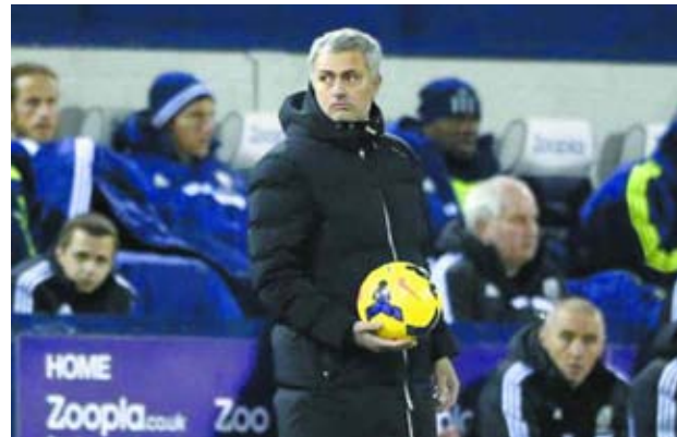
Chelsea manager Jose Mourinho holds the ball during the team's English Premier League soccer match against West Bromwich Albion at the Hawthorns in West Bromwich, central England, on 11 Feb, 2014.

“I completely changed my attitude,” American Garrigus told reporters when asked what had made the difference for him at a