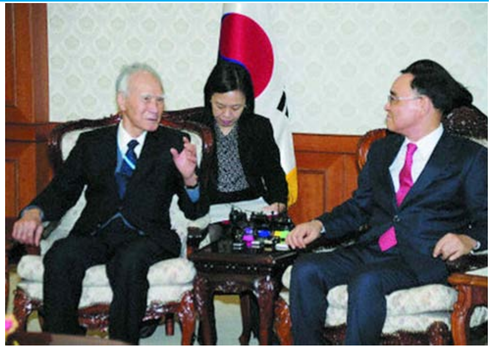
Former Japanese Prime Minister Tomiichi Murayama (L) and South Korean Prime Minister Jung Hong Won hold talks in Seoul on 13 Feb, 2014.