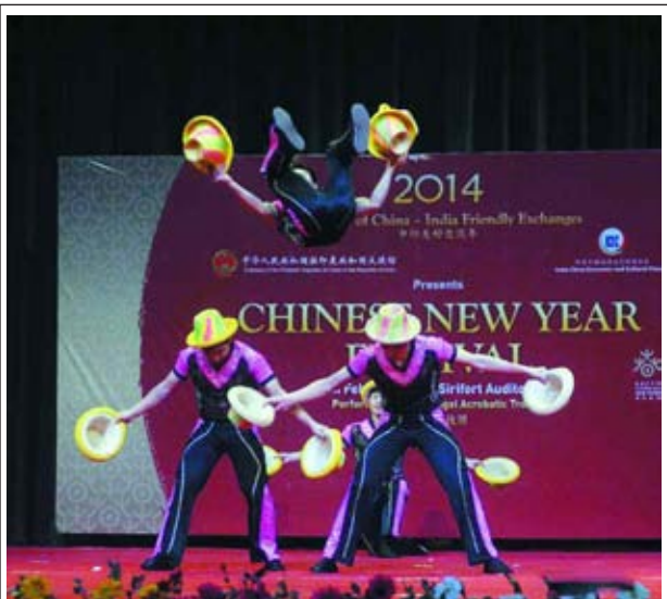
Chinese acrobats perform in celebration of the Year of China-India Friendly Exchanges in New Delhi, India, on 13 Feb, 2014.

"Using the tunnel, it will take only 40 minutes to travel from Dalian to Yantai," Wang said. At the moment it is a 1,400-km drive or about eight hours by ferry. Passenger vehicles can be loaded onto rail carriages and transported at about 220 kilometers per hour, massively shortening the travel time between the two cities.—Xinhua