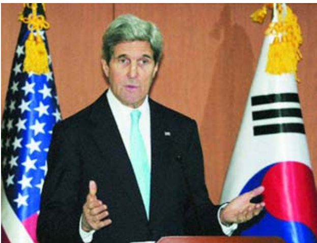
US Secretary of State John Kerry speaks during a joint Press conference after talks with South Korean Foreign Minister Yun Byung Se in Seoul on 13 Feb, 2014.

SEOUL, 14 Feb— US Secretary of State John Kerry reiterated on Friday amid a visit to South Korea that the United States will not accept North Korea as