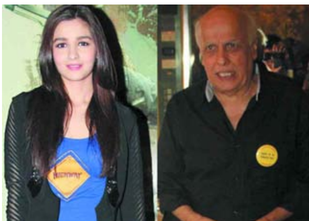
Alia Bhatt says her father Mahesh Bhatt will not return to direction for anybody.

MUMBAI, 14 Feb — Actress Alia Bhatt says she