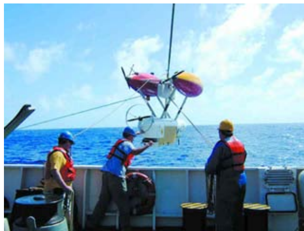
The Chinese research vessel, Dayang 1, used in the discovery of the first hot vents in the Indian Ocean.

BEIJING, 14 Feb — China has used a domestically made underwater robot to study polymetallic sulfide in the southwest Indian Ocean,