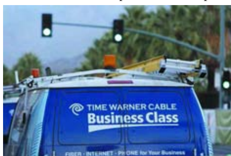
A Time Warner Cable installation van is shown in Palm Springs, California on 29 Jan, 2014.