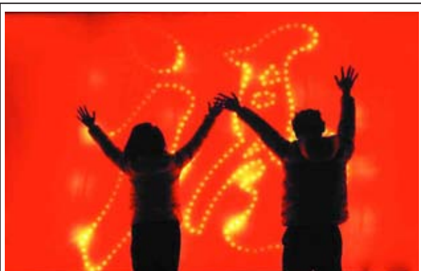
A couple pose for photos during a lantern exhibition in Ningbo, east China's Zhejiang Province, on 13 Feb, 2014. The Chinese Lantern Festival fell on Friday this year, the same day as the western festival for lovers - the valentine's day.