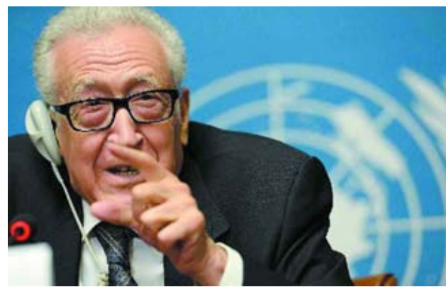
UN-Arab League Special Envoy to Syria Lakhdar Brahimi speaks at a Press conference in Geneva, Switzerland, on 13 Feb, 2014. Russia and the United States reaffirmed their support to the ongoing second round of Geneva II conference on Syria and assured that they would help to push forward the stalled peace talks, Brahimi said on Thursday.

When asked about whether the ongoing conference would end up as a failure, Brahimi, after noting the difficulty and complication of the situation, answered: “Failure is always staring at us in the face. As far as the United Nations is concerned, we will certainly not leave one stone unturned if there is a possibility to move forward.”—Xinhua