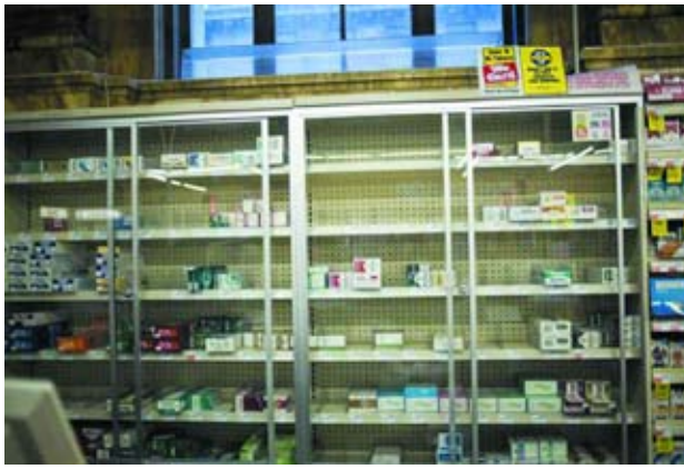
Near empty cigarette shelves are seen at a CVS store in New York on 4 Feb, 2014.