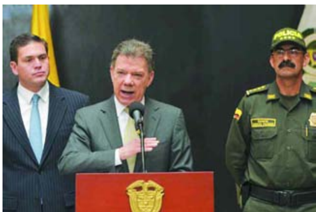
Colombia's President Juan Manuel Santos (C) speaks in between Defence Minister Juan Carlos Pinzon (L) and police chief Rodolfo Palomino during an official ceremony at the police headquarters in Bogota on 4 Feb, 2014 file photo.

BOGOTA, 14 Feb — The Colombian government and FARC guerrilla negotiators said on Thursday that they had made progress toward an agreement on combating illegal drug trafficking, a sign that peace talks were making headway before elections.