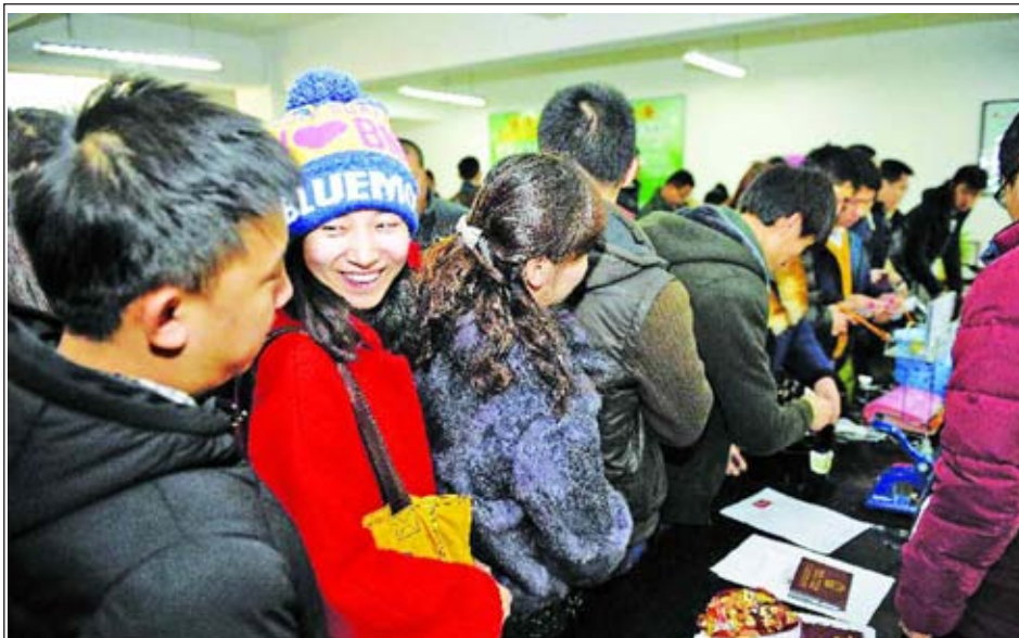
Lovers queue to wait for marriage registration at a marriage registry on the Valentine's Day as well as the Chinese traditional Lantern Festival in Yinchuan, capital of northwest China's Ningxia Hui Autonomous Region, on 14 Feb, 2014. The registry here is expected to issue more than 300 certificates, three times more than the other days, on the Valentine's Day, which coincides with the Lantern Festival, the 15th day of the first month of the Chinese lunar calendar.—XINHUA

Jimenez said South Korea, the United States, Japan, China and Australia were the top five sources of tourists last year. DOT also said total revenues gained from foreign tourists went up by 15.1 percent on year to 186.15 billion pesos (4.4 billion US dollars). The average daily expenditure of foreign tourists also increased by 8.7 percent to 101.12 US dollars last year.—Xinhua