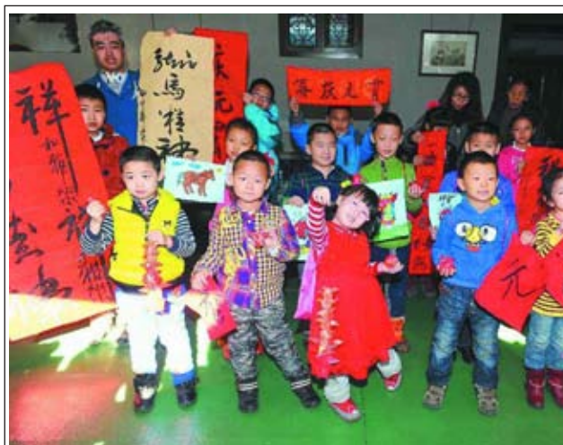
Children display lanterns, pictures and their calligraphy works during an activity in Changchun, capital of northeast China's Jilin Province, on 13 Feb, 2014. A series of activities for children were held at the Museum of the Imperial Palace of "Manchukuo" on Thursday to celebrate the coming Lantern Festival, which falls on 14 February this year.