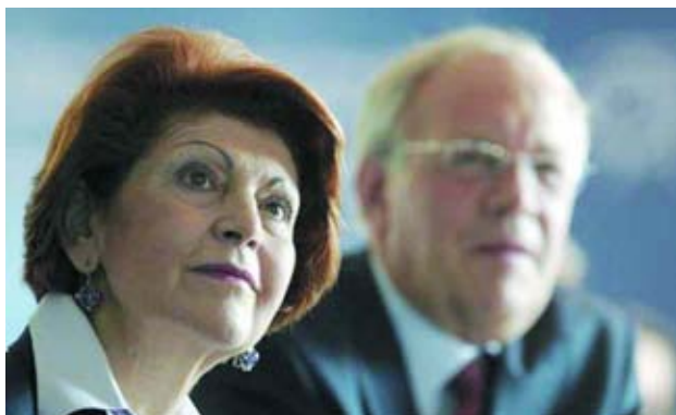
Androulla Vassiliou European Commissioner for Education (L) and Johann Schneider-Ammann Switzerland's Economy minister listens to CERN Director General Rolf Heuer (not pictured) during a visit of the Compact Muon Solenoid (CMS) experience at the Organization for Nuclear Research (CERN) in the French village of Cessy near Geneva in Switzerland on 15 April, 2013 file photo.

By suggesting Obama could extend an opening to Cuba without political costs, Rodriguez may have been referring to a public opinion poll released