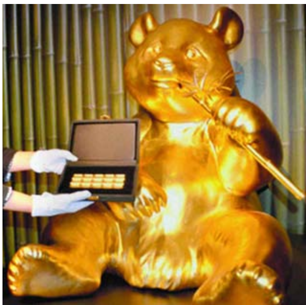
The Matsuzakaya Ueno department store shows on 12 Feb, 2014 a gold-plated giant panda statue and pure gold made in the shape of a chocolate tablet which will be sold at the store in Tokyo. The 1-meter tall statue covered with 2,000 gold leaf sheets is priced at 8.88 million yen and the 1-kilogram chocolate-shaped gold at 12.6 million yen.