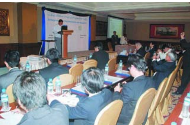
Introduction ceremony of Japan-made maritime technology-applied equipment in progress.

All in all, the more the number of happy and loving homes in a society, the more peaceful that society will become. It is beyond doubt.