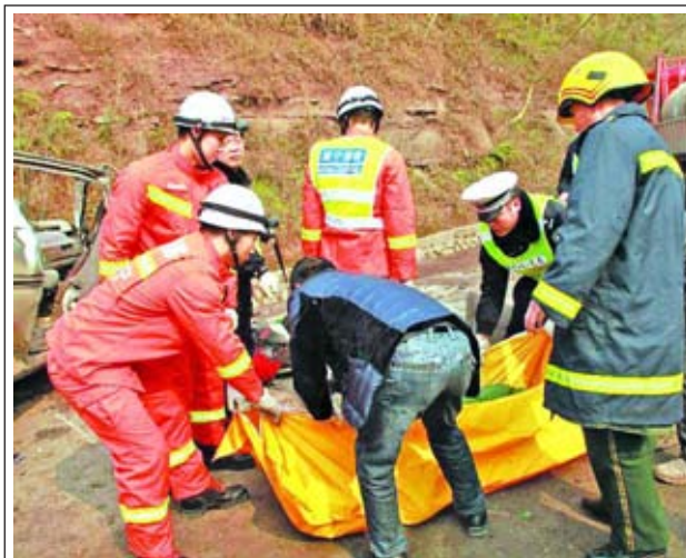
Rescuers work at the site of the traffic accident which claimed five lives in Santai Village of Pengxi County in Suining City, southwest China's Sichuan Province, on 13 Feb, 2014. The accident occurred at midday on 13 Feb when a minivan slammed into a truck on the 304 provincial road, causing five dead in the minivan and four others injured.—XINHUA

The illnesses started with flu-like symptoms, then progressed to pneumonia and, in some cases, organ failure. The Egyptian government killed about 300,000 pigs in 2009 when the virus first spread in the most populous Arab state. However, the spokesman said Thursday that it has nothing to do with "swine" unlike what a lot of Egyptians may think.—Xinhua