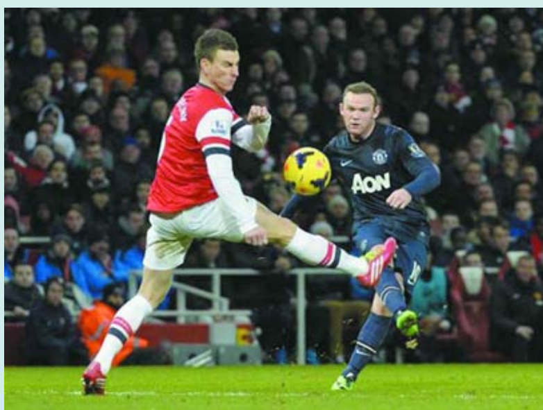
Manchester United's Wayne Rooney (R) is challenged by Arsenal's Laurent Koscielny during their English Premier League soccer match at the Emirates stadium in London on 12 Feb, 2014.

"Maybe once or twice in the past I can say without too many fears of contradiction that on the world stage he hasn't exploded as he has on our national stage, where we all accept him as being an outstanding player." The