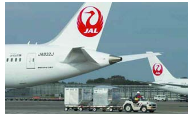
A airport worker drives a luggage transport vehicle past one of the company’s Boeing Co’s 787 Dreamliner plane (L) and a Boeing 767 at Narita international airport in Narita, east of Tokyo, on 11 Nov, 2013.