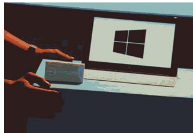
A Microsoft Surface tablet is seen during the launch of Microsoft Windows 8 operating system in Hong Kong on 26 Oct, 2012. —Reuters

The latest version of the browser is IE 11, which is unaffected, and a Microsoft security tool called the Enhanced Mitigation Experience Toolkit also protects users who have installed that. Previously unknown flaws in popular software are a key weapon for hackers and are sold by the researchers who discover them for $50,000 or more, brokers say. They are most often bought by defense contractors and intelligence agencies in multiple countries, but some of the best-funded criminal groups buy them as well. —Reuters