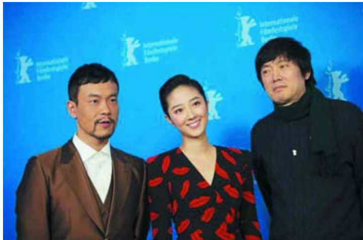
Director Diao Yinan (R) poses with cast members Liao Fan (L) and Gwei Lun-Mei during a photocall to promote the movie "Black Coal, Thin Ice" at the 64th Berlinale International Film Festival in Berlin on 12 Feb, 2014.