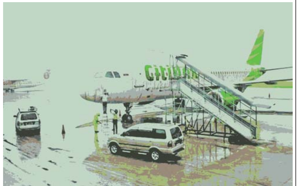
Workers stand near a Citilink airplane covered with ash from Mount Kelud at Adi Sucipto Airport in Yogyakarta on 14 Feb, 2014.

killed earlier this month in the north of the island of Sumatra when Mount Sinabung erupted.