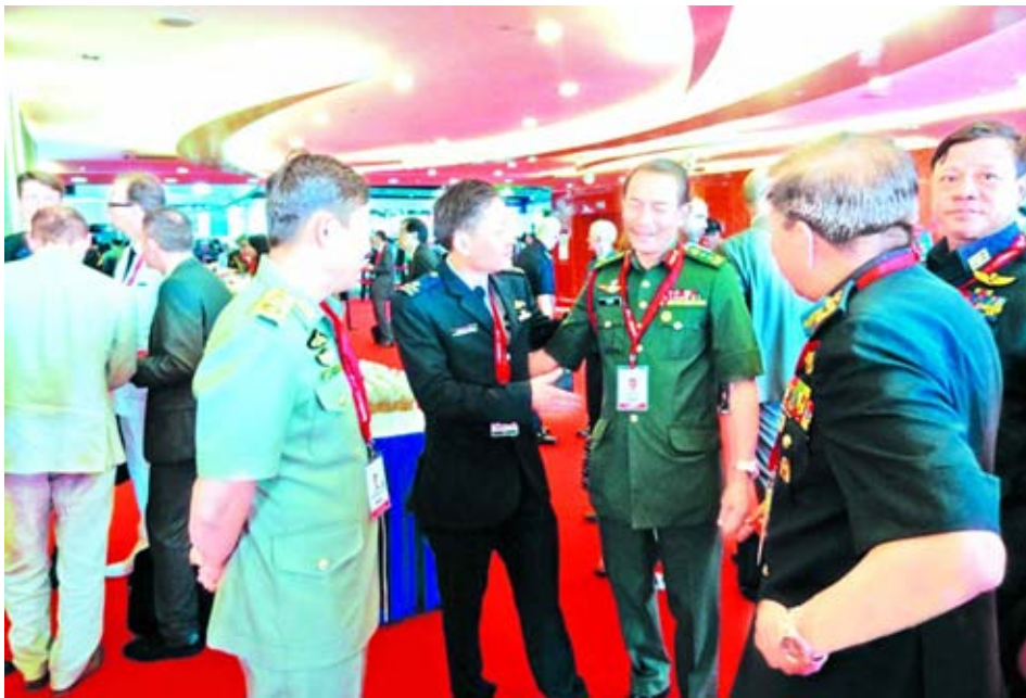
Vice-Senior General Soe Win views round scale models at Changi Exhibition Center in Singapore.

NAY PYI TAW, 14 Feb—Deputy Commander-in-Chief of Defence Services Commander-in-Chief (Army) Vice-Senior General Soe Win attended opening ceremony of Singapore Air Show-2014 at Changi Exhibition Center in Singapore on 11 February.