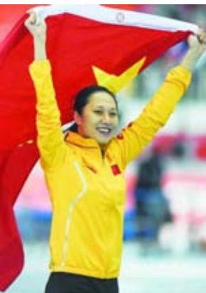
Less fancied Zhang Hong claimed China's first ever Olympic speed skating title on Thursday, winning the women's 1,000m with a large margin.

SOCHI, 14 Feb — Less fancied Zhang Hong claimed China's first ever Olympic speed skating title on Thursday, winning the women's 1,000m with a large margin. The 25-year-old Olympic debutante, who clocked one minute 14.02 seconds in the seventh pair, had to wait for 22 more skaters to finish the race before knowing she had made