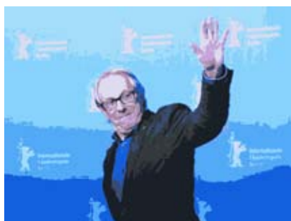
British film director Ken Loach pose during a photocall during the 64th Berlinale International Film Festival in Berlin on 13 Feb, 2014.