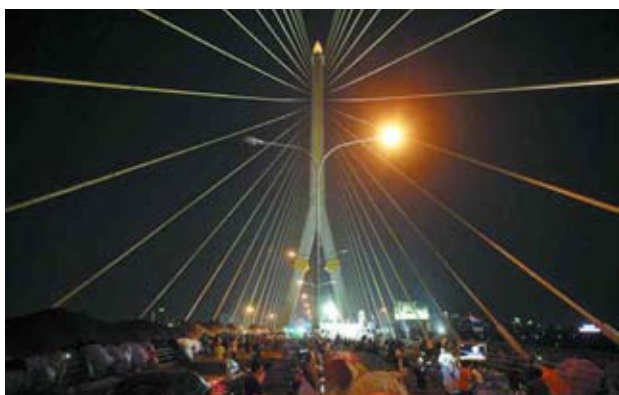
Anti-government protesters camp on Rama VIII bridge in Bangkok 4 Feb, 2014.

the three largest protest sites, where demonstrators have been rallying to try to oust Yingluck, and in recent weeks the numbers there have dwindled to a small hard core.