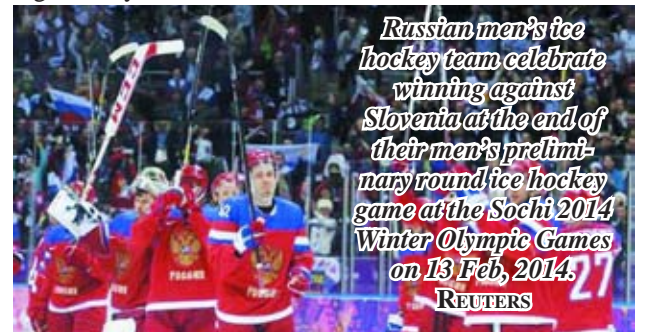
Russian men's ice hockey team celebrate winning against Slovenia at the end of their men's preliminary round ice hockey game at the Sochi 2014 Winter Olympic Games on 13 Feb, 2014.