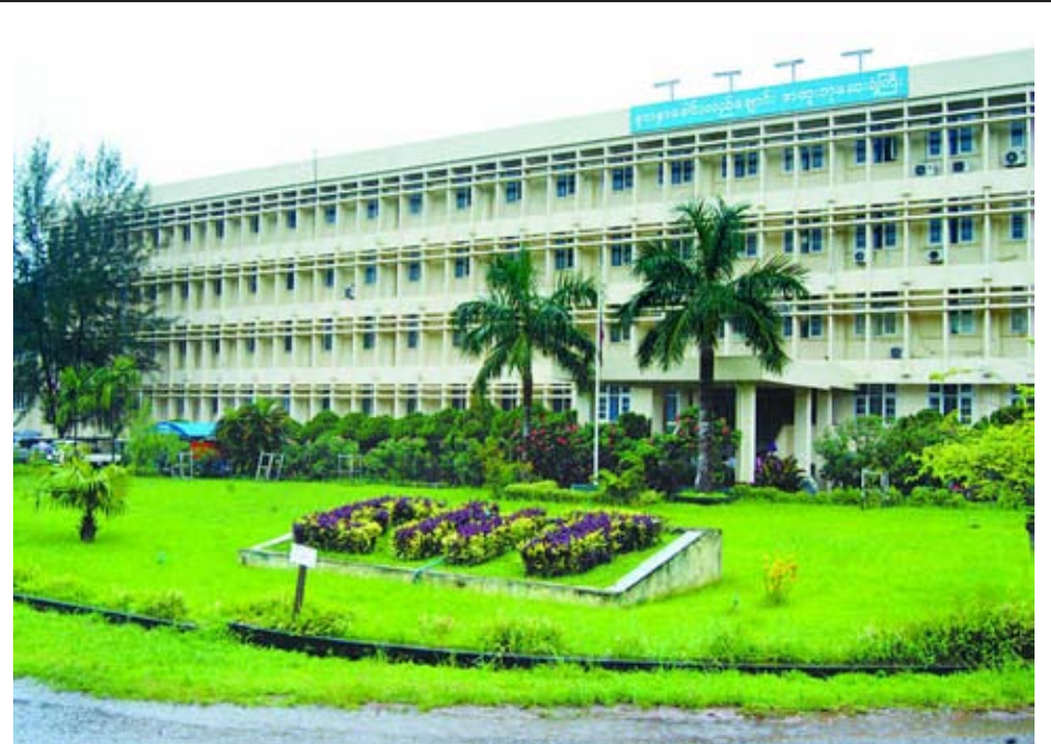
Ear, Nose and Throat Hospital in Yangon.

The ear, nose and throat specialists are providing not only treatments to the patients by making field trip in Myanmar but also joint surgeries at