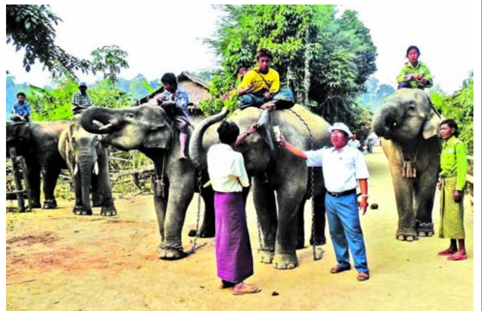
of the chips, the elephants were checked and officials confirmed them.— Kyemon-Moe Chaint Nyan Hein

Wildlife Conservation Society (WCS) installed microchips at elephants of the enterprise on 6 April, 2013 for prevention against illegally killing the elephants, smuggling the elephants and easy identification between wild elephants and enterprise-owned elephants. Ten months after installation