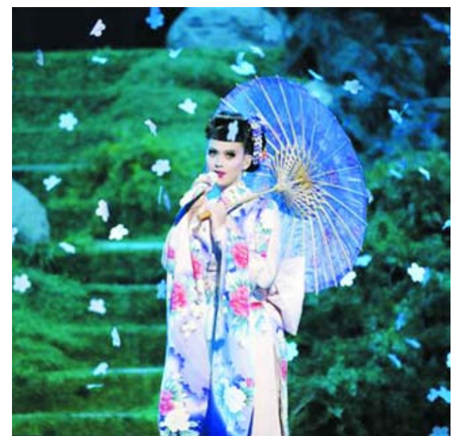
Katy Perry performs "Unconditionally" at the 41st American Music Awards in Los Angeles, California on 24 Nov, 2013.

I can stay in my track-pants all day and feel comfortable. Style is more about your attitude and it is not really about what you wear. You need to carry what you wear," she said. Kareena, who is married to actor Saif Ali Khan, said that she loves junk food but exercises regularly to maintain her body. "I am a Punjabi and everywhere you go in Delhi there is such amazing food. But I exercise regularly," she said.—PTI