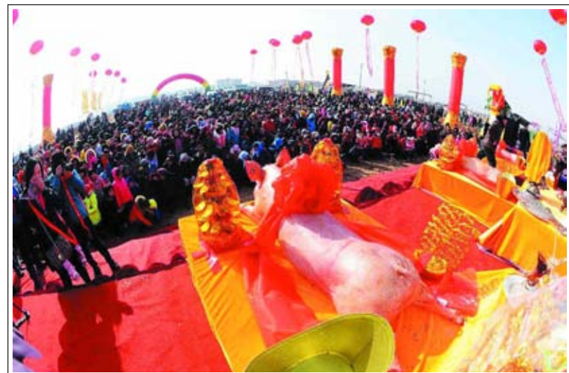
A ceremony is held to pay tribute to sea gods and goddesses in Qingdao City, east China's Shandong Province, on 12 Feb, 2014.