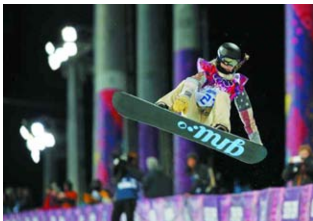
1 of 7. Kaitlyn Farrington of the US performs a jump during the women's snowboard halfpipe finals at the 2014 Sochi Winter Olympic Games in Rosa Khutor on 12 Feb, 2014.