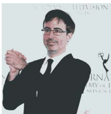
Comedian John Oliver poses for photographers backstage during the 41st International Emmy Awards in New York, on 25 Nov, 2013.