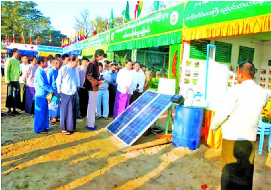
MONYWA, 13 Feb—The 67 th Anniversary Union Day Commemorative sports ground in Monywa Booths were opened at the of Sagaing Region on 10