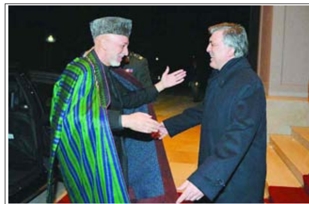
Photo released by the Turkish Presidential Palace shows Turkish President Abdullah Gul (R) welcoming visiting Afghanistan President Hamid Karzai to attend the 8th Turkey-Afghanistan-Pakistan Trilateral Summit in Ankara, Turkey, on 12 Feb, 2014.

"It would be a mistake to talk about the radar as the solution," he said, adding "if you have the radar, but not the capacity to respond to the coordinates indicated by the radar, then it's not much help."—Xinhua