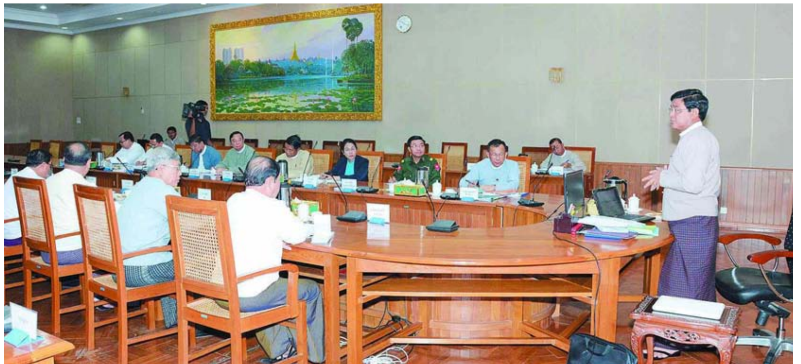
Vice-President U Nyan Tun delivers address at coordination meeting of central work committee for Myanmar Special Economic Zones.—MNA

He called for a comprehensive strategy in order to deal with advantages and disadvantages of the establishment of SEZs. He