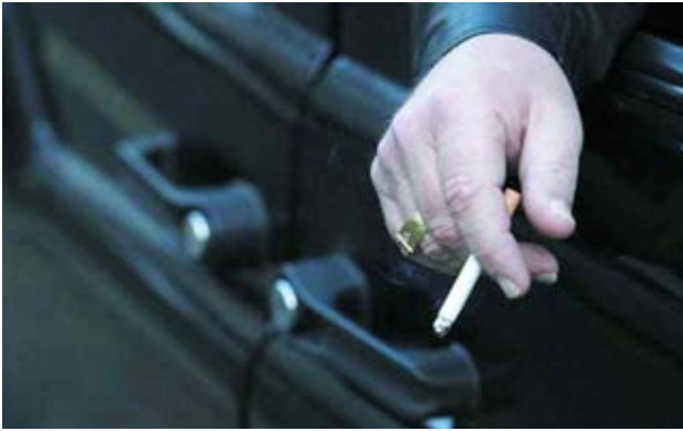
A man smokes in his car in London on 16 Nov, 2011.

"The intention is for the secondary regulations to be in force ahead of May 2015," Prime Minister David Cameron's official spokesman said on Tuesday. "There is a particular issue around vehicles being a particularly confined space and the associated public health concerns."