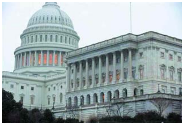
The Capitol Building stands in Washington on 17 Dec, 2012.

After a few more tense minutes of huddling on the Senate floor, several other Republicans changed their votes to follow their leadership. In the end, 12 Re-