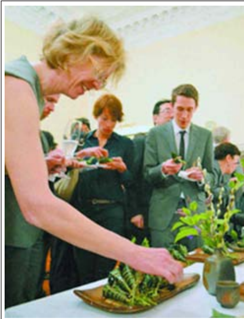
Visitors taste Japanese food at an event held at the Japanese Embassy in London on 10 Feb, 2014, to promote Japanese cuisine.