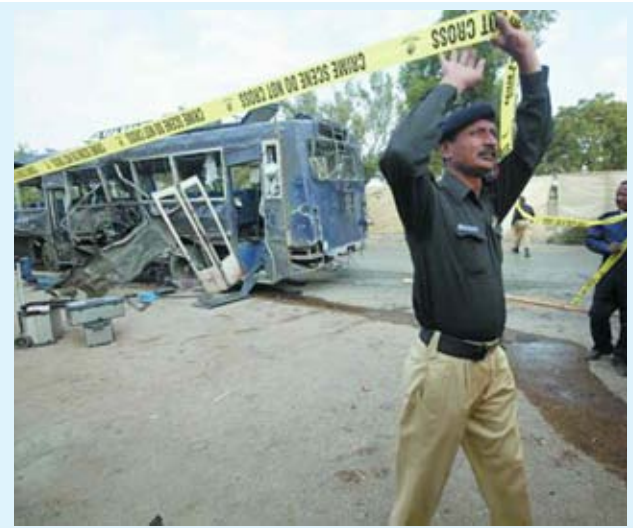
A security official uses a tape to cordon off a site of a damaged police bus after an explosion in Karachi on 13 Feb, 2014.—REUTERS

Others worry that there are too many militant groups in Pakistan to negotiate with. Several such groups, not included in the talks, have carried out bloody bombings of markets, churches, and mosques.—Reuters