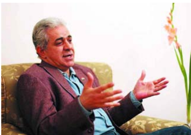
Leftist leader Hamdeen Sabahi speaks during an interview with Reuters in Cairo, on 29 April, 2013.