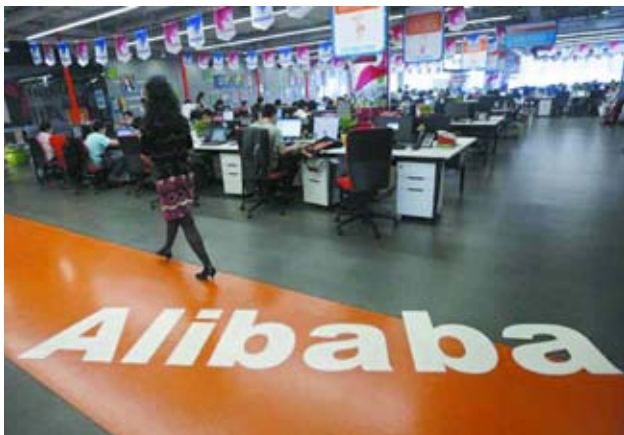
An employee walks past a logo of Alibaba Group at its headquarters on the outskirts of Hangzhou, Zhejiang Province, in this on 17 May, 2010 file photo.