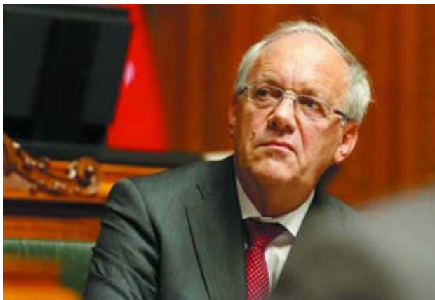
Swiss Economy Minister Johann Schneider-Ammann follows the debate of the 'Minimal Salary' initiative in the National Council in Bern on 27 Nov, 2013 file photo.

FRANKFURT, 13 Feb — A loss of trust in Switzerland's business and political elite may be one of the reasons the alpine nation voted in favor of putting strict limits on immigration, Swiss Economy Minister Johann Schneider-Ammann said on Wednesday.