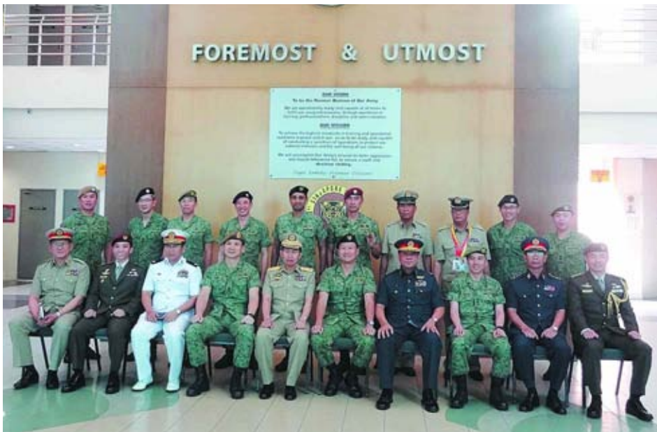
NAY PYI TAW, 13 Feb—Deputy Commander-in-Chief of Defence Services Commander-in-

Vice-Senior General Soe Win and party pose for documentary photo together with officers of No 3 Division in Singapore.—MNA