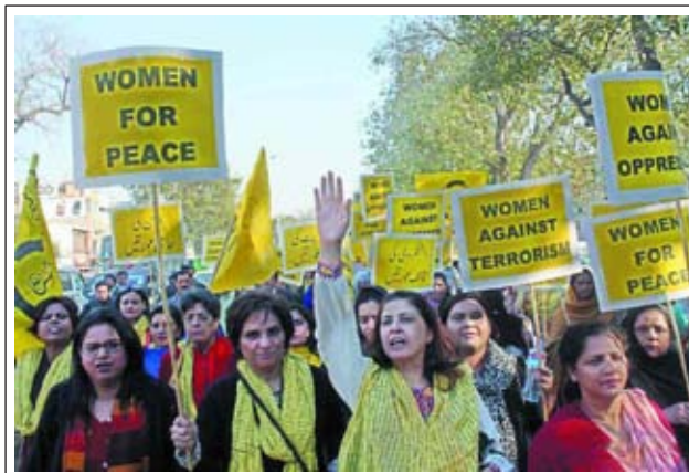
Pakistani women hold placards during a protest rally against terrorism in eastern Pakistan's Lahore on 12 Feb, 2014. At least 10 people were killed when some unknown militants stormed the house of a local peace militia commander in Pakistan's northwest Peshawar city, local media reported on Wednesday morning.