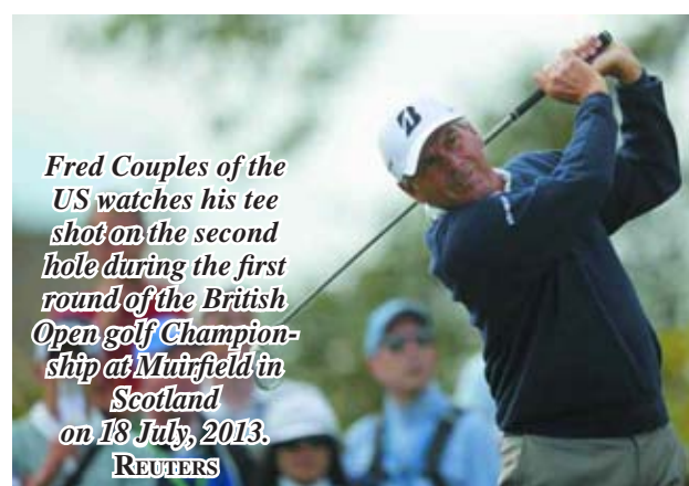
Fred Couples of the US watches his tee shot on the second hole during the first round of the British Open golf Championship at Muirfield in Scotland on 18 July, 2013.

"I have a great pairing tomorrow with Jordan (Spite) and Webb Simpson so it's very exciting for me with that pairing. We'll see what happens." Former Masters champion Couples, who was the winner at Riviera in 1990 and 1992, was scheduled to tee off in Thursday's opening round from the first hole with fellow Americans Simpson and Spieth.—Reuters