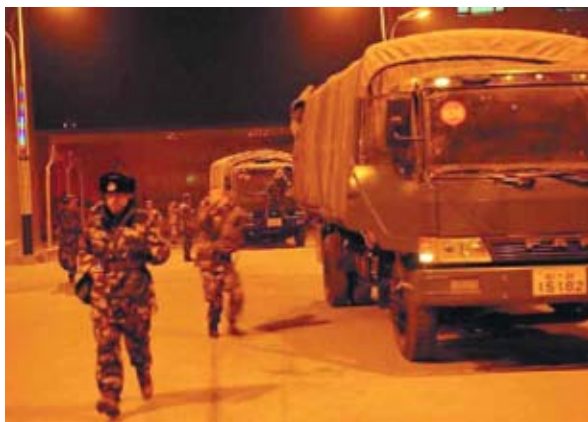
Members of a paramilitary troop head for earthquake-stricken areas in Yutian County, Hotan, northwest China's Xinjiang Uygur Autonomous Region, on 12 Feb, 2014. A total of 260 paramilitary troop members have been dispatched to Yutian County for disaster relief work, after a 7.3-magnitude earthquake struck the county at 5:19 pm Wednesday.