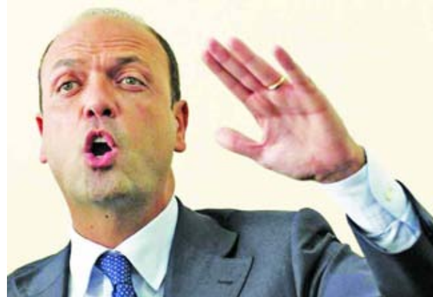
Italy's Interior Minister Angelino Alfano speaks during a news conference in Lampedusa 9 Oct, 2013.