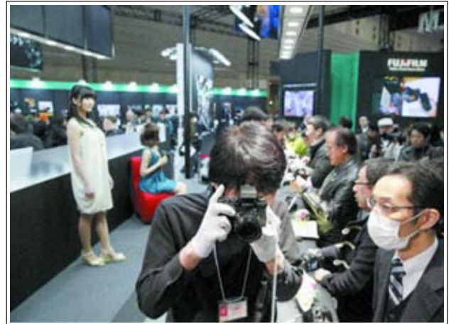
The CP+2014 camera and photo imaging show begins in Yokohama, near Tokyo, on 13 Feb, 2014. The four-day event is one of Asia's biggest camera exhibitions.