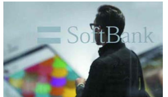
Softbank Corp's logo is pictured at its branch in Tokyo on 11 June, 2013.

Speaking at a news conference to brief on SoftBank's financial results, Son, who is also chairman of Sprint, said he could not comment on "rumors in the industry."—Reuters