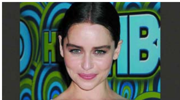
The title is attributable to the strength and character she portrays on screen as well as the popularity of HBO's.

"The Top 99 poll called on readers to elect women who most closely match their ideals, voting on more than just sex appeal and taking into account other criteria such as character, talent and potential for 2014," it read further. Community star Alison Brie is placed second on the list. Emily Ratajkowski who starred in Robin Thicke's music video for Blurred Lines is on number three. The fourth and fifth positions are taken by Jennifer Lawrence and Emma Watson respectively. Over more than 1 million people took part in the poll.