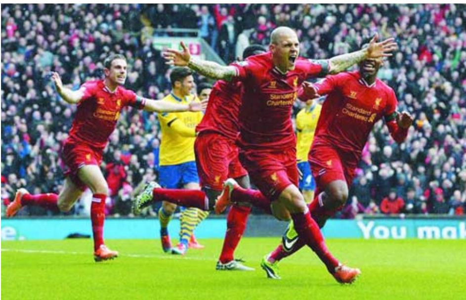
Martin Skrtel celebrates scoring one of his two goals in the first half against Arsenal.