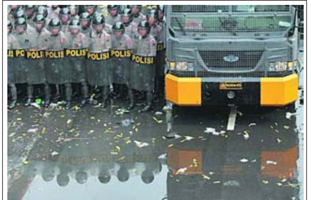
Police officers participate in a security drill in Jakarta, Indonesia, on 7 Feb, 2014. The purpose of the anti-riot drill is ensuring security for the legislative elections in April and presidential polls in July this year.