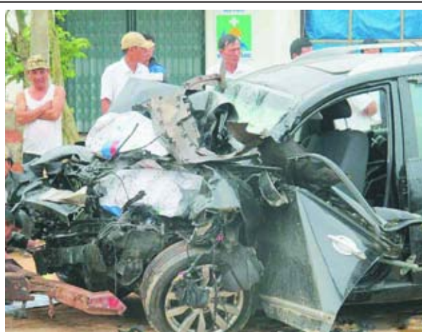
The damaged car is seen at the accident site in Bo Trach District, Vietnam's central Quang Binh province, on 7 Feb, 2014. At least three people were killed and four others injured when the car smashed into a truck on the National Highway Friday morning, Vietnamese state-owned news agency VNA reported.