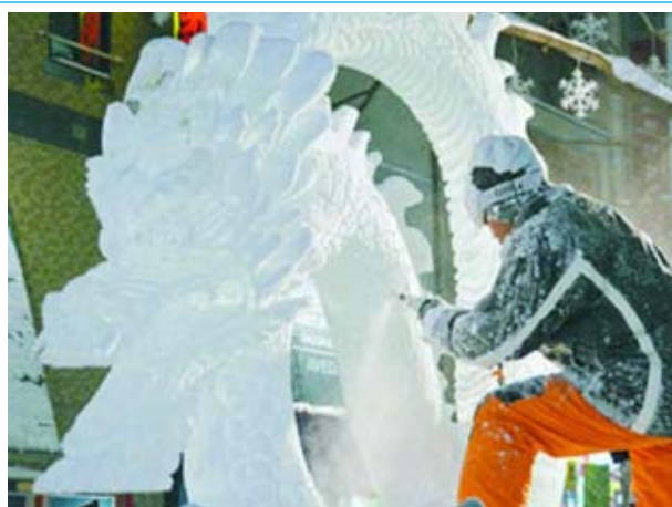
A participant in an ice sculpture contest in Asahikawa, Hokkaido, puts the final touches to a dragon statue on 7 Feb, 2014