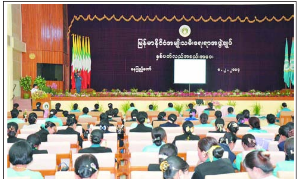
Officials of Ministry of Immigration and Population clarifies census taking process at AGM of MWAFF. (News on page 16) —MNA