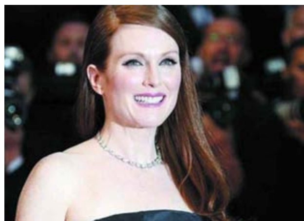
Julianne says she favours the natural look.

natural and normal, and I'm all for showing that, but I don't like when magazines show pictures of someone looking terrible. We all have our moments when we look awful. My gosh," she said.