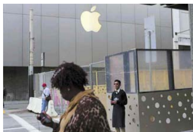
The Apple flagship retail store is pictured in San Francisco, California on 27 Jan, 2014.

With the latest round of purchases, Apple had bought back more than $40