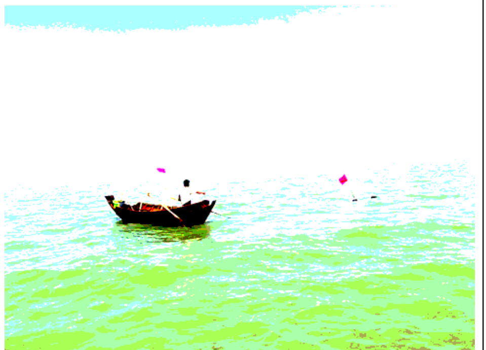
Photo shows a local fisherman carrying out small-scale fishing in the sea.