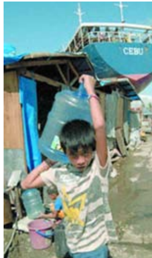
A boy carries a water tank in Tacloban City on Leyte Island on 6 Feb, 2014.

The messages in Shibuya will be displayed for about two to three weeks. Similar messages were displayed elsewhere, including New York Times Square and Lafayette Mogador in Paris, the officials said.—Kyodo News