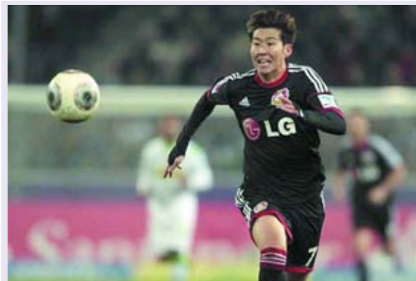
Bayer Leverkusen's Son Heung-Min plays a ball during the German first division Bundesliga soccer match against Borussia Moenchengladbach in Moenchengladbach on 7 Feb, 2014.