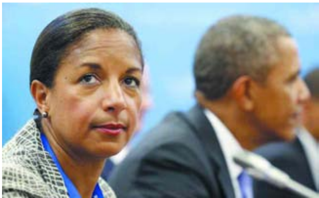
US National Security Advisor Susan Rice looks up during a meeting between US President Barack Obama (R) and Japanese Prime Minister Shinzo Abe at the G20 Summit in St Petersburg, Russia on 5 Sept, 2013.