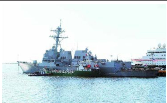
Picture taken on 7 Feb, 2014 shows the USS Pinckney warship in Manila, the Philippines. The USS Pinckney Guided Missile Destroyer with its 300 sailors docked here for visit and replenishment.