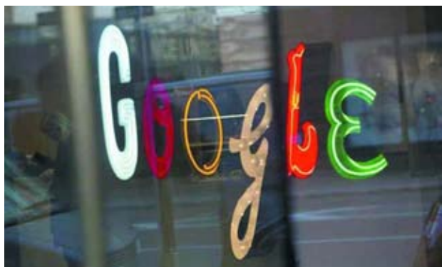
The Google signage is seen at the company's offices in New York on 8 Jan, 2013. — REUTERS

Lenovo agreed to buy Google's Motorola handset division last week for $2.91 billion in a cash and stock deal. — Reuters