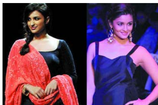
Alia had earlier advised Parineeti to get some help for her dressing style on the show.

Alia had earlier appeared on the show with actors Sidharth Malhotra and Varun Dhawan where she advised Parineeti to get some help for her dressing style. Parineeti has no problems with her suggestion. "She had genuinely like a friend said that Parineeti should be careful about her dressing style. We wanted to tell everyone there is no problem between us and that's why we went on that couch," she added.—PTI