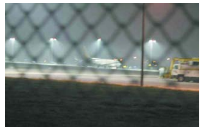
The Pegasus Airlines plane from the Ukrainian city of Kharkov on the tarmac of Istanbul's Sabiha Gokcen Airport, on 7 Feb, 2014.

and Prachuap, where polling stations were blocked by protesters on 2 February. However, the specific time for the new round of voting is yet to be announced.