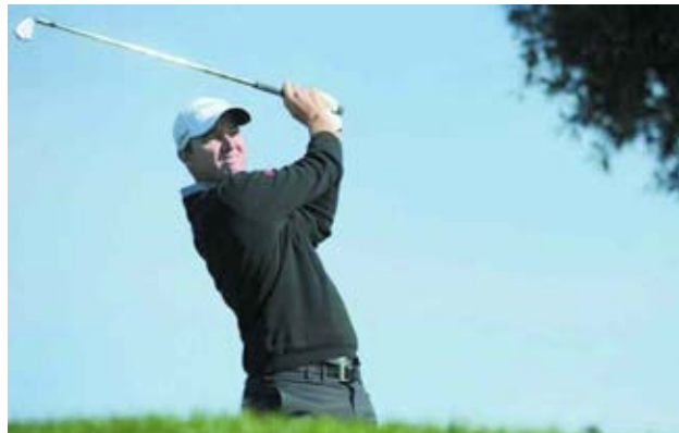
Jimmy Walker tees off on the third hole during the first round of the Farmers Insurance Open golf tournament at Torrey Pines Municipal Golf Course.

Spieth, the 2013 PGA Tour Rookie of the Year