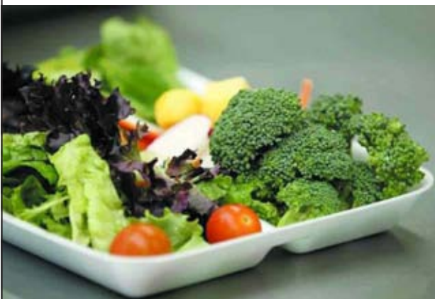
Some of more than 8,000lbs of locally grown broccoli from a partnership between Farm to School and Healthy School Meals is served in a salad to students at Marston Middle School in San Diego, California, on 7 March, 2011.