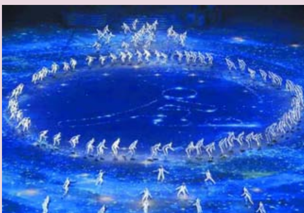
Performers take part in the opening ceremony of the 2014 Sochi Winter Olympics, on 7 Feb, 2014.

Before the rings hiccup, a young girl in a white dress soared into the air, lifted by a harness, and sang as floating islands featuring folktale Russian landscapes drifted dreamlike across the