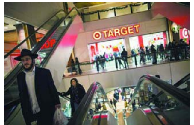
Shoppers are seen at a Target store during Black Friday sales in the Brooklyn borough of New York, on 29 Nov, 2013.

Target did not identify the vendor. The US Secret