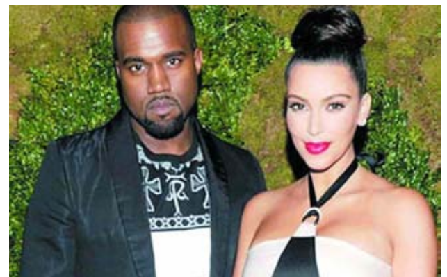
Kim and Kanye will reportedly get married in Paris.

However, Kim, who was married twice before, is said to have been very reluctant to have a lavish ceremony. "Kim isn't totally pumped about a huge wedding. But she's going along with it," another source said.—PTI