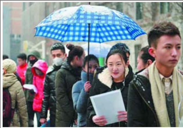
Examinees prepare to enter the exam room at the Central Academy of Drama in Beijing, capital of China, on 7 Feb, 2014. The first round art professional exam of the Central Academy of Drama kicked off in Beijing on Friday. A total of 30254 examinees registered for the exam, competing for 595 vacancies to be enrolled.—XINHUA