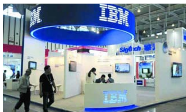
Visitors walk past the IBM booth at the 9th China International Software Product & Information Service Expo in Nanjing, Jiangsu Province on 6 Sept, 2013.

The report comes two weeks after IBM agreed to sell its low-end server