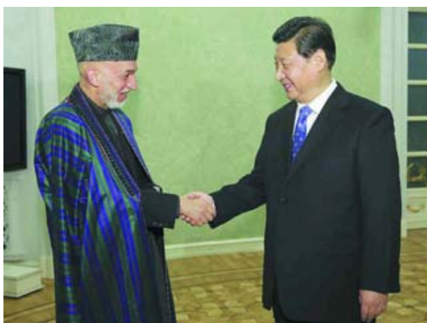
Chinese President Xi Jinping (R) meets with Afghan President Hamid Karzai in Sochi, Russia, on 7 Feb, 2014.

Noting that 2014 is a critical year in Afghanistan's transition, he conveyed the hope that Afghanistan will