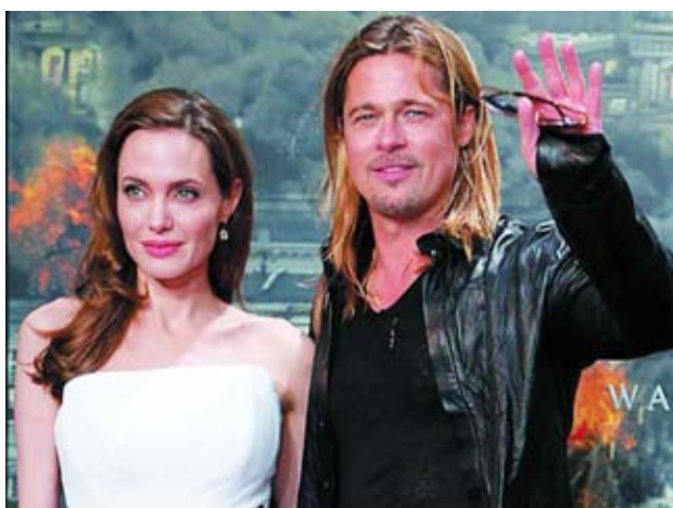
Angelina Jolie attended the wrap party of Unbroken with Brad Pitt.

"She had a bulging vein in her forehead and dark circles under her eyes. Her famous lips even looked thin. Everyone is talking about Brad's crush on his 12 Years A Slave co-star Lupita Nyong'o and she looked sick with worry," a source said.—PTI