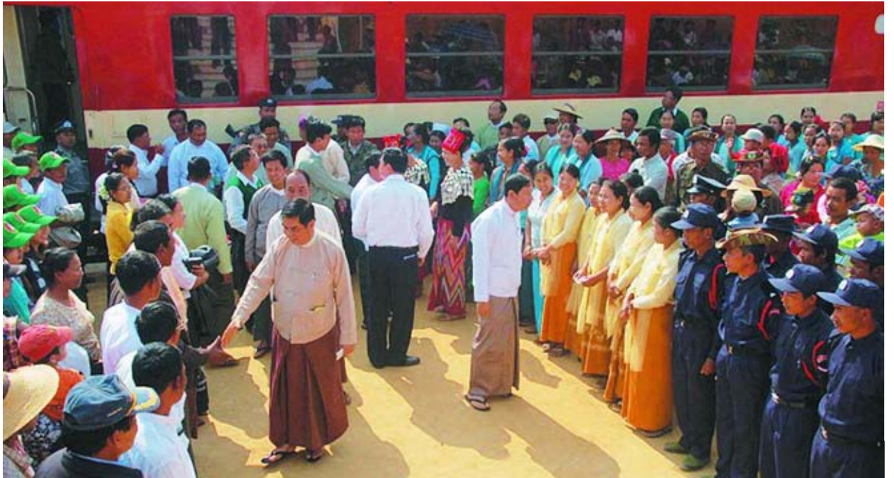
Union Minister U Than Htay greets locals at opening of Motargyi-Chaungwa-Kyaukkyi Railroad Section in Katha Township.