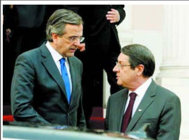
Greek Prime Minister Antonis Samaras (L) speaks with Cypriot President Nicos Anastasiades in Athens, Greece, on 7 Feb, 2014. Greece supports the resumption of talks for a "viable and fair" solution to the Cyprus issue, Prime Minister Antonis Samaras said Friday after a meeting with visiting Cypriot President Nicos Anastasiades.