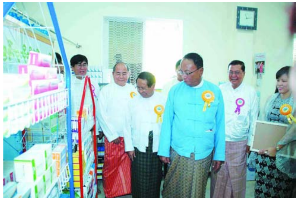
Amyotha Hluttaw Speaker U Khin Aung Myint visits Cetanamon free clinic.

Other wellwishers donated K 12.5 million for the library and e-library and medicine, E.C.G. machine