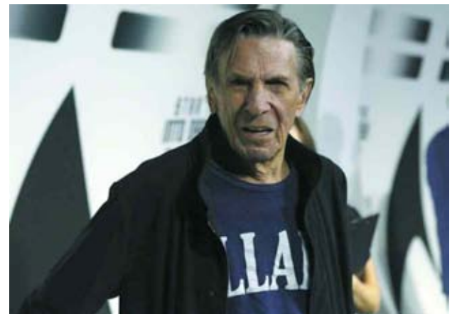
Cast member Leonard Nimoy poses at the party for the release of the Blu-Ray DVD of "Star Trek Into Darkness" at the California Science Centre in Los Angeles, California on 10 Sept, 2013.

Boston, has become synonymous with his role as Spock, the fictional half-human, half-Vulcan first officer and later commander of the starship Enterprise, in the television and film versions of "Star Trek." He most recently appeared in JJ Abrams' "Star Trek Into Darkness" last year, and is a celebrated figure among the franchise's loyal and avid fan base.—Reuters