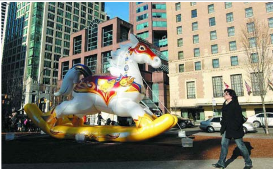
A woman walks by a giant inflatable rocking horse during the 2014 LunarFest in Vancouver, Canada, on 7 Feb, 2014. The 3-day LunarFest is Canada's premier presenter of the contemporary expression of Asian arts and culture.