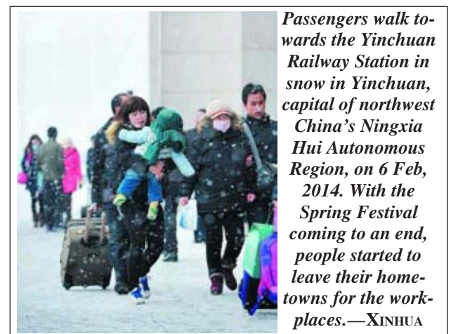
Passengers walk towards the Yinchuan Railway Station in snow in Yinchuan, capital of northwest China's Ningxia Hui Autonomous Region, on 6 Feb, 2014. With the Spring Festival coming to an end, people started to leave their hometowns for the workplaces.