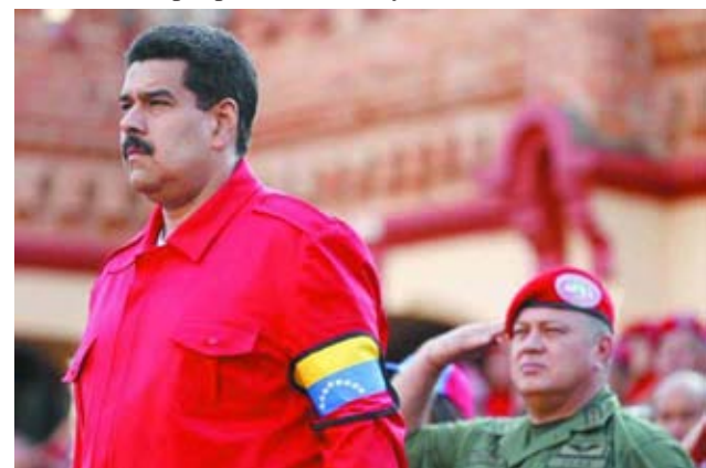
Venezuela's President Nicolas Maduro (L) and National Assembly President Diosdado Cabello attend a ceremony commemorating the 22nd anniversary of late Venezuelan President Hugo Chavez's attempted coup d'etat in Caracas on 4 Feb, 2014.

"I have information they are looking for injuries and deaths. They want to project images to the world in order to disrupt our country," he said.