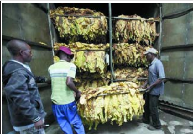
Farm workers hang harvested tobacco leaves in a barn in Beatrice about 30km of the capital Harare, Zimbabwe, 7 Feb, 2014. Zimbabwe’s Tobacco Industry and Marketing Board announced that this year’s tobacco sale season will start on 19 February. Zimbabwe is one of the world’s major tobacco producers. About 90 percent of the Zimbabwean tobacco leaves were exported, mainly to China, Belgium, Russia, South Africa, and Sudan, according to government statistics.—XINHUA