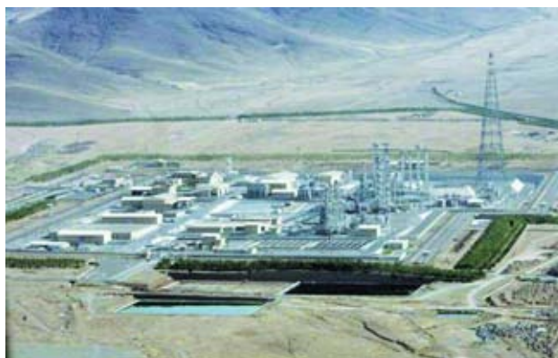
A view of the Arak heavy-water project 190 km (120 miles) southwest of Teheran on 26 Aug, 2006.