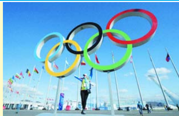
A volunteer for the Winter Olympics poses for souvenir photos at the Olympic Park in Sochi, Russia, on 6 Feb, 2014, the day before the start of the Games.