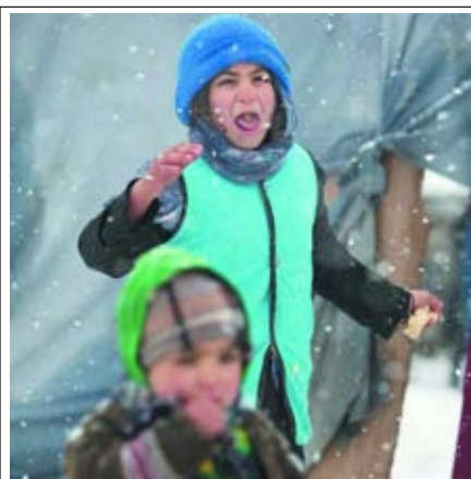
Afghan refugee children play with snow at a refugee camp during heavy snowfall in Kabul, Afghanistan, on 6 Feb, 2014.