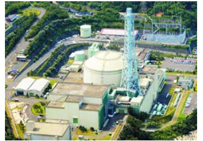
A July 2013 file photo shows the Monju prototype fast-breeder reactor in Tsuruga, Fukui Prefecture. The government is considering reviewing its research project to commercialize the Monju reactor, a move that could affect Japan's long-held policy of recycling spent nuclear fuel, informed sources said on 7 Feb, 2014.—KYODO NEWS