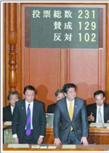
Prime Minister Shinzo Abe (R front) and Finance Minister Taro Aso (L front) bow in appreciation after a 5.47 trillion yen extra budget for the fiscal year through March 2014 is approved by the House of Councillors with a majority vote on 6 Feb, 2014.