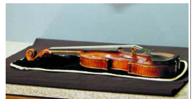
The 300-year-old Stradivarius violin that was taken from the Milwaukee Symphony Orchestra's concertmaster in an armed robbery is on display for the media after it was recently recovered, in Milwaukee, Wisconsin on 6 Feb, 2014.