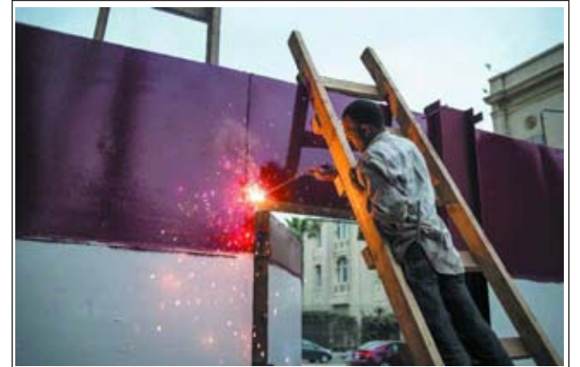
A worker welds on the newly settled metal separation barrier replacing a security wall on a major road leading to Tahrir Square in Cairo, capital of Egypt, on 6 Feb, 2014. A downtown Cairo security wall erected in late 2011 to keep protestors away from government buildings near Tahrir Square was brought down and replaced with a large metal separation barrier on Thursday.