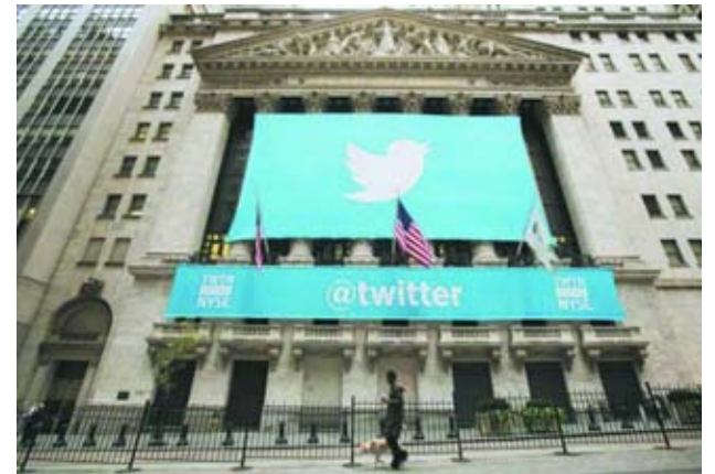
A sign displays the Twitter logo on the front of the New York Stock Exchange ahead of the company’s IPO in New York, on 7 Nov, 2013.