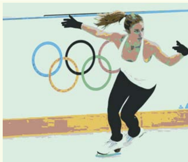
Ashley Wagner of the US skates during a figure skating training session in preparation for the 2014 Sochi Winter Olympics at the Iceberg Skating Palace, on 5 Feb, 2014.