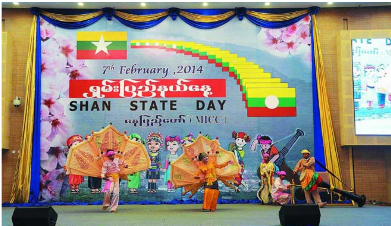
Shan cultural troupe performs entertainment at ceremony to mark 67 th Anniversary Shan State Day at MICC.

NAY PYI TAW, 7 Feb—Pyidaungsu Hluttaw Speaker Thura U Shwe Mann attended ceremony to mark the 67 th Anniversary Shan State Day at MICC, here, this evening.