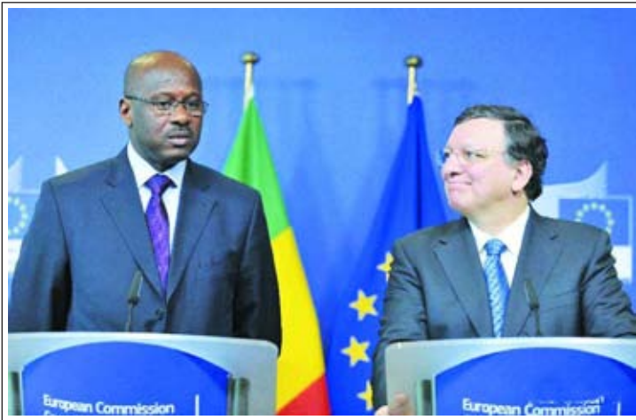
European Commission President Jose Manuel Barroso (R) and Mali's Prime Minister Oumar Tatam Ly attend a Press conference after their meeting at EU headquarters in Brussels, capital of Belgium, on 6 Feb, 2014.