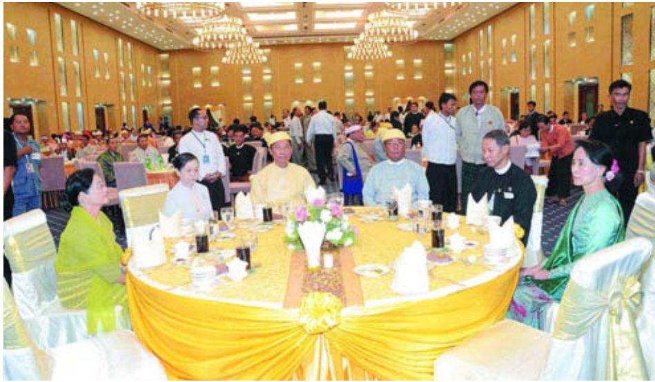
Pyidaungsu Hluttaw Speaker Thura U Shwe Mann, Amyotha Hluttaw Speaker U Khin Aung Myint and Hluttaw Committee Chairperson Daw Aung San Suu Kyi attend Shan State Day reception. (News on page 1)