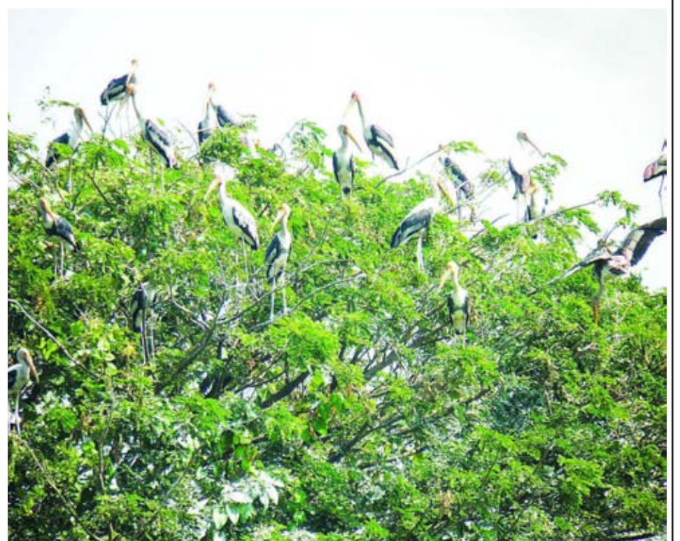
Photo shows migratory birds seen at national fish breeding lake.