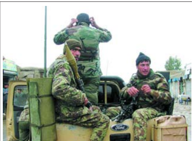
Afghan security forces sit in a military vehicle in Nangarhar Province in eastern of Afghanistan on 6 Feb, 2014. Afghan security forces detained 36 suspect Talebans with their ammunition during an operation in Nangarhar Province on Thursday officials said.