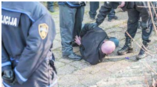
Police detain an anti-government protester in Tuzla on 6 Feb, 2014.

Police fired teargas to drive back several thousand people throwing stones, eggs and flares at a local government building in Tuzla, once the industrial heart of Bosnia's north which has been hit hard by factory closures in recent years.