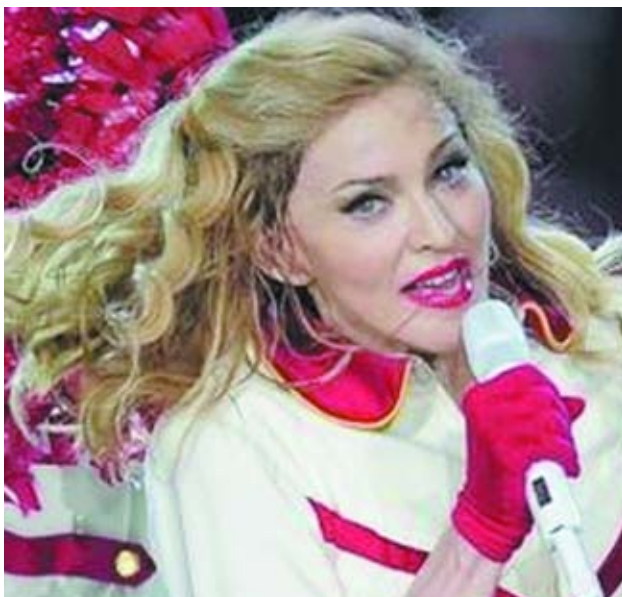
Madonna says she was even threatened with arrest

"Needless to say, I did not change one moment of my show. 87 of my fans were arrested for gay behaviour — whatever that is," she said.—PTI