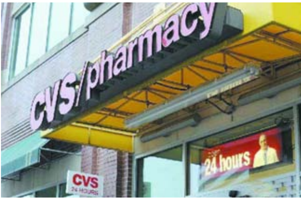
Photo taken on 5 Feb, 2014 shows a view of the entrance of a CVS store in Arlington, Virginia.

WASHINGTON, 7 Feb — CVS Caremark, the second largest drugstore chain in the US, announced on Wednesday it will stop selling cigarettes and other tobacco products in its more than 7,600 stores nationwide, a decision US