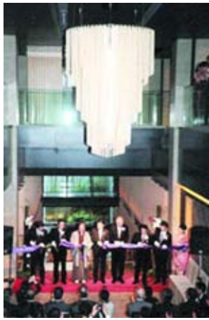
An opening ceremony is held at the Ritz-Carlton Kyoto hotel in Kyoto, western Japan, on 7 Feb, 2014.

Prestigious sweets shop Pierre Herme Paris, Japanese restaurant Mizuki