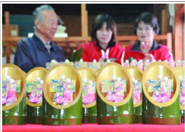
Photo shows "Kaguyabina," couple dolls in bamboo tubes in the town of Kamigori, Hyogo Prefecture, on 6 Feb, 2014.