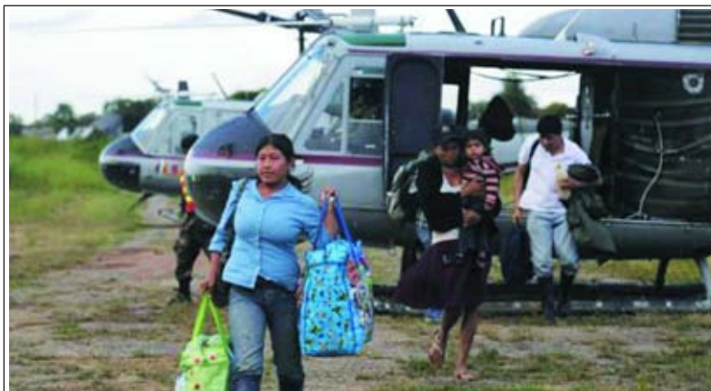
Women disembark from a helicopter after being rescued from their flooded homes, in Trinidad, some 400 km (249 miles) northeast of La Paz on 5 Feb, 2014.

"We put on one side the workers who were left without basic rights, such as pensions and health benefits... , and on the other side all hooligans who used this situation to create chaos," Prime Minister Nermin Niksic said after the meeting.—Reuters