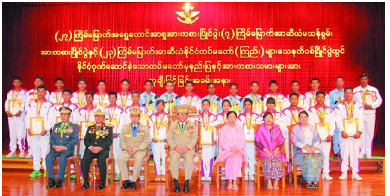
Senior General Min Aung Hlaing poses for documentary photo with victorious athletes.

NAY PYI TAW, 7 Feb—Commander-in-Chief of Defence Services Senior General Min Aung Hlaing presented certificates of honour and cash awards to the victorious coaches and athletes in the 27 th SEA Games, the 7 th ASEAN Para Games and the 23 rd ASEAN Armies Rifle Meet, at Zeyathiri Beikman here this morning.