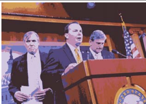
(L to R) US Senators Jeff Merkley (D-OR), Mike Lee (R-UT) and Joe Manchin (D-WV) attend a news conference to address the introduction of the Senate's bipartisan resolution that would require congressional approval for any military mission in Afghanistan after 2014, on Capitol Hill in Washington DC, capital of the United States, on 6 Feb, 2014.