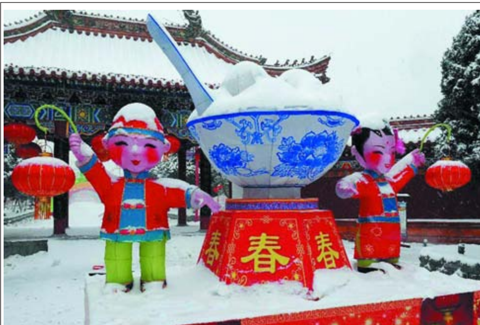
Photo taken on 6 Feb, 2014 shows the snow-covered landscape of a scenic area in Kaifeng City, central China's Henan Province, on 6 Feb, 2014. The city witnessed a snowfall Thursday.

Moeung Samphan, Secretary of State at the Cambodian Ministry of Defence, extended gratitude to the Chinese government and the Chinese People's Liberation Army for continuous supports to Cambodia. "The aid is timely as Cambodia is facing shortage of military materials," he said. "This truly reflects China's attention to assist Cambodia and it will create closer friendship relations and solidarity between the armies of the two countries." —Xinhua