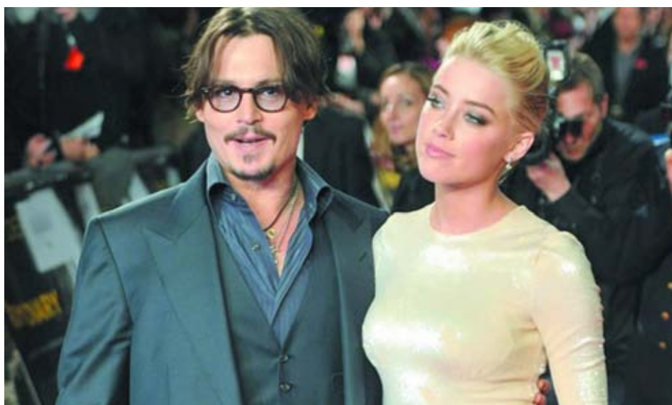
Johnny Depp proposed to Amber Heard last year