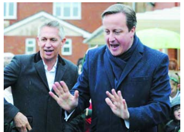
Britain's Prime Minister David Cameron (R) arrives with sports broadcaster Gary Lineker at St Brigid's Catholic Primary School in Birmingham, central England on 6 Feb, 2014.

A "yes" vote would place the future of Britain's Scotland-based nuclear submarine fleet in doubt and could weaken London's claim to a permanent seat on the United Nations and its influence in the European Union. EU People familiar with the matter say Cameron doesn't want to go down in history as the prime minister who lost Scotland. But he has conceded that his privileged background and centre-right politics mean he isn't the best person to win over Scots, usually more left-wing than the English.