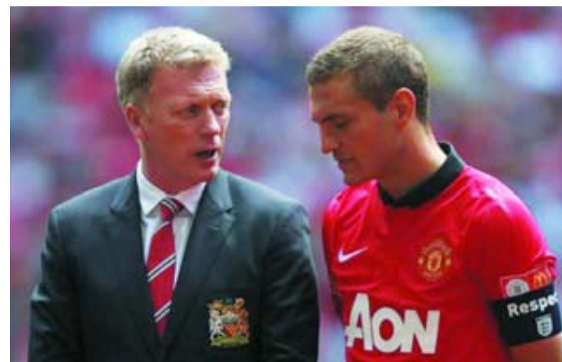
Manchester United's new manager David Moyes speaks to his captain Nemanja Vidic before their kick off against Wigan Athletic's in their English Community Shield soccer match at Wembley Stadium in London, on 11 Aug, 2013.