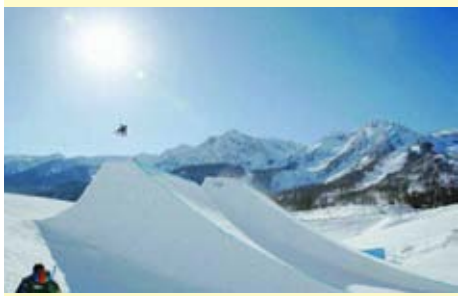
Photo shows jump ramps for the snowboard slopestyle in Sochi, Russia, on 6 Feb, 2014.

The short dance and the women's short programme are scheduled for Saturday.