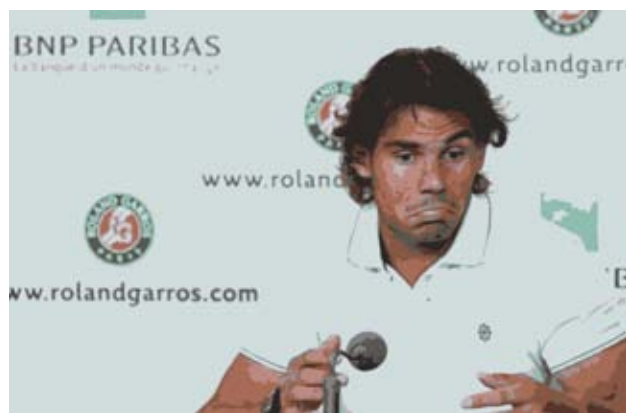
Rafael Nadal speaks during a news conference in Paris on 9 June, 2012.

After that, he will defend his titles at the 6-9 March WGC-Cadillac Championship in Miami and the 20-23 March Arnold Palmer Invitational in Or-