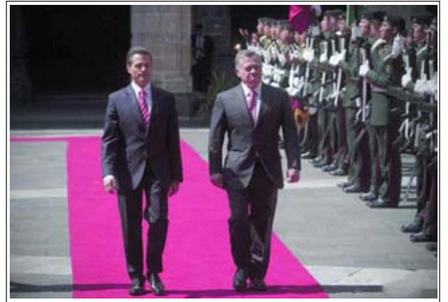
Mexican President Enrique Pena Nieto (L) and King Abdullah II of Jordan (R) review a guard of honour during a welcome ceremony at the National Palace in Mexico City, capital of Mexico, on 6 Feb, 2014. King Abdullah II of Jordan was in Mexico on an official visit upon the invitation of Mexican President Enrique Pena Nieto, the state-run Petra news agency reported.

His presence at the Olympics will be significant, as US and European leaders have decided not to attend the opening ceremony to protest antigay legislation enacted by Russia last year.