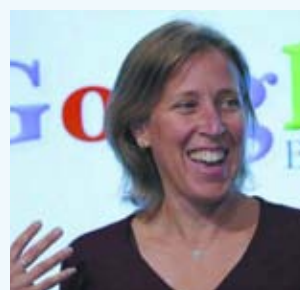
Susan Wojcicki, senior vice president of Ads and Commerce for Google, speaks at the garage where the company was founded on Google’s 15th anniversary in Menlo Park, California on 26 Sept, 2013.