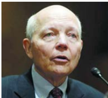
John Koskinen testifies before a Senate Finance Committee confirmation hearing on his nomination to be commissioner of the Internal Revenue Service (IRS) on the Capitol Hill in Washington, on 10 Dec, 2013.

"Finalizing this proposed rule would make intimidation and harassment of the administration's po-