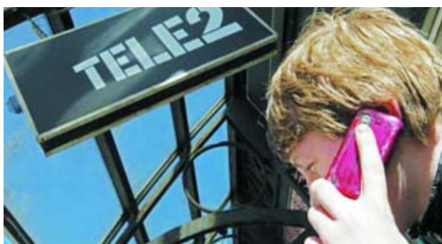
A man talks on a telephone outside a branch of Nordic telecoms group Tele2 in St. Petersburg, on 28 March, 2013.