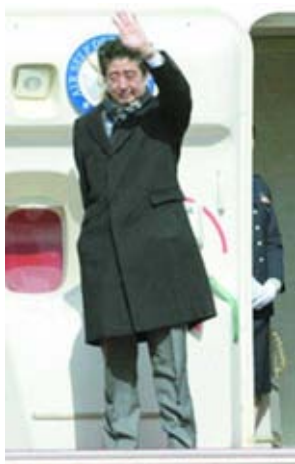
Japanese Prime Minister Shinzo Abe waves to onlookers at Haneda Airport in Tokyo on 7 Feb, 2014.

At the summit in the Black Sea resort on Saturday, the two leaders are also