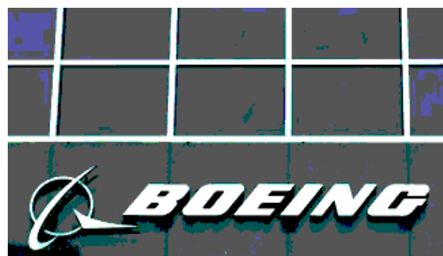
The Boeing logo is seen at their headquarters in Chicago, on 24 April, 2013.

McNerney also acknowledged that Boeing is hiring contract workers to help fix production problems at the 787 Dreamliner factory in South Carolina, and that some work was being moved to the Seattle area to be finished. “We have traveled some work to Everett,” he said, referring to the location Boeing’s main 787 assembly line. But he characterized it as routine: “This is what we do all the time.”—Reuters