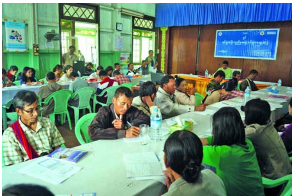
Members of Township Community-based Support Group at the workshop together with Township Committee for the Rights of the Child.

THATON, 25 Jan—Thaton Township Committee for the Rights of the Child and Community-based Support Group held the workshop at the hall of Township Administrator in Thaton Township of Mon State on 22 January.