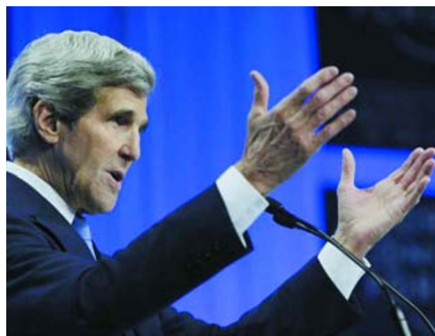
US Secretary of State John Kerry delivers his speech at the World Economic Forum in Davos, Switzerland on 24 Jan, 2014.