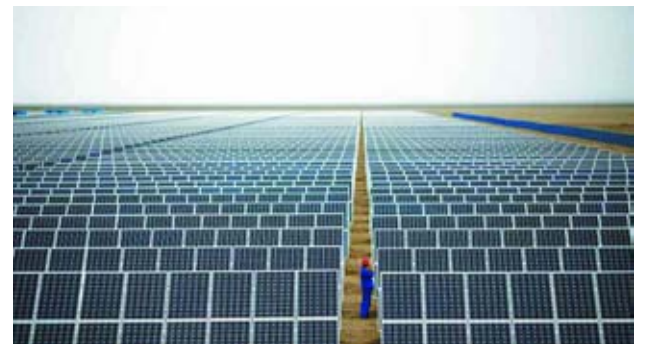
A worker inspects solar panels at a solar farm in Dunhuang, 950km (590 miles) northwest of Lanzhou, Gansu Province on 16 Sept, 2013.

But industry officials worry fast-growing generation capacity will increase fiscal pressures on China and Japan and force them to cut subsidies which will then hit demand, just as happened with previous big solar users Germany, Spain and Italy. “The key is whether the Chinese government is