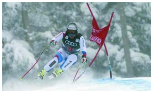
Feuz Beat of Switzerland skis to sixth place during the Men's World Cup Downhill ski race in Beaver Creek, Colorado, in this file photo from 6 Dec, 2013.

WENGEN, (Switzerland), 25 Jan — Having undergone 10 knee surgeries