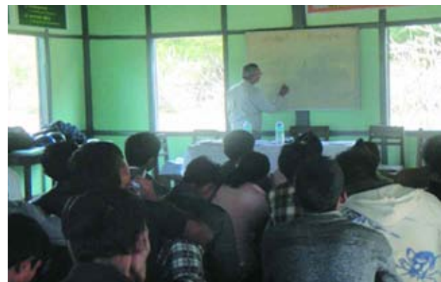
An official give lecture on technics of fish breeding.

MMAL-Kyaukse District Fisheries Department