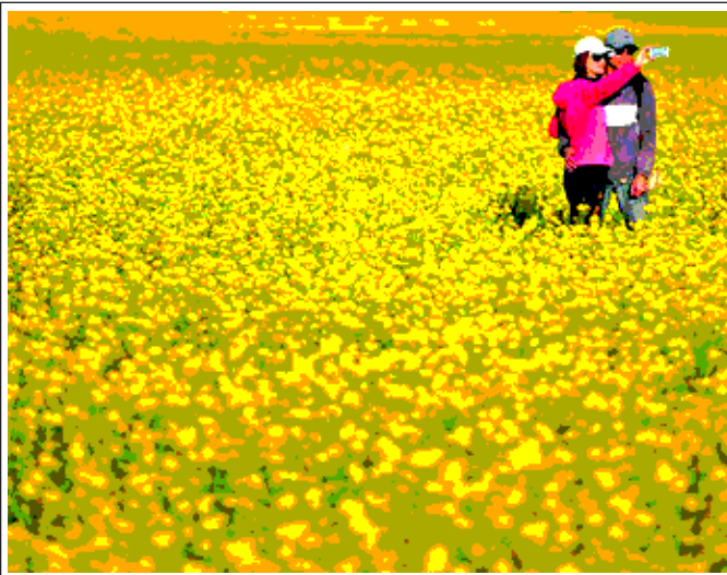
Two tourists take photos of themselves amidst rape flowers in Chishang Township of Taitung County, south-east China's Taipei, on 24 Jan, 2014. In Taitung County, a major rice-producing area in Taiwan, farmers would grow rapes in their rice paddies during the winter fallow. The rapes, though planted as fertilizers, have become an attraction for the tourists.