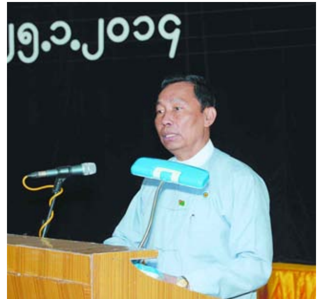
Pyidaungsu Hluttaw Speaker Thura U Shwe Mann delivers an address in meeting with local people in Sagaing Region.

(from page 16) should not harm current stability and development, unity of national people, national reconciliation and