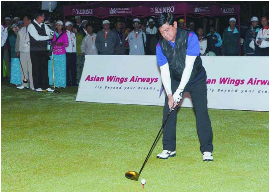
Vice-President U Nyan Tun takes part in 2 nd Union Government Cup Golf Tournament for 2014. (News on page 1) MNA