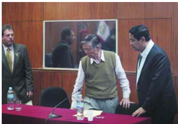
Peru's former President Alberto Fujimori attends a judge's verdict about his sentence in prison, in Lima on 29 Oct, 2013.

LIMA, 25 Jan — Peru has closed an inquiry into whether former president Alberto Fujimori and his cabinet members forcibly sterilized thousands of indigenous women as part of a birth control campaign that targeted the rural poor.