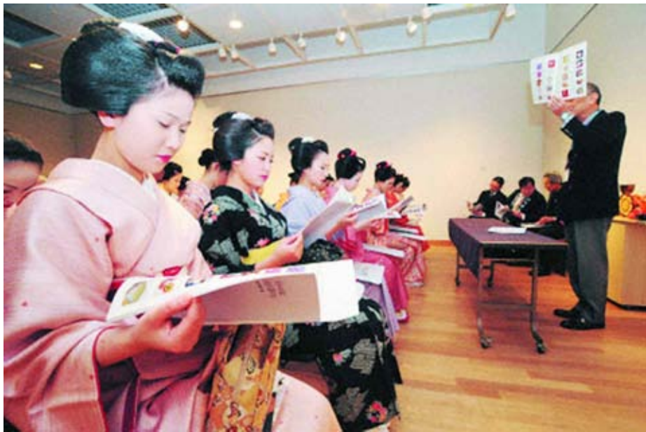
"Maiko" (apprentice "geiko" or geisha) and "geiko" in Kyoto receive a lecture about traditional Japanese arts and crafts as part of their training programme on 22 Jan, 2014.