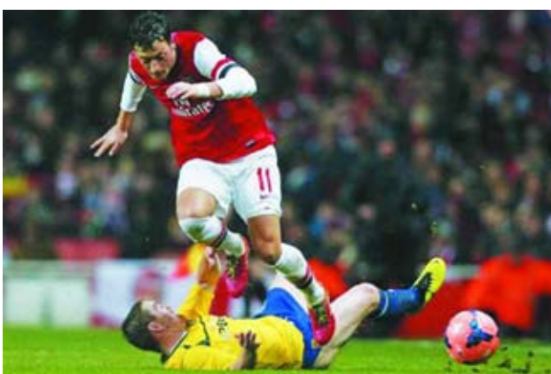
Arsenal's Mesut Ozil (top) is challenged by Coventry City's John Fleck during their English FA Cup fourth round soccer match at The Emirates in London on 24 Jan, 2014.

Three minutes after the opening goal Coventry, the 1987 FA Cup winners who now play in League One, almost hit back with Arsenal stopper Lukasz Fabianski making a diving save to keep out midfielder Carl Baker's fine shot from outside the area. Striker Leon Clarke also missed two good chances to get a more enterprising Coventry side back into the game early in the second half. Fabianski saved his first effort and the striker then hit the post from a central position inside the box after Franck