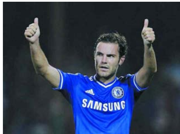
Chelsea's Juan Mata acknowledges the fans after winning their game against Swindon Town in their English League Cup soccer match at the County Ground in Swindon, western England on 24 Sept, 2013.

With competition fierce for places in the 2014 World Cup squad, Mata needs regular first