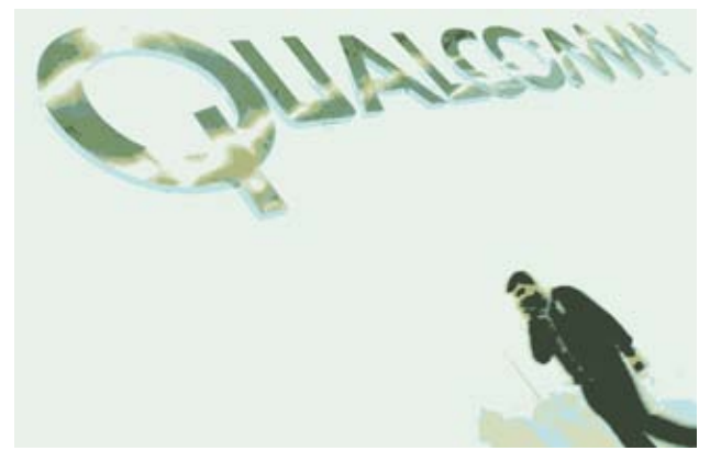
A man walks past a Qualcomm advertising logo at the Mobile World Congress at Barcelona, on 27 Feb, 2013.

The new patents will not lead to increased royalty rates for existing Qual-