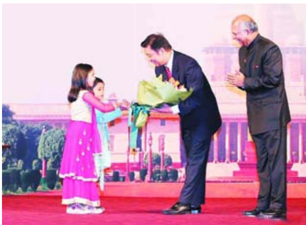
Chinese Vice President Li Yuanchao (C) attends the opening ceremony of China-India "Year of Friendship in 2014", in Beijing, capital of China, on 24 Jan, 2014.

In Peru, they also plan to visit the residences of elderly Japanese Peruvians. In Argentina, migrants of Okinawan descent will hold a welcome event in their honor.