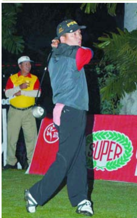
A golfer taking part in 2 nd Union Government Cup Golf Tournament for 2014. (News on page 1) MNA