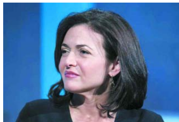
The chief operating officer of Facebook, Sheryl Sandberg, listens at the Clinton Global Initiative 2013 (CGI) in New York on 24 Sept, 2013.

LOS ANGELES, 25 Jan — Sony Pictures Entertainment has purchased the film rights to Facebook Inc executive Sheryl Sandberg's bestselling memoir on female empowerment, "Lean In," a source familiar with the deal said on Friday.