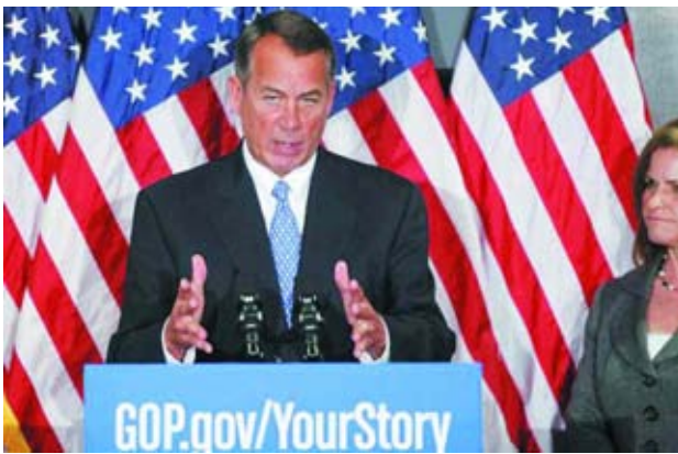
US House Speaker John Boehner (R-OH) speaks next to Representative Lynn Jenkins (R-KS) (R) during a news conference at the Republican National Committee offices on Capitol Hill in Washington on 23 Oct, 2013.

We need to present the American people with a positive,” said long-time Senator John McCain of Arizona, who in 2008 had