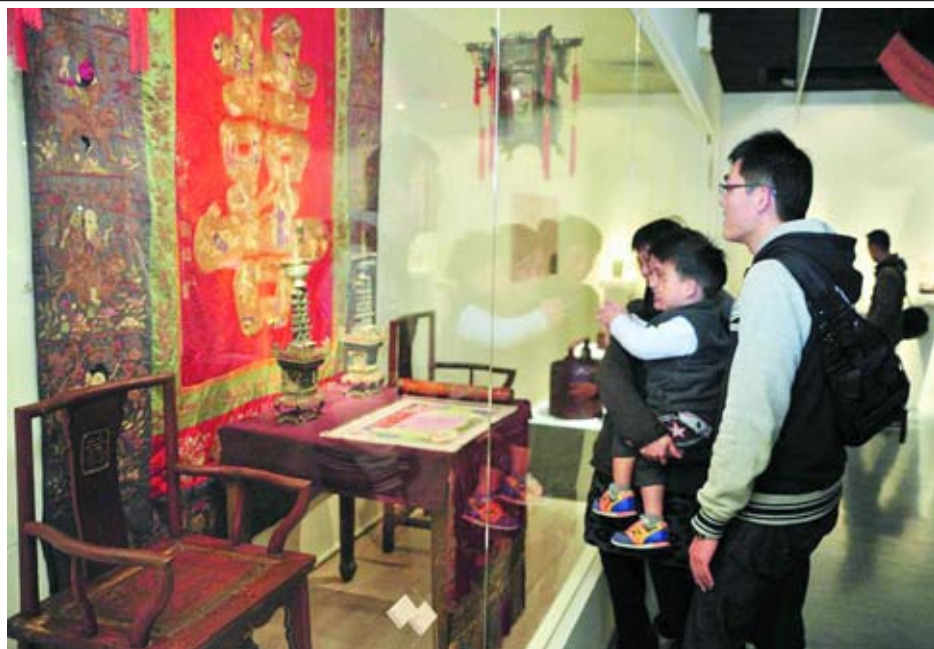
Visitors watch furnitures with Chinese character 'Xi', meaning "Double Happiness" in Taipei, southeast China's Taiwan. About 150 exhibits featuring the traditional "Xi" culture were displayed at Taipei Museum of History on Friday.