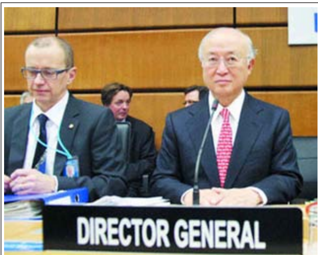
Yukiya Amano (R), director general of the International Atomic Energy Agency, attends a special session of the IAEA Board of Governors on monitoring Iran's nuclear programme, in Vienna, Austria, on 24 Jan, 2014.