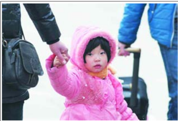
A little "migratory bird" is on the way home with parents.