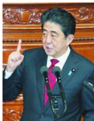
Japanese Prime Minister Shinzo Abe delivers a policy speech at the House of Representatives in Tokyo on 24 Jan, 2014.

have stirred controversy over the draft of the energy policy, calling for the need to break away from nuclear power generation, while former Prime Minister Morihiro Hosokawa, who is running in the Tokyo gubernatorial race with support from another former premier, Junichiro Koizumi, shows antinuclear stance during the election campaign.—Kyodo News