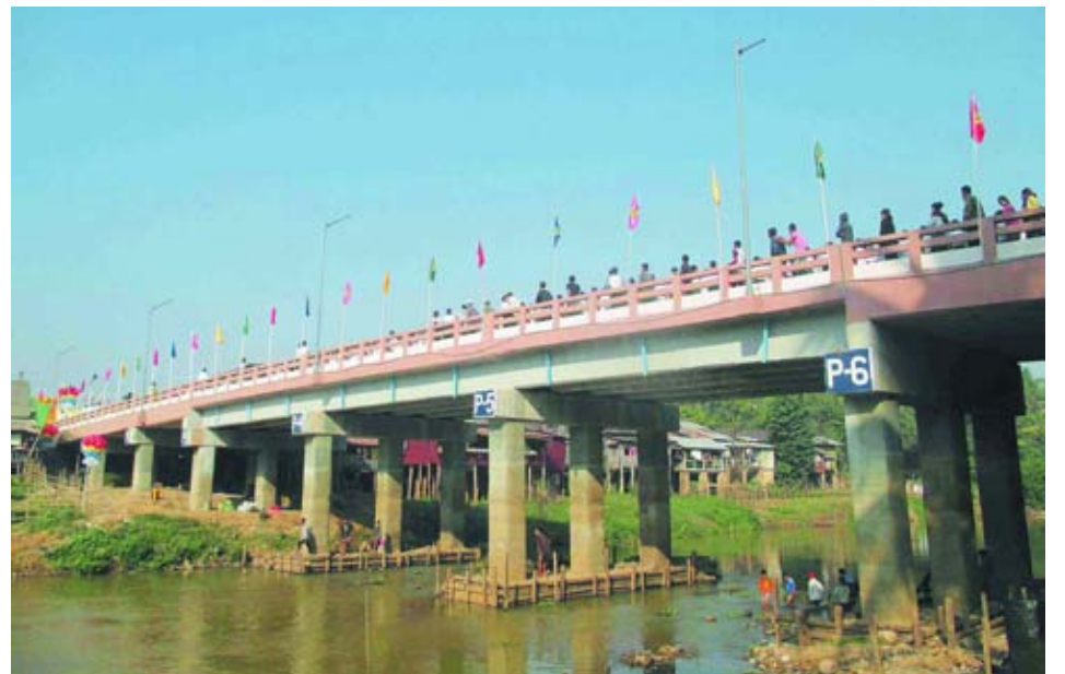
Kyaukkyi Bridge is put into service in Kyaukkyi Township in Bago Region.