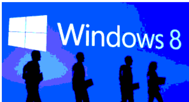
Guests are silhouetted at the launch event of Microsoft Windows 8 operating system in New York in this 25 Oct, 2012 file photo.

SEATTLE, 25 Jan — Microsoft Corp posted a bigger-than-expected quarterly profit on Thursday, boosted by strong sales of its software and