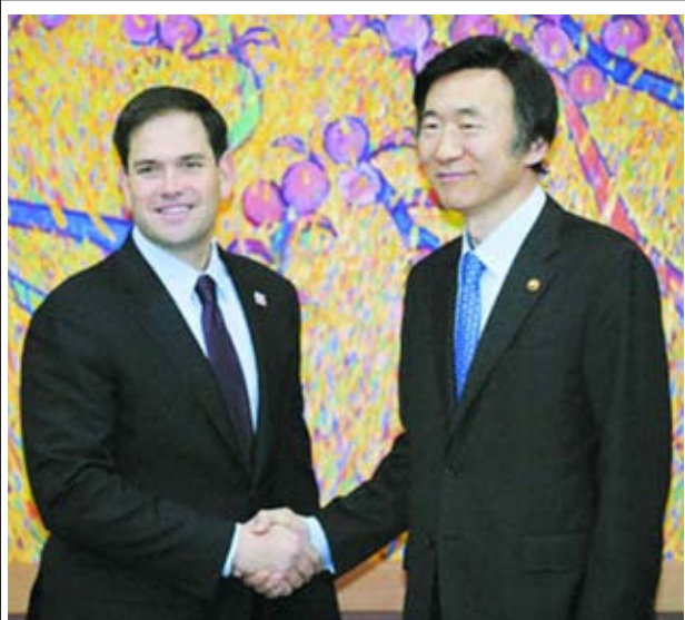
Marco Rubio (L), a Republican senator for Florida, shakes hands with South Korean Foreign Minister Yun Byung Se ahead of talks at the ministry in Seoul on 24 Jan, 2014.