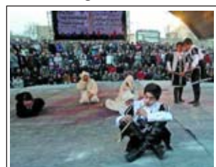
Iranian actors perform during the 32 th Fajr International Theater Festival in Teheran, capital of Iran, on 24 Jan, 2014.

At age 44, Sandberg is considered to be one of the world's youngest billionaires after shares of Facebook rose earlier this week and made her one of the few women to cross the $1 billion mark in net worth. Sandberg worked for the US Treasury Department and Google Inc before joining Facebook in 2008. Columbia Pictures also distributed 2010's "The Social Network," about the founding of Facebook by Mark Zuckerberg. — Reuters