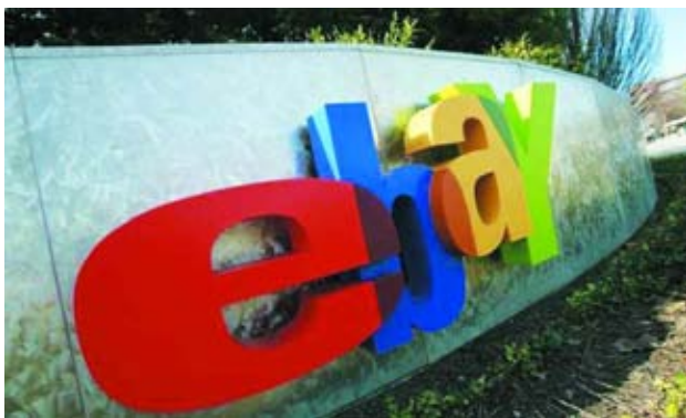
A sign is shown at the headquarters of eBay in San Jose, California February 2, 2010. Picture taken on 2 Feb, 2010.

NEW YORK, 25 Jan — Activist investor Carl Icahn's stake in e-commerce company eBay Inc is more than previously reported at close to 2 percent, a source familiar with the matter said on Thursday.