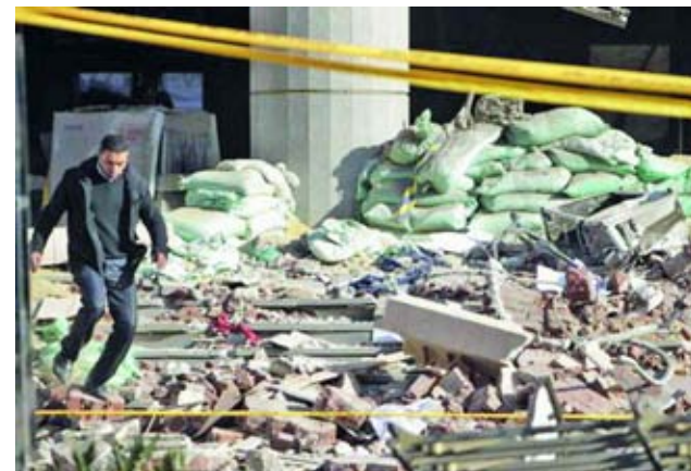
A police officer walks over rubble from a blast, after a bomb attack in downtown Cairo on 24, Jan 2014.

Authorities have tightened security around Cairo in anticipation of trouble,