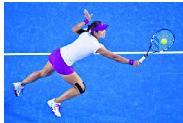
Li Na of China hits a return during her women's singles final match against Dominika Cibulkova of Slovakia at 2014 Australian Open tennis tournament in Melbourne, Australia, 25 Jan, 2014.

The champion is Li's second Grand Slam title as she won her first in the 2011 French Open.