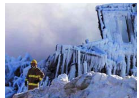
A firefighter looks on at the seniors residence Residence du Havre after a fire in L'Isle-Verte, Quebec, on 23 Jan, 2014.