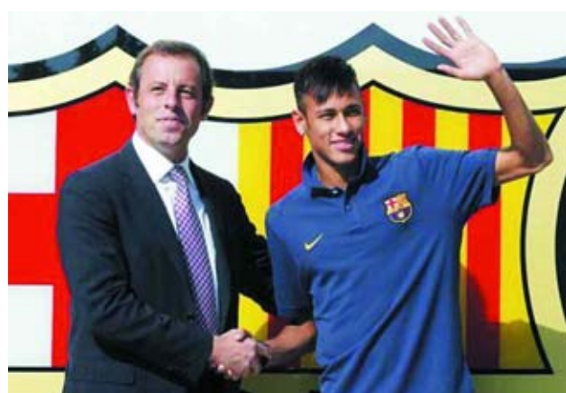
Brazilian soccer player Neymar (R) shakes hands with Barcelona's president Sandro Rosell after signing a five-year contract with FC Barcelona, in front of their offices close to Camp Nou stadium in Barcelona in this 3 June, 2013 file photo.

Sandro Rosell, who was named in the lawsuit but denies wrongdoing, stepped down as president on Thursday. He said he wanted to protect the club's image and alleged he and