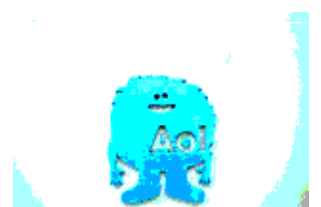
The AOL logo is seen at the company's office in New York on 5 Nov, 2013. — REUTERS

and CEO Amit Kapur said Gravity uses machine based algorithms to determine what topics are interesting to a specific reader based on their preferences and habits. "When you go to a website, it organizes the entire experience just for you," said Kapur, who was also the chief operating officer of MySpace. — Reuters