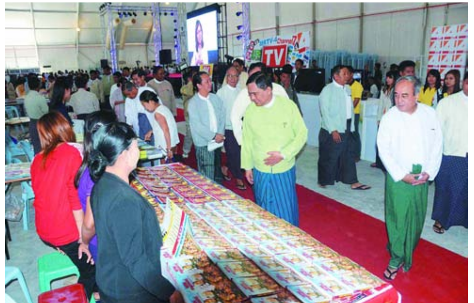
Union Minister U Aung Kyi views round at 1 st Book Show of Reader's Channel. —MNA