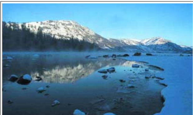
Photo taken on 23 Jan, 2014 shows the winter scenery in Kanas, Altay Prefecture, northwest China's Xinjiang Uygur Autonomous Region.

Previous star exhibits in the 35 meter high by 152 meter long Turbine Hall have included 'Marsyas' by Indian artist Anish Kapoor, who designed a tower for the London Olympics site, and French-American artist Louise Bourgeois 'I Do, I Undo, I Redo' which was the first exhibition in the space in 2000, and last year's 'These Associations' by British-German artist Tino Sehgal.