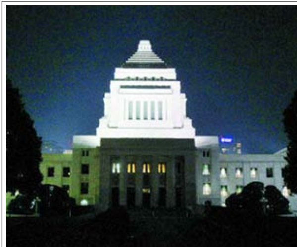
The Diet building in Tokyo is illuminated on 24 Jan, 2014, as nighttime illumination of the Japanese parliament resumes after a nearly three-year hiatus. The illumination, which started in 1990 to mark the centennial of the launch of the Diet, was halted on 14 March, 2011, three days after the massive earthquake and tsunami that triggered the nuclear crisis at the Fukushima Daiichi power plant, leading to power shortages in Japan.

The National Defence Commission sent an open letter on Thursday on a special order from DPRK's top leader Kim Jong Un, saying that Pyongyang's repeated peace call was not "camouflaged," the official KCNA news agency reported on Friday. On 16 January, the commission said in its "important proposal" that the two Koreas should stop all hostile acts starting from 30 January on the eve of the Lunar New Year.—Xinhua