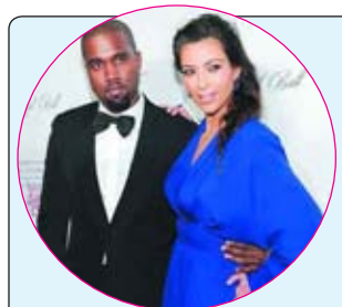
Kanye West and Kim Kardashian have a daughter together.

Like "Jersey Boys" and "Motown: The Musical," shows that have been drawing crowds on Broadway, "Beautiful" is about real people and the music they created.—Reuters