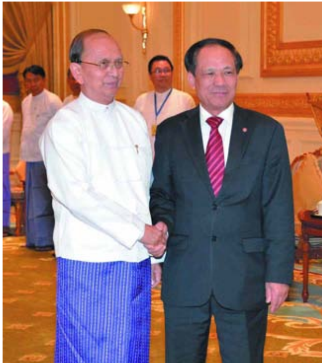
President U Thein Sein shaking hands with Secretary-General of ASEAN Mr Le Luong Minh.