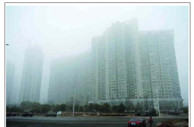
Buildings are blanketed by fog in Nanchang, capital of east China's Jiangxi province, on 14 Jan, 2014. The local meteorologic centre issued an orange alert for fog on Tuesday.