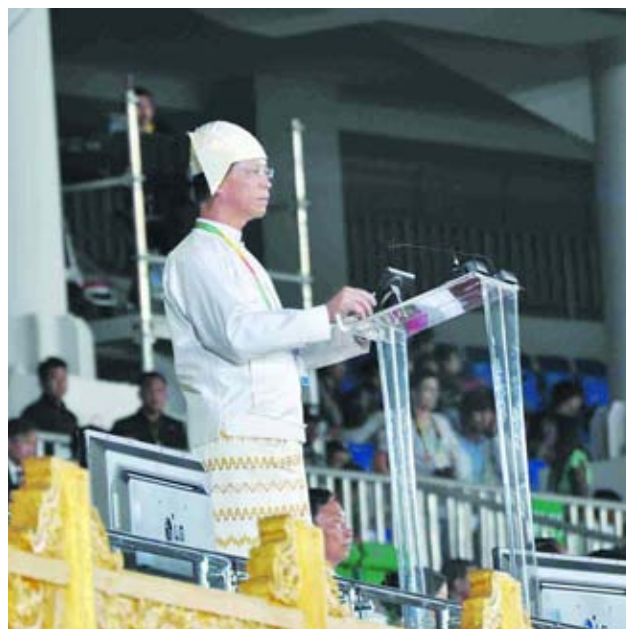
Vice-President Dr Sai Mauk Kham addresses opening of 7 th ASEAN Para Games.