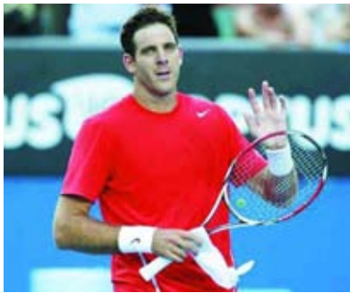
Juan Martin Del Potro

MELBOURNE, 14 Jan — World number five Juan Martin del Potro advanced to the second round of the Australian Open with a 6-7,