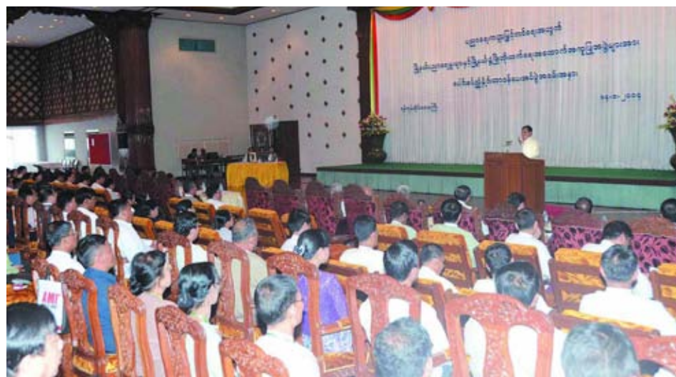
Union Minister at the President Office U Tin Naing Thein addresses coordination meeting to focus on promotion of education sector.

In his address, Union Minister at the President Office U Tin Naing Thein said nation education policies and formulation of laws are under discussion. He stressed the need to achieve increased school enrollment rate and low dropout rate, for capacity building and free secondary education, infrastructure development, mass cooperation in non-