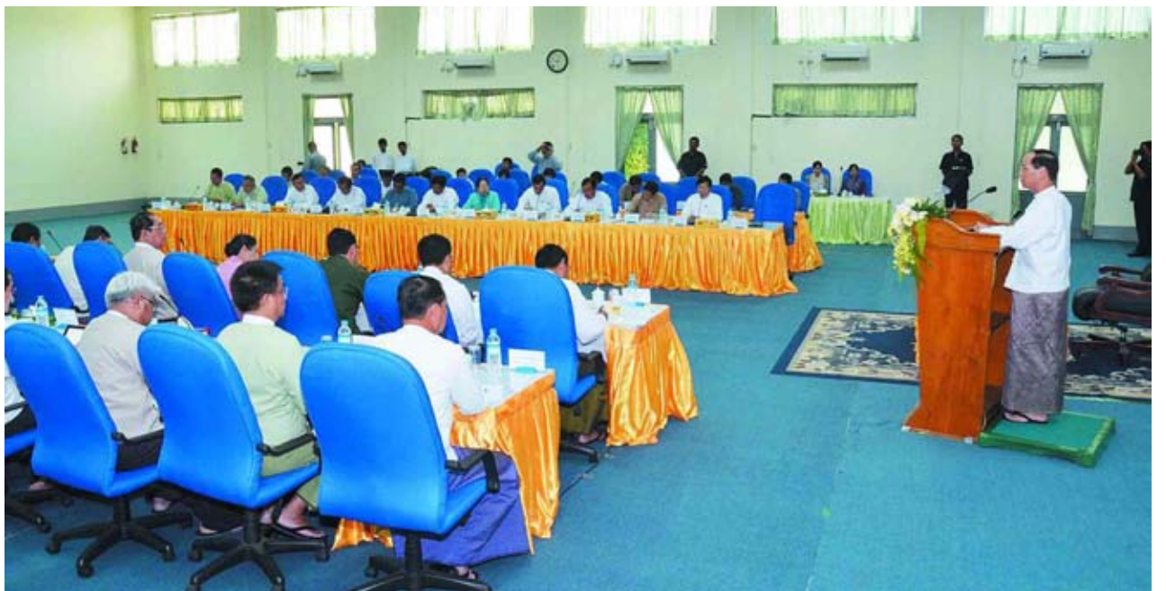
Vice-President Dr Sai Mauk Kham addresses at meeting on holding Inter-University Football Tournament.

Afterwards, Acting Union Minister for Education Dr Myo Myint reported on the holding of inter-university football tournament and Chairman of the Leading Committee for Organizing Inter-University Foot-