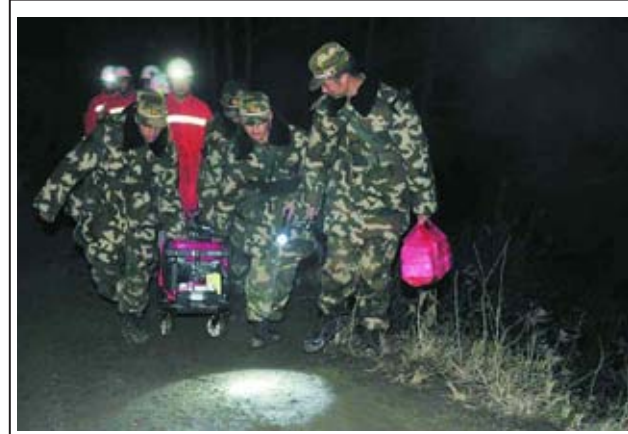
Rescuers transport relief goods to the place where an explosion occurred in Longchang Town, Kaili, southwest China's Guizhou Province, on 13 Jan, 2014. Fourteen people were killed while seven others injured in the explosion here on Monday, local government said. Investigation into the case is now in full swing.