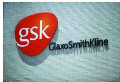
The logo of GlaxoSmithKline (GSK) is seen on its office building in Shanghai on 12 July, 2013.