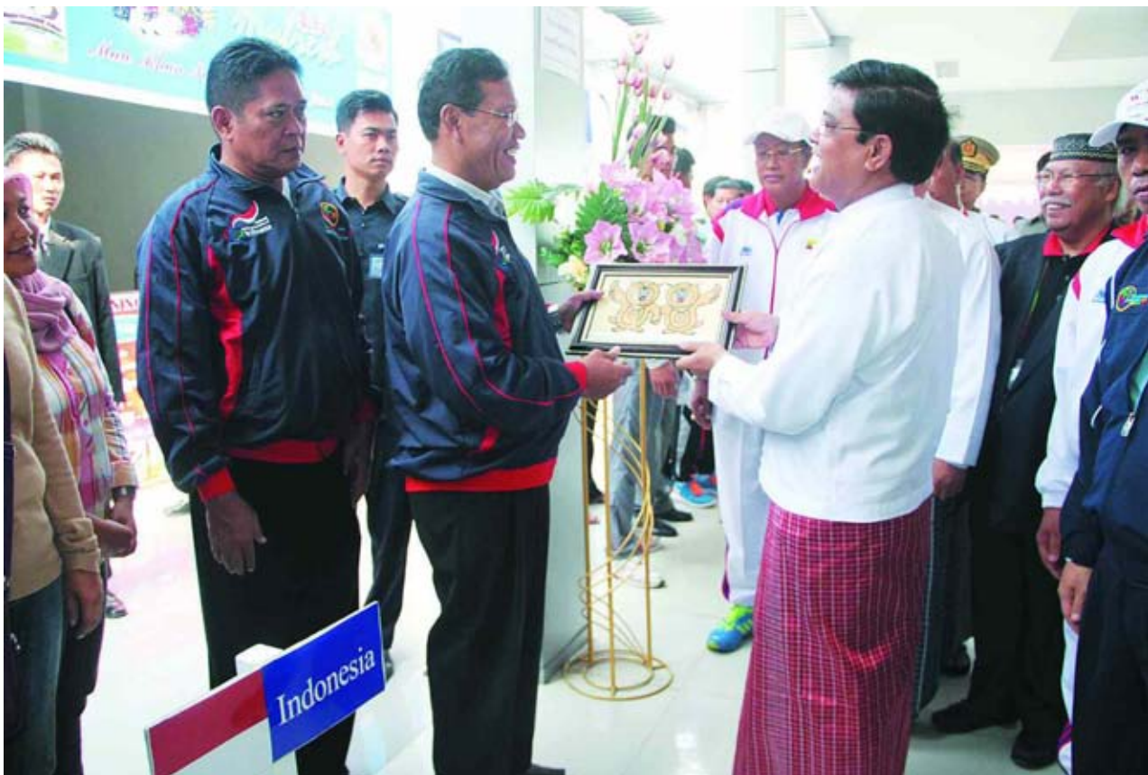
Vice-President of the Republic of the Union of Myanmar U Nyan Tun presents gift to a member of Indonesian sports contingent.