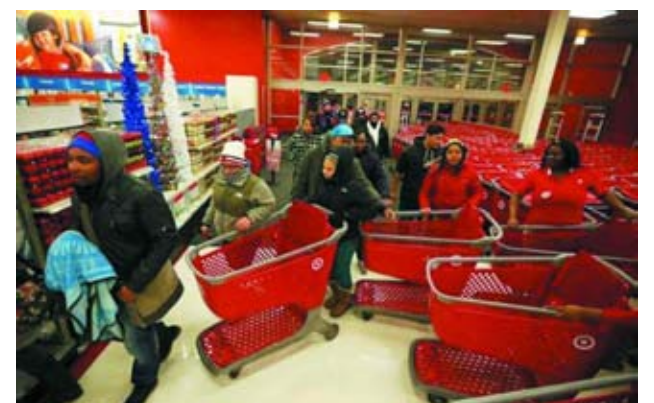
Thanksgiving Day holiday shoppers enter the Target retail store in Chicago, Illinois, on 28 Nov, 2013.