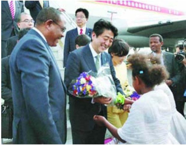
Japanese Prime Minister Shinzo Abe (C) and his wife Akie (to his right) receive flowers after arriving at Bole Airport in Addis Ababa on 13 Jan, 2014. Ethiopian Prime Minister Hailemariam Desalegn is pictured at front left.

On the economic front, Abe told Hailemariam that Japanese companies are very interested in investing in Ethiopia and promised to continue aid in various fields such as agriculture, infrastructure building and education. Hailemariam vowed to improve customs procedures to pave the way for increased Japanese investment including from small and mid-sized com-