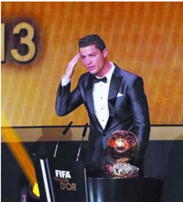
Portugal's Cristiano Ronaldo (L) gestures after being awarded the FIFA Ballon d'Or 2013 in Zurich on 13 January, 2014.