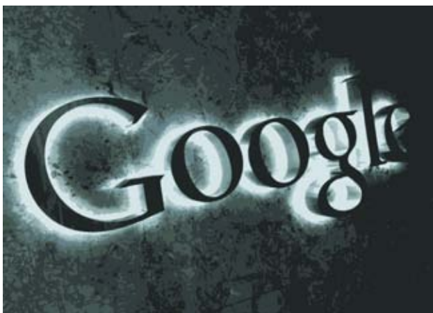
A Google logo is seen at the entrance to the company's offices in Toronto on 5 Sept, 2013.

Nest gained a large following with its first thermostat - a round, brushed-metal