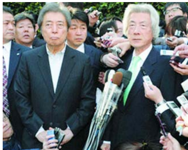
Former Prime Minister Junichiro Koizumi (R) speaks with reporters in Tokyo after a meeting with another former Prime Minister, Morihiro Hosokawa (L), on 14 Jan, 2014. Hosokawa decided to run in the upcoming Tokyo gubernatorial election after securing the backing of Koizumi at the meeting.