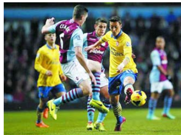
Aston Villa's Ciaran Clark (L) and Ashley Westwood (C) challenge Arsenal's Mesut Ozil during their English Premier League soccer match at Villa Park in Birmingham on 13 Jan, 2014.

"The country's national open should be moved around to give everyone an opportunity to see the event and it also gives us the chance to show the world just how many amazing courses there are in Ireland," added the Northern Irishman.—Reuters