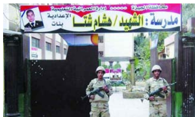
Egyptian soldiers stand guard in the courtyard of a school that will be used as a polling station in Giza on 13 Jan, 2014.

"The situation does not please us, but we'll vote 'yes' and God willing it will get better." This will be the third time Egyptians have voted on constitutional arrangements since the historic uprising against Mubarak, a former air force chief, in January 2011, and overall the sixth time they have gone to the polls since his downfall.—Reuters