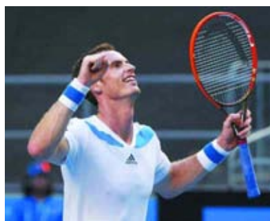
Andy Murray of Britain celebrates defeating Go Soeda of Japan during their men's singles match at the Australian Open 2014 tennis tournament in Melbourne on 14 Jan, 2014.

The Briton headed into the clash having played just two competitive matches since back surgery in September and said it would