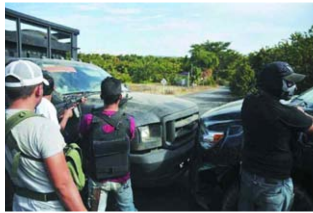
Vigilantes block the road after hearing rumours on a possible ambush in Tierra Caliente on 10 Jan, 2013.

"This is a war. This is no longer an issue of public safety, or normal law enforcement. This is a political-military conflict be-