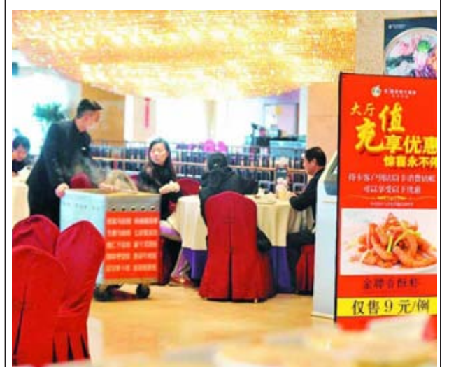
Citizens dine at a restaurant in Taiyuan, capital of north China's Shanxi Province, on 10 Jan, 2014. Many fine restaurants in Taiyuan have changed traditional operation recently to meet the average diners' demand through changing its luxury menu into folk snack, remoulding deluxe rooms into common banquet hall and providing group-purchase set meals with low prices.