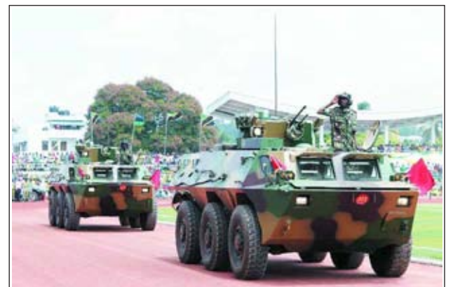
Armoured vehicles participate in the celebration held at the Amani Stadium to commemorate the 50th anniversary of the Zanzibar 1964 Revolution, in Zanzibar, east of Tanzania, on 12 Jan, 2013. The Republic of Tanganyika and the People's Republic of Zanzibar united as the United Republic of Tanzania on 26th April, 1964.

SHIPPING AGENCY DEPARTMENT MYANMA PORT AUTHORITY AGENT FOR: M/S COSC SHIPPING CO LTD Phone No: 256916/256919/256921