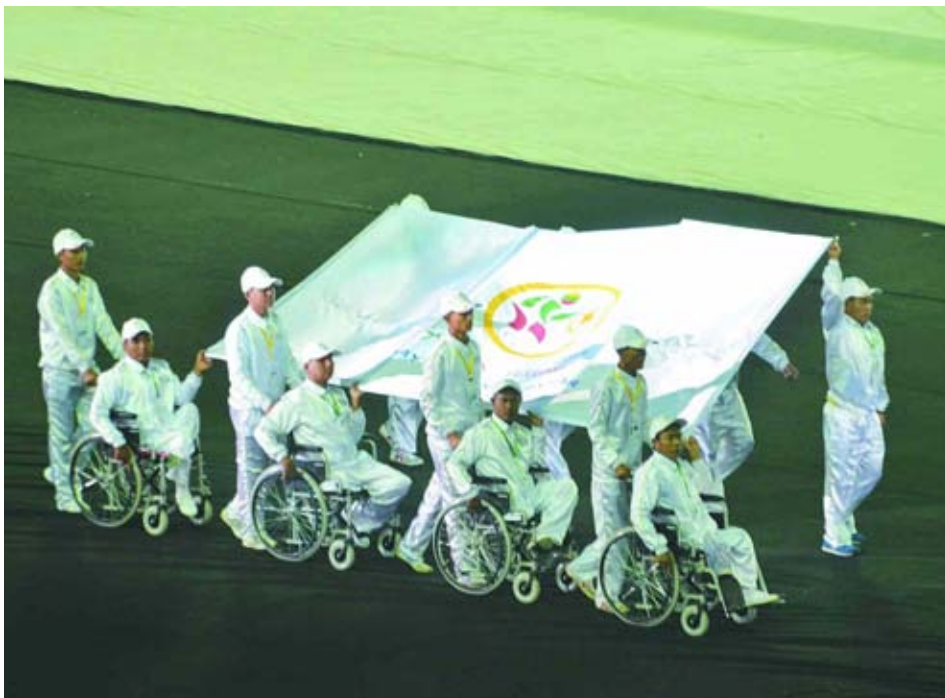
Para sports athletes carrying ASEAN Para Games flag.—MNA

The RLC No. of vehicle with number plate 9909 (2013) is worth K 27.59 million. The well-wishers also donated K 500,000 for the vehicle maintenance.—MNA