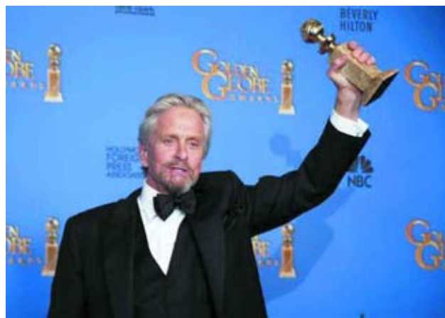
Michael Douglas poses backstage with the award for Best Actor in a Mini-Series or TV Movie for his role in "Behind the Candelabra" at the 71st annual Golden Globe Awards in Beverly Hills, California on 12 Jan, 2014.

The plot for "Ant-Man" is being kept firmly under wraps. The film, directed by Edgar Wright, is scheduled to be in theaters in July 2015.—Reuters