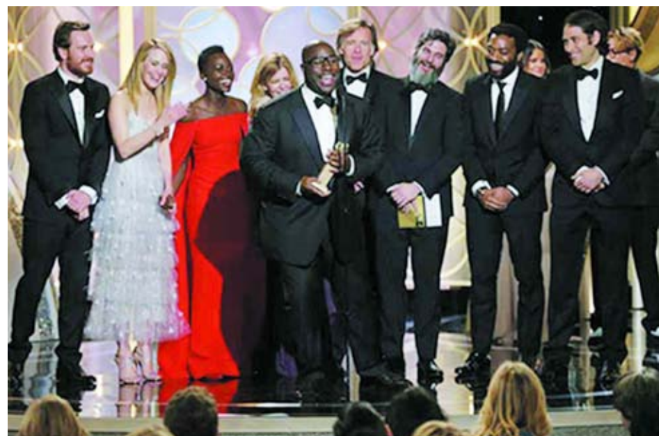
Golden Globe Awards 2014

Comedy or Musical: Brooklyn Nine-Nine. Best TV Actress - Comedy/Musical: Amy Poehler, Parks & Recreation Best Animated Feature Film: Frozen