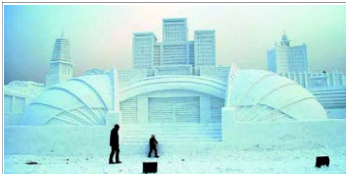
Visitors view the snow sculptures during the 2014 Shenyang International Ice and Snow Festival in Shenyang, capital of northeast China's Liaoning Province, on 12 Jan, 2014.

Material Planning Department Myanmar Electric Power Enterprise, Ministry of Electric Power Bldg No. 27, Nay Pyi Taw Myanmar