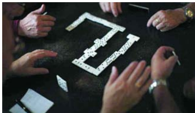
Pensioners play dominoes at a seniors centre during the International Day of Older Persons in Ronda, near Malaga on 1 Oct, 2013.

Older adults who underwent a brief course of brain exercises saw improvements in reasoning skills and processing speed that could be detected as long as 10 years after the course ended, according to results from the largest study ever on cognitive training.