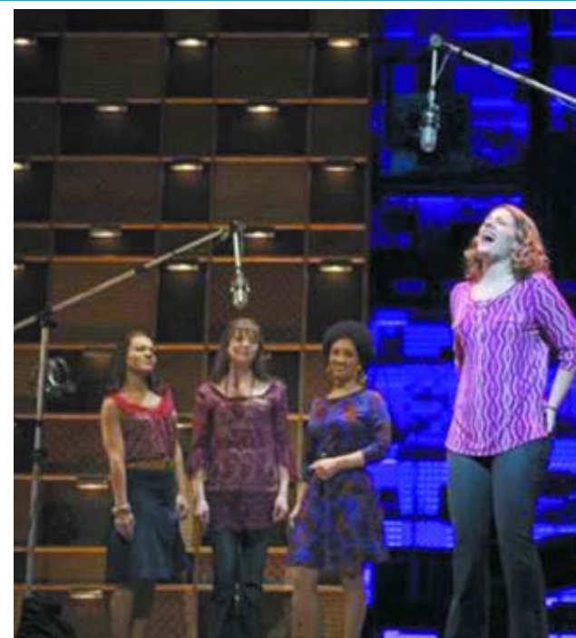
Jessie Mueller sings onstage during the "Beautiful - The Carole King Musical" press preview at the Stephen Sondheim Theatre in New York, on 21 Nov, 2013.

Best TV Series, Comedy or Musical: Brooklyn Nine-Nine.—PTI