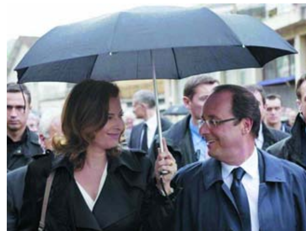
France's President Francois Hollande (R) and his companion Valerie Trierweiler take part in a march as part of a ceremony in tribute to the memory of Nazi victims in Tulle, southwestern France, in this on 9 June, 2012 file photo.