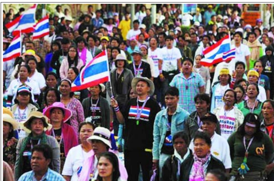
Anti-government protesters listen to the national anthem during a rally in central Bangkok on 14 Jan, 2014.