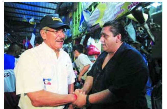
Norman Quijano (L), presidential candidate from the conservative Nationalist Republican Alliance party (ARENA), shakes hands with a man at a local market in La Libertad on 8 Jan, 2014.

The Mitofsky poll shows different results to surveys by the Central American Jesuit University, which have consistently put Sanchez ahead. In December, the latter's poll showed