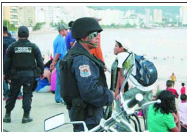
Police officers patrol along a beach in Acapulco, a Pacific resort in Mexico, on 18 Nov, 2013.

"Iran has yet to state whether or not it supports implementing the Geneva 1 communique," he said. For his part, Lavrov reiterated Moscow's support for including Iran in the peace talks. "It's quite clear Iran and Saudi Arabia should participate in this conference," he said. — Xinhua