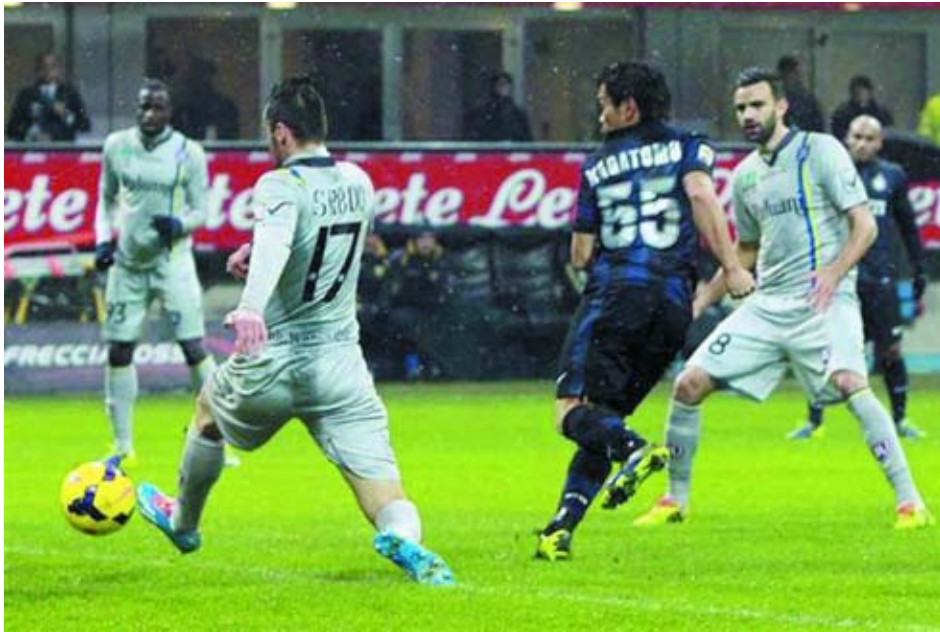
Inter Milan's Yuto Nagatomo (2nd R) shoots to score against Chievo during their Italian Serie A soccer match at San Siro stadium in Milan on 13 Jan, 2014.