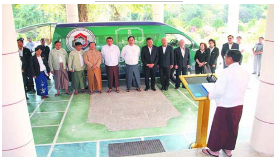
PTT Public Company Limited from Thailand donates a new Mobile Fuel Lab vehicle to MPPE.