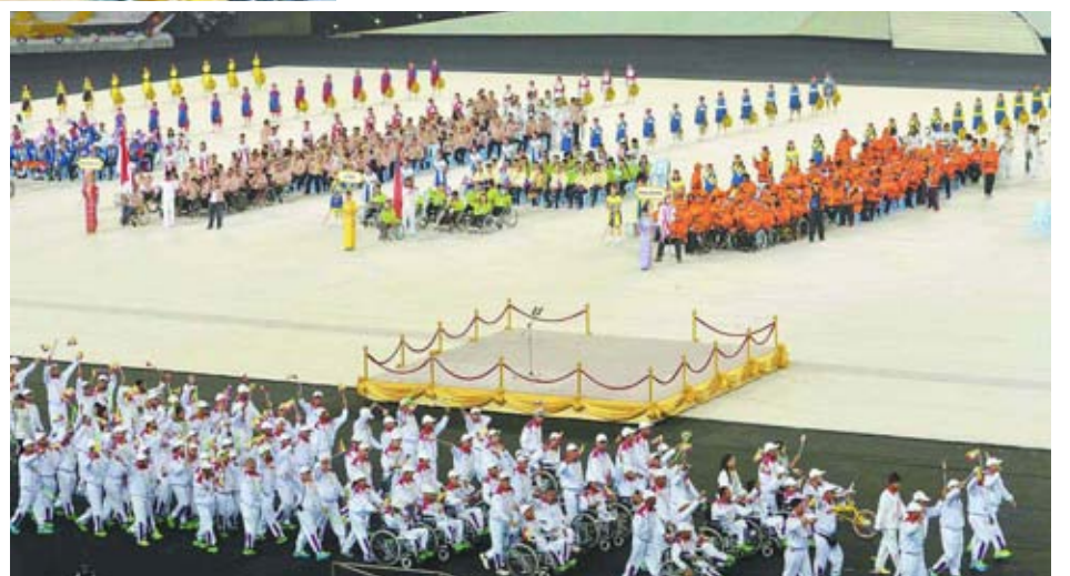
Opening ceremony of ASEAN Para Games in progress.