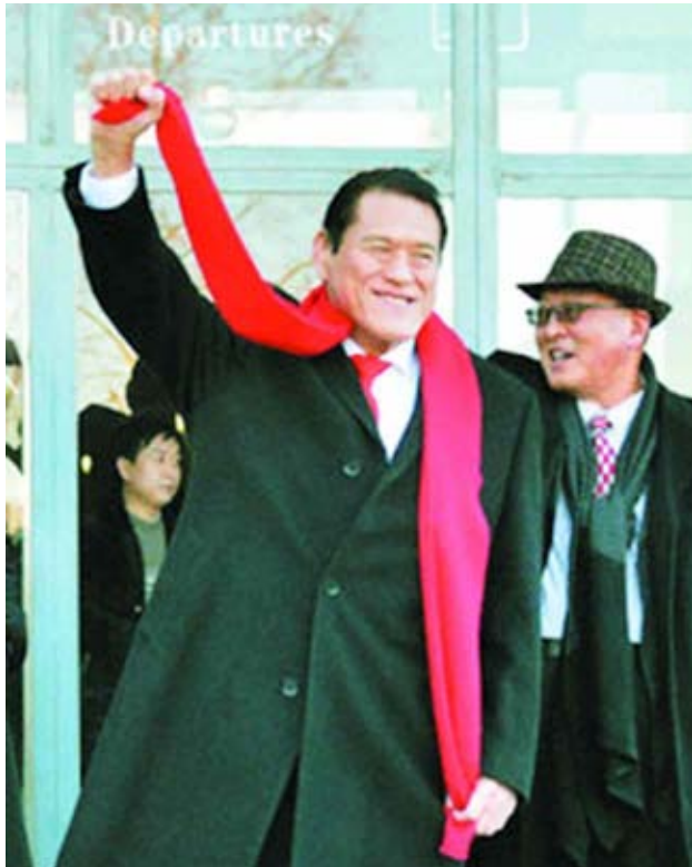
Japanese lawmaker Antonio Inoki arrives in Pyongyang on 13 Jan, 2014. The pro wrestler-turned-politician is expected to promote sports exchanges and reiterate his proposal for a trip by a Japanese parliamentary delegation to North Korea.