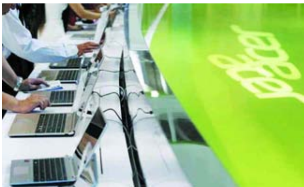
Visitors try Acer laptops at the Acer booth at the 2013 Computex exhibition at the TWTC Nangang exhibition hall in Taipei on 4 June, 2013.

TAIPEI, 14 Jan — Investors looking for specifics as to the future of Acer Inc, the world's No 4 PC vendor, came away disappointed when the new CEO spent more time delivering a history of the company's past mistakes than on where it was headed.