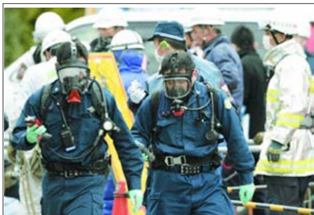
Investigators wearing masks examine a sewer work site around a manhole in the Kurihama district in the city of Yokosuka, Kanagawa Prefecture, on 10 Jan, 2014. Four sewer maintenance workers were found lying earlier the same day near the manhole, where hydrogen sulfide was detected.