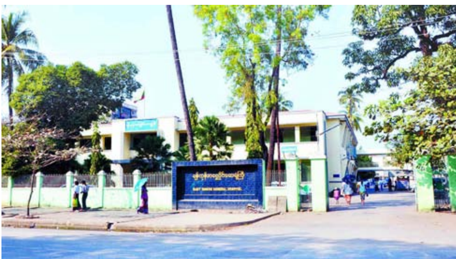
Yangon East General Hospital in Yangon.

In coming years, it is expected to provide better health care services to the people as the government gives priority to the health sector with more allotment of funds.