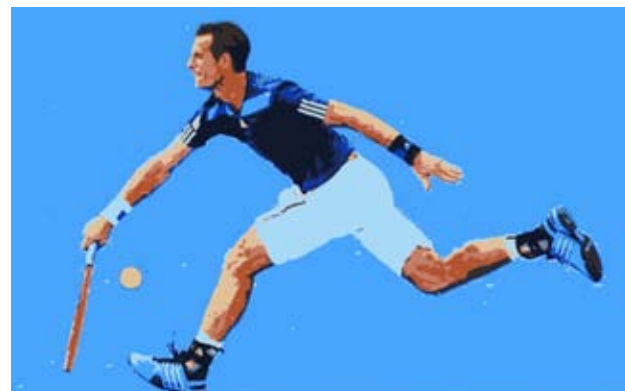
Britain's Andy Murray.