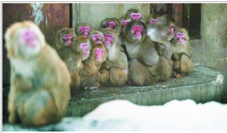
Japanese monkeys snuggle to keep warm under the eaves as snow falls at Sapporo Maruyama Zoo in Sapporo, Hokkaido, on 10 Jan, 2014.