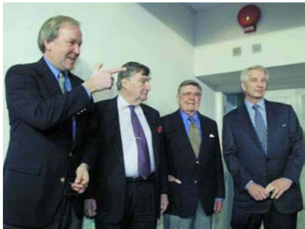
Former White House Press Secretary (far right) before the start of a ceremony in the White House Briefing Room, on 11 Feb, 2000.

WASHINGTON, 11 Jan — Larry Speakes, who took over as press secretary for President Ronald Reagan in 1981 after his predecessor was wounded in an assassination attempt against the president, died on Friday in Mississippi, a funeral home owner said.