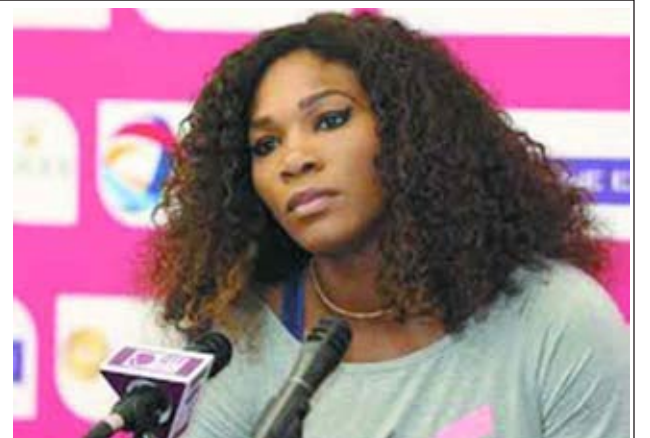
Serena Williams of the US

the draw, second seed Azarenka and Williams would meet in the final if they advance that far.