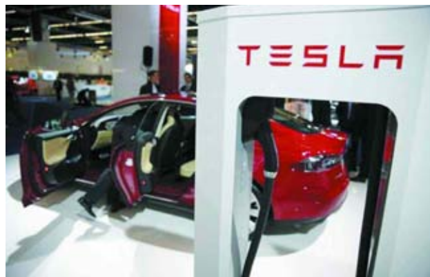
A Tesla model S car with an electric vehicle charging station is displayed during a media preview day at the Frankfurt Motor Show (IAA) on 10 Sept, 2013. The world's biggest auto show is open to the public on 14 -22 September . — REUTERS

A December tweak to its charging software tackles the issue through reducing charging by 25 percent if the charging system detects fluctuations in power entering the vehicle, Tesla said.—Reuters