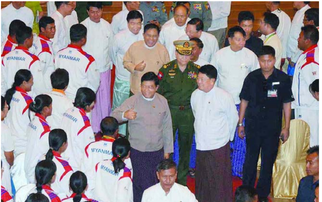
Vice-President U Nyan Tun greets victorious Myanmar athletes.—MNA

The ceremony was also attended by the Yangon Region Chief Minister, deputy ministers and top government officials.—MNA