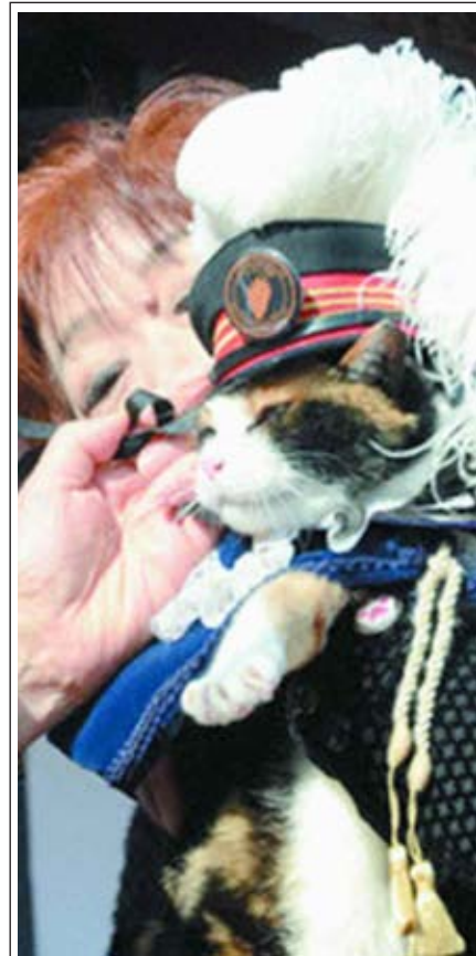
Tama, a cat "station master" at Wakayama Electric Railway Co's Kishi Station, is presented with a new station master's cap during a ceremony at the station in Kinokawa, Wakayama Prefecture, on 5 Jan, 2014, to mark seven years since the feline "took office," as her promotion to become "ultra" station master to head 14 stations on the railway's Kishigawa Line was announced.