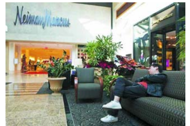
A man sleeps on a couch outside of a Neiman Marcus store at South Park mall in Charlotte, North Carolina on 25 Nov, 2011.

said an investigation found a cyber attack compromised the information of at least 70 million customers, in the second-biggest retail cyber attack on record.