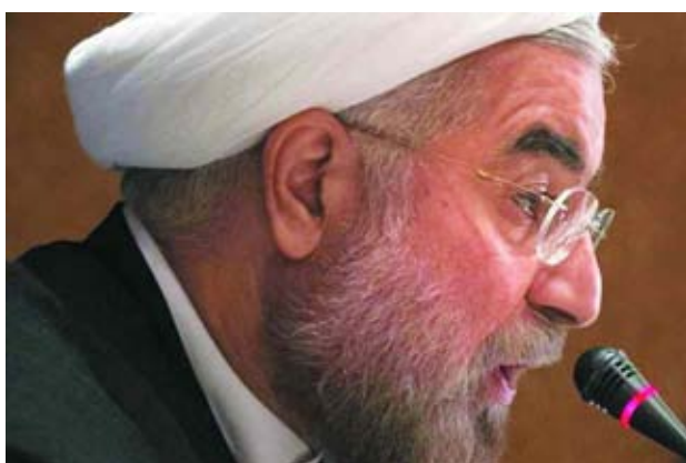
Iran's President Hassan Rouhani speaks to journalists during a news conference in New York on 27 Sept, 2013.

The European Union liaises with Iran on behalf of six world powers — the United States, Russia, China, France, Britain and Germany — in diplomatic