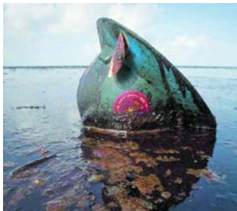
A hard hat from an oil worker lies in oil from the Deepwater Horizon oil spill on East Grand Terre Island, Louisiana on 8 June, 2010. REUTERS

The case stems from the 2010 explosion of the Deepwater Horizon drilling rig and rupture of BP's Macondo oil well, which killed 11 people and triggered the largest-ever US offshore oil spill. The torrent fouled shorelines from Texas to Alabama. Plaintiffs ranged from hotel owners to oyster gatherers. Billions of dollars have already been paid out to claimants.—Reuters