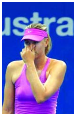
Maria Sharapova of Russia

She made an impressive return to the WTA Tour last week by reaching the semi-finals in Brisbane before losing to world number