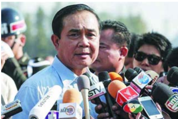
General Prayuth Chan-ocha (C), chief of the Royal Thai Army, answers questions from the media while attending national Children's Day at The Army base in central of Bangkok on 11 Jan, 2014.

BANGKOK, 11 Jan — Seven people were wounded, one seriously, after gunmen opened fire on anti-government protesters in Bangkok early on Saturday, heightening fears of more violence when protesters try to "shutdown" the capital next week in their