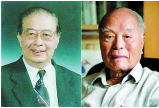
Two Chinese scientists, physical chemist Zhang Cunhao(left) and nuclear weapon expert Cheng Kaijia(right), won China's top science award on Friday for their outstanding contribution to scientific and technological innovation.