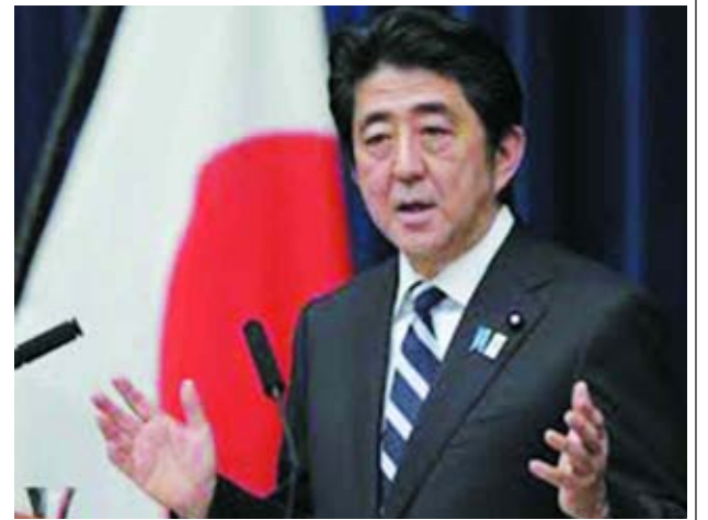
Japanese Prime Minister Shinzo Abe

Following the talks with Ouattara, Abe held a meeting with 11 leaders from the Economic Community of West African States. The African leaders called for Japan's assistance for natural resource development projects, the officials said. Abe responded that Japan will promote