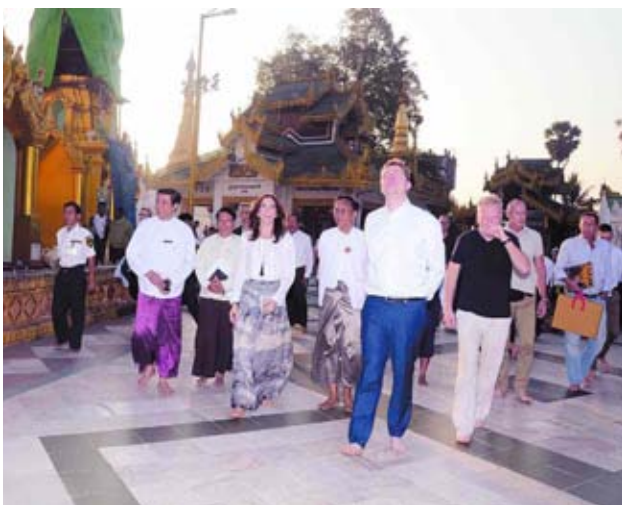
Princess Her Royal Highness Ms. Mary Donalson, Spouse of the Crown Prince of Denmark, and Minister of Development Cooperation of Denmark Mr. Rasmus Helveg Petersen visit Shwedagon Pagoda.

Urgent conservation efforts are needed to tackle overexploitation and improve the management of fishing.