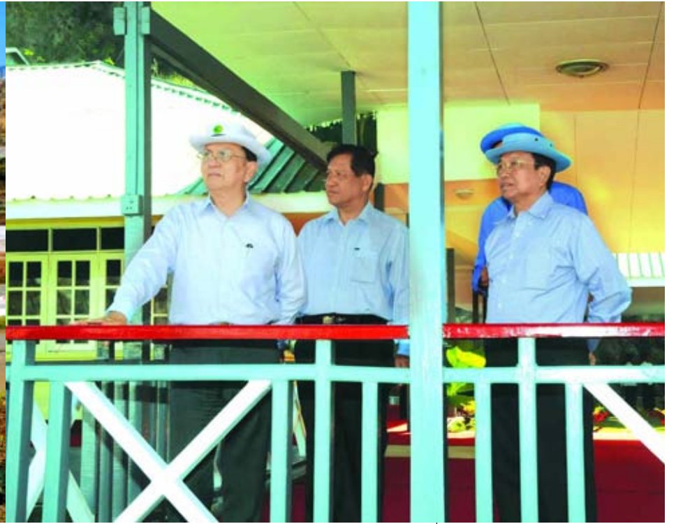
President U Thein Sein views structures at Yeywa Hydropower Plant near Yeyaman Village of Kyaukse Township.

NAY PYI TAW, 11 Jan—President U Thein Sein inspected No.18 Heavy Industry (Inn gon) in Kyaukse Township, Mandalay Region this morning.