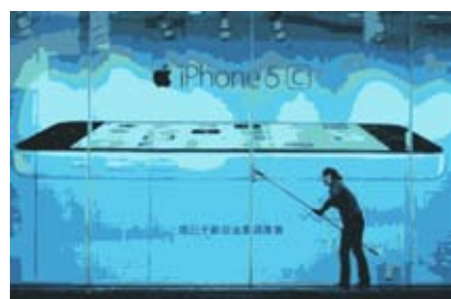
A worker cleans glass in front of an iPhone 5C advertisement at an apple store in Kunming, Yunnan Province, in this 27 Oct, 2013 file picture.