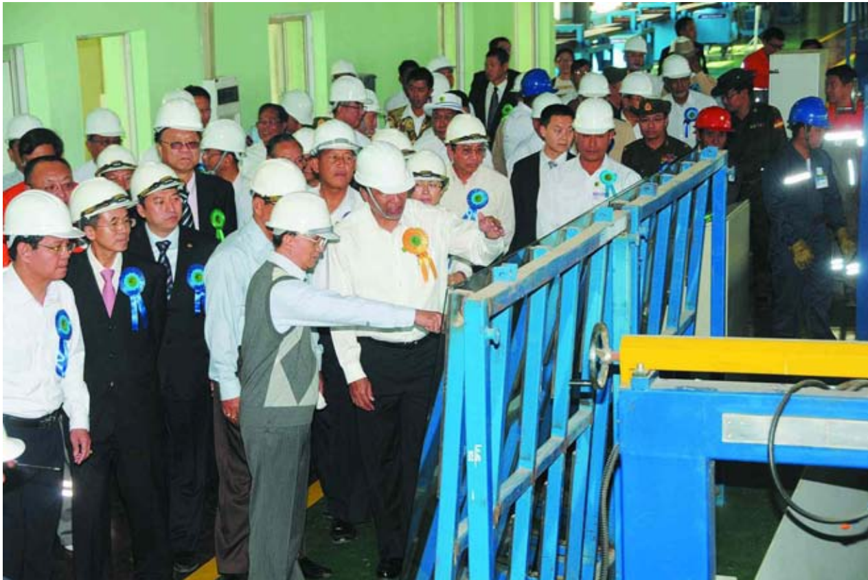
President U Thein Sein observes production line at No.36 Heavy Industry (Kyaukse) in Kyaukse Township in Mandalay Region.

NAY PYI TAW, 11 Jan—The opening of No.36 Heavy Industry (Kyaukse) of No.3 Heavy Industries