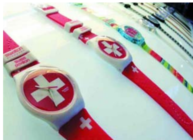
Swatch watches are displayed in front of a shop at the central station in Zurich on 4 Feb, 2013.

ZURICH, 11 Jan — The emergence of smartwatches, gadgets allowing the wearer to check text messages or capture video, is an opportunity rather than a threat for traditional watchmakers, the head of Swatch Group (UHR.VX) told Reuters on Friday.