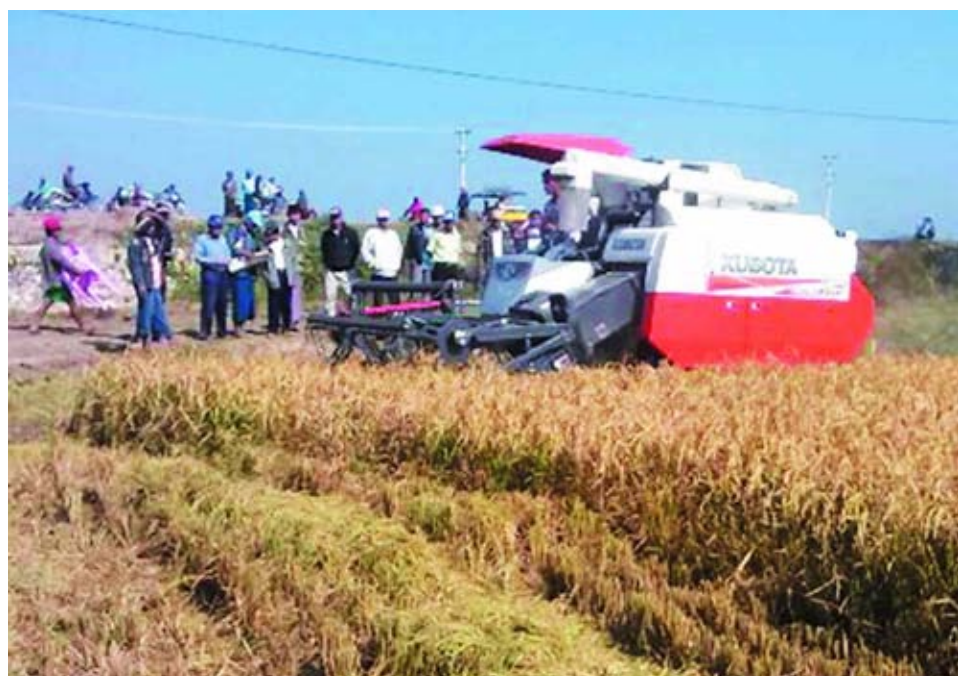
Combine harvester being used at paddy plantation in Singu Township of PyinOoLwin District.

INDAW, 11 Jan—Workers of Myanma Railways carried out maintenance of the railroad section between Indaw and Hseywa stations in Indaw Township of Sagaing Region.