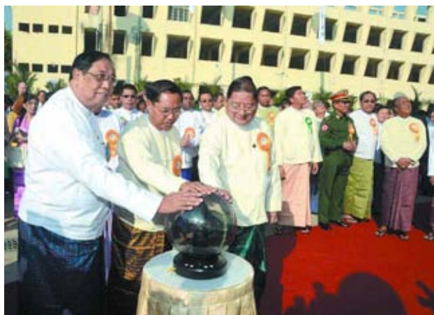
Yangon Region Chief Minister U Myint Swe and party open Construction and Housing Development Bank.