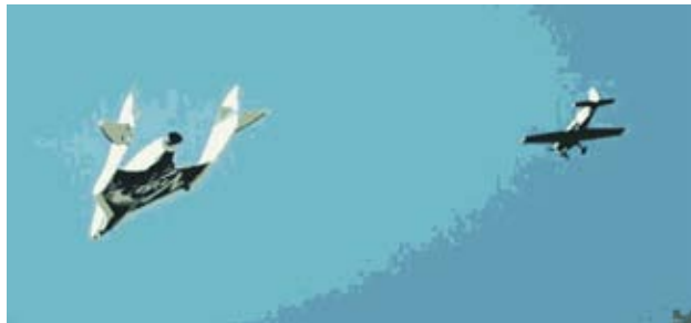
Virgin Galactic's SpaceShipTwo flies over the Mojave Desert in California in this file photo taken on 29 April, 2013 shortly before successfully completing a test flight that broke the sound barrier.

NEW YORK, 11 Jan — Virgin Galactic's SpaceShipTwo, a six-passenger, two-pilot spacecraft aiming to make the world's first commercial suborbital spaceflights later this year, conducted its third rocket-powered test flight on Friday.