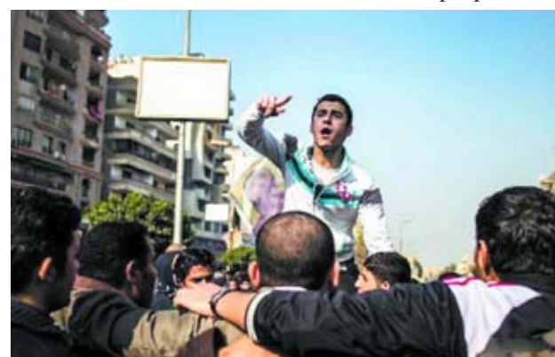
Anti-military protesters shout slogans during a march in Nasr City, Cairo, on 10 Jan, 2014.

Ever since, Morsi's supporters have been holding recurrent protests against the ongoing leadership, calling for Morsi's reinstatement. Friday's protests came after the Egyptian interim government declared the Brotherhood as "a terrorist group" on 25 Dec, 2013.—Xinhua