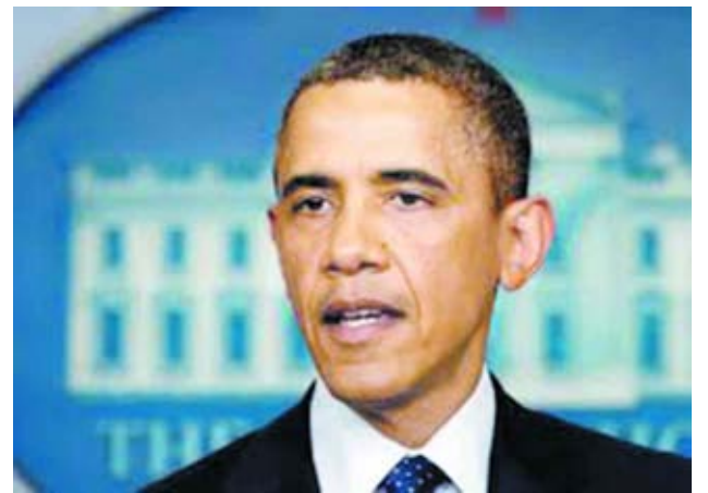
US President Barack Obama

However, it is not clear whether those sweeping recommendations will be