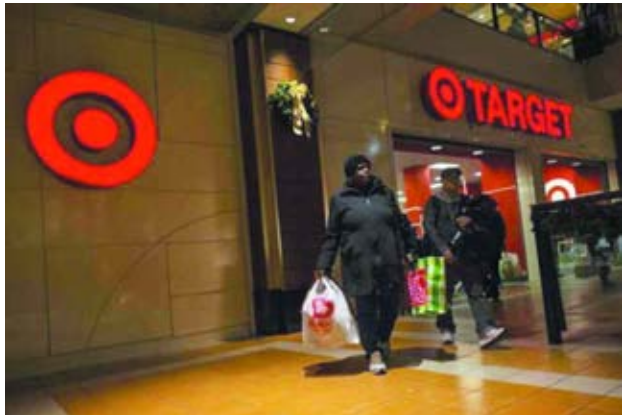
People shop at a Target store during Black Friday sales in the Brooklyn borough of New York, on 29 Nov, 2013.

"A breach of this magnitude is extremely disconcerting and we are participating in a multi-state investigation to discover the circumstances that led to this breach," said Massachusetts Attorney General Martha Coakley. Security experts said the stolen payment card data could be used to fabricate false magnetic strip credit cards. And the personal information could be sold on underground exchanges for use in email "phishing" campaigns, aimed at persuading victims to hand over even more sensitive information, such as bank account numbers.—Reuters