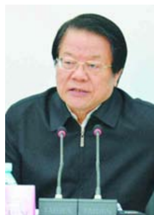
China's Culture Minister Cai Wu holds a Press conference in Beijing on 10 Jan, 2014.

Cai, however, stressed that Abe's government is entirely responsible for the dismal state of Sino-Japanese relations and needs to correct its mistakes before mutual trust can be restored. "We should create an enabling environment for full cultural exchanges,"