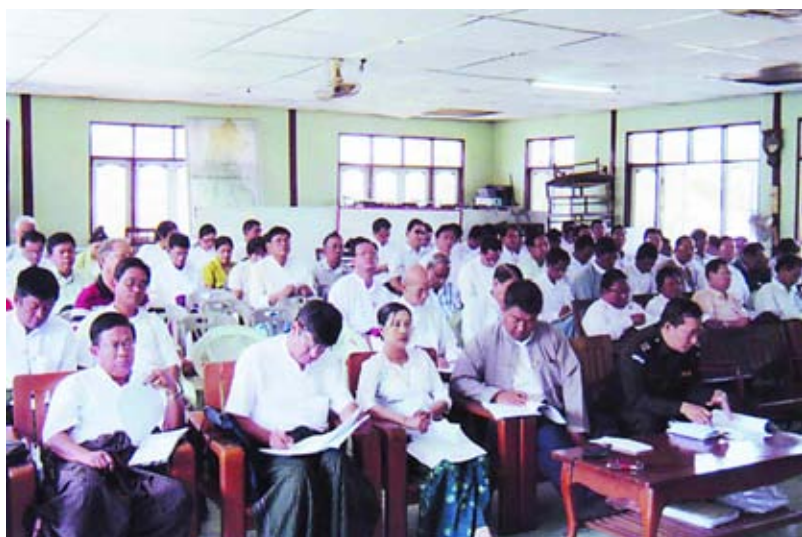
Departmental officials attend discussions on census taking process.

YANGON, 11 Jan—A coordination meeting on census taking process and matters of houses was held at the hall of Tamway Township General Administration