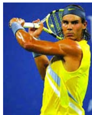
Rafael Nadal of Spain