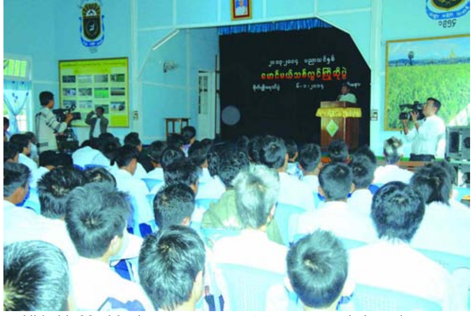
established in Mandalay in 1964. An expansion program moved the institute from

Mandalay to Yezin in 1973 with the aim of training more students and providing more