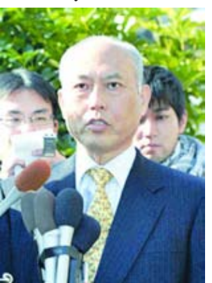
Former Japanese health minister Yoichi Masuzoe answers reporters' questions in Tokyo on 8 Jan, 2014. He said he is considering running in the Tokyo gubernatorial election the following month as an independent candidate.

Prime Minister Nouri al-Maliki earlier urged Fallujah residents to expel the militants to avoid an all-out battle in the besieged city. The militants — who are also involved in the fighting in neighbouring Syria — have held the two cities since last Wednesday.—Xinhua