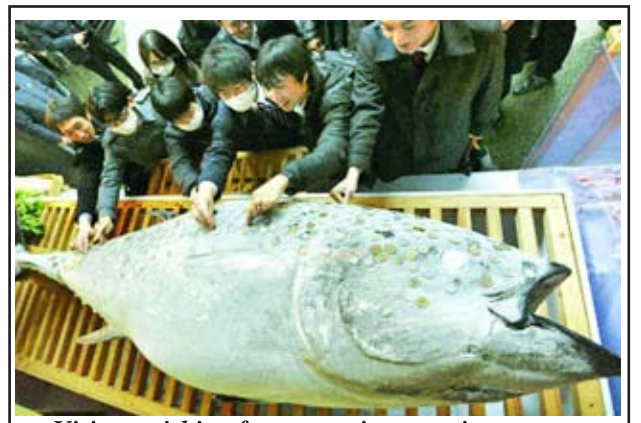
Visitors wishing for prosperity put coins on tuna offered by a local fishery cooperative at Nishinomiya Shrine, a Shinto shrine dedicated to Ebisu, the god of commerce, in Nishinomiya, Hyogo Prefecture, western Japan, on 8 Jan, 2014.