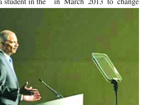
US Attorney General Eric Holder speaks on stage during the annual meeting of the American Bar Association in San Francisco, California on 12 Aug, 2013.

The lawsuit contended that police in Meridian, Mississippi, routinely arrested suspended students even when they lacked probable cause to believe they had committed a crime. The district agreed in March 2013 to change