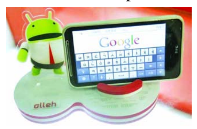
An Android smartphone displays the Google website in this picture illustration in Seoul.

LONDON, 8 Jan — The number of smartphones and tablet computers shipped with Google's Android operating system will break the 1 billion barrier this year, research group Gartner said on Tuesday.