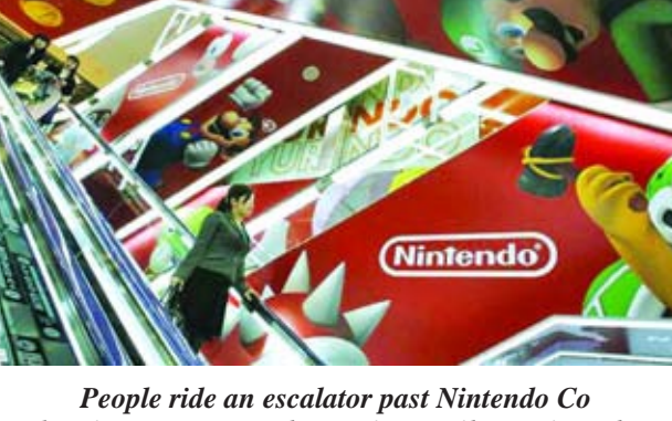
advertisements at an electronics retail store in Tokyo on 23 April, 2013.

Price may also be a problem for console makers looking to expand in China. More than 70 percent of Chinese gamers earn less than 4,000 yuan ($660) a month, according to Hong Kong-based brokerage CLSA, not much more than