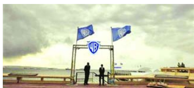
Security guards stand at the entrance of the Warner Bros beach during the annual MIPCOM television programme market in Cannes, southeastern France, in this 4 Oct, 2010 file photo.