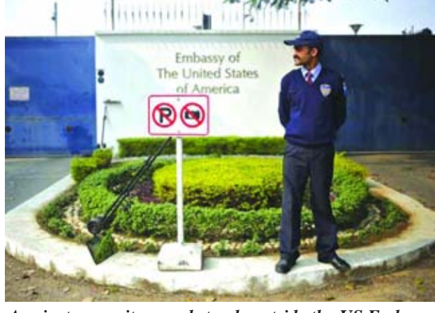
A private security guard stands outside the US Embassy in New Delhi on 18 Dec, 2013.