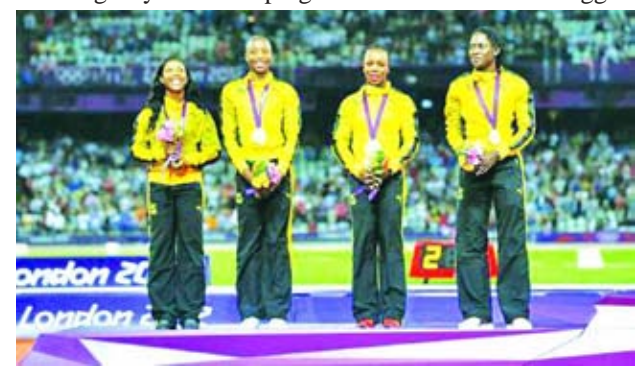
(L-R) Jamaica's Shelly-Ann Fraser-Pryce, Sherone Simpson, Veronica Campbell-Brown and Kerron Stewart pose with their silver medals in the women's 4 x 100m relay at the London 2012 Olympic Games in London at the Olympic Stadium on 10 Aug, 2012.

But a lawyer for the Jamaica Anti-Doping Commission said that there is no evidence to suggest