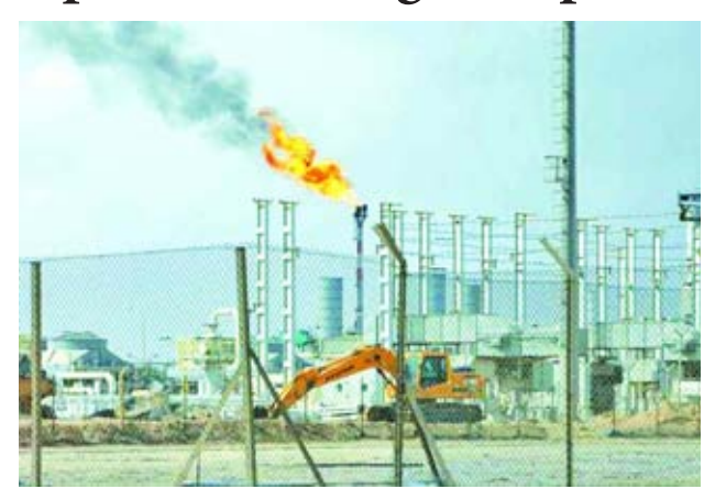
A view of the Mellitah Oil and Gas blocked by members of the Berber minority demanding more rights complex, 100 km (60 miles) west of Tripoli on 7 Nov, 2013.

Tripoli/London, 8 Jan — A heavily armed autonomy group in eastern Libya said on Tuesday it would invite foreign companies to buy oil from seized ports and protect arriving tankers, challenging Tripoli which has promised to use force to stop them.