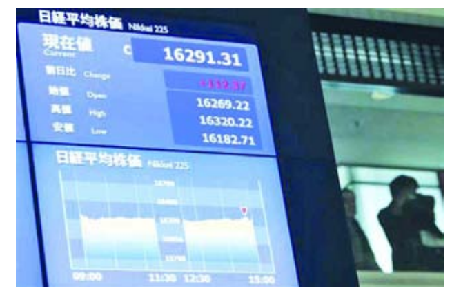
People stand near a monitor displaying Japan's Nikkei average after a ceremony marking the end of trading in 2013 at the Tokyo Stock Exchange (TSE) in Tokyo on 30 Dec, 2013.

Underlining the bright-Japan's Nikkei led the er mood were reports that the International Monetary Fund will raise its forecast for global growth in about three weeks, breaking a depressingly-long run of