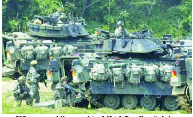
US Army soldiers and its M2A2 Bradley fighting vehicles take part in the US-South Korea joint military exercise against possible attacks by North Korea, at a shooting range near the demilitarized zone separating the two Koreas in Paju, about 45 km (28 miles) north of Seoul, on 8 June, 2011.

Washington, 8 Jan — The United States said on Tuesday it will send 800 more soldiers and about 40 Abrams main battle tanks and other armoured vehicles to South Korea next month as part of a military rebalance to East Asia after more than a decade of war in Afghanistan and Iraq. The battalion of troops and M1A2 tanks and about 40 Bradley fighting vehicles from the 1st US Cavalry Division based at Fort Hood, Texas. will begin a nine-month deployment in South Korea on 1 February. A Pentagon spokesman said the personnel would remain for nine months but on departing would leave their equipment behind to be used by follow-