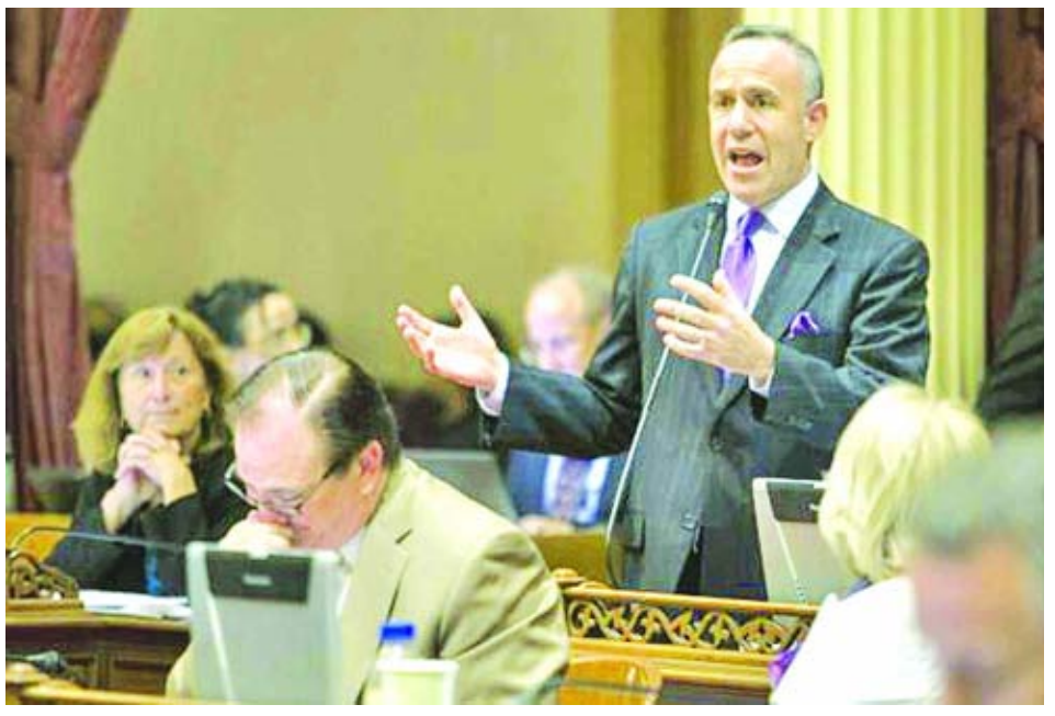
California Senate president pro tempore Darrell Steinberg (D-Sacramento) argues in favour of his bill SB743, which modifies the California Environmental Quality Act, at the State Capitol in Sacramento, California, on 12 Sept, 2013.

SACRAMENTO, 8 Jan — A top California lawmaker unveiled a $1 billion proposal on Tuesday to fund free public preschool for all children in the most populous US state, the latest challenge by Democratic leaders to fiscal restraints imposed by Governor Jerry Brown.