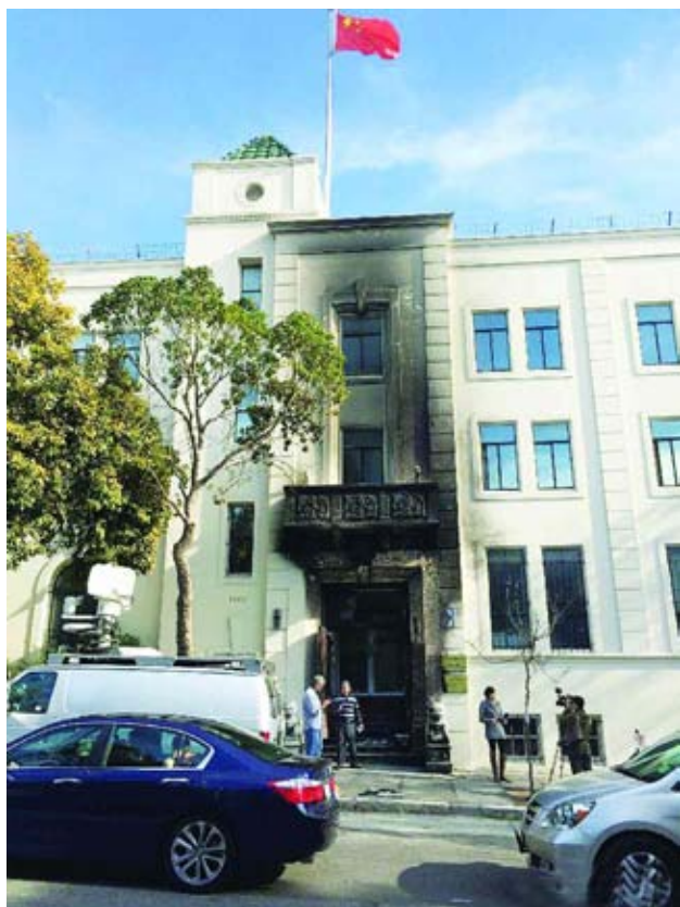
Reporters stand by the front gate of the Chinese Consulate-General in San Francisco, the United States, on 2 Jan, 2014. The United States is "deeply concerned" by reports that the Chinese Consulate-General in San Francisco was damaged in an arson attack, the State Department said on Thursday.