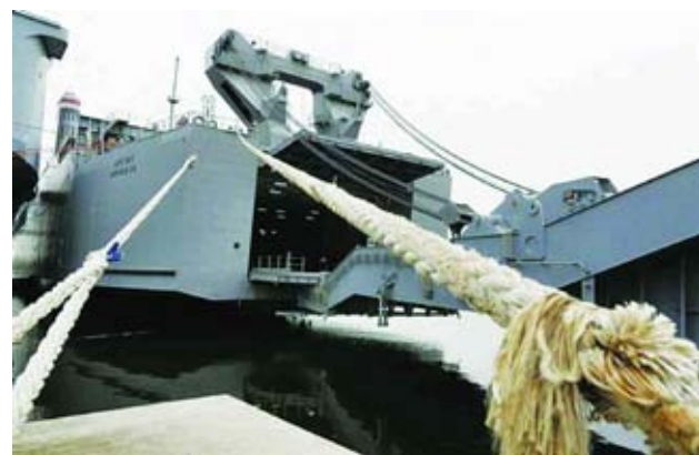
The MV Cape Ray is seen before its deployment from the NASSCO-Earl Shipyard in Portsmouth, Virginia, on 2 Jan, 2014.

Damascus agreed to eliminate its chemical weapons last year in the face of threatened US military action following a Syrian chemical attack against