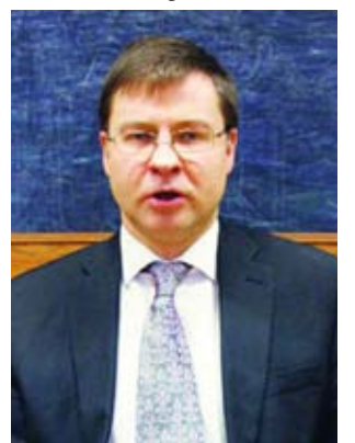
Latvian Prime Minister Valdis Dombrovskis speaks during an interview in Riga on 1 Jan, 2014, the day his country adopted the euro as its currency.

The three Baltic countries won independence on the breakup of the Soviet Union in 1991 and acceded to the North Atlantic Treaty Organization and the European Union in 2004.