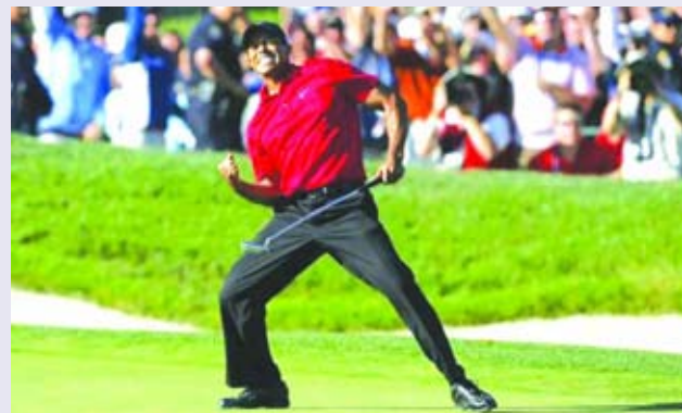
US golfer Tiger Woods celebrates after making a birdie on the 18th hole during the final round of the US Open golf championship at Torrey Pines in San Diego on 15 June, 2008.

“If he were to win at Augusta, I’d almost bet you