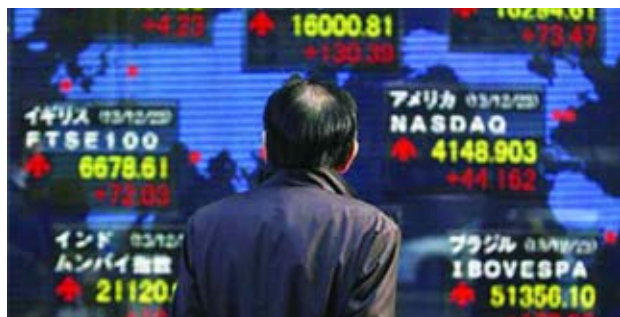
A pedestrian looks at an electronic board displaying various countries' stock market indices outside a brokerage in Tokyo on 24 Dec, 2013.—REUTERS

"Looking ahead, the hope for the euro zone is that recent improved confidence will encourage businesses to lift their employment and investment plans as 2014 progresses, and will also encourage consumers to spend more," said Howard Archer, the chief European and UK economist at IHS Global Insight.—Reuters