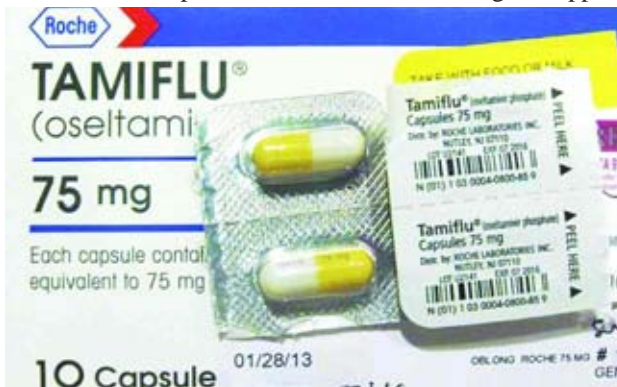
Four capsules of Tamiflu are pictured on a Tamiflu box in Burbank, California, on 31 Jan, 2013.