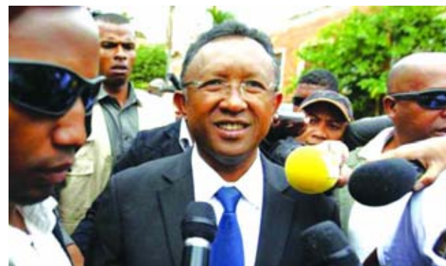
Madagascar's presidential candidate Hery Rajaonarimampianina arrives to cast his ballot at a polling centre in Tsimbazaza area of Madagascar's capital Antananarivo on 20 Dec, 2013.

A disputed result could prolong the malaise on the