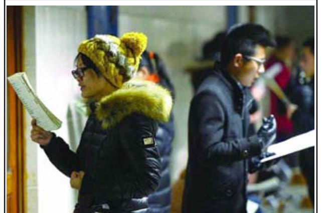
Students are busy studying in the Anhui Agriculture University on 31 Dec, 2013, in preparation for the postgraduate exam from 4 to 6 Jan, 2014.