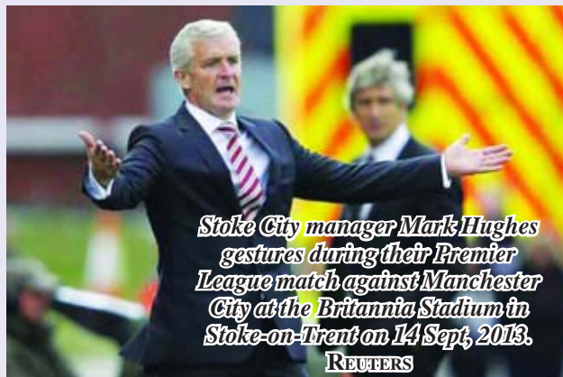
Stoke City manager Mark Hughes gestures during their Premier League match against Manchester City at the Britannia Stadium in Stoke-on-Trent on 14 Sept, 2013.

he’d win another major this year. He’d win two majors. But if he doesn’t win at Augusta, I think the odds of him winning another one are not that great.