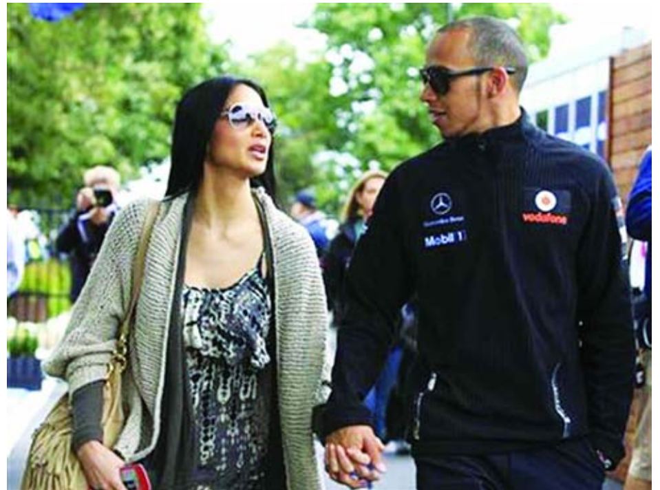
Lewis Hamilton and Nicole Scherzinger

Tender Selection Committee Ministry of Construction, Public Works Road Department office No-(11), Nay Pyi Taw Tel: 067-407578, 407603, 407583, 407380