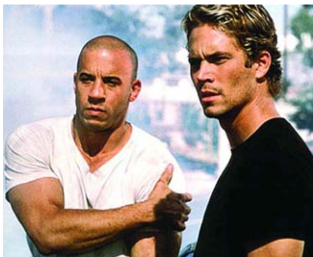
Vin Diesel and Paul Walker

LOS ANGELES, 3 Jan — Hollywood producers nominated slavery drama "12 Years a Slave," 1970s con-men caper "American Hustle" and space thriller "Gravity" along with seven other films on Thursday for the top Producers Guild Award, a key indicator of sentiment in the race for the best picture Oscar. The other films nominated for outstanding producer in a motion picture were Woody Allen's tragic comedy "Blue Jasmine," Somali pirate thriller "Captain Phillips," AIDS activist drama