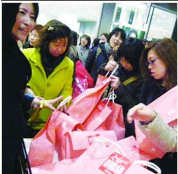
Customers buy "lucky bags" at the flagship outlet of Kintetsu Department Store Co in Osaka's Abeno Ward on 2 Jan, 2014. Major Japanese department stores kicked off business for 2014 that day.

Khaleda Zia's opposition alliance had earlier enforced blockade for a total of 22 days in phases since Nov. 26 after the Election Commission announced schedule for the 10th parliamentary polls.