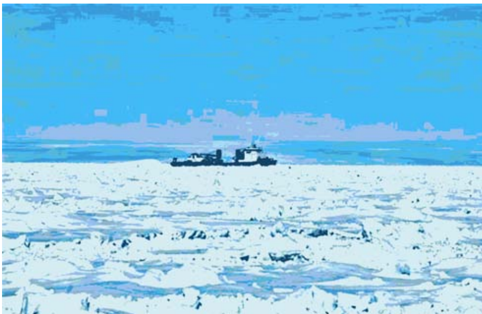
The Xue Long (Snow Dragon) Chinese icebreaker, as seen from Australia's Antarctic supply ship, the Aurora Australis, sits in an ice pack unable to get through to the MV Akademik Shokalskiy, in East Antarctica, some 100 nautical miles (185 km) east of French Antarctic station Dumont D'Urville and about 1,500 nautical miles (2,800 km) south of Hobart, Tasmania, on 2 Jan, 2014, in this handout courtesy of Fairfax's Australian Antarctic Division.—REUTERS

SYDNEY, 3 Jan — A Chinese icebreaker that helped rescue 52 passengers from a Russian ship stranded in Antarctic ice found itself stuck in heavy ice on Friday, further com-