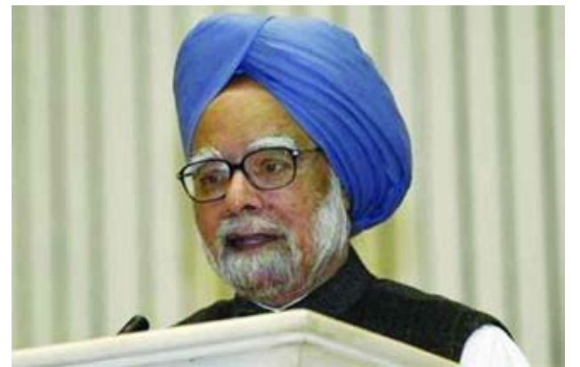
Indian Prime Minister Manmohan Singh

The BJP prime ministerial candidate Narendra Modi is campaigning strong-