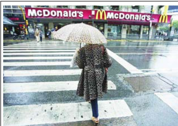
A resident walks in the rain in Buenos Aires, capital of Argentina, on 2 Jan, 2014. Storms landed in part of Argentina and have lowered the temperature here about 20 degrees Celsius. National Weather Service (SMN, for its acronym in Spanish) issued an alert for possible severe thunderstorms in Buenos Aires and five provinces of Argentina.

The Turkish energy minister paid a visit to Baghdad in December to brief the officials on the deals. In response to Baghdad's concerns, Turkey has proposed a formula to both parties under which oil and gas money will be tied up at a Turkish state bank in line with the agreed share of 83 percent to the Iraqi central government and 17 percent to the Kurds.—Xinhua