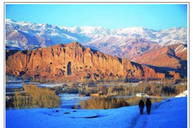
Afghan men walk on the snow in Bamiyan Province of central Afghanistan, on 1 Jan, 2014.

UN Secretary-General serves for five-year term that can be renewed indefinitely, although none so far has held office for more than two terms.