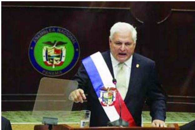
Panama President Ricardo Martinelli gestures as he delivers his last State of the Nation speech during the national congress opening session in Panama City on 2 Jan, 2014.

PANAMA CITY/MADRID, 3 Jan — The president of Panama said on Thursday he would go to Spain and Italy to pressure companies to honour contracts to expand his country's canal