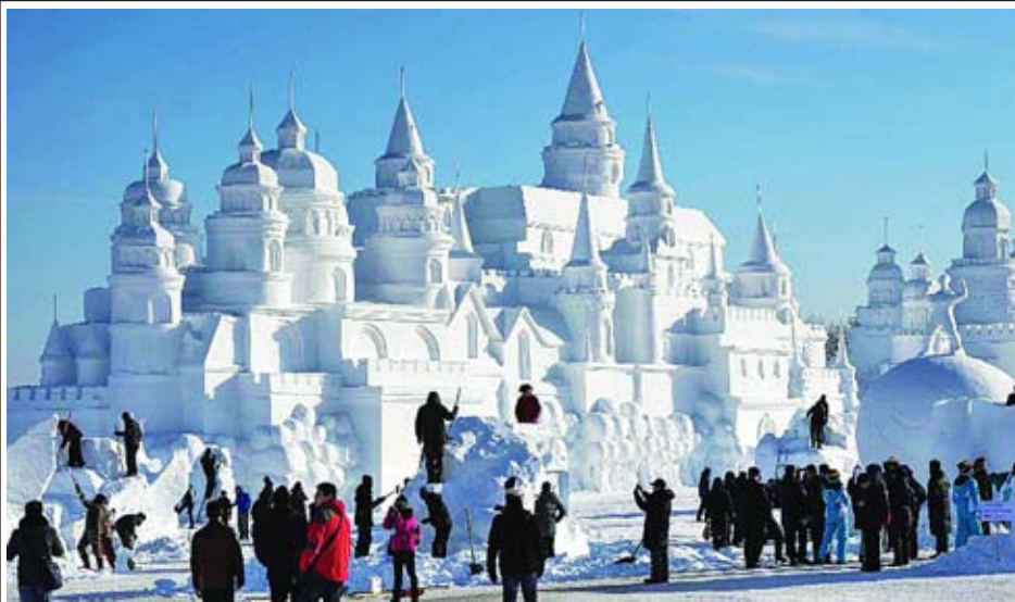
Visitors view a snow sculpture at Jingyuetan National Forest Park in Changchun, capital of northeast China's Jilin Province, on 2 Jan, 2014. The "Jingyue Snow World", with numbers of snow sculptures, opened to tourists on Thursday.