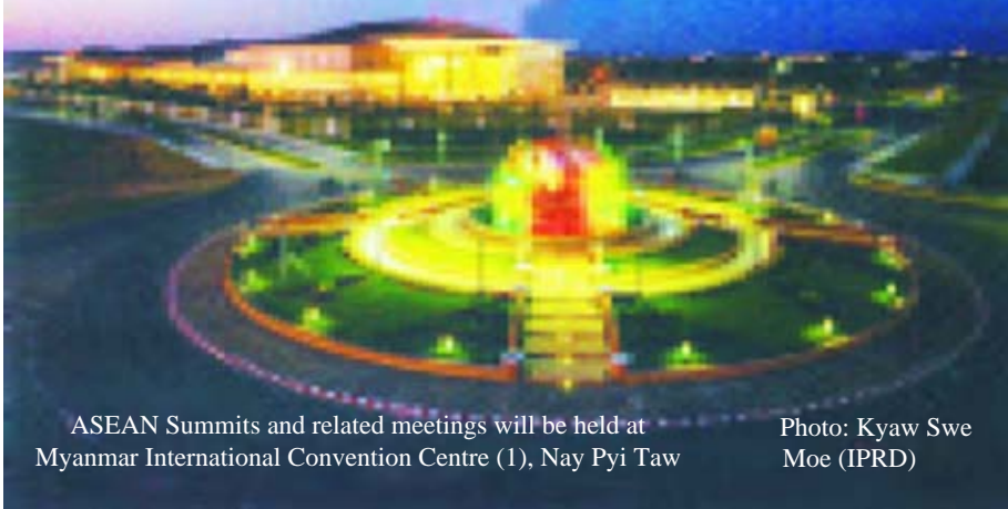
ASEAN Summits and related meetings will be held at Myanmar International Convention Centre (1), Nay Pyi Taw