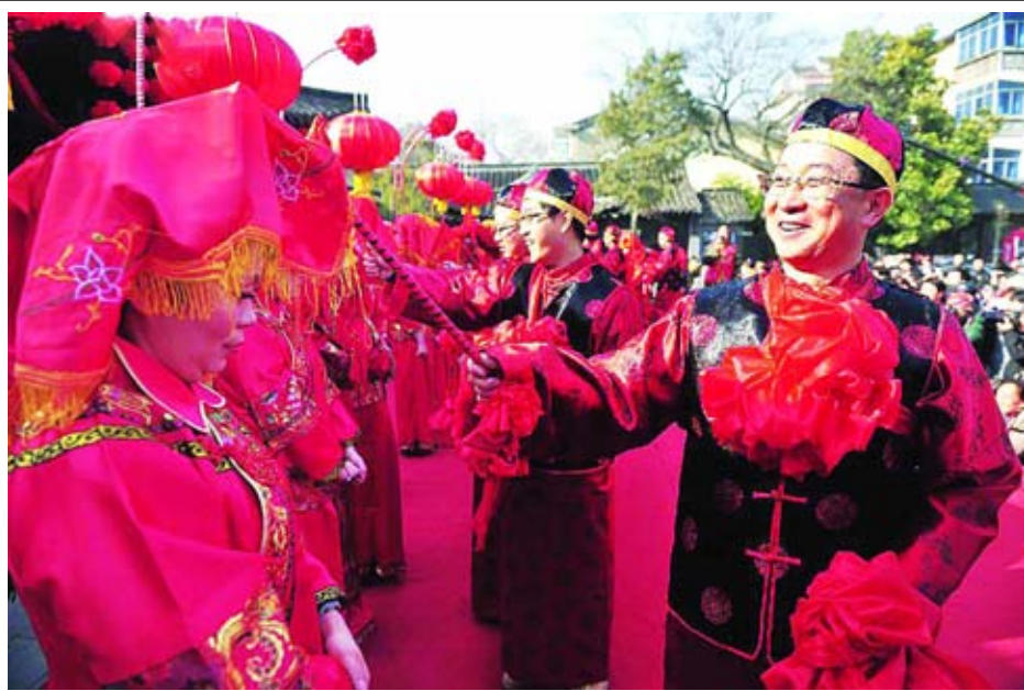
Newly-married couples attend a group wedding ceremony in Yangzhou, east China's Jiangsu Province, on 1 Jan, 2014. Altogether 13 newly-wed couples took part in a group wedding of traditional style at Geyuan Garden in Yangzhou on the first day of 2014.