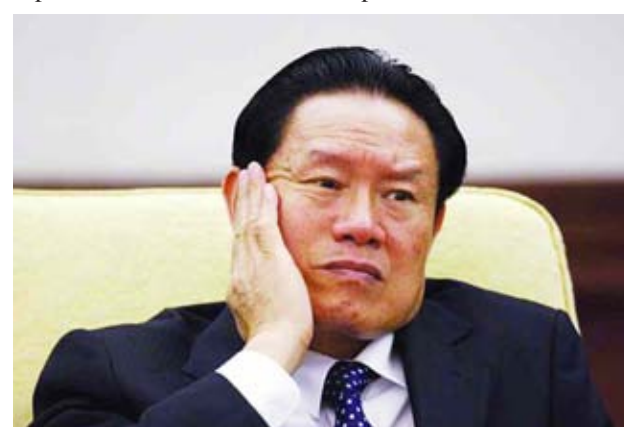
China's Public Security Minister Zhou Yongkang reacts as he attends the Hebei delegation discussion sessions at the 17th National Congress of the Communist Party of China at the Great Hall of the People, in Beijing on 16 Oct, 2007.

All public security personnel must "take real actions to resolutely defend the leadership of the Communist Party", Guo said. "Unswervingly be a loyal defender of the party and the people." Guo made no direct mention of Li's case