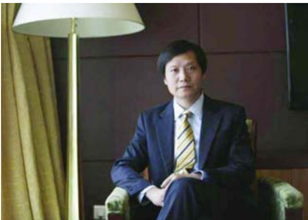
Lei Jun, founder and CEO of China's mobile company Xiaomi, poses for a photo ahead of an interview during the Fortune Global Forum (FGF) in Chengdu, Sichuan province, on 6 June, 2013.

BEIJING, 3 Jan — Chinese budget smartphone maker Xiaomi plans to sell 40 million handsets in 2014, more than double the number it sold in 2013, its chairman said on Thursday, reinforcing the company's ambitions to outsell more expensive offerings from Apple Inc and Samsung Electronics Co Ltd.