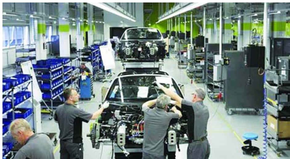
Electricians assemble a new Porsche 918-Spyder sports car at the production line of the German car manufacturer's plant in Stuttgart-Zuffenhausen on 2 July, 2013.

US stock markets have been on a tear, even as the