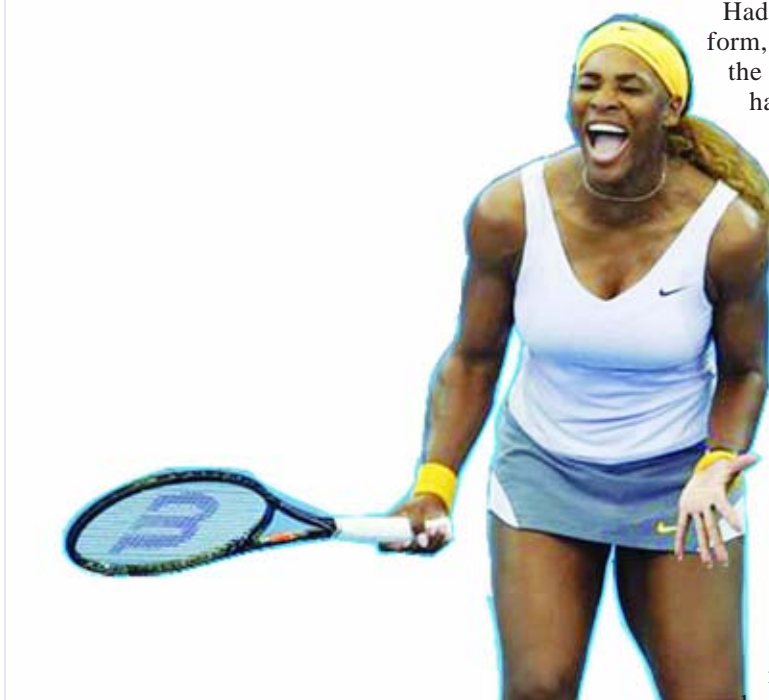
match against Dominika Cibulkova of Slovakia at the Brisbane International tennis tournament in Brisbane on 2 Jan, 2014.