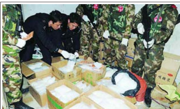
A massive drugs operation ends in the seizure of three tonnes of crystal meth, or "ice," and 182 arrests, in Boshe Village in the city of Lufeng, south China's Guangdong Province, local police announced on Thursday. It involved more than 3,000 personnel in 109 separate raids with the help of helicopters and border speedboats.

According to CyBC sources, the message was broadcast by mistake because a radio presenter clicked on the wrong heading of an item. They said that the old message, which should have been removed a long time ago, was erroneously left on the broadcast computer. Christofias did not contest re-election and was succeeded by Anastasiades who won the election in February 2013.— Xinhua