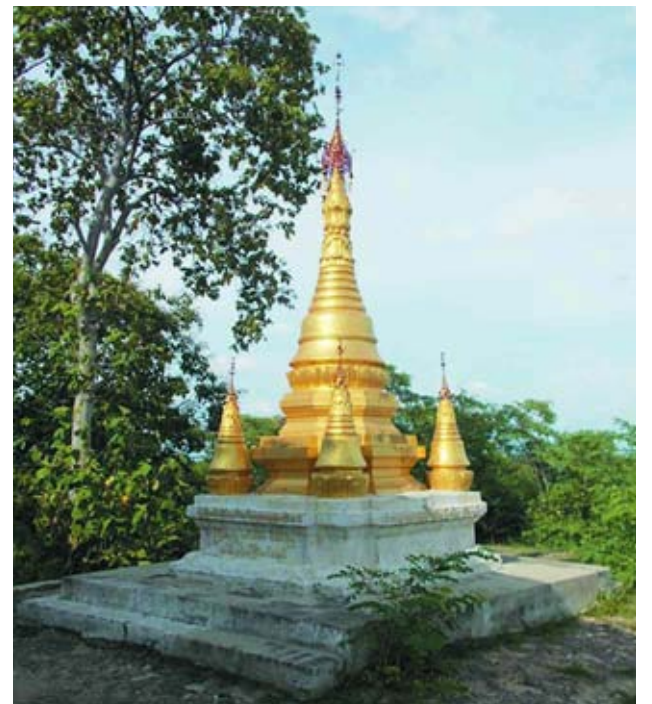
places of interest in the area include the Mingun Stupa, Mingun Bell, Lion Statues, Myatheindan Pagoda, Setyawya Pagoda, Momeik Hill and Dhammanada Monastery.

The pagoda which turns 66 today has in recent years attracted more and more visitors and pilgrims as the Mingun region is famous for its ancient cultural sites. Other