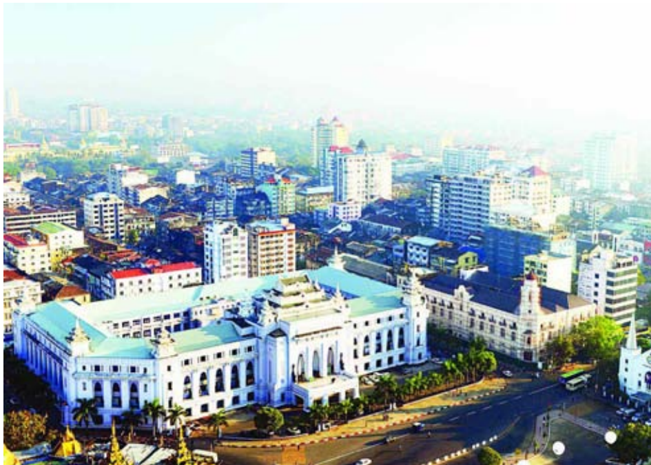
A photo shows a bird's eye view of Yangon area.