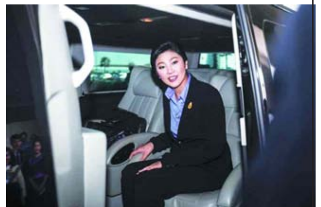
Thailand's Prime Minister Yingluck Shinawatra leaves the Government Complex after a meeting with the Election Commission in Bangkok on 20 December, 2013.