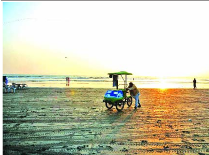
Photo taken on 29 Dec, 2013, shows an ice-cream vendor pushing his cart on Clifton beach in southern Pakistani port city of Karachi.

However, WIFO expects private consumption to increase by about one percent in 2014 due to improved income developments and an easing of inflation, added that improvements in the economy are not expected to be enough to brighten the unemployment outlook.—Xinhua