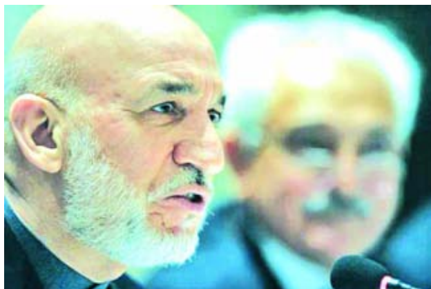
Afghanistan's President Hamid Karzai addresses media representatives during a press interaction in New Delhi on 14 Dec, 2013. Karzai is on a four-day visit to India.