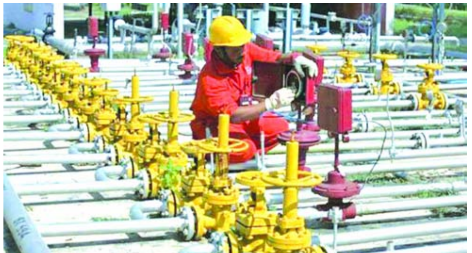
An engineer of Oil and Natural Gas Corp (ONGC) works inside the Kalol oil field in Gujarat on 12 Sept, 2009.

Petrobras' need for cash has risen as production from older oil fields has stagnated and output from new areas comes on line behind schedule, forcing the company to boost debt to finance investment. The government has also forced the company to sell gasoline and diesel fuel at home at prices below those on the world market, causing its refining and supply