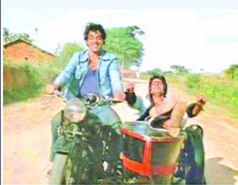
It took three years to restore and convert Sholay into 3D.

As far as the budget is concerned, it is close to Rs 20 crores to Rs 22 crores, which also includes the marketing and publicity of the film besides restoration and conversion costs.” Sascha added. The original Sholay was reportedly made on a