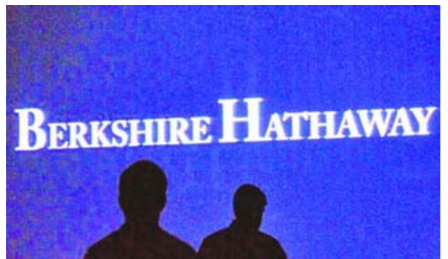
Berkshire Hathaway shareholders walk by a video screen at the company's annual meeting in Omaha on 4 May, 2013.

NEW YORK, 31 Dec — Warren Buffett's Berkshire Hathaway Inc (BRKa.N) struck a deal to buy a Phillips 66 (PSX.N) business that makes chemicals to improve the flow potential of pipelines for around $1.4 billion of stock.