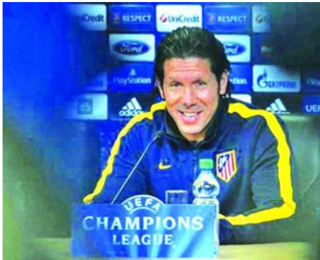
Atletico Madrid coach Diego Simeone attends a news conference before a training session at Petrovsky stadium in St Petersburg on 25 Nov, 2013.

“It would be stupid not to think about it, above all looking at the standings,”