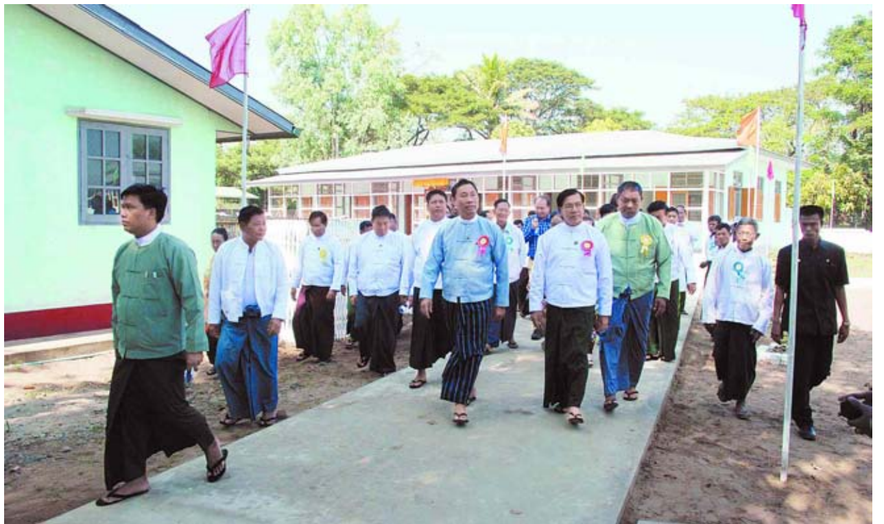
Speaker of Pyidaungsu and Pyithu Hluttaw Thura U Shwe Mann visits extended patient ward of Kanutwin People's Hospital.