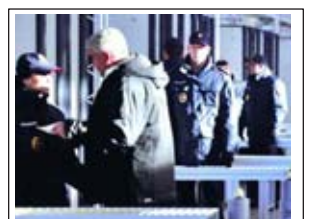
A police officer checks the luggage of a passenger at a station in Sochi, Russia, on 30 Dec, 2013. An explosion occurred on a trolleybus the same day in the southern city of Volgograd, where a suicide bombing took place the previous day.