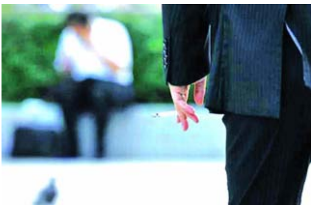
A man holds a cigarette in Tokyo on 3 Aug, 2009.

The panel, which is comprised of independent