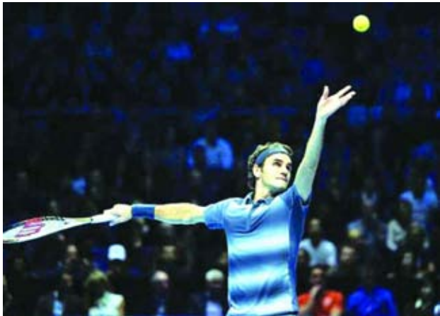
Roger Federer of Switzerland serves to Rafael Nadal of Spain during their men's singles semi-final tennis match at the ATP World Tour Finals at the O2 Arena in London on 10 Nov, 2013.

LONDON, 31 Dec — Roger Federer, who has taken on childhood hero Stefan Edberg as part of his team, thinks the recruitment of former great players as coaches will be good for tennis in the long term.