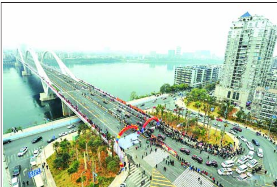
A ceremony is held to mark the opening of the newly-built Guangya Bridge in Liuzhou, south China's Guangxi Zhuang Autonomous Region, on 30 Dec, 2013. The 30-metre-width bridge runs 1,410 metres and officially opened on Monday. It is the 19th bridge spanning over the Liujiang River in the city.