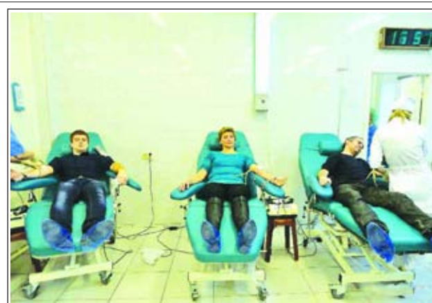
People donate blood for the injured at a hospital in Volgograd, Russia, on 30 Dec, 2013. At least 10 people were killed and 10 others injured early on Monday when an explosion hit a trolley bus in Russia's Volgograd, the second fatal blast within two days.

SHIPPING AGENCY DEPARTMENT MYANMA PORT AUTHORITY AGENT FOR: M/S INTERASIA LINES Phone No: 256908/378316/376797