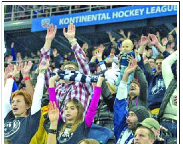
Croatian fans perform longest fan wave during the Kontinental Hockey League (KHL) ice hockey match between Medvescak Zagreb and Russian team Vityaz Podolsk at Arena Zagreb in Zagreb, capital of Croatia, on 29 Dec, 2013. More than 15,000 Medvescak Zagreb fans set a new Guinness world record in longest so called “Mexican fan wave” with 15 minutes and 3 seconds breaking current record of 6:54 seconds that stood from 1986 during the Mexico vs Brazil match in Cowboy Stadium, Texas.

The South American Games, organized by the South American Sports Organization (Odesur), will be held in Bolivia in 2018, 40 years after the nation hosted the first edition in 1978 in La Paz, Cochabamba and Santa Cruz.—Xinhua