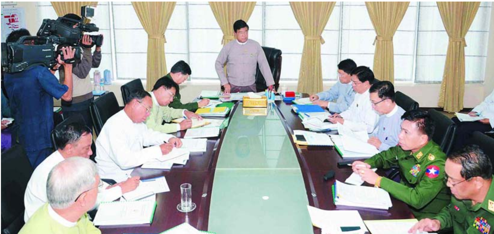
Vice-President U Nyan Tun delivers address at coordination meeting to host 7 th ASEAN Para Games at Wunna Theikdi Stadium.

NAY PYI TAW, 31 Dec—The host country for the SEA Games has to organize the ASEAN Para Games in line with the rules of the ASEAN Para Sports Federation-APSF, said Vice-President U Nyan Tun at the coordination meeting to host the 7 th ASEAN Para Games at Wunna Theikdi Stadium, here, this morning.