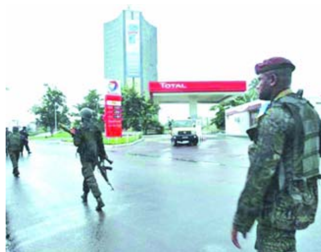
Congolese security forces secure the street near the state television headquarters in the capital Kinshasa, on 30 Dec, 2013.