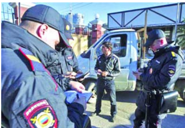
Russian police check a driver's documents in Sochi on 30 Dec, 2013.

"At the Olympics, security is the responsibility of the local authorities, and we have