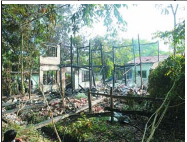
A fire broke out at No 158 on 1 st Minyekyawswa Street in Dala on 29 December. Fire fighters and local people put out the fire with two fire engines. A building was destroyed in the fire and it was valued at K 750,000.