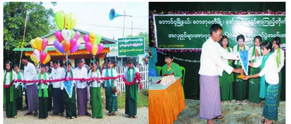
The opening ceremony of self-reliant library in progress in Kaytumat in Toungoo Township.

TOUNGGOO, 31 Dec—A Library was put into service in Kaytumat of Taungoo Township, Bago Region on 28 December. It was attended by district/township level departmental officials, media persons, NGOs, town's elders and well-wishers.