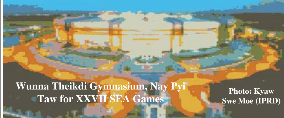
Wunna Theikdi Gymnasium, Nay Pyi Taw for XXVII SEA Games