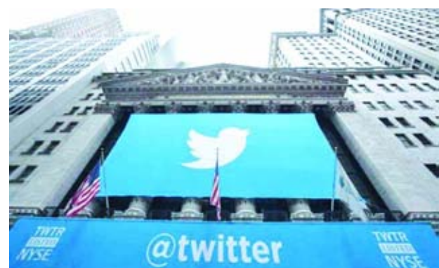
A sign displays the Twitter logo on the front of the New York Stock Exchange ahead of the company's IPO in New York, on 7 Nov, 2013.