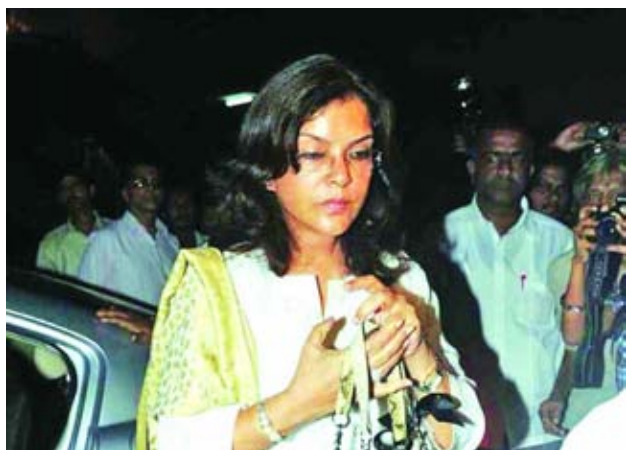
The yesteryear actress is 62-years-old.

MUMBAI, 31 Dec — Veteran actress Zeenat Aman has starred in a bilingual movie Strings of