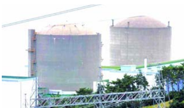
The Kori No 1 reactor (R) and No 2 reactor of state-run utility Korea Electric Power Corp (KEPCO) are seen in Ulsan, about 410 km (255 miles) southeast of Seoul, on 3 Sept, 2013.