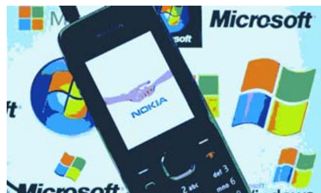
A Nokia mobile phone lies on a tablet computer showing logos of Microsoft, in this illustration picture taken in Frankfurt, on 18 Nov, 2013.—REUTERS

Markets expect more details on the new management structure at Nokia and its equipment business to be announced after the deal is closed, which is expected to happen in the first quarter of 2014.—Reuters