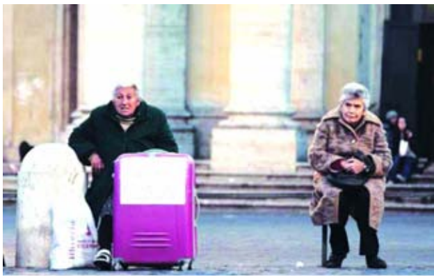
Two homeless women sit on a bench in downtown Rome on 25 Nov, 2011.