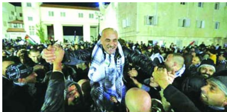
A prisoner (C) released from an Israeli prison is welcomed by relatives in the West Bank city of Ramallah early on 31 Dec, 2013.