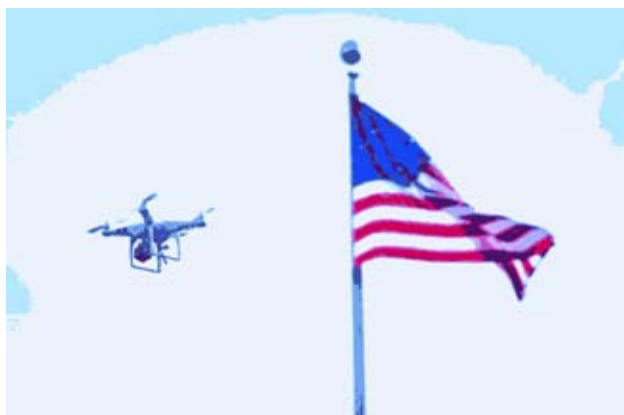
A small drone helicopter operated by a paparazzi records singer Beyonce Knowles-Carter (not seen) as she rides the Cyclone rollercoaster while filming a music video on Coney Island in New York on 29 Aug, 2013.