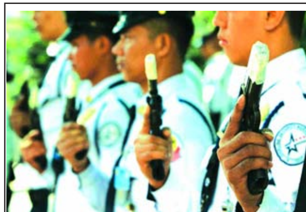
Security guards hold their firearms after being sealed by policemen in Quezon City, the Philippines, on 30 Dec, 2013, to show their campaign against indiscriminate firing of firearms during the New Year's celebration.