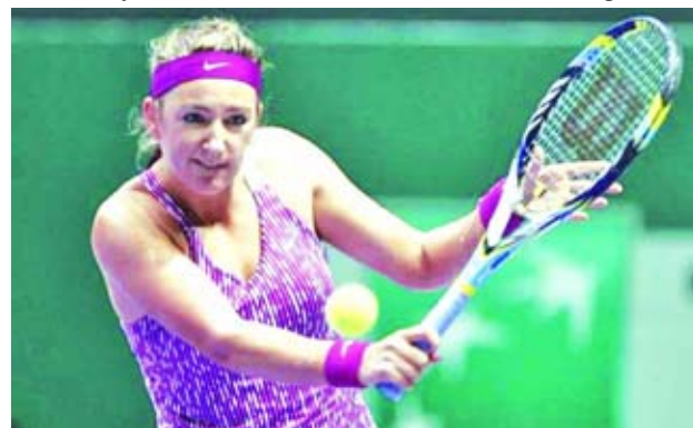
Victoria Azarenka of Belarus hits a return to Li Na of China during their WTA tennis championships match at Sinan Erdem Dome in Istanbul, on 25 Oct, 2013.

Azarenka's subsequent victory over Stephens in the semi-finals, when she took a controversial 10-minute medical time out, means she has a lot of goodwill to win back in Australia over the next month.—Reuters