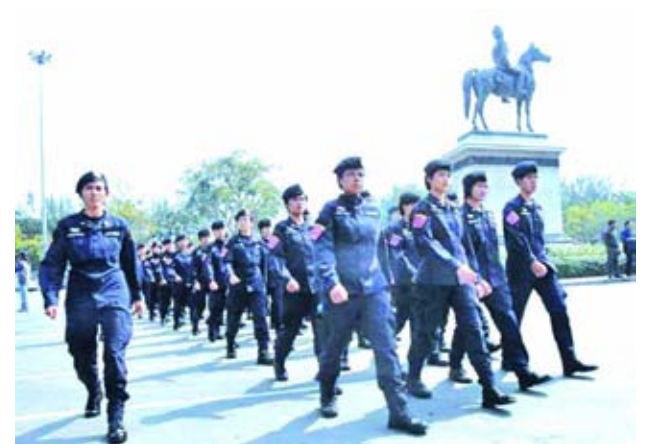
Thai police officers gather at the Royal Plaza near the Government House in Bangkok on 30 Dec, 2013.

The demonstrators are determined to topple Prime Minister Yingluck Shinawatra, who they accuse of being a puppet of her self-exiled brother and former premier, Thaksin Shinawatra.