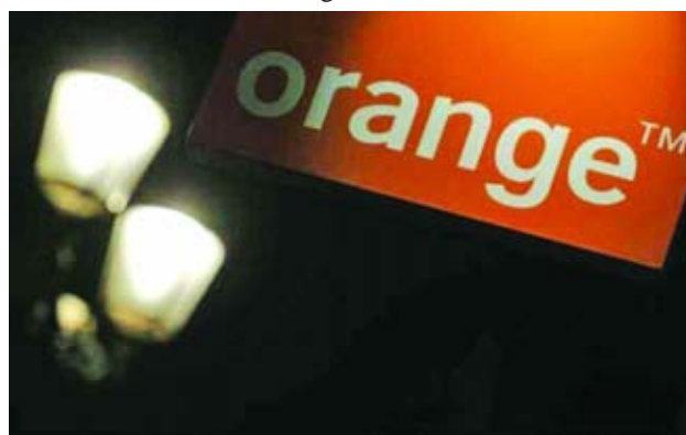
The logo of the Orange telecommunication and internet provider is seen on the facade of a store in Paris on 24 July, 2013.

Under the French legal system, a company or a person can file a complaint, not necessarily against a particular person or organisation, to trigger an investigation and kick-start a legal process.—Reuters