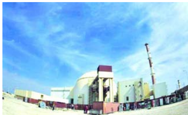
A general view of the Bushehr nuclear power plant, some 1,200 km (746 miles) south of Teheran on 26 Oct, 2010.

In the meeting, which lasted nearly 23 hours and ended at 7 am (0600 GMT), the sides again sought to agree how exactly Iran would meet its obligation to