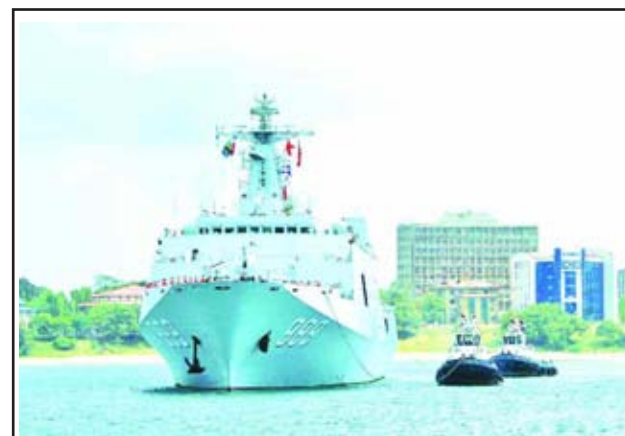
The amphibious docking vessel Jinggangshan (L) of the 15th Chinese naval escort fleet approaches the port of Dar es Salaam, Tanzania, on 29 Dec, 2013. After completing its escort mission, the 15th Chinese naval escort fleet paid a four-day visit from Sunday to Tanzania on its way back to China. —XINHUA

About 100 editors from both print and electronic media attended the one-day forum. The Club of Cambodian Journalists is the biggest and most influential journalists association in Cambodia.—Kyodo News