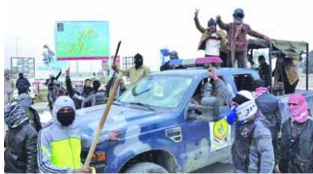
Gunmen takeover a police vehicle in Ramadi on 30 Dec 2013.