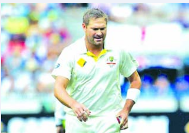
Australia’s Ryan Harris puts the ball in his pocket as rain falls during the first day of the fourth Ashes cricket test against England at the Melbourne cricket ground on 26 Dec, 2013.

giving away to brilliant sunshine, Carberry smacked a pair of boundaries to try to break the shackles of a disciplined pace attack but was left ashen-faced when he