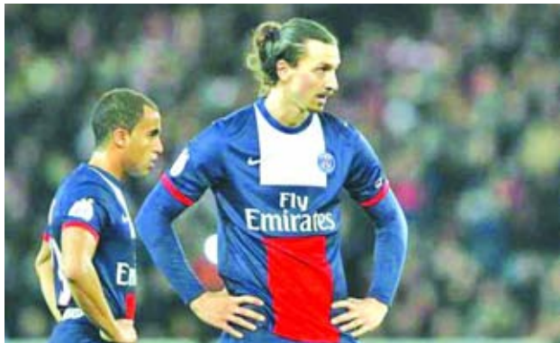
Paris St Germain's Zlatan Ibrahimovic (R) and Lucas react during their French Ligue 1 soccer match against Lille at the Parc des Princes Stadium in Paris on 22 Dec, 2013.

STOCKHOLM, 26 Dec—Players in the men's soccer team deserve to get more recognition than their female counterparts in Sweden and people should stop whipping up a gender storm about it, striker Zlatan Ibrahimovic said.