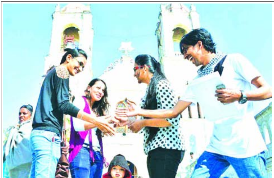
People greet each other after offering prayers on Christmas at St Joseph's Cathedral in Hyderabad, India, on 25 Dec, 2013.