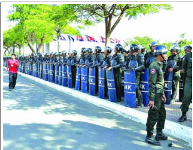
Security forces are deployed near the Prime Minister Hun Sen's house in Phnom Penh, Cambodia, on 25 Dec, 2013. Cambodian opposition leader Sam Rainsy vowed to mobilize 1 million supporters into capital Phnom Penh on Sunday as the opposition party's daily protests against Prime Minister Hun Sen's government entered the 11th day on Wednesday.

Since the ouster of Morsi, Brotherhood supporters have staged many protests that in many cases turned into violent, while students, affiliated to the group, tried to disturb studying in different Egyptian universities.— Xinhua