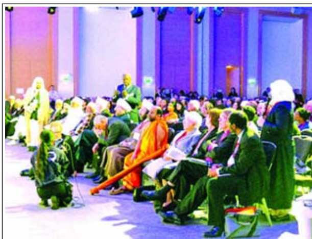
Photo taken on 20 Nov, 2013 shows some participants standing to exchange views over the issue of women's human rights during the ninth assembly of the World Conference of Religions for Peace in Vienna.

The deputy foreign ministers held talks in Moscow in mid-August, effectively resuming the territorial negotiations between the two countries. Four islands off Hokkaido — Etorofu, Kunashiri, Shikotan and the Habomai islet group — were seized by the Soviet Union following Japan's surrender in World War II on 15 August, 1945.— Kyodo News