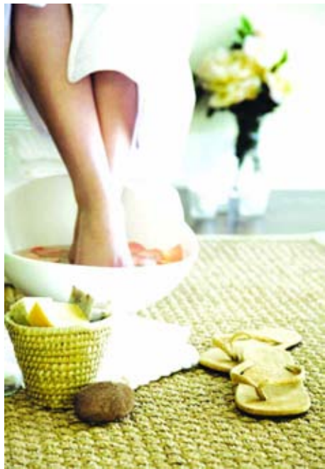
1. Eat more foods that can nourish blood