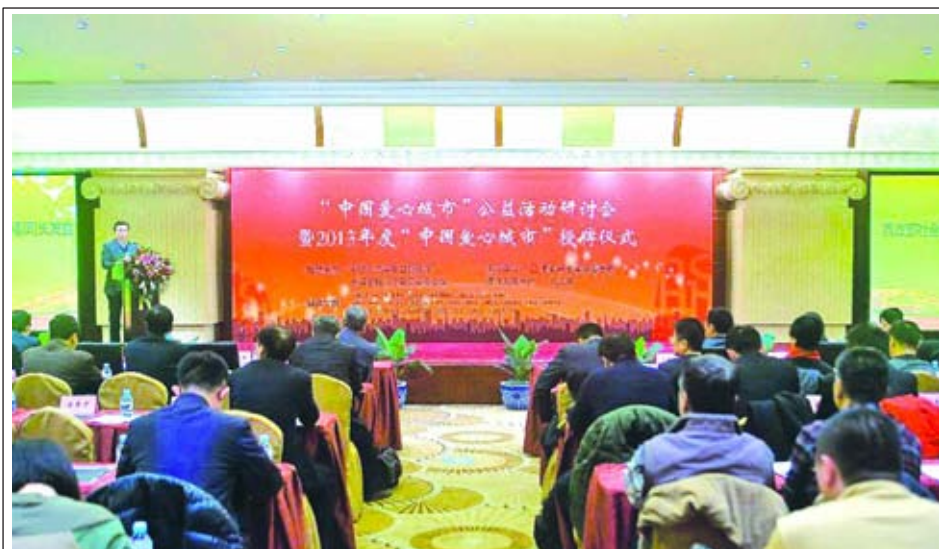
Photo taken on 25 Dec, 2013 shows the scene of an awarding ceremony in Beijing, capital of China. Qiqihar City is awarded "Chinese love city" during an awarding ceremony in Beijing on Wednesday.—XINHUA

On Tuesday, a thunderous blast hit security headquarters of the Nile Delta governorate of Daqahliya in Egypt, killing at least 15 and injuring over one hundred.—Xinhua