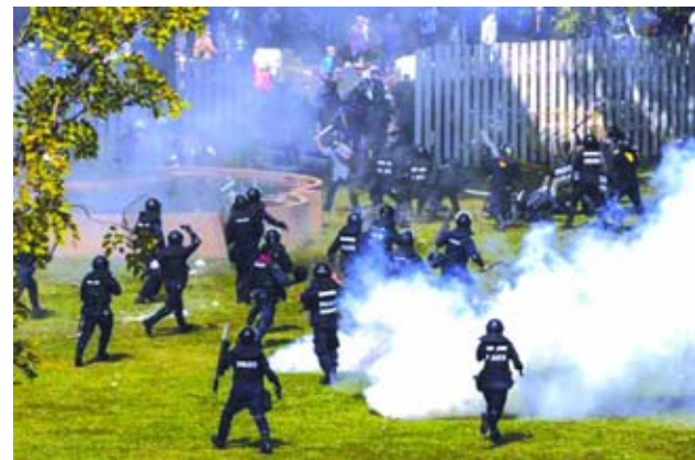
An anti-government protester (top, L) waves his knife as they attack the Thai-Japan youth stadium during clashes with policemen in central Bangkok on 26 Dec, 2013.