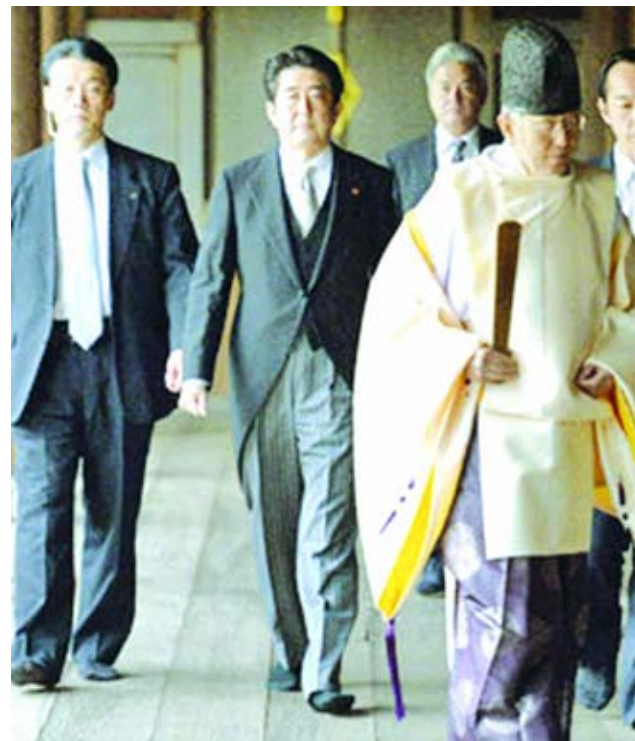
Prime Minister Shinzo Abe (2 nd from L) is seen after paying homage at Yasukuni Shrine in Tokyo on 26 Dec 2013.—KYODO NEWS