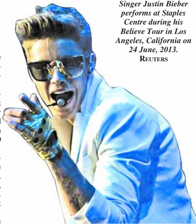
Singer Justin Bieber performs at Staples Centre during his Believe Tour in Los Angeles, California on 24 June, 2013.