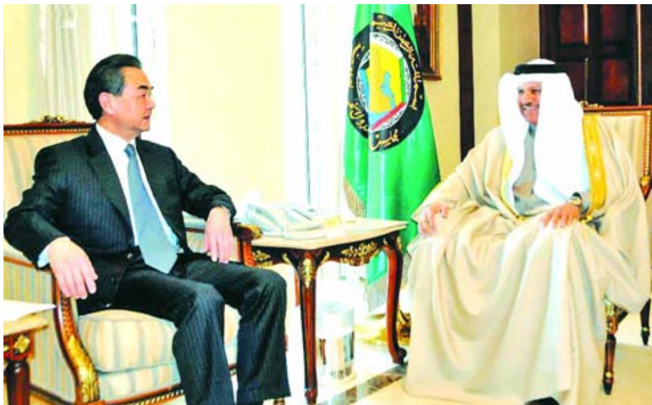
Chinese Foreign Minister Wang Yi (L) meets with Gulf Cooperation Council (GCC) General Secretary Abdullateef Al Zayani in Riyadh, on 25 Dec, 2013. Visiting Chinese Foreign Minister Wang Yi underlined Wednesday China's keenness to promote strategic cooperation and ties in all fields with the Gulf Cooperation Council (GCC) countries.

RIYADH, 26 Dec — Visiting Chinese Foreign Minister Wang Yi underlined Wednesday China's keenness to promote strategic cooperation and ties in all fields with the Gulf