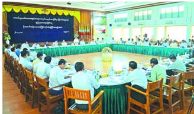
First work coordination meeting of the leading committee for formulation of laws and bylaws to protect the rights and to promote the interests of farmers in process.—MNA