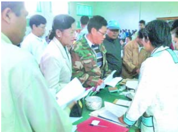
Officials of ministries concerned draw lots for competing in futsal, tug of war and sepaktakraw events on the Independence Day.

the 66 th Anniversary Independence Day took place at the Ministry of Sports, here, this morning. (See page 9)