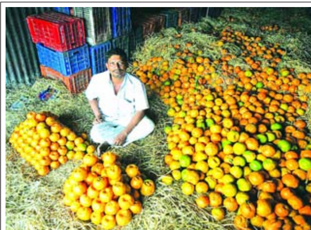
A shopkeeper sits among oranges at a fruit market in Nagpur, which is famous for orange production and trade, in Maharashtra, India, on 22 Dec, 2013.