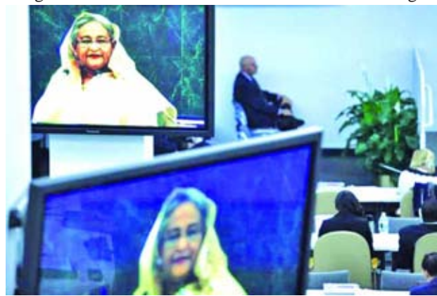
Delegates listen to Bangladesh's Prime Minister Sheikh Hasina (pictured on screens) while she addresses the 68th United Nations General Assembly at the UN headquarters in New York, on 27 Sept, 2013.— REUTERS

The army will be deployed until 9 January, an Election Commission official said.— Reuters