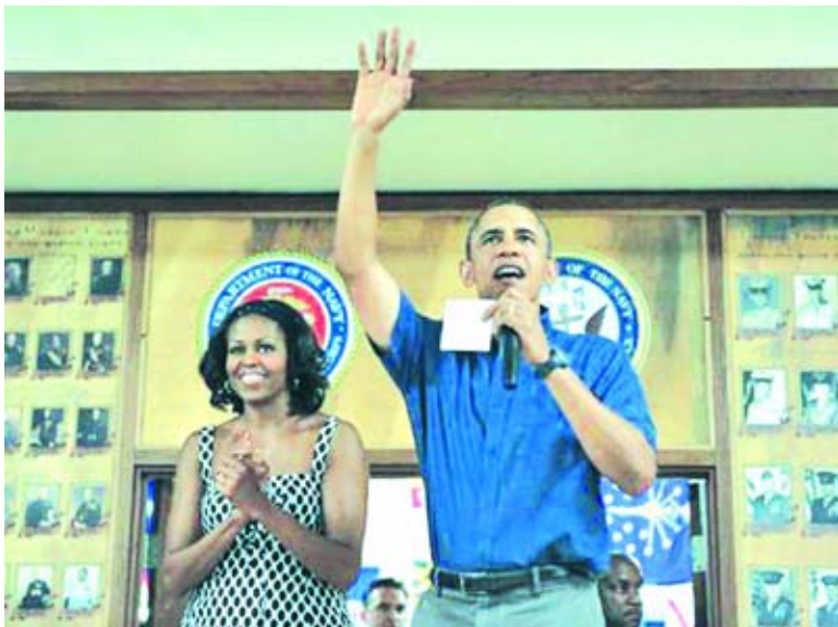
US President Barack Obama (R) and first lady Michelle Obama greet military personnel during a Christmas day visit to Marine Corps Base Hawaii in Kaneohe, Hawaii on 25 Dec, 2013.