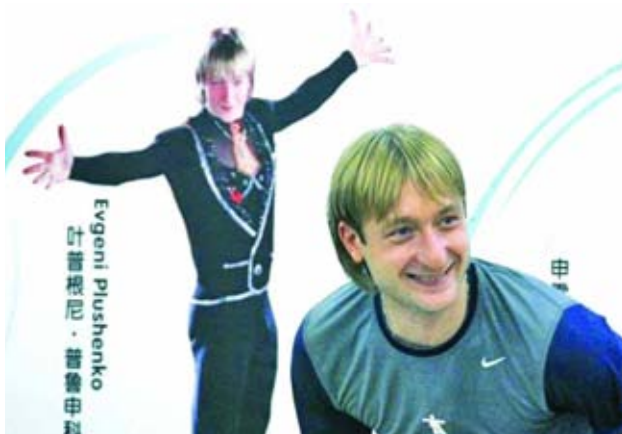
Former Olympic champion figure skater Yevgeny Plushenko of Russia.

MOSCOW, 26 Dec—Russian figure skating superstar Yevgeny Plushenko said on Wednesday he will not compete for the gold medal in the men's competition at the Sochi Olympic Games after he came in second in the national championships.