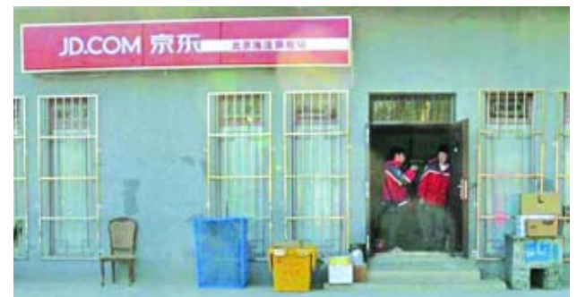
Two Jingdong, also known as JD.com, couriers chat at the entrance to the company's Haidian District delivery station in Beijing, on 20 Nov, 2013.