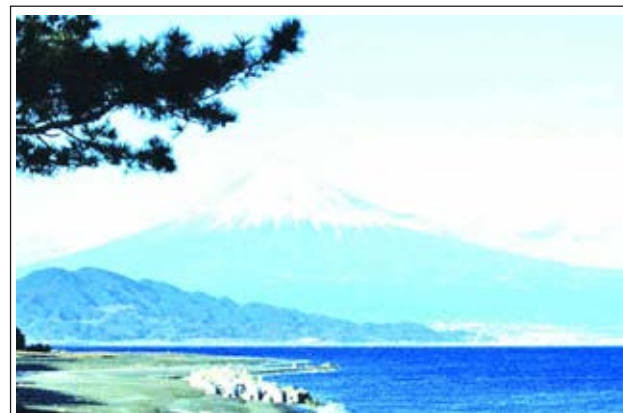
File photo taken on 12 Dec, 2013, shows Mt Fuji, seen from Miho no Matsubara in Shizuoka Prefecture. Local prefectures agreed on 25 Dec, 2013, to collect a 1,000 yen admission fee from climbers on Mt Fuji from the summer of 2014 on a voluntary basis.

The NRA was launched in September last year, endowed with greater independence than the former nuclear safety agency to prevent close relations developing between regulators and promoters of atomic power, something said to have caused safety to be neglected.—Kyodo News