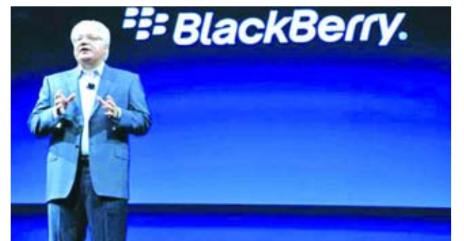
Mike Lazaridis, President and Co-CEO of Research In Motion, speaks during BlackBerry's DevCon at the Moscone West Centre in San Francisco, California, on 18 Oct, 2011.