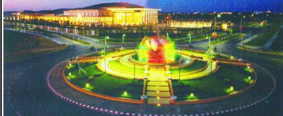
ASEAN Summits and related meetings will be held at Myanmar International Convention Centre (1), Nay Pyi Taw