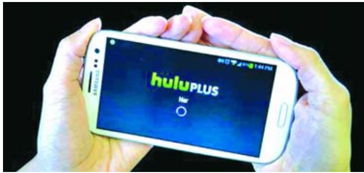
The HULU Plus app is played on a Samsung Galaxy phone in this photo-illustration in New York, on 23 Dec, 2013.