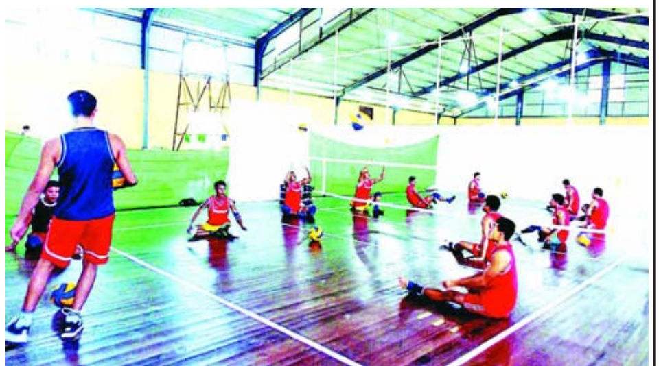
Sitting volleyball athletes under training to participate in 7 th ASEAN Para Games.

"Myanmar women sitting volleyball team is consisted of 12 players. They are from the Schools for Disabled Persons. They have no competition expe-