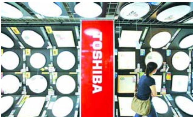
The logo of Toshiba Corp is seen at an electronics store in Yokohama, south of Tokyo, on 25 June, 2013.