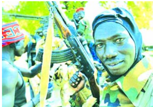
A South Sudan army soldier holds his weapon in Bor, 180 km (108 miles) northwest from capital Juba on 25 Dec, 2013.