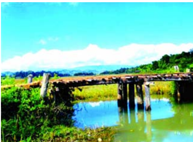
Photo shows a wooden bridge linking between Ilayku and Lwaepaw Villages near Indawgyi Lake in Mohnyin Township, which would be reconstructed at the cost of K 0.5 million, with the contribution of Pyidaungsu Hluttaw Fund.