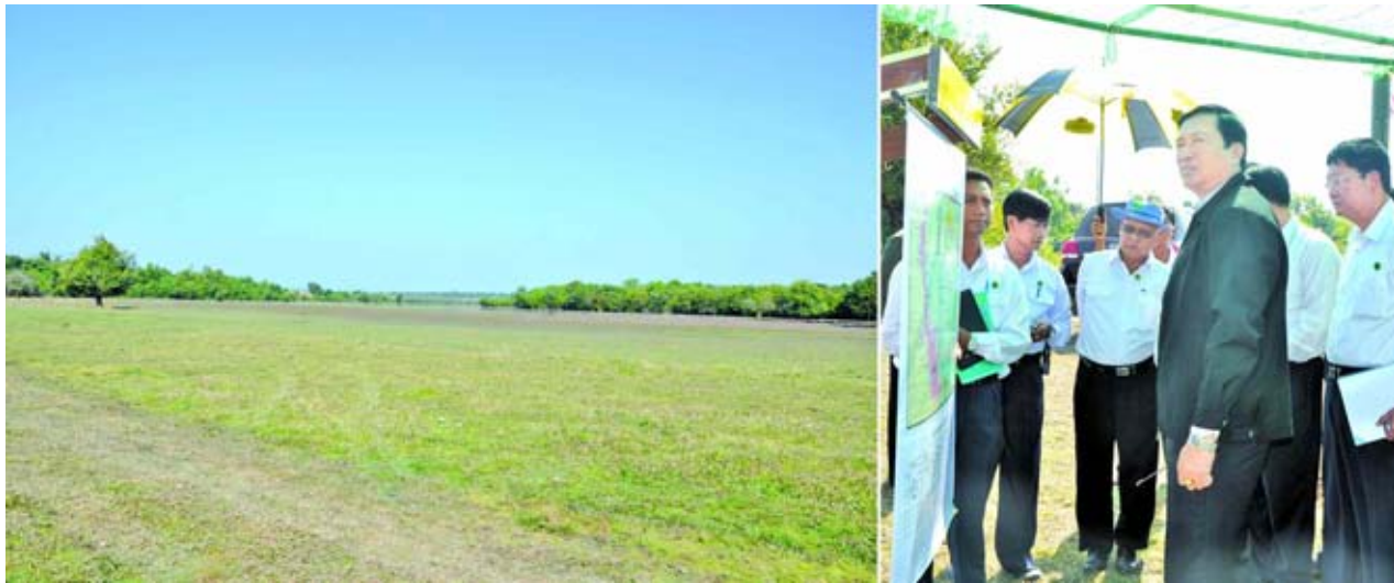
Union Minister U Maung Myint views site chosen for construction of caustic soda plant in Mayantaung rubber farm in Thaton.—MNA

NAY PYI TAW, 26 Dec— Union Minister for Industry U Maung Myint inspected land plot of Naung Yo sugarcane plantation in Bilin in Mon State yesterday. Then, he viewed the chosen site to build a caustic