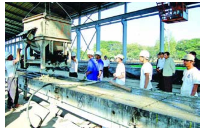
Union Minister U Than Htay looks into production of sleepers at Concrete Sleeper Plant (Ottshipin).