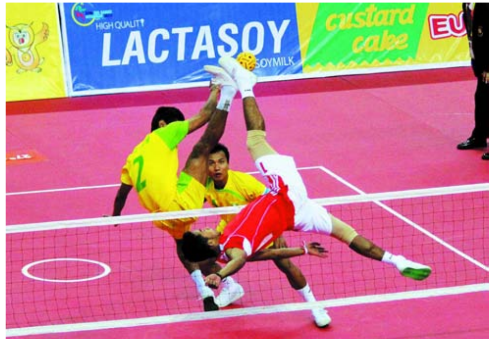
Myanmar and Indonesian players fight for the caneball men's double regu Sepak Takraw.