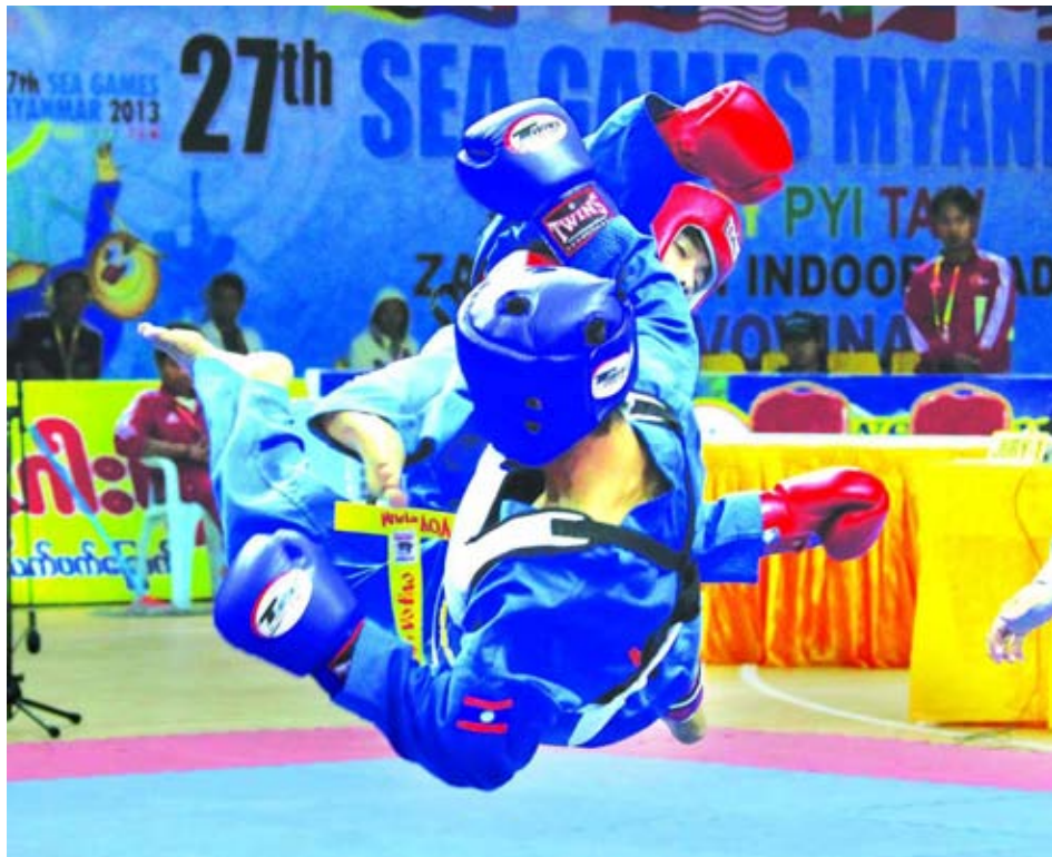
Athletes from Vietnam and Lao fight during the men's 50-55 kg category of Vovinam.