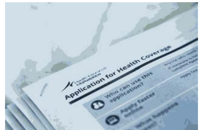
The federal government forms for applying for health coverage are seen at a rally held by supporters of the Affordable Care Act, widely referred to as "Obamacare", outside the Jackson-Hinds Comprehensive Health Center in Jackson, Mississippi on 4 Oct, 2013.

One of the central features of a value-based system is a financial "stick." If patients insist on medical procedures that science shows to be ineffective or unnecessary, they'll have