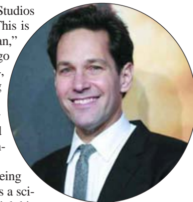
Actor Paul Rudd poses at the UK Premiere of the film Anchorman 2 in Leicester Square, London, on 11 Dec, 2013.

The studio said in a statement that the plot is being kept under wraps. But in Marvel Comics, Ant-Man is a scientist who invents a substance that allows him to shrink his size and communicate with insects. The film, to be directed by Edgar Wright, is scheduled for release in mid-2015. Walt Disney Co. bought Marvel in 2009 for $4.3 billion. The studio is behind some of the most successful films of recent years, including the “Iron Man,” “Avengers” and “Thor” franchises.—Reuters