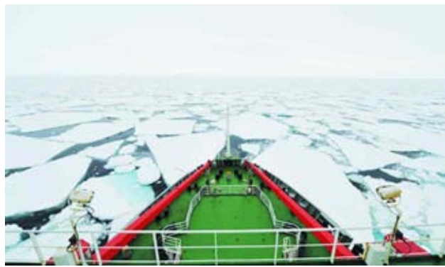
Chinese icebreaker Xuelong, or Snow Dragon, arrives at the Zhongshan Station on 2 Dec on the country's 30th expedition to the Antarctica that began on 7 November.

"Building the Taishan camp and inspecting sites for the station can further guarantee that Chinese sci-