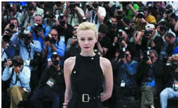
Cast member Carey Mulligan poses during a photocall for the film ‘Inside Llewyn Davis’ at the 66th Cannes Film Festival in Cannes on 19 May, 2013.

A: The reason the Coen brothers asked me to audition for it is that they had not seen me play a part like that before, and I had not gotten the opportunity to play a part like that. She was just so incensed and furious and behind that, you could see the intimate relationship between (Jean and Llewyn), she was just brilliantly written.