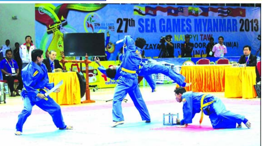
Myanmar team participates in the Dragon Tiger Form event of Vovinam.