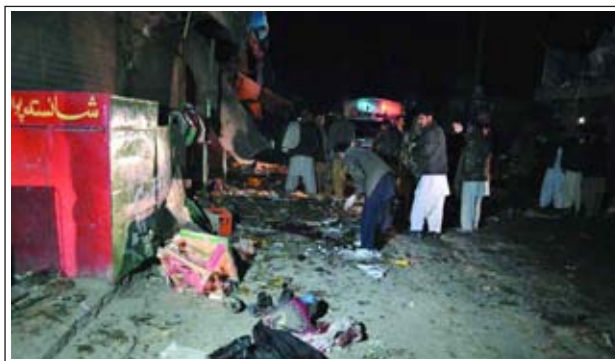
Officials examine the blast site in Quetta, southwest Pakistan, on 19 Dec, 2013. At least one person was killed and 21 others including seven children were injured when a bomb blast struck Quetta Thursday evening, reported local media.—XINHUA