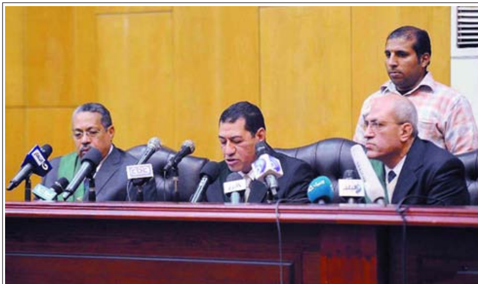
A Press conference is held at a court in Cairo, Egypt on 19 Dec, 2013. An Egyptian court on Thursday ordered to acquit Mubarak's two sons Alaa and Gamal, and former prime minister Ahmed Shafiq, who were charged of misuse of public funds, Middle East News Agency reported.