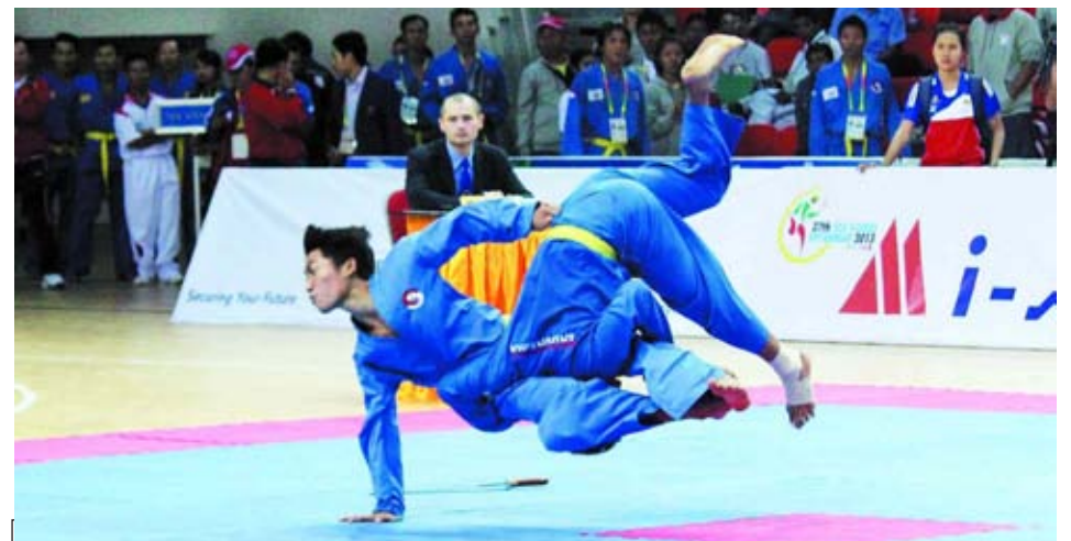
Two athletes from Laos compete in Pair machete form of Vovinam.