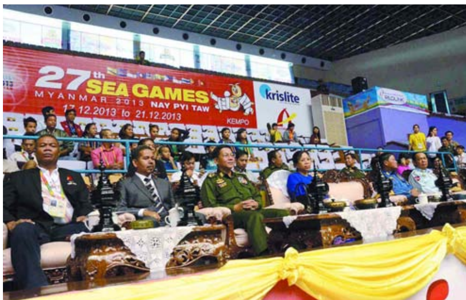
Senior General Min Aung Hlaing enjoys Kempo event of the 27th SEA Games.

YANGON, 20 Dec—Kempo and hockey events of the 27th SEA Games continued here today.