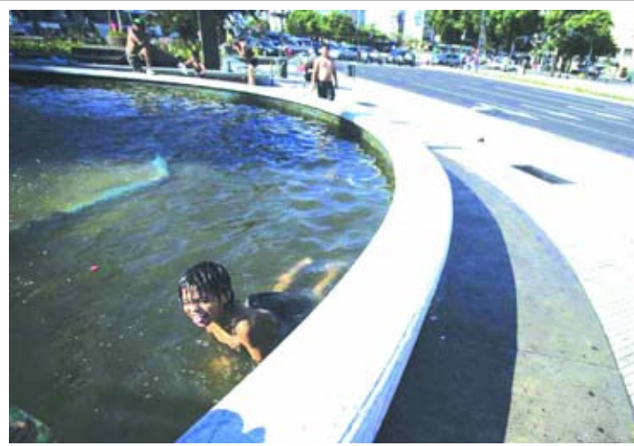
A child refreshes himself in a public fountain in Buenos Aires, Argentina, on 19 Dec, 2013. The temperature reached 32 degrees Celsius, and the orange alert issued by the National Weather Service continued in Buenos Aires and the surrounding areas, due to the heat wave.