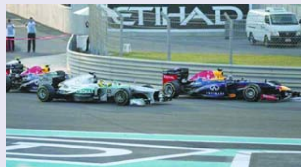
Red Bull Formula One driver Sebastian Vettel of Germany (R) drives ahead of Mercedes Formula One driver Nico Rosberg of Germany and Red Bull Formula One driver Mark Webber of Australia (L) during the Abu Dhabi F1 Grand Prix at the Yas Marina circuit on Yas Island, on 3 Nov, 2013

Red Bull, with Sebastian Vettel, have been champions for the past four years and were dominant in the second half of the 2013 season with their 26-year-