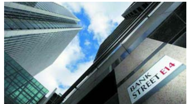
A sign for Bank Street and high rise offices are pictured in the financial district Canary Wharf in London in this on 21 Oct, 2010 file photo.