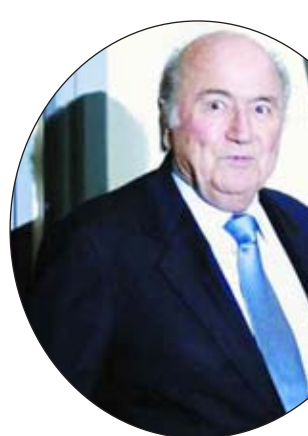
FIFA President Sepp Blatter Blatter said he hoped the tournament, being staged in Morocco this year for the first time, would eventually be included in the international calendar to avoid clashing with European league football.

MARRAKECH, (MOROCCO), 20 Dec — FIFA president Sepp Blatter is disappointed with European indifference towards the Club World Cup, he said on Thursday. The competition, featuring the club champions of each continent, arouses great interest in South America, Asia and Africa, but is barely noticed in Europe amid the torrent of pre-Christmas domestic football. "I could understand that when we played this competition in the past years in Japan or the United Arab Emirates, that there was less interest," Blatter told reporters. "But now it is on Europe's doorstep and there is not so much interest, I agree that we are disappointed."