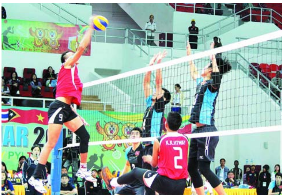
Myanmar and Vietnamese players in action of volleyball event of 27 th SEA Games taken place at Zeyathiri Indoor Stadium (B).