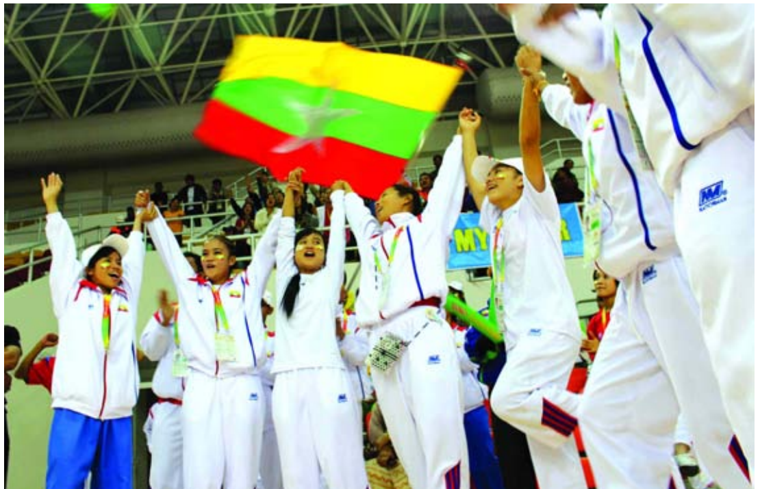
Vovinam athletes of Myanmar celebrate after winning three gold medals in Dec. 20 events.