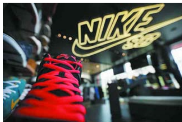
Shoes are displayed in the Nike store in Santa Monica, California, in this on 25 Sept, 2013, file photo.

Nike earned $537 million, or 59 cents a share, up 40 percent from the year-