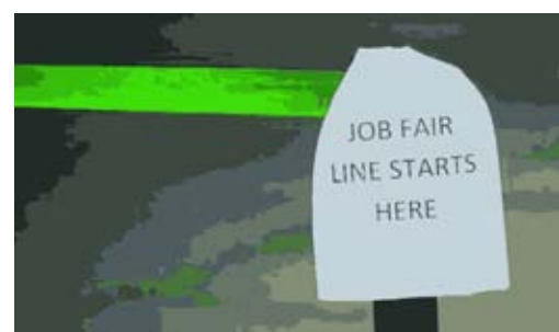
A sign marks the entrance to a job fair in New York on 24 Oct, 2011.

A large number of baby boomers are expected to retire from the workforce in the next 10 years, as they