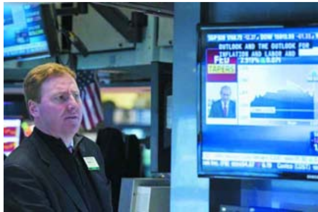
A trader listens to an announcement by the US Federal Reserve on the floor of the New York Stock Exchange in New York on 18 Dec, 2013.