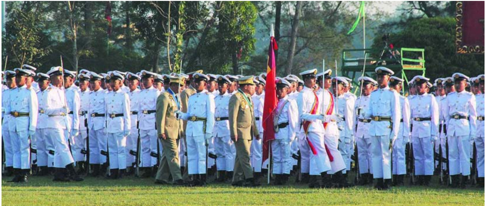
Senior General Min Aung Hlaing inspects cadets of 15 th Intake of Defence Services Medical Academy.—MYAWADY

bers of the Defence Forces to take part in the educative and consultation on health care services as a long-term plan while carrying out the treatment and preventive measures.