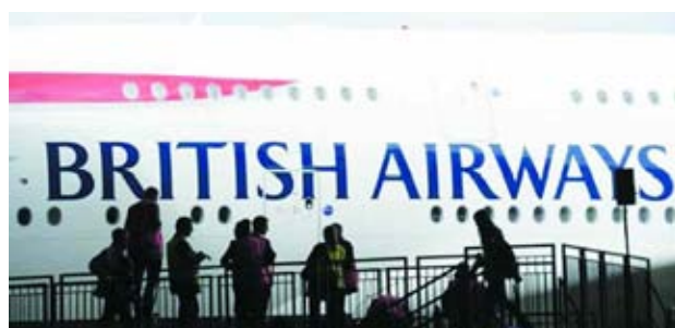
British Airways' Airbus A380 arrives at a hanger after landing at Heathrow airport in London on 4 July, 2013.

flights between London's City Airport and New York can already send texts and access WiFi. The changes will come in on 19 December.—Reuters