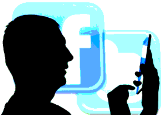
A man is silhouetted as he uses a mini tablet computer while standing in front of a video screen with the Facebook and Twitter logos, in this picture illustration taken in Sarajevo on 22 Oct, 2013.

SAN FRANCISCO, 20 Dec — Facebook Inc took a first step on Tuesday toward selling video ads that play automatically in newsfeeds, moving cautiously to unlock a source of revenue