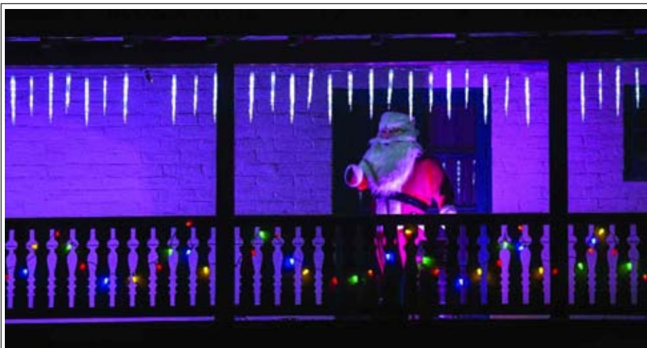
Photo taken on 16 Dec, 2013 shows a Santa Claus-shaped Christmas light in Los Angeles, the United States.

2. Tender documents are available at our office starting from 20.12.2013 during office hours and for further detail please contact: Deputy General Manager Supply Department, Myanma Railways, Corner of Theinbyu Street and Merchant Street, Botahtaung, Yangon. Phone:95-1-291985, 291994