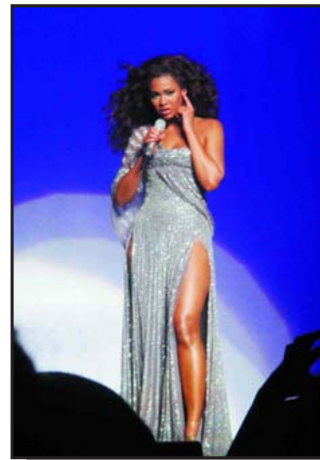
Singer Beyonce attends HBO’s New York premiere of her documentary ‘Beyonce — Life is But a Dream’ in New York on 12 Feb, 2013.