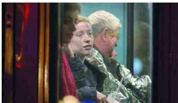
People receive medical attention on a bus after part of the ceiling at the Apollo Theatre on Shaftesbury Avenue collapsed in central London on 19 Dec, 2013.