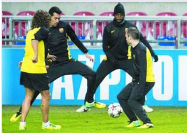
Barcelona's Carles Puyol, Sergio Busquets, Alex Song and Andres Iniesta (L-R) attend a training session the day before their Champions League group H soccer match against Ajax Amsterdam, in Amsterdam, on 25 Nov, 2013.

He is a hero to Spaniards after netting the extra-time winner against Netherlands in South Africa in 2010 that secured the Iberian nation's first World Cup.