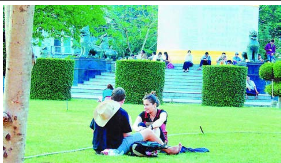
Service personnel and families, globetrotters take relaxation at Maha Bandoola Park, downtown Yangon, enjoying scenic beauty and sunset of Yangon on 17 December.

Ngushweli farm has 230 acres of land.