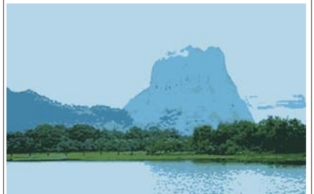
Mt Zwei Kabin

Literally meaning Split Mountain Pagoda, this ruggedly beautiful rocky hill rising straight out of the surrounding plain is split in two, with pagodas on each.