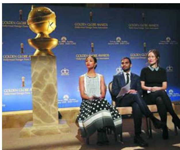
(L-R) Actors Zoe Saldana, Aziz Ansari and Olivia Wilde sit on stage at the announcement of nominations for the 71st annual Golden Globe Awards in Beverly Hills, California on 12 Dec, 2013.

In the category of best TV dramas, Netflix's political thriller "House of Cards" and Showtime's racy sex history series "Masters of Sex" will take on AMC's gritty drug drama "Breaking Bad," PBS' British period series "Downton Abbey" and CBS' law and corruption yarn "The Good Wife."