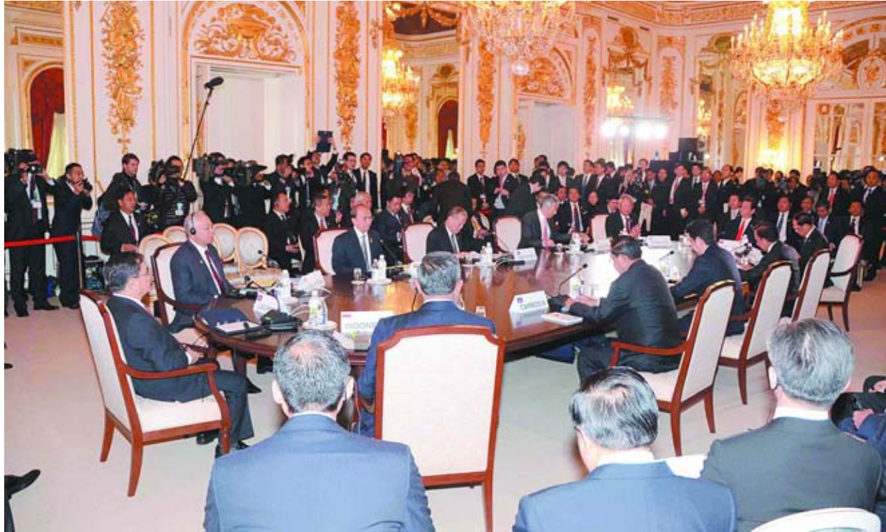
President U Thein Sein attends Summit to mark the 40 th Anniversary of ASEAN-Japan ties at the State Guest House in Japan.

Next, the ASEAN-Japan Summit followed at Hagoromo-no-ma Hall of the State Guest House with addresses of the Japanese Prime Minister and ASEAN leaders.