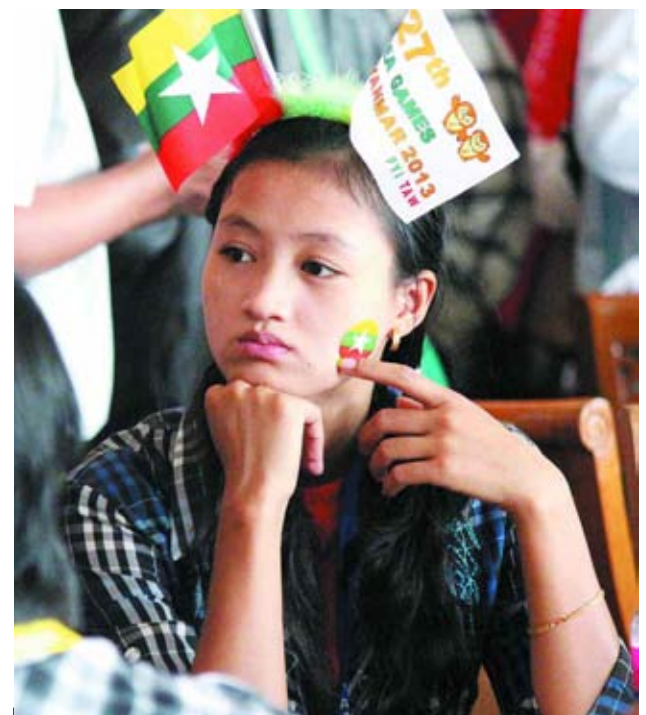
A fan at Wunna Theikdi Stadium in Nay Pyi Taw.