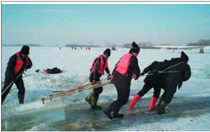
Workers take ice from Songhua River for an ice sculpture fair at Zhaolin Park, in Harbin, capital of northeast China's Heilongjiang Province, on 13 Dec, 2013. Nearly 1,000 workers started to pick ice in Harbin recently for making ice sculptures.

In February, seven workers taken from northern Bauchi state, including four Lebanese citizens and one each from Britain, Greece and Italy, were killed by the extremist Islamist group known as Ansaru. They are linked to al-Qaeda and claimed responsibility for the killings.—Xinhua