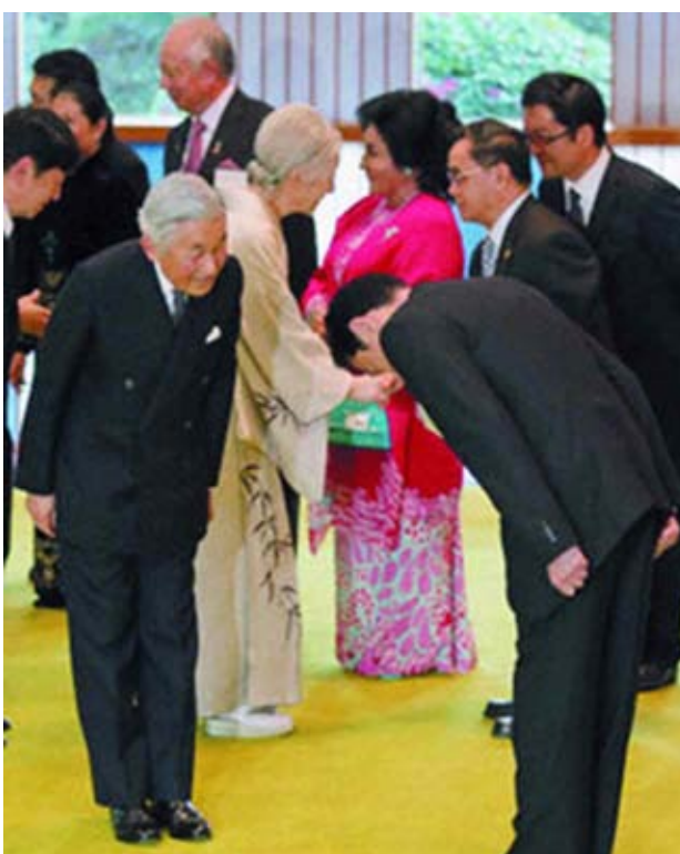
Emperor Akihito and Empress Michiko meet with ASEAN leaders and their wives at the Imperial Palace in Tokyo on 13 Dec, 2013. The leaders from the Association of Southeast Asian Nations were in Japan for a summit with Japan.

The ASEAN leaders meanwhile welcomed Prime Minister Shinzo Abe’s policy of making Japan a proactive contributor to peace, saying they “looked forward to Japan’s efforts in contributing constructively to peace, stability and development in the region,” it said.—Kyodo News