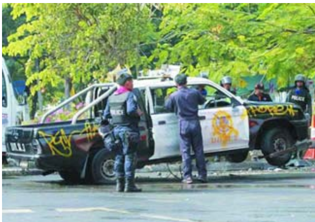
Police officers remove a damaged police pick-up truck near the Government House in Bangkok 14 Dec, 2013.

BANGKOK, 14 Dec — Leaders of the protest movement trying to overthrow Thailand's government outlined their aims at an armed forces seminar on Saturday but military leaders declined to take sides or say if a February election should take place.