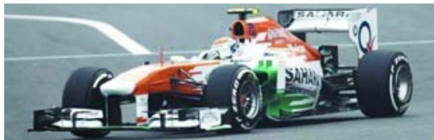
Former Force India Formula One driver Adrian Sutil of Germany drives during the Indian F1 Grand Prix at the Buddh International Circuit in Greater Noida, on the outskirts of New Delhi, on 27 Oct, 2013.