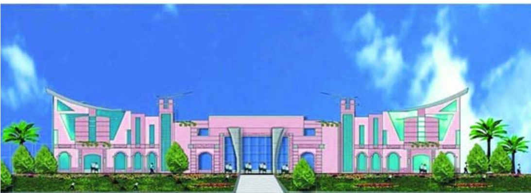
Scale model on arrival side of elevation passenger terminal at Central Check Point, Moreh, India.