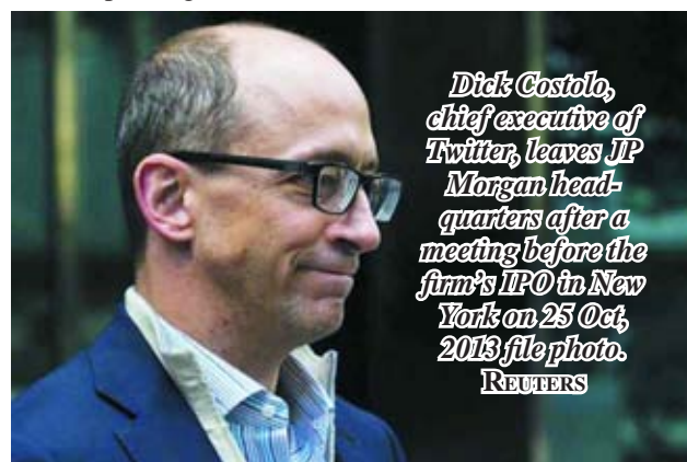
Dick Costolo, chief executive of Twitter, leaves JP Morgan headquarters after a meeting before the firm's IPO in New York on 25 Oct, 2013 file photo.

"Just ignore them & they'll stop" is a dangerous thing to say to bullied kids & a dangerous thing to say to stalked/harassed Twitter users," wrote @red3blog, another user.—Reuters