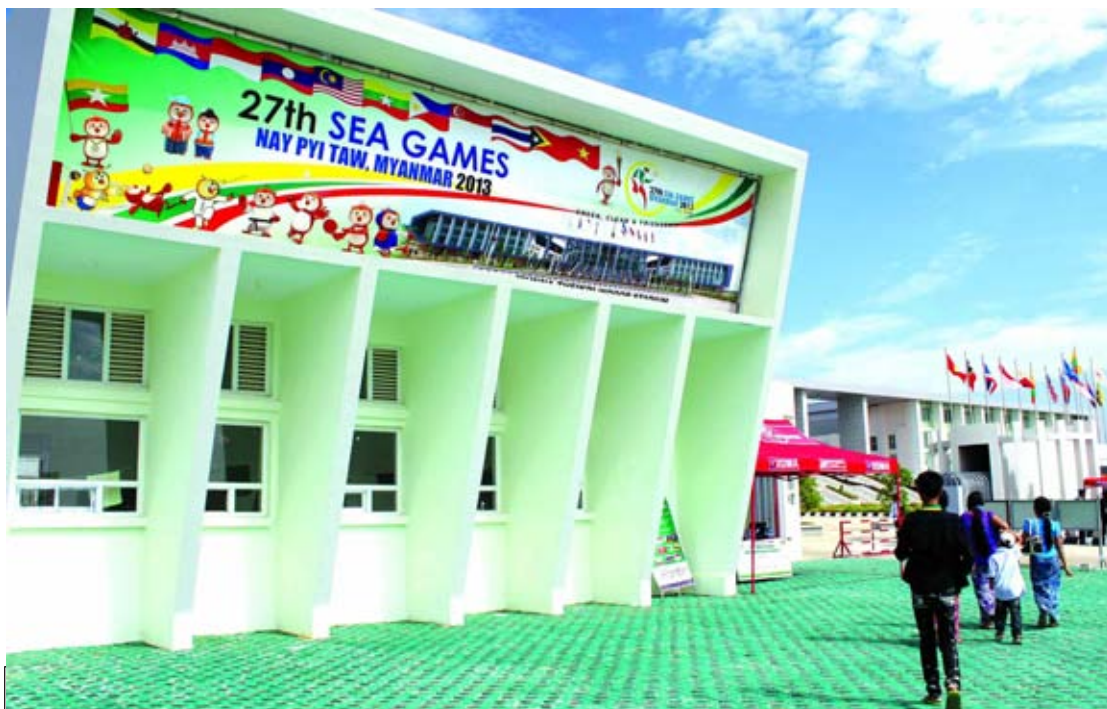
Fans arrive at Wunna Theikdi Stadium in Nay Pyi Taw.