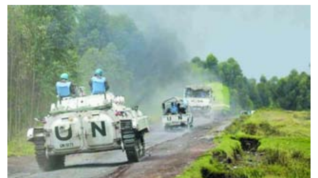
UN peacekeepers drive their tank as they patrol past the deserted Kibati village near Goma in the eastern Democratic Republic of Congo, on 7 Aug, 2013.

embargo on Democratic Republic of Congo, was investigating the origin of the weapons, adding: "I'm sure it will make interesting reading." The UN experts, who report to the UN Security Council's Congo sanctions committee, have repeatedly accused neighboring Rwanda of backing the rebellion by M23 in eastern Congo, a claim the Rwandan government has fiercely rejected.—Reuters