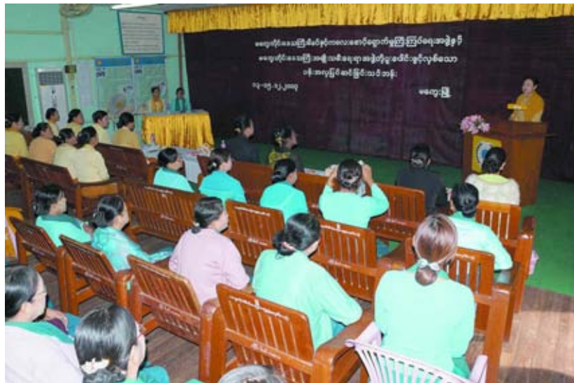
Members of WAO and MCWA attending flower arrangement course.

MAGWAY, 14 Dec—Magway Region Maternal and Child Welfare Supervisory Committee and Women's Affairs Organization jointly conducted the flower arrangement course.