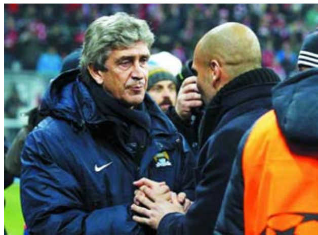
Manchester City coach Manuel Pellegrini (L) and Bayern Munich coach Pep Guardiola chat before their Champions League Group D soccer match in Munich on 10 Dec, 2013.

goal away from topping their Champions League group, but does not feel guilty about his mathematical blunder.