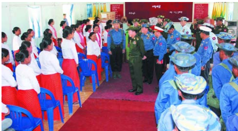
Senior General Min Aung Hlaing greets those present at the meeting with families of officers and other ranks in Cocogyun.