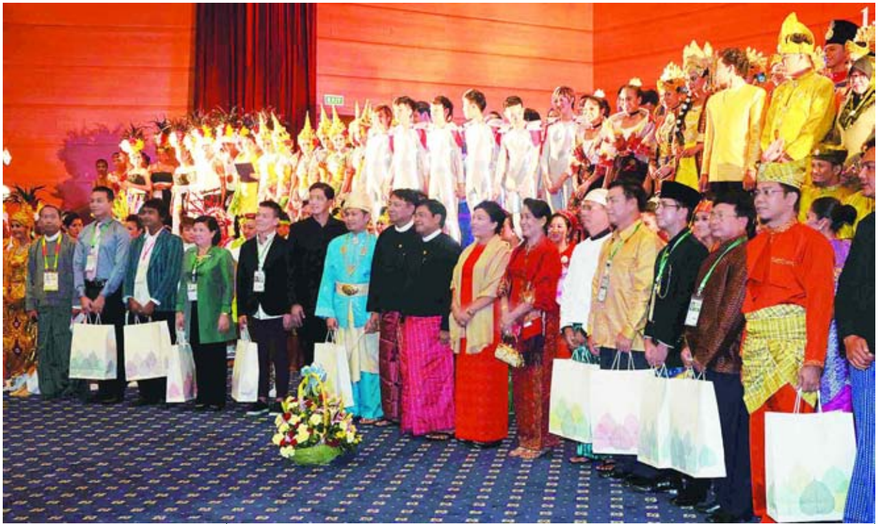
Later, the Vice-President cordially greeted the attendees.

The Vice-President and wife and the Union ministers presented gifts to the entertainers and they altogether posed for documentary photos.