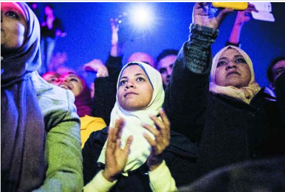
Fans enjoy the musical performance of Egyptian band Masar Egbari taking place at the Cairo Opera House, in Cairo, capital of Egypt, on 12 Dec, 2013. As one part of the annual International Volunteer Day event organized by United Nation Volunteers programme and others, two Egyptian popular-music band Masar Egbari and Wust El-Balad gave a show on Thursday, attracting hundreds of local young people.