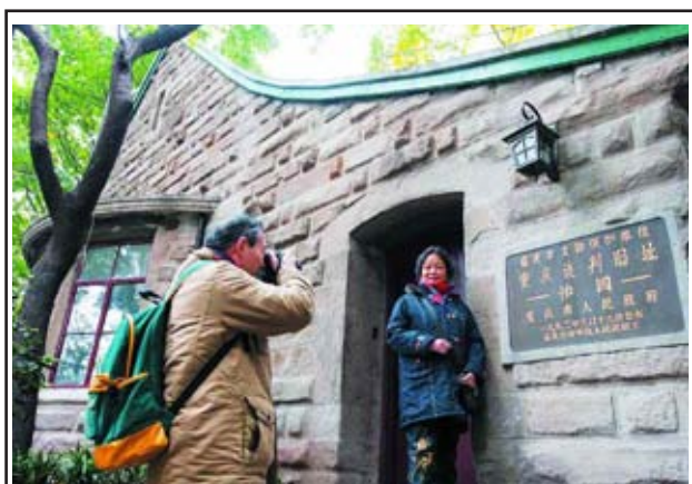
A tourist poses for photos in front of an historical building at Jiaxi Village, a scenic spot transformed from a residential section in Chongqing Municipality, southwest China, on 13 Dec, 2013. Traditional architectural style and some historical buildings as cultural relics were kept well at the Jiaxi Village.