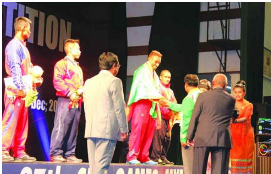
Union Election Commission Chairman U Tin Aye congratulates first prize winner in bodybuilding event.

NAY PYI TAW, 14 Dec—The opening ceremony of bodybuilding event of the 27 th SEA Games took place at Myanmar Convention Center (MCC) in Yangon this afternoon with an address by Union Election Commission Chairman U Tin Aye. After bodybuilding events (55, 60 and 70 kilo), the UEC chairman and officials presented prizes to the winners of the matches.