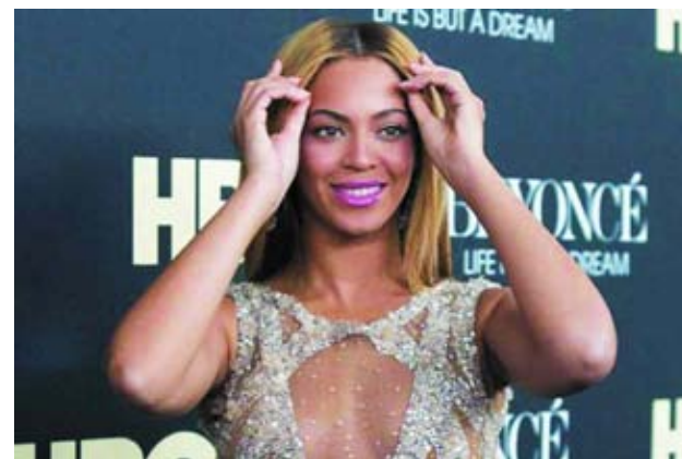
Singer Beyonce attends HBO's New York premiere of her documentary "Beyonce - Life is But a Dream" in New York on 12 Feb, 2013.