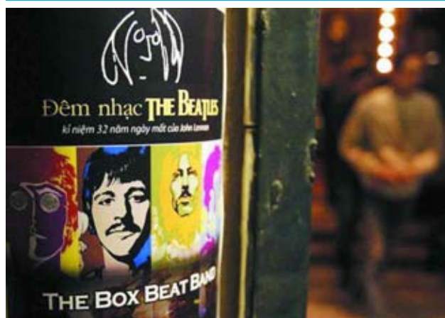
A fan walks near a poster promoting a tribute concert which marks the 32nd death anniversary of British legendary rocker John Lennon of the Beatles at a vintage cafe in Hanoi on 7 Dec, 2012.