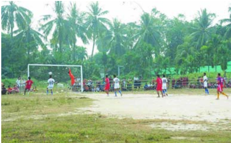
Footballers tussling the football in tournament in commemoration of 66 th Anniversary Independence Day.

MYEIK, 14 Dec—As a gesture of hailing the 66 th Anniversary Independence Day, the seventh Thathayar Aye Cup Football Tournament was held at the sports ground in Shanchaung Ward of Myeik on 12 December.