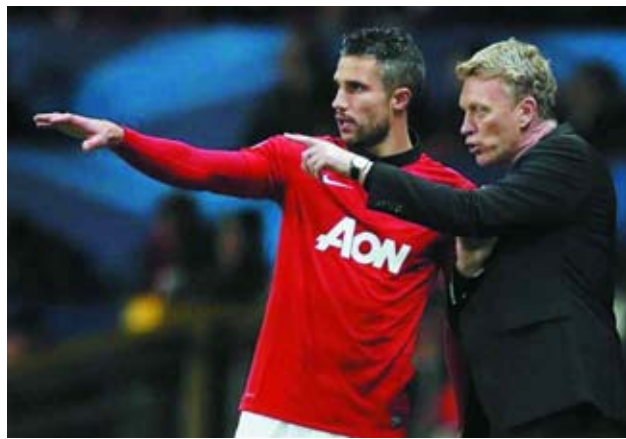
Manchester United's manager David Moyes speaks to substitute Robin Van Persie during their Champions League soccer match against Shakhtar Donetsk at Old Trafford in Manchester, northern England, on 10 Dec, 2013.

Responsibility will now fall to Rooney who has been in great form this season despite United's