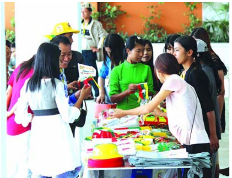
Fans buy souvenirs at Wunna Theikdi Stadium in Nay Pyi Taw.