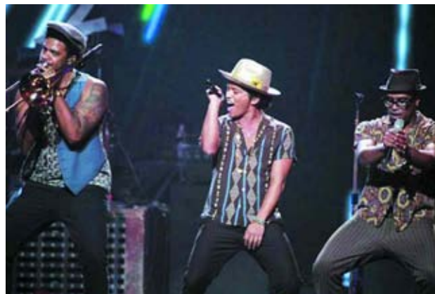
Bruno Mars (C) performs during the iHeartRadio Music Festival in Las Vegas, Nevada on 21 Sept, 2013.—REUTERS

He also notched four Grammy nominations this month, including two of the industry's top prizes — his single "Locked Out of Heaven" picked up both record and song of the year nods. The singer will embark on the North American leg of his "Moonshine Jungle World Tour" in 2014, and will also headline the Super Bowl half time show in February. Mars's music crosses over between pop, R&B, soul and hip hop, and he is known for conjuring up different musical eras within his albums. He reimagined 1940s doo-wop music for his 2010 debut album, "Doo-Wops & Hooligans," and revived sounds of Motown and 1970s disco in "Unorthodox Jukebox." —Reuters