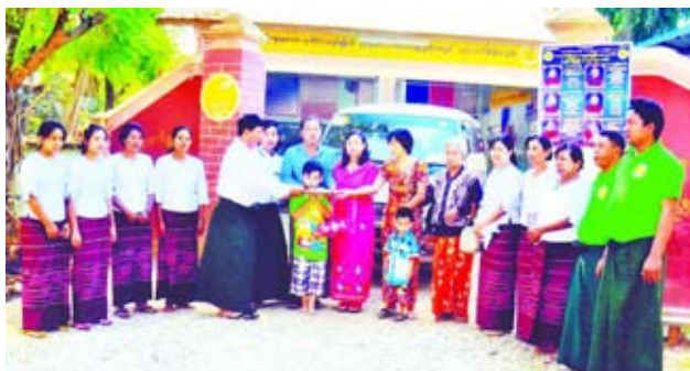
Wellwisher donates Super Custom car to a social association.

MYITNGE, 14 Dec—Philanthropic associations have been formed in wards and villages in Amarapura Township of Mandalay Region.