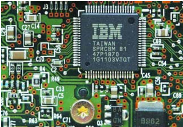
An IBM Central Processor Unit (CPU) is seen on a Hard Disk Drive (HDD) controller in Kiev, on 5 March, 2012.