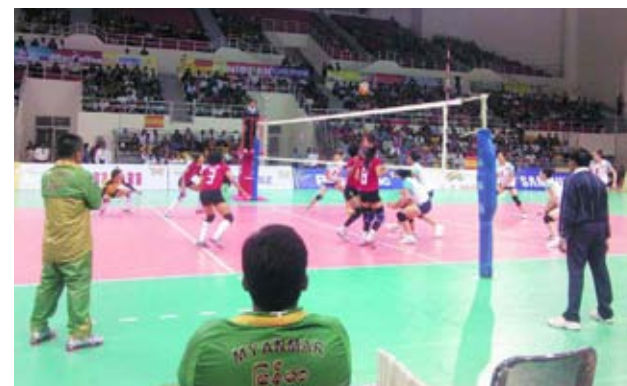
Myanmar volleyball women team plays against Vietnamese volley women team at Zeyathiri Indoor Stadium-B.