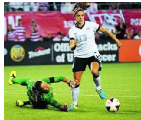
US forward Alex Morgan (13) dribbles the ball around Brazil goalkeeper Luciana (12) in the second half at Florida Citrus Bowl.

City host Premier League pacesetters Arsenal on Saturday with their title credentials in need of a boost after an inconsistent start to the campaign left them in fourth place, six points off the lead. The match pitches the Premier League's best home team against the country's best travellers with City winning all seven matches at their Etihad Stadium and Arsenal winning six out of eight away.—Reuters