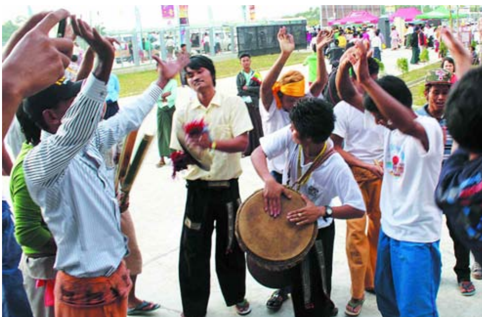
Fans dance to the accompaniment of traditional orchestra as they celebrate victory of Myanmar boxer Nwe Ni Oo in the Women's Feather category of 27th SEA Games.