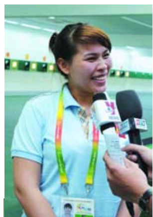
Gold medalist Vietnamese shooter.

Vietnamese shooters clinched four gold in Men's 50-metre rifle prone (individual), Women's 10-metre air pistol, Men's 50-metre pistol (team) and Women's 10-metre air pistol contests to top the table in which Thailand and Malaysia are ranked second and third places. Myanmar stands fourth place with one gold, two silver and one bronze.