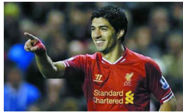
Liverpool's Luis Suarez celebrates after scoring during their English Premier League soccer match against West Ham United at Anfield in Liverpool, northern England on 7 Dec, 2013.

Yet it is his added ability to conjure moments of individual brilliance and single-handedly pick apart the opposition that make