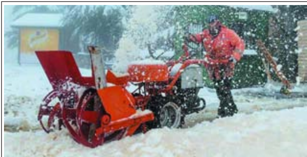
A worker of Mount Hermon Ski Resort crashes snow in the Golan Heights, on 11 Dec, 2013. It was stormy in most of Israel and snow in the Golan Heights on Wednesday, and it will snow periodically in the northern Golan Heights, with temperatures dropping further to around 0 degree Centigrade.—XINHUA