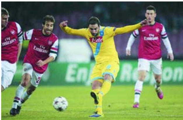
Napoli's Gonzalo Higuain kicks the ball to score against Arsenal during their Champions League soccer match at San Paolo stadium in Naples, on 11 Dec, 2013.