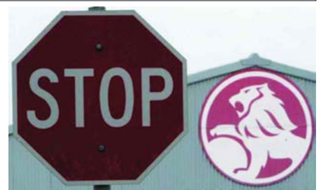
A stop sign is seen near a General Motors (GM) Holden storage facility in Melbourne on 2 June, 2009 file photo.