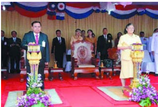
Lao Vice President Bounhang Vorachith (L) and Thai Princess Maha Chakri Sirindhorn attend the opening ceremony of the new Lao-Thai bridge in Chiang Rai, Laos, on 11 Dec, 2013.

"The bridge is the missing link along the North South Economic Corridor,