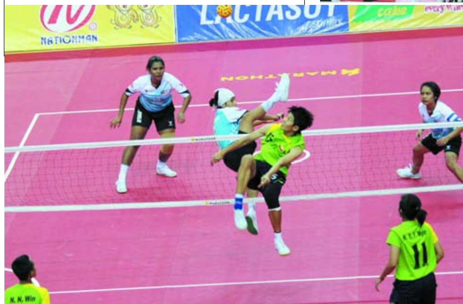
Women's Sepak Takraw match between Myanmar and Malaysia at Wunna Theikdi Indoor Stadium.