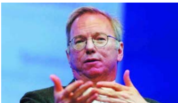
Google Executive Chairman Eric Schmidt speaks at the Google Big Tent event at the Grove Hotel, on the outskirts of London on 22 May, 2013.

The report found that overall, NASA benefited from leasing 70,000 square feet of space to H211, the private company that manages the Google executives' aircraft. The $1.4 million a year that H211 paid NASA was at a fair market value. And NASA has flown more than 200 flights using some of the aircraft to collect climate data at no cost to the agency. But while NASA did not lose any money on the fuel it sold to H211, the report said that H211 received a monetary benefit to which it was not entitled and recommended that NASA and H211 explore options to "remedy" the situation. Google referred