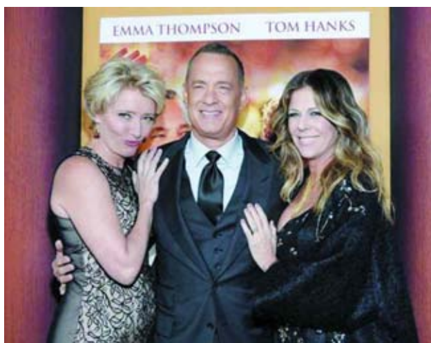
Cast members Emma Thompson (L), Tom Hanks and his wife Rita Wilson (R) attend the film premiere of "Saving Mr. Banks," at the Walt Disney Studios in Burbank, California, on 9 Dec, 2013.