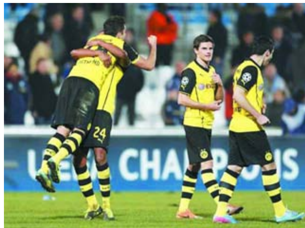
Borussia Dortmund players react after winning their Champions League soccer match against Olympique Marseille at the Velodrome stadium in Marseille, on 11 Dec, 2013.