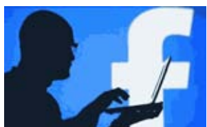
A man is silhouetted against a video screen with an Facebook logo as he poses with an Dell laptop in this photo illustration taken in the central Bosnian town of Zenica, on 14 Aug, 2013.

NEW YORK, 12 Dec — Standard & Poor's on Wednesday said Facebook Inc will join its S&P 500 stock index after the close of trading on 20 December, cementing the social media network's rise into one of the biggest, most powerful US companies.