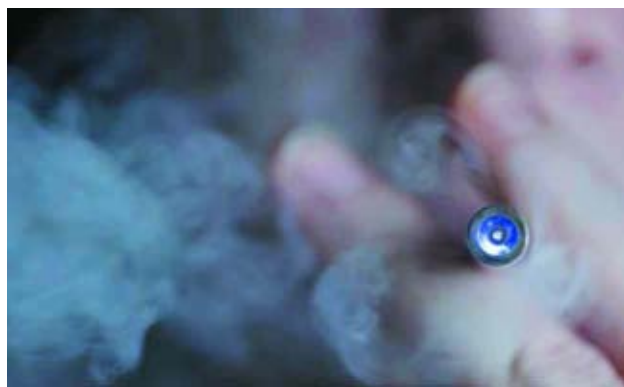
A man uses an E-cigarette, an electronic substitute in the form of a rod, slightly longer than a normal cigarette, in this illustration picture taken in Paris, on 5 March, 2013.