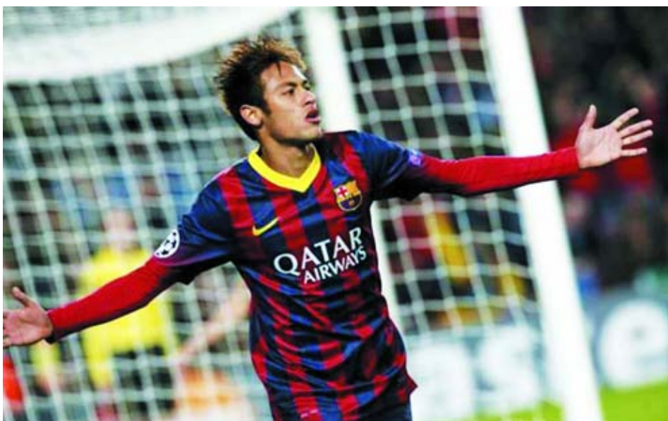
Barcelona's Neymar celebrates after scoring a goal against Celtic during their Champions League soccer match at Camp Nou stadium in Barcelona on 11 Dec, 2013.

form with a 6-1 win over Celtic at the Nou Camp on Wednesday to seal top