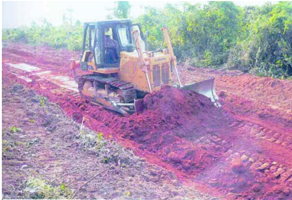
A heavy machinery at work at the detour construction site in Mohnyin.

The local people donated their farmlands included in the area of constructing the detour as it is the town