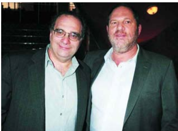
Bob Weinstein (L) and his brother Harvey Weinstein, the founders of The Weinstein Co, pose at the premiere of the film "1408" in Los Angeles, California.