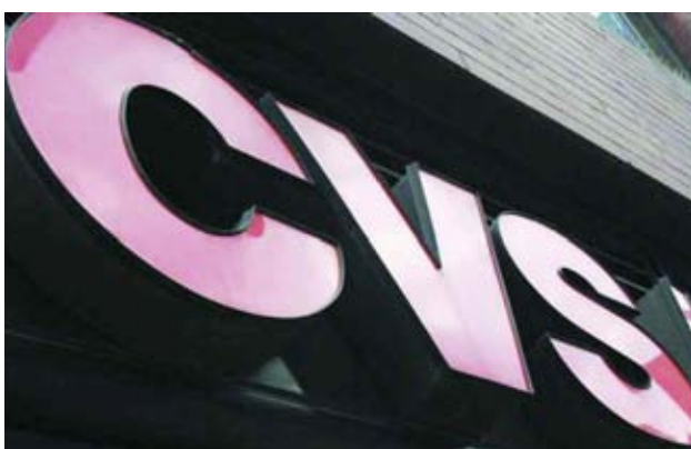
A CVS pharmacy is seen in New York City on 28 July, 2010.