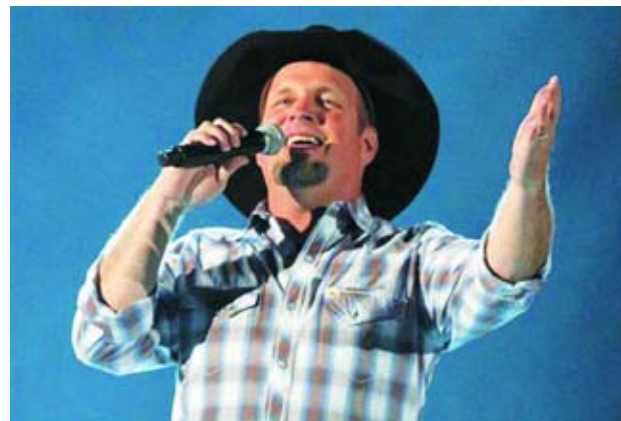
Garth Brooks sings "The Dance" as a tribute to Dick Clark at the 48th ACM Awards in Las Vegas, on 7 April, 2013.