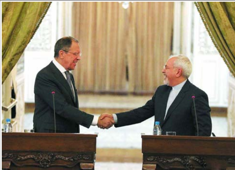
Iranian Foreign Minister Mohammad-Javad Zarif (R) shakes hands with his Russian counterpart Sergei Lavrov during a joint Press conference in Teheran, Iran, on 11 Dec, 2013. Lavrov said here Wednesday that his country support invitation of Iran to Geneva II talks on Syria.