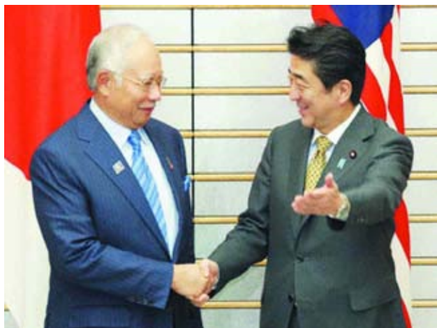
Malaysian Prime Minister Najib Razak (L) and Japanese Prime Minister Shinzo Abe shake hands before holding talks at Abe's office in Tokyo on 12 Dec, 2013.