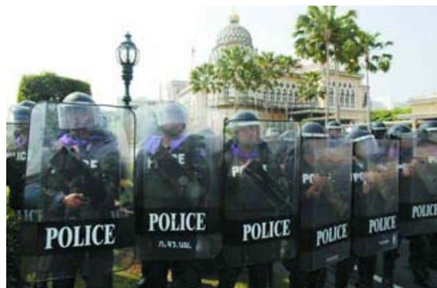
Riot policemen stand guard at the Government House during an anti-government protest in Bangkok 12 Dec, 2013.

His opponents are Thailand's royalist elite and establishment who feel threatened by his rise. Trade unions and academics see him as a corrupt rights abuser, while the urban middle class resent what they see as their taxes being used as his political war chest.—Reuters