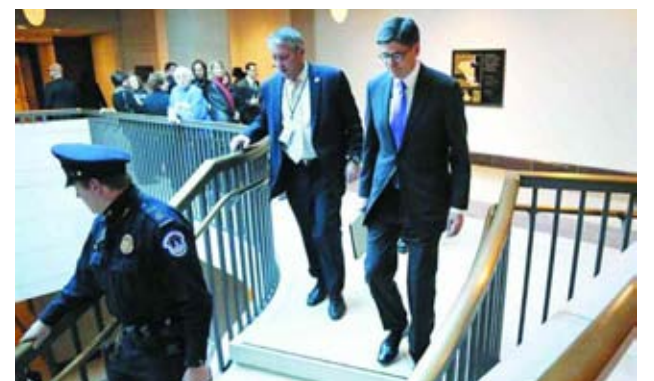
US Treasury Secretary Jack Lew (R) arrives to brief members of the US Senate on talks with Iran during a closed-door meeting at the Capitol in Washington, on 11 Dec, 2013.

However, the measure would impose the new sanctions only if the interim deal has gone nowhere in six months or Iran violates terms of the agreement. Supporters said that would comply with the adminis-