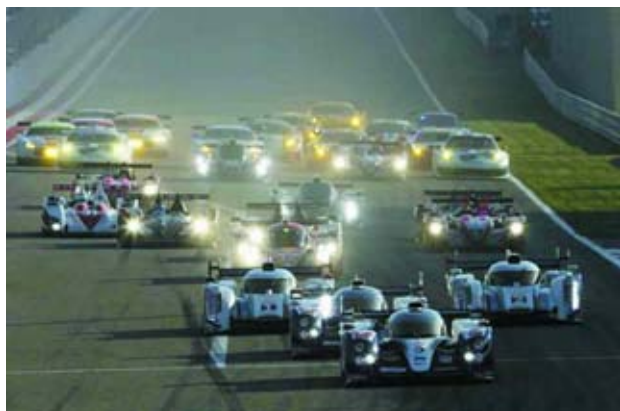
Race cars compete during the start of the final race of the 2013 World Endurance Championship (WEC) Six Hours of Bahrain at the Bahrain International Circuit (BIC) in Sakhir, south of Manama, on 30 Nov, 2013.

"The overall long-term interests of the championship will determine which can-