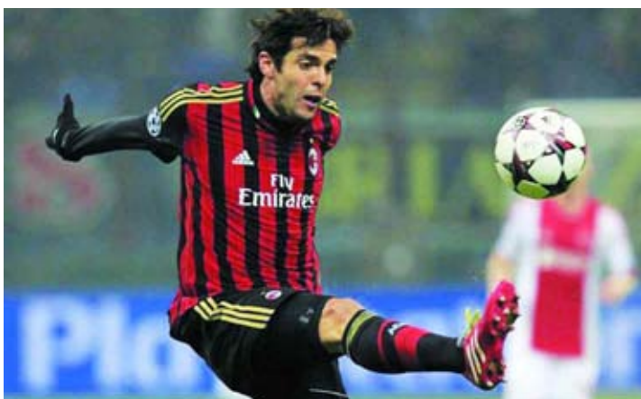
AC Milan's Kaka controls the ball during their Champions League group H soccer match against Ajax Amsterdam at the San Siro stadium in Milan on 11 Dec, 2013.

MILAN, 12 Dec — Three Ajax Amsterdam supporters were stabbed in Milan on Wednesday during fighting before the Champions League match against AC Milan and one is seriously hurt, Italian police said.