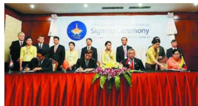
Guests sign a railway union memo during the 19th Ministerial Conference of the Greater Mekong Subregion's (GMS) Economic Cooperation Programme in Vientiane, capital of Laos, on 11 Dec, 2013. The meeting closed here on Wednesday. —XINHUA

GMS Programme was more relevant within the region and the global economy than ever. "We also agree that the RIF is the strategic blueprint that will guide our way forward. Moreover we are better aware of and better prepared for the challenges that we will face along the way," the document concluded. —Xinhua