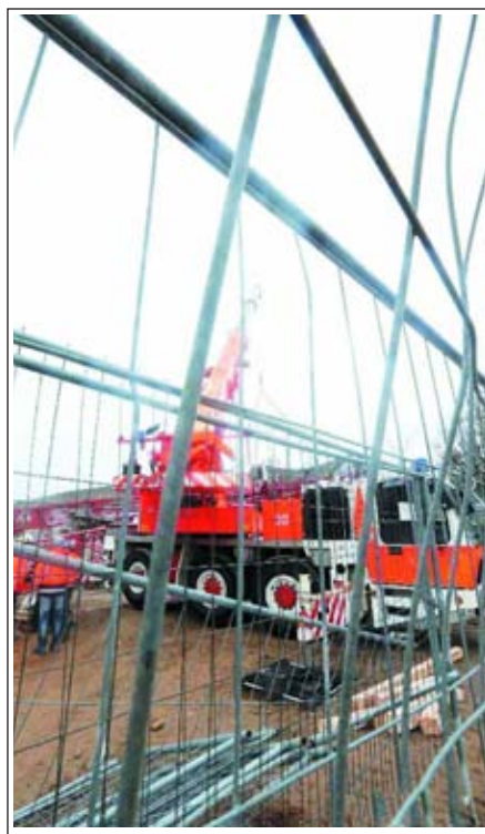
Rescuers work at the site of a crane accident in the German town of Bad-Homburg near Frankfurt, on 11 Dec, 2013. A construction crane crashed on a supermarket in the German town of Bad-Homburg near Frankfurt on Wednesday, causing at least one death and several injuries, local media reported.

It's not immediately known what caused the collision. Though the United States is reputed for its strict school bus safety code, such accidents are not uncommon.—Xinhua