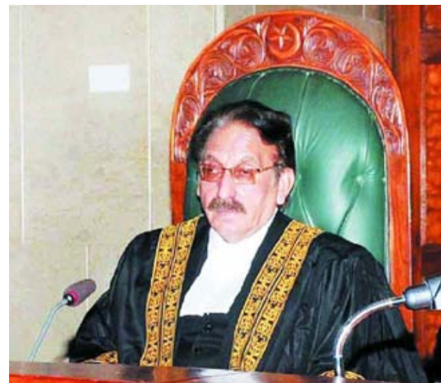
shows Chief Justice of Pakistan Mr Justice Iftikhar Muhammad Chaudhry presiding over Full Court meeting on the eve of his retirement at Supreme Court, in Islamabad, capital of Pakistan. Pakistan's longest serving chief justice of the Supreme Court, Iftikhar Muhammad Chaudhry, retired on Wednesday.

Judges of the apex court gathered at a special "Full Court Reference" in Islamabad on Wednesday and lauded the services rendered by Chaudhry as chief justice