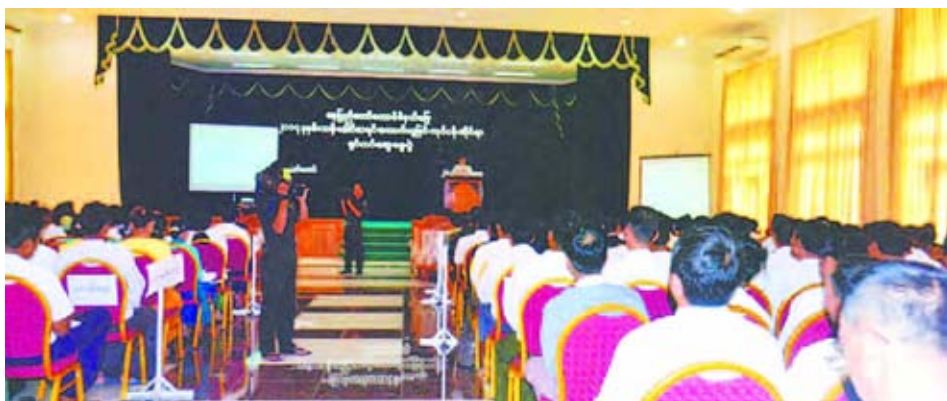
Officials make clarification on taking census 2014 in Nay Pyi Taw Council Area.

NAY PYI TAW, 25 Oct—A ceremony to clarify taking census in eight townships of Nay Pyi Taw Council Area was held at Zabuthiri Beikman Hall in Nay Pyi Taw Council Office on 20 October afternoon.