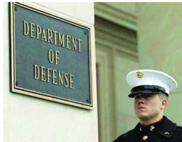
A United States Marine stands by his post in front of the Pentagon in Washington on 29 Feb, 2012.