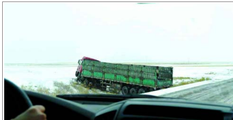
Photo taken on 23 Oct, 2013 shows a vehicle sliding out of the road in Hexigten Banner, north China's Inner Mongolia Autonomous Region. A heavy snowstorm hit Hexigten on Wednesday, affecting local traffic and local people's life.