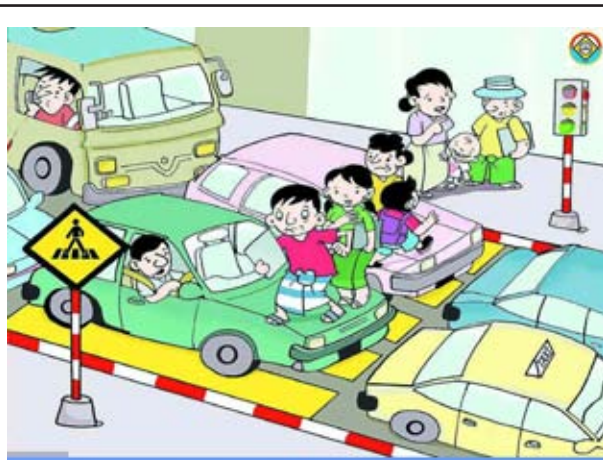
Stop! when pedestrians are at the zebra crossing

Meanwhile, classy banking system is a must to boost international trade. Stable inflation rate, balanced budget, foreign trade and exchange rate are requisite for the stability of the macro economy. We hope all the developments will be combined with proper management and right decisions to bring fortunes to Myanmar people.