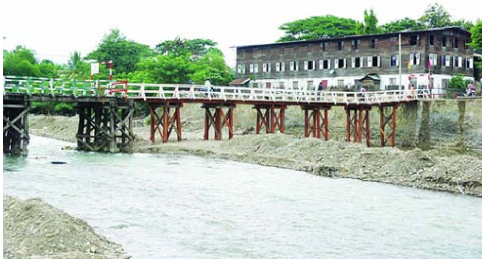
Newly-built temporary bridge across the creek in use for smooth transportation of local people.