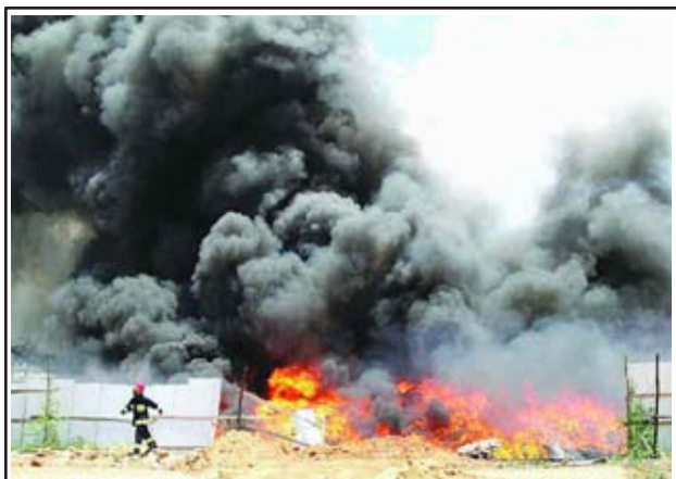
A fireman works at the fire scene in Dar es Salaam, Tanzania, on 24 Oct, 2013. A big fire broke out at a large rubber dumpsite on Thursday and no casualties were reported.