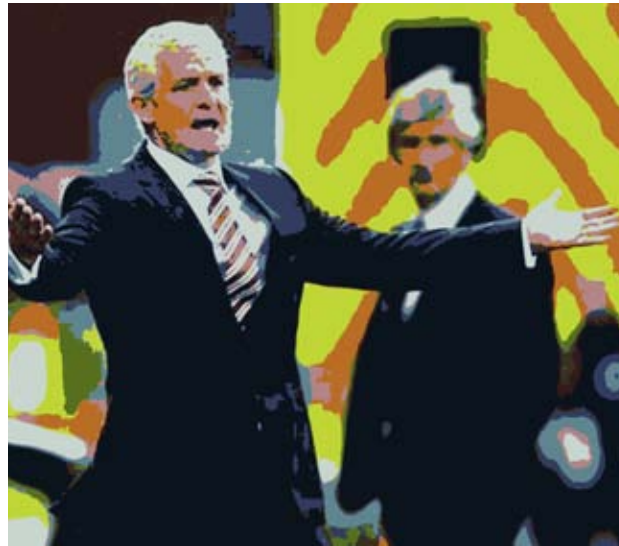
Stoke City manager Mark Hughes gestures during their English Premier League soccer match against Manchester City at the Britannia Stadium in Stoke-on-Trent on 14 Sept, 2013.

"Five or six defeats enable you to still be in the title race. Lose any more than six then you make it very difficult, nigh on impossible, for yourself."