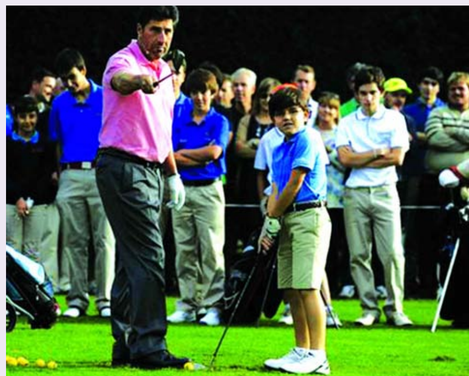
Spanish golfer Jose Maria Olazabal instructs a child during a golf clinic in La Barginiza, near Oviedo, northern Spain on 23 Oct, 2013.

“But I've always believed the Seve Trophy can be a very important tournament,” said Olazabal while