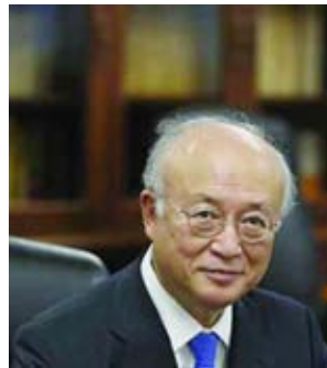
International Atomic Energy Agency (IAEA) Director General Yukiya Amano attends a meeting with Japan's Economy, Trade and Industry Minister Toshimitsu Motegi to talk about the tsunami-crippled Fukushima Daiichi nuclear plant issue at Motegi's ministry in Tokyo on 9 Oct, 2013.

“The meeting will provide an opportunity to exchange views on the way