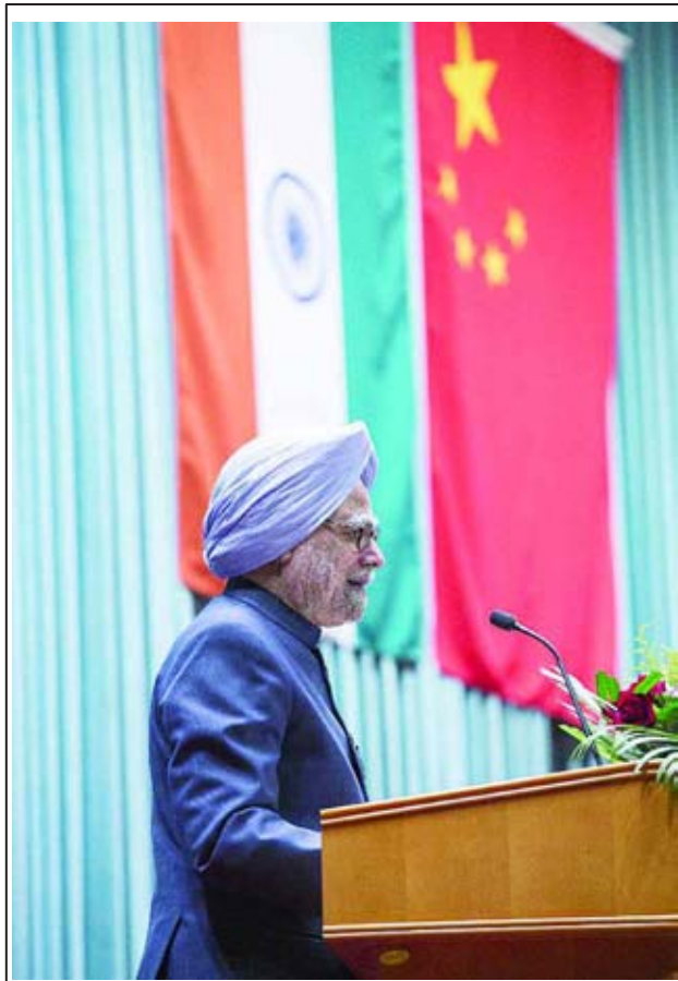
Indian Prime Minister Manmohan Singh delivers a speech at the Party School of the Communist Party of China (CPC) Central Committee in Beijing, capital of China, on 24 Oct, 2013. —XINHUA

"The threat is continuing to ease but we're still asking people to be vigilant because there is such a large amount of fires still active," an RFS spokeswoman told the Australian Associated Press (AAP). —Xinhua