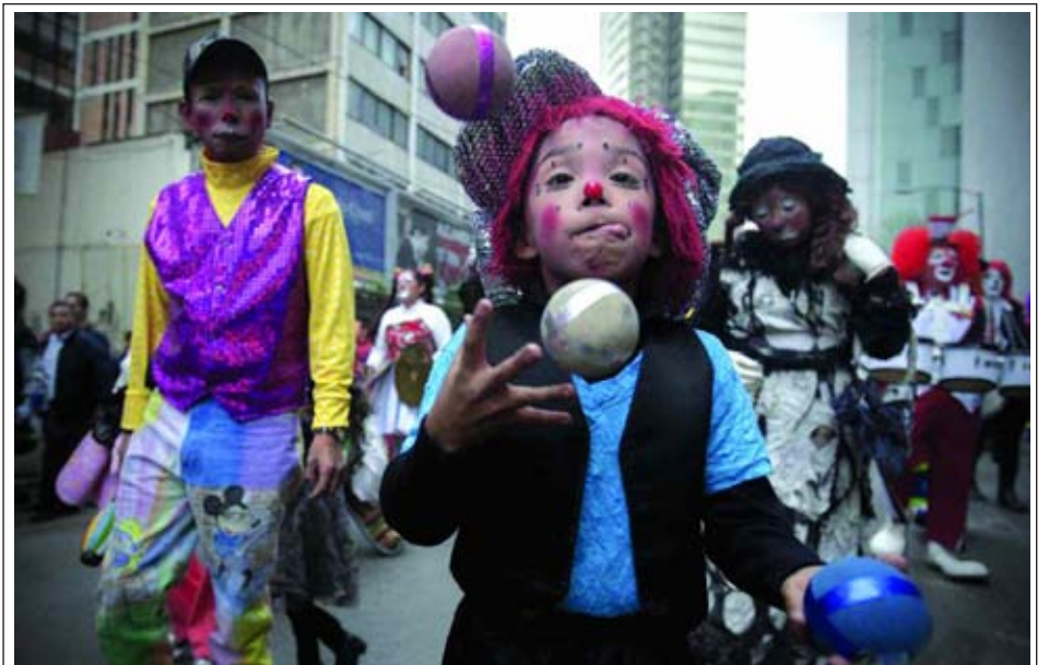
A clown child acts in a street during the 18th International Clown Convention, in Mexico City, capital of Mexico, on 23 Oct, 2013. The International Clown Convention takes place from 21 to 24 October.