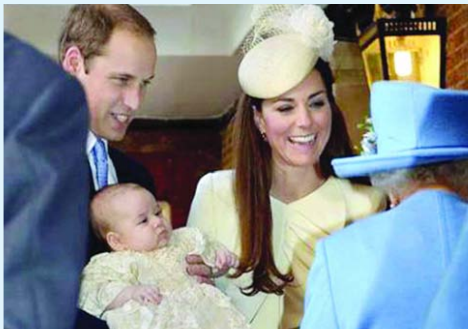
Britain's Prince William carries his son Prince George, as he arrives with his wife Catherine, Duchess of Cambridge for their son's christening at St James's Palace in London on 23 Oct, 2013.

ny in the 16th century St. James's Palace in central London.