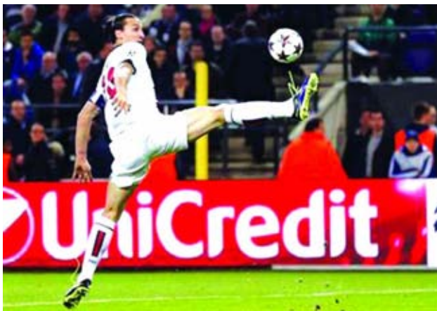
Paris Saint-Germain's Zlatan Ibrahimovic controls the ball during their Champions League soccer match against Anderlecht at Constant Vanden Stock stadium in Brussels on 23 Oct, 2013.