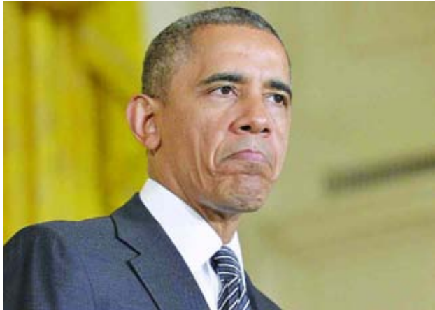
US President Barack Obama speaks on immigration reform during an event in the East Room of the White House in Washington DC, capital of the United States, on 24 Oct, 2013. US President Barack Obama called on Congress on Thursday to finish work on an immigration bill by the end of the year.

WASHINGTON, 25 Oct — US President Barack Obama on Thursday called on US Congress to move forward the immigration reform this year, after the once hot-button issue has been overshadowed for months in Washington.