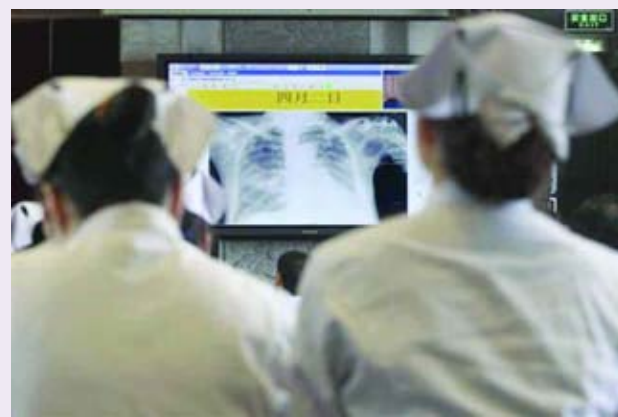
Doctors and nurses attend a training course for the treatment of the H7N9 virus at a hospital, where a H7N9 patient is being treated, in Hangzhou, Zhejiang Province, in this 5 April, 2013 file photo.

As things stand, 45 of the 136 people known to have contracted H7N9 bird flu in China and Taiwan have died—giving a case fatality rate of around 30 percent. Fouchier, who has already done so-called "gain of function" experiments with another strain of bird flu, H5N1, says we