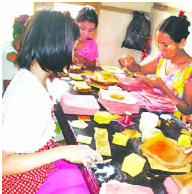
Workers at production of gold foils in Mandalay.

MANDALAY, 25 Oct—Gold foil production, a traditional industry in Mandalay, is booming in cold season and attracting tourists.