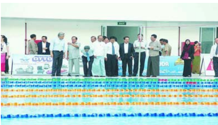
Ambassadors from ASEAN countries observing preparations for 27 th SEA Games.