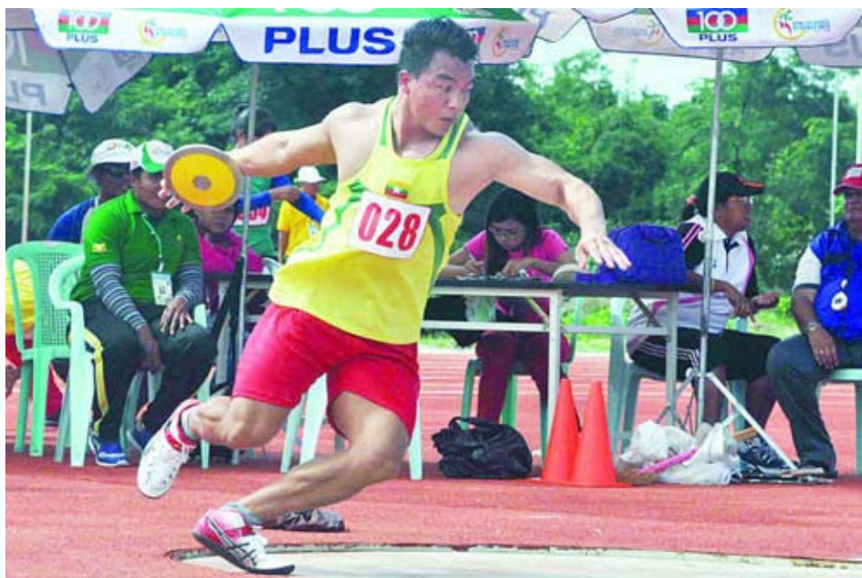
An athlete at posture of competing in discus event.