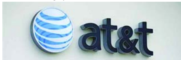
The AT&T logo is pictured by its store in Carlsbad, California, on 22 April, 2013.