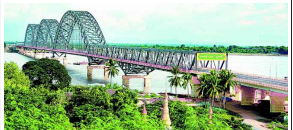
Photo shows the site proposed for construction of cargo port in Mandalay.

ities not only by train and ensure swift and smooth car but also through waterway transport daily. To flow of commodities, (See page 9)