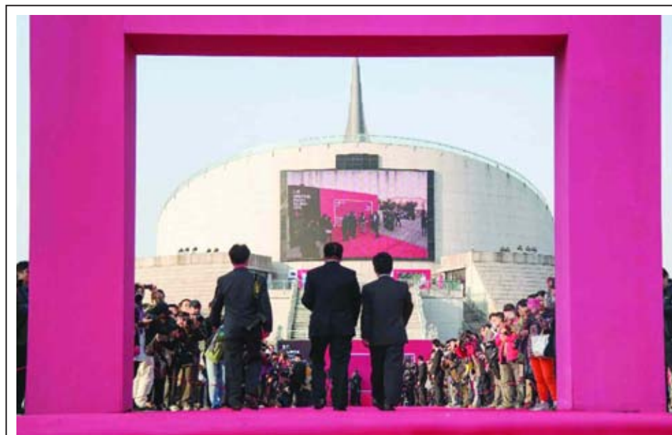
Photographers are seen during the opening ceremony of the Photo Beijing 2013 at the China Millennium Monument in Beijing, capital of China, on 24 Oct, 2013. The Photo Beijing 2013 kicked off on Thursday, offering photographers, curators and artists a platform of communication and cooperation.