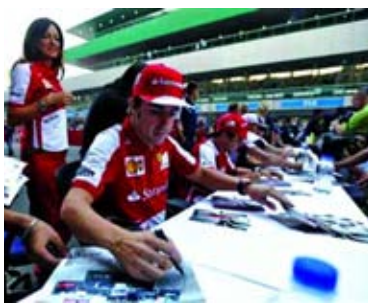
Ferrari Formula One driver Fernando Alonso (front) of Spain signs autographs for fans at the Buddh International Circuit in Greater Noida on the outskirts of New Delhi on 24 Oct, 2013.