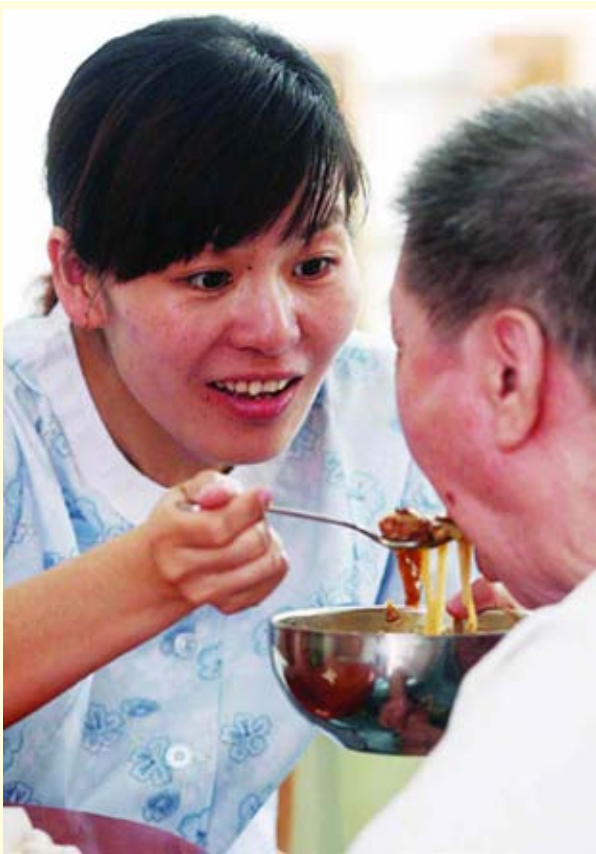
A staff member with a care center in Tianjin looks after an elderly man in June. Many people working in the public welfare industry could easily be suffering from depression.

from Hepatitis C, an infectious disease affecting the liver, according to a new law signed on Wednesday by New York State Governor Andrew Cuomo.” Hepatitis C is a debilitating and potentially fatal disease that disproportionately affects the baby boomer generation in