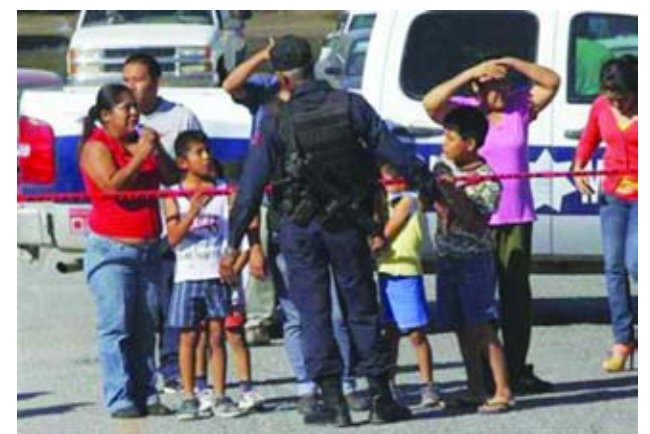
Family members of employees talk to a police officer after an explosion at a candy factory in Ciudad Juarez on 24 Oct, 2013.

CIUDAD JUAREZ, (Mexico), 25 Oct—A boiler exploded at a candy factory in northern Mexico on Thursday, killing one person, injuring dozens and badly damaging the building, officials said.