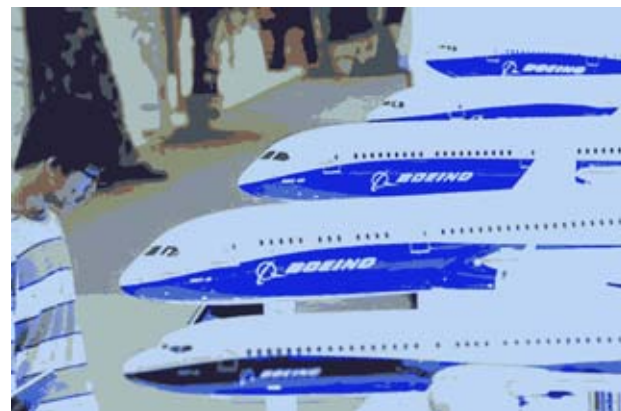
A visitor looks at a display of miniature Boeing passenger aircrafts at Aviation Expo China 2013 in Beijing in this 25 Sept, 2013 file photo.

WASHINGTON, 25 Oct — Major US weapons makers posted higher third-quarter profit on Wednesday despite budget cuts, their margins remained largely solid or rose in places, and revenue fell less than expected. But executives at the top four weapons makers—Lockheed Martin Corp (LMT.N), Boeing Co (BA.N), General Dynamics Corp (GD.N) and Northrop Grumman Corp (NOC.N)—said the outlook remains hazy given lingering uncertainty over defence budgets in the United States