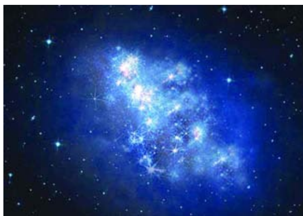
An artist's rendering of the galaxy, known by its catalog name z8_GND_5296, in seen this handout provided by NASA on 23 Oct, 2013.