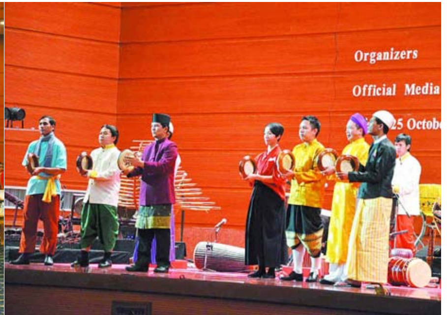
Vice-President Dr Sai Mauk Kham and party enjoy music fair to mark the 40 th anniversary of ASEAN-Japan Friendship and Cooperation in progress.

NAY PYI TAW, 25 Oct—A music fair to mark the 40 th anniversary of ASEAN-Japan Friendship and Cooperation took place at Myanmar International Convention Center (MICC) in Zabuthiri Township here this evening, attended by Vice-President