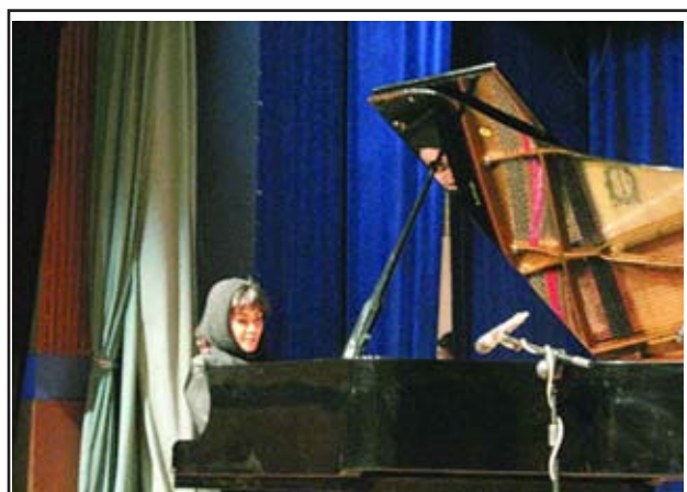
Japanese pianist Noriko Ogawa performs during a ceremony to kick off the Japan cultural week in Teheran, Iran, on 24 Oct, 2013.