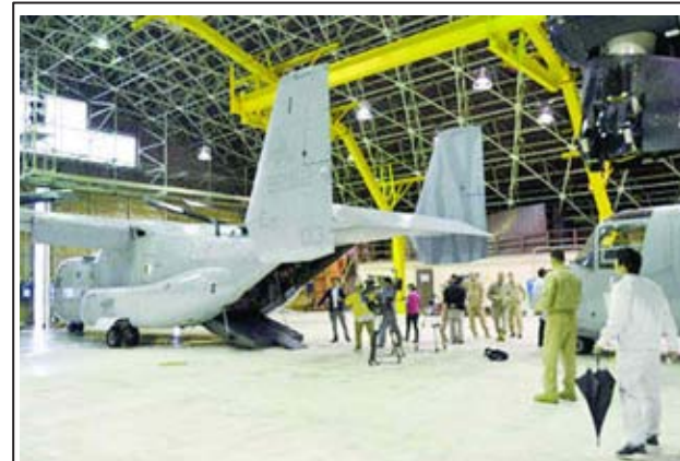
The US Marine Corps invites journalists to take a look at MV-22 Osprey tilt-rotor aircraft at the US Marine air station in Iwakuni, Yamaguchi Prefecture on 24 Oct, 2013.