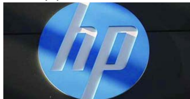
A Hewlett-Packard logo is seen at the company's Executive Briefing Center in Palo Alto, California on 16 Jan, 2013.