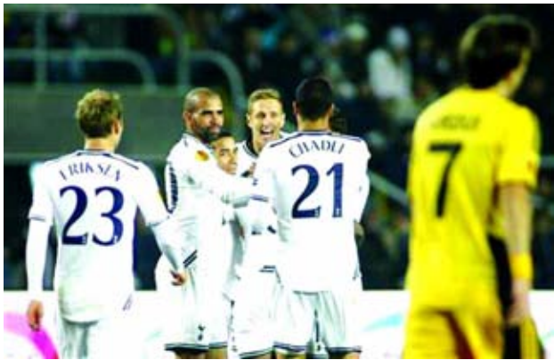
Tottenham Hotspur's players celebrate a goal scored by Jermain Defoe during their Europa League soccer match against Sheriff Tiraspol in Tiraspol, on 24 Oct, 2013.

LONDON, 25 Oct — Goals from Jan Vertonghen and Jermain Defoe left Tottenham Hotspur on the cusp of the Europa League knockout stages as four other clubs maintained perfect starts on Thursday.