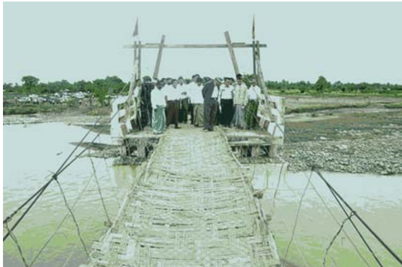
Inspection tour of Chief Minister U Tha Aye on repairing of damages of bridge in Kalay Township.

KALAY, 25 Oct—Chief Minister of Sagaing Region U Tha Aye, Sagaing Region Minister for Transport U Aung Zaw Oo, Region Minister for Planning and Economic U Sein Mung, departmental officials and chairmen of district and township management committees inspected