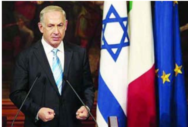
Israel's Prime Minister Benjamin Netanyahu gestures during a joint news conference with his Italian counterpart Enrico Letta during a meeting at Chigi Palace in Rome on 22 Oct, 2013.

JERUSALEM, 25 Oct — Israel said on Thursday it would press ahead with plans to build in existing Jewish settlements in the occupied West Bank and East Jerusalem, in an apparent bid to appease hardliners opposed to peace talks with the Palestinians.