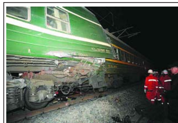
Photo taken on 24 Oct, 2013 shows the train collision site on the Qinghai-Tibet railway line in northwest China's Qinghai Province. One person was killed and three others were seriously injured after an empty train hit a parked passenger train on the Qinghai-Tibet railway line in Qinghai on Wednesday. The collision happened at around 8:10 pm when the empty train, operated by Golmud East Railway Station, crashed into the No 7581 passenger train just outside the station.

If convicted, the two men may face the death penalty.—Xinhua