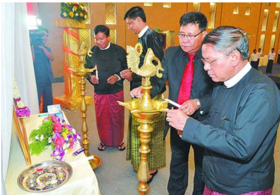
Ceremony to ignite the light in commemoration of Deepavali Day at Myanmar International Convention Centre in progress.

NAY PYI TAW, 25 Oct—A reception on the eve of Deepavali Day organized by Myanmar-Indian entrepreneurs association, was held at Myanmar International Convention Centre,