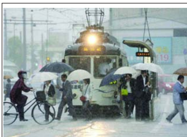
Commuters head to work in heavy rain in Kochi, western Japan, on 25 Oct, 2013. Typhoon Francisco was approaching Japan that morning.