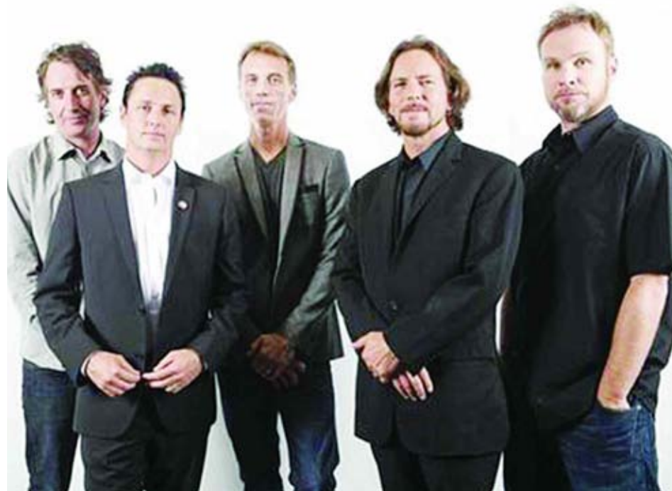
Members of the band Pearl Jam (L-R), Stone Gossard, Mike McCready, Matt Cameron, Eddie Vedder, and Jeff Ament of the film "Pearl Jam Twenty" pose during the 36th Toronto International Film Festival (TIFF) in Toronto, on 10 Sept, 2011.