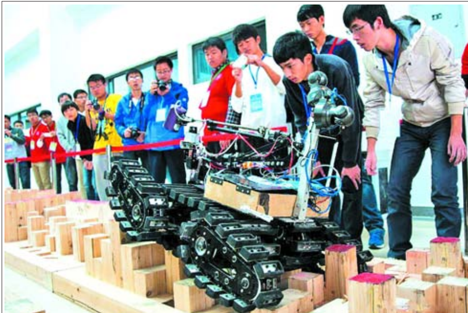
Contestants control a robot during the 2013 China Robot Competition and the Robocup China in Hefei, capital of east China's Anhui Province, on 19 Oct, 2013. Over 2,000 contestants from 180 colleges and universities took part in the competition.