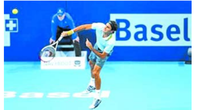
Switzerland's Roger Federer serves the ball during his match against Adrian Mannarino of France at the Swiss Indoors ATP tennis tournament in Basel on 21 Oct, 2013.