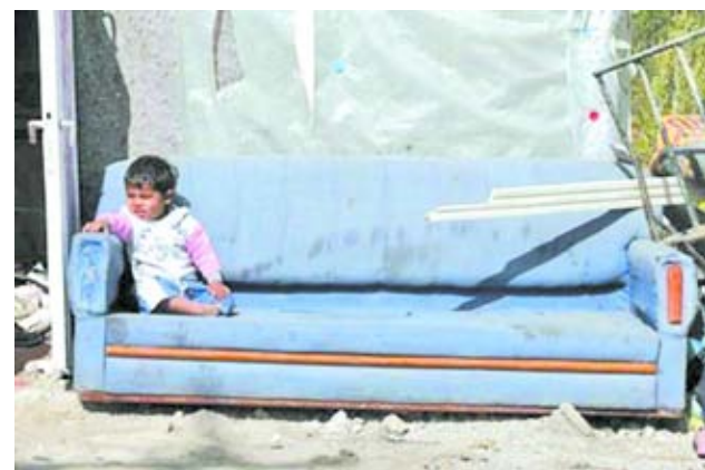
A Syrian refugee boy sits on a couch collected from garbage in central Ankara on 5 Oct, 2013.