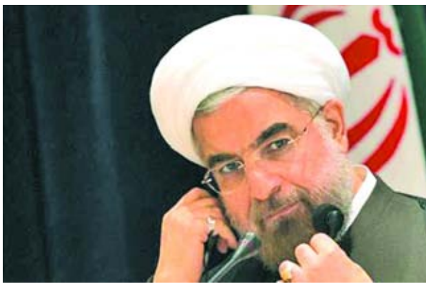
Iran's President Hassan Rouhani takes questions from journalists during a news conference in New York on 27 Sept, 2013.

Iran denies it is after nuclear weapons, saying its uranium enrichment pro-