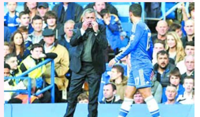
Chelsea's manager Jose Mourinho gestures as he speaks to Eden Hazard during their English Premier League soccer match against Cardiff City at Stamford Bridge in London, on 19 Oct, 2013.

"I just want to know the reason why the referee stopped me doing my work. To be with the fans was not funny. It was not funny. It's frustrating."—Reuters