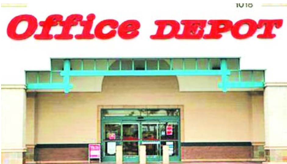
An Office Depot store is pictured in Encinitas, California, on 19 Feb, 2013.

NEW YORK, 22 Oct — Office Depot (ODP.N) and OfficeMax Inc (OMX.N) are set to receive regulatory approval for their planned merger as the Federal Trade Commission has concluded the deal is not likely to substantially lessen competi-