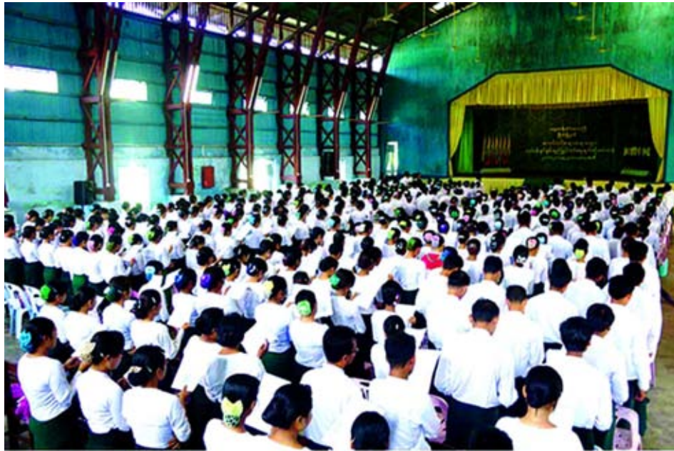
Basic education teachers seen at Capacity Enhancement Short-Term Course for basic education teachers in Myeik.

Altogether 428 teachers are attending the training course up to 23 October.— Kyemon-Myeik District IPRD