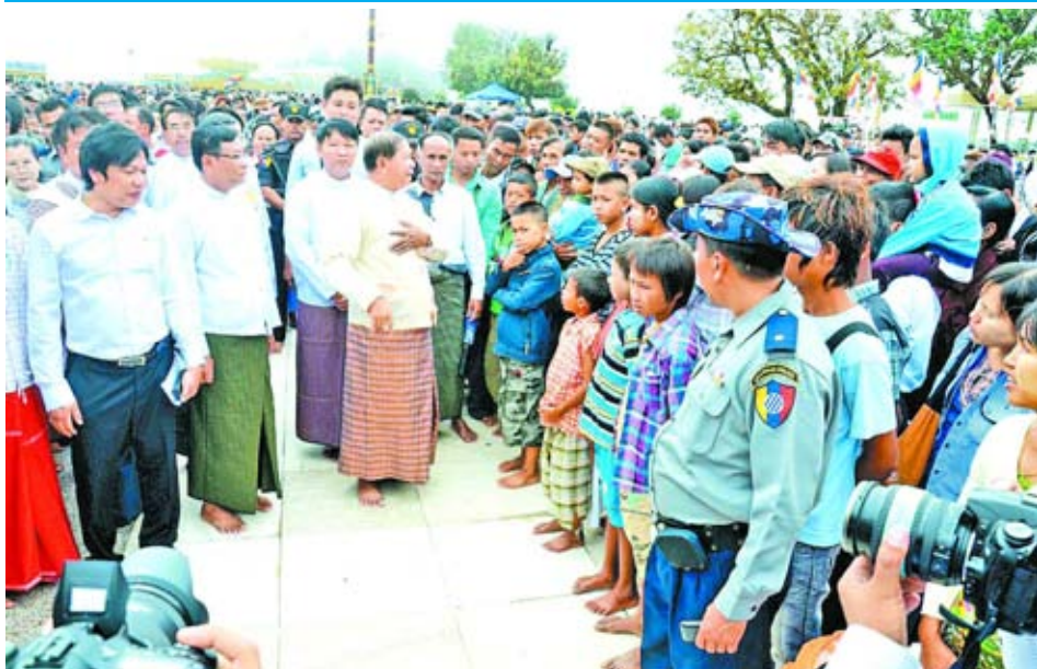
Chief Minister of Mon State U Ohn Myint cordially converses with pilgrims at consecration and Buddha Pujaniya of Kyaikhtyoe Pagoda on Fullmoon Day of Thadingyut.