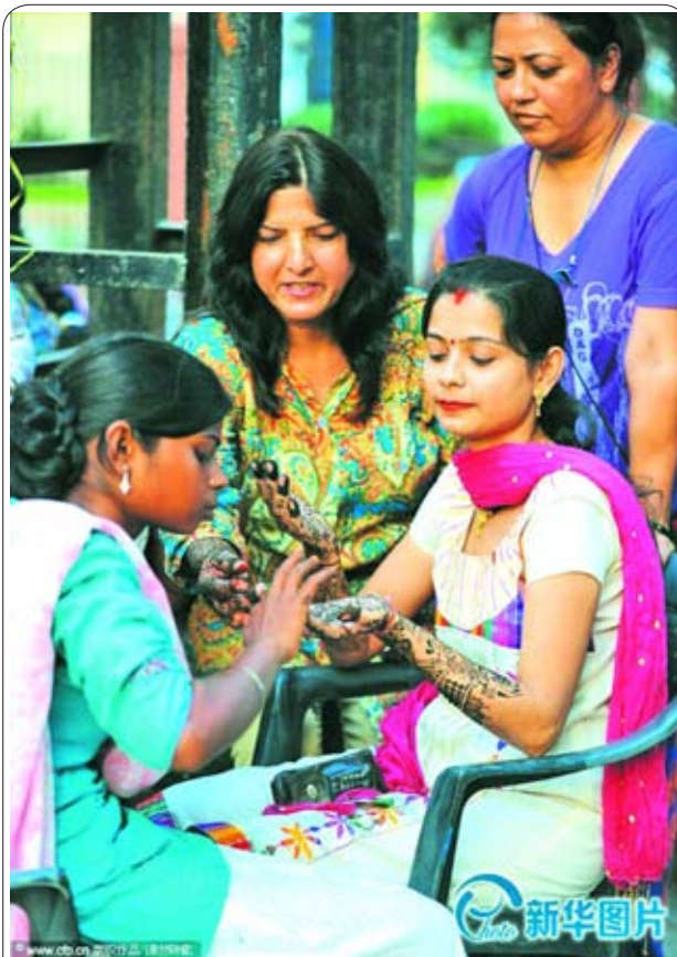
Hand painting in India.