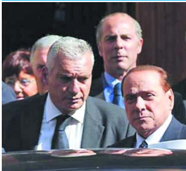
Italian center-right leader Silvio Berlusconi sits in his car as he leaves the Senate in Rome, on 2 Oct, 2013.