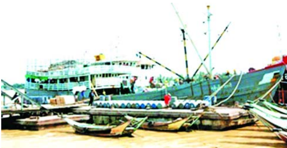
YANGON, 22 Oct—A total of 421 barrels of crude palm oil were unloaded from