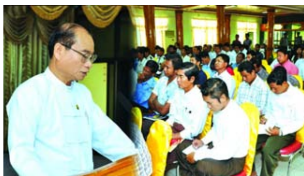
A course on hotel security in progress.

NAY PYI TAW., 22 Oct — A security course was opened at Zegyo Hotel in Mandalay yesterday as part of efforts for training staff of the hotels for security measures.