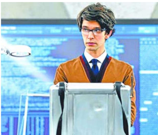
Ben Whishaw in a still from the movie Skyfall