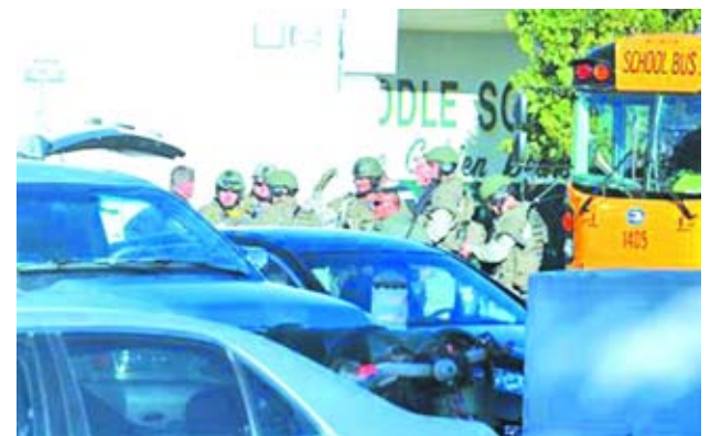
Police officers are at the shooting scene at the Sparks Middle School in Sparks, Nevada, on 21 Oct, 2013.

"And then he walked up to a teacher and says back up. The teacher started backing up and he pulled the trigger." "The teacher was just lying there and he was limp," he told KOLO. "And me and five other friends went to him and said come on we've got to get him to safety. We picked him up, carried him a little bit far and we left him because our vice principal came along