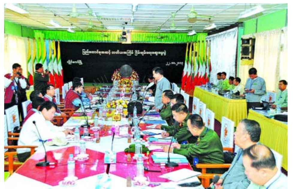
Union level peace talks between Union Peace-making Work Committee and Karen National Progressive Party (KNPP) in progress.—MNA

He highlighted the nationwide ceasefire agreement signing ceremony that