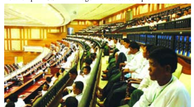
Visitors observe 12 th day eighth regular session of first Pyithu Hluttaw.—MNA

NAY PYI TAW, 22 Oct—A group comprising 185 members of Magway Township Union Solidarity and Development Party of Magway Region, 60 members of Padaung Township USDP Bago Region (West) and 20 members of Nay Pyi Taw Lewe Township USDP this morning observed process of the 12 th day eighth regular session of first Pyithu Hluttaw and looked round Hluttaw complex.—MNA