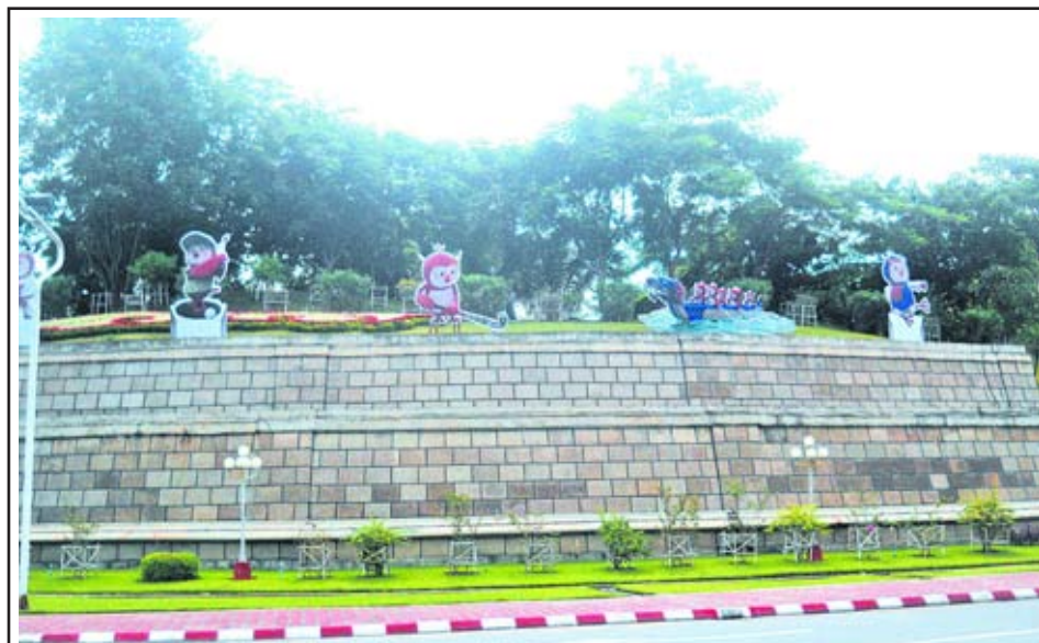
MASCOTS HAIL SEA GAMES: As a gesture of hailing XXVII SEA Games, mascots of SEA Games seen at the walls near Thabyegon roundabout with beautiful scenes of neat and tidy landscapes in Nay Pyi Taw.