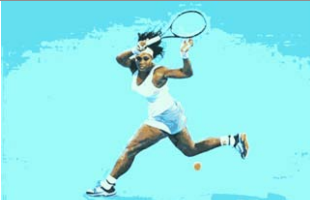
Serena Williams of the US runs to return a shot during her women's singles final match against Jelena Jankovic of Serbia at the China Open tennis tournament in Beijing on 6 Oct, 2013.