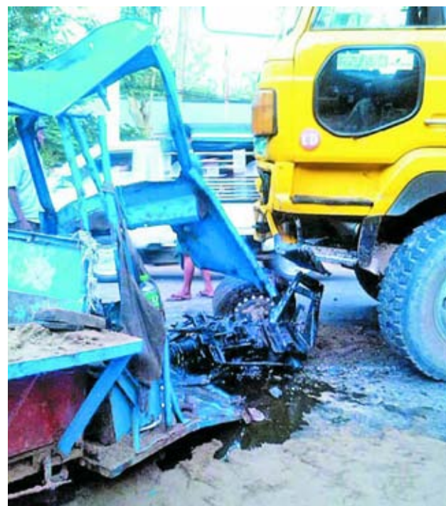
Photo shows collision between 10-wheeled truck with timber load and sand carrier trawlergy in front of Settlement and Land Records Department on Kyaikkhauk Pagoda Road in Thanlyin Township of Yangon South District on 20 October.