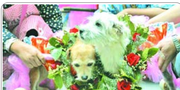
Bride dog "Lanlan" and groom dog "Guaiguai" (R) wear garlands during their wedding at the Home of Rescued Animals, in Chengdu, Sichuan Province, on 18 Oct, 2013.