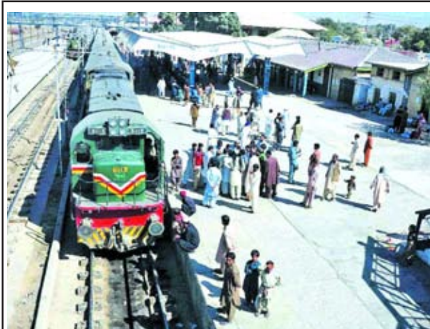
Pakistani passengers wait at a railway station after the suspension of train services following a bomb explosion hitting a passenger train in southwest Pakistan's Quetta, on 21 Oct., 2013. At least five people were killed and 15 others injured when a blast hit a passenger train in Pakistan's southwest province of Balochistan on Monday morning, local media Geo reported.

A final version of the report will be issued in two months time, according to Lentijo.—Kyodo News