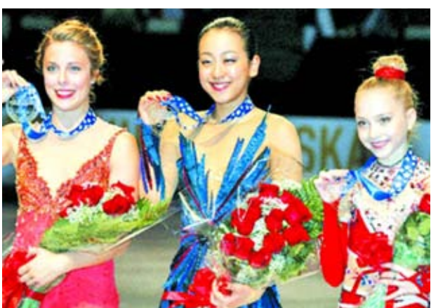
Mao Asada (C) of Japan, Ashley Wagner (L) of the United States and Elena Radionova (R) of Russia show their medals at Skate America in Detroit, Michigan, on 20 Oct, 2013. Asada won with a total of 204.55 points, followed by Wagner at 193.81 points and Radionova at 183.95 points.

BEIJING, 22 Oct — Police say a man is in custody after he shot dead two women at a Detroit senior centre. The shooting happened