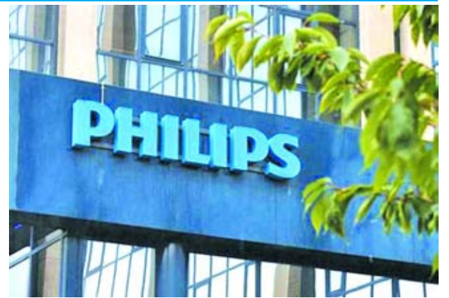
The logo of Philips is seen at the company's entrance in Brussels on 11 Sept, 2012.

plans to buy Naperville, Illinois-based OfficeMax on 20 February in an all-stock deal worth $976 million that will combine the nation's second and third largest office-supply superstores. The companies declined to comment on the report.—Reuters