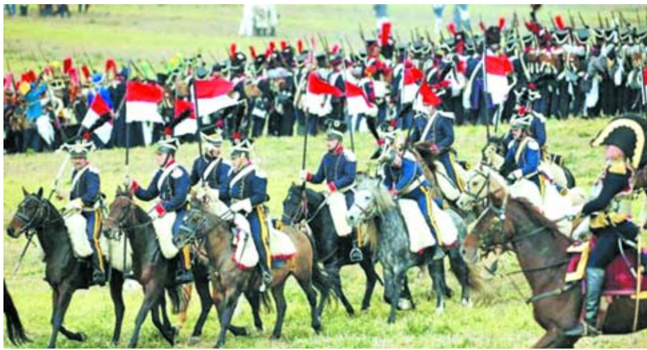
Performers wearing 19th century French forces military uniforms ride their horses during a re-enactment of the Battle of the Nations in a field in the village of Markleeberg near Leipzig on 20 Oct, 2013.