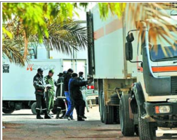
Gendarmes, firefighters and police officers transport bodies of victims of the hostage crisis at a hospital in In Amenas, Algeria, on 21 Jan, 2013. Algerian Prime Minister Abdel Malek Sellal said here on Monday that 37 hostages were killed and another five remain missing in the hostage crisis at a gas facility in southeastern Algeria.—XINHUA

protect their rights and provide appropriate conditions, said Bandar bin Mohammed Al-Aiban, president of the Saudi Human Rights Commission. They included a ban on outdoor work in the heat between mid-day and 3 pm from June to August, when temperatures are usually higher than 40 degrees Celsius (104 Fahrenheit) and can soar to 50 degrees. "With regard to women's rights, the Islamic Sharia (law) guarantees fair gender equality and the state's legislative enactments do not differentiate between men and women," he said.—Reuters