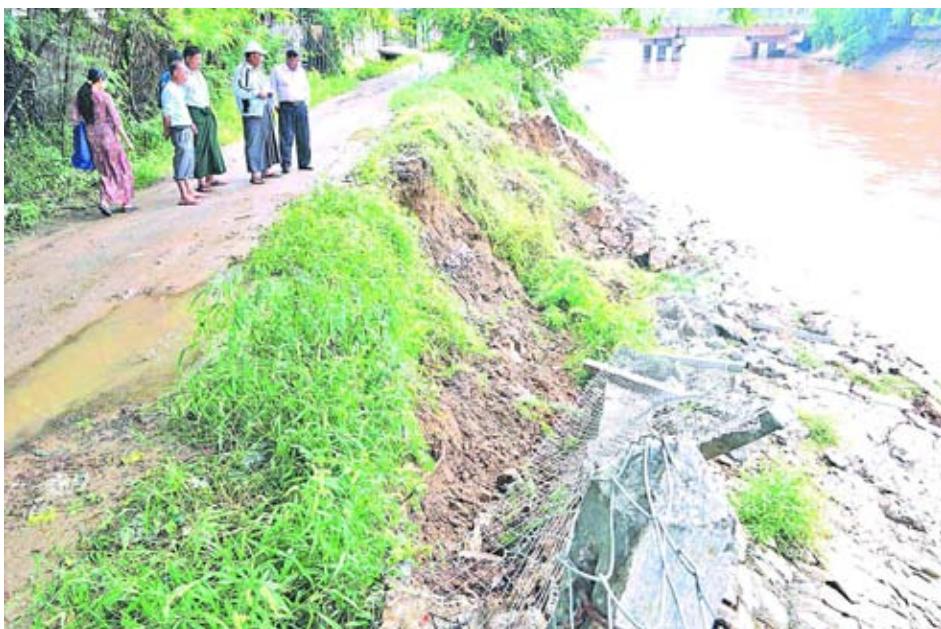
Retaining walls collapse into Zawgyi River in heavy rain in Kyaukse.

KYAUKSE, 22 Oct—Heavy rains on 19 October caused bank collapse at three places of Zawgyi River in Kyaukse Township.