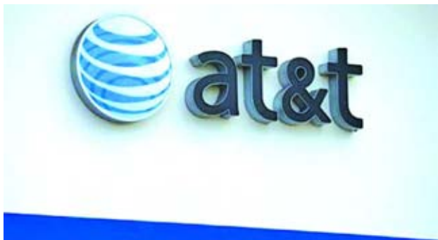
The AT&T logo is pictured by its store in Carlsbad, California, on 22 April, 2013.

NEW YORK, 22 Oct — Wireless infrastructure provider Crown Castle International Corp (CCI.N) said on Sunday that it had agreed to buy rights to about 9,700 AT&T Inc (T.N) wireless communication towers for $4.85 billion in cash. Under the agreement, Crown Castle will purchase some 600 towers and have the exclusive