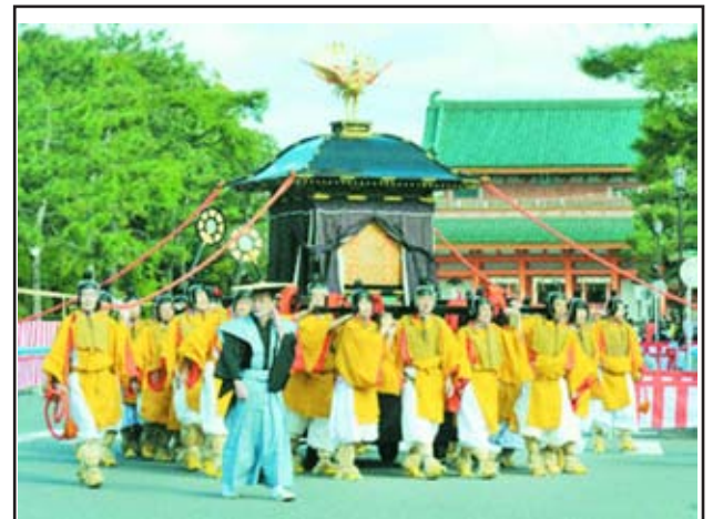
People wearing historical costumes parade after leaving the Heian Shrine for the Kyoto Imperial Palace in Kyoto on the morning of 22 Oct, 2013, to mark the annual Jidai Matsuri (Festival of Eras), one of the three biggest festivals in the ancient Japanese capital.