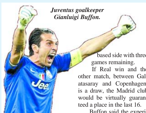
Juventus goalkeeper Gianluigi Buffon.

Ancelotti promised attacking, entertaining football at his presentation but