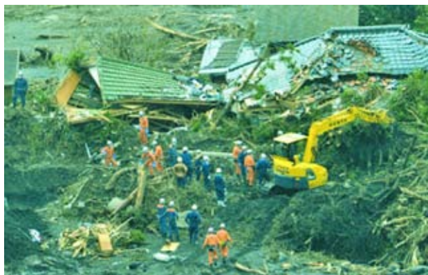
Photo taken from a Kyodo News helicopter shows the search for the missing, which resumed on 21 Oct, 2013, on the island of Izu Oshima, south of Tokyo. Typhoon Wipha on 16 October brought torrential rain to the island, causing mudslides that destroyed houses and buried residents alive. According to police and local authorities, 27 people have been confirmed dead.

As of Sunday night, some 590 evacuees were in shelters. Typhoon Wipha, the 26th of the year,