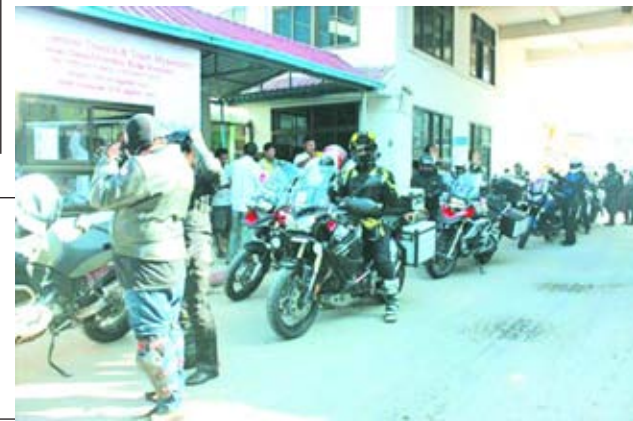
Thai tourists riding motorcycles and pickup truck seen at border gate in Myawady.