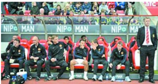
Manchester United's manager David Moyes (R) reacts with his coaches on the bench ahead of their English Premier League match against Sunderland at The Stadium of Light in Sunderland, northern England, on 5 Oct, 2013.

United made a flying start in the Champions League, beating Bayer Leverkusen 4-2 at home in their opener but then drew 1-1 in Donetsk.—Reuters