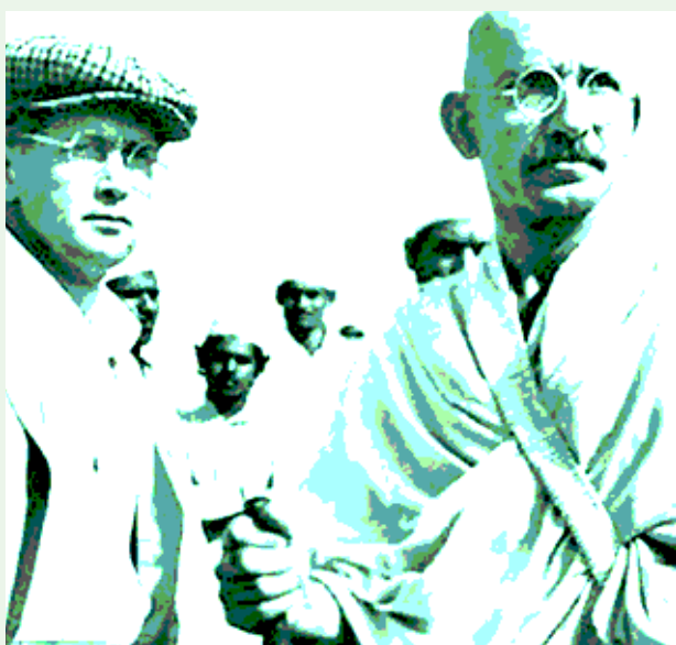
Martin Sheen in a still from Gandhi