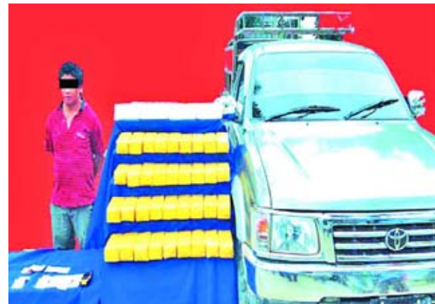
A file of lawsuit was opened against the drug trafficker.—Kyemon-Police Information

The Ice will be reportedly sent to Monghsat from Tachilek.