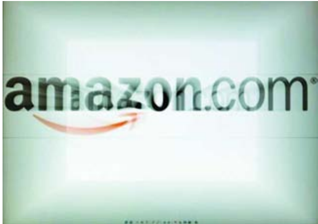
A zoomed image of a computer screen showing the Amazon logo is seen in Vienna on 26 Nov, 2012.