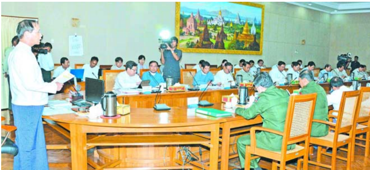
Vice-President Dr Sai Mauk Kham delivers an address at first meeting of Human Resources Development Plan Implementation Central Committee.

NAY PYI TAW, 22 Oct—“Lack of human resources development would make a country lag behind the development,” said Chairman of Human Resources Development Plan Implementation Central Committee Vice-President Dr Sai Mauk Kham at Central Committee’s meeting Union government office here today.