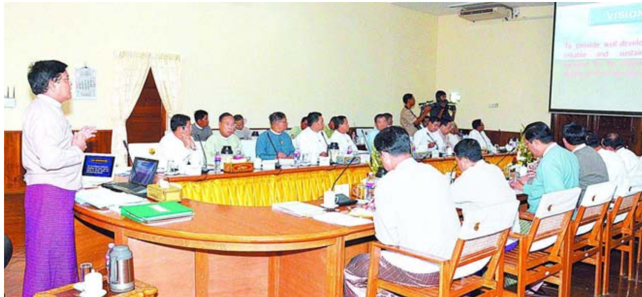
Vice-President U Nyan Tun addresses National Energy Management Committee meeting at Ministry of Energy.

NAY PYI TAW, 22 Oct —Patron of National Energy Management Committee Vice-President U Nyan Tun called on experts from development partnership organizations and officials of ministries concerned to give comprehensive sug-