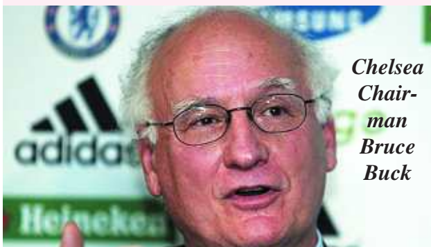
Chelsea Chairman Bruce Buck

LONDON, 11 Oct— Rules forcing European football clubs to cut their financial losses will make it harder for smaller teams to challenge the game's elite, Chelsea Chairman Bruce Buck said on Thursday.