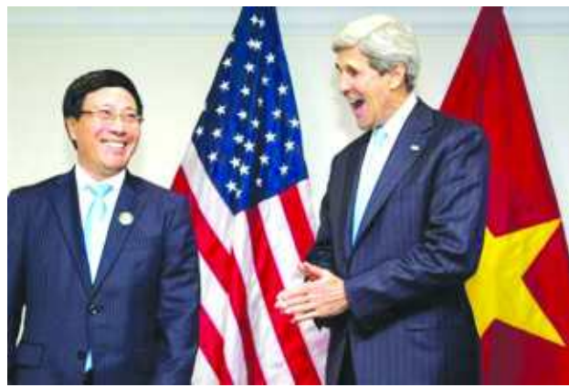
US Secretary of State John Kerry (R) and Vietnam's Foreign Minister Pham Binh Minh smile during an Association of Southeast Asian Nations (ASEAN) meeting in Bandar Seri Begawan on 2 July, 2013.

Vietnam has the second-largest market after