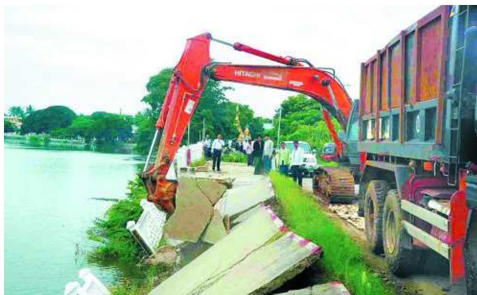
Collapsed corridor under repair at Meiktila Lake.