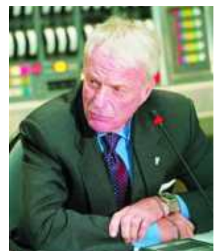
Mercury astronaut Scott Carpenter listens to questions during a Press conference at the Kennedy Space Centre Visitors Center in Florida in this file photo from 24 Feb, 2002.

"I still remember what a thrill it was being up there—I liked the feeling of weightlessness, and the view I had of Earth," Carpenter told the University of Colorado's alumni magazine last year. The other Mercury astronauts had piloted fighter jets during the Korean War, but Carpenter mostly flew surveillance in multi-engine propeller planes.—Reuters