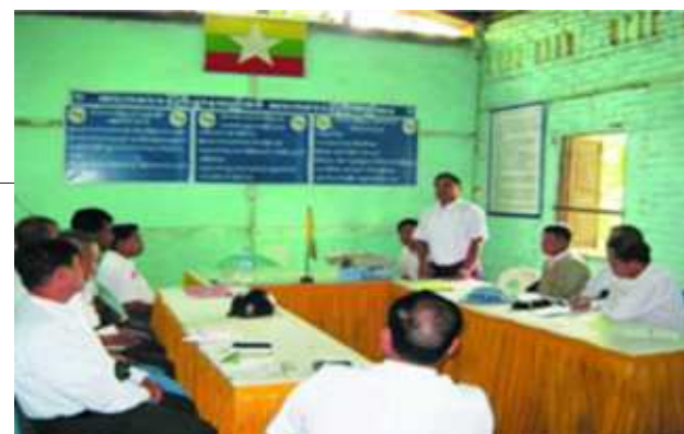
Meeting on construction of Sports and Physical Education Department in Myanaung Township in progress.

The SPED Office will be built north of Aungzeya Gymnasium and near the wall of Basic Education High School (Naychi) within two months.—Kyemon-Nay Win Zaw (Myanaung)