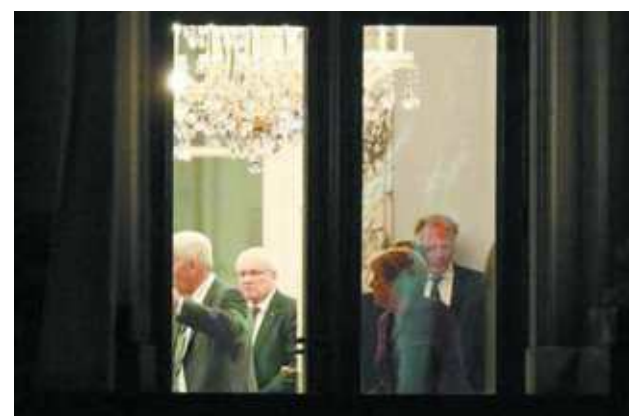
German Chancellor and leader of the Christian Democratic Union (CDU) Angela Merkel (2nd R) stands up at the end of preliminary coalition talks between Germany's conservative (CDU/CSU) parties and the Green party at the Parliamentary Society in Berlin on 10 Oct, 2013.

The chances the CDU/CSU and Greens would move onto more formal coalition talks are not seen as high due to animosities between the arch-conservative CSU and the Greens, a