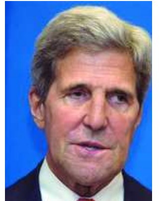
US Secretary of State John Kerry speaks during a news conference in Kuala Lumpur on 10 Oct, 2013.