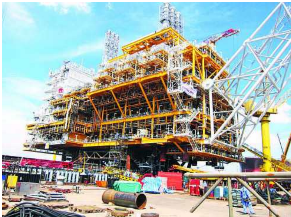
Photo shows Zawtika Processing and Living Quarters for Zawtika Natural Gas Exploration Project being implemented as joint venture between Myanmar Oil and Gas Enterprise and PTTEPI of Thailand through PSC contract in Block M9 offshore Mottama of Myanmar.

NAY PYI TAW, 11 Oct— Union Minister for Energy U Zeyar Aung and party attended the ceremony to launch Sail-Away Ceremony to send Zawtika Processing and Living Quarters to the offshore block of Myanmar so as to implement Zawtika natural gas exploration project being undertaken as joint venture by Myanmar Oil and Gas Enterprise and PTTEPI Co of Thailand on Block M9.