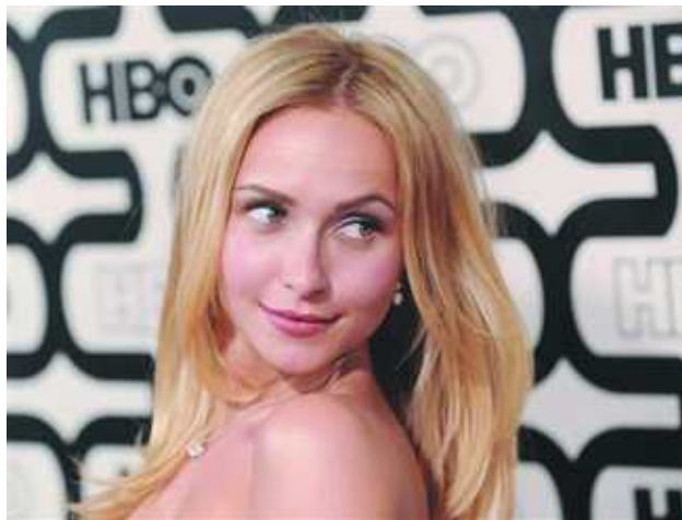
Actress Hayden Panettiere