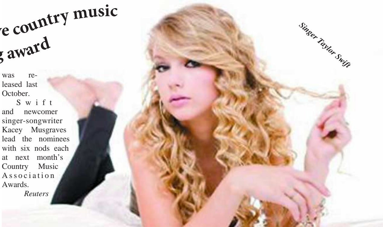
Singer Taylor Swift