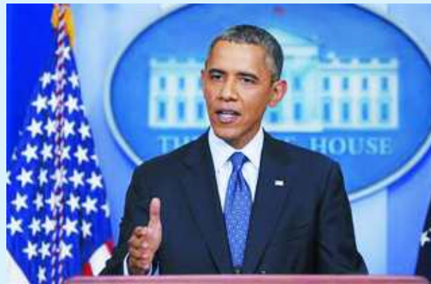
US President Barack Obama speaks about the continuing government shutdown from the White House Briefing Room in Washington, on 8 Oct, 2013.

That would help ensure that large numbers of enrollees — especially healthy young adults needed to make the programme work finan-