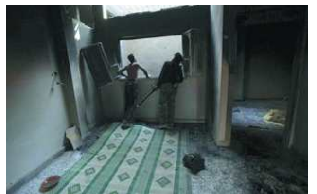
A Free Syrian Army fighter and a civilian look up from a window as they stand inside a room in Deir al-Zor on 10 Oct, 2013.