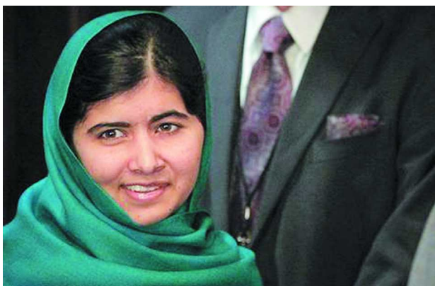
Pakistan’s Malala Yousafzai arrives for a photo opportunity before speaking at an event in New York, on 10 Oct, 2013.

NEW YORK, 11 Oct — Pakistani teenager Malala Yousafzai, who was shot in the head by the Taliban for campaigning for girl’s education, spoke on Thursday