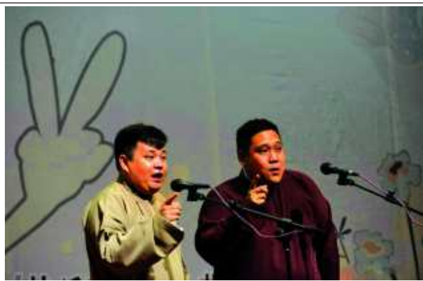
Contestants perform traditional crosstalk show during the 4th Beijing Youth Crosstalk Festival and Competition in Beijing, capital of China, on 9 Oct, 2013.

He said fires could start easily under these conditions and have the chance of affecting people in a matter of minutes.—Xinhua