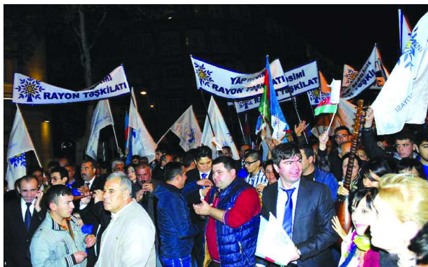
Supporters of Azerbaijan’s incumbent President Ilham Aliyev celebrate the victory in the country’s presidential election in Baku, capital of Azerbaijan, on 9 Oct, 2013.

Hasanly, 61, a former lawmaker who has united Azerbaijan’s fractured opposition for the first time in a presidential election, told journalists: “When (officials) announce the final official results of the election and declare Ilham Aliyev as the president, we will address the Constitutional Court with a demand to cancel the election results.”