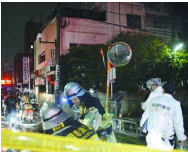
Photo taken on the morning of on 11 Oct, 2013, shows an orthopedic hospital in the southwestern Japan city of Fukuoka, where a fire broke out earlier that morning. Ten people were confirmed dead after the fire.