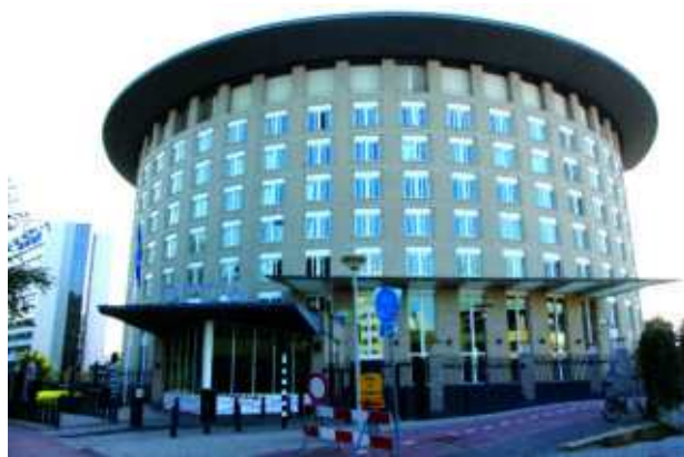
File photo from September 2013 shows the headquarters of the Organization for the Prohibition of Chemical Weapons in The Hague, the Netherlands. The Norwegian Nobel Committee awarded the 2013 Nobel Peace Prize to the OPCW on Oct. 11, 2013, "for its extensive efforts to eliminate chemical weapons."