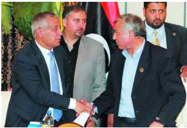
Libyan Prime Minister Ali Zeidan (L), who has been released several hours after he was taken from a Tripoli hotel by former rebel militiamen, shakes hands with President of the Libyan General National Congress Nouri Abusahmain during a press conference at the government headquarters in Tripoli, on 10 Oct, 2013.