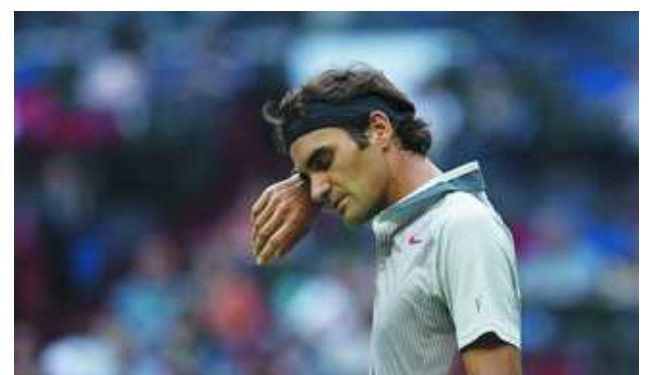
Roger Federer of Switzerland reacts after losing a point during his men's singles tennis match against Gael Monfils of France at the Shanghai Masters tennis tournament in Shanghai on 10 Oct, 2013.

Monfils will play top seed and defending champion Djokovic in the quarter-finals after the Serb defeated Fabio Fognini of Italy 6-3, 6-3.