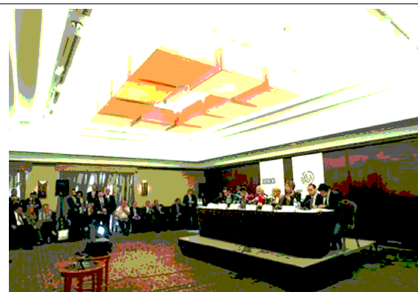
Monitors from the Organisation for Security and Cooperation in Europe (OSCE) attend a news conference in Baku on 10 Oct, 2013.

ference degenerated into chaos as journalists from pro-government media drowned out the observers and shouted “The OSCE is biased.”