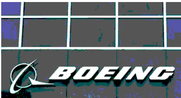
The Boeing logo is seen at their headquarters in Chicago, on 24 April, 2013.

NEW YORK, 11 Oct — Boeing Co (BA.N) said on Thursday that it will restructure its commercial airplane strategy and marketing functions, just days after it lost a $9.5 billion order in Japan, previously its most secure market. The action, announced in a memo by Boeing Commercial Airplane Chief Executive Ray Conner that was obtained by Reuters, follows Japan Airlines Co Ltd's (9201.T) decision on Monday to pick Airbus planes to replace its Boeing 777s, rather than the next-generation Boeing 777X model.