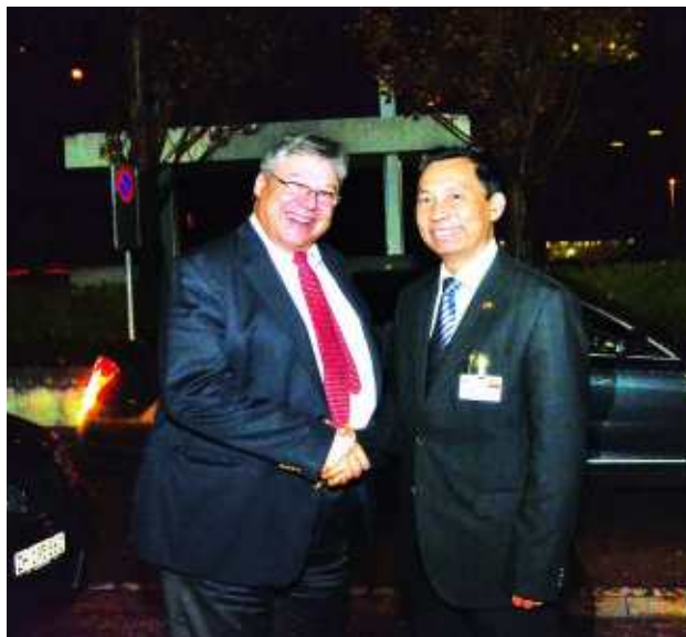
Speaker of Pyidaungsu Hluttaw and Pyithu Hluttaw Thura U Shwe Mann shakes hands with President of Council of States of Switzerland Mr. Fillippo Lombardi.

NAY PYI TAW, 11 Oct—The president of Federal Assembly hosted a working lunch to Myanmar parliamentarian goodwill delegation at Bellevue Palace Hotel in Bern. The Pyidaungsu Hluttaw speaker signed the visitor's book of the Swiss parliament and exchanged