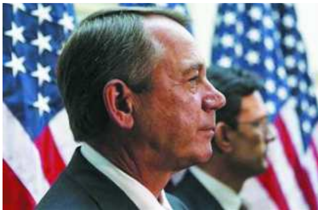
US Speaker of the House John Boehner (R-OH) (L) and Rep Eric Cantor (R-VA) (R) attend a news conference with Republican House members in Washington on 10 Oct, 2013.

The plummeting standing of congressional Republicans in public opinion polls helped spur a move toward ending the standoff, Oklahoma Republican Representative James Lankford said on CNN Thursday night. The latest, an NBC-Wall Street Journal survey published on Thursday, showed the public blaming Republicans by a 22-point margin — 53 to 31 percent. The President's