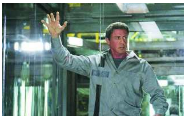
Sylvester Stallone in a still from Escape Plan.

NEW DELHI, 11 Oct—Actor Sylvester Stallone will be seen mouthing Hindi words in his forthcoming