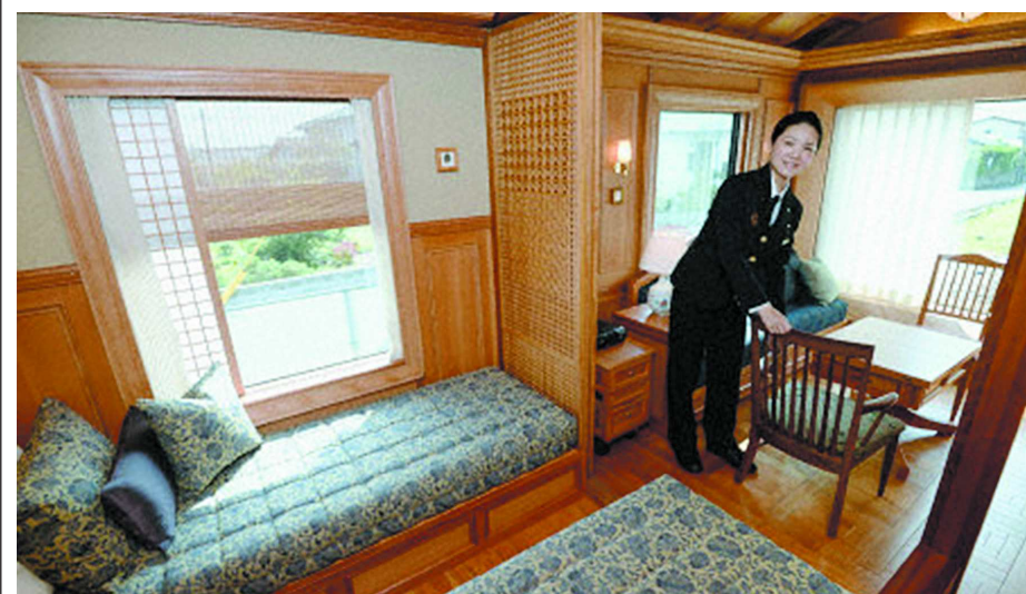
Kyushu Railway Co unveils to the Press on 10 Oct, 2013, the DX Suite, the most expensive guest room of its Seven Stars luxury cruise train service, during the train’s test run in Kagoshima Prefecture. The railway operator commonly known as JR Kyushu is set to launch the Seven Stars service on 15 October.