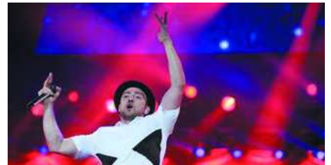
US singer-songwriter Justin Timberlake

Country singer Tyler Farr entered the chart at No 5 with his debut album “Redneck Crazy,” while Los Angeles sister trio Haim came in at No 6 with the critically acclaimed debut album “Days Are Gone.”