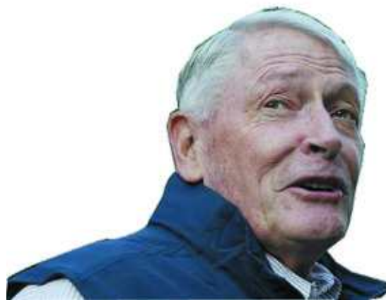
Liberty Media Corp chairman John Malone arrives at the annual Allen and Co conference at the Sun Valley, Idaho Resort on 12 July, 2013.