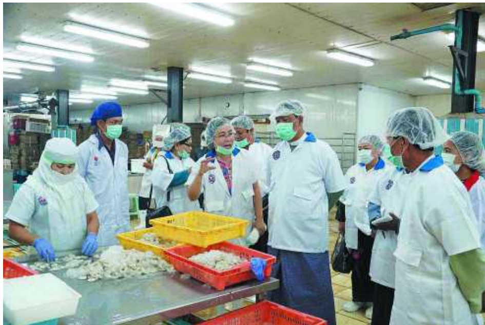
Taninthayi Region Minister for Economic and Planning U Thein Lwin meets workers and employers at a cold storage.

MYEIK, 11 Oct—Taninthayi Region Minister for Economic and Planning U Thein Lwin together with