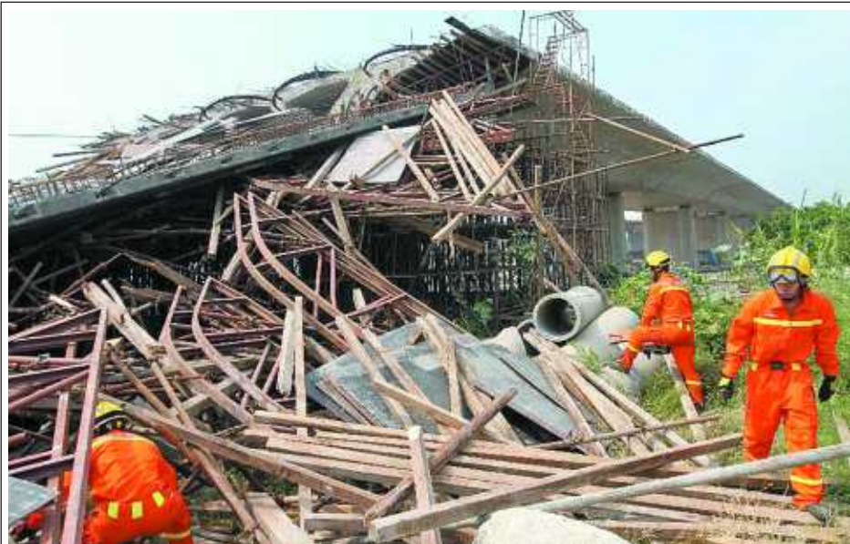
Rescuers work at the collapse site of a viaduct in Xiamen City, southeast China's Fujian Province on 10 Oct, 2013. Four workers were injured when the viaduct under construction collapsed at around 10:30 am Thursday.