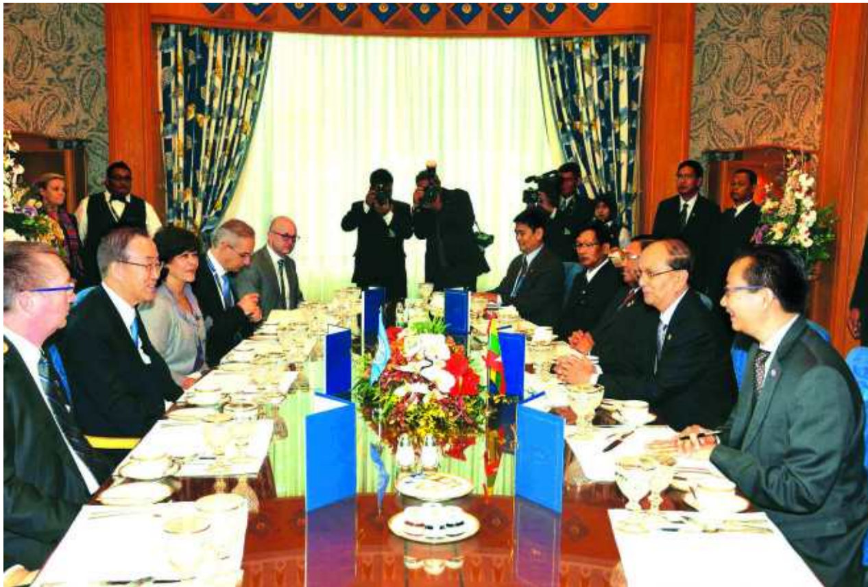
President U Thein Sein holds talks with Secretary-General of the United Nations Mr Ban Ki-moon.

During the meeting in Bandar Seri Begawan, Brunei, they discussed matters related to promoting cooperation between Myanmar and the United Nations, between ASEAN and the UN while Myanmar is taking the chair of ASEAN. They also exchanged views on more participation of the UN and international communities in peace making process and in settling conflicts, building a society in which communities live together in Myanmar, taking legal actions against those who instigate conflicts and cooperation with international