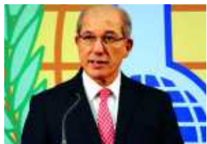
Organization for the Prohibition of Chemical Weapons Director General Ahmet Uzumcu holds a press conference in the Hague, the Netherlands, on Oct. 9, 2013.