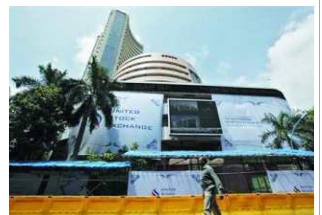
A man walks past the Bombay Stock Exchange (BSE) building in Mumbai on 21 Sept, 2010.

“The situation is fluid but it seems like progress is being made on averting the worst case scenario. But a short-term solution should be met with short-term enthusiasm,” analysts at Nomura wrote in a client note. Republican lawmakers, who have not passed budget funding, on Thursday offered a plan that would extend the US government's borrow-