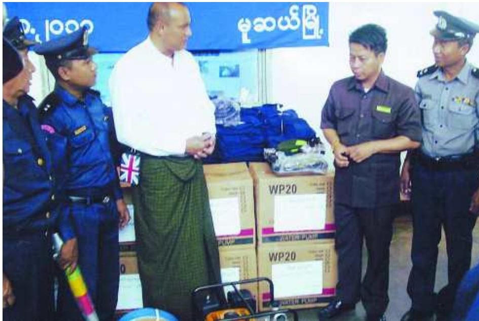
Presentation of uniforms for members of Auxiliary Fire Brigade in progress in Muse.

MUSE, 11 Oct—A ceremony to present uniforms to 339 members of Auxiliary Fire Brigade of Muse