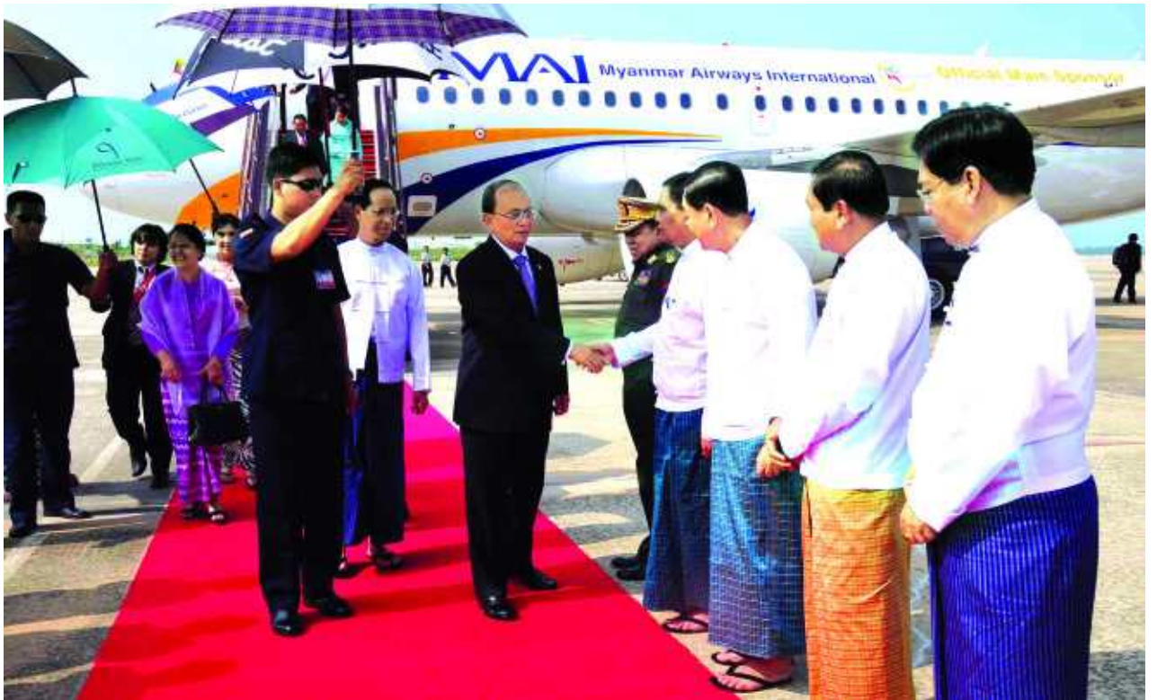
President U Thein Sein being welcomed back by Vice-President Dr Sai Mauk Kham at Nay Pyi Taw Airport.