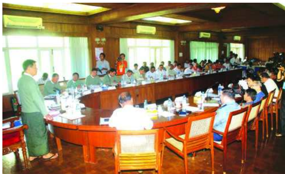
Meeting between Union Election Commission and political parties in progress.