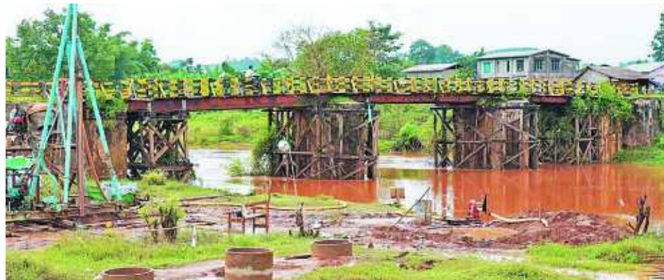
Photo shows Einaing Bridge on Lashio-Mansan Road in Shan State (North).