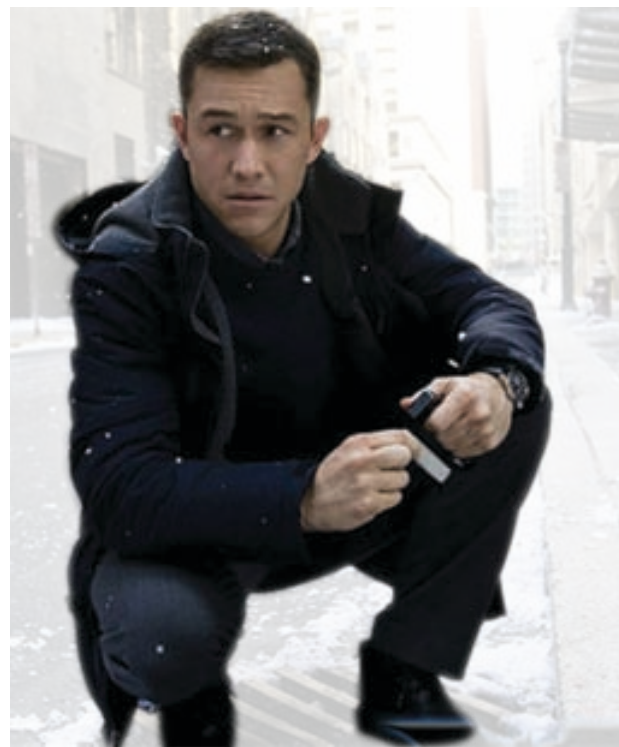
Joseph Gordon-Levitt in a still from The Dark Knight Rises .

The Man of Steel sequel will see Affleck as Batman and Cavill as Superman.—PTI