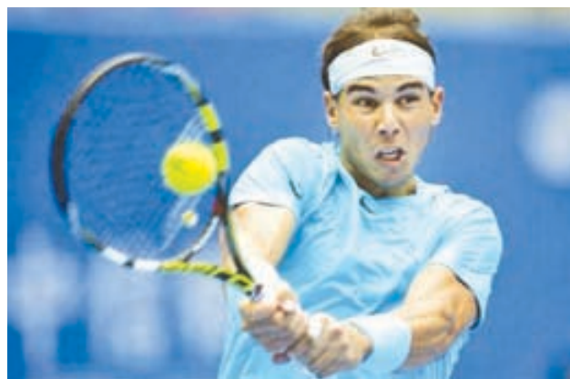
Spain's Rafael Nadal returns the ball during his men's singles semi-final match against Tomas Berdych of the Czech Republic at the China Open tennis tournament in Beijing on 5 Oct, 2013.

the end of the season, not before. This season is not over. My work is not over," said Nadal, it seemed that he has started to focus on the games afterwards, "Remain a match tomorrow. Remain Shanghai. I am No1 today, but it's not done for the end of the season."—Xinhua