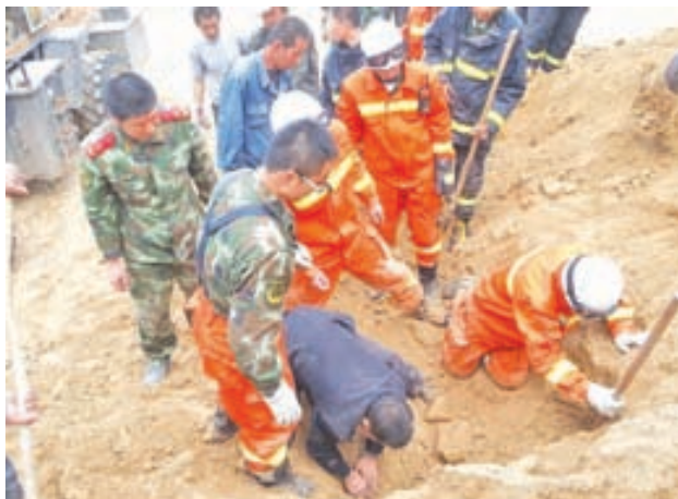
Rescuers work at the scene of landslide in Datong County, Xining, northwest China's Qinghai Province, on 5 Oct, 2013. A landslide killed seven people in northwest China's Qinghai Province Saturday afternoon, according to local authorities.