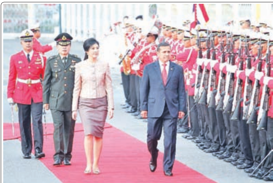
Thai Prime Minister Yingluck Shinawatra (front, L) and visiting Peruvian President Ollanta Humala (front, R) review an honor guard during a welcoming ceremony at the Government House in Bangkok, Thailand, on 5 Oct, 2013. The Peruvian president is on a visit to Thailand on 4 October to 5 October.