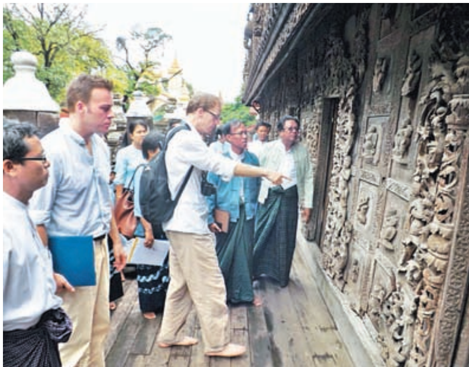
the Shwekyauungyi. They then observed damages of the building.