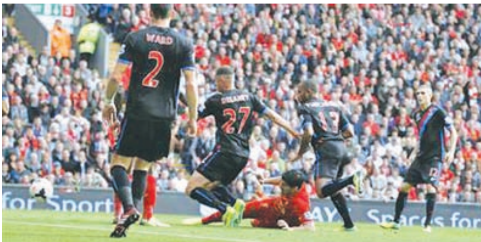
Liverpool's Luis Suarez (C, bottom) shoots to score his side's first goal during their Premier League match against Crystal Palace at Anfield in Liverpool, northern England on 5 Oct, 2013.

Leno also denied substitute Mario Goetze who was making his comeback after injury.