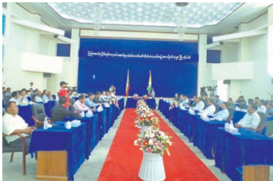
Peace talks between Union Peace-making Work Committee and Wa Special Region-2 in progress.—MNA