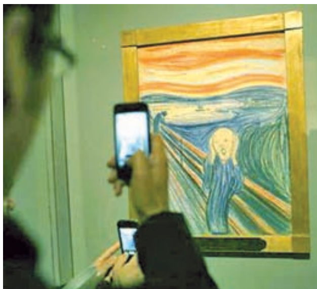
People use camera phones to photograph Edvard Munch’s iconic “ The Scream ”, a pastel-on-board (1895) during a Press preview of an exhibition of Munch’s work at New York City’s Museum of Modern Art (MoMA) on 24 Oct, 2012.