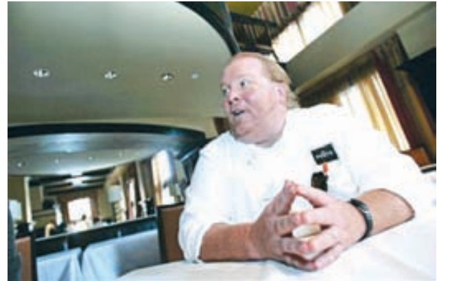
Celebrity chef Mario Batali talks during an interview with Reuters at his latest restaurant, Del Posto, in New York in this file photo from 11 April, 2006.

"If users, including influential users, do not continue to contribute content to Twitter, and we are unable to provide users with valuable and timely content, our user base and user engagement may