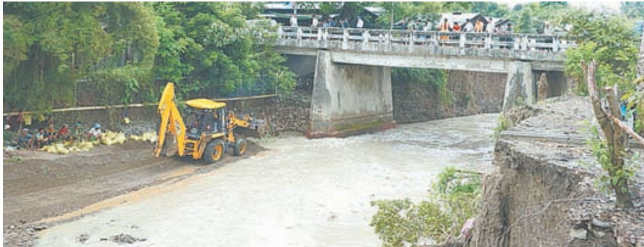
Upoktaw Creek being dredged for proper flow of water at water course.