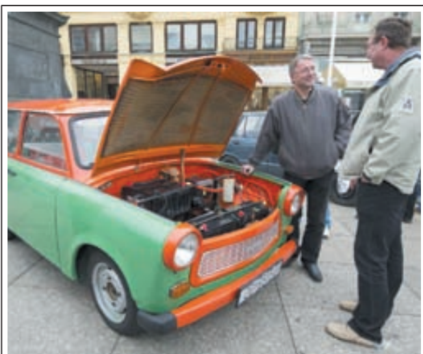
A man talks to the owner of an electric converted vintage Trabant car exhibited at main square in downtown Zagreb, capital of Croatia, on 5 Oct, 2013. Several Croatian companies and individual manufacturers showed their electric vehicles during the electric vehicles exhibition on Saturday.