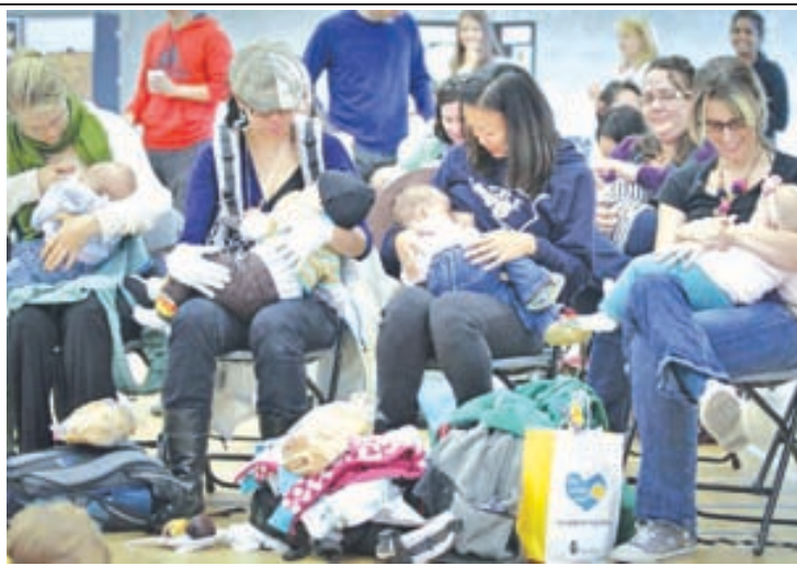
Moms breast feed their children during the breast-feeding challenge held at False Creek Community Centre in Vancouver, Canada, on 5 Oct, 2013. Dozens of mothers gathered to take part in the Global Breast-feeding Challenge 2013.

Director General Central Equipment Statistics and Inspection Department