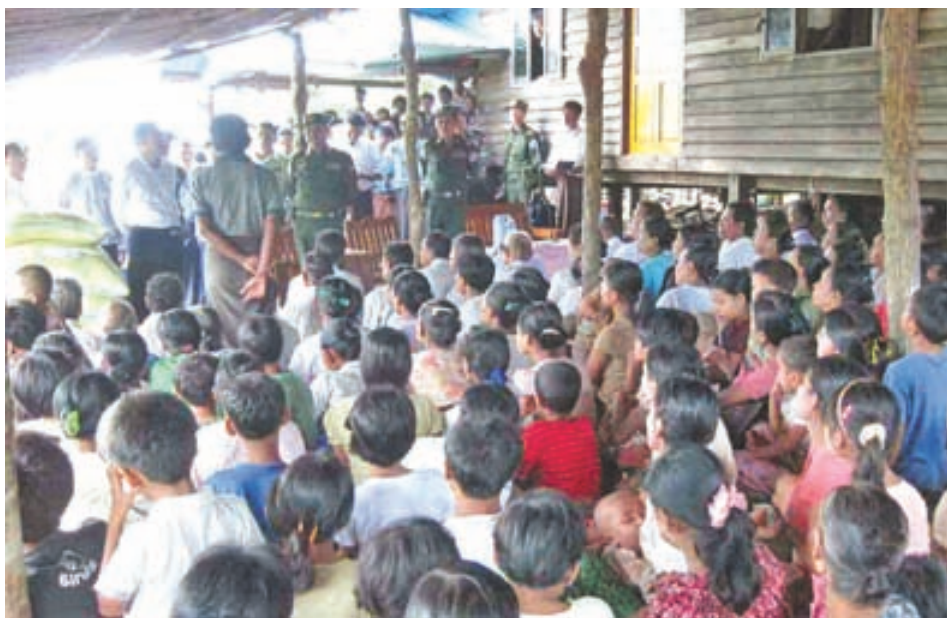
Chief Minister U Hla Maung Tin and Lt-Gen Hla Min meeting with local people in violence-hit village in Thandwe Township.—MNA

NAY PYI TAW, 6 Oct— Rakhine State Chief Minister U Hla Maung Tin, Lt-Gen Hla Min of the Office