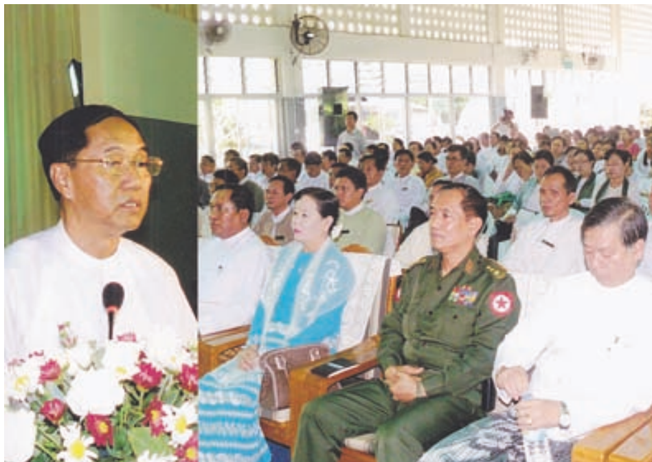
Chief Minister U Myint Swe speaking at ceremony to mark World Teachers' Day-2013 in Yangon Region.

YANGON, 6 Oct—A ceremony to mark the World Teachers' Day 2013 was observed at Thiri Yadana Hall of No 4 Basic Education High School in Ahlon Town-