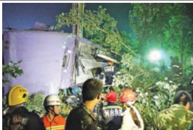
Rescuers work at the accident site in Linzhou, central China's Henan Province, on 5 Oct, 2013. Six people were killed and 38 others injured after a coach overturned on Saturday. The injured have been rushed to hospital and two of them are in critical conditions.

With other investment channels such as the stock market proving disappointing, houses in those cities have become a popular investment choice for the country's wealthy, further squeezing the already tight supplies.—Xinhua