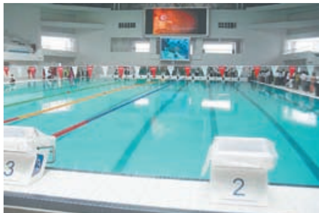
Photo shows Zeyathiri Swimming Pool with preparations for holding water polo event of the XXVII SEA Games.

Myanmar water polo players are under intensive training for securing the medals in the coming SEA Games.