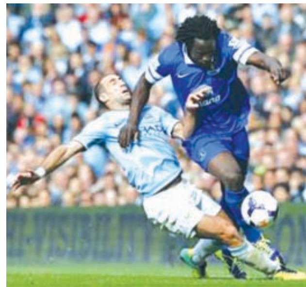
Manchester City's Pablo Zabaleta challenges Everton's Romelu Lukaku (R) during their Premier League match at the Etihad Stadium in Manchester, northern England, on 5 Oct, 2013.