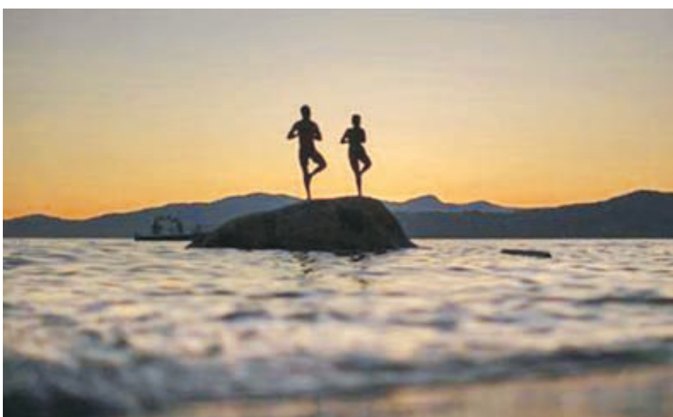
A couple stand on a rock facing the sunset along the shores of English Bay in Vancouver, British Columbia on 23 July, 2013.

NEW YORK, 6 Oct—Stress reduction exercises have been linked to many health benefits, but lower blood pressure may not be one of them.