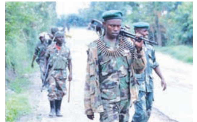
Congolese M23 rebels carry their weapons as they patrol near Rushuru, in Democratic Republic of Congo on 3 Aug, 2013 as a deadline set by UN peacekeepers for rebels in the volatile eastern Democratic Republic of Congo to lay down their weapons passed on Thursday, with the fighters facing force if they fail to disarm.