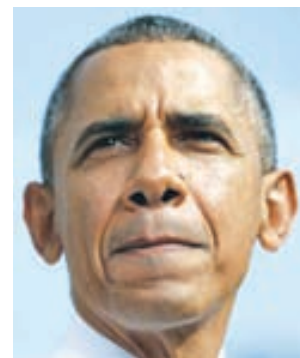
US President Barack Obama delivers remarks on the government funding impasse at M Luis Construction, a local small business in Rockville, Maryland, near Washington, on 3 Oct, 2013.

jamin Netanyahu and President Obama see eye-to-eye on the need to prevent Iran obtaining nuclear weapons,” the official said.