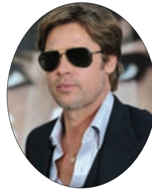
Brad Pitt says he loves films of ‘60s and ‘70s.