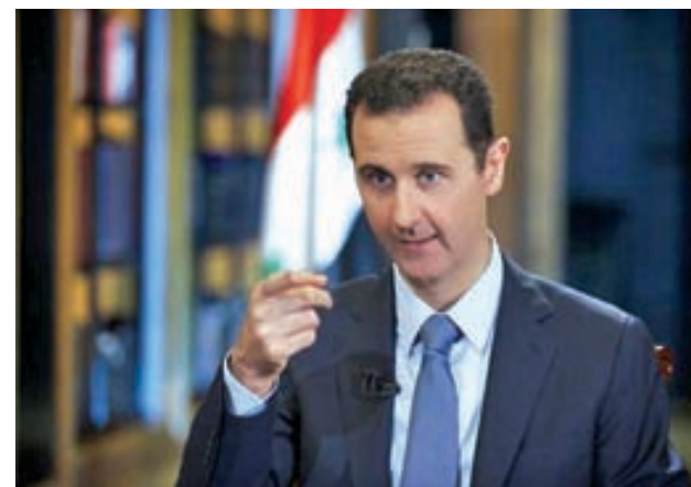
Syria's President Bashar al-Assad speaks during an interview with Turkey's Halk TV in Damascus, in this handout photograph distributed by Syria's national news agency SANA on 4 Oct, 2013.

Assad told Der Spiegel that US President Barack Obama had “not even a whisper of proof” that the