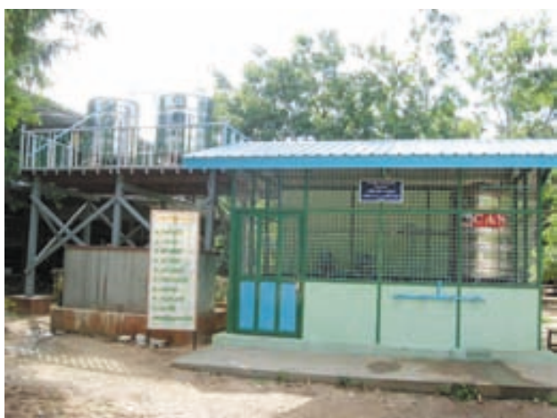
Newly-donated Water purifier for Thedaw-Wundwin BEHS.

So, the teachers and students are pleased for prospects of outbreaking infectious diseases based on water.—Kyemon-Htay Hlaing(Wundwin)