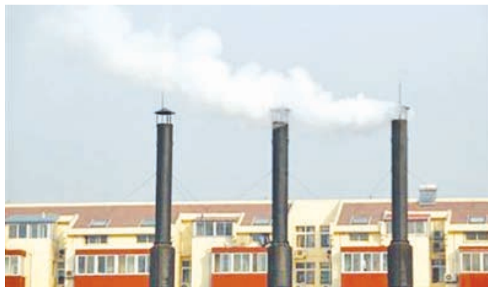
Smoke billows from the chimneys of a heating plant near a residential compound in Beijing, in this 23 Nov, 2010 file photo.