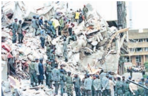
Rescue workers sift through rubble to find survivors trapped in the remains of Ufundi house, a seven-story office building which collapsed when a huge bomb went off on 7 Aug, 1998 in Nairobi, Kenya, in this file photo taken on 8 Aug, 1998.

WASHINGTON, 6 Oct—US forces captured in Libya an al-Qaeda militant wanted for his suspected role in the 1998 bombings of US embassies in Kenya and Tanzania, US media reported on Saturday.