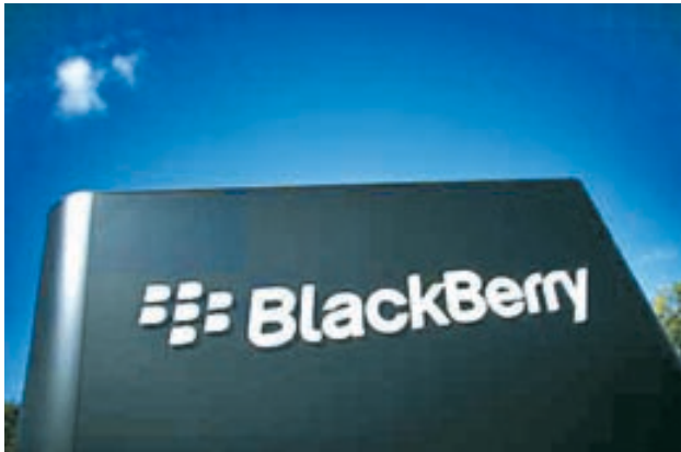
The company logo is seen at the BlackBerry campus in Waterloo, in this 23 Sept, 2013 file photo.