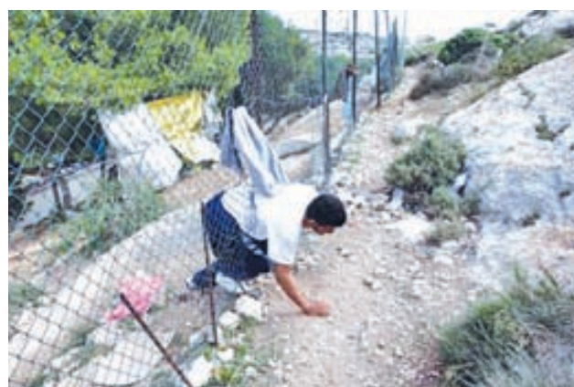
A migrant leaves the immigration centre through a fence on the southern Italian island of Lampedusa on 5 Oct, 2013.

LAMPEDUSA, 6 Oct — The survivors of a shipwreck off Sicily two days ago live in terrible conditions and face criminal prosecution, a delegation of lawmakers and officials said on Saturday as they called for policy changes at home and in the European Union.