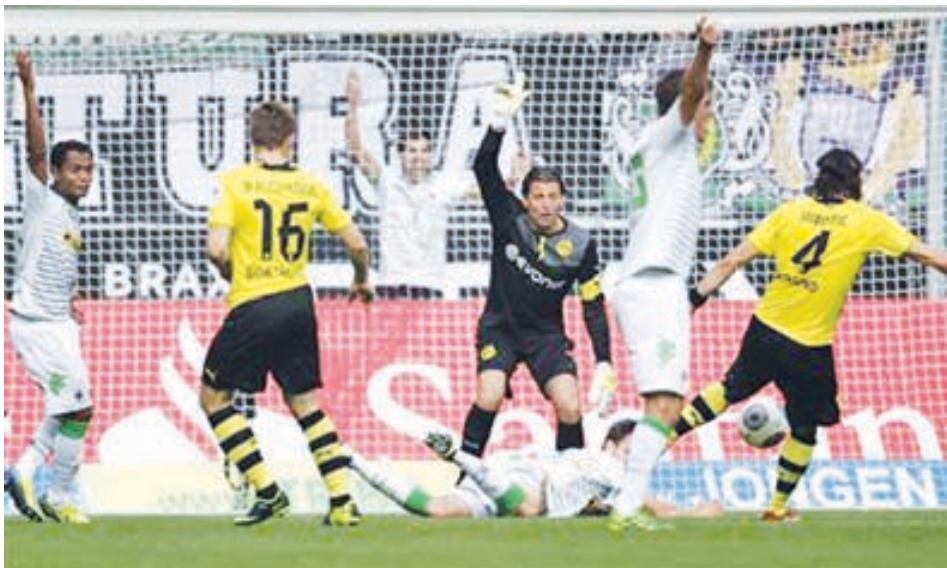
Borussia Dortmund's goalkeeper Roman Weidenfeller (C) reacts during the German first division Bundesliga match against Borussia Moenchengladbach in Moenchengladbach on 5 Oct, 2013.