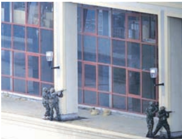
Kenya Defence Forces soldiers comb the rooftop of the Westgate shopping mall in Nairobi on 24 Sept, 2013.