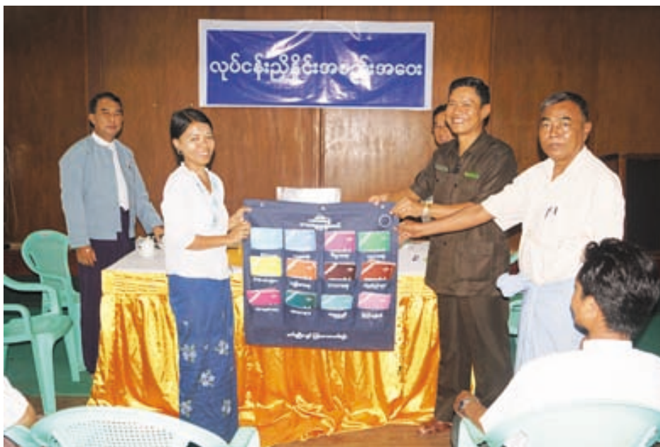
The donation ceremony of mini book corners for public places of Thaton Township in progress.

THATON, 6 Oct—For enabling the local people to have access to reading facilities, the mini book corners were opened at the public places in Thaton Township of Mon State by staff of Information and