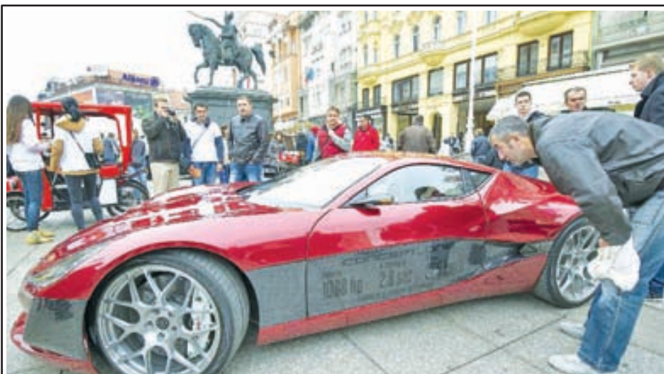
A man looks on a Rimac Concept One electric car exhibited at main square in downtown Zagreb, capital of Croatia, on 5 Oct, 2013. Several Croatian companies and individual manufacturers showed their electric vehicles during the electric vehicles exhibition on Saturday.