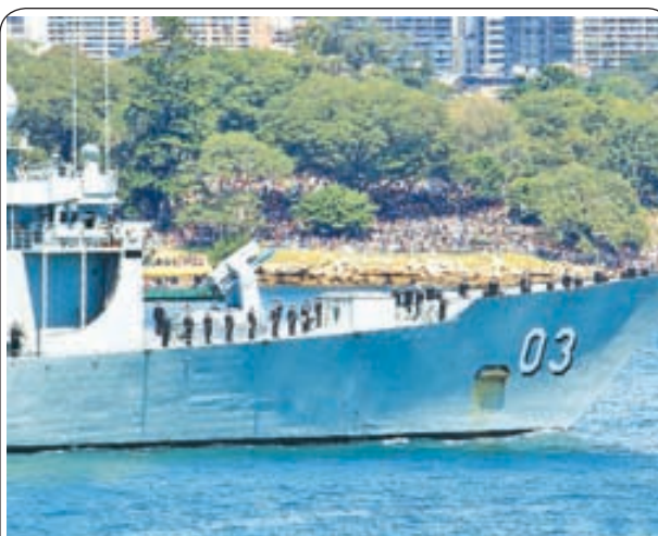
Marines stand on the deck of a warship of the Royal Australian Navy during the International Fleet Review commemorating the 100th anniversary of the first entry of the Royal Australian Navy's Fleet into Sydney Harbour, in Sydney, Australia, on 5 Oct, 2013.