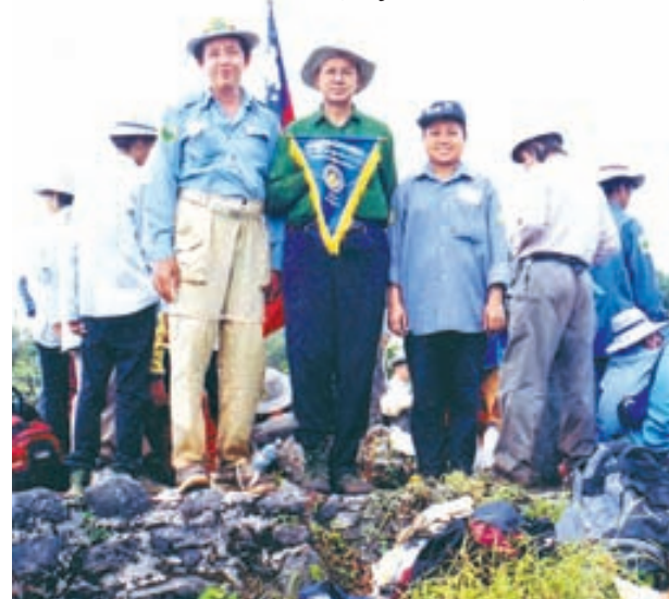
Members of Universities Hiking and Mountaineering Team pose for documentary photo at apex of Mt Taungme.

Mountaineering is good for our health, improving muscular fitness and lowering the risks of dying early. Enjoying beautiful natural sceneries apparently can relieve the stress of modern city life. Moreover, regional knowledge can be accumulated by doing hiking and mountaineering. Members of Universities’ Hiking and Mountaineering Association made a successful climbing of Mt. Taungme in Mogok recently.