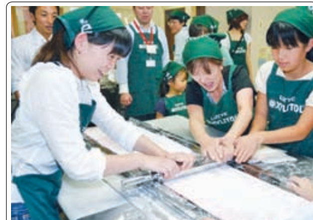
Around 90 people set a Guinness world record by making the world's biggest piece of gum in Sapporo, northern Japan, on 5 Oct, 2013. The 110-centimetre-long, 30-cm-wide piece of blueberry flavoured gum was around 15 times the size of an ordinary stick of gum.

Foreigners were reluctant to invest into local bonds amid looming fears over the tapering of US bond purchases that may raise market interest rates across the board.