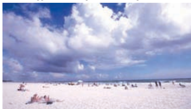
Clouds move in before the possible arrival of Tropical Storm Karen in Navarre Beach, Florida on 5 Oct, 2013.

The governors of Louisiana, Mississippi, Florida and Alabama had earlier declared states of emergency to speed storm preparations, and the Federal Emergency Management Agency recalled some workers who were furloughed in the federal government shutdown to assist.