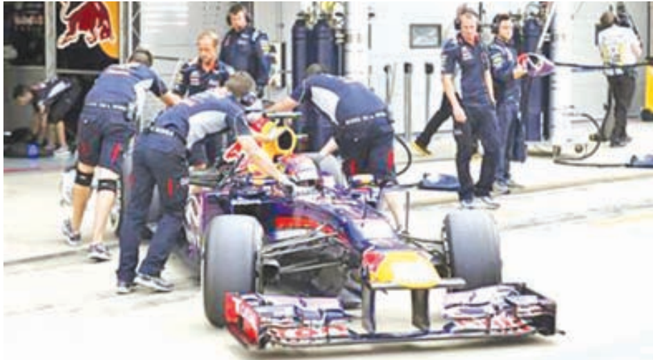
Mechanics push the car of Red Bull Formula One driver Sebastian Vettel of Germany during the qualifying session for the Korean F1 Grand Prix at the Korea International Circuit in Yeongam, on 5 Oct, 2013.

YEONGAM, 6 Oct — Red Bull's Formula One championship leader Sebastian Vettel grabbed pole position at the Korean Grand Prix on Saturday while closest title rival Fernando Alonso qualified only fifth for Ferrari.