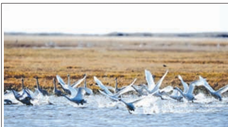
Migrating white swans are seen during their sojourn in the Hulun Buir Grasslands, north China's Inner Mongolia Autonomous Region, on 5 Oct, 2013.