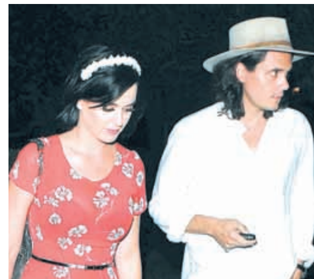
Katy Perry says she wants to donate John's brain to science.