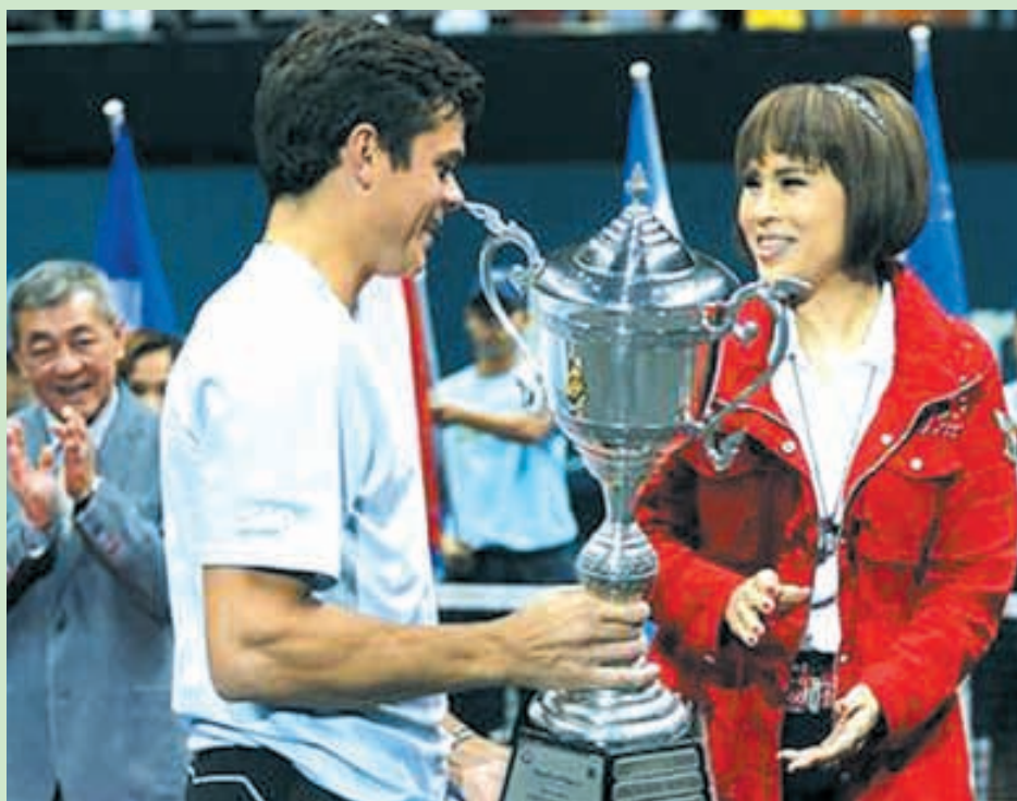
Thai Princess Ubolratana Rajakanya (R) presents the winner's trophy to Milos Raonic of Canada after the men's singles final match at the Thailand Open tennis tournament in Bangkok on 29 Sept, 2013.—REUTERS

Berdych, fifth in the race to London, as the only player in the top 10 not to have won a title this season.—Reuters