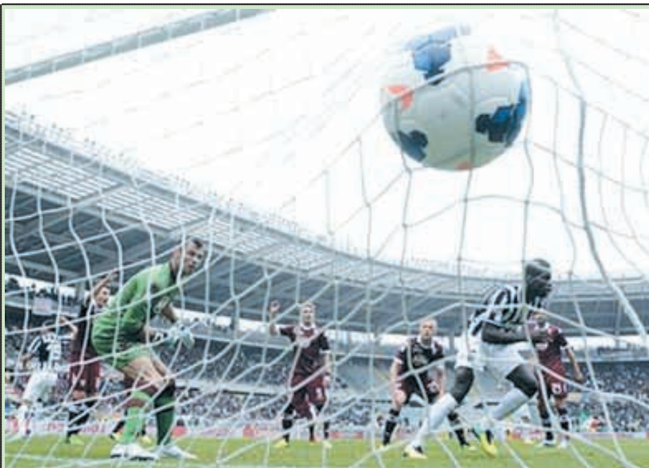
Juventus' Paul Pogba (R) heads the ball and scores against Torino during their Serie A soccer match at Olympic stadium in Turin, on 29 Sept, 2013.