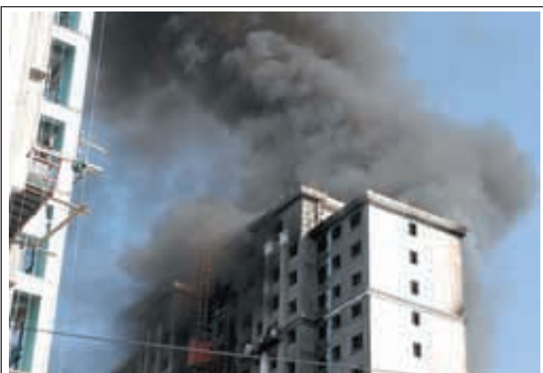
Photo taken on 29 Sept, 2013 shows a building on fire with dense smoke near the South 2nd Ring Road in Hohhot, capital of north China's Inner Mongolia Autonomous Region. No injuries have been reported so far.