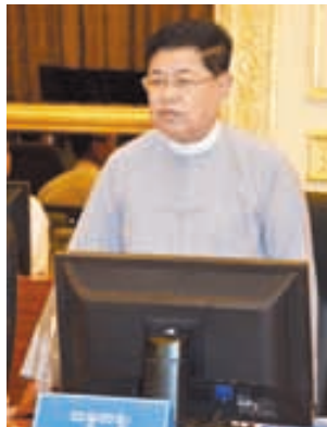
Union Minister at President Office U Soe Thane makes explanation.—MNA

He also stressed the need for active cooperation between working groups to use foreign grants, loans and technical assistance and projects.