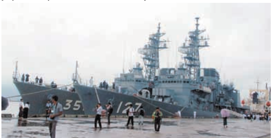
Three training warships—Kashima, Shirayuki and Isoyuki—of Maritime Self Defence Force of Japan seen at Thanlyin Thilawa Port in Yangon.