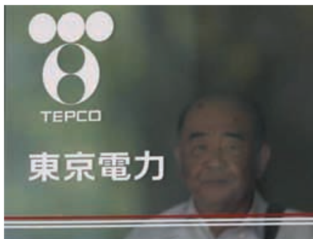
A man walking out is seen past Tokyo Electric Power Co (TEPCO)'s logo at the company headquarters in Tokyo on 19 July, 2012.