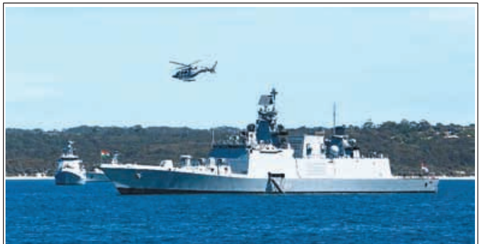
Warships arrive at the Jervis Bay, Australia, on 29 Sept, 2013. Warships from 11 countries arrived at Jarvis Bay to take part in a marine security exercise held during the enlarged meeting of ASEAN Defence Ministers on Sunday. The exercise would last till Tuesday.