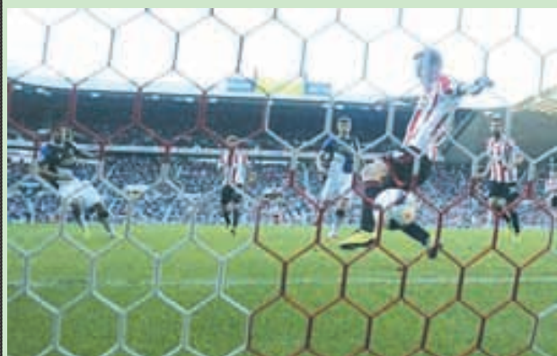
Liverpool's Luis Suarez (L) shoots to score against Sunderland during their English Premier League soccer match at The Stadium of Light in Sunderland, northern England, on 29 Sept, 2013.