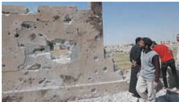
A man looks at one of the walls of the secondary school that is covered with blood after activists said it was hit by an air strike from forces loyal to President Bashar Al-Assad in Raqqa, eastern Syria on 29 Sept, 2013.