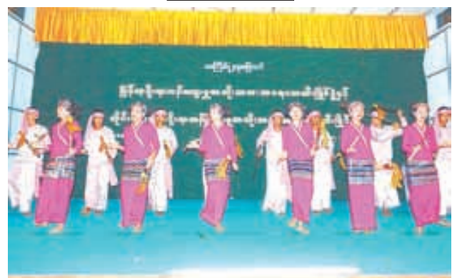
The 20 th Myanmar Traditional Performing Arts Competitions and National Races Traditional Performing Arts Competitions in Langhkiio District in southern Shan State were held at Ngwewady Hall in Langhkiio on 25 September.