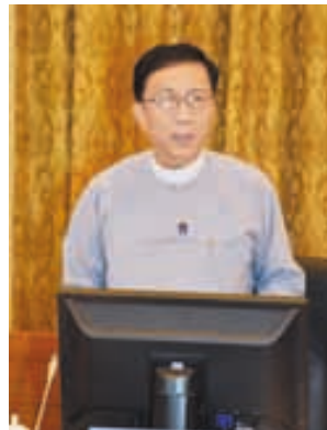
Union Minister U Win Shein makes clarification.

Arrangements are being made to ensure effective