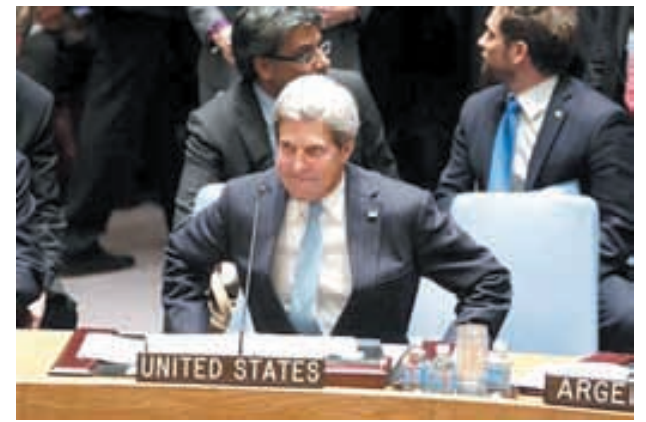
US Secretary of State John Kerry takes his seat moments before the United Nations Security Council voted unanimously in favour of a resolution eradicating Syria's chemical arsenal during a Security Council meeting at the 68th United Nations General Assembly in New York on 27 Sept, 2013.—REUTERS

"Iran needs to take rapid steps, clear and convincing steps, to live up to the international community's requirements regarding nuclear programmes, peaceful nuclear programmes," Kerry said.—Reuters