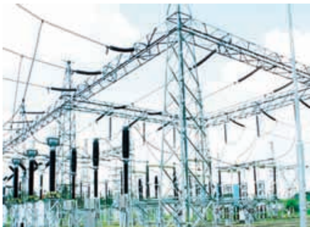
Photo shows a sub-power station.

The Ministry of Electric Power signed MoU with local and foreign companies to build power plants from 2013-