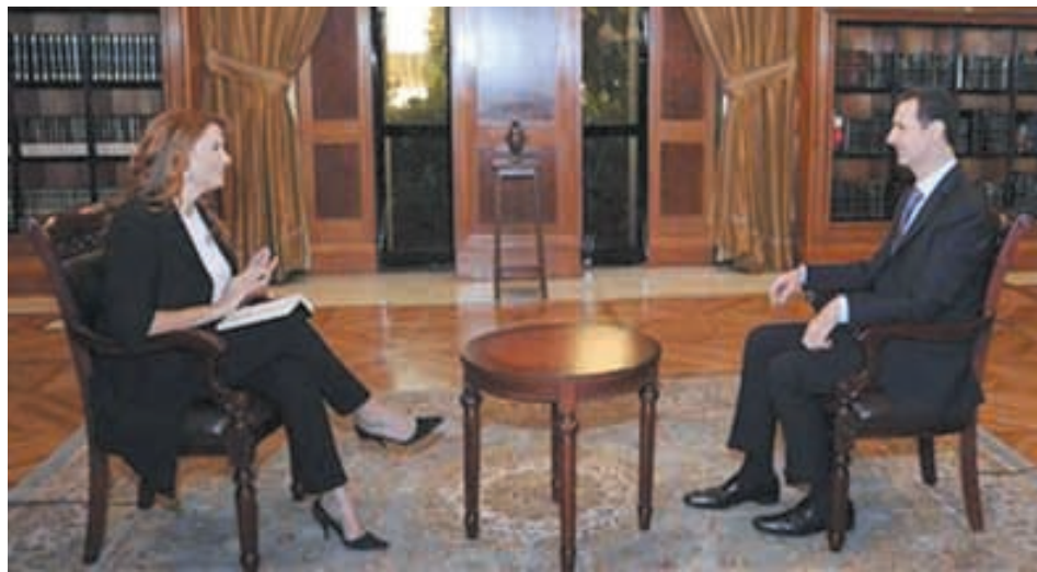
Syria's President Bashar al-Assad speaks during an interview with Italian television station RaiNews24 in Damascus in this handout photograph distributed by Syria's national news agency SANA on 29 Sept, 2013.

The UN Security Council adopted a resolution on Friday that demands the eradication of Syria's chemical weapons but does not threaten automatic punitive action against Assad's government if it does not comply. "The central part of it is based on what we ourselves wanted. So it is not about a resolution, in reality it is our own intention," he said, according to the Italian