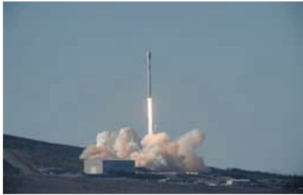
A Falcon 9 rocket carrying a small science satellite for Canada is seen as it is launched from a newly refurbished launch pad in Vandenberg Air Force Station on 29 Sept, 2013.

VANDENBERG AIR FORCE BASE, 30 Sept—An unmanned Falcon 9 rocket blasted off from California on Sunday to test upgrades before commercial satellite launch services begin later this year.