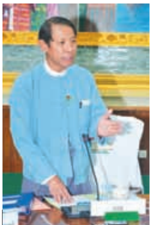
Pyidaungsu Hluttaw Deputy Speaker U Nanda Kyaw Swa delivers address at Constitution Assessment Joint Committee.—MNA

NAY PYI TAW, 30 Sept—The Constitution Assessment Joint Committee held its meeting (2/2013) at the meeting hall of the Hluttaw Office, here, this afternoon.