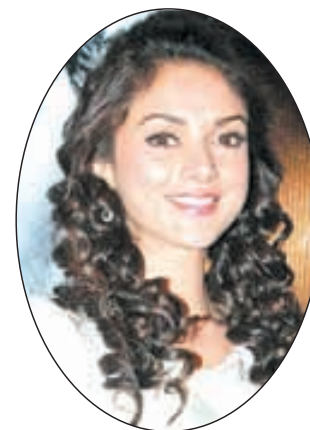
Aditi Rao Hydari will be seen wearing a bikini in Boss.

"I was asked not to lose weight (for the movie), but I worked hard and toned my