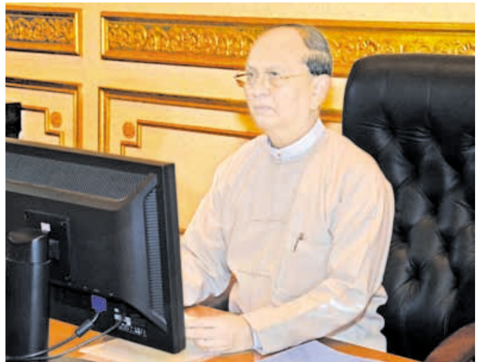
President U Thein Sein delivering an address at the meeting.