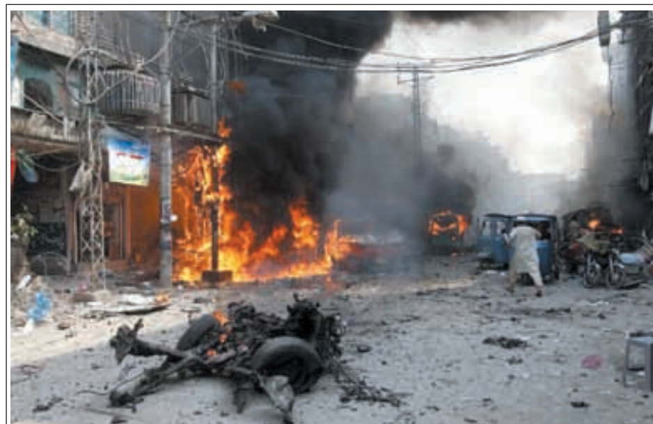
Fire rages from the blast site in northwest Pakistan's Peshawar on 29 Sep, 2013. The death toll of a blast that hit Pakistan's northwest city of Peshawar on Sunday morning has risen to 39, said a local hospital official.