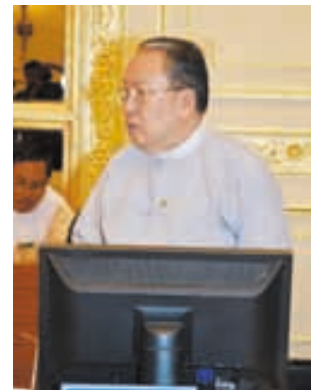
Governor of the Central Bank of Myanmar U Kyaw Kyaw Maung gives explanation.—MNA

Central Bank of Myanmar U Kyaw Kyaw Maung reported on establishment of CBM Net that will be assisted by JICA, arrangements for signing of Exchange of Note (EN) and relaxation of rules and regulations in financial sector of Myanmar.