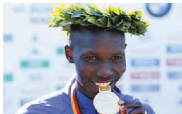
Wilson Kipsang of Kenya poses during the victory ceremony after winning the 40th Berlin marathon, on 29 Sept, 2013.

With the group whittled down to three runners, Kipsang made his decisive move at the 37 km mark and held off former 5,000 meters world champion Kipchoge before pulling