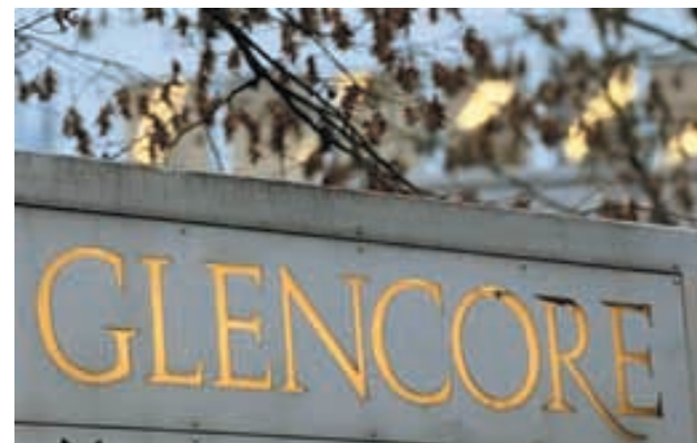
The logo of commodities trader Glencore is pictured in front of the company's headquarters in the Swiss town of Baar on 20 Nov, 2012.