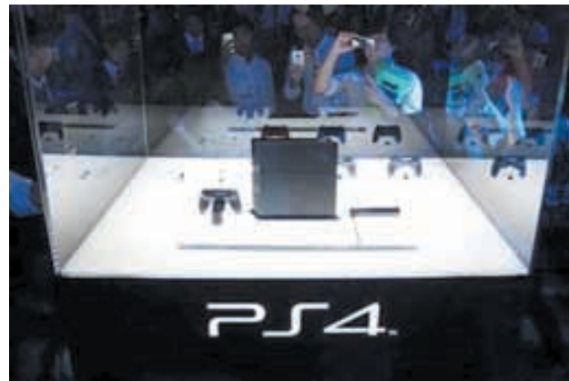
Visitors take pictures of Sony Corp’s PlayStation 4 new game console at the Tokyo Game Show in Chiba, east of Tokyo, on 19 Sept, 2013.

Sony said at video game industry trade show in Germany that it had received more than 1 million pre-orders for its upcoming console, while Microsoft has revealed only that pre-orders for the Xbox One exceeded those of its predecessor, the 360, eight years ago.— Reuters