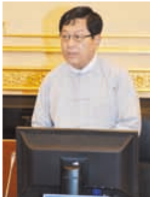
Union Minister U Tin Naing Thein gives explanation.—MNA

combination of planning and financing in implementing the tasks. Moreover, it is necessary to cope with poverty alleviation and to