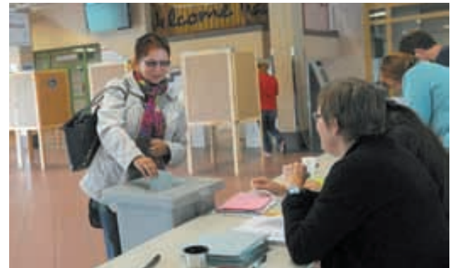
A voter casts her vote during the parliamentary elections at a polling station in Vienna, Austria, on 29 Sept, 2013.

Together, the two parties coalition got 99 seats in parliament, giving them a majority for the next five-year term in parliament, which seems to make a