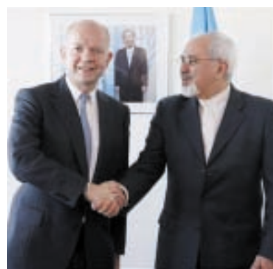
British Foreign Minister William Hague (L) shakes hands with Iran’s Foreign Minister Mohammad Javad Zarif at the beginning of their bilateral meeting at the United Nations in New York on 23 Sept, 2013.