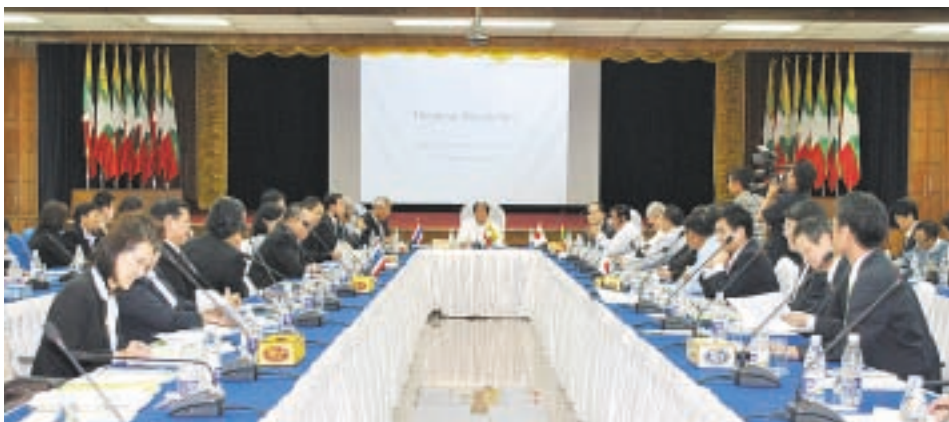
Trilateral discussion between Myanmar, Thailand and Japan for implementation of Dawei SEZ in progress.—MNA

YANGON, 27 Sept—First Myanmar-Thailand-Japan trilateral discussion on implementation of Dawei Special Economic Zone (DSEZ) and its related projects was held here today.