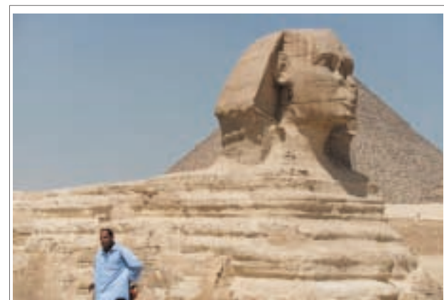
A tourist poses for photos at the Great Sphinx of Giza in Cairo, Egypt, on 13 Sept, 2013. 27 September is the World Tourism Day. Egypt suffered a setback in tourism due to deterioration of security situation after the ouster of former President Mohamed Morsi on 3 July.