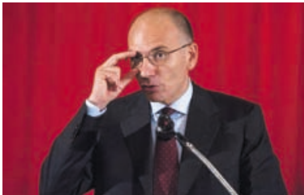
Italian Prime Minister Enrico Letta speaks during a news conference held for the Italian media, at the Italian Academy in Columbia University, New York on 26 Sept, 2013.

NEW YORK/ROME, 27 Sept—Italian Prime Minister Enrico Letta returns from a visit to New York on Friday to face the threat of a government collapse following renewed threats from Silvio Berlusconi's centre-right party to pull out of his fragile coalition.