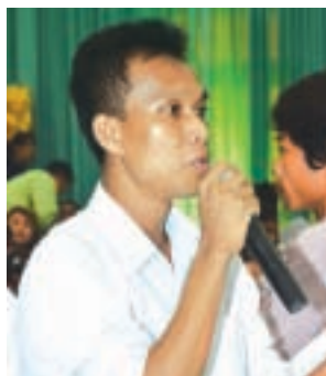
A reporter raising questions.