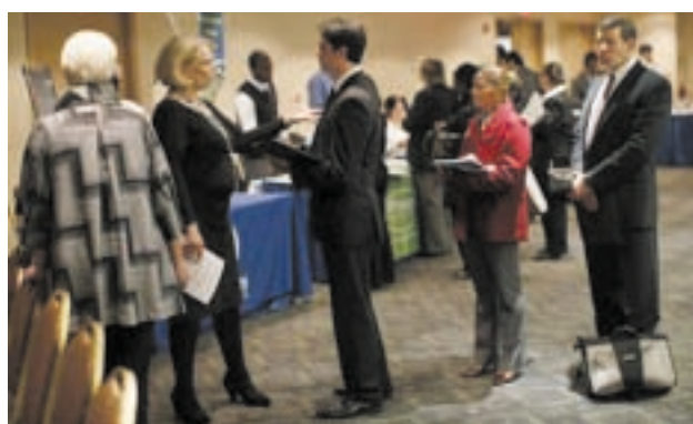
Job seekers wait to meet with employers at a career fair in New York City, on 24 October, 2012.

The National Association of Realtors said its Pending Homes Sales Index, based on contracts signed last month, decreased 1.6 percent last month.— Reuters