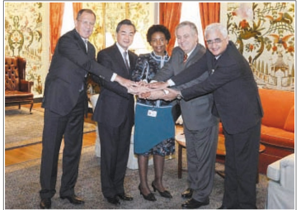
(L-R) BRICS countries foreign ministers Sergey Lavrov of Russia, Wang Yi of China, Maite Nkoana-Mashabane of South Africa, Luiz Alberto Figueiredo of Brazil, and Salman Khurshid of India shake hands during a luncheon under the framework of the 68th session of the United Nations General Assembly, at the UN headquarters in New York, on 26 Sept, 2013.

Meanwhile, the draft legislation presented by the government to the ruling