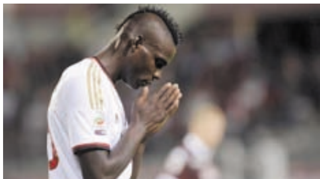
AC Milan's Mario Balotelli reacts during their Italian Serie A football match against Torino at the Olympic stadium in Turin on 14 Sept, 2013.