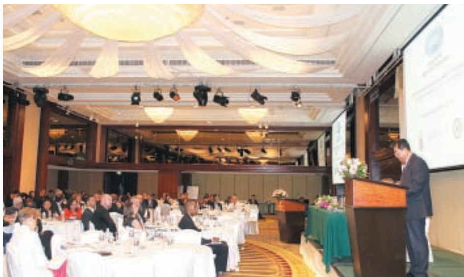
Attorney-General of the Union Dr Tun Shin addresses Asia-Pacific Economic Cooperation (APEC) Pathfinder Dialogue.—MNA

NAY PYI TAW, 27 Sept—A Myanmar delegation led by Attorney-General of the Union Dr Tun Shin attended Asia-Pacific Economic Cooperation (APEC) Pathfinder Dialogue held in Bangkok, Thailand from 23-25 September.