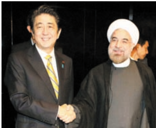
Japanese Prime Minister Shinzo Abe (L) and Iranian President Hassan Rouhani shake hands prior to talks in New York on 26 Sept, 2013.

However, the Iranian President made no mention in his speech of the country’s own nuclear development programme which has been widely suspected to be for military purposes. In his speech to the UN General Assembly on Tuesday, Rouhani expressed willingness to restart talks on the matter.— Kyodo News