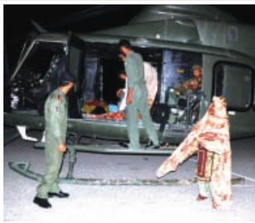
Photo released by the Inter Services Public Relation (ISPR) office on 26 Sept, 2013 shows Pakistan army officers transfer injured earthquake survivors to an army helicopter in the earthquake-devastated district of Awaran in southwest Pakistan's Balochistan province. Pakistan's Interior Minister Chaudhry Nisar Ali Khan told the parliament on Thursday that the death toll from the 7.7-magnitude powerful earthquake could rise as some areas are still inaccessible due to lack of roads.—XINHUA