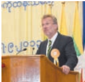
Executive Director of World Tourism Organization Mr Zoltan Somogyi reading message of Secretary-General of WTO.

The main objective of the forum is - to increase the capacity of the Ministry of Hotels and Tourism; to mobilize and manage the resources in implementing the aforementioned master plan; to create a responsible, community involved tourism, and more importantly