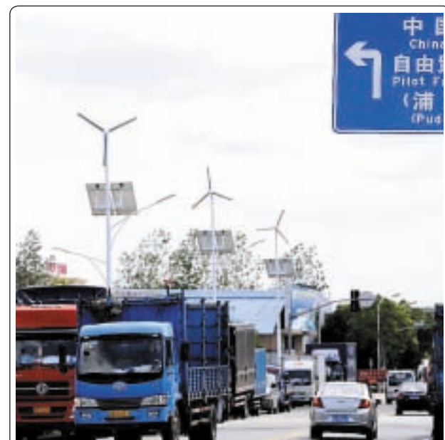
Vehicles are seen near the Pudong Airport Comprehensive Free Trade Zone, part of the free trade zone (FTZ) in Shanghai, east China, on 25 Sept, 2013. China will officially launch the pilot FTZ in Shanghai on 29 Sept, taking a solid step forward to boost reforms in the world's second-largest economy. Covering almost 29 square kilometers, the zone will be created modeled on existing free trade businesses in the country's economic hub.