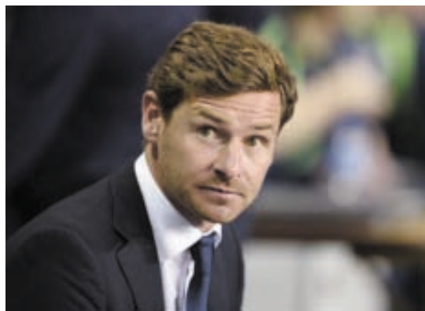
Tottenham Hotspur manager Andre Villas Boas attends their Europa League soccer match against Dinamo Tbilisi at White Hart Lane in London on 29 August, 2013.

"My relationship with him professionally and personally was excellent, as you can imagine, because we worked so many years together," he told reporters at Tottenham's training facilities in Enfield on Thursday.