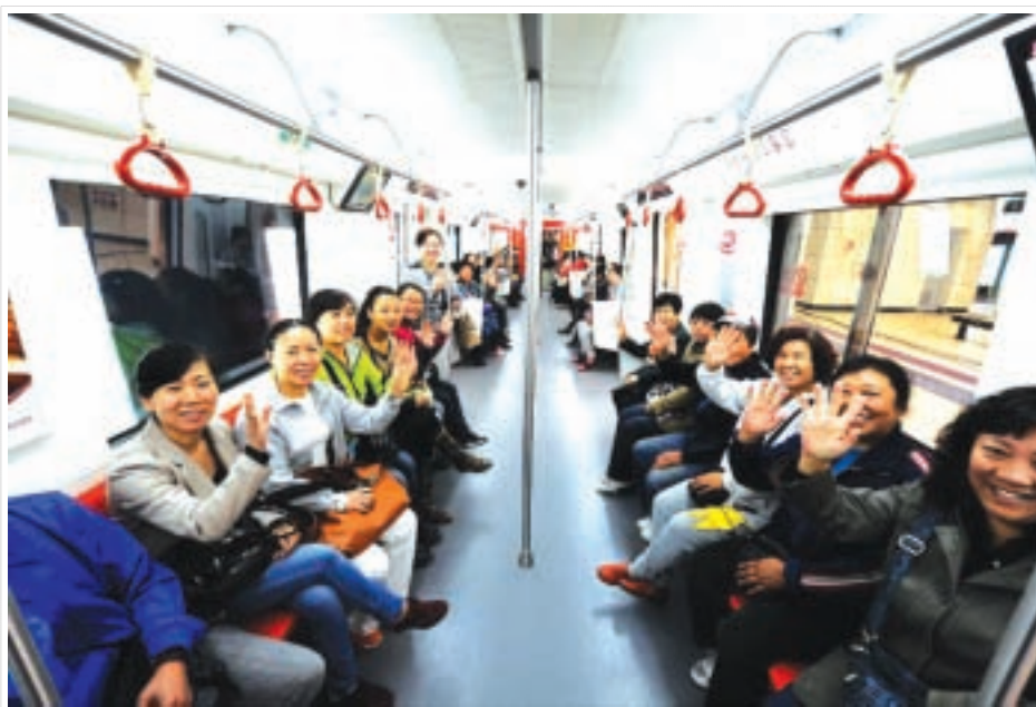
Passengers wave in a train of a subway line in Harbin, capital of northeast China's Heilongjiang Province, on 26 Sept, 2013. China's first underground subway line in a frigid region on Thursday started a trial run in Harbin. The 17.48-km line with 18 stations has been designed to withstand extreme winter cold in the city, which has a record low temperature of 38.1 degrees Celsius below zero.