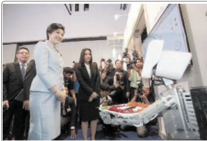
Thai Prime Minister Yingluck Shinawatra (front) visits a booth during the Thailand Design and Innovation Expo 2013 at the International Trade and Exhibition Centre in Bangkok, Thailand, on 25 Sept, 2013.