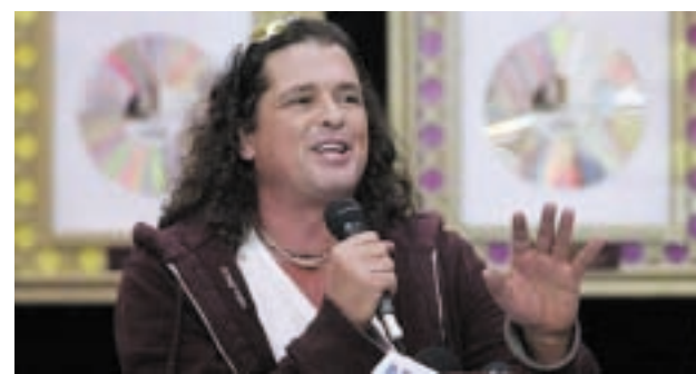
Colombian singer Carlos Vives

Illya Kuryaki & the Valderramas, a duo who take their name from the fictional television spy and former Colombian soccer player Carlos Valderrama, landed nominations at Latin music's top honors for best urban song and best alterna-