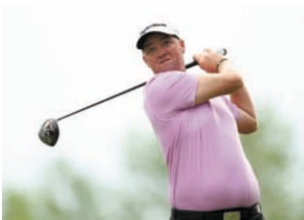
Sweden's Peter Hanson tees off on the second hole during the first round of the 2013 US Open golf championship at the Merion Golf Club in Ardmore, Pennsylvania, on 13 June, 2013.

NEW YORK, 27 Sept — A recurring back problem may prevent Ryder Cup stalwart Peter Hanson from representing Continental Europe in next week's Seve Trophy match against Britain and Ireland at St Nom-