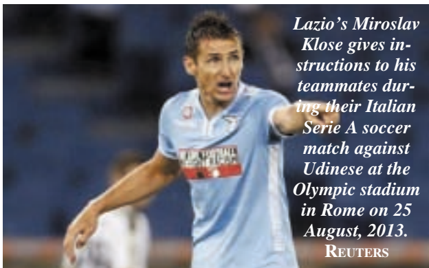
Lazio's Miroslav Klose gives instructions to his teammates during their Italian Serie A soccer match against Udinese at the Olympic stadium in Rome on 25 August, 2013.

Germany, top of Group C next host Ireland on 11 October before finishing off away to Sweden four days later. They need two points from the two games to guarantee top spot.—Reuters