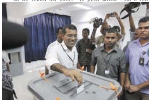
Maldivian presidential candidate Mohamed Nasheed, who was ousted as president in 2012, smiles as he casts his vote during the presidential elections in Male on 7 Sept, 2013.