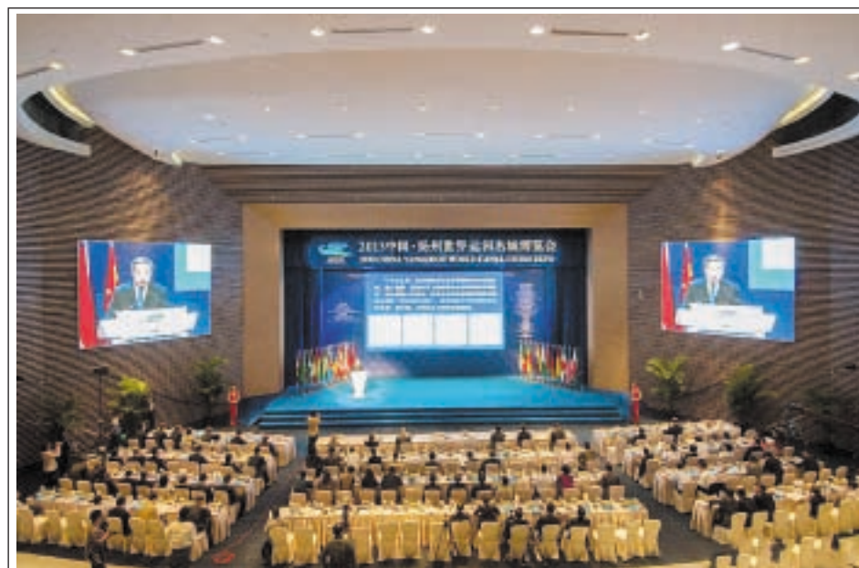
Chinese Vice Minister of Water Resources Hu Siyi makes a keynote speech during the opening ceremony of the 2013 China Yangzhou World Canal Cities Expo in Yangzhou, east China's Jiangsu Province, on 26 Sept, 2013. About 400 representatives from 16 world canal cities and 35 Chinese cities took part in the one-day expo.—XINHUA

Earlier this month, Hongkong Land, a Hong Kong-based property group, broken ground on a 100 million US dollars mixed-use development project in Phnom Penh's financial hub.— Xinhua