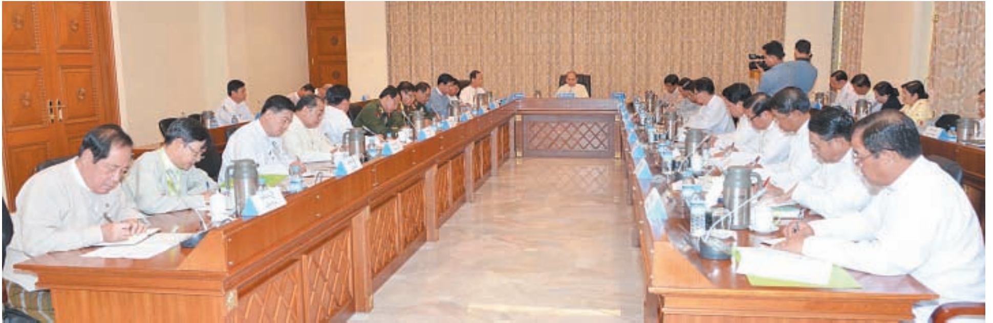
President U Thein Sein delivers an address at the meeting with deputy ministers who will chair respective Cabinet Sub-committees/Delivery Units.

NAY PYI TAW, 27 Sept — President U Thein Sein met deputy ministers who will chair respective Cabinet Sub-committee/Delivery Unit and delivered an address at the meeting hall. It was also attended by Vice-Presidents Dr Sai