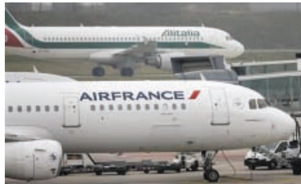
An Alitalia plane passes an Air France plane on the tarmac of Charles de Gaulles International Airport in Roissy near Paris, on 8 January, 2013.

ROME, 27 Sept—Struggling Italian carrier Alitalia will seek a capital increase of at least 100 million euros ($135 million), it said on Thursday after reporting another heavy loss for its first half.