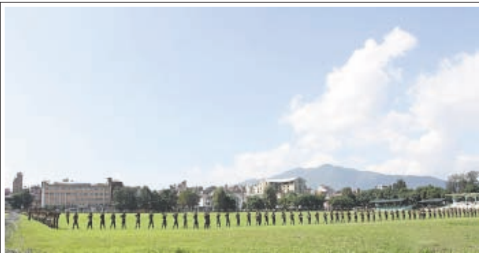
Nepalese army soldiers practice for Fulpati, the seventh special day of Bada Dashain festival, at Tundikhel in Kathmandu, Nepal, on 26 Sept, 2013. According to traditions, Hindu devotees across the country will offer assortment of sacred shrubs and flowers to worship goddess Durga. — XINHUA