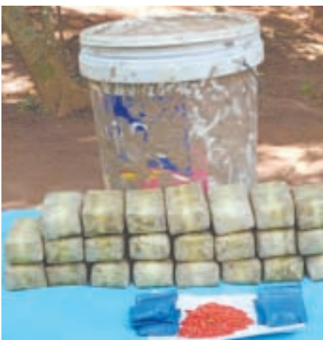
Photo shows packets of narcotic drugs seized in Tachilek.