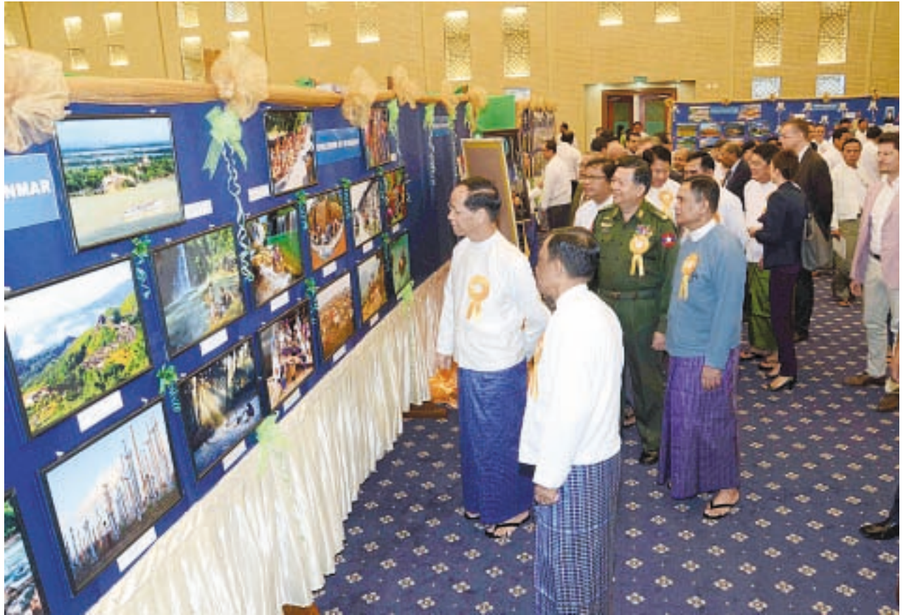
Vice-President Dr Sai Mauk Kham views booths at the celebration of World Tourism Day.

NAY PYI TAW, 27 Sept—Vice-President Dr Sai Mauk Kham called for upgrading and providing adequate tourism facilities