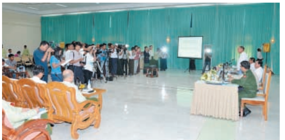
Union Minister U Win Tun making speech at the press conference of Land Utilization Management Central Committee.