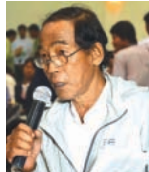
A journalist questioning.

Union government sought the assistance from the experts at home and abroad and UN agencies and INGOs. After drawing the policy, the national level land utilization plan will be mapped out. Deputy Minister for Home Affairs Brig-Gen Kyaw Zan Myint explained directives of the President office and the Union government for solv-