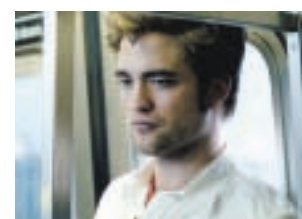
Robert Pattinson was spotted with the mystery woman during his friend's birthday party

fun. Everyone was dancing to Frank Sinatra hits. Rob was there with his new girlfriend. I don't know her name," a source said.