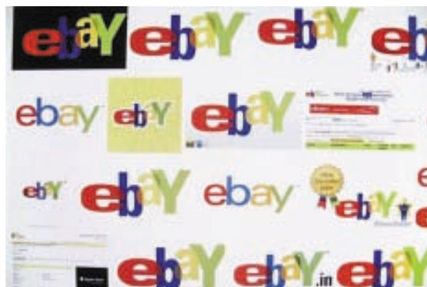
The results of a Google image search on Ebay are shown on a monitor in this photo illustration in Encinitas, California, on 16 April, 2013.