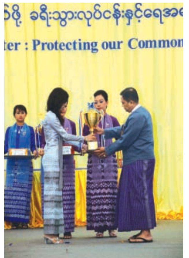
Union Minister for Information U Aung Kyi presents prize to a winner.—MNA