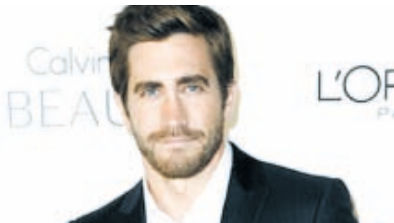
Jake Gyllenhaal spends a great deal of time researching about his characters.