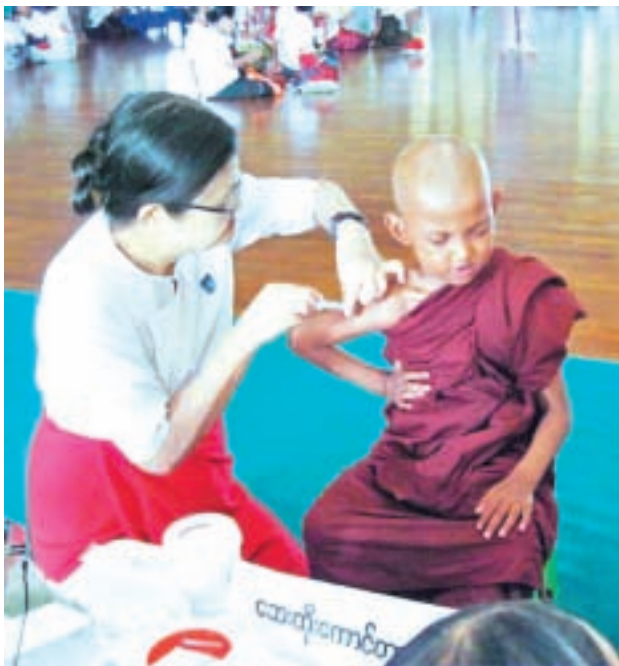
A nurse gives Hepatitis B vaccine to a novice in Toungoo.