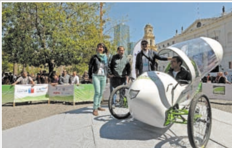
Visitors pose besides the electric vehicle "Vilti", manufactured by La Ruta Solar ONG and Chile's University, during its presentation for 2013 Desafio Cero competition, in Santiago, capital of Chile, on 24 Sept, 2013. Vilti, which means falcon in Kunza (Atacameño) language, is impelled by electrical energy and human traction, reaching a maximum speed of 50 km per hour, and it counts with an autonomy of 20 km just using electric energy. The La Ruta Solar ONG, launched the activities of the electric vehicles competence "Desafio Cero 2013" on Tuesday, aiming to develop urban transport alternatives. The competence will be held from 4 October to 6 in Farellones, Valparaíso, Santiago.