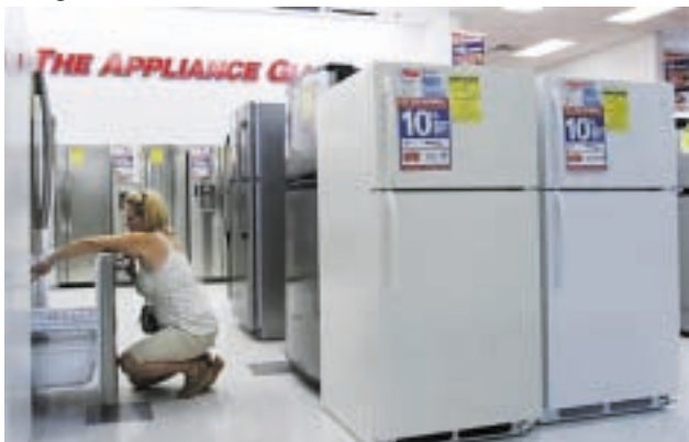
A woman shops for refrigerators at a store in New York on 28 July, 2010.