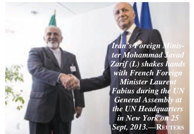
Iran’s Foreign Minister Mohammad Javad Zarif (L) shakes hands with French Foreign Minister Laurent Fabius during the UN General Assembly at the UN Headquarters in New York on 25 Sept, 2013.—REUTERS

“The only way forward is for a timeline to be inserted into the negotiations that’s short,” new Iranian President Hassan Rouhani was quoted as telling the Washington Post , through a translator, during a visit to New York, where he addressed the United Nations General Assembly on Tuesday.—Reuters