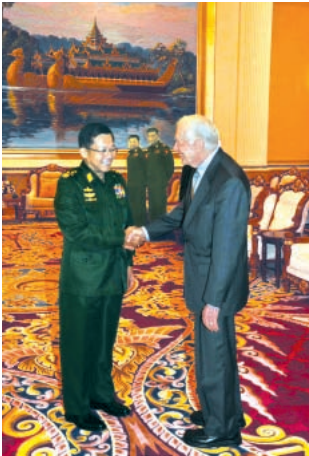
Commander-in-Chief of Defence Services Senior General Min Aung Hlaing shaking hands with Former US President and Nobel Laureate Mr. Jimmy Carter.—MNA