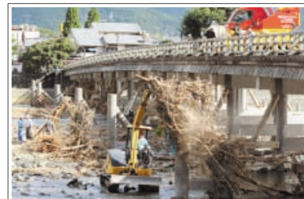
Workers use heavy machinery to clear debris around the Togetsukyo Bridge in Kyoto's Arashiyama area, a tourist spot, on 26 Sept, 2013, after heavy rain and flooding brought by Typhoon Man-yi earlier in the month.

In the year ending March, Japan replaced Germany as New Zealand's fourth largest outward investment partner.