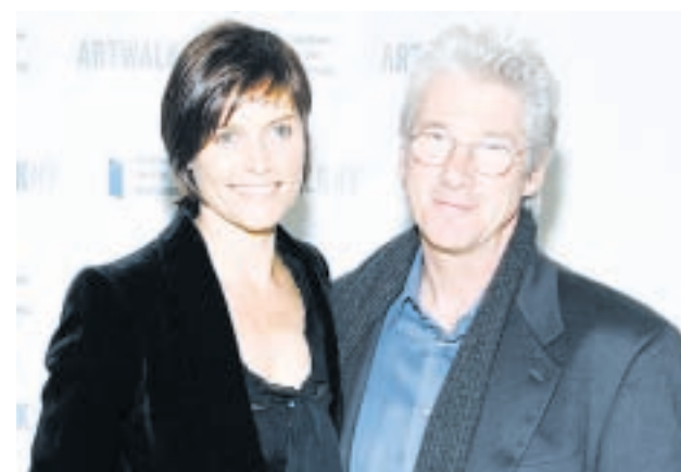
Richard Gere married Carey Lowell in 2002

"They'll do everything possible to keep things amicable and put their child first," a friend of the couple said.