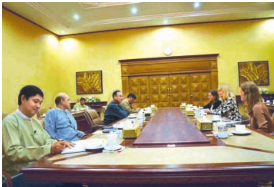
Lake and Inlay Lake and protection of biodiversity between Norway and Myanmar.—MNA

On the occasion, they discussed development of environmental sector and forest resources, United Nations Collaborative Programme on Reducing Emissions from Deforestation and Forest Degradation (UN-REDD) including environmental impact assessment in investment sector for sectoral development for the State in the long run, promotion of cooperation in environmental conservation of Indawgyi