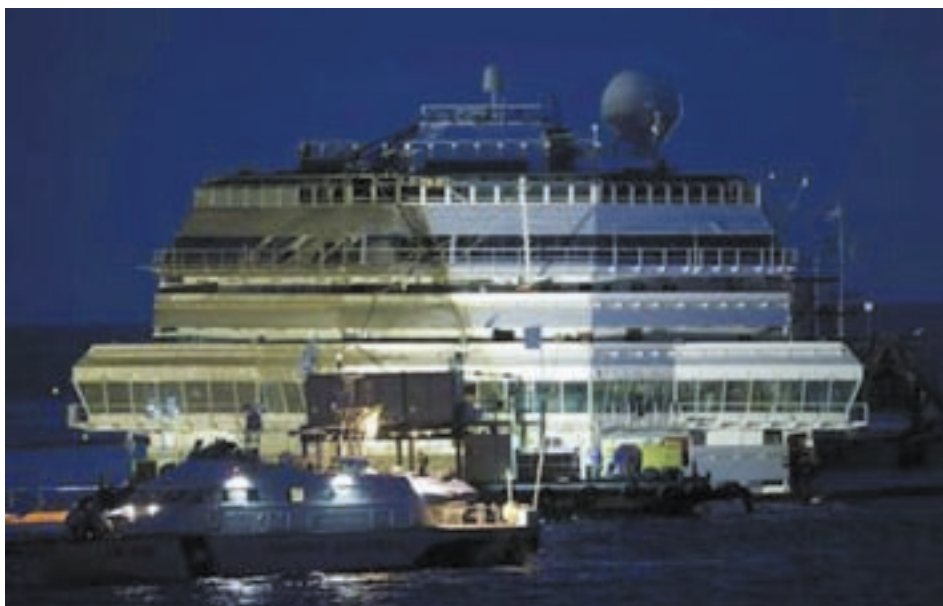
The capsized cruise liner Costa Concordia is seen at the end of the "parbuckling" operation outside Giglio harbour on 17 Sept, 2013.