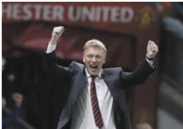
Manchester United manager David Moyes celebrates a goal against Liverpool during their English League cup soccer match at Old Trafford in Manchester, northern England on 25 Sept, 2013.

LOS ANGELES, 26 Sept—Novak Djokovic, the world's top-ranked tennis player, announced via social media on Wednesday that he was engaged to marry his longtime girlfriend, Jelena Ristic.