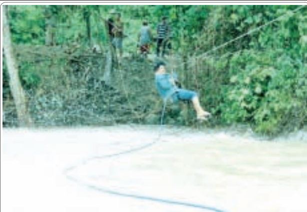
A woman crosses a river at El Carrizal in the Costa Grande region, in Guerrero, south Mexico, on 25 Sept, 2013. The death toll from floods and landslides caused by heavy rains due to tropical storms "Ingrid" and "Manuel", rose to 139, Mexican Interior Minister Miguel Angel Osorio Chong has said.