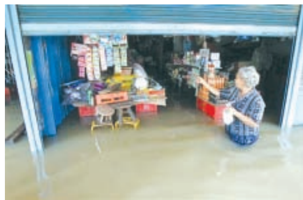
A resident walks outside a flooded shop at Srimahaphot district in Prachin Buri province, east of Bangkok on 24 Sept, 2013.