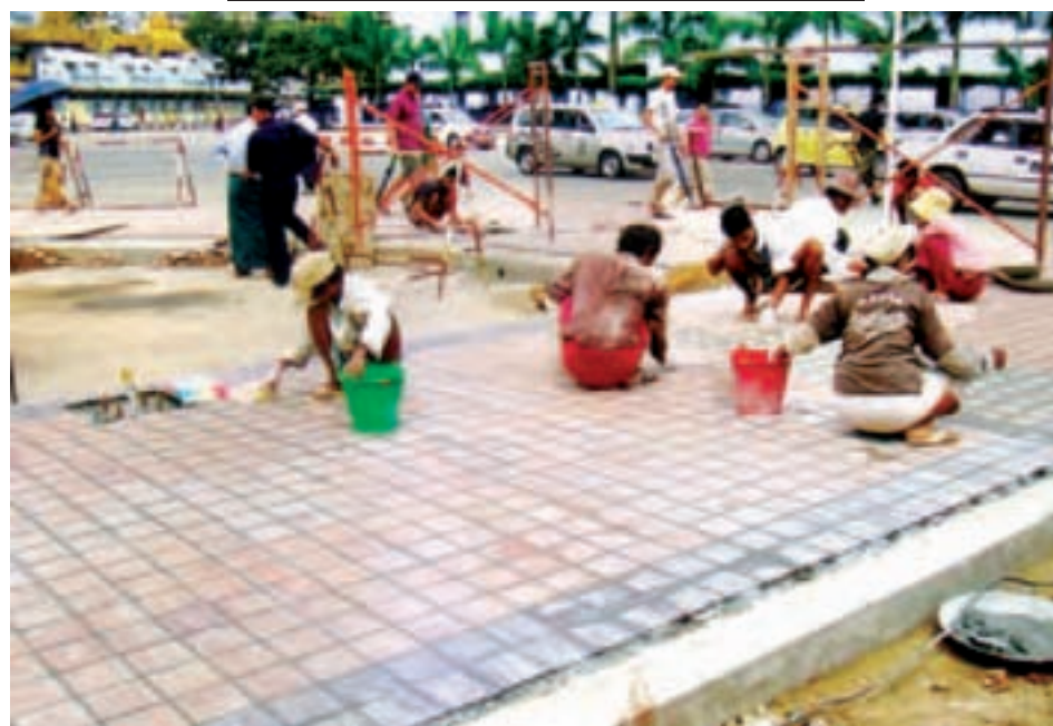
Yangon City Development Committee staff working on the site of parking lot in front of Emanuel Church at the corner of Maha Bandoola Park and Maha Bandoola street in Yangon on 21 September.