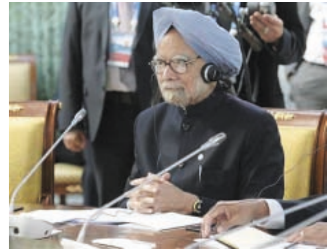
India’s Prime Minister Manmohan Singh attends a BRICS leaders’ meeting at the G20 Summit in Strelina near St. Petersburg, on 5 Sept, 2013.

Indian sourcing rules for retail, IT, medicine and