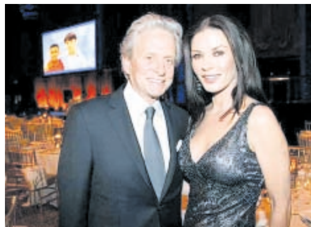
Michael Douglas and Catherine Zeta-Jones