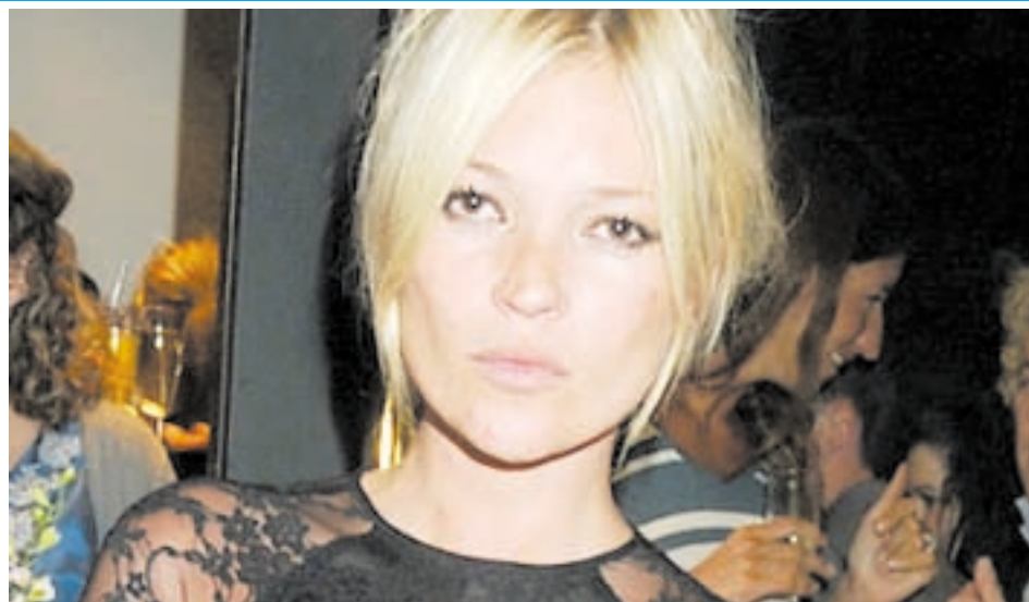
Supermodel Kate Moss

from Spears and has no plans to watch her rumoured USD 310,000-a-night performances in the US gambling capital.—PTI