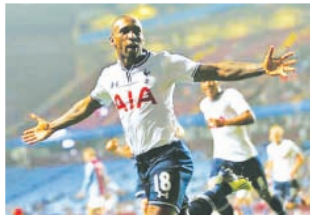
Tottenham Hotspur's Jermain Defoe celebrates his goal against Aston Villa during their English League Cup third round soccer match at Villa Park in Birmingham, central England, on 24 Sept, 2013.