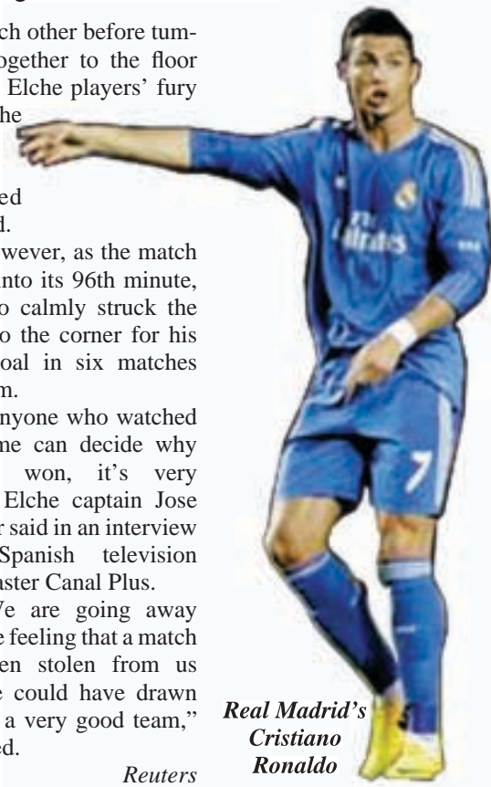
Real Madrid's Cristiano Ronaldo