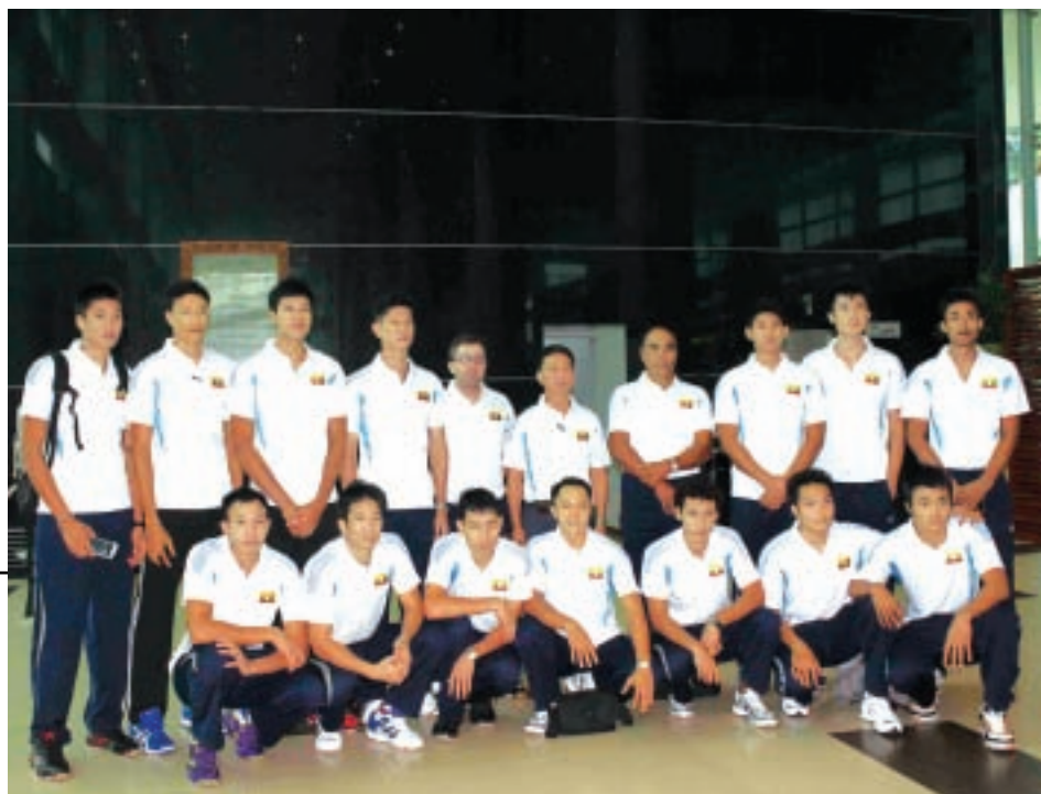
Myanmar National Volleyball Team seen at Yangon International Airport before their departure for UAE.—MNA

Altogether twenty four countries including Myanmar from Asia will take part in the championship.—MNA