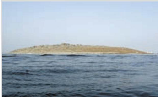
An island that rose from the sea following an earthquake is pictured off Pakistan's Gwadar coastline in the Arabian Sea on 25 Sept, 2013.

ISLAMABAD, 26 Sept — Experts from Pakistan's National Institute of Oceanography have visited a small island created by Tuesday's powerful earthquake that rocked the coun-