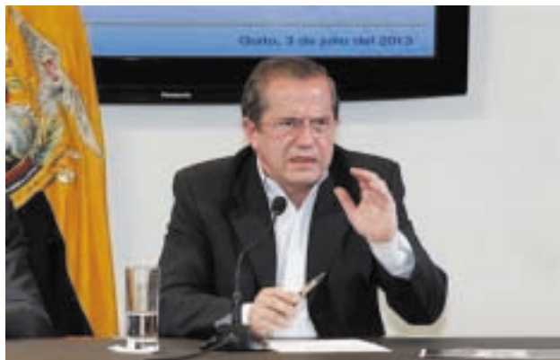
Ecuador's Foreign Minister Ricardo Patino gestures during a news conference on the hidden spy microphone uncovered at the office of Ana Alban, the Ecuadorean ambassador to the United Kingdom, in Quito, on 3 July, 2013.

NEW YORK, 26 Sept — South American nations are jointly exploring the creation of a communications system to curtail US spying in the region, Ecuadorean Foreign Minister Ricardo Patino said on Wednesday.