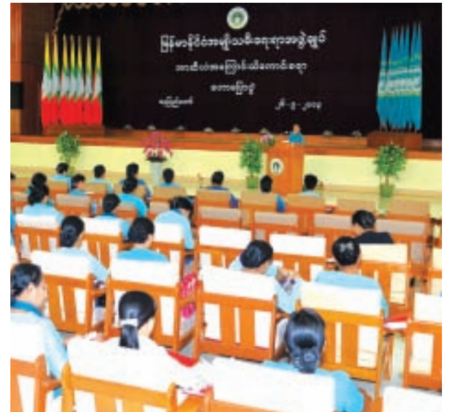
A talk on facts about ASEAN in progress.