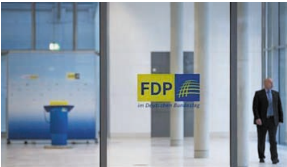
A man walks in the lobby of the former faction rooms of the Free Democratic Party (FDP) in the building of the lower house of parliament, the Bundestag, in Berlin, on 24 Sept, 2013.