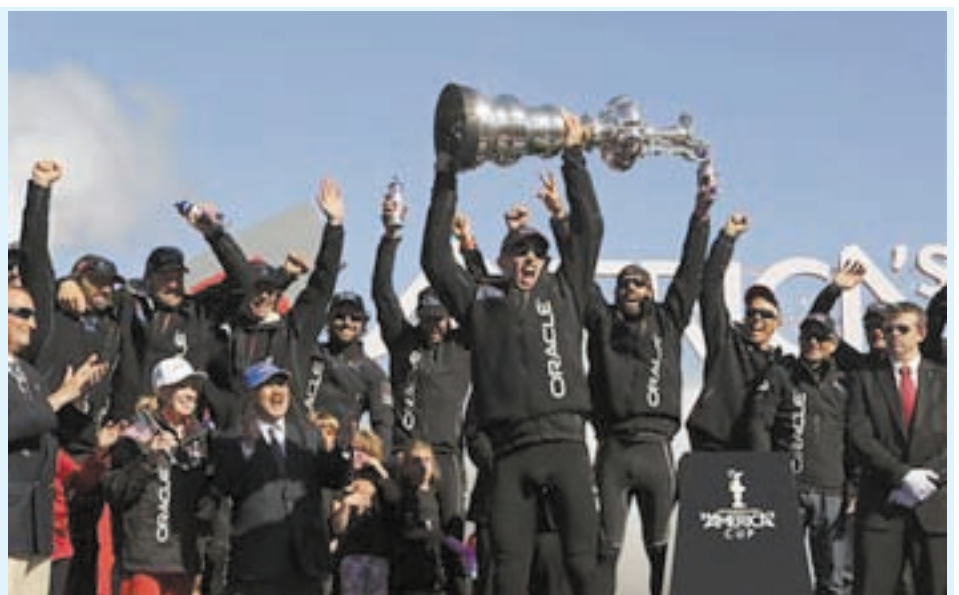
Skipper James Spithill lifts the America's Cup with members of the Oracle Team USA after winning the overall title of the 34th America's Cup yacht sailing race over Emirates Team New Zealand in San Francisco, California on 25 Sept, 2013.