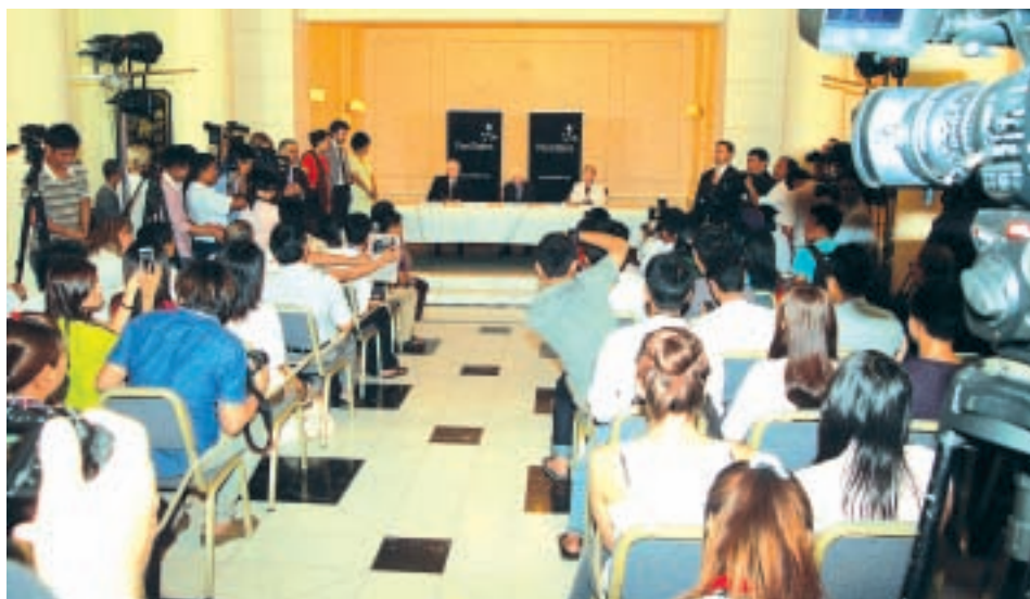
The Elders meet the press.