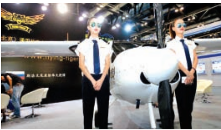
Models demonstrate short wings during the 15th Aviation Expo in Beijing, capital of China, on 25 Sept, 2013. The four-day event kicked off at the China National Convention Centre on Wednesday.

She said she was at the shopping mall with her children for a shopping spree, and while escaping she saw the wounded woman and grabbed her and ran away with her to the road before she met assistance from the police.