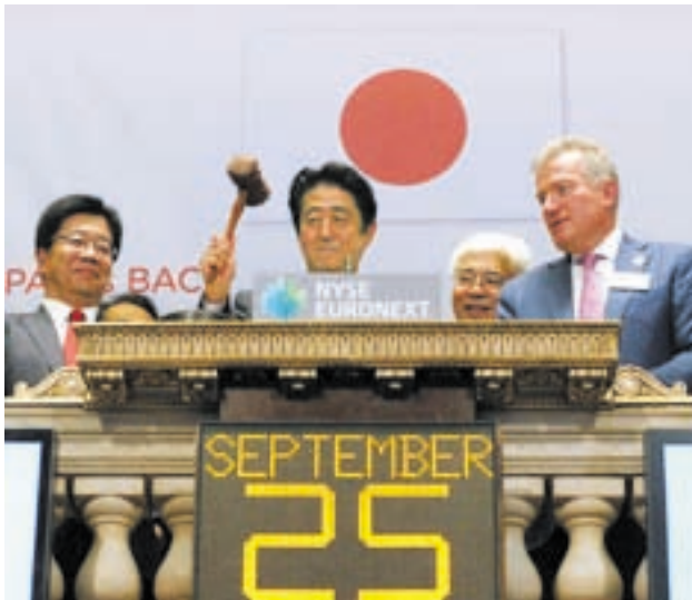
Japanese Prime Minister Shinzo Abe rings the closing bell the New York Stock Exchange in New York on 25 Sept, 2013.

NEW YORK, 26 Sept—Japanese Prime Minister Shinzo Abe told Wall Street on Wednesday that alongside his push for deregulation and empowering women to spur the economy, Japan will contribute its nuclear safety technology to the world by overcoming the Fukushima crisis.