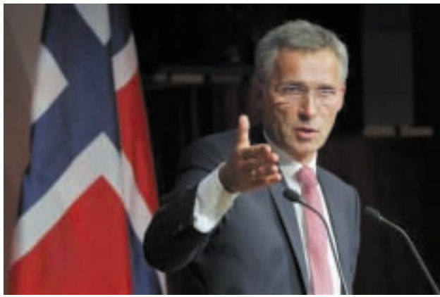
Norway's Prime Minister Jens Stoltenberg answers a question from the audience following his speech at the Kennedy School of Government at Harvard University in Cambridge, Massachusetts on 25 Sept, 2013.

"That way the fund lasts forever," he told an