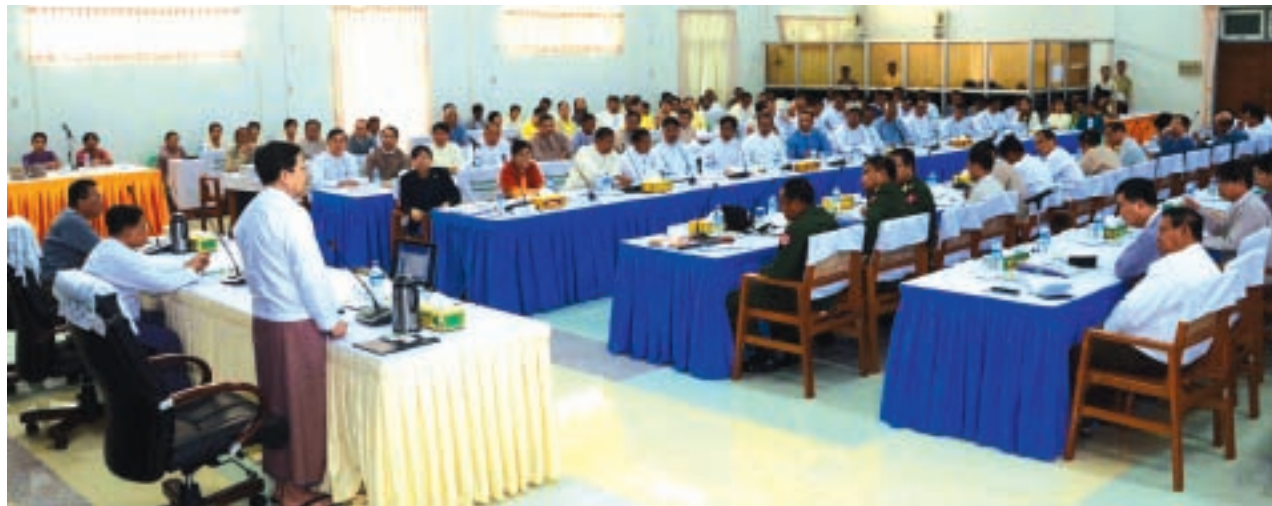
A work coordination meeting on fund allocation, economic development and economic and planning of the Union ministries, organizations and region and state governments in progress.

to fulfill the requirements of people in implementing people-centered development in the first five-year term of National Comprehensive De-