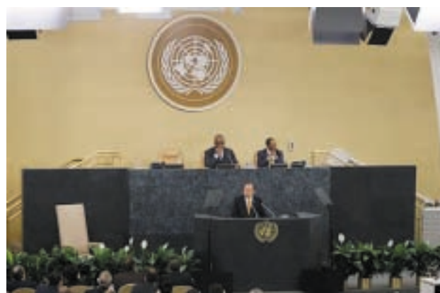
UN Secretary-General Ban Ki-moon (C) addresses the start of the 68th United Nations General Assembly at UN headquarters in New York, on 24 Sept, 2013.