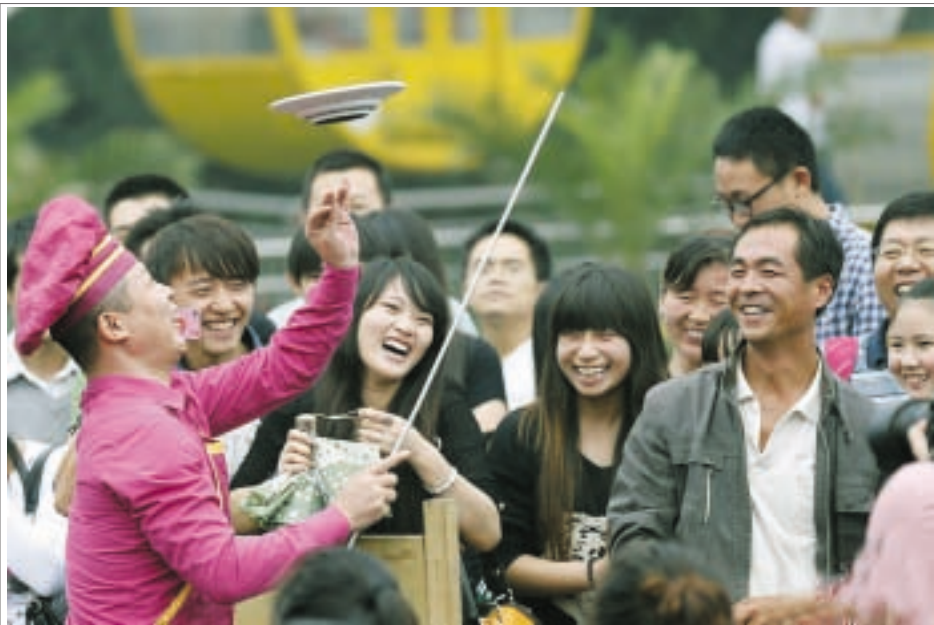
The 2013 Beijing Gourmet Culture Carnival kicked off on 19 Sept in Beijing Shijingshan Amusement Park. Apart from food from across the world, there are singing and dance performances, parades, painting exhibitions and other interactive activities. The carnival will run until on 7 October.