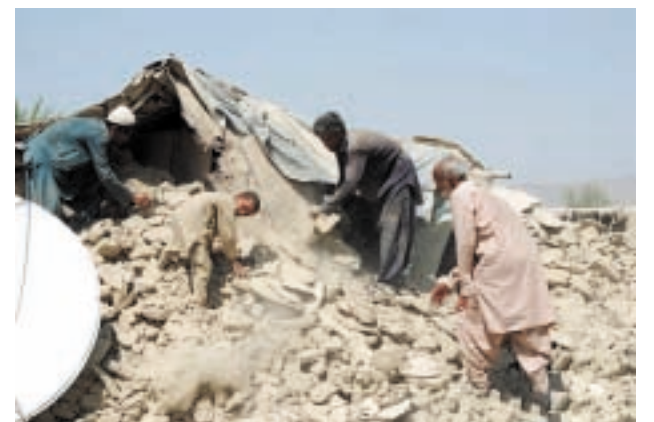
Pakistani survivors search for household items in the debris of their destroyed houses in the earthquake-devastated district of Awaran in southwest Pakistan's Balochistan Province on 25 Sept, 2013.—XINHUA

The 2013-2014 France-Vietnam-year will be an opportunity to concretely implement priorities between the two countries, said Hollande.—Xinhua