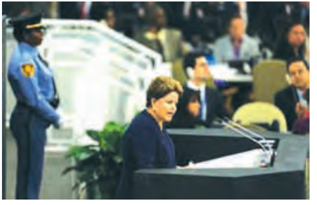
Brazil's President Dilma Rousseff addresses the 68th United Nations General Assembly at UN headquarters in New York, on 24 Sept, 2013.

In unusually strong language, Rousseff launched a blistering attack on US surveillance, calling it an affront to Brazilian sovereignty and "totally unacceptable." "Tampering in such