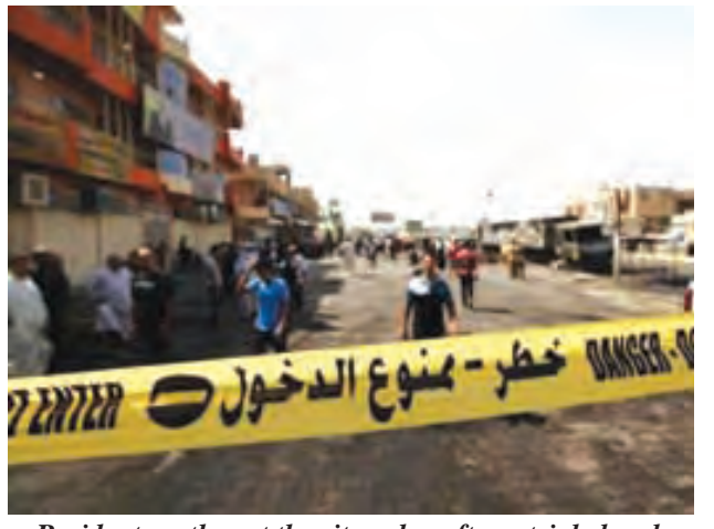
Residents gather at the site a day after a triple bomb attack in Baghdad's Sadr City, on 22 Sept, 2013.