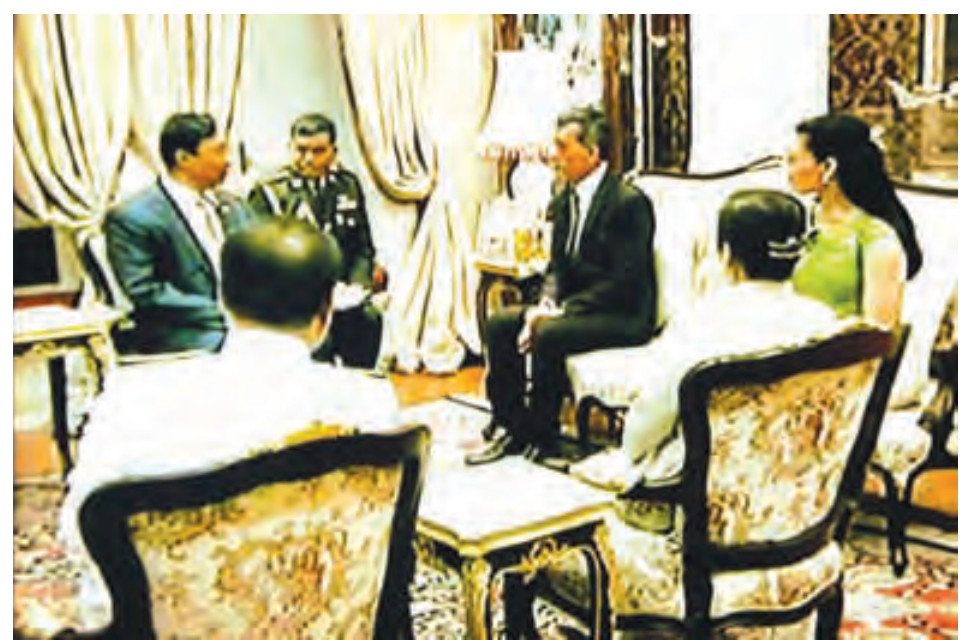
Speaker of Pyidaungsu Hluttaw Thura U Shwe Mann hold talks with Crown Prince of Thailand Maha Vajiralongkorn at Shukhothai Palace in Bangkok.

This morning, Pyidaungsu Hluttaw Speaker Thura U Shwe Mann and party visited PTT Group in Chonburi Province. MNA