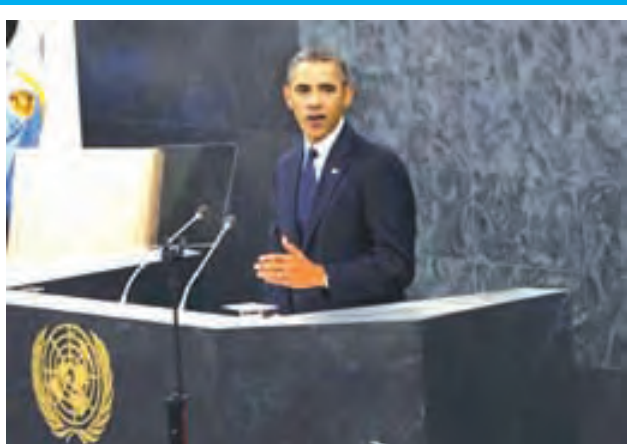
United States President Barack Obama addresses the 68th United Nations General Assembly in New York, on 24 Sept, 2013.

Obama, in closely watched remarks on Iran based on a diplomatic opening offered by Iran's new president, Hassan Rouhani, said the United States wants to resolve the Iran nuclear issue peacefully but is determined to prevent Iran from developing a nuclear weapon. "The roadblocks may prove to be too great but