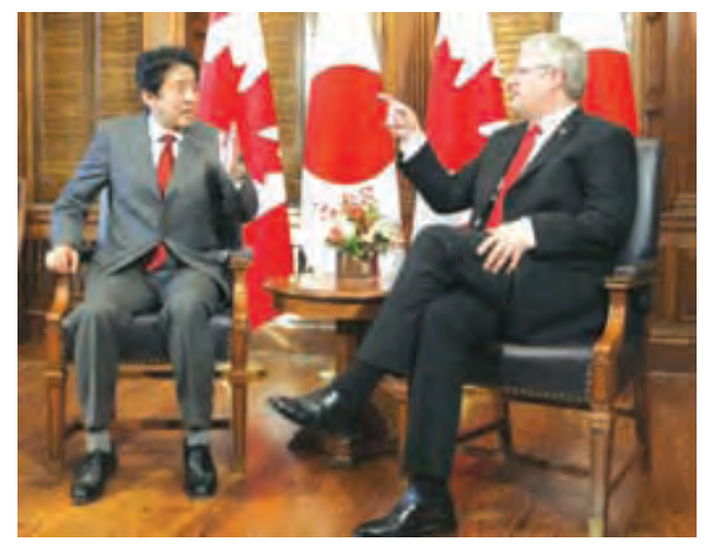
Japanese Prime Minister Shinzo Abe (L) holds talks with Canadian Prime Minister Stephen Harper in Ottawa on 24 Sept, 2013.

Shale gas, a relatively cheaper source of energy, is expected to help reduce ris-