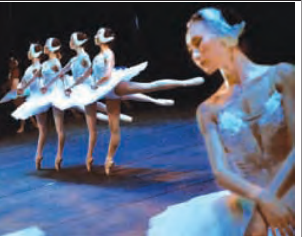
Ballet dancer of China's Central Ballet Troupe rehearse classic Swan Lake in Paris, France, on 24 Sept, 2013. China's Central Ballet Troupe will give performances of the classic Swan Lake and Chinese ballet Red Detachment of Women here from 25 Sept to 3 Oct.

Yuwono added that such an education programme was now crucially important for Indonesia due to its geographical position that makes the world's largest archipelago country prone from the impacts of climate change.—Xinhua