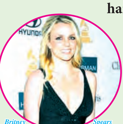
says that she loves food and it is hard for her to stay away from pizzas.

"Cute girl! But that ain't me! I know the poor girl was like, 'Why are they taking pictures of me!!' Wow!," posted on Twitter.-PTI