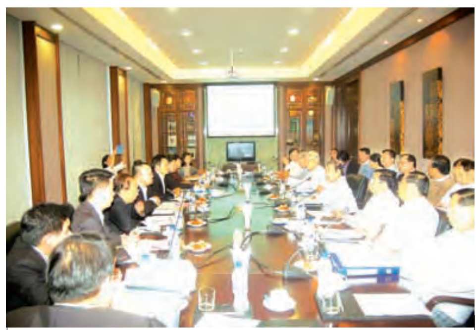
Preliminary work coordination meeting on implementation of Dawei Special Economic Zone and related projects in progress.—MNA

YANGON, 25 Sept— Myanmar and Thailand held a preliminary work coordination meeting at Embassy of Thailand, here, this afternoon.