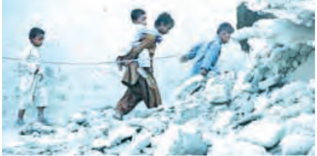
Survivors of an earthquake walk on rubble of a mud house after it collapsed following the quake in the town of Awaran, southwestern Pakistani province of Baluchistan, on 25 Sept, 2013.

throughout the remote and thinly populated area, officials said. Pakistan's army airlifted hundreds of soldiers to help with the aftermath of