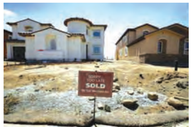
Toll Brothers luxury homes are shown sold before their completion in Oceanside, California, on 30 Aug, 2013.

NEW YORK, 25 Sept-US home prices gained in July even as a dip in confidence consumer this month underscored the potential for higher interest rates and a sluggish economy to dent a housing market recovery.