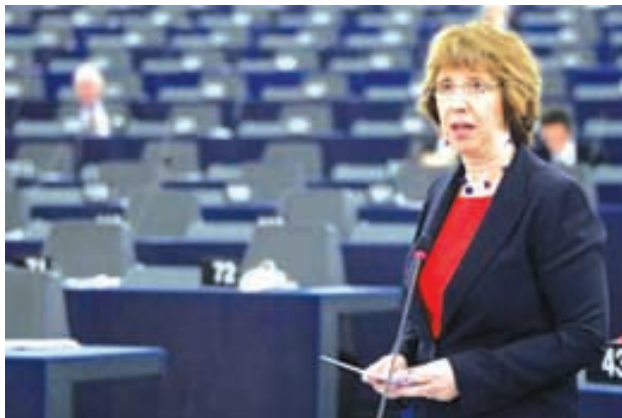
European Union foreign policy chief Catherine Ashton addresses the European Parliament in Strasbourg on Sept 24.

“We talked about a number of important issues that focused on the nuclear issue,” Ashton told reporters after meeting Zarif ahead of this week’s UN General As-