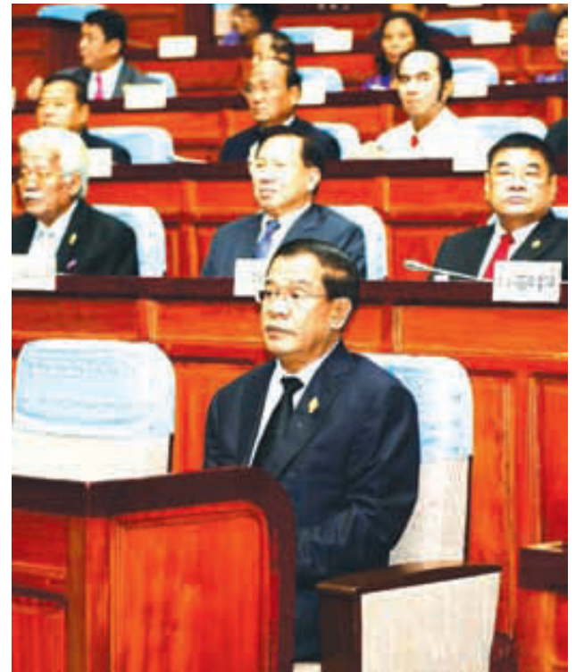
Cambodian Prime Minister Hun Sen Front attends the parliamentary session in Phnom Penh on 24 Sept, 2013. Cambodian ruling party's 8 newly elected lawmakers on Tuesday elected Hun Sen as the prime minister of the new government despite the boycott of the opposition's lawmakers.

liance at the Royal Palace first since they failed to do it on Monday due to their boycott of parliamentary opening session. The country held a general election on 28 July. The results showed that the ruling Cambodian People's Party (CPP) of Prime Minister Hun Sen won 80 out of the 235 parliamentary seats and the Cambodia National Rescue Party (CNRP) of long-time opposition leader Sam Rainsy got 55 seats. But the opposition refused to accept the outcome and boycotted the opening session of the fifth legislature of the national assembly under the patronage of King Norodom Sihamoni on Monday. Under the country's constitution, a new government was formed by a 51 percent plus one majority, or 133 lawmakers, in the new