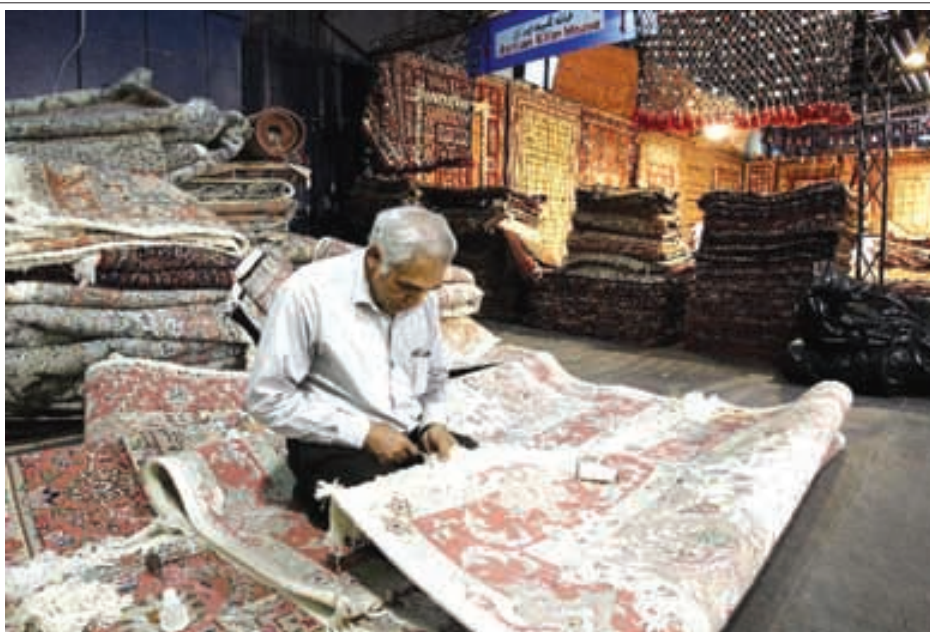
A man weaves a carpet at the 22th international hand woven carpet exhibition in Tehran, capital of Iran, on 23 Sept, 2013. The seven day long fair opened here on Monday.

ILO Director-General Guy Ryder said the fight against child labour was moving in the right direction but progress was still too slow.