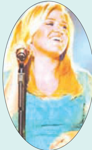
Kelly Clarkson performs "Don't Push" during the 48th A.M. Awards in Las Vegas on April, 2013.

The singer, who became the first contestant to win the American Idol more than a decade ago, bought the turquoise and gold antique ring at an auction last year for more than 5,000 pounds ($22,000). Culture Minister David Cameron placed a temporary export ban on the ring,