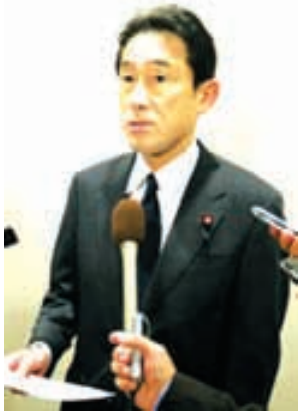
Japanese Foreign Minister Fumio Kishida addresses reporters at the United Nations headquarters in New York on Sept 24 after meeting with Iranian Foreign Minister Mohammad Javad Zarif.

Kishida also said he told Zarif that Japan hopes Iran will play a “constructive role” toward settlement of the crisis in civil war-racked Syria, where chemical weapons were used against civilians. Iran has traditionally close ties with Syria. Rouhani recently showed willingness to