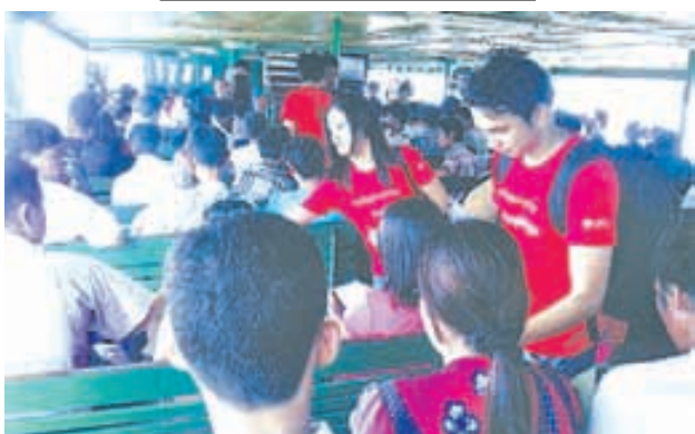
Volunteers distribute anti-human trafficking pamphlets to passengers of Yangon-Dala vessel.

Take Preventive Measures against Dengue Haemorrhagic Fever