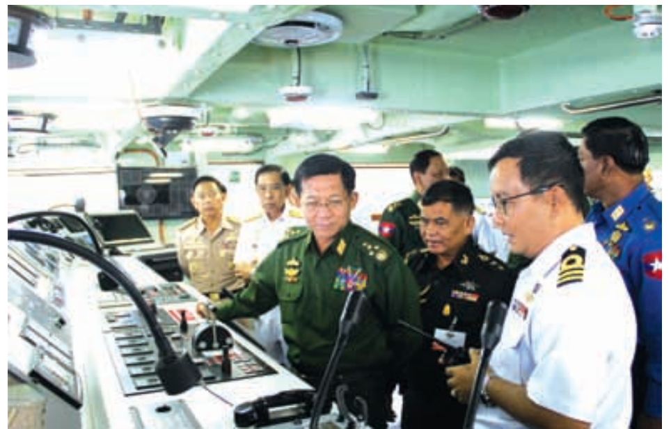
Commander in Chief of Defence Services Senior General Min Aung Hlaing observes war vessel of Royal Thai Navy.

Both Myanmar and Thailand have Buddhist majorities and similar culture and customs. The ethnic peoples are also similar. With the Myanmar political process after 2011, those affinities have acquired a greater significance. During the period of the new Government, visits have been exchanged by the leaders of the two countries and historical milestones established. Friendship sporting events have been organized for the Armed Forces of the two countries and cooperation in the greater Mekong