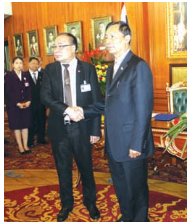
Pyidaungsu Hluttaw Speaker Thura U Shwe Mann shakes hands with President of the National Assembly of Thailand Mr. Somsak Kiatsuranont.

In the evening, the Speaker of Pyidaun su Hluttaw and Pyit u Hluttaw