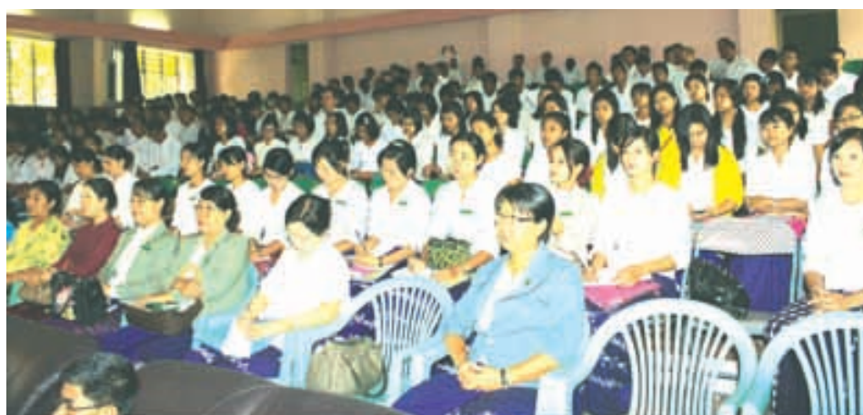
Liaison officers for 27th SEA Games at training session in Nay Pyi Taw.