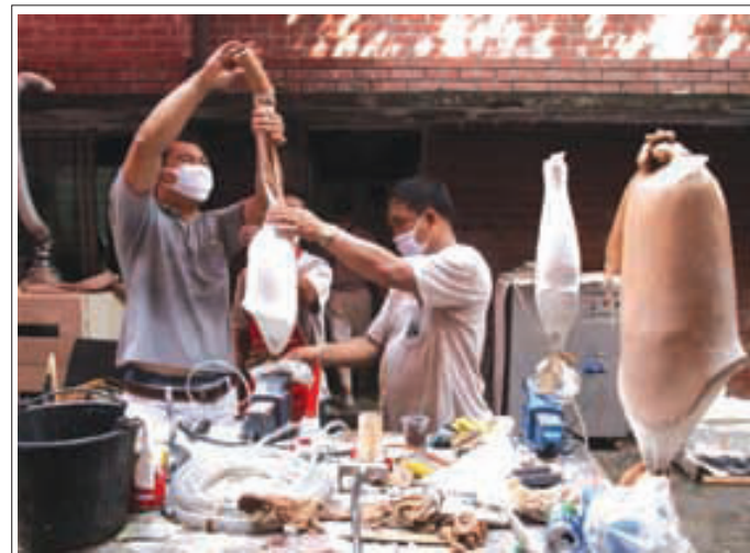
Members of a Thai medical team produce prosthetic legs at the National Institute of Traumatology and Orthopaedic Rehabilitation in Dhaka, Bangladesh, on 23 Sep, 2013. A 3 member Thai medical team on Sunday arrived in Dhaka to provide prosthetics to 100 Bangladeshi amputees, including 100 Rohingya victims.