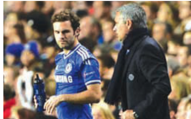
Chelsea's manager Jose Mourinho prepares to bring on substitute Juan Mata during their Champions League soccer match against Arsenal at Stamford Bridge in London on 18 Sept, 2013.

Pandev, Milito, Torres and Schneider were the front four. Three of those