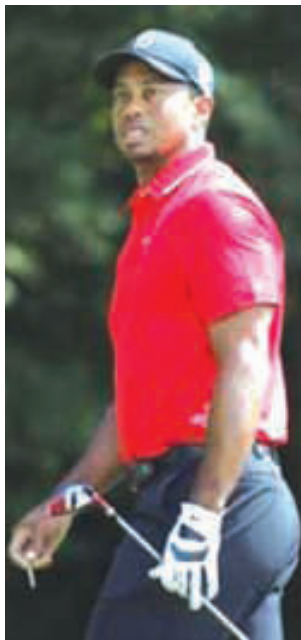
Tiger Woods of the US watches his tee shot on the third hole in the final round of the Tour Championship golf tournament at East Lake Golf Club in Atlanta, Georgia on 22 Sept, 2013.

Woods had the most successful year, Stenson ended it in spectacular style with two FedEx Cup