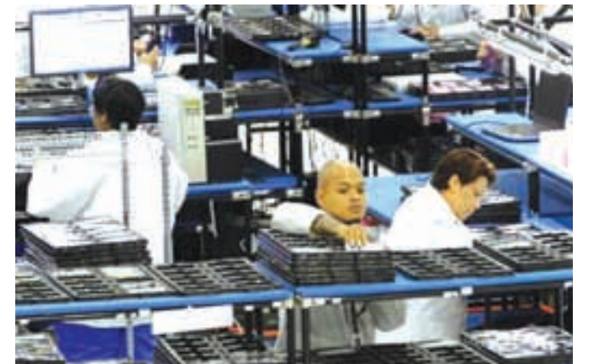
Workers assemble Motorola phones at the Flextronics plant that will be building the new Motorola smart phone 'MotoX' in Fort Worth, Texas on 10 Sept, 2013.