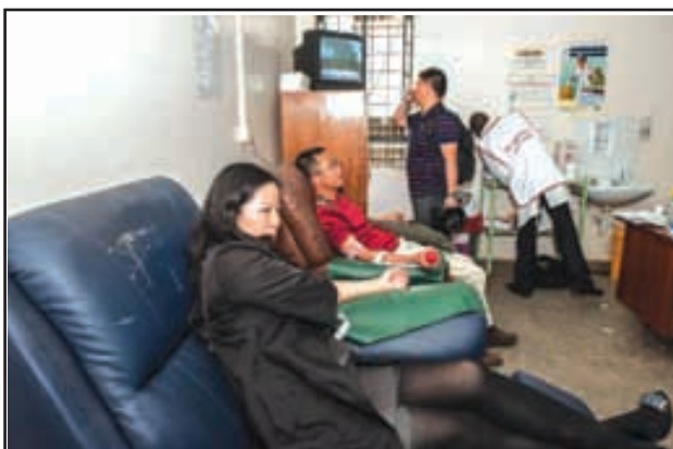
Chinese people donate blood at a blood donation station in Airobi on Sept 24. Many Chinese working in Kenya gathered to donate their blood for those injured during the Westgate mall attack since last Saturday.