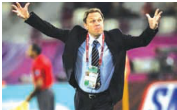
Australia's coach Ange Postecoglou celebrates during their 2011 Asian Cup semi-final soccer match against Uzbekistan at Khalifa stadium in Doha on 2 Jan, 2011.

Under-fire Australia coach Ange Postecoglou has dumped veteran goalkeeper Mark Schwarzer for friendlies against France and Canada after the Socceroos led goals in a humiliating defeat by World Cup hosts France earlier this month.