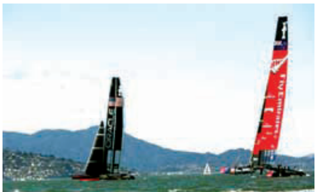
Oracle Team USA holds a lead against Team New Zealand during race 1 of the 34th America's Cup yacht sailing race in San Francisco, California on 23 Sept, 2013.

The Oracle wind delayed the start of the race on Monday