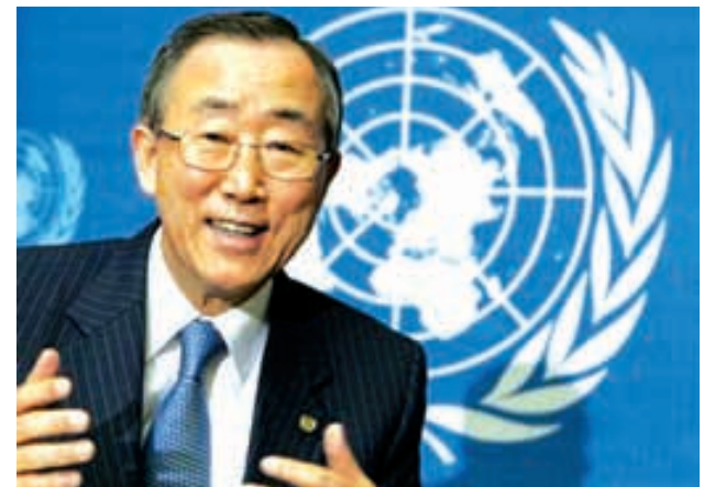
UN Secretary-General Ban Ki-moon gestures during a news conference during the UN global impact leaders summit at the United Nations European headquarters in Geneva on Sunday.