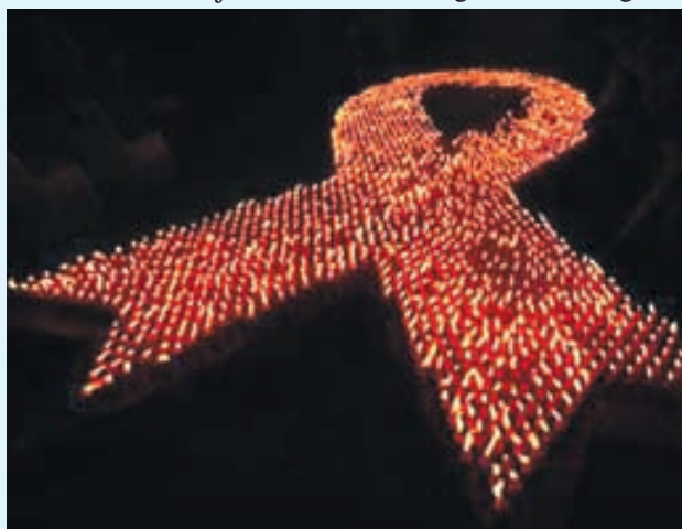
About 2880 candles are seen lit during a World AIDS Day event in Jakarta on 1 December, 2009.—REUTERS

Total funding for the global fight against HIV and AIDS in 2012 was $18.9 billion, about $3 billion to $5 billion short of the estimated $22 billion to $24 billion needed annually by 2015.—Reuters