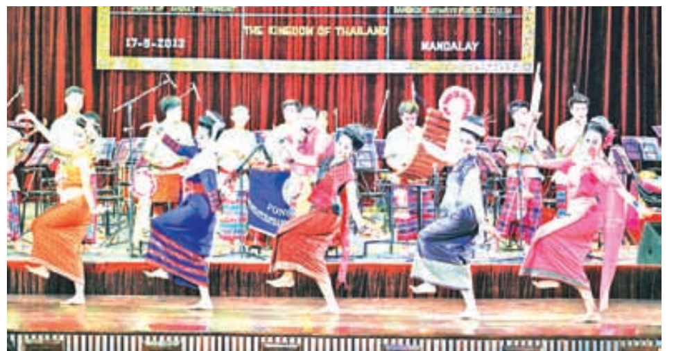
Dancers from Ubon Rachathani University of Thailand and music band perform entertainment to audience to mark launching Bangkok-Mandalay direct flight.