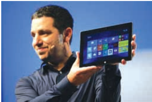
Panos Panay, Microsoft Surface general manager, holds up the Microsoft Surface Pro 2 during the launch of their Surface 2 tablets in New York on 24 Sept, 2013.

The new Surface 2, which runs on a low-power chip designed by ARM Holdings Plc, starts at $449 for the 32 GB version, not including a snap-on keyboard starting at $120. That is slightly less than Apple's latest wifi-only 32GB iPad, which costs $599.