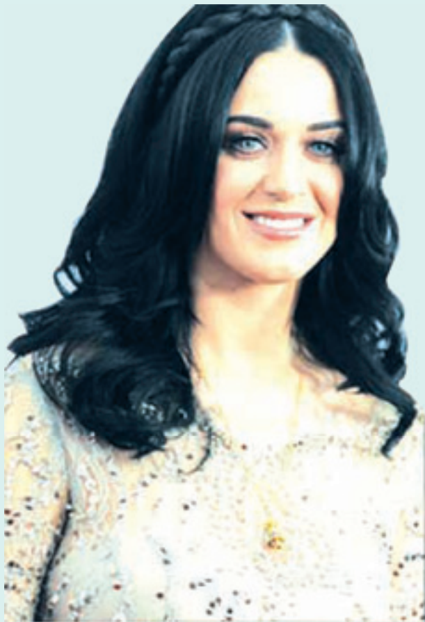
Pop star Katy Perry

LOS ANGELES, 24 Sept—Pop star Katy Perry has praised singer-actress Miley Cyrus and said she would love to collaborate with the 23-year-old singer in the future, reported online. She said of an incredible voice. Perry said. Perry also voiced her support for Cyrus, who was recently criticised by a number of other artists including Pinkey, Justin Bieber and Jessie J, following her raucous performance at the MTV Video Music Awards in New York City last month.