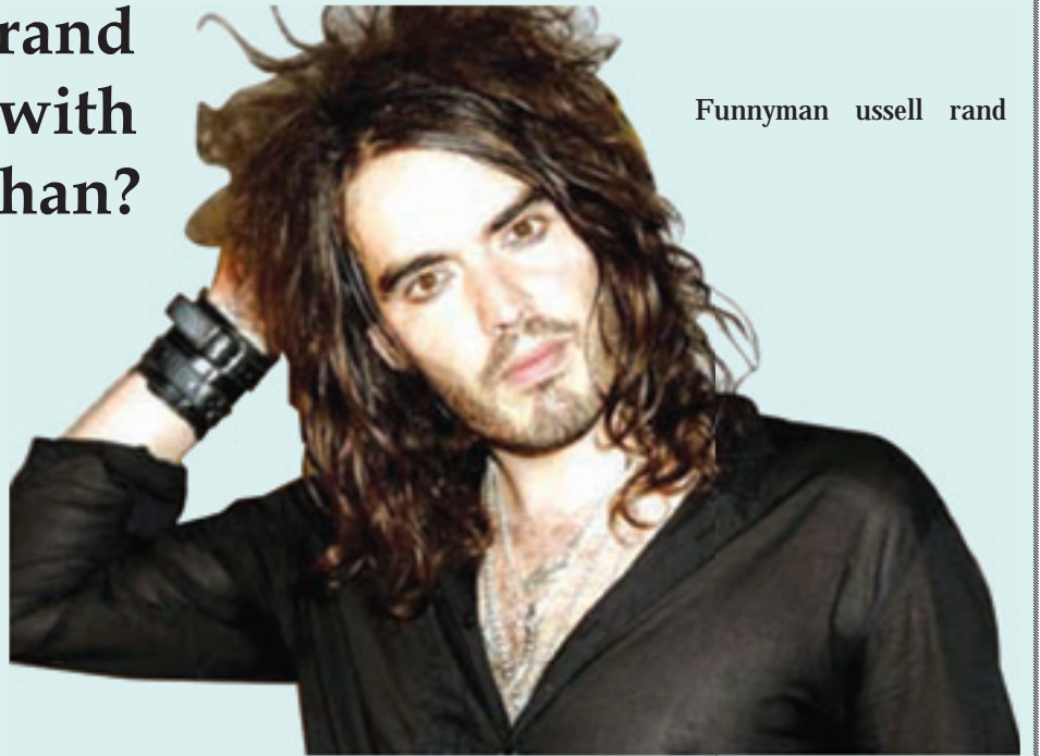
Funnyman Russell Brand

LONDON, 24 Sept—Comedian Russell Brand has reportedly become too fond of socialite Jemima Khan, which in turn is freeing her out. The 38-year-old comedian fuelled dating rumours after he was pictured walking arm in arm with Khan on recent outings, reported the Daily Mail. The socialite is reportedly finding Brand's growing affection as obsessive. "Jemima's started to get a bit freed out by Russell's relentless affection. She's described him as compulsive and obsessive, a source said.