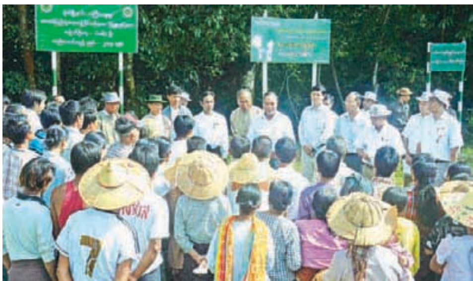
Union Minister U Win Tun clarifies establishment of forests to local people in Taunggyi District.—MNA

NAY PYI TAW, 23 Sept—Union Minister for Environmental Conservation and Forestry U Win Tun inspected forest plantation, protected public forests and forest research and watershed administrative stations in Taunggyi District, Shan State on 21 and 22 September.