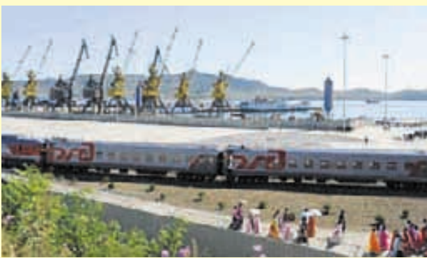
Photo shows a special train after its arrival at Rajin Port in Rason, a special economic zone in northeastern North Korea, from Khasan in the Russian Far East, on 22 Sept, 2013. After years of work to directly connect railway tracks between Russia and North Korea, a 54-kilometre section linking border areas of the two countries reopened the same day.

In 2008, the two countries started work to lay Russia-sized railway tracks from the Russian border area to Rajin Port after Russian President Vladimir Putin and then North Korean