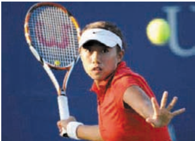
Zhang Shuai of China returns the ball to Angelique Kerber of Germany during the French Open tennis tournament at the Roland Garros stadium in Paris on 27 May, 2012.

BEIJING, 23 Sept—Zhang Shuai was aware of the risks involved when she opted to "Fly Alone" two months ago but the 24-year-old Chinese now stands vindicated after winning her maiden WTA Tour title on Saturday.