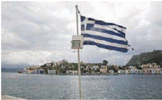
A Greek flag flutters at the port of the Greek southeastern island of Kastelorizo on 15 April, 2013. Picture taken on 15 April, 2013.

ATHENS, 23 Sept — Greece and its lenders are close to agreeing that Greece will achieve a primary budget surplus this year, a senior Finance Ministry official told report-