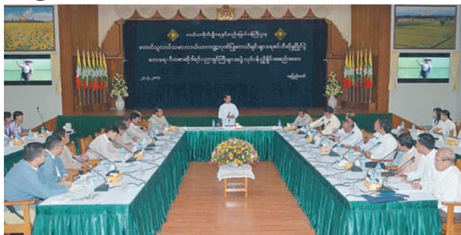
Union Minister U Myint Hlaing addresses work coordination meeting.

He also called for collaborative efforts between musicians and composers