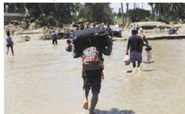
Villagers carry their belongings through a stream after the road was destroyed by floodwaters in Coyuca de Benitez, in the Mexican state of Guerrero, on 21 Sept, 2013.

Mexico's president called for a quick state-by-state evaluation of damage to be overseen by the country's interior minister that "will allow us to add resources beyond those already budgeted for contingency and disaster funds to rebuild infrastructure that has sadly been lost."