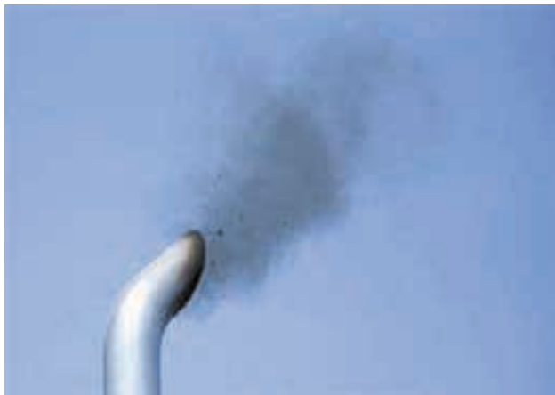
A truck engine is tested for pollution exiting its exhaust pipe as California Air Resources field representatives (unseen) work a checkpoint set up to inspect heavy-duty trucks traveling near the Mexican-US border in Otay Mesa, California on 10 Sept, 2013.

OSLO, 23 Sept—Scientists meet on Monday to prepare the strongest warning yet that climate change is man-made and will cause more heatwaves, droughts and floods this century unless governments take action. Officials from up to 195 governments and scientists will meet in Stockholm from 23-26 September to edit a 31-page draft that also tries to explain why the pace of warming has slowed this century despite rising human emissions of greenhouse gases.