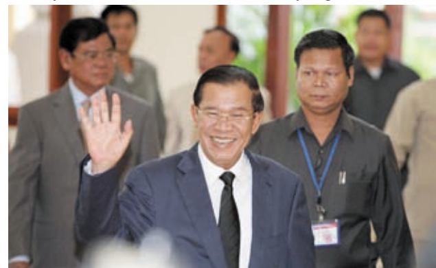
Cambodian Prime Minister Hun Sen (C) waves to reporters at the National Assembly in Phnom Penh, Cambodia, on 17 Sept, 2013.

In response to the appointment, Prime Minister Hun Sen thanked the king and vowed to put all his efforts to fulfill his duties in order to serve the nation and the people.