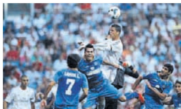
Real Madrid's Cristiano Ronaldo heads the ball during their Spanish first division soccer match against Getafe at Santiago Bernabeu stadium in Madrid on 22 Sept, 2013.

of the campaign after the break, and after Getafe were reduced to 10 men, Ronaldo grabbed his second at the end with a clever backheel.