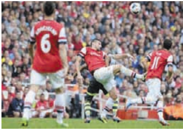
Arsenal's Olivier Giroud (C) goes for the ball during Arsenal's English Premier League soccer match against Stoke City at the Emirates Stadium, London, England on 22 Sept, 2013.—REUTERS

Moyes was deprived of injured striker Robin van Persie on Sunday but offered no excuses for a woe-filled display.—Reuters