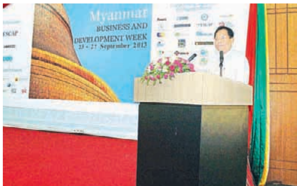
Union Minister U Win Myint delivers an address at Seminar on Myanmar Business and Development Week.