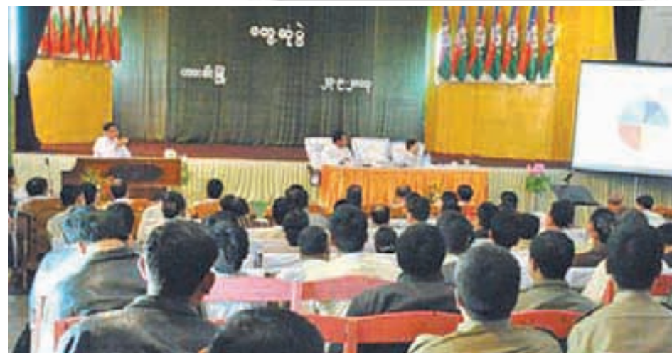
A meeting between the Union Ministers and locals in Chin State in progress.—MNA

TDSC and TDAC reported on measures on education, health, electrification, transportation, agriculture, supply of drinking water,