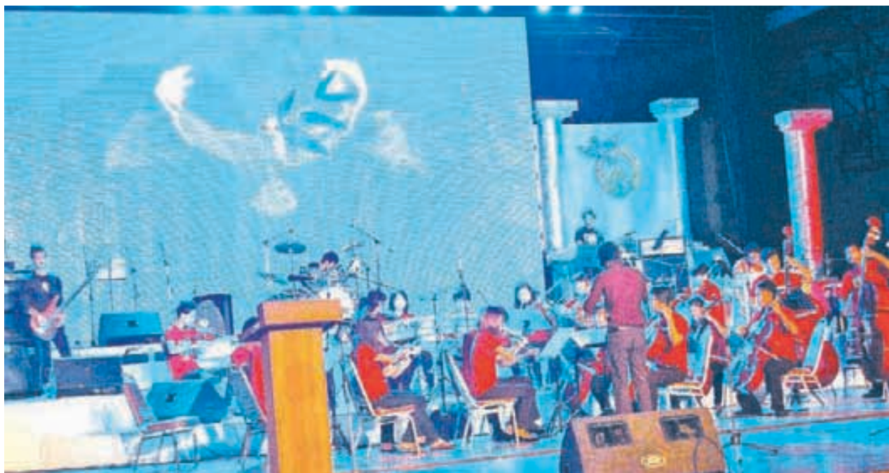
Peace Music Concert-2013 Myanmar in progress at National Theatre in Yangon.

YANGON, 23 Sept—Peace Music Concert-2013 Myanmar conducted by Peace Music Group was staged at the National Theatre here this evening.