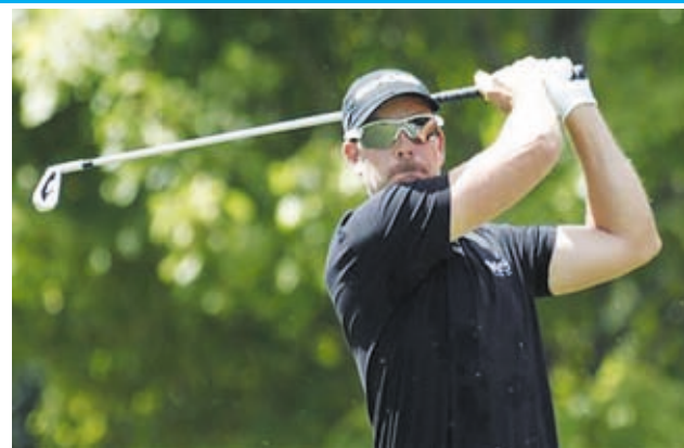
Henrik Stenson of Sweden hits off the second tee in the final round of the Tour Championship golf tournament at East Lake Golf Club in Atlanta, Georgia on 22 Sept, 2013.

sation Spieth, seeking his second victory of the year, closed with an eight-birdie (65). American Steve Stricker (65) closed with an eight-birdie (64) to finish in a tie for sec-