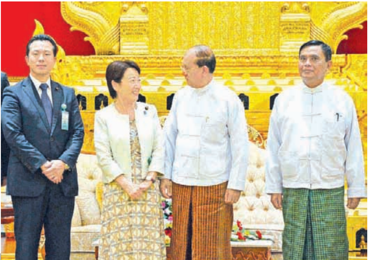
President U Thein Sein cordially converses with MP Ms Eriko Yamatani of the House of Councilors of Japan at the Credentials Hall of the Presidential Palace.