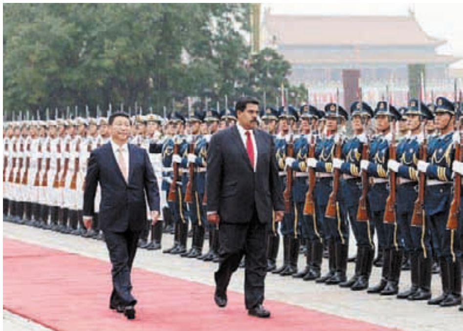
Chinese President Xi Jinping (L) holds a welcoming ceremony for his Venezuelan counterpart Nicolas Maduro before their talks in Beijing, capital of China, on 22 Sept, 2013. Xi held talks with Maduro on Sunday.

BEIJING, 23 Sept—China and Venezuela on Sunday pledged to seek a stronger strategic partnership. The pledge came out of the talks