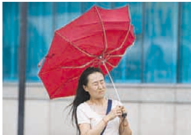
A woman's umbrella is turned over due to strong wind caused by Super typhoon Usagi in south China's Hong Kong, on 22 Sept, 2013. Super typhoon Usagi moves to Southern Chinese coastal provinces at a speed of up to 20 km per hour and is expected to hammer Hong Kong's neighbouring Guangdong Province on Sunday night, according to local authorities.

On Monday, 14 cities in Guangdong, including the provincial capital of Guangzhou, Shenzhen, and Zhuhai, as well as neighbouring Hong Kong and Macao, had still suspended school classes and air, railway and shipping traffic as a precaution against the storm.