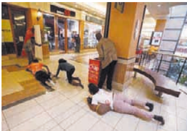
People scramble for safety as armed police hunt gunmen who went on a shooting spree at Westgate shopping centre in Nairobi, on 21 Sept, 2013.