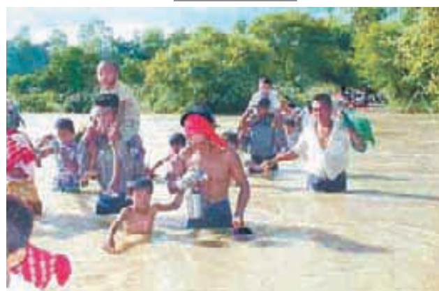
Local authorities including police, firefighters and the village-tract administrators evacuate the flood victims in Thanzalon village in Koehtaung village-tract along Ayeyawady River as the flood escalate to erode river banks in Seikpyu Township in Magway Region.