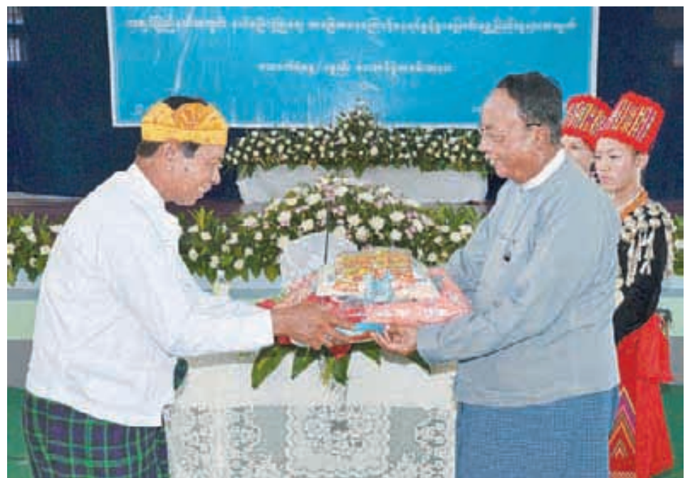
Speaker of Amyotha Hluttaw U Khin Aung Myint gives a present to a local people.

Speaker U Khin Aung Myint, Union Minister U Soe Maung, Chief Minis-