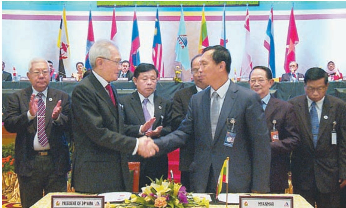
Speaker of Pyidaungsu Hluttaw and Pyithu Hluttaw Thura U Shwe Mann shakes hands with the President of AIPA.

NAY PYI TAW, 23 Sept — Speaker of Pyidaungsu Hluttaw and Pyithu Hluttaw Thura U Shwe Mann together with Pyidaungsu Hluttaw representatives attended the closing ceremony of the 34 th General Assembly of ASEAN Inter-Parliamentary Assembly at the Empire Hotel and Country Club in Bandar Seri Begawan of Brunei yesterday morning.