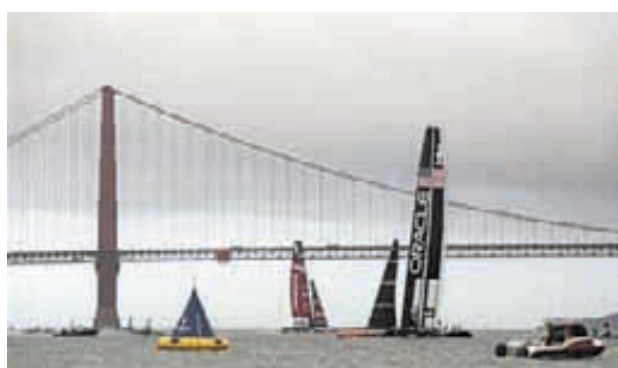
Emirates Team New Zealand (L) and Oracle Team USA sail near the Golden Gate Bridge before the scheduled Race 14 of the 34th America's Cup yacht sailing race in San Francisco, California on 21 Sept, 2013.

Oracle's winning streak has narrowed New Zealand's overall lead to 8-5, but the Kiwis still only need one more race to take home the trophy.—Reuters