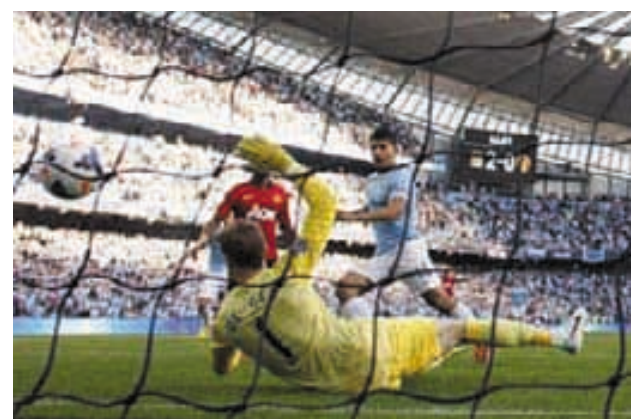
Manchester City's Sergio Aguero (R) shoots to score against Manchester United during their English Premier League soccer match at the Etihad Stadium in Manchester, northern England, on 22 Sept, 2013.