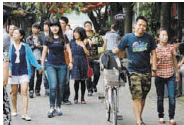
People walk in Nanluogu lane which is temporarily designated as a car-free zone during the World Car Free Day in Beijing, capital of China, on 22 Sept, 2013.

BEIJING, 23 Sept—More than 150 Chinese cities including Beijing observed World Car Free Day on Sunday to fight air pollution, but the capital remained clogged with traffic jams.