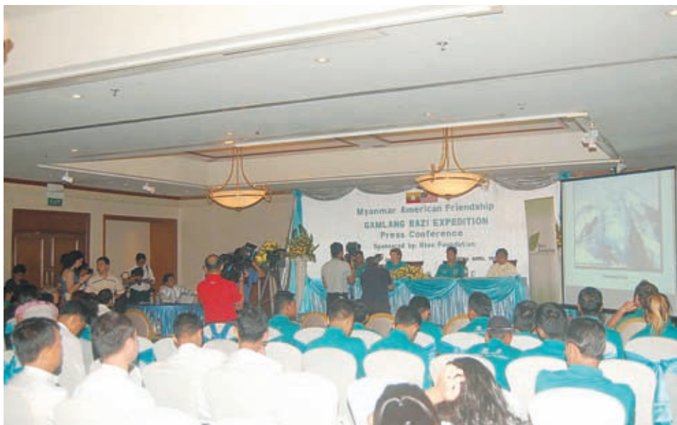
Press conference on Myanmar-American Friendship Gamlang Razi Expedition in progress.