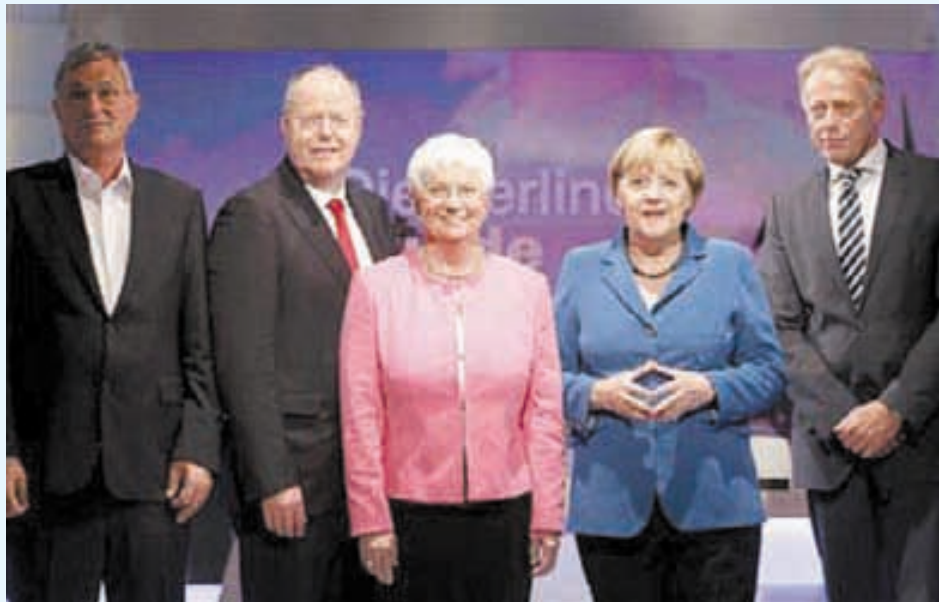
Die Linke top candidate Bernd Riexinger, Social Democratic Party (SPD) top candidate Peer Steinbrueck, Christian Social Union (CSU) Bundestag faction leader Gerda Hasselfeldt, Christian Democratic Union (CDU) party leader and German Chancellor Angela Merkel and Greens (Die Gruenen) top candidate Juergen Trittin (L-R) pose after a TV discussion regarding the German general election (Bundestagswahl) results, at the ZDF studios in Berlin on 22 Sept, 2013.

BERLIN, 23 Sept — Angela Merkel won a landslide personal victory in Germany's general election on Sunday, but her conservatives appeared just short of the votes needed to rule on their own and may have to convince leftist rivals to join a coalition government.