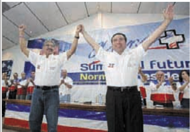
Norman Quijano (L) of El Salvador's Nationalist Republican Alliance party (ARENA), a candidate for the 2014 presidential election, and Rene Portillo Cuadra (R), vice presidential candidate, take part in the ARENA General Assembly, in San Salvador, capital of El Salvador, on 22 Sept, 2013.

Our collective hearts are heavy with sympathy, sharing the great loss together with the bereaved family. MOPTA Family