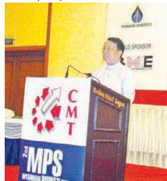
Union Minister U Khin Maung Soe speaking at opening of Second Myanmar Power Summit.—MNA

The Ministry of Electric Power and Centre for Management Technology (CMT) of Singapore jointly organized the Summit that will run up to 25 September. — MNA