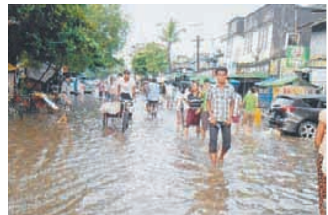
Due to heavy rains, railway Station Road in Hline Township was inundated at 1 am on 21 September.—KYEMON-686