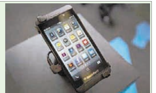
A BlackBerry Z10 is displayed at a store in Toronto on 5 February, 2013.

The company has struggled ever since Apple Inc’s iPhone and Samsung