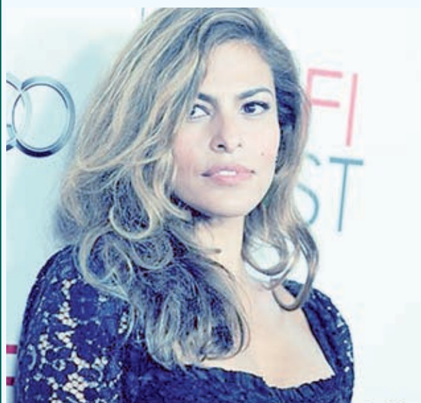
Hitch star Eva Mendes