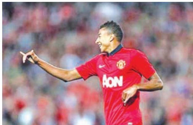
Manchester United's Jesse Lingard celebrates after scoring against A-League All Star XI during their friendly match in Sydney on 20 July, 2013.

another Manchester United player out on loan, scored both goals for Doncaster Rovers as they held in-form Nottingham Forest to a 2-2 draw in their second division game.