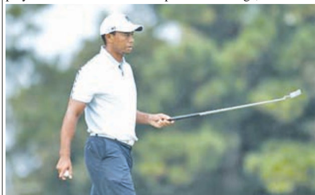
Tiger Woods of the US walks off the green on the eighth hole during the third round of the Tour Championship golf tournament at East Lake Golf Club in Atlanta, Georgia on 21 Sept, 2013.

Asked how much he was focused on winning the FedExCup title, Stenson replied: "First of all, I'm interested in winning the tournament, and I know, if I do that, then I'm going to win the FedExCup. We're just trying one more day."—Reuters