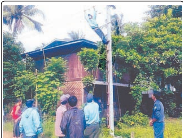
Staff of Township Electrical Engineer Office are installing 480-ft long 400 Volt grid in Htargon village (5) in Pyu in Toungoo District in Bago Region on 14 September.—MMAL-IPRD