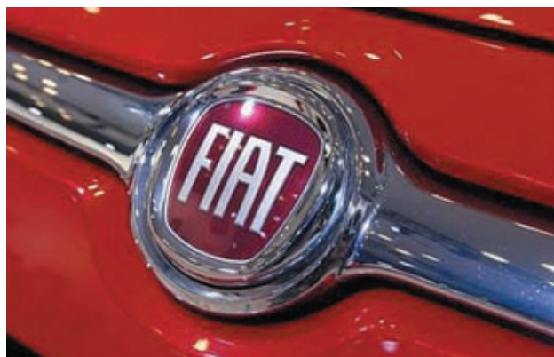
A Fiat logo is seen on a car during a press preview at the 2013 New York International Auto Show in New York, on 28 March, 2013.

MILAN, 22 Sept—The Italian carmaker Fiat (FIA.MI) is planning to take full control of the diesel engine manufacturer VM Motori by buying out the half of the company owned by joint venture partner General Motors (GM.N), Fiat said on Saturday.