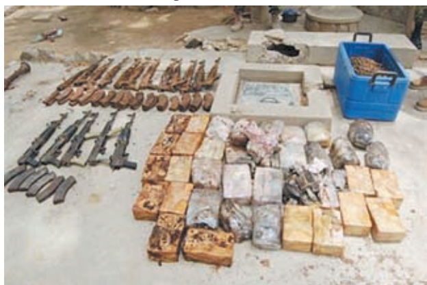
Ammunition and explosives seized from suspected members of Hezbollah are displayed after a raid of a building in Nigeria's northern city of Kano on 30 May, 2013.—REUTERS

Nigeria, with support from Israel, says it has uncovered a Hezbollah cell and arms cache and arrested has locals it accuses of spying for Iran. A resource-rich but poorly policed part of the world, which already sees al Qaeda-linked activity, could see future Hezbollah attacks, some Western experts say.—Reuters