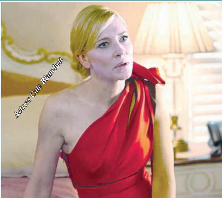
Actress Cate Blanchett

“New York and Company came to me with the opportunity, and I have been a fan of theirs for years. My first reaction was nervous, I was like, ‘I’m not sure I have anything to offer’. But I accepted the challenge with one goal: to make women look good,” Mendes said.— PTI