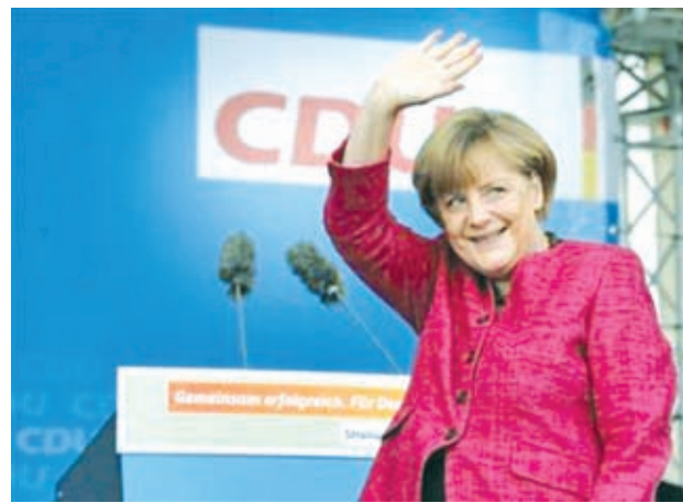
German Chancellor and conservative Christian Democratic Union (CDU) leader Angela Merkel waves to supporters during a CDU election campaign rally in Stralsund on 21 Sept, 2013.

Led by a group of renegade academics, lawyers