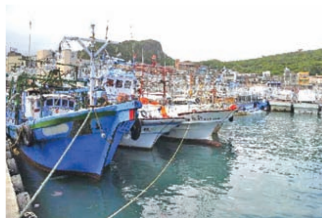
Fishing boats stay in a harbour to avoid typhoon Usagi in Xinbei City, southeast China's Taipei, on 20 Sept, 2013.

Guangdong government has issued warnings and activated the second highest alert for disaster response. Local authorities have been send-