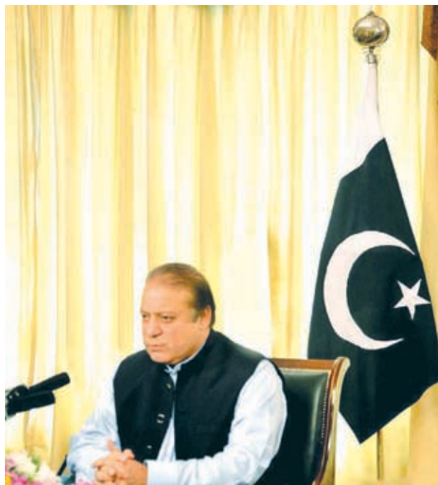
Photo released by Press Information Department (PID) on 21 Sept, 2013, shows Pakistani Prime Minister Nawaz Sharif addressing the Nation over TV and Radio Network in Islamabad, capital of Pakistan. Pakistani Prime Minister Nawaz Sharif on Saturday launched several welfare schemes for youth with initial allocations of twenty billion rupees (about 189.4 million US dollars).

He said the micro-interest free loan scheme is targeted at disadvantaged sections of the society and will benefit 250,000 people. An allocation of 3.5 billion rupees has been made during the current financial year. The Small Business Loan Scheme has been designed for the unemployed, especially educated youth, to enable them to start their own businesses. Under the scheme, loans ranging from 500,000 to 2 million rupees would be advanced to youth at concessionary mark-up rate of 8 percent and the remaining burden of the