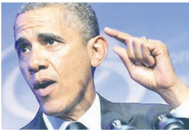
US President Barack Obama addresses the Congressional Black Caucus Foundation Annual Phoenix Awards Dinner in Washington, on 13 Sept, 2013.

The Obama administration has largely moved on to other priorities since