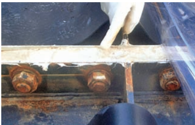
Supplied photo shows bolts at the bottom of a tank that has leaked about 300 tons of toxic water at the Fukushima Daiichi nuclear power plant. Plant operator Tokyo Electric Power Co said on 20 Sept, 2013, that five bolts at the bottom of the huge cylindrical tank were found to be loose. The tank is one of around 300 containing highly radioactive water at the plant.

TOKYO, 22 Sept—A senior official of the ruling Liberal Democratic Party has proposed to Prime Minister Shinzo Abe that Tokyo Electric Power Co be split up through the creation of a company in charge of decommissioning reactors at the crippled Fukushima Daiichi nuclear power plant, a party official said on Saturday.