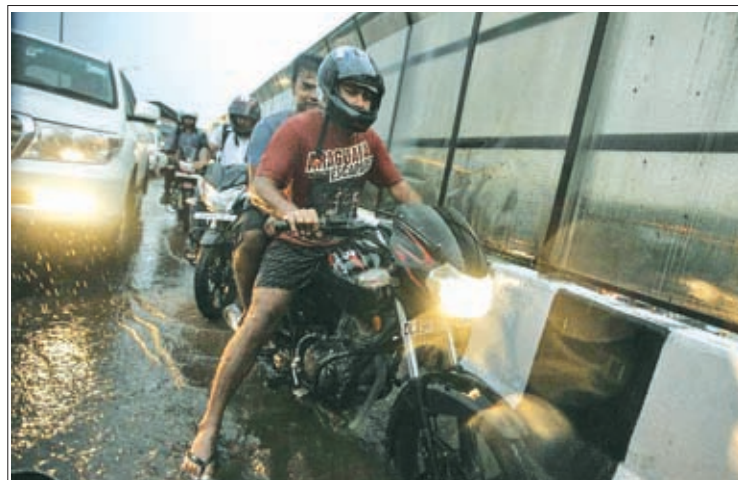
People ride motorcycles on a water-logged road in New Delhi, India, on 21 Sept, 2013. A heavy rain hit New Delhi on Saturday and many streets were flooded by the rainwater, causing traffic jams and inconvenience for local people.