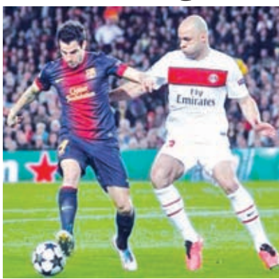
Barcelona's Cesc Fabregas (L) and Paris St Germain's Alex challenge for the ball during their Champions League quarter-final second leg soccer match at Camp Nou stadium in Barcelona on 10 April, 2013.