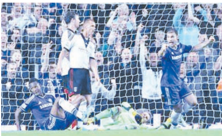
Chelsea's John Obi Mikel (L) celebrates scoring his goal against Fulham with Branislav Ivanovic (R) during their English Premier League soccer match at Stamford Bridge in London on 21 Sept, 2013.