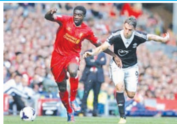
Liverpool's Kolo Toure (L) challenges Southampton's Jay Rodriguez during their English Premier League soccer match at Anfield in Liverpool, northern England on 21 Sept, 2013.

Fulham keeper David Stockdale could only parry a cross from Andre Schuerrle as well as Samuel Eto'o's follow-up and the