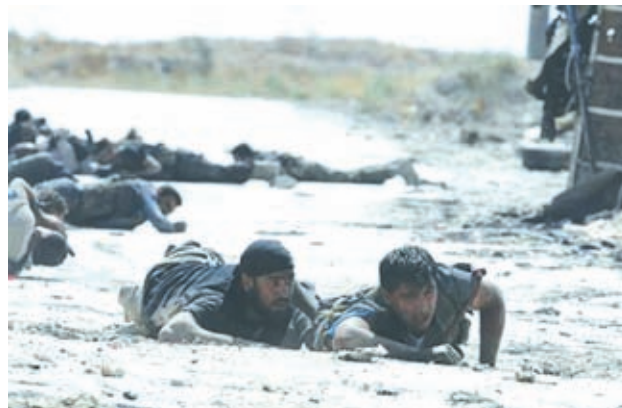
Free Syrian Army fighters take cover from snipers by crawling on the front line in Aleppo's Sheikh Saeed neighbourhood on 21 Sept, 2013.