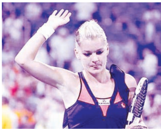
Agnieszka Radwanska of Poland walks off the court after losing her match to Ekaterina Makarova of Russia at the US Open tennis championships in New York, on 1 Sept, 2013.

Top-seeded Radwanska continued her good form on her Seoul debut, having dropped just 11 games in four matches, and needed 64 minutes to thrash the Spaniard, ranked 113 in the world.