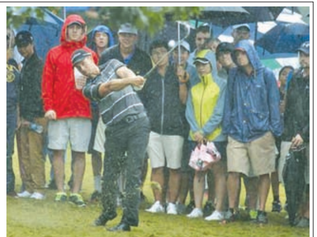
Henrik Stenson of Sweden hits from the rough off the 17th fairway during the third round of the Tour Championship golf tournament at East Lake Golf Club in Atlanta, Georgia on 21 Sept, 2013.

four-shot lead and I've still got it, so that's all that matters really. I had it going, and I had a much larger lead than that for a while.