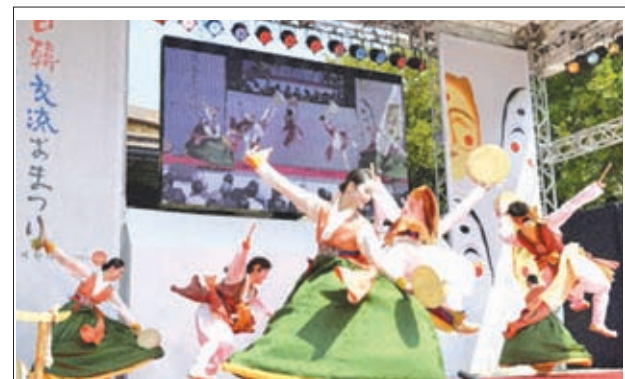
A South Korean traditional performing art is demonstrated during a Japan-South Korea exchange festival at Tokyo's Hibiya Park on 21 Sept, 2013.