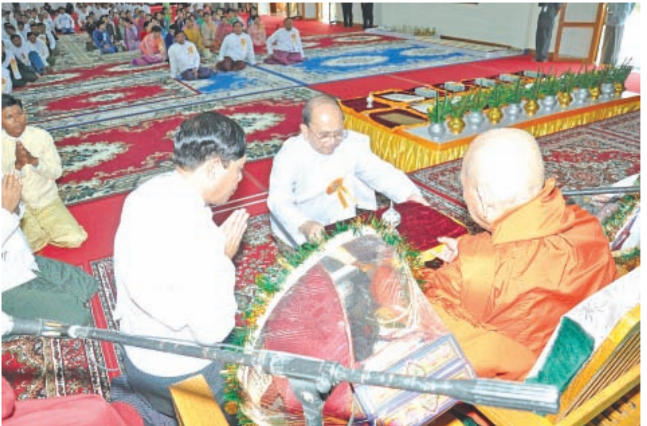
President of the Republic of the Union of Myanmar U Thein Sein offers alms to a Sayadaw.

Vice-President Dr Sai Mauk Kham and wife, and Vice-President U Nyan Tun (See page 8)