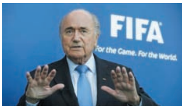
FIFA President Sepp Blatter addresses the media after meeting the presidents of the soccer federations of Israel and Palestine at the FIFA headquarters in Zurich on 3 Sept, 2013.

"We hope the international community will respect the Kenyan people's choice, and the ICC will heed the advice of African nations and the African Union," he said.— Xinhua