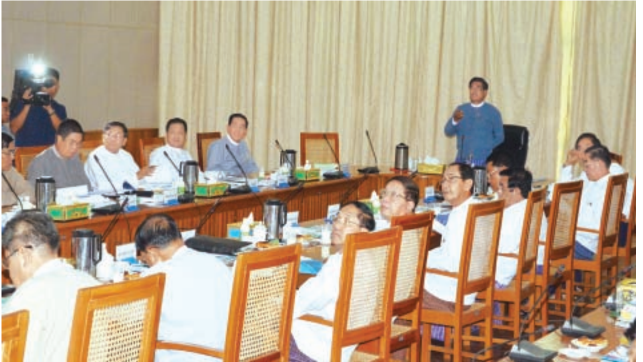
Vice-President U Nyan Tun delivers an address at coordination meeting of the Rural Region Electrification and Water Supply Committee.—MNA