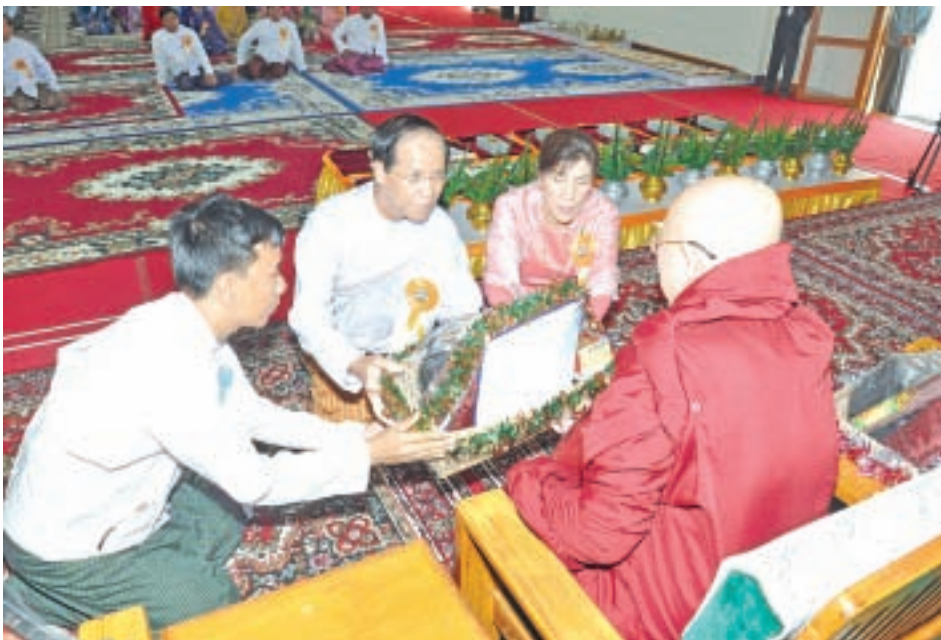
Vice-President Dr Sai Mauk Kham and wife Daw Nan Shwe Hmon presents offertories to a Sayadaw.