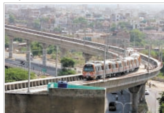
The Jaipur Metro train is seen during its trial run in Jaipur, India, on 18 Sept, 2013.—XINHUA

The accident occurred on the same day when five people choked to death after inhaling poisonous gas underground in a pyrite mine in central China's Hunan Province.—Xinhua