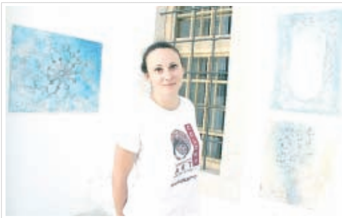
A painter stands in front of her pictures which are part of the group exhibition "Ottoman Period - 550 Years of Sarajevo" by artist from the colony, in "Hanikah" gallery in the old city, in Sarajevo, Bosnia and Herzegovina, on 18 Sept, 2013.