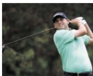
Bill Haas of the US watches his tee shot on the second hole during the third round of the Memorial Tournament at Muirfield Village Golf Club in Dublin, Ohio on 1 June, 2013 in this file picture.

Webb Simpson and Luke Donald failing to do well enough in the final round, Haas beat compatriot Hunter Mahan in a thrilling playoff to clinch the Tour Championship along with the FedExCup and its $10 million bonus.