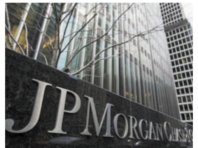
A sign stands in front of the JPMorgan Chase & Co bank headquarters building in New York, on 15 March, 2013.