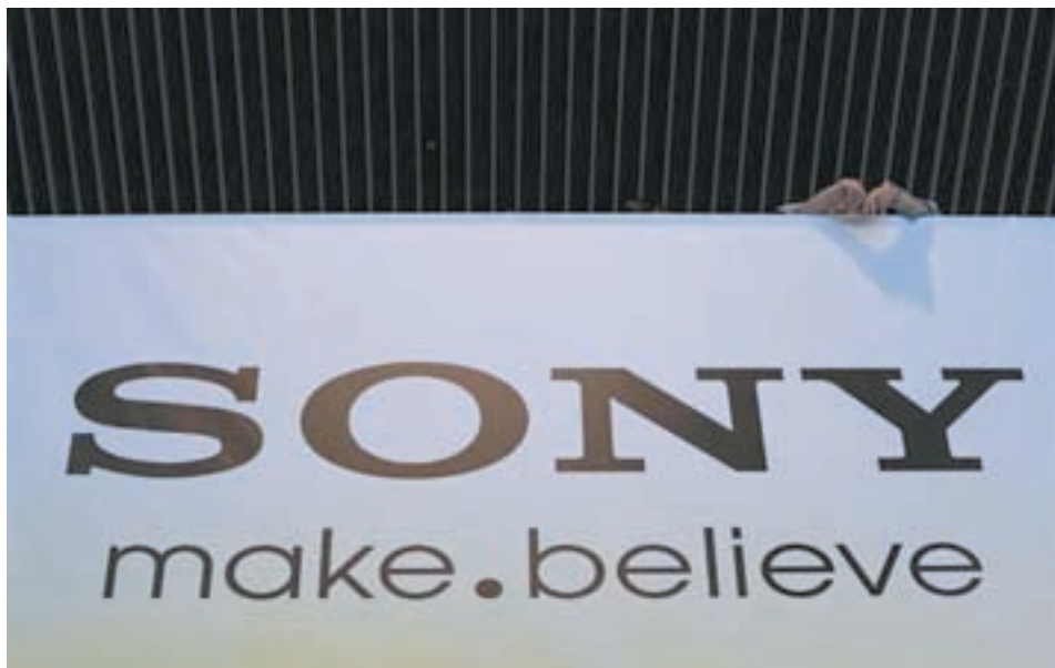
Sony Corp's logo is seen at the company headquarters in Tokyo on 22 May, 2013.