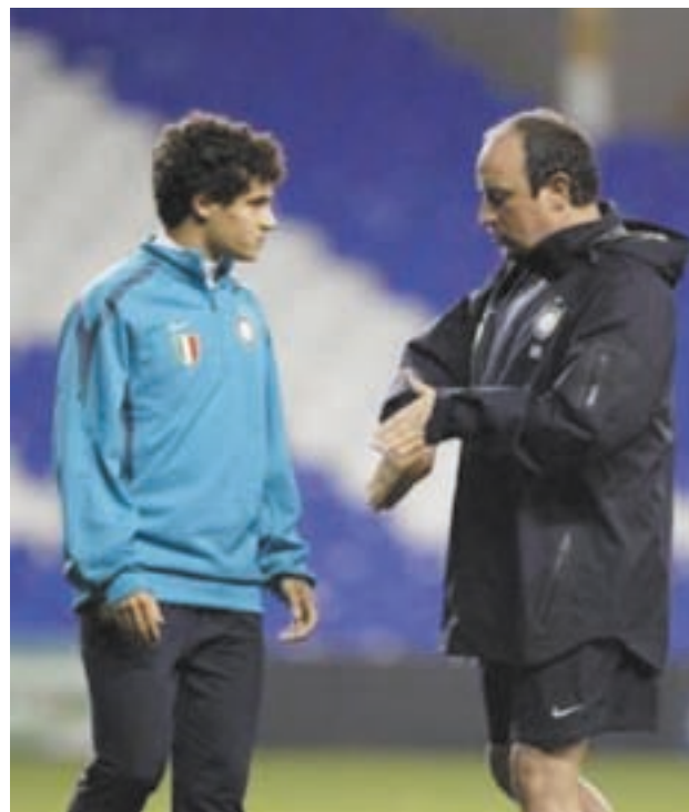
Inter Milan head coach Rafael Benitez (R) talks to Philippe Coutinho during a team training session at White Hart Lane in London on 1 Nov, 2010.