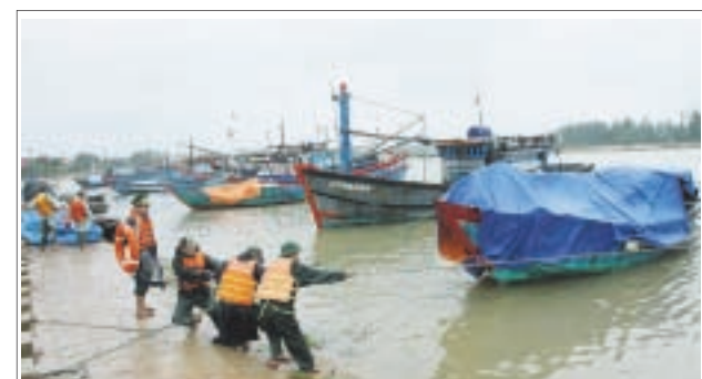
Soldiers help local fishermen pull a boat back to a harbour in Trieu Phong District of Quang Tri Province, central Vietnam, on 18 Sept, 2013. Heavy rain and tornadoes brought by a tropical depression hit Quang Tri Province on Wednesday.