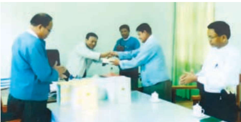
The law book presentation ceremony in progress at Bago Region Hluttaw.

BAGO, 19 Sept—Bago Region Agriculture Department presented books on agricultural laws to the region Hluttaw on 13 September morning.