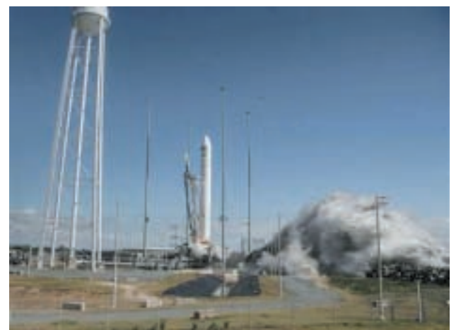
The Orbital Sciences Corporation Antares rocket, with the Cygnus cargo spacecraft aboard, launches from NASA's Wallops Flight Facility in Virginia in this handout photo taken on 18 Sept, 2013.