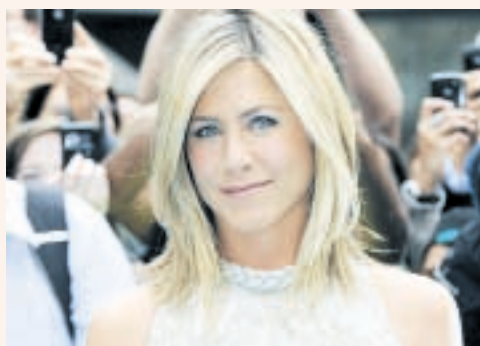
Actress Jennifer Aniston

LOS ANGELES, 19 Sept — Actress Jennifer Aniston is thrilled to work in the new movie Life Of Crime and says the script