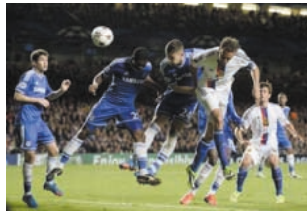
Basel's Marco Streller (R) scores a goal against Chelsea during their Champions League football match at Stamford Bridge in London on 18 Sept, 2013.