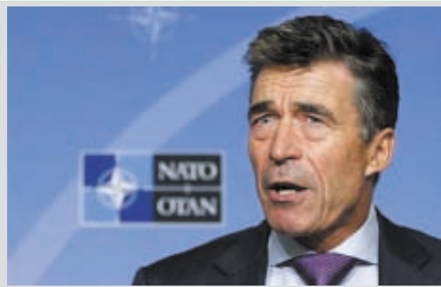
NATO Secretary General Anders Fogh Rasmussen talks to the media during a monthly news conference in Brussels on 2 Sept, 2013.

posed helping Europe’s defence industry cope with falling military budgets by funding research and aiding the development of new technologies with military uses. British Defence Secretary Philip Hammond voiced skepticism over the Commission’s proposals last week and said London would oppose any moves to enforce new rules on the region’s defence industry that damaged British com-