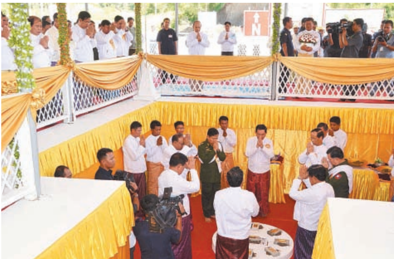
President U Thein Sein, Vice-Presidents Dr Sai Mauk Kham and U Nyan Tun at cornerstone laying ceremony for birthplace of Lord Buddha and place of administering Dhammaçakka Sutta.

over Northwest Bay of Bengal, announced the Meteorology and Hydrology Department.