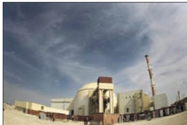
A general view of the Bushehr nuclear power plant, some 1,200 km (746 miles) south of Teheran on 26 Oct, 2010.

ade-old dispute over Teheran’s nuclear programme.