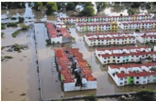
An aerial view of a flooded neighbourhood is seen in Acapulco on 17 Sept, 2013.—REUTERS

Acapulco's tourist trade was already grappling with a surge in drug gang violence, which earned the city the dubious distinction of Mexico's murder capital last year.—Reuters