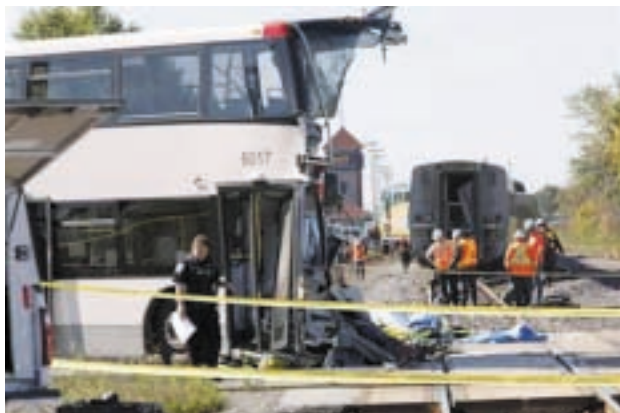
Investigators examine the scene of an accident involving a bus and a train in Ottawa on 18 Sept, 2013.

OTTAWA, 19 Sept — A passenger train and a double-decker city bus collided on the outskirts of Ottawa on Wednesday, killing six people on the bus and injuring 30 others, emergency officials said. The front of the red double-decker bus was sheared off and the engine of the VIA Rail train had derailed, but the train cars remained upright with little noticeable damage.