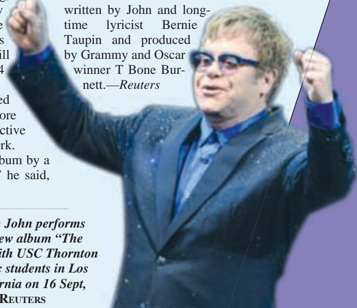
Musician Elton John performs songs off his new album "The Diving Board" with USC Thornton School of Music students in Los Angeles, California on 16 Sept, 2013.

The new album was written by John and longtime lyricist Bernie Taupin and produced by Grammy and Oscar winner T Bone Burnett.—Reuters