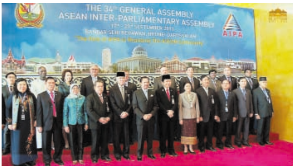
Speaker of Pyidaungsu Hluttaw and Pyithu Hluttaw Thura U Shwe Mann poses for documentary photo with Brunei King Sultan Haji Hassanal Bolkiah and parliamentary speakers at AIPA.—MNA

BRUNEI DARUSSALAM, 19 Sept—The 34 th ASEAN Inter-Parliamentary Assembly (AIPA) is taking place at Grand Hall of The Empire Hotel in Bandar Seri Begawan of Brunei Darussalam as of 17 September.