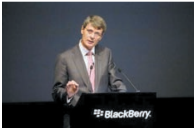
BlackBerry Chief Executive Thorsten Heins speaks at the company's annual meeting in Waterloo, Ontario on 9 July, 2013.