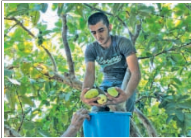
A Palestinian man harvests fresh guavas during the 2nd Guava Festival in the West Bank city of Qalqilya, on Sept. 18, 2013. Qalqilya is a major producer of guava fruit for domestic consumption and export to Jordan, Saudi Arabia and the United Arab Emirates markets.