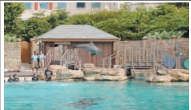
A dolphin leaps from the water at the Dolphin Island in Singapore's Resorts World Sentosa, on 18 Sept, 2013. The Marine Life Park at Singapore's Resorts World Sentosa plans to launch its dolphin interaction programmes on 30 September, the resorts said on Wednesday.