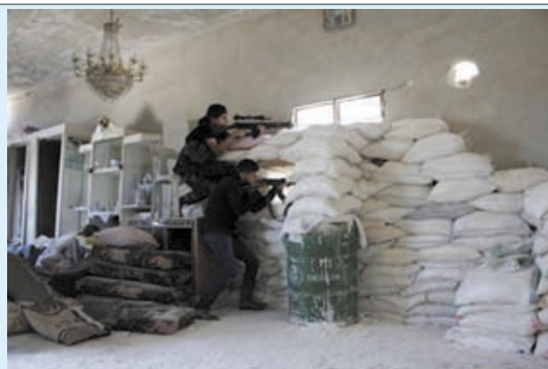
Free Syrian Army fighters stand in shooting position in Aleppo's Sheikh Saeed neighbourhood, on 15 Sept, 2013.

The number of men aged over 65 stood at 13.69 million, accounting for 22.1 percent of the overall male population. The corresponding figures for women were 18.18 million and 27.8 percent, respectively. The number of people aged over 70 stood at 23.17 million, representing 18.2 percent of the overall population, while those aged over 80 stood at 9.30 million, accounting for 7.3 percent.—Kyodo News