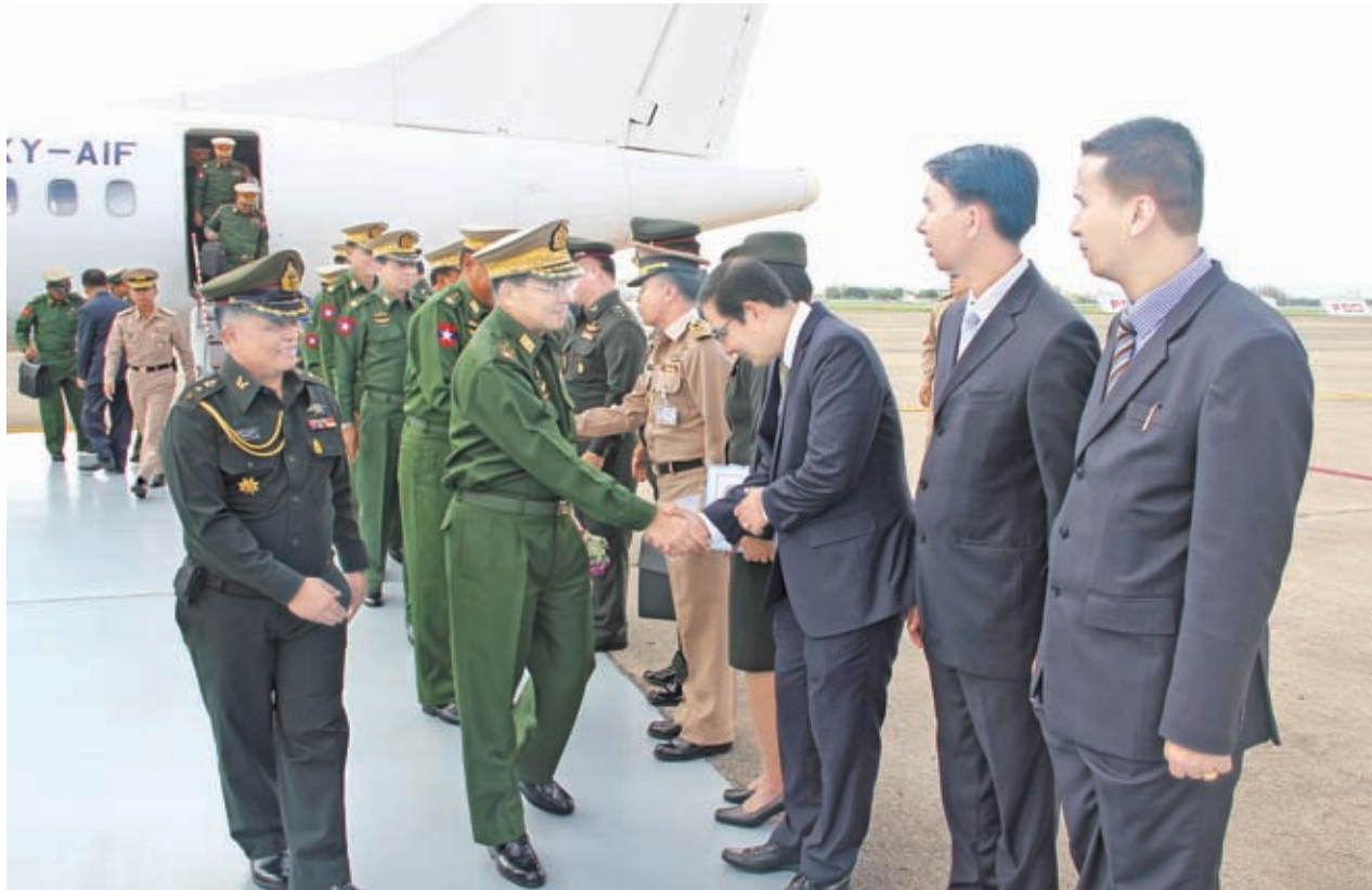
Commander-in-Chief of Defence Services Senior General Min Aung Hlaing and party being welcomed at Wing-6 of Royal Thai Air Force in Bangkok of Thailand.

NAY PYI TAW, 16 Sept—The Myanmar Tatmadaw delegation led by Commander-in-Chief of Defence Services Senior General Min Aung Hlaing left here by air yesterday to attend the 1 st Thailand-Myanmar High Level Committee Meeting to be held in Thailand and