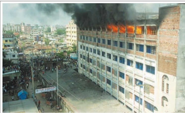
Photo taken on 15 Sept, 2013 shows a garment factory ablaze in Dhaka, Bangladesh. A six-story garment factory caught fire on Sunday, but no casualty has been reported, fire service said.