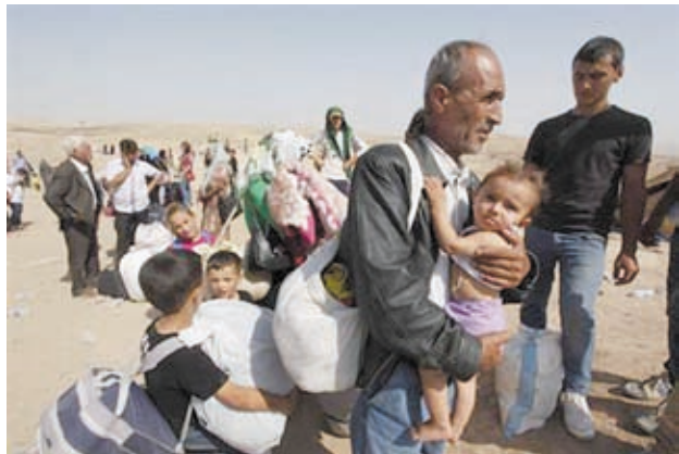
Syrian refugees, fleeing the violence in their country, cross the border into the autonomous Kurdish region of northern Iraq on 4 Sept, 2013.

ARBIL, 16 Sept — Iraqi Kurdistan has asked oil companies operating in the autonomous region for $50 million to help deal with an influx of refugees from Syria that has put a strain on its resources.