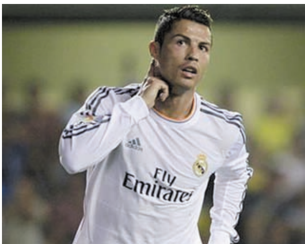
Real Madrid's Cristiano Ronaldo celebrates after he scored against Villarreal during their Spanish first division soccer match at the Madrigal stadium in Villarreal, on 14 Sept, 2013.

MADRID, 16 Sept — Real Madrid have moved to tie Cristiano Ronaldo to the club until the end of the 2017-18 season by agreeing a three-year contract extension with the prolific Portuguese forward.