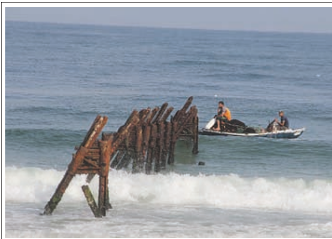
Palestinian fishermen ride on a boat in the Mediterranean Sea off the coast of Rafah in the southern Gaza Strip, near Egypt's territorial water, on 15 Sept, 2013. Hamas Government said two Egyptian Navy boats opened fire towards a Palestinian fisherman on Saturday evening, and damaged his boat off the coast of Rafah.