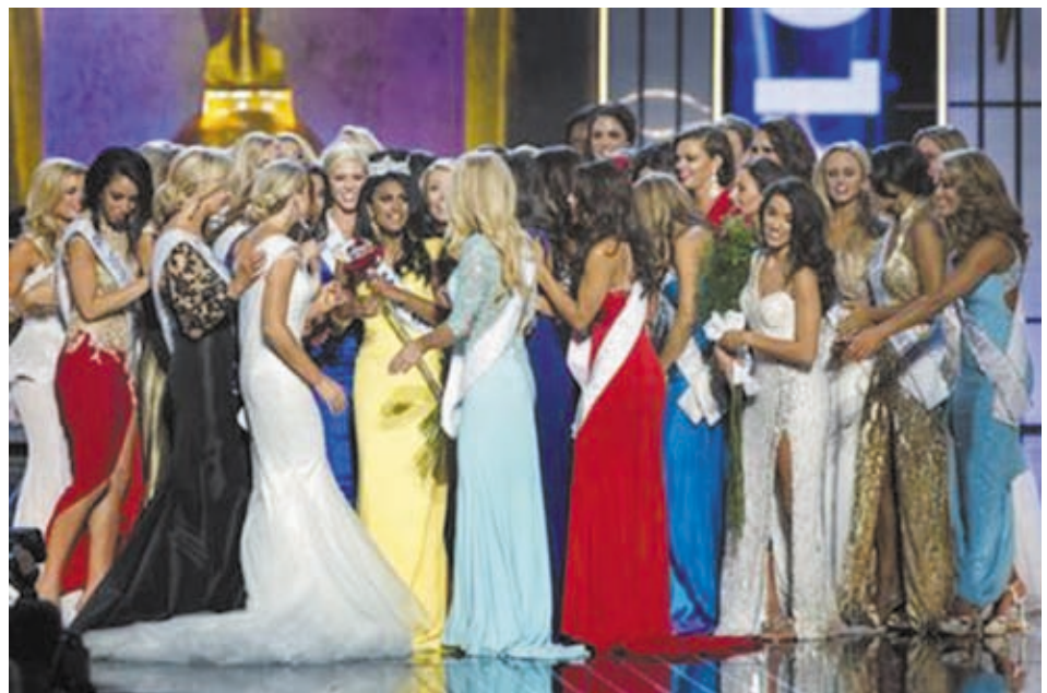
Miss America contestant, Miss New York Nina Davuluri (in yellow) celebrates with other contestants after being chosen winner of the 2014 Miss America Pageant in Atlantic City, New Jersey on 15 Sept, 2013.

plastic surgery on her eyes. Davuluri answered that she personally was opposed to plastic surgery and said that one's diversity should be celebrated.