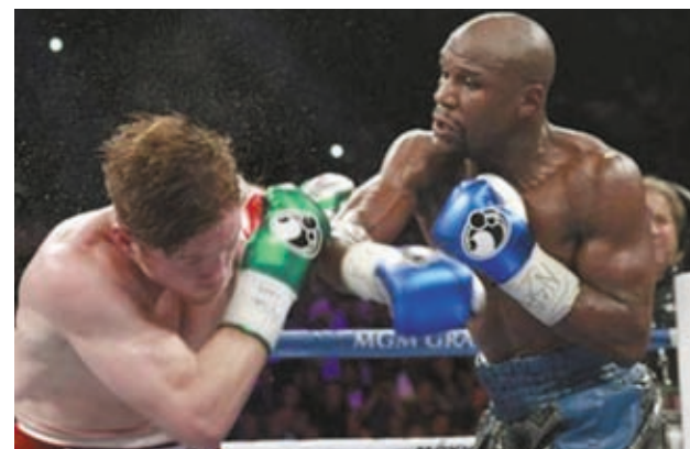
WBC/WBA 154-pound champion Canelo Alvarez (L) takes a punch from Floyd Mayweather Jr of the US at the MGM Grand Garden Arena in Las Vegas, Nevada, on 14 Sept, 2013.

ed to pin Mayweather in the corner in the seventh, the American slipped most of his punches and answered with a right hand, followed by a sequence of jabs and an uppercut, before backing the Mexican to the ropes and picking him apart.