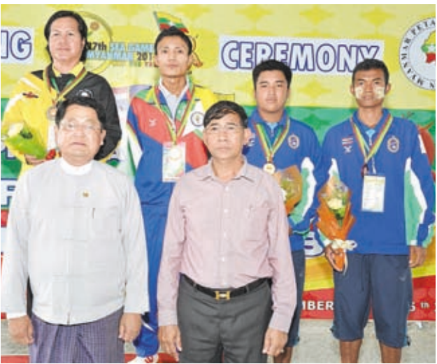
Union Minister U Tint Hsan together with winners at prize awarding ceremony of Pre-SEA Games Petanque Test Match 2013.—MNA

Six teams from Myanmar, Thailand and Brunei took part in the event. Thailand secured first with three gold, three silver and four bronze, Myanmar second with two gold, one silver and five bronze and Brunei third with one silver and one bronze.—MNA