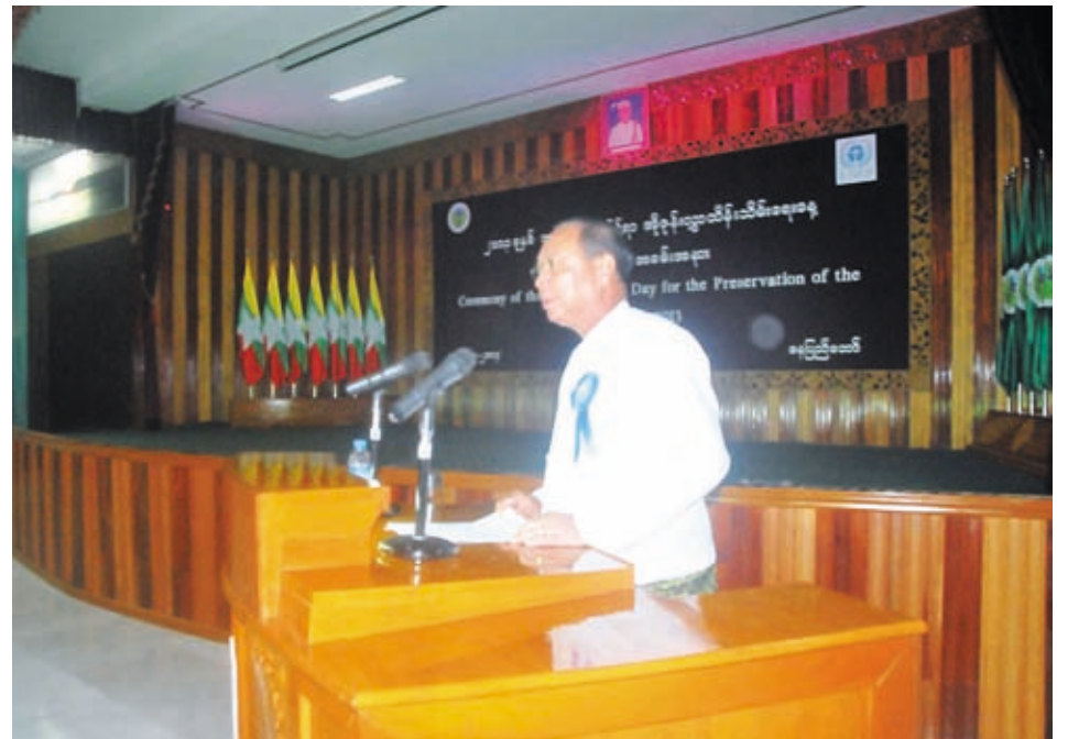
Union Minister U Win Tun speaking at ceremony to mark the International Day for the Preservation of the Ozone Layer.—MNA

He continued that as one ton of CFC is equal to 10900 tons of carbon dioxide and one ton of HCFC, to 1810 tons of carbon dioxide, minimizing the use of CFC and HCFC will reduce