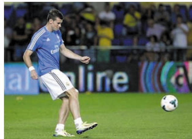
Real Madrid's Gareth Bale kicks the ball during the warm up before their Spanish first division soccer match against Villarreal at the Madrigal stadium in Villarreal, on 14 Sept, 2013.

MADRID, 16 Sept—Real Madrid will get their first indication on Tuesday of whether unprecedented spending on players of more than 600 million euros over the past five years can secure the 10th European crown they have been chasing since 2002.