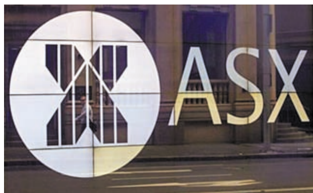
An office worker walks past the board of the Australian Securities Exchange building displaying its logo in central Sydney on 5 April, 2013.