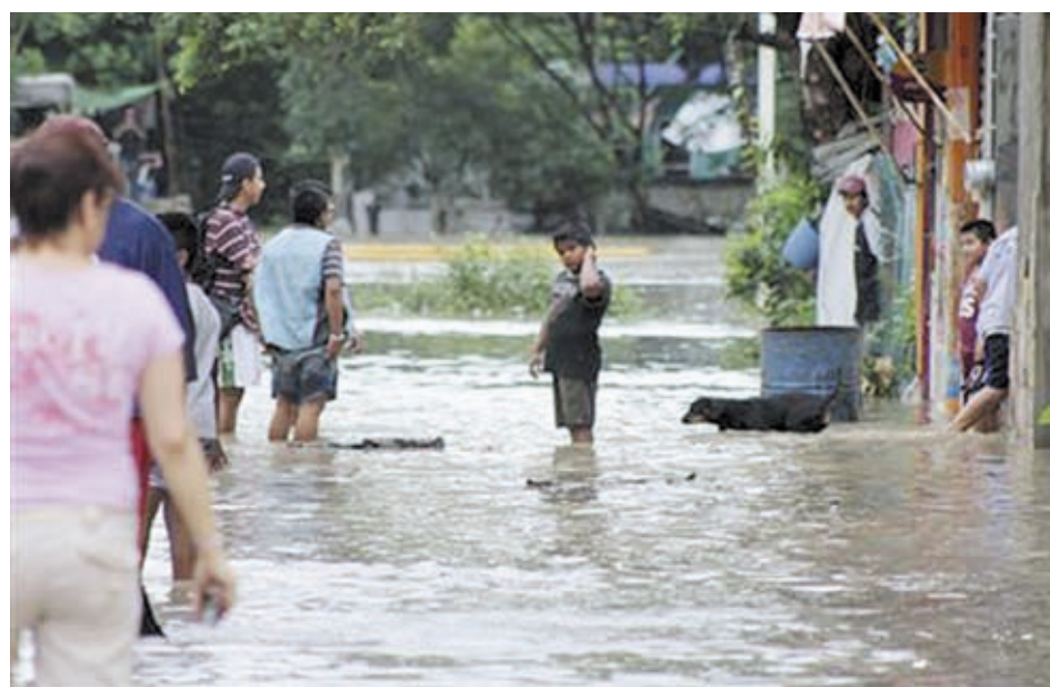
Residents wade through a flooded street in Poza Rica, in the Mexican state of Veracruz on 14 Sept, 2013.

In Guerrero state on Mexico's Pacific coast, 11 people died in landslides and as buildings collapsed because of heavy rain on Saturday and Sunday. In the states of Puebla and Hidalgo, three people were killed