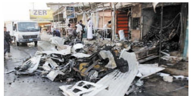
Policemen inspect the site of an explosion which killed two people and wounded 16 others in Kirkuk, Iraq, on 15 Sept, 2013. At least 44 people were killed and 133 others wounded in separate violent attacks across Iraq on Sunday, police and interior ministry sources said.

a police source revealed two farmers were shot dead in their orchard by gunmen in the town of Abu Sayda, some 30 km north of the provincial capital city of Baquba, about 65 km northeast of Baghdad.—Xinhua