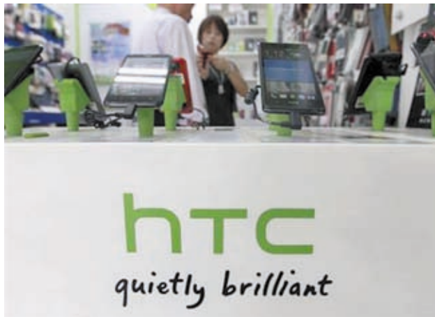
Customers look at HTC smartphones in a mobile phone shop in Taipei on 30 July 2013.

The US layoffs represent a tiny fraction of HTC’s global workforce of about 17,000. HTC’s sales so far this year have dropped 31.5 percent compared to the same period last year, rocked by a component shortage in the beginning of the year and its position at the high end of a smartphone market that is close to saturation.—Reuters