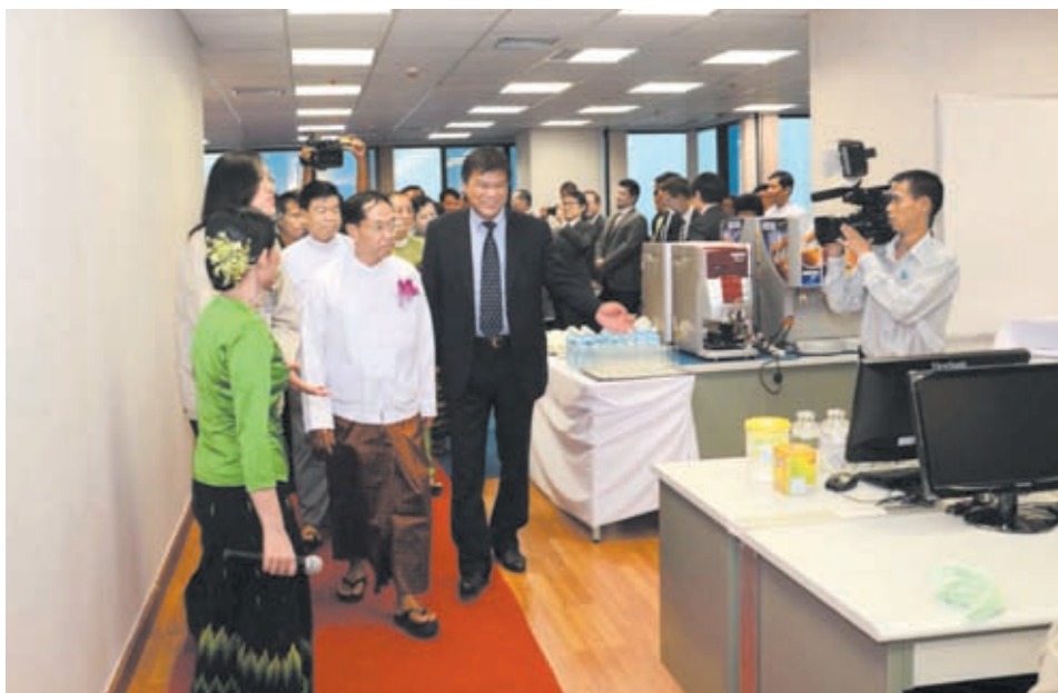
Yangon Region Chief Minister U Myint Swe attends opening of Thai-Myanmar JV office.

YANGON, 16 Sept— Toyo Thai-Myanmar Corporation Co., Ltd. (TTMC) and Toyo Thai