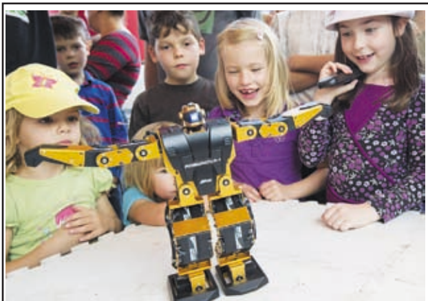
Children look at a dancing remote-controlled robot during the Science Picnic in Zagreb, Croatia, on 15 Sept, 2013. More than ten thousand people visited the event organized for the purpose of popularization of scientific knowledge.