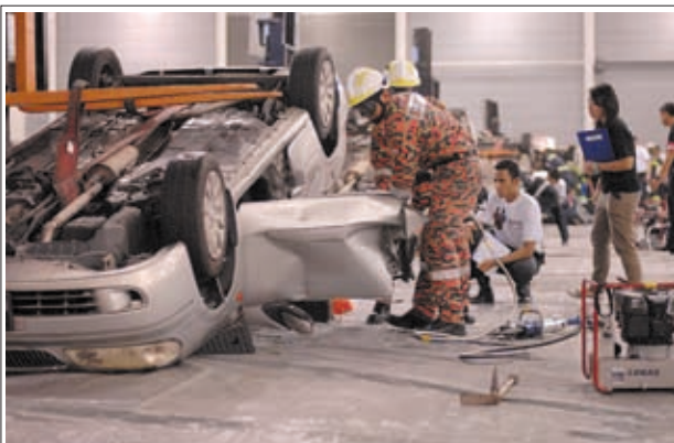
Firefighters attend the Singapore-Global Fire Fighters and Paramedics Challenge on the Singapore Civil Defence Force Day in Singapore, on 15 Sept, 2013.