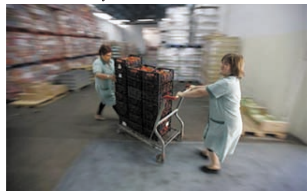
Members of a charity transport crates of tomatoes at the Food Bank institution in Lisbon on 10 Sept, 2013.