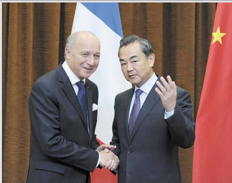
Chinese Foreign Minister Wang Yi (R) shakes hands with his French counterpart Laurent Fabius during their talks in Beijing, capital of China, on 15 Sept, 2013.

After three days of intense negotiations, US Secretary of State John Kerry and his Russian counterpart Sergei Lavrov reached agreement on Saturday on