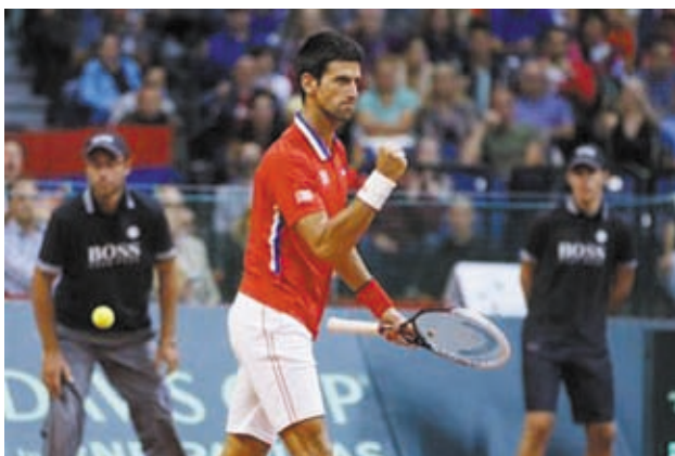
Serbia's Novak Djokovic celebrates after winning a point against Canada's Vasek Pospisil during their Davis Cup semi-final tennis match in Belgrade on 13 Sept, 2013.

Canada had dreamed of a first Davis Cup final appearance when Daniel Nestor and Pospisil won a doubles cliffhanger on Saturday but their hopes were ultimately crushed.