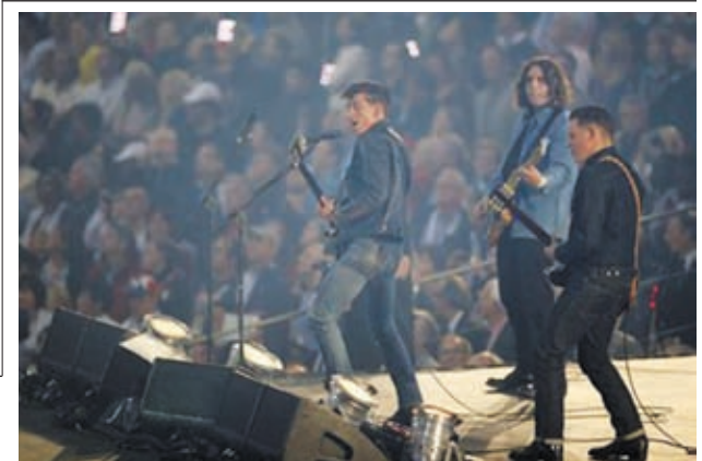
Members of the band Arctic Monkeys perform during the opening ceremony of the London 2012 Olympic Games at the Olympic Stadium on 27 July, 2012.

SHIPPING AGENCY DEPARTMENT MYANMA PORT AUTHORITY AGENT FOR: M/S COSCO SHIPPING CO LTD Phone No: 256916/256919/256921