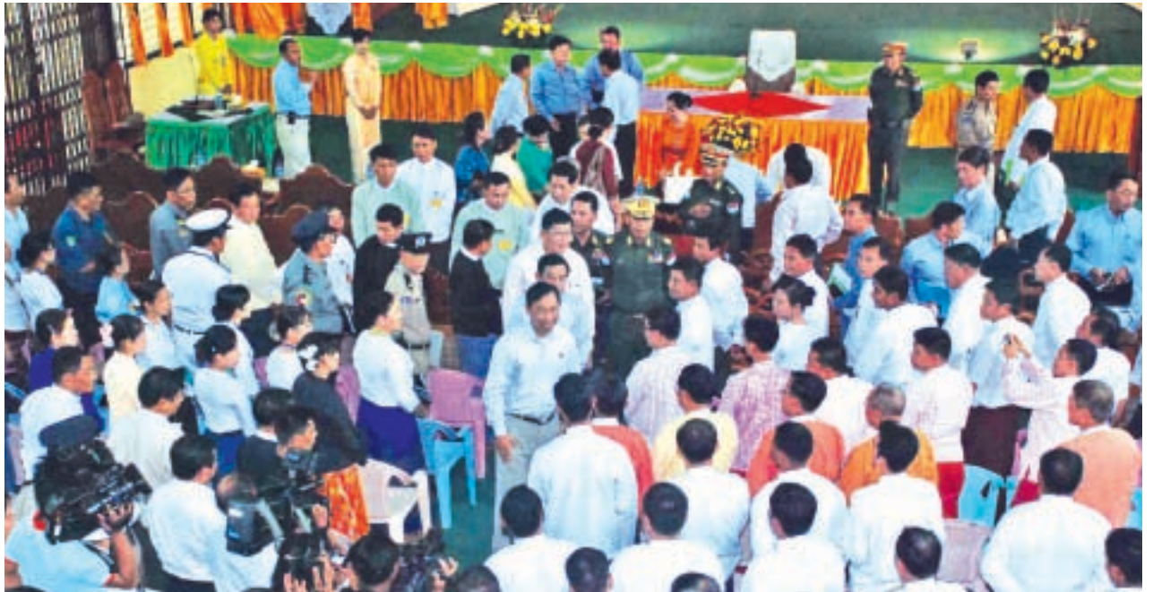
Speaker of Pyidaungsu Hluttaw and Pyithu Hluttaw Thura U Shwe Mann meets with local people at Myintzuthaka Hall in Kawthoung.

KAWTHOUNG, 11 Sept—Speaker of Pyidaungsu Hluttaw and Pyithu Hluttaw Thura U Shwe Mann met with local people at Myintzuthaka Hall in Kawthoung yesterday morning.