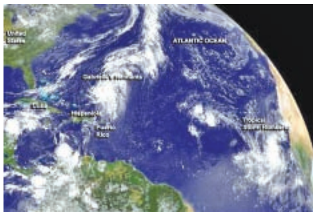
Tropical storm Humberto (lower R) and the remnants of tropical storm Gabrielle near the Bahamas are shown in this image provided by NOAA's GOES-East satellite and captured on 9 Sept, 2013.

The affluent British territory has strict building codes and tends to withstand tropical storms without major damage. Gabrielle first formed last week in the northeastern Caribbean, soaking Puerto Rico as it crossed into the Atlan-