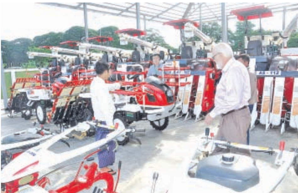
Union Minister for Agriculture and Irrigation U Myint Hlaing explains display of agricultural machinery to officials from international organizations at showroom.

NAY PYI TAW, 11 Sept—Union Minister at the President Office U Soe Maung, Union Minister for Agriculture and Irrigation