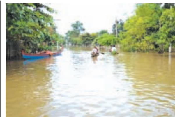
Heavy rains in Bhamo Township of Kachin State caused inundation at Letpandan, Khuntha and Tatkale wards on 7 September. On 8 September, the roads were flooded and the local people used boats in their transportation.

rooms, four family rooms and two suites.