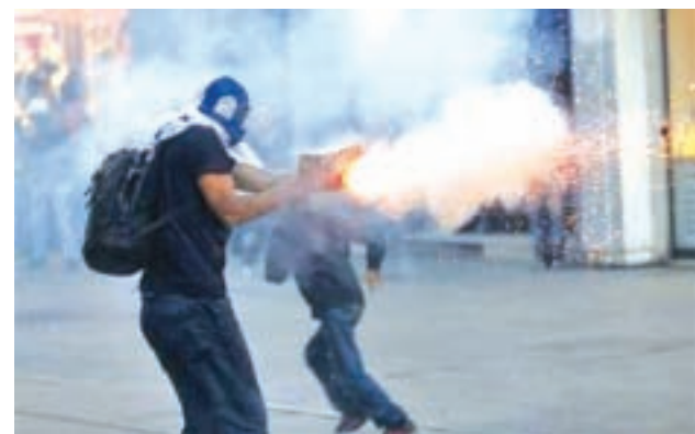
A masked demonstrator uses fireworks against riot police with a home made device during a protest in central Istanbul on 10 Sept, 2013.