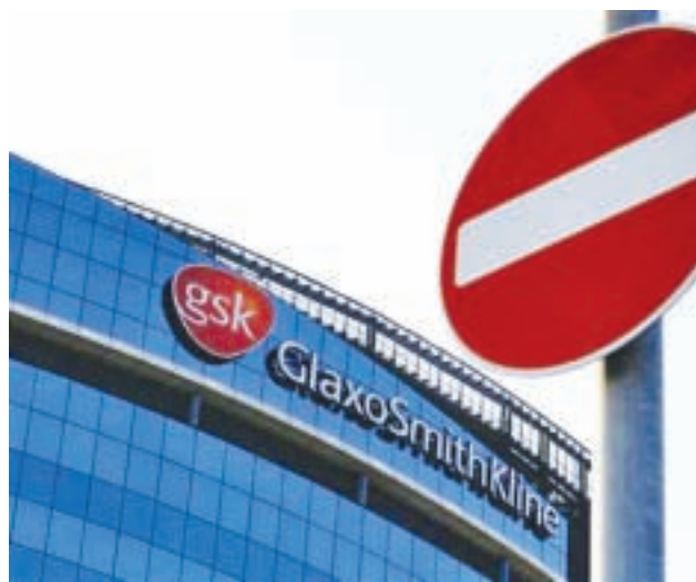
A no entry sign is pictured outside the GlaxoSmithKline building in Hounslow, west London on 18 June, 2013.

percent and 0.7 percent increases respectively, with most economists revising upwards their expectations for growth this year and next. RICS survey respondents remarked that government measures designed to stimulate the mortgage and housing market such as the Funding for Lending Scheme (FLS) and Help to Buy had helped spark the improvement in house-buying activity.—Xinhua