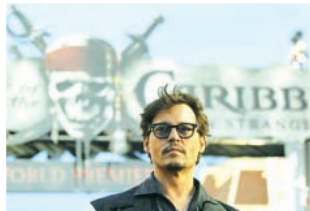
Cast member Johnny Depp poses at the premiere of "Pirates of the Caribbean: On Stranger Tides" at Disneyland in Anaheim, California on 7 May, 2011. The movie opens in the US on 20 May.

The delay on "Pirates 5" comes a day after the studio said it would move up the release of another big-budget film, "Ant-Man," from Oc-