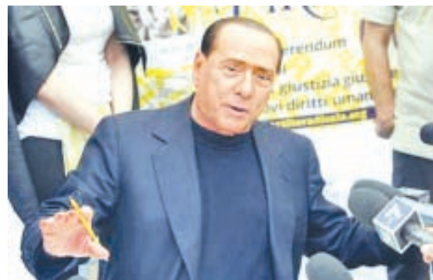
People of Liberty party (PDL) leader Silvio Berlusconi talks with reporters as he signs a referendum on justice reforms and human rights in downtown Rome on 31 August, 2013.—REUTERS

After a tense day in which centre-right leaders threatened to pull out of Letta's coalition, potentially triggering snap elections, a sign of reduced hostilities came when Berlusconi called off a meeting with his lawmakers scheduled for Wednesday. Many observers had expected that meeting to sanction the end of the Letta government if the center-left had maintained the uncompromising stance it had shown at an initial committee meeting on Monday.—Reuters