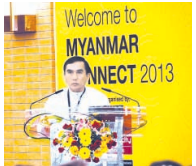
Union Minister U Myat Hein speaking at ceremony of Myanmar Connect 2013.—MNA

The meeting jointly organized by the Ministry of Communications and Information Technology and Capacity Media ran two days.—MNA