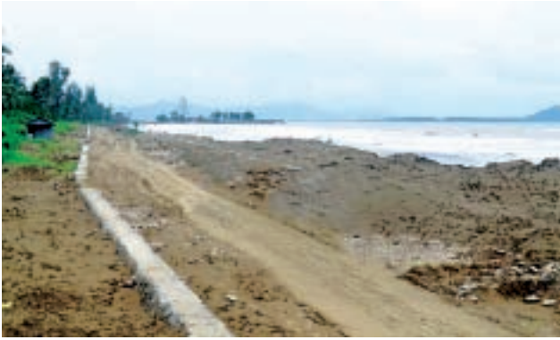
SITTWAY, 11 Sept—A concrete road, which is 6035 feet long, 24 feet wide and

Efforts are being made for timely completion of the road linking Point (Shukhintha) and Sittway Hotel.