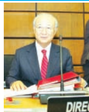
Yukiya Amano, director general of the International Atomic Energy Agency, attends a regular IAEA board meeting in Vienna, Austria, on 9 Sept, 2013.

The IAEA previously sent a team of experts to