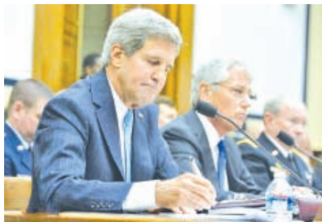
US Secretary of State John Kerry (L), Secretary of Defence Chuck Hagel (C) and Chairman of the Joint Chiefs of Staff Martin Dempsey testify before the House Armed Services Committee during a hearing on the authorization of use of force in Syria on Capitol Hill in Washington DC, capital of the United States, on 10 Sept, 2013.