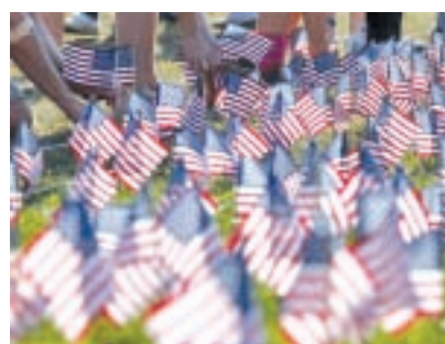
People plant some of the 3000 US flags placed in memory of the lives lost in the September 11, 2001 attacks, at a park in Winnetka, Illinois, on 10 Sept, 2013.

Later, however, it turned out that Islamist extremists launched the attack on the 11 September anniversary. The administration was forced for months to defend its handling of the events at Benghazi, with critics charging officials deliberately played down the nature of the attack to protect the president's re-election bid.—Reuters