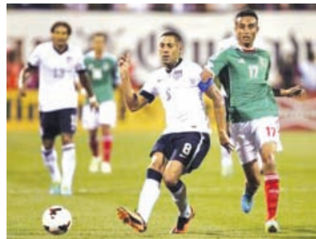
United States' Clint Dempsey (8) passes the ball under pressure from Mexico's Jesus Zavala (17) during the first half of their 2014 World Cup qualifying soccer match in Columbus, Ohio on 10 Sept, 2013.