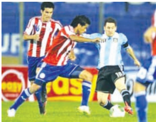
Argentina's Lionel Messi (R) controls the ball between Paraguay's Salustiano Candia (C) and Cristian Riveros during their 2014 World Cup qualifying match in Asuncion, on 10 Sept, 2013.

Argentina lead the South American group on 29 points with two qualifiers remaining next month. The top four qualify automatically and the group leaders can now only be overtaken by Colombia and Chile.