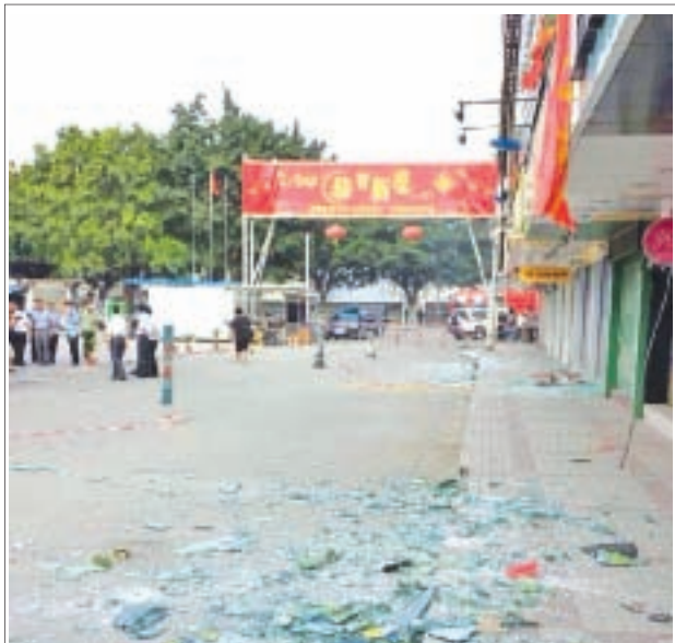
Photo taken with a mobile phone shows damaged window glass of a nearby building after an explosion occurred at a storehouse in Guangzhou, capital of south China's Guangdong Province, on 10 Sept, 2013. Rescuers have found four bodies at the scene. Fourteen people were injured and have been taken to hospital.

Lee will be accompanied by Grace Fu, Minister in the Prime Minister's Office, Second Minister for the Environment and Water Resources and Second Minister for Foreign Affairs; Lee Yi Shyan, Senior Minister of State for Trade and Industry and Senior Minister of State for National Development and some Members of Parliament and senior officials.— Xinhua