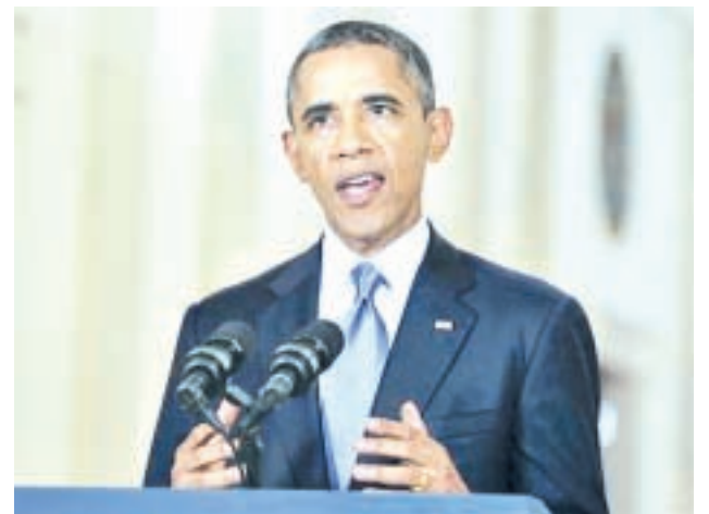
US President Barack Obama addresses the nation about the situation in Syria from the East Room at the White House in Washington, on 10 Sept, 2013.

Obama set no deadlines for diplomacy to run its course, but said any deal