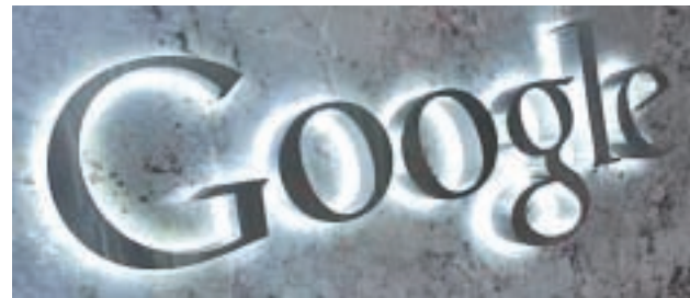
A Google logo is seen at the entrance to the company’s offices in Toronto on 5 Sept, 2013.

“Even if it is commonplace for members of the general public to connect to a neighbour’s unencrypted Wi-Fi network,” Bybee wrote, “members of the general public do not typically mistakenly intercept, store, and decode data transmitted by other devices on the network.”—Reuters