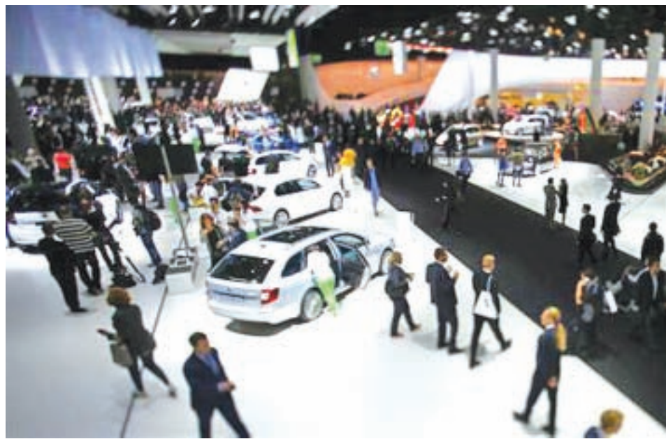
The stand of Volkswagen is pictured during a media preview day at the Frankfurt Motor Show (IAA) on 10 Sept, 2013.