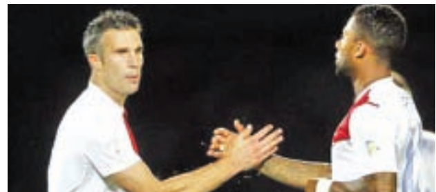
Netherlands' Robin Van Persie (L) celebrates with teammate Jeremain Lens after scoring a goal against Andorra during their 2014 World Cup qualifying soccer match at Estadi Comunal in Andorra on 10 Sept, 2013.