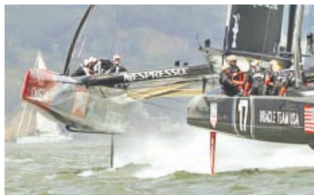
Emirates Team New Zealand (L) trails Oracle Team USA at the the first mark during Race 5 of the 34th America’s Cup yacht sailing race in San Francisco, California on 10 Sept, 2013.

The unprecedented cheating penalty means that for Oracle to keep the Cup it must win 11 races — two more than government-backed New Zealand. Al-