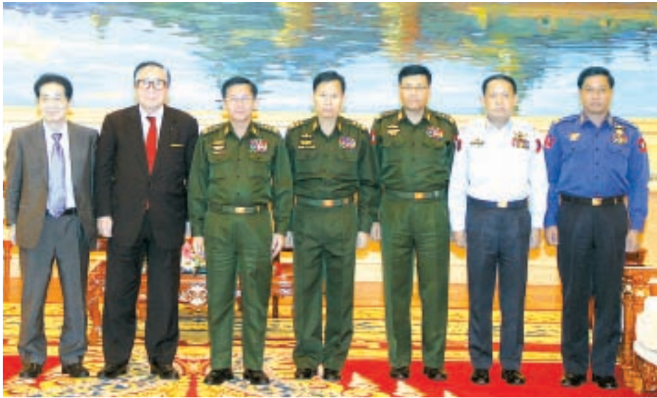
Senior General Min Aung Hlaing poses for documentary photo with Japanese guests.—MNA

They cordially exchanged views on further promoting relations and cooperation between the governments and Tatmadaws of the two countries and Myanmar's reforms.—MNA