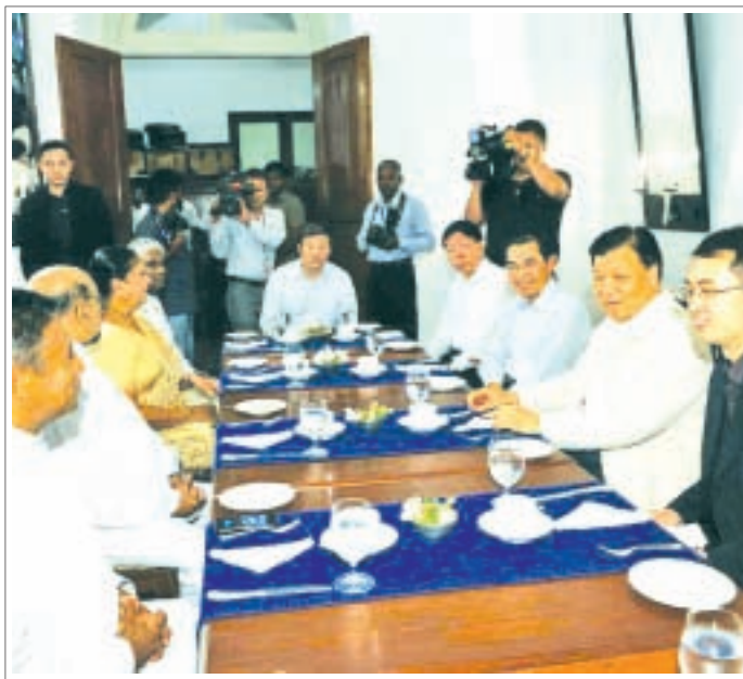
Liu Yunshan (2nd R), a member of the Standing Committee of the Political Bureau of the Communist Party of China (CPC) Central Committee, meets with Sri Lanka National Heritage Minister Jagath Balasuriya (3rd L, front), Governor of Southern Province Kumari Balasuriya (4th L, front) and other Sri Lankan officials in Galle, Sri Lanka, on 10 Sept, 2013.