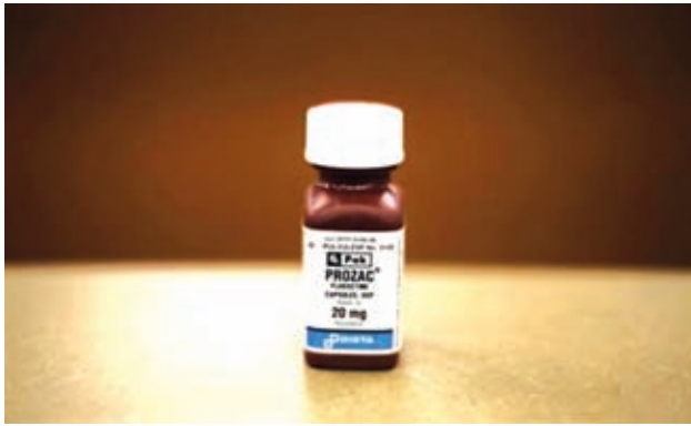
Prozac medicine is seen at a pharmacy in Los Angeles, California, in this 18 Oct, 2010 file photo.