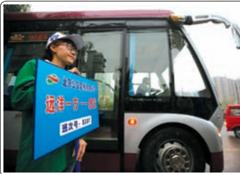
A staff member holds a guide card next to a customized shuttle bus in Beijing, China, on 9 Sept, 2013. The Beijing Public Transport Holdings launched customized shuttle buses on Monday, and released three bus routes and price. The customized bus service, designed to meet the passengers' demand of routines and stops, is offered for city dwellers to subscribe a greener option than private cars.