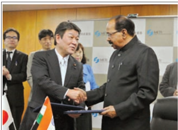
India's Petroleum and Natural Gas Minister M. Veerappa Moily (R) and Japan's Economy, Trade and Industry Minister Toshimitsu Motegi shake hands after signing a joint statement in Tokyo on 9 Sept, 2013. The two countries called for "transparent and globally competitive" price formation in the procurement of liquefied natural gas in the Asia-Pacific market.