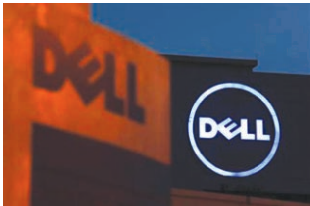
Dell logos are seen at its headquarters in Cyberjaya, outside Kuala Lumpur on 4 Sept, 2013.