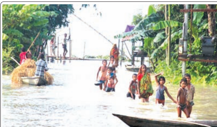
People wade through flood waters in the Morigaon district of India's northeastern state of Assam, on 9 Sept, 2013.

"I got a message from our comrade involved in the crisis. There were no plans to attack Zamboanga. Those men involved were supposed to return to their respective homes after attending their independence declaration last 12 August," he said.—Xinhua