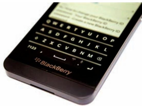
A view shows the keyboard of the BlackBerry Z10 at a Rogers store in Toronto on 5 Feb, 2013.