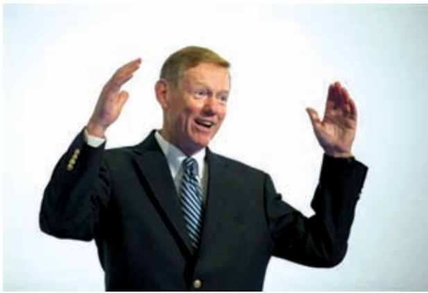
Alan Mulally, President and CEO of Ford Motor Company speaks at the Automobilwoche automotive industry conference in Berlin on 7 Nov, 2012.