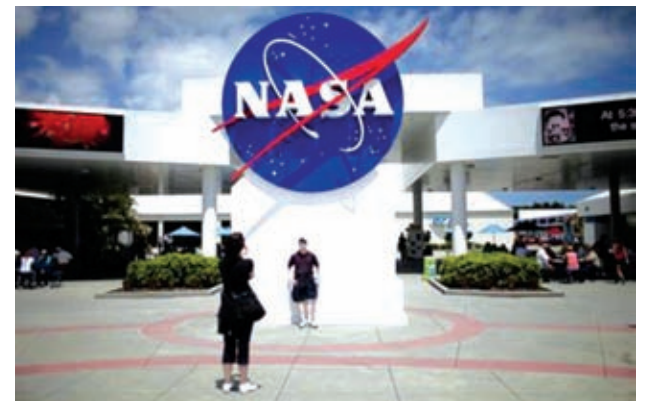
Tourists take pictures of a NASA sign at the Kennedy Space Centre visitors complex in Cape Canaveral, Florida on 14 April, 2010.

Senator Carl Levin, a Michigan Democrat who chairs the investigations subcommittee, and John McCain, the top Republican on the panel, had asked GAO to investigate space launch funding to get a better handle on the overall government effort.—Reuters