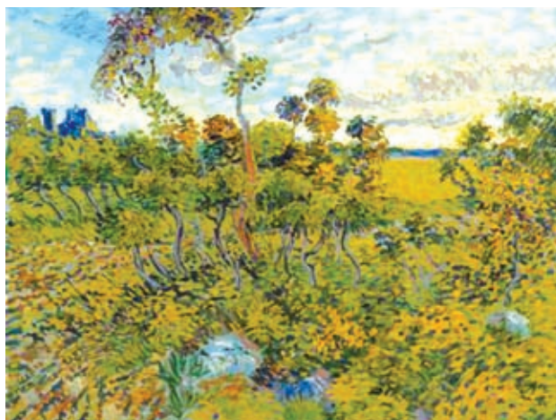
A painting titled "Sunset at Montmajour" is seen in this handout photo received from The Van Gogh Museum in Amsterdam on 9 Sept, 2013.