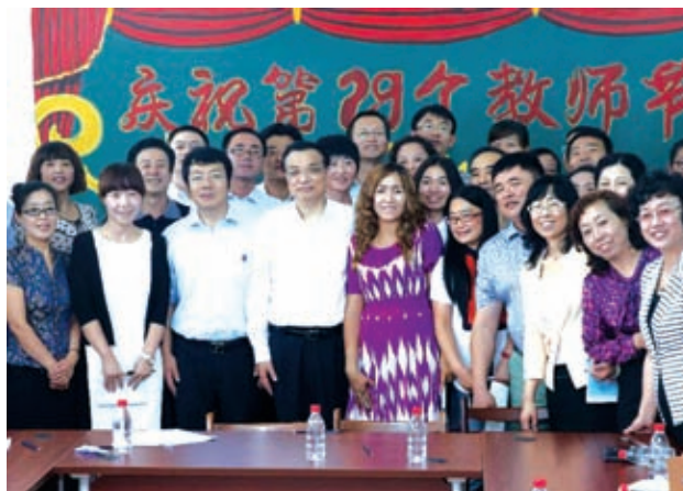
Chinese Premier Li Keqiang poses for a group picture with teachers at No 20 High School of Dalian, northeast China's Liaoning Province, on 9 Sept, 2013.

Li said education equality is the key to