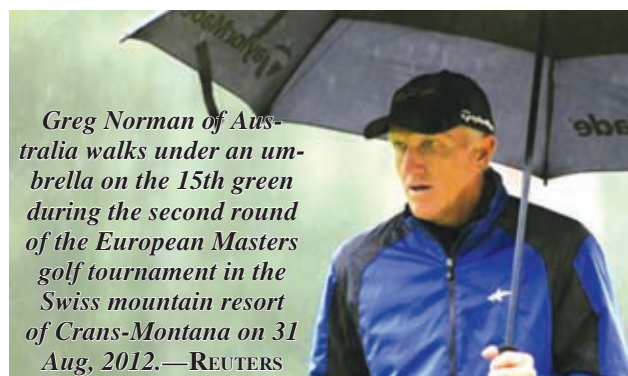
Greg Norman of Australia walks under an umbrella on the 15th green during the second round of the European Masters golf tournament in the Swiss mountain resort of Crans-Montana on 31 Aug, 2012.

Norman, who held a six-stroke lead heading into the final round but crashed to a 78 in one of the greatest sporting 'chokes' of all time, said he was suffering from a bad back and it was not just a case of nerves