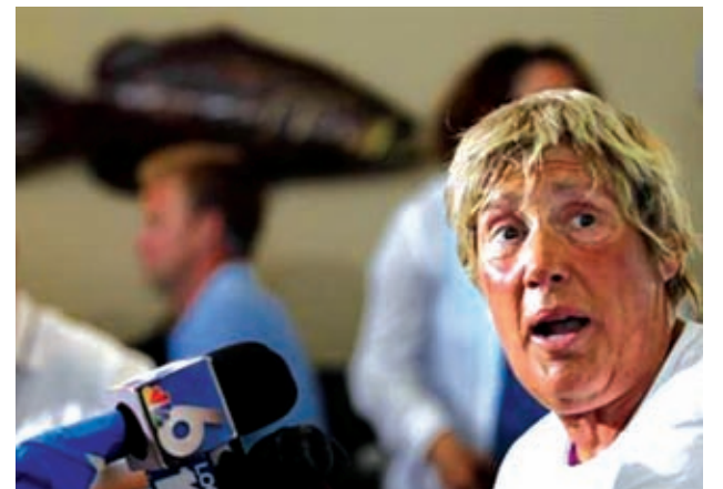
US long-distance swimmer Diana Nyad, 64, who completed her swim from Cuba to Key West, Florida, yesterday, speaks at a news conference on Stock Island, on 3 Sept, 2013.

around the world invited to participate in a panel discussion via Skype on Tuesday evening with Nyad and her team."I anticipate it will be an extremely interesting and valuable discussion for everyone," he said. "It will shed a lot of light where there's been none so far." The re-