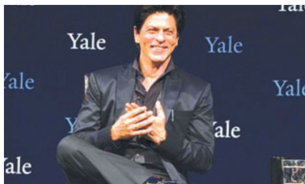
Shah Rukh even tweeted that he needed to catch up on some much needed sleep.

disappeared. Directed by Farah Khan, Happy New Year also stars Deepika Padukone and Abhishek Bachchan.