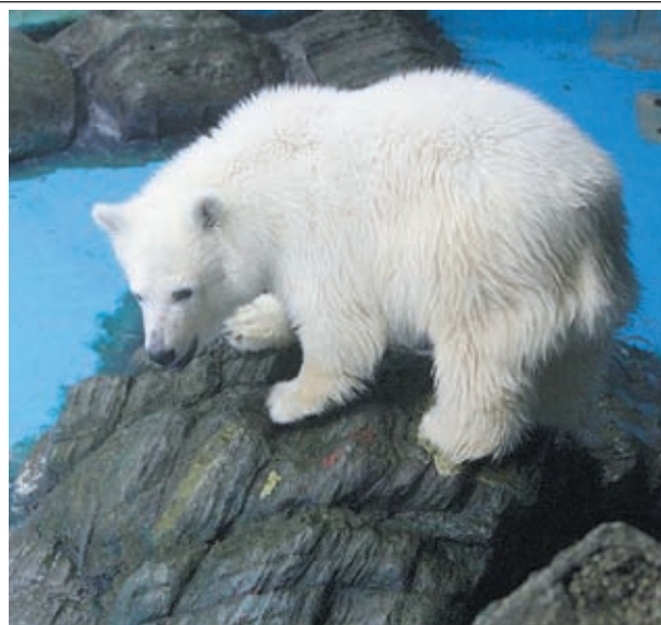
Polar bear cub Pezoo is seen at a local aquarium in Yantai, east China's Shandong Province, on 6 Sept, 2013. Pezoo, born at the Polar Sea World in north China's Tianjin, arrived at the aquarium on Friday for a three-month sojourn.