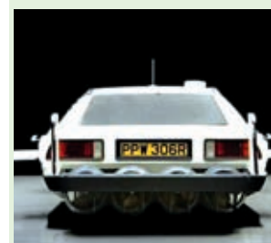
The 007 Lotus Esprit 'Submarine Car', used in the James Bond movie 'The Spy Who Loved Me' is pictured in this undated handout photo.

The white Lotus Esprit, which transformed into a submarine during a sequence in the 1977 movie starring Roger Moore as 007, had been expected to sell for between 650,000 and 950,000 pounds, according to RM Auctions. Bidding started at 100,000