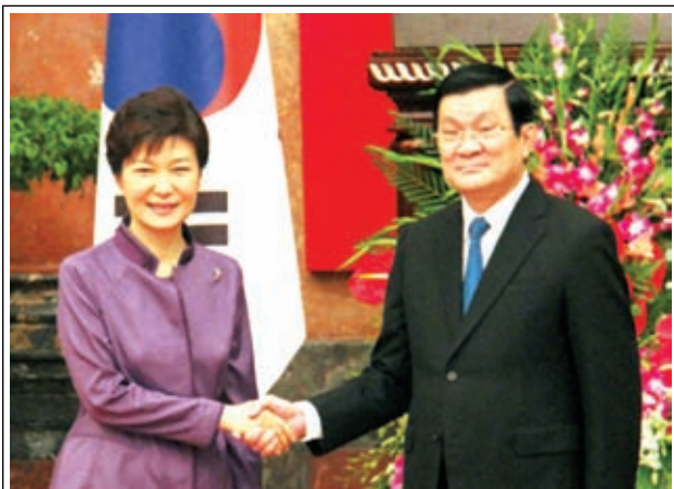
South Korean President Park Geun Hye (L) and Vietnamese President Truong Tan Sang shake hands in Hanoi on 9 Sept, 2013.