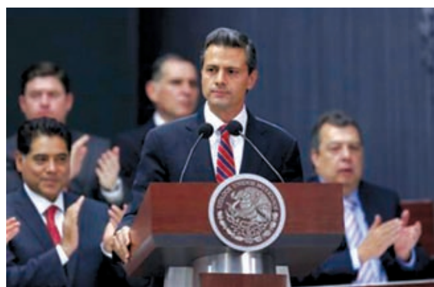
Mexico's President Enrique Pena Nieto looks on during his speech in the presentation of the fiscal reform at Los Pinos presidential residence in Mexico City, on 8 Sept, 2013.