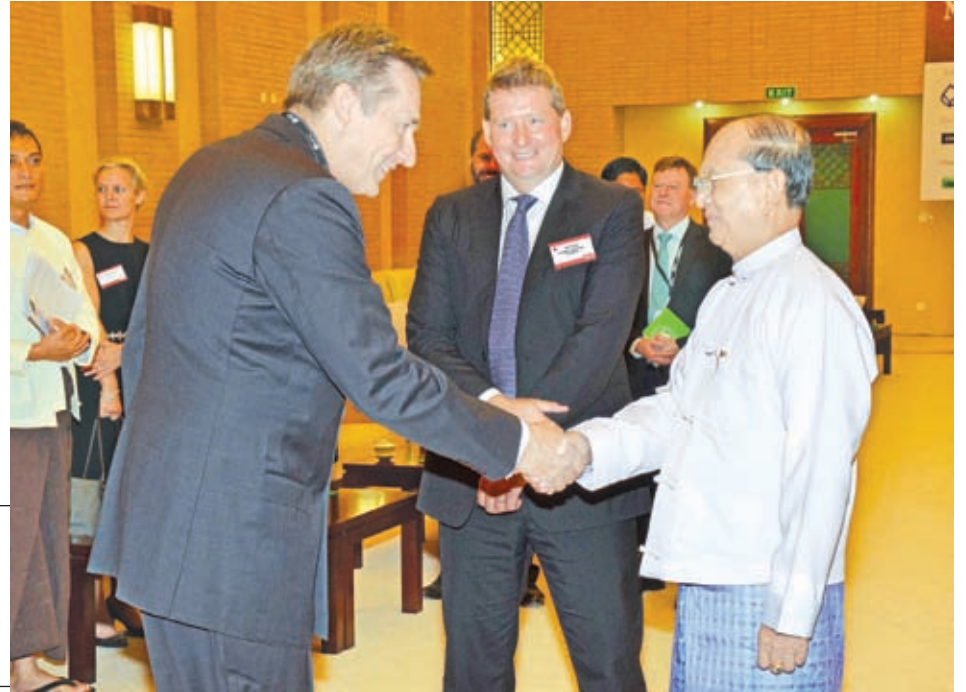
President of the Republic of the Union of Myanmar U Thein Sein shakes hands with a delegate to attend 2 nd Myanmar Global Investment Forum, at MICC.—MNA