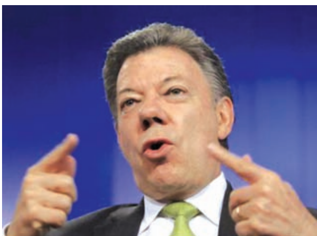
Colombia’s President Juan Manuel Santos speaks during a Reuters interview at the presidential palace in Bogota on 8 Aug, 2013.