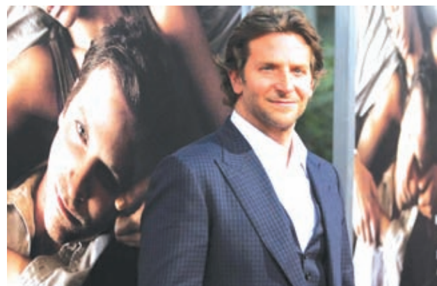
The actor says his mother is always the same regardless of the place she is.—PTI