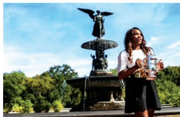
Serena Williams of the US poses with her trophy after winning the women's singles final match against Victoria Azarenka of Belarus at the US Open tennis tournament in New York's Central Park, on 9 Sept, 2013.