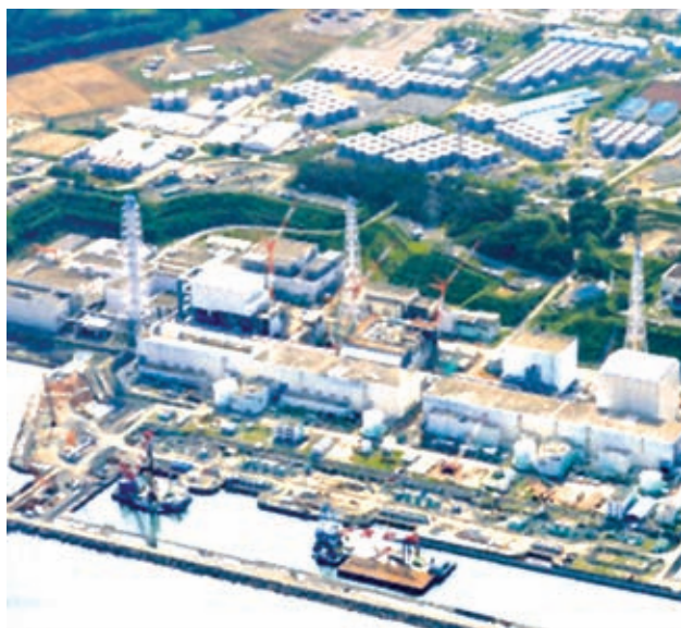
The photo from a Kyodo News helicopter taken on 31 Aug, 2013, shows the Fukushima Daiichi Nuclear Power Station in Fukushima Prefecture. The Japanese government announced a plan on 3 Sept, 2013, to use 47 billion yen to tackle a massive buildup of radioactive water at the plant crippled since the 2011 Great East Japan Earthquake and tsunami.