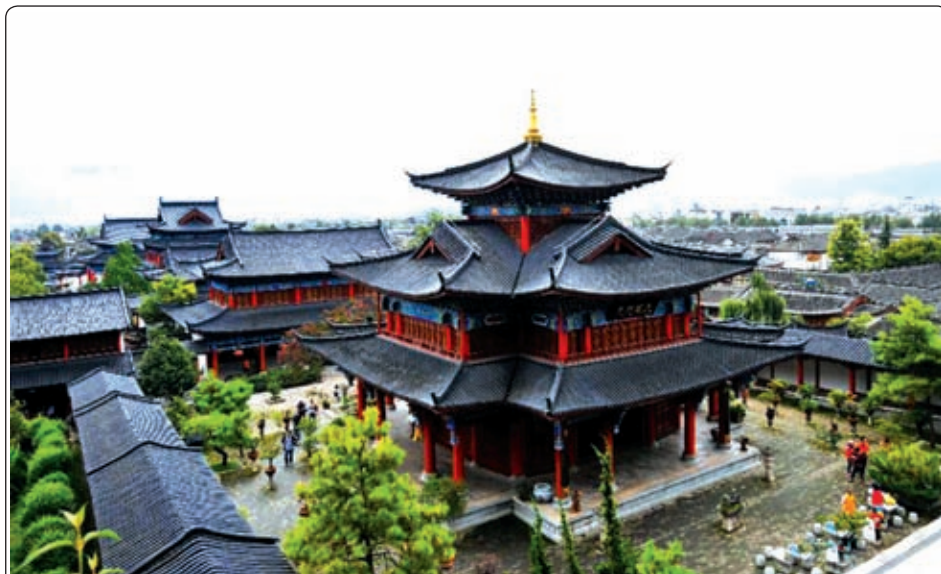
Tourists visit the old town of Lijiang, southwest China's Yunnan Province, on 8 Sept, 2013. The old town of Lijiang, a UNESCO World Heritage site with a history of more than 800 years, has received 9.597 million tourists during the first six months of 2013, increasing by 18.58 percent year on year. The tourism industry's revenue of the same period reached 12.65 billion RMB yuan (2.06 billion US dollars), growing by 19.8 percent year on year.