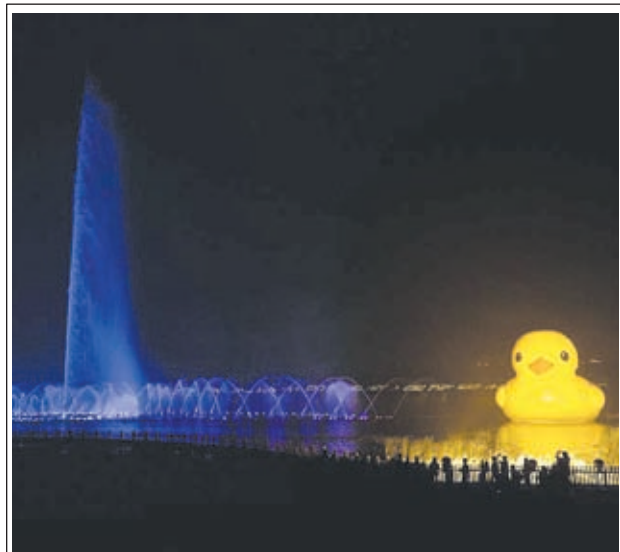
A giant rubber duck is seen on the Yuanbo Lake in the Garden Expo Park in Beijing, capital of China, late 6 Sept, 2013. The 18-metre-tall inflatable rubber duck, created by Dutch artist Florentijn Hofman, is expected to visit Beijing from September to October.