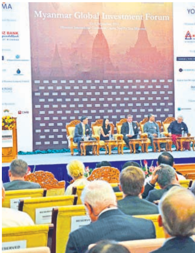
Myanmar Global Investment Forum in progress at MICC in Nay Pyi Taw.

NAY PYI TAW, 10 Sept—The Myanmar Global Investment Forum, jointly organized by Myanmar Investment Commission and Euromoney Conferences, kicked off at Myanmar International Convention Centre (MICC), here, at 9 am today.