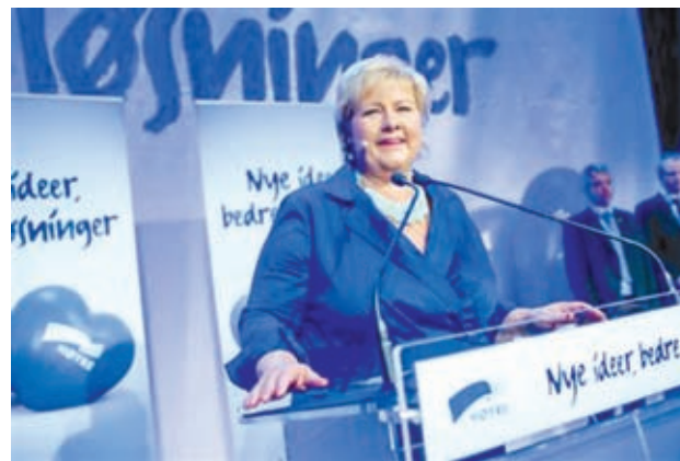
Norway’s main opposition leader Erna Solberg of Hoyre speaks to party members while waiting for the results of the general elections in Oslo on 9 Sept, 2013.