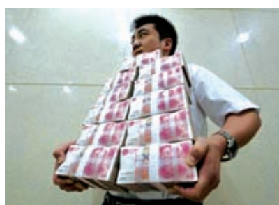
An employee carries bundles of 100 yuan Chinese bank notes to store after counting at a bank in Taiyuan, Shanxi Province on 4 July, 2013.