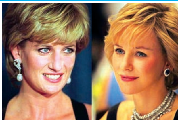
Diana shows the last two years of the Princess Diana's life before she was killed in a car crash in 1997.

Watts initially refused to do the role over concerns that the biopic would upset the royal family. Diana shows the last two years of the princess' life before she was killed in a car crash in 1997. It also follows her relationship with surgeon Hasnat Khan, played by Naveen Andrews, 44.