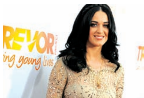
The singer has often expressed her admiration for the 1970's British rock band Queen.

Queen made me discover music and helped me come into my own at the age of 15," Perry said. "The way Freddie Mercury delivered his lyrics just made me feel like a confident woman. I'd say his fingerprint is all over me," she added. The singer also performed the band's song Don't Stop Me Now during her Hello Katy tour in 2009. Perry even named her new perfume Killer Queen.