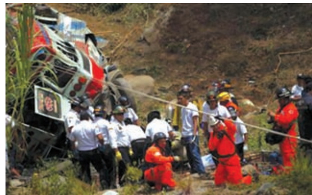
Rescuers stand near bodies recovered from a bus crash site in San Martin Jilotepeque, Chimaltenango region on 9 Sept, 2013.

He said 38 people died at the scene, including six children and 12 women. Five more died at hospitals, he said. Local television said many passengers were