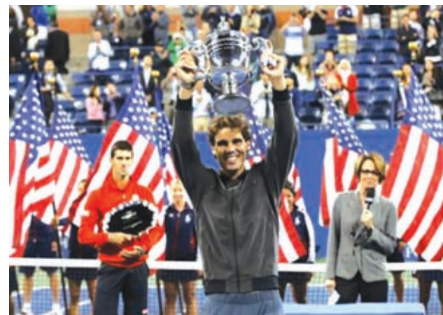
Rafael Nadal of Spain raises his trophy after defeating Novak Djokovic of Serbia (L) in their men's final match at the US Open tennis championships in New York, on 9 Sept, 2013.

"I feel very lucky about what happened since I came back." Luck has accounted for a very small sliver of his remarkable season. Since rejoining the Tour in February, Nadal has reached the finals in 12 of his 13 tournaments, winning 10 of them. The Spaniard said beating Djokovic made this victory even more meaningful. "Playing against Novak is a very special feeling," he said at the trophy ceremony.