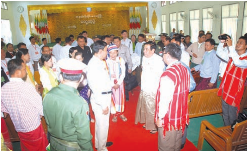
Speaker of Pyidaungsu Hluttaw Thura U Shwe Mann meets with Region Hluttaw MPs, departmental officials, townsenders at City Hall in Dawei.

DAWEI, 10 Sept— Speaker of Pyidaungsu Hluttaw and Pyithu Hluttaw Thura U Shwe Mann met with Region Hluttaw representatives, departmental officials, townsenders and responsible persons from the town development supporting committee,