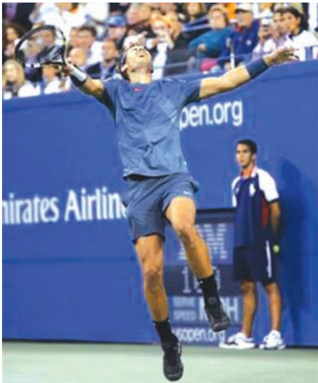
Rafael Nadal of Spain celebrates after defeating Novak Djokovic of Serbia in their men's final match at the US Open tennis championships in New York, on 9 Sept, 2013.

NEW YORK, 10 Sept—Rafa Nadal crowned his brilliant year by defeating world number one Novak Djokovic to win the US Open title at Arthur Ashe Stadium on Monday and earn his 13th grand slam singles crown. The Spaniard earned his second major championship this season following his French Open triumph, sealing the 6-2, 3-6, 6-4, 6-1 win when Djokovic dumped a forehand into the net, sending Nadal down onto his back before rolling face down and sobbing in joy.