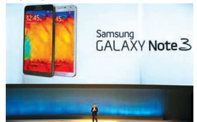
Shin Jong-kyun, President and CEO, head of IT and Mobile Communication division of Samsung presents the Samsung Galaxy Note 3 during its launch at the ‘Samsung UNPACKED 2013 Episode 2’ at the IFA consumer electronics fair in Berlin, on 4 Sept, 2013.