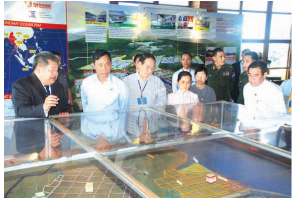
Speaker of Pyidaungsu Hluttaw Thura U Shwe Mann observes scale model of Dawei SEZ and Bawa Housing Project.