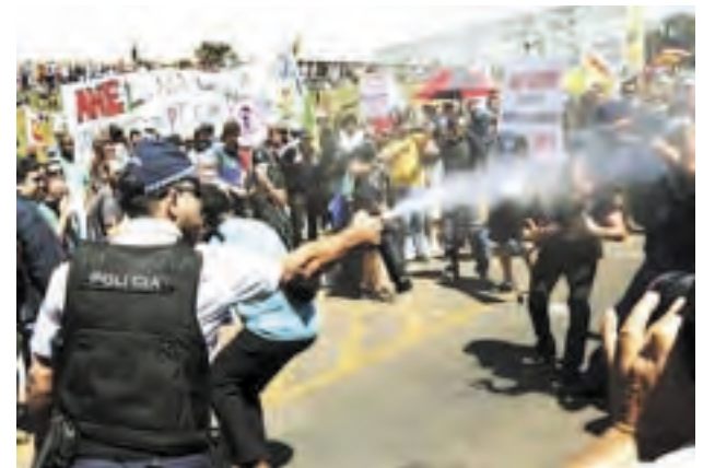
A policeman sprays anti-government demonstrators with tear gas outside the Congress in Brasilia, on 7 Sept, 2013.