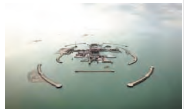
An aerial view shows artificial islands on Kashagan offshore oil field in the Caspian sea, western Kazakhstan, on 7 April, 2013.