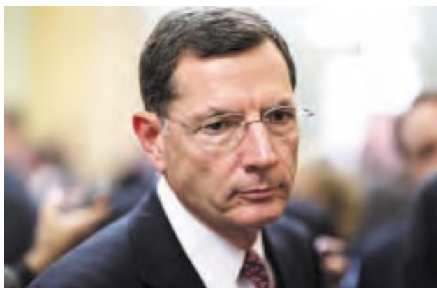
Senator John Barrasso (R-WY) speaks to the media after the Republican policy luncheon on Capitol Hill in Washington on 18 Dec, 2012.

WASHINGTON, 8 Sept—Weeks before healthcare exchanges under President Barack Obama’s healthcare overhaul open next month, a Republican senator attacked the plan on Saturday by