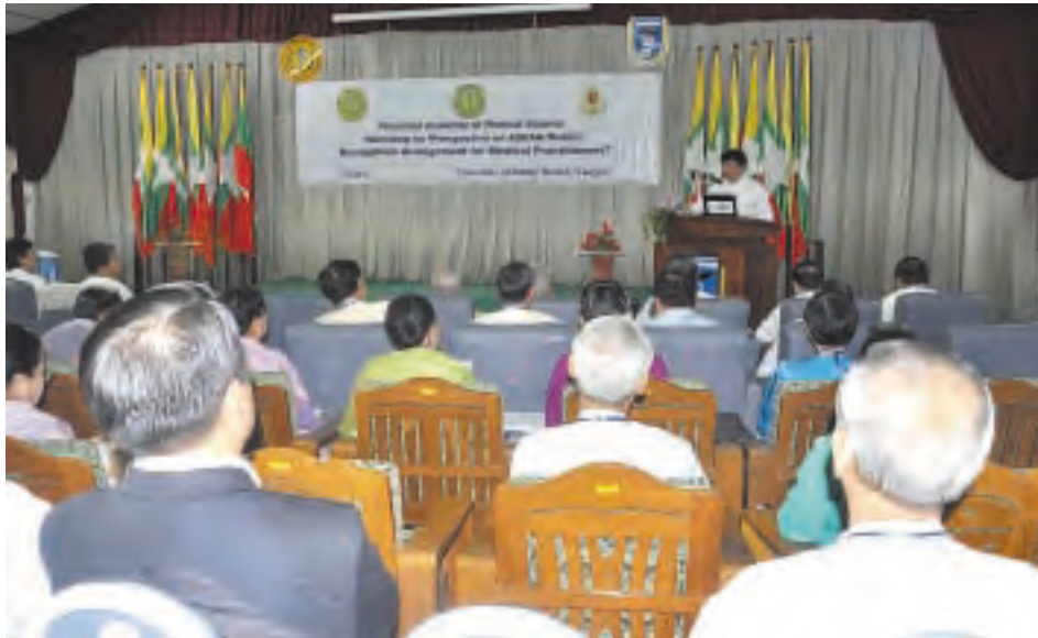
Union Minister Dr Pe Thet Khin addresses Workshop on Perspective for Myanmar on ASEAN Mutual Recognition Arrangement for Medical Practitioners.

workshop on drawing guidance for capacity building of general practitioners at the University of Medicine (1). The chairmen of Myanmar Medical Association and General Practitioners Association reported on the outcomes from the workshop.