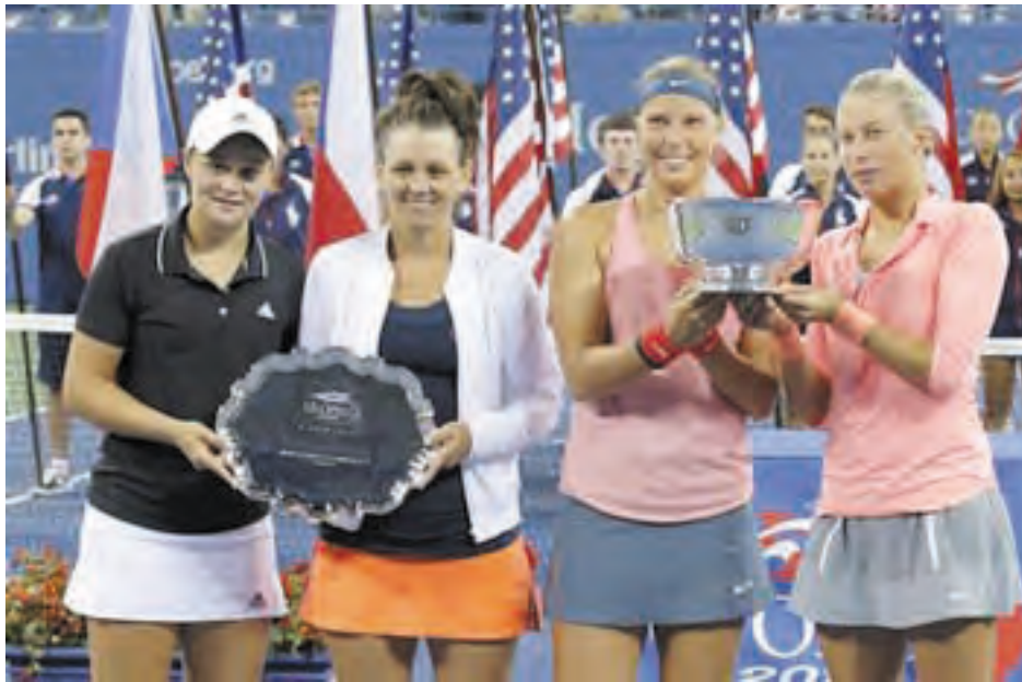
Andrea Hlavackova (R) and Lucie Hradecka of the Czech Republic pose with their winner's trophy as Ashleigh Barty (L) and Casey Dellacqua of Australia pose with their runner's up award after their women's doubles final match at the US Open tennis championships in New York on 7 Sept, 2013.