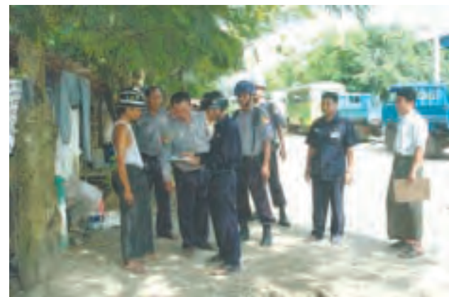
buildings and tents by the entrance of Hlinethaya 6.3-mile road section from Bayintnaung Bridge to Township. MMAL-164

to make the move right away as there are already instructions and manual for eviction. If anyone who has occupied the road area and fails to move will be subject to prosecution at the Township Court. The deadline for move is set on 14 September. Action would be taken against the encroachers as Development Affairs Law and Rules. They include shops,