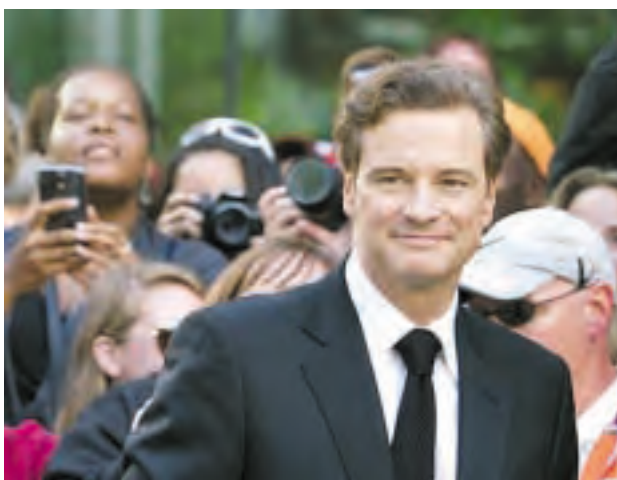
British actor Colin Firth arrives for the film premiere of ‘Railway Man’ at the 38th Toronto International Film Festival in Toronto on 6 Sept, 2013.