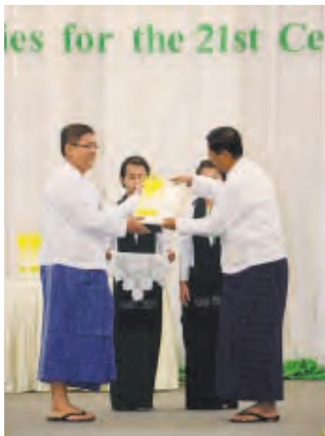
Union Minister for Education Dr Mya Aye presents certificate to a winner.