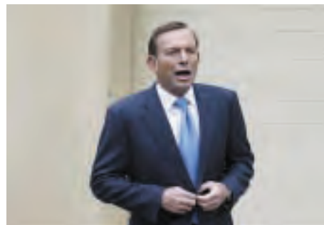
Australia's conservative leader and Prime Minister-elect Tony Abbott leaves his house in Sydney on 8 Sept, 2013.

"As of today, the mining boom will be rebooted,"