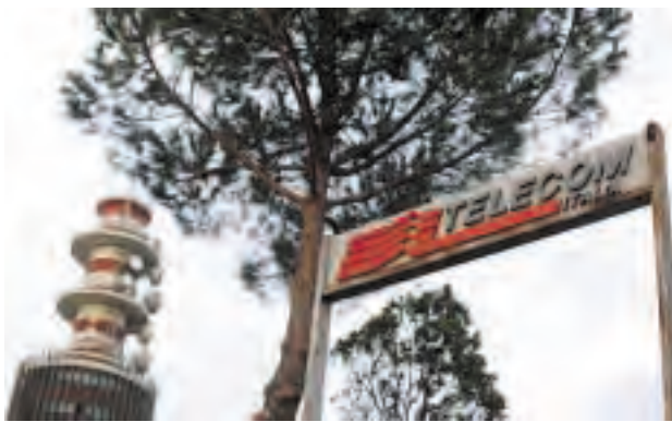
A Telecom Italia antenna booster is seen in northern Rome on 12 Nov, 2012.

an Italian newspaper said on Friday that Rome would prefer a merger between Telecom Italia and Telefonica rather than a buy-in by Sawiris. However in an interview with Reuters , Italy Economy Minister Fabrizio Saccomanni said Rome welcomed foreign investments and companies should be left to decide on their future