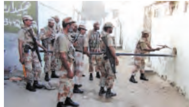
Pakistan Rangers take part in an operation against criminals in the country's violence-hit southern port city of Karachi on 7 Sept, 2013.