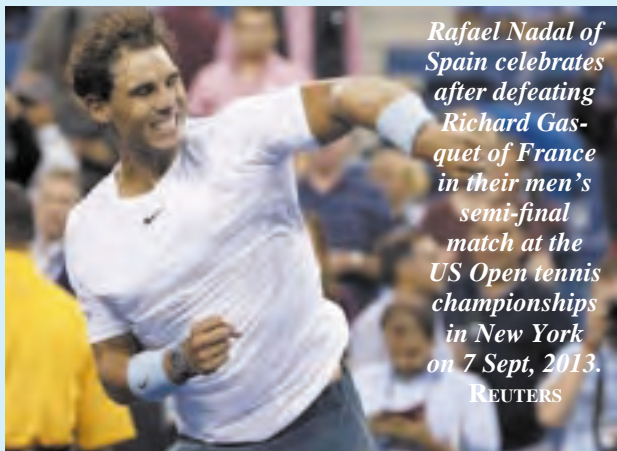
Rafael Nadal of Spain celebrates after defeating Richard Gasquet of France in their men's semi-final match at the US Open tennis championships in New York on 7 Sept, 2013.

The combatants locked into a marathon duel that lasted 21 minutes and featured a series of fierce rallies and brilliant shot-making.—Reuters