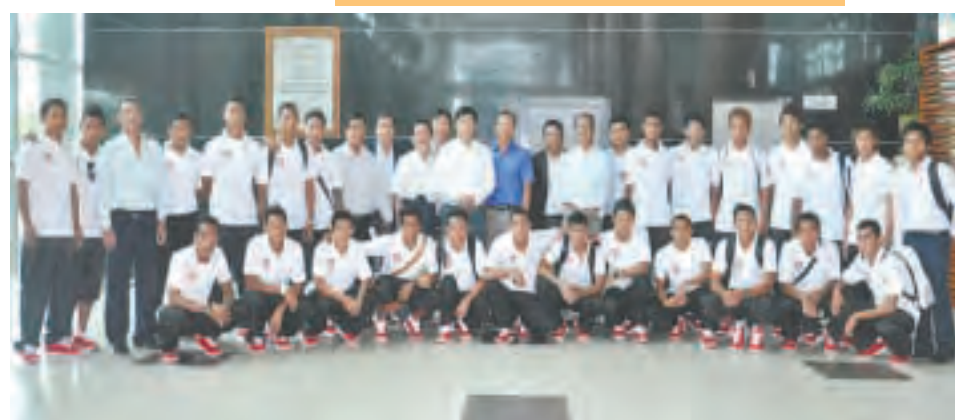
Myanmar U-23 national team seen at Yangon International Airport before departure to Malaysia.