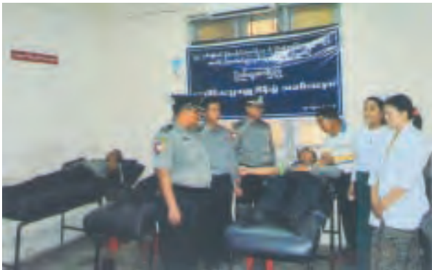
MANDALAY, 8 Sept— Myanmar Police Force is placing emphasis on rule of law, peace and stability and

drug elimination. As a gesture of hailing the 49th Anniversary Myanmar Police Force, 237 policemen and family members from No 4, 14 and 16 police battalions under control of No 3 Police Battalions Control Command donated blood at National Blood Bank of Mandalay General Hospital yesterday.