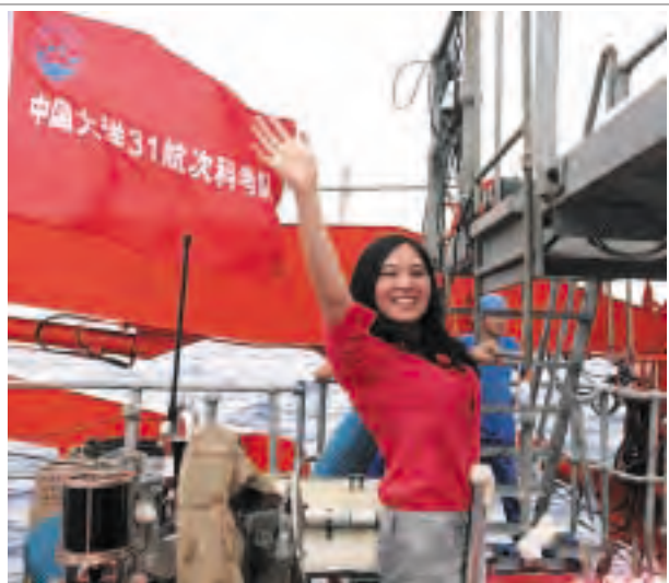
Tang Limei, the first woman scientist who dives into the ocean by China's manned submersible, waves on deck at Pacific Ocean, on 7 Sept, 2013. Jiaolong and its support ship the Xiangyanghong-09 are on a scientific research voyage focusing on polymetallic nodules in the northeast Pacific and cobalt-rich crusts in the northwest Pacific.—XINHUA