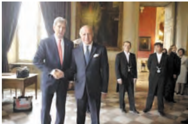
US Secretary of State John Kerry (L) arrives for a meeting with French Foreign Affairs Minister Laurent Fabius (2nd L) at the Ministry of Foreign Affairs in Paris on 7 Sept, 2013.

PARIS, 8 Sept — French, it is said, is the language of love. US Secretary of State John Kerry flaunted his fluency in the language on Saturday to deliver something of a love letter to France, one of the few world powers that seems likely to join the United States in any military action against Syria.