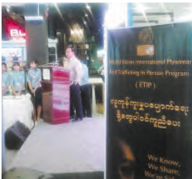
Wall of Pledge ceremony in progress.—MPF