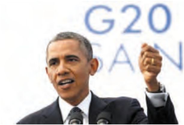
US President Barack Obama speaks during a news conference at the G20 Summit in St Petersburg, Russia on 6 Sept 2013.

Pope Francis, who two days ago branded a military solution in Syria "a futile pursuit," led the world's 1.2 billion Roman Catholics in a global day of prayer and fasting for peace in Syria,