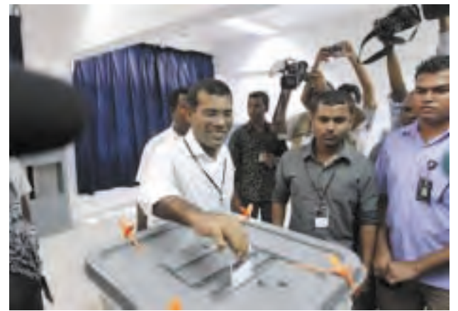
Maldivian presidential candidate Mohamed Nasheed, who was ousted as president in 2012, smiles as he casts his vote during the presidential elections in Male on 7 Sept, 2013.