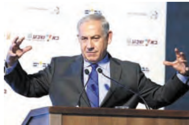
Israel's Prime Minister Benjamin Netanyahu gestures during his speech at the inauguration ceremony of a hi-tech industry park in the southern city of Beersheba on 3 Sept, 2013.

appeared to have been issued by newly-elected Hassan Rouhani and Foreign Minister Javad Zarif, wishing Jews a good Rosh Hashanah—the Jewish New Year, which was celebrated this week—made headlines in Israel. They were a change in tone from Rouhani's predecessor, Mahmoud Ahmadinejad, who left office last month and regularly use to rile Israel by calling for the destruction of the "Zionist entity".