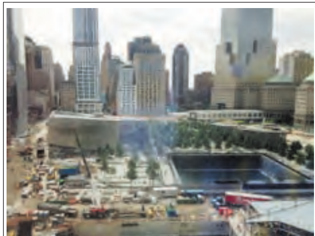
This 3 Sept, 2013 photo shows the reconstruction work underway at the site of the former World Trade Centre in New York.