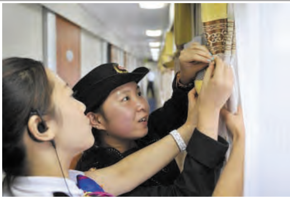
A boy displays animation character dolls in the Anime Festival Asia (AFA) Indonesia 2013 exhibition in Jakarta, Indonesia, on 6 Sept, 2013.