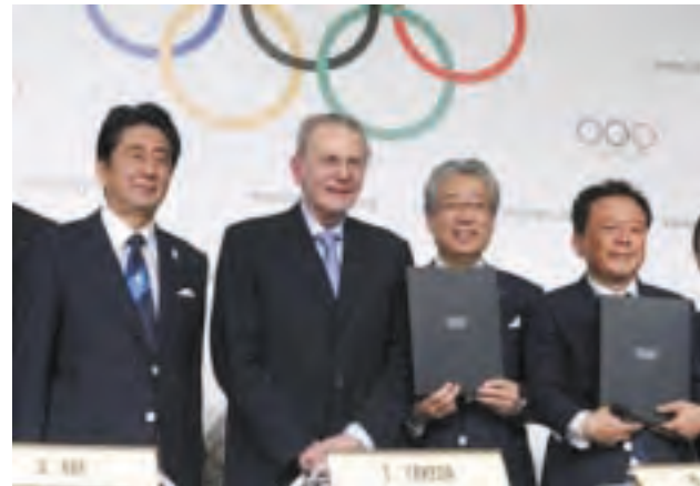
Japan's Prime Minister Shinzo Abe (L) stands with Jacques Rogge (2nd L), president of the International Olympic Committee (IOC), Governor of Tokyo Naoki Inose (R) and Japan's Olympic Committee President Tsunekazu Takeda during the Signature of the Host City Contract after Tokyo was selected as the city to host the 2020 Summer Olympic Games, in Buenos Aires on 7 Sept, 2013.

The Japanese capital also dangled $4.5 billion in front of the IOC a year before the vote, saying the money for the Games was "in the bank." "You described yourself as a safe pair of hands and as a surgeon even if I did not vote,