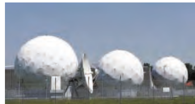
A general view of the large former monitoring base of the US intelligence organization National Security Agency (NSA) in Bad Aibling south of Munich, on 18 June, 2013.