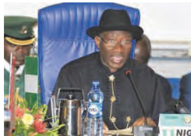
Nigeria's President Goodluck Jonathan attends the 43rd Economic Community of West African States (ECOWAS) meeting in Abuja on 17 July 2013.

than clubs and knives - has been operating against the Islamists in recent weeks, leading to the arrest of hundreds of them, the military says. The vigilantes and their families have become targets and scores have been killed in revenge attacks. Jonathan is under intense political pressure due to a split in his party and from a recently formed opposition coalition. He has been criticized for not quelling Boko Haram’s insurgency, which has intensified under his leadership.—Reuters