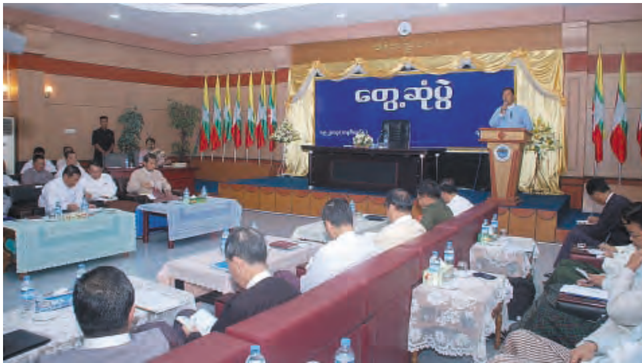
Speaker of Pyidaungsu Hluttaw and Pyithu Hluttaw Thura U Shwe Mann meets entrepreneurs and producers.

At the meeting, the Speaker of Pyidaungsu Hluttaw said he was there to observe the wishes of producers and distributors from livestock breeding and food production arenas, adding that discussions and suggestions would much contribute towards making laws. Political reform is only not enough for democratization. Executive reform, economic reform and function reform must be made in synchronization and harmony. Economic reform plays a crucial role in reform processes. The