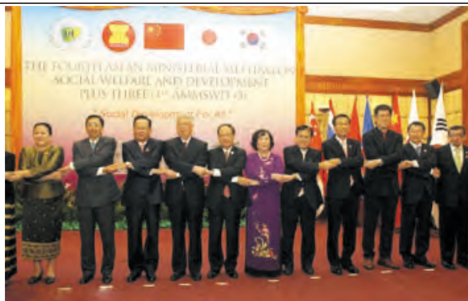
The ASEAN+3 social welfare ministers pose for group photos at the 4th ASEAN+3 Ministerial Meeting on Social Welfare and Development in Siem Reap, Cambodia, on 7 Sept, 2013. The ASEAN+3 social welfare ministers met here on Saturday to seek possibilities to broaden cooperation in social welfare for the benefits of the people in their respective countries.

“We will support these countries to reinforce the efforts and actions on sharing policies and information with China,” he said. “We will also support ex-