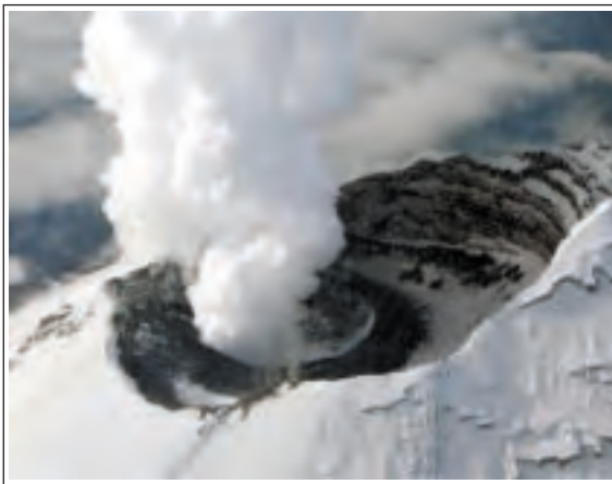
Image provided by the Armed Navy Secretariat of Mexico (SEMAR) shows steam and ash rising from the crater of the Popocatepetl volcano in Puebla, Mexico, on 6 Sept, 2013. According to the latest report from the National Centre for Disaster Prevention (CENAPRED), during the last 24 hours there have been 37 exhalations of low intensity in the volcano, and the volcanic alert remains at yellow Phase 2.—XINHUA