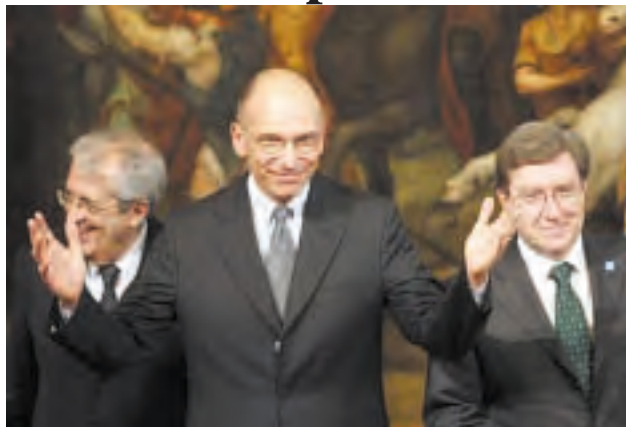
Italy's Prime Minister Enrico Letta (C) gestures next to Economy Minister Fabrizio Saccomanni (L) and Labour Minister Enrico Giovannini during a meeting for "Jobs for Youth - Building Opportunities, Opening Paths", at Palazzo Chigi in Rome on 14 June 2013.