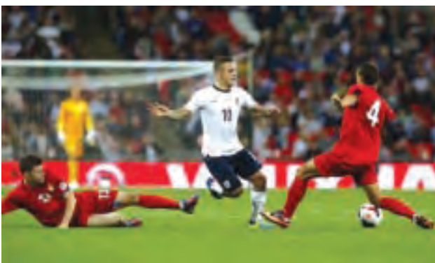
England's Jack Wilshere (C) is challenged by Moldova's Simeon Bulgaru and Alexandru Onica (R) during their 2014 World Cup qualifying soccer match at Wembley Stadium in London, on 6 Sept, 2013.—REUTERS

Netherlands also had defensive questions to answer after they saw a first-minute lead secured by Arjen Robben evaporate in Tallinn where they stood seconds away from an embarrassing 2-1 defeat after a Konstantin Vassiljev double for the hosts.—Reuters