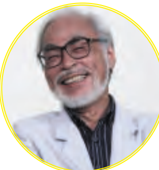
Japanese director Hayao Miyazaki speaks during a news conference held to announce his retirement from film in Tokyo on 6 Sept, 2013.

I was glad I became a director but I have been glad I'm an animator many, many times," he told about 600 journalists gathered at a Tokyo hotel. "To be an animator, if you are able to perfectly