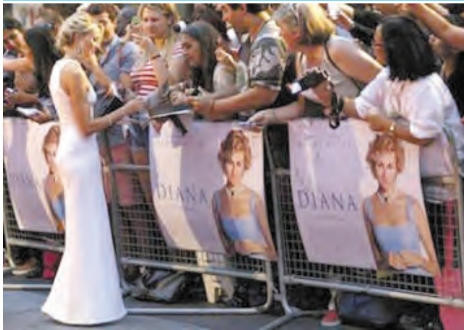
Cast member Naomi Watts of Australia, who plays the title role, signs autographs before the world premiere of "Diana" at Leicester Square in London on 5 Sept, 2013.