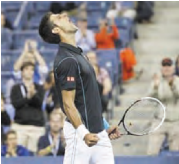
Novak Djokovic of Serbia celebrates defeating Mikhail Youzhny of Russia during their quarter-final match at the US Open tennis championships in New York, on 5 Sept, 2013.

NEW YORK, 7 Sept—Novak Djokovic and Rafa Nadal can set up a delectable US Open final between the top two players in the world with 2013 grand slam bragging rights at stake by posting victories in Saturday's semi-finals.