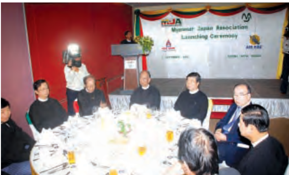
Ceremony to mark founding anniversary of Myanmar Japan Association (MJA) in progress.

YANGON, 7 Sept—A ceremony to mark the founding anniversary of Myanmar Japan Association (MJA) was held at Sedona Hotel, here yesterday evening, with an address