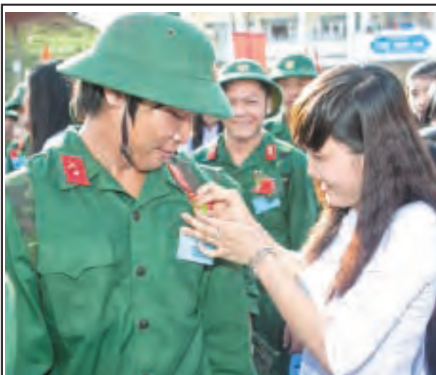
A girl adorns her friend with a flower during the second army recruitment 2013 at Long My District, southern Vietnam’s Hau Giang Province, on 6 Sept 2013. A total of 550 young people were recruited in Hau Giang Province in the second recruitment. Vietnam holds army recruitment twice a year.

Singapore came in the second place in the overall global competitiveness ranking, trailing Switzerland. China’s Hong Kong was the seventh, while Japan came in the 9th.