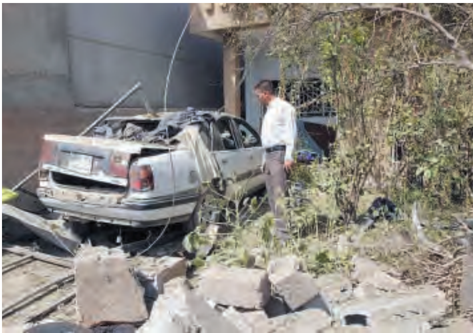
An Afghan man looks at the wrecks of a damaged car at the blast site in Kirkuk, Iraq, on 5 Sept, 2013. Three car bombs ripped through Iraq's ethnically mix city of Kirkuk on Thursday, killing two people and wounding some 25 others, police said.