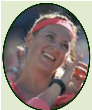
Victoria Azarenka of Belarus makes a heart symbol as she celebrates defeating Flavia Pennetta of Italy at the US Open tennis championships in New York on 6 Sept, 2013.

NEW YORK, 7 Sept—Defending champion Serena Williams slugged her way to a US Open title rematch against Victoria Azarenka as the top two seeds scored straight-sets knockouts in their semi-finals on Friday.