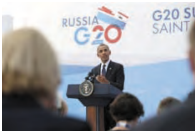
US President Barack Obama speaks to the media during a news conference at the G20 summit in St Petersburg on 6 Sept 2013.

ST PETERSBURG, (Russia), 7 Sept—US President Barack Obama resisted pressure on Friday to abandon plans for air strikes against Syria and enlisted the support of 10 fellow leaders for a “strong” response to a chemical weapons attack.