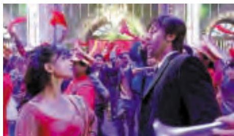
Ranbir and Pallavi will be seen together in the upcoming film Besharam.