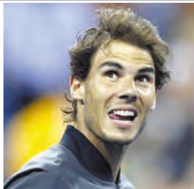
Rafael Nadal of Spain looks up at the crowd after defeating compatriot Tommy Robredo following their men's quarter-final match at the US Open tennis championships in New York on 4 Sept, 2013.