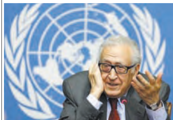
Arab League-United Nations envoy Lakhdar Brahimi gestures during a news conference on the situation in Syria at the United Nations European headquarters in Geneva on 28 Aug 2013.

Lavrov said that “a clear understanding is taking shape among many responsible states that the use of force, bypassing the Security Council, would essentially put an end to efforts to reach a political settlement and convene an international conference.”—Reuters