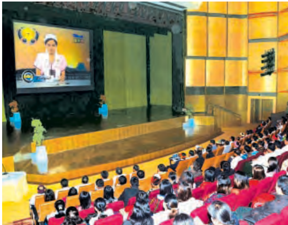
Test show at coordination meeting on test broadcasting of National Races Channel was held at Myanmar Radio and Television (MRTV) in progress.

The Public Service Media Bill which has been submitted at the Hluttaw covers the prescriptions