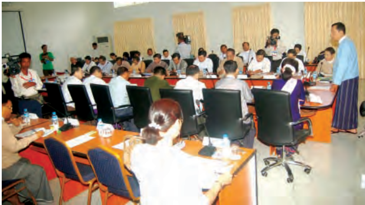
Speaker of Pyithu Hluttaw Thura U Shwe Mann speaking at the meeting with organizations for rule of law at the Hluttaw Office Branch (Yangon) on Inya Road in Kamayut Township.

YANGON, 7 Sept—Speaker of Pyithu Hluttaw Thura U Shwe Mann met the organizations for rule of law at the Hluttaw Office Branch (Yangon) Inya Road in Kamayut Township, here, this afternoon.