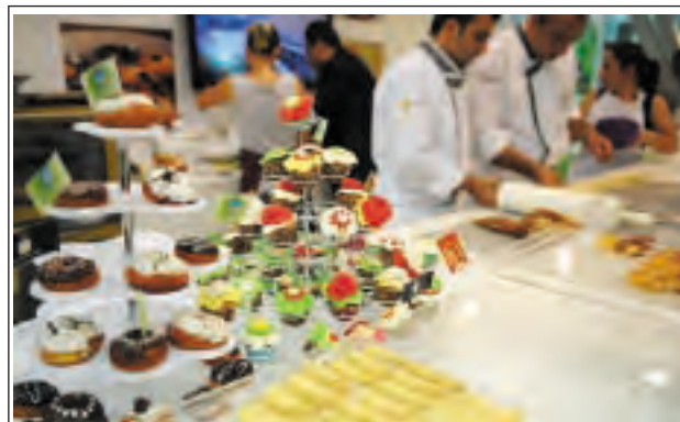
Cookies and cakes can be seen at a booth during the 2013 World Food fair in Istanbul on 6 Sept, 2013. More than 400 food producers and companies from 28 countries and regions participated in the exhibition opened here on Friday.