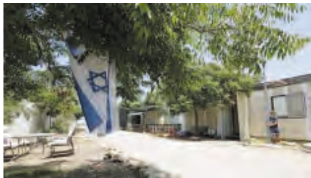
A boy stands near an Israeli flag in the West Bank Jewish settlement of Ofra, north of Ramallah on 18 July, 2013.

Literacy is much more than an educational priority – it is the ultimate investment in the future and the first step towards all the new forms of literacy required in the twenty-first century. We wish to see a century where every child is able to read and to use this skill to gain autonomy. On this International Literacy Day, we call on governments to work together to achieve this dream. This requires new funding, policies drawn up with the populations concerned, new and more innovative forms of action, taking full advantage of new technologies. The progress made in recent years shows that this is possible, and UNESCO is committed to doing all that it can to make it happen.—UNIC/Yangon