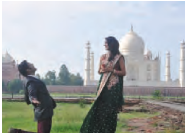
Mallika will be seen in the reality TV show The Bachelorette India - Mere Khayalon Ki Mallika.

AGRA, 7 Sept — Bollywood actress Mallika Sherawat, who was in Agra to shoot a promotional trailer of TV reality show The