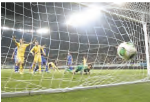
Ukrainian players celebrate a goal during their teams' World Cup qualifying soccer match against San Marino at the Arena Lviv stadium in Lviv on 6 Sept, 2013.—REUTERS

KIEV, 7 Sept — Ukraine earned their biggest ever win by beating San Marino 9-0 at a packed Lviv Arena on Friday before they host England in a key World Cup Group H qualifier in four days' time.