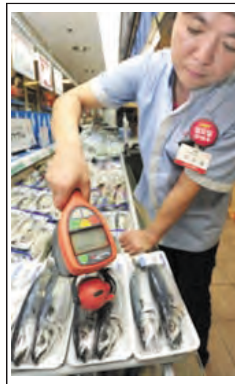
An employee checks radiation levels of fish at a fish corner of a market near Seoul Station on 4 Sept, 2013. South Korea said on 6 Sept, 2013, it has banned the import of any fisheries products from eight Japanese prefectures, including Fukushima.