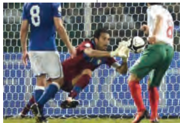
Italy's goalkeeper Gianluigi Buffon (C) makes a save during the World Cup qualifying soccer match against Bulgaria at the Renzo Barbera Stadium in Palermo on 6 Sept, 2013.

The clean sheet banished concerns over recent German defensive frailties as they stayed in control of