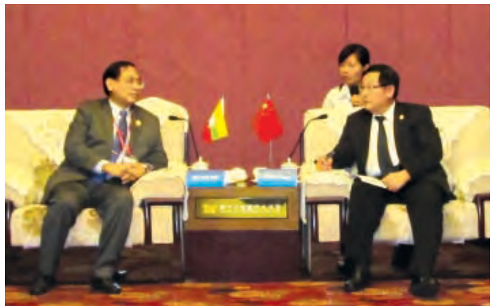
Union Minister for Science and Technology Dr Ko Ko Oo holds talks with Chinese Science and Technology Minister Dr Wan Gang.