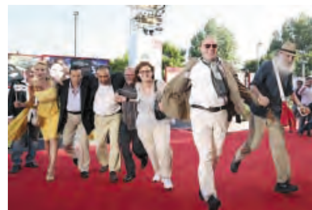
Director Gianfranco Rosi (2nd R) poses with his cast during a red carpet for the movie "Sacro Gra" at the 70th Venice Film Festival on 5 Sept, 2013.

on Saturday. The other is director Errol Morris's "The Unknown Known", a portrayal of former US Defence Secretary Donald Rumsfeld. Meanwhile "The Fifth Estate," an unlikely thriller that chronicles the emergence of anti-secrecy website WikiLeaks and its enigmatic founder Julian Assange, premiered at the Toronto International Film Festival on Thursday.