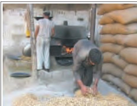
Afghan men work at a peanut factory in Nangarhar Province of eastern Afghanistan on 5 Sept, 2013.

Robertson said he had lodged a notice of motion in the New Zealand Parliament calling on the government to work with the United Nations towards a lasting peace in the Central African Republic.— Xinhua