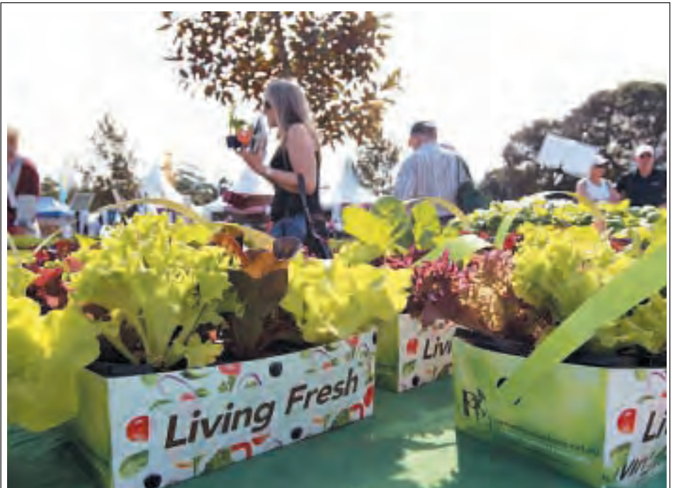
People buy vegetable which can grow in a balcony at the Australian Garden Show in Sydney, Australia, on 5 Sept, 2013. The event is underpinned by the philosophy-celebrating gardening, flowers, sustainability and design, and offers something for all garden lovers.

The Chairman Bid Evaluation and Awarding Committee (BEAC)