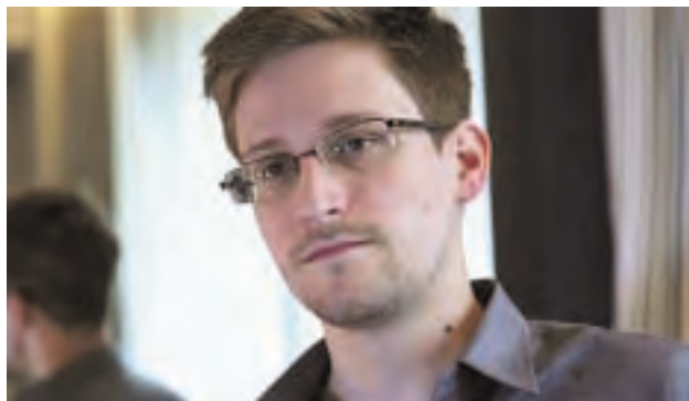
NSA whistleblower Edward Snowden, an analyst with a US defence contractor, is seen in this still image taken from video during an interview by The Guardian in his hotel room in Hong Kong on 6 June, 2013.