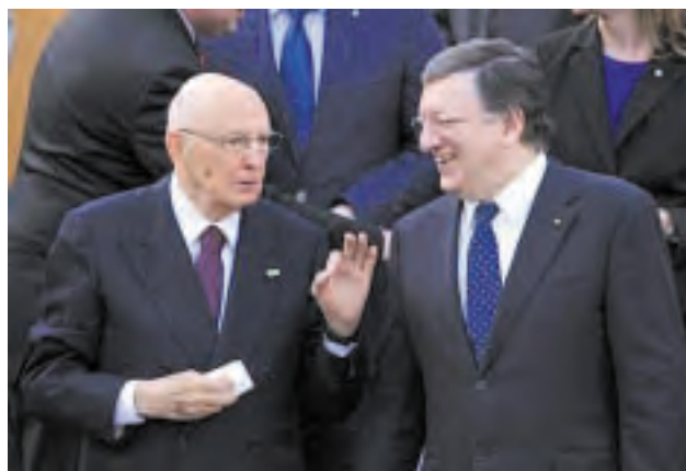
Italian President Giorgio Napolitano (L) discuss with EU Commission President Jose Manuel Barroso (R) before a family photo during the celebration of the accession of Croatia to the European Union at St. Mark’s Square in Zagreb on 30 June 2013.

On Thursday, one of the 76-year-old billionaire’s most loyal lieuten-