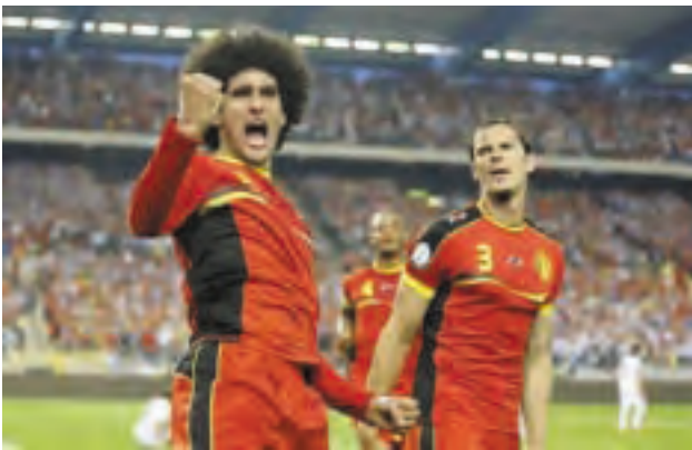
Belgium's Marouane Fellaini (L) celebrates after scoring against Serbia during their 2014 World Cup qualifying soccer match at the King Baudouin stadium in Brussels on 7 June, 2013.

LONDON, 3 Sept—Arsenal paid Real Madrid a club record fee for Germany playmaker Mesut Ozil and Manchester United bought Belgium forward Marouane Fellaini from Everton in a crazy last hour before the transfer window closed on Monday.