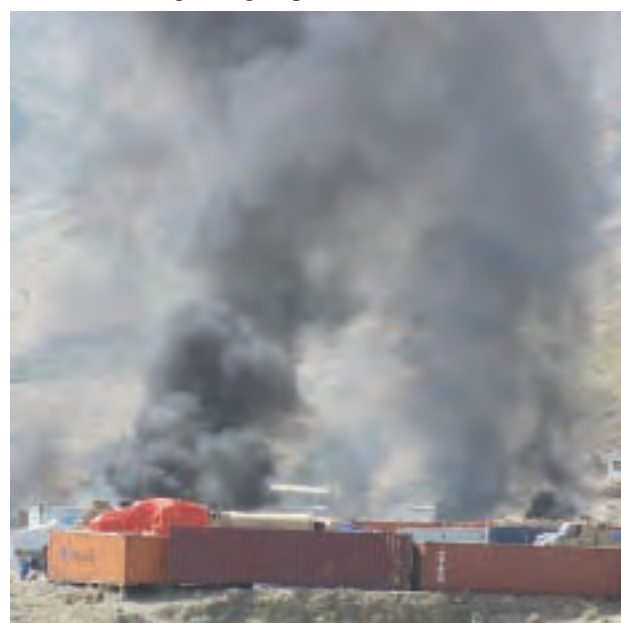
Photo taken on 2 Sept, 2013 shows the US military base following an attack by Taliban fighters in Torkham near Afghan border with Pakistan in Nangarhar Province, eastern Afghanistan. Afghan Taliban insurgent group early Monday morning launched a complex attack on a US forces' base in eastern Afghan Province of Nangarhar, sources said.