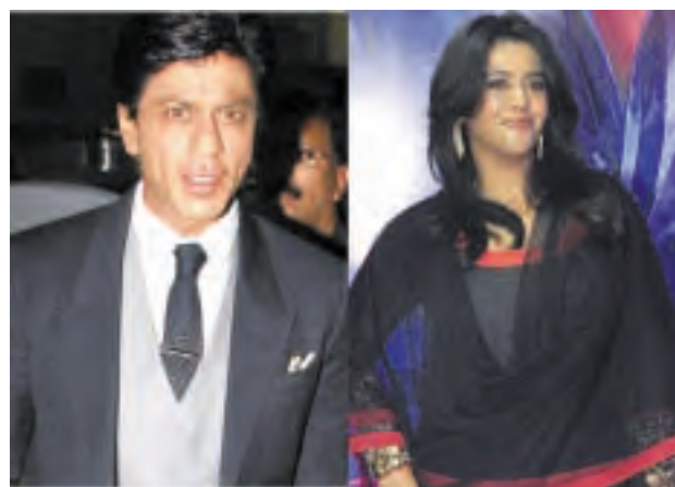
SRK and Ekta’s films may just clash at the box office.

This year too, Ekta (with Once Upon A Time In Mumbai Dobaara!) was set to clash with Shah Rukh (Chennai Express) until the star requested her dad, veteran actor Jeetendra to alter the film’s release date. The producer apparently was extremely upset after her film failed to work wonders at the BO. So much so that