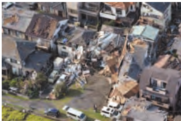
Photo taken from a Kyodo News helicopter shows houses destroyed by a strong gust of wind, an apparent tornado, in Koshigaya, Saitama Prefecture, near Tokyo, on 2 Sept, 2013.