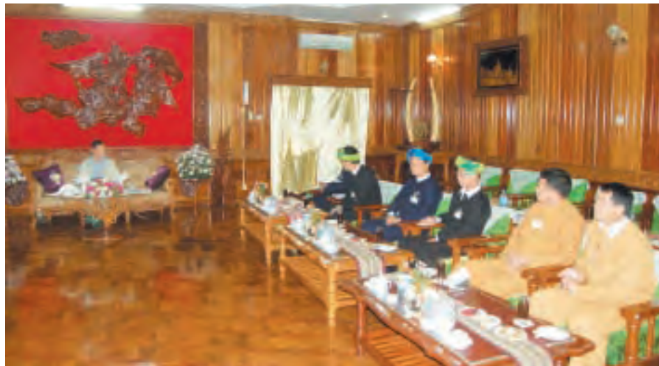
Pyidaungsu and Pyithu Hluttaw Speaker Thura U Shwe Mann meets with officials from Pa-O Self-Administered Zone, PNLO and SSA/RCSS in Taunggyi.

With Regard to the reports, the Speaker replied that special emphasis is placed on dealing with the land disputes by forming the commission at the Pyidaungsu Hluttaw. At the same time, Land Management Committees which were formed by