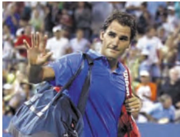
Roger Federer of Switzerland waves as he walks off the court after losing in three sets to Tommy Robredo of Spain at the US Open tennis championships in New York on 2 Sept, 2013.

"I kind of feel like I beat myself, without taking any credit away from Tommy," a dejected Federer told reporters. "I kind of self destructed, which is very disappointing, especially on a quicker court.