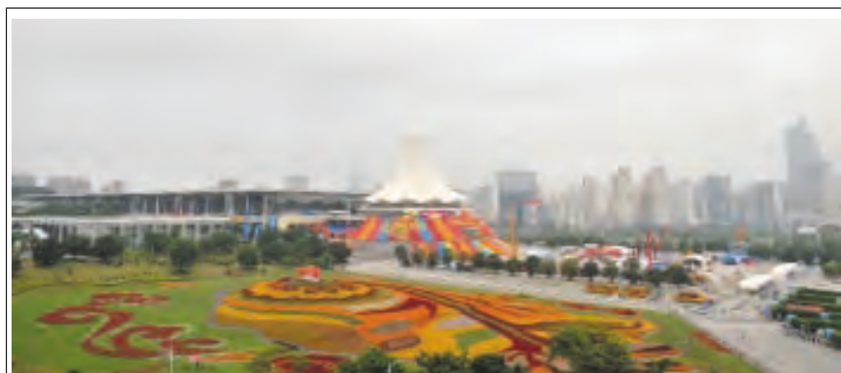
Photo taken on 3 Sept, 2013 shows the outdoor scene of the Nanning International Convention and Exhibition Centre in Nanning, capital of southwest China's Guangxi Zhuang Autonomous Region. The 10th China-ASEAN Expo opened in the centre on Tuesday.