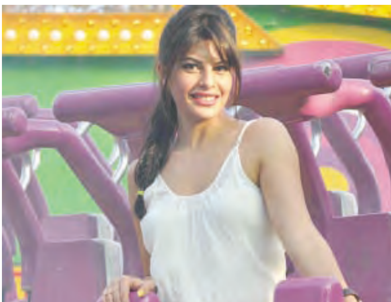
Jacqueline plays a double role in the film.

“We haven’t started shooting for Roy yet. We will start by end of the year. It’s really interesting, I am working opposite two amazing actors,” she said. Roy features Ranbir Kapoor and Arjun Rampal. To be directed by Vikramjit Singh, it is currently slated for release in June 2014.