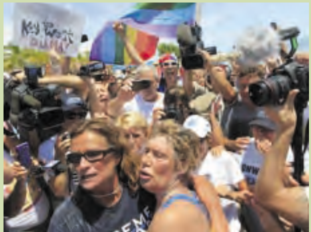
US long-distance swimmer Diana Nyad (front R), 64, is welcomed ashore after completing her swim from Cuba as she arrives in Key West, Florida, on 2 Sept, 2013.