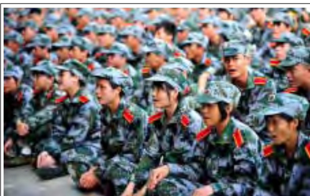
Freshmen of Hainan Technology and Business College receive military training in Haikou, capital of south China's Hainan Province, on 2 Sept, 2013.