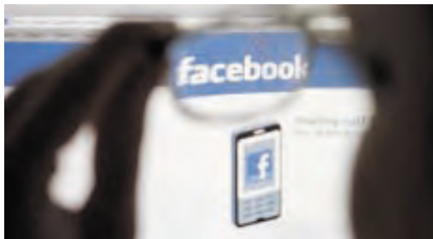
In this photo illustration, a Facebook logo on a computer screen is seen through glasses held by a woman in Bern on 19 May, 2012.

NEW YORK, 3 Sept — Groups on the popular networking site Facebook may help educate men about HIV prevention and testing, a new study suggests. Researchers found that specially-created Facebook social media groups helped encourage men who have sex with men