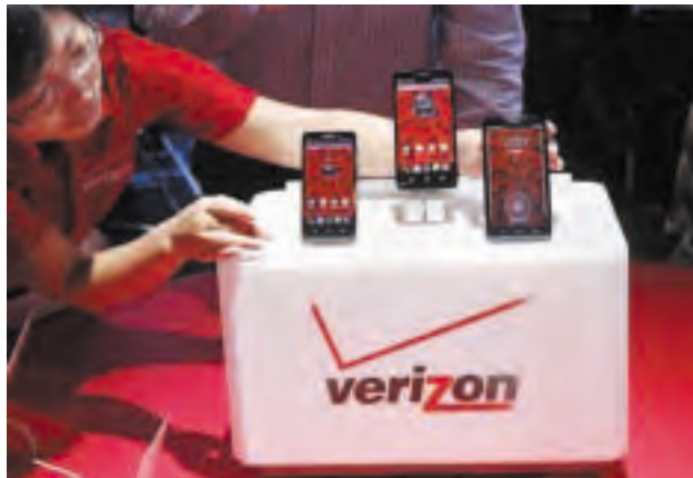
The Droid Mini, Droid Ultra and Droid Maxx are seen on display during the Verizon Wireless media event in New York on 23 July, 2013.