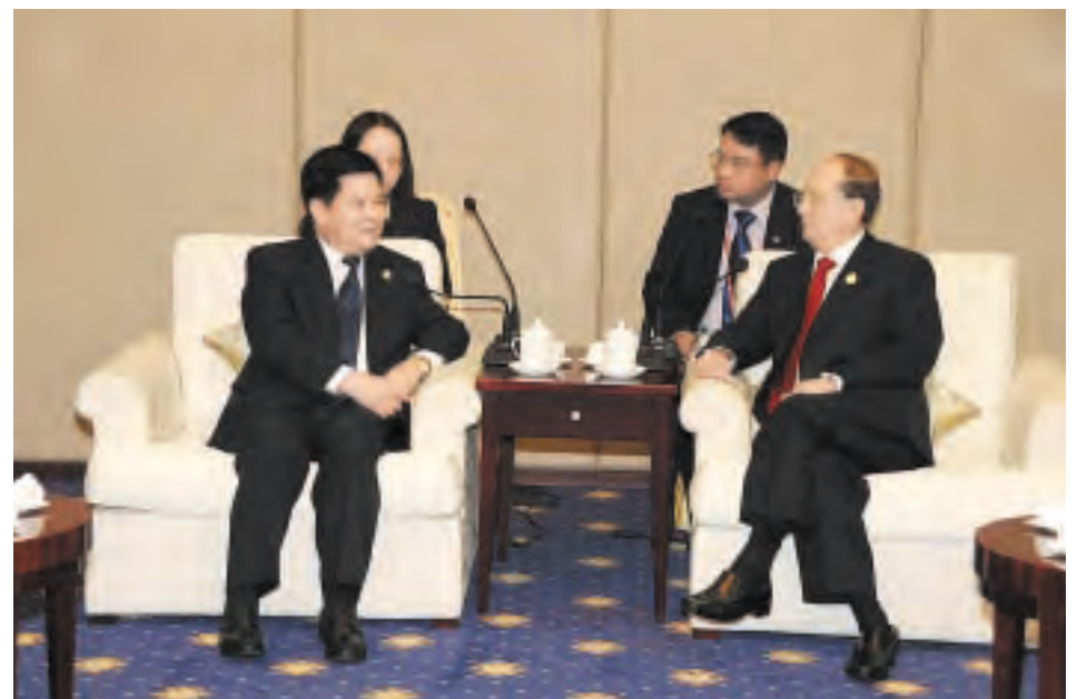
President U Thein Sein receives Governor of Yunnan Province Mr. Li Jigehen.