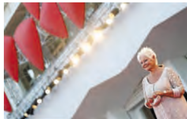
Actress Judi Dench arrives during a red carpet for the movie “Philomena”, directed by Stephen Frears, during the 70th Venice Film Festival in Venice on 31 Aug, 2013.

Haunted by visions of a black hole, he has no friends, talks about himself in the first person plural and