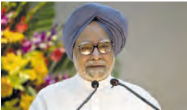
Indian Prime Minister Manmohan Singh speaks during the launch of the "Gandhi Heritage Portal" in New Delhi on 2 Sept, 2013.

NEW DELHI, 3 Sept—India's upper house of parliament on Monday approved a $20 billion (12.8 billion pounds) scheme to distribute subsidised wheat and rice to 800 million people, backing an anti-malnutrition drive that investors fear will mean missing the fiscal deficit target.