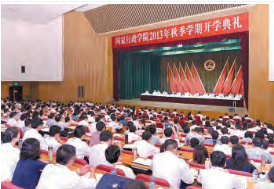
The Chinese Academy of Governance holds the inauguration for its Autumn Semester in Beijing, capital of China, on 2 Sept, 2013.