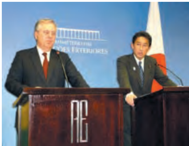
Brazilian Foreign Minister Luiz Alberto Figueiredo (L) and Japanese Foreign Minister Fumio Kishida hold a Press conference in Brasilia, Brazil, on 2 Sept, 2013, after their talks.

BRASILIA, 3 Sept — Japan and Brazil agreed on Monday to cooperate in developing marine resources, including underwater oil fields, off Brazil as well as satellite-oriented anti-disaster measures for the Latin American country.