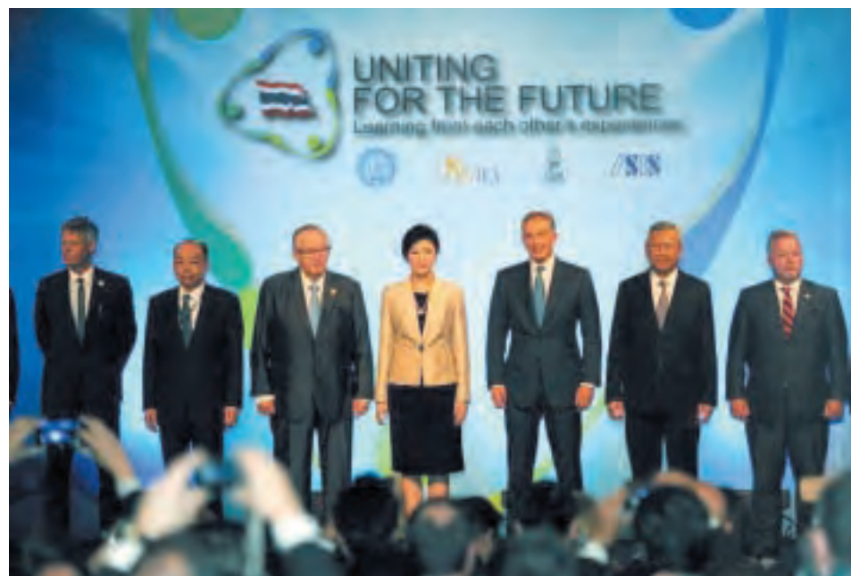
Thai Prime Minister Yingluck Shinawatra (C) and former British Prime Minister Tony Blair (3rd R) pose for group photos at a special lecture on "Uniting for the Future: Learning from each other's experiences" in Bangkok, capital of Thailand, on 2 Sept, 2013.

the past and make a better future. The reconciliation bid must be based upon mutual trusts... True reconciliation depends upon the will of the people and it can