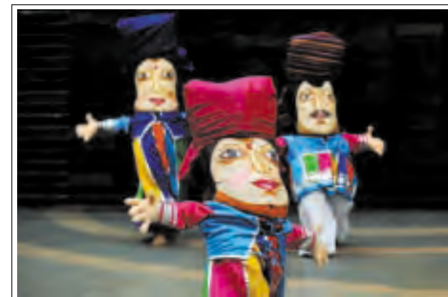
Artists from Masti Makers perform during the World Puppet Festival in Jakarta, Indonesia, on 2 Sept, 2013. Puppet shows are presented in theatres, streets, cultural centres, parks and so on to celebrate the World Puppet Carnival.