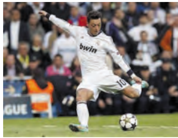
Real Madrid's Mesut Ozil shoots towards the goal of Borussia Dortmund during their Champions League semi-final second leg football match at Santiago Bernabeu stadium in Madrid on 30 April, 2013.

Everton were also busy recruiting on deadline day, signing young Chelsea striker Romelu Lukaku and ex-England midfielder Ga-