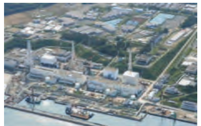
An 31 Aug, 2013, photo from a Kyodo News helicopter shows the Fukushima Daiichi Nuclear Power Station in Fukushima Prefecture.