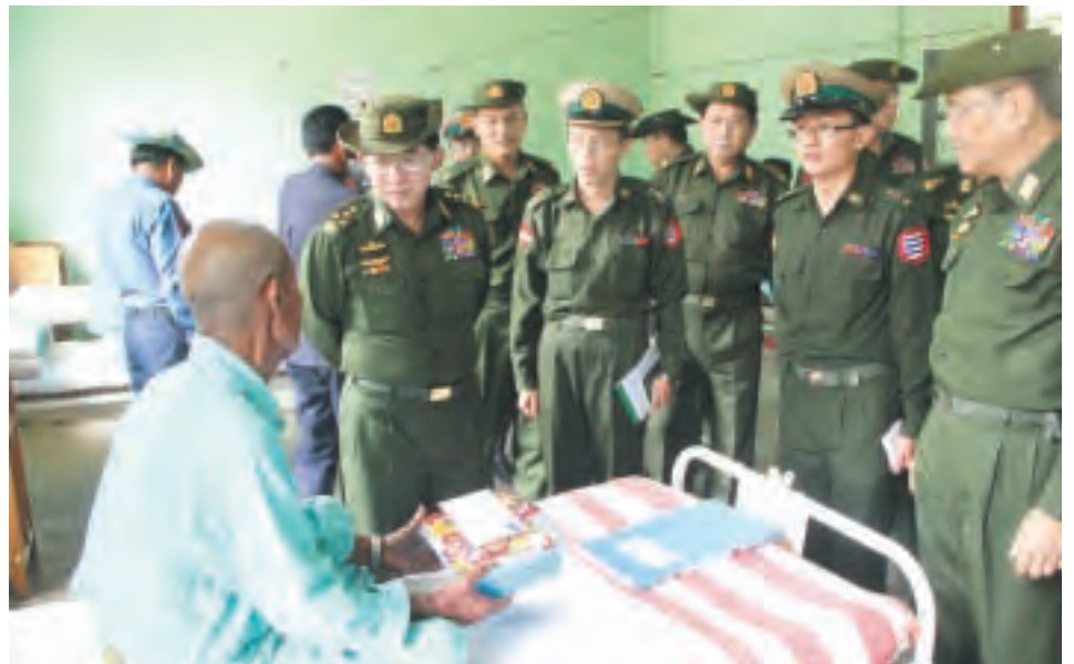
Senior General Min Aung Hlaing comforts patient at the hospital of Battlefield Medical Battalion in Pathein.