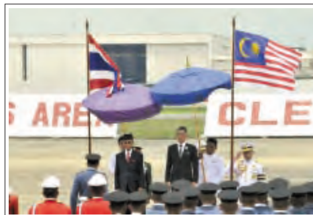
Malaysia's King Mizan Zainal Abidin (C, with red tie) and Thai Crown Prince Maha Vajiralongkorn (C, with grey tie) review the honour guard during a welcome ceremony upon Abidin's arrival at the military airport in Bangkok, Thailand, on 2 Sept, 2013. The King and Queen of Malaysia are on a four-day official visit to Thailand.