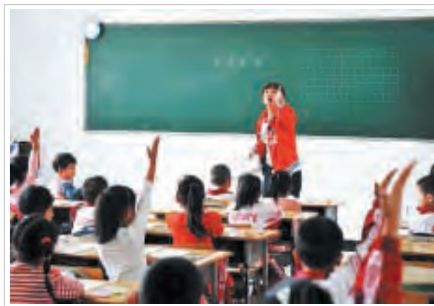
A teacher invites a student to answer a question in class at No 1 Primary School of Fuyuan County, northeast China's Heilongjiang Province, on 2 Sept, 2013. All the 1,400 students from the flood-affected areas in Fuyuan County have been resettled in new schools at the beginning of the new semester.

SHIPPING AGENCY DEPARTMENT MYANMA PORT AUTHORITY AGENT FOR: M/S REGIONAL CONTAINER LINES Phone No: 256908/378316/376797