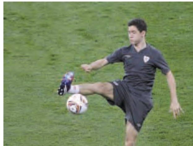
Athletic Bilbao's Ander Herrera kicks the ball during a training session on the eve of their Europa League final match against Atletico Madrid at the National Arena stadium in Bucharest on 8 May, 2012.

The Basque club last week rejected an offer which Spanish newspapers reported at $40 million from United for