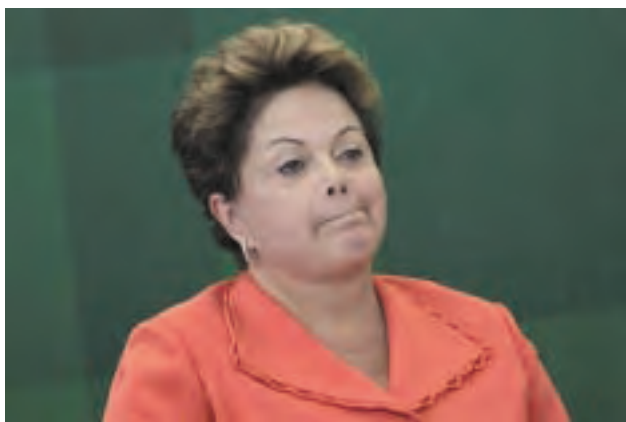
Brazil's President Dilma Rousseff participates in the inaugural ceremony for the new Minister of Foreign Affairs of Brazil Luiz Alberto Figueiredo Machado at the Planalto Palace on 28 August, 2013.