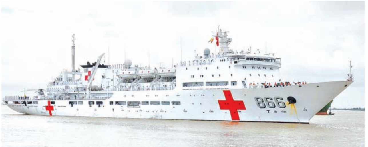
Chinese Navy's Hospital Ship Peace Ark (866) arrives at Myanmar International Terminal Thilawa (MITT) in Yangon.—MNA

NAY PYI TAW, 28 Aug—As part of China-Myanmar friendship programme and medical trip, Chinese Navy's Hospital Ship Peace Ark (866) carrying 400 health staff led by Rear Admiral Shen Hao from the Chinese Navy docked at Myanmar International Terminal Thilawa (MITT) in Yangon this morning via Malaysia.