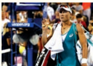
Samantha Stosur of Australia walks off the court after losing her first round match to Victoria Duval of the US at the US Open tennis championships in New York, on 27 Aug, 2013.