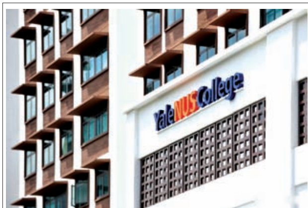
Photo taken on 27 Aug, 2013 shows the facade of Yale-National University of Singapore (NUS) College's temporary school facilities during its first inauguration ceremony in Singapore.