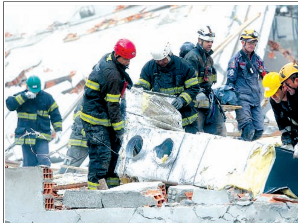
Rescuers work in the site of the collapse of a building in Sao Paulo, Brazil, on 27 Aug, 2013. A building under construction collapsed on Tuesday morning in the Sao Mateus region, in the east zone of Sao Paulo. At least six people were killed and 24 injured on Tuesday when a commercial building under construction collapsed, officials said.