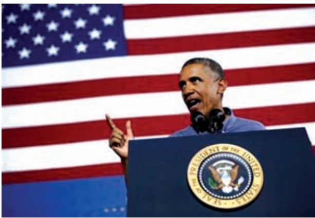
US President Barack Obama delivers remarks on affordable education at Henninger High School in Syracuse, New York, on 22 Aug 2013.