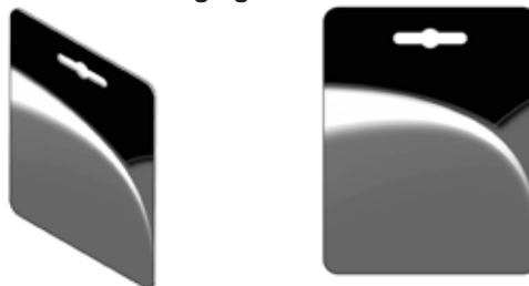
Fig.1 Perspective view Fig.2 Front view

INDUSTRIAL DESIGN CAUTION PANASONIC CORPORATION , a company incorporated in Japan and having its registered office at 1006, Oaza Kadoma, Kadoma-shi, OSAKA 571-8501 JAPAN, is the owner and proprietor of the following Design in the title of "Card Board for Packaging":