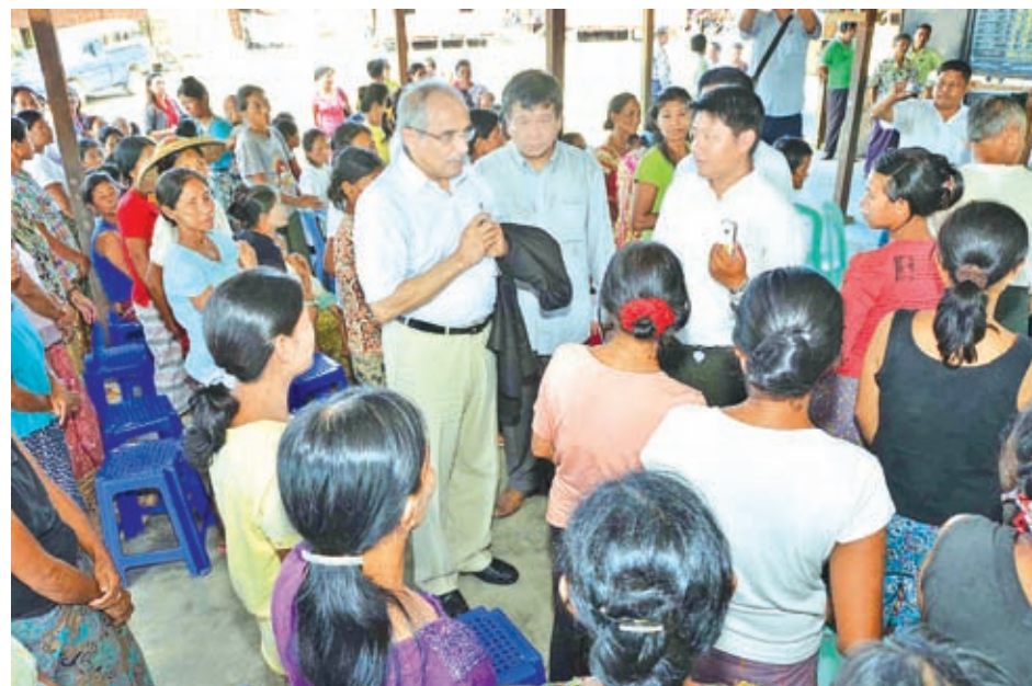
Special Adviser to UN Secretary-General for Myanmar Mr Vijay Nambiar meets local people.

On the occasion, the Union Minister said that the country is striking for eternal peace and stability and it has now seen progress in ongoing trust-building with KIO/KIA groups. There has come out fruitful results through peacemaking process step by step. Mass participation