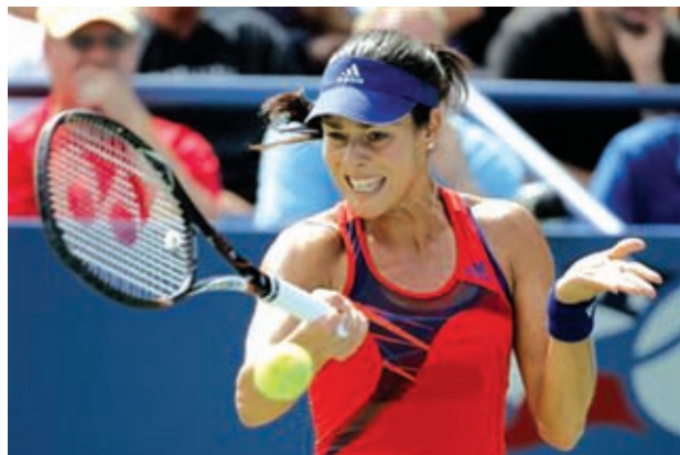
Ana Ivanovic of Serbia hits a return to Anna Tatishvili of Georgia at the US Open tennis championships in New York on 27 Aug, 2013.

"I'm very confident with the game and the way I was playing," she said, adding she was concentrating on conditioning and making her serve and forehand more dominant.