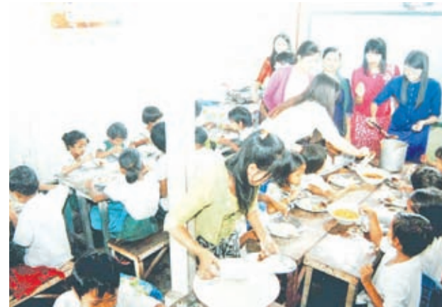
Wellwishers feed refreshments to school children.