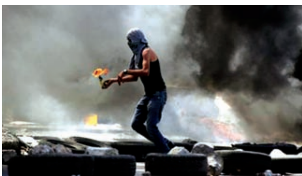
A Palestinian protester gets ready to throw a Molotov cocktail during small clashes with Israeli forces following the funerals of Robin Zayed, Younis Jahjouh and Jihad Aslan at Qalandiya Refugee Camp near the West Bank city of Ramallah on 26 Aug, 2013.—REUTERS

"We decided not to go to the scheduled round of talks today in protest of killing three Palestinian