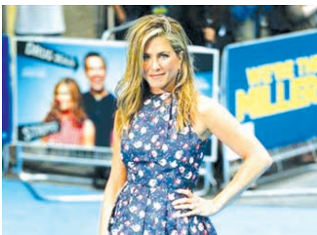
Actress Jennifer Aniston poses for photographers as she arrives for the UK premiere of "We're the Millers" in Leicester Square in central London on 14 Aug, 2013.