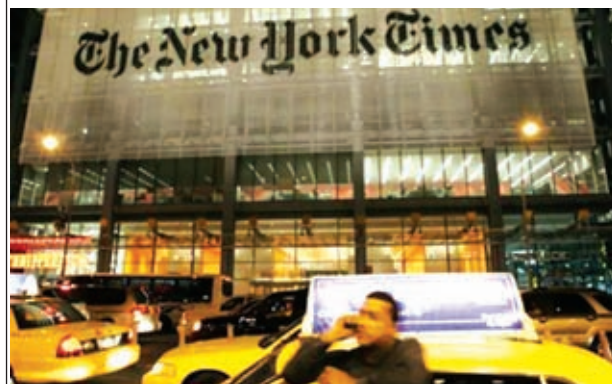
A man speaks on his mobile phone in front of the New York Times building in New York City on 21 May, 2009.

Security experts said electronic records showed that NYTimes.com, the only site with an hours-long outage, redirected visitors to a server controlled by the Syrian group before it went dark. New York Times Co NYT.N spokeswoman Eileen Murphy tweeted the "issue is most likely the result of a malicious external attack", based on an initial assessment. The Huffington Post attack was limited to the blogging platform's UK web address. Twitter said the hack led to availability issues for an hour and a half but that no user information was compromised.—Reuters