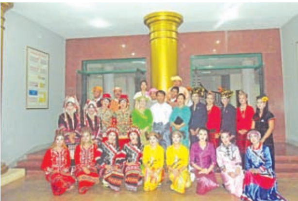
Shan State cultural troupe poses for documentary photo at performing arts festival.

Release more and more fact would help crack down "rumours" more effectively than the mere words, "Don't believe rumours," with no efforts to offer what are facts.