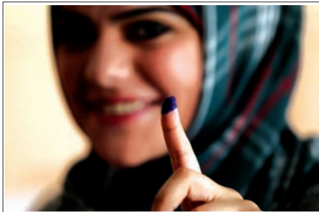
A woman shows her ink-stained finger after voting for municipal elections at a polling station in Amman, Jordan, on 27 Aug, 2013.

Pillay, who is on a seven day visit to Sri Lanka, said on Sunday that following her visit she will be reporting on the human rights situation in Sri Lanka to the UN Human Rights Council in Geneva. Pillay said that she is not visiting Sri Lanka to criticize the country but to look into human rights concerns. She said that she wants to see if the government is complying with the human rights standards set to the whole world and accepted by the Sri Lankan government.