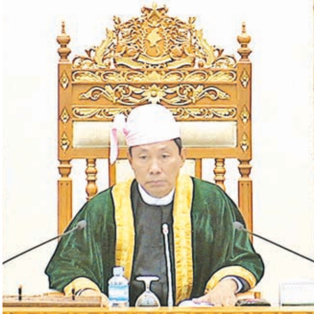
Speaker of Pyithu Hluttaw Thura U Shwe Mann at today's session.—MNA

NAY PYI TAW, 28 Aug—Deputy Minister for Agriculture and Irrigation U Ohn Than replied to the question on safety use of legally permitted pesticides raised by U Sai Win Khaing of Hsenwi Constituency at today's session of Pyithu Hluttaw.