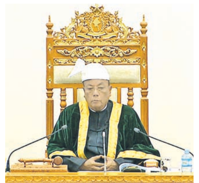
Speaker of Amyotha Hluttaw U Khin Aung Myint at today's session.—MNA

MP U Zone Hle Htan of Chin State Constituency No.2 discussed that non-profit media are carrying out the publishing in national races languages in the rural areas that have