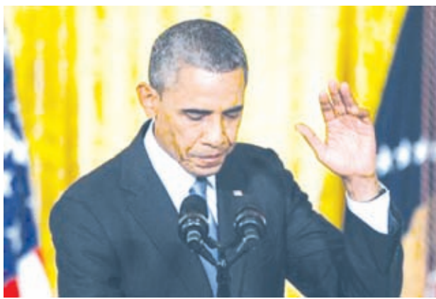
US President Barack Obama waves before departing a news conference in the East Room of the White House in Washington, on 9 Aug, 2013.

"You know, I did see 'The Butler,' and I did tear up," Obama told syndicated radio hosts Tom Joyner and Sybil Wilkes in an inter-