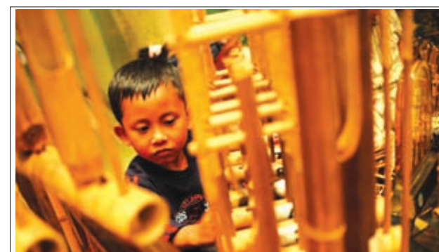
A child plays angklung, an Indonesian traditional musical instrument, during the two-day Bamboo Music Festival in Jakarta, Indonesia, on 27 Aug, 2013.