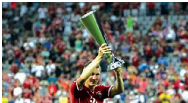
Bayern Munich's Bastian Schweinsteiger holds up the trophy after winning the final match against Manchester City at the Audi Cup friendly soccer tournament in Munich on 1 Aug, 2013.

BERLIN, 28 Aug—Bayern Munich midfielder Bastian Schweinsteiger is doubtful for their Super Cup game against Chelsea on Friday in Prague after straining his ankle in a 1-1 Bundesliga draw at Freiburg on Tuesday.