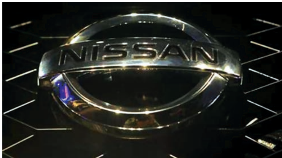
A company logo is seen on the newly-unveiled Nissan "Terrano" compact sport utility vehicle during a news conference in Mumbai on 20 Aug, 2013.