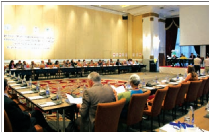
“Save Food Asia-Pacific,” a high-level consultation on food loss and waste in the Asia-Pacific, begins in Bangkok on 27 Aug, 2013, to examine measures to deal with loss and waste increasing in the region and the rest of the world. KYODO NEWS

tially determined to be at 27.8 degrees south latitude and 179.9 degrees west longitude.—Xinhua