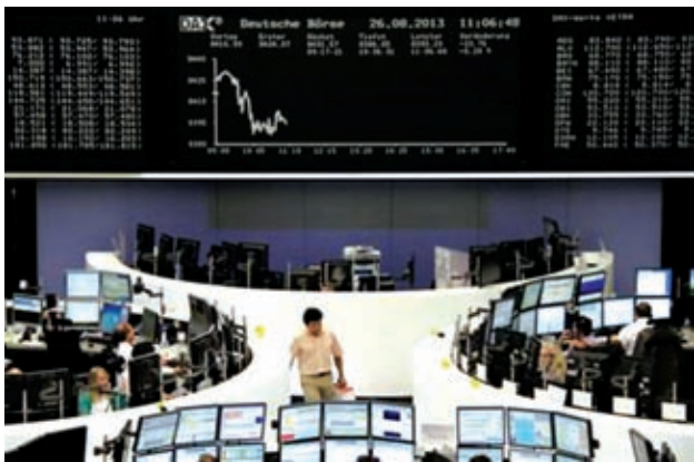
Traders are pictured at their desks in front of the DAX board at the Frankfurt stock exchange on 26 Aug, 2013.

TOKYO, 28 Aug—Jitters over a possible US-led military strike against the Syrian government knocked Asian equities to a seven-week low on Wednesday and pushed oil prices and safe-haven gold to multi-month highs. An acute 'risk-off' mode also boosted the appeal of the Japanese yen, which held near a one-week high against the dollar and euro after having posted its biggest rally in more than two months.