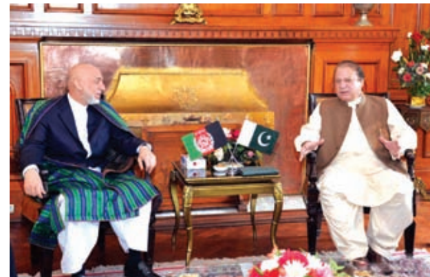
shows Pakistani Prime Minister Nawaz Sharif (R) talks with visiting Afghan President Hamid Karzai in Murree near Islamabad, Pakistan. Afghan President Hamid Karzai Tuesday wrapped up his extended visit to Pakistan, which focused on Islamabad's role in talks with the Taleban and the release of Taleban prisoners.

The Prime Minister's office said Sharif told Karzai that Pakistan and Afghanistan have to work closely to bring peace in the region.