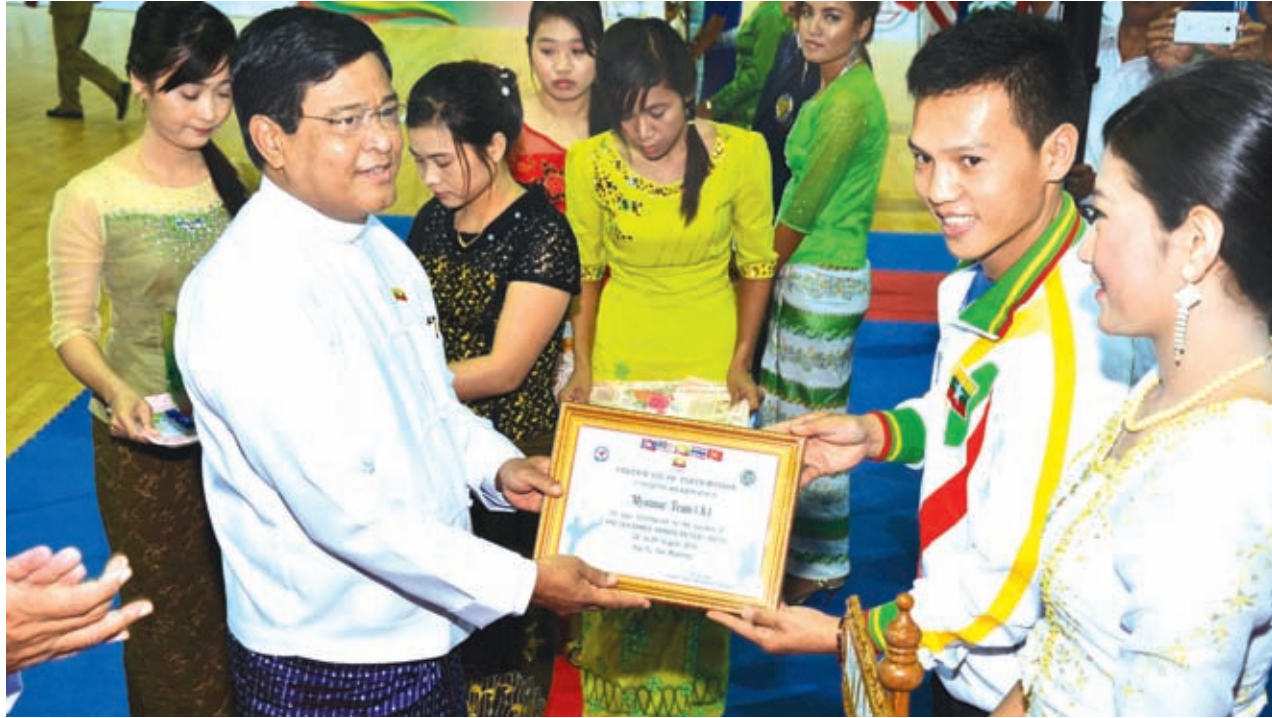
Vice-President U Nyan Tun presents certificate of honour to an athlete in Pre-SEA Games Karatedo Test Match.

NAY PYI TAW, 28 Aug—Vice-President U Nyan Tun attended the opening ceremony of Pre-SEA Games Karatedo Test Match at Nay Pyi Taw Wunna Theikdi Gymnasium (3000-A), here, this morning.