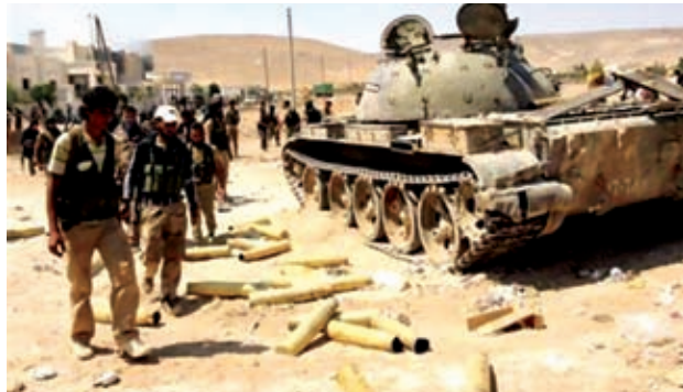
Free Syrian Army fighters inspect munitions and a tank that belonged to forces loyal to Syria's President Bashar al-Assad after they seized Aleppo's town of Khanasir on 26 Aug 2013.

"There is no doubt who is responsible for this heinous use of chemical weapons in Syria: the Syrian regime," Vice President Joe Biden said at a speech