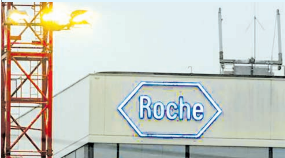
The logo of Swiss pharmaceutical company Roche is seen at the company's headquarters in Basel on 5 April, 2012.—REUTERS

Nexavar is already approved to treat liver as well as kidney cancer and it is also being tested on breast cancer patients.—Reuters