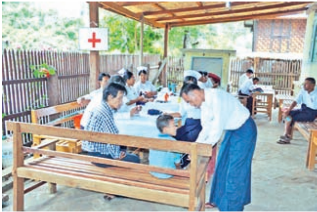
Health staff provide health care to families of fire victims in Htargon Village of Kanbalu Township.