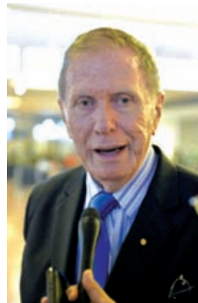
Michael Kirby of Australia, chairman of a UN commission tasked with investigating human rights violations in North Korea, speaks with reporters after arriving at Tokyo's Haneda airport on 27 Aug 2013.