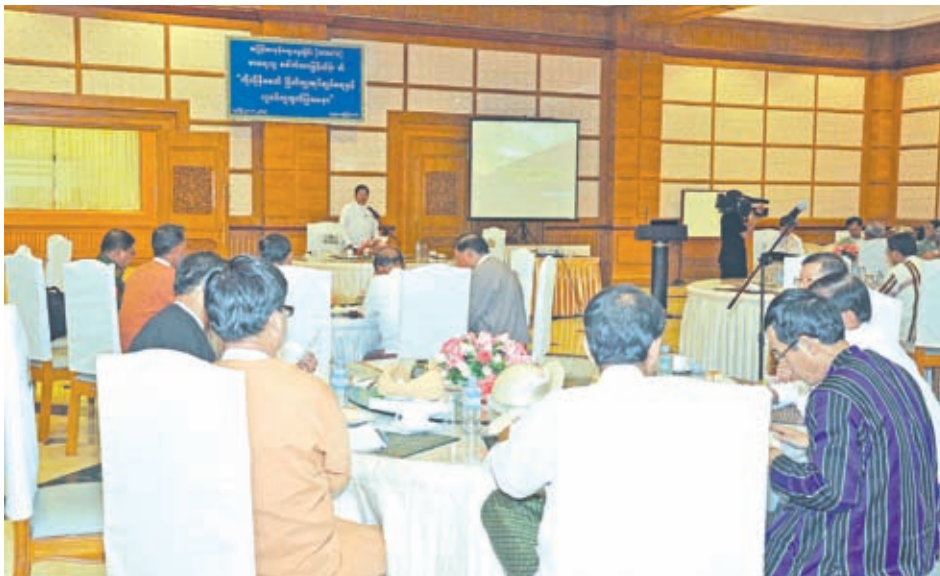
Amyotha Hluttaw Deputy Speaker U Mya Nyein delivers speech at debate on British administration and immigration in colonial era.—MNA

NAY PYI TAW, 28 Aug— Debate on "British administration and immigration in colonial era" was held at the assembly hall of Amyotha Hluttaw Building in the Hluttaw Complex, here, this afternoon.