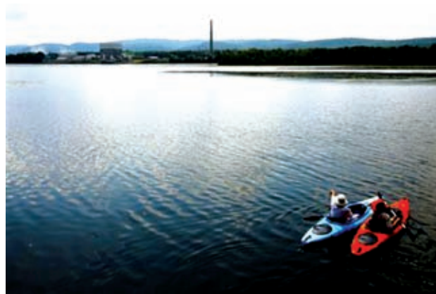
Kayakers paddle in the Connecticut River from Hinsdale, New Hampshire, in front of the Vermont Yankee nuclear power plant in Vernon, Vermont on 27 Aug, 2013.