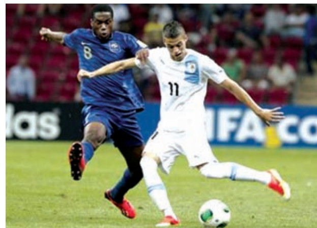
France's Geoffrey Kondogbia challenges Uruguay's Nicolas Lopez (R) during the final match of the FIFA Under-20 tournament in Istanbul, on 13 July, 2013.

Kondogbia, a versatile midfielder with excellent passing skills, joined Sevilla last year from French second division club Lens. He made an immediate impact and eventually played 31 league games.—Reuters