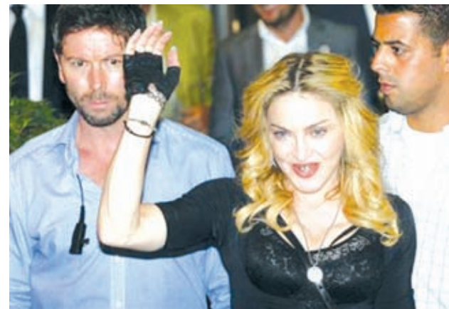
US singer Madonna waves as she leaves the new Hard Candy Fitness centre in downtown Rome on 21 Aug, 2013.

Madonna's top spot compares with her previous peak of $110 million in 2009, but falls short of the $165 million taken in by Oprah Winfrey in the previous year, Forbes said. Talk show queen and media mogul Winfrey took a big pay cut this year according to Forbes , falling to No 13 on the list with earnings of $77 million.—Reuters