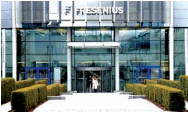
The headquarters of Fresenius is pictured in Bad Homburg near Frankfurt on 24 Feb, 2010.

FRANKFURT, 27 Aug—US regulators have issued a third warning this year for German healthcare group Fresenius to improve procedures at its sites, this time a blood bag manufacturing plant in Puerto Rico. A letter to the company from the US Food and Drug Administration (FDA) took issue