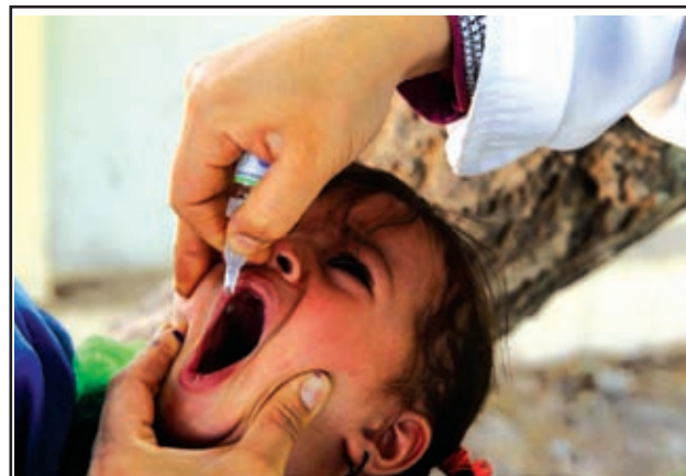
An Afghan health worker gives polio vaccine to a child in Herat Province, western Afghanistan, on 26 Aug 2013. Afghanistan launched a three-day nationwide polio vaccination in order to immunize children under five years old against polio.