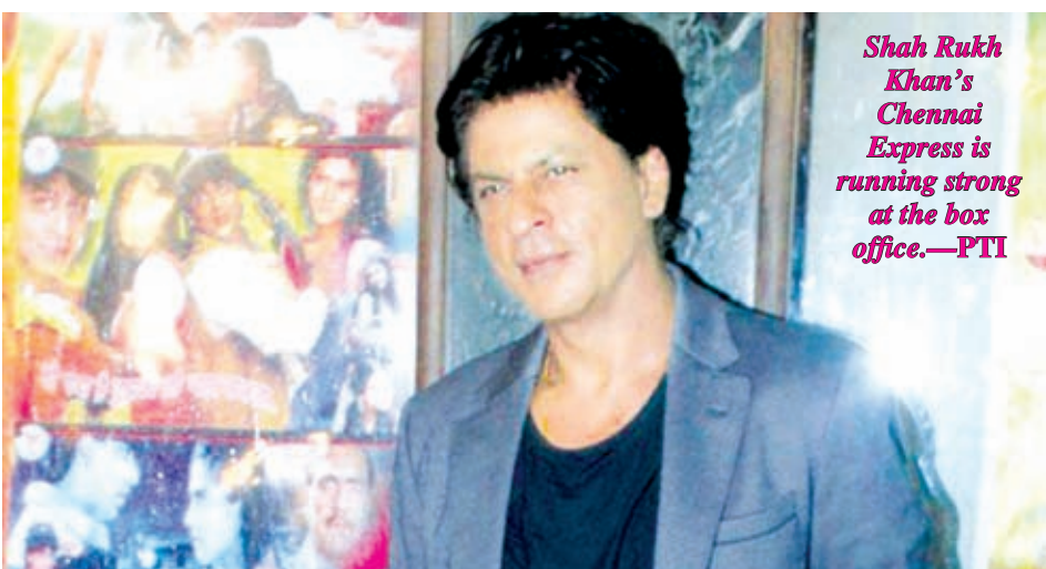
Shah Rukh Khan's Chennai Express is running strong at the box office.

"Julia's urging Taylor to stay hungry and competitive, but not let petty fights spill over into public. It's a case of Julia just trying to impart her hard-won wisdom to a kindred soul, and it's blossoming into a beautiful friendship," the source added. PTI