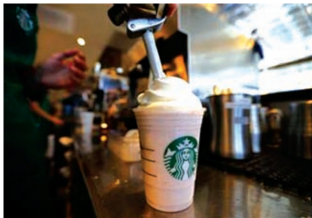
A barista puts whipped cream on a drink at a newly designed Starbucks coffee shop in Fountain Valley, California on 22 Aug, 2013.