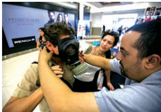
An Israeli Postal Service employee shows a man how to adjust a gas mask at a distribution point at a shopping mall in the West Bank Jewish settlement of Maale Adumim near Jerusalem on 26 Aug 2013.

With speculation mounting that NATO powers might fire cruise missiles into Syria, many in Israel worry that President Bashar al-Assad, embroiled in a 2-1/2 year uprising against his rule, could strike out at the Jewish state in retaliation.