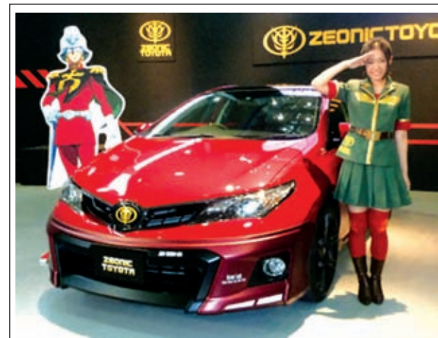
Toyota Marketing Japan Corp, a marketing unit of Toyota Motor Corp, unveils the "Auris Char's Customize" in Tokyo on 26 Aug, 2013. The special Auris model is customized with the image of Char Aznable, a character from the popular Japanese animated television series "Mobile Suit Gundam."