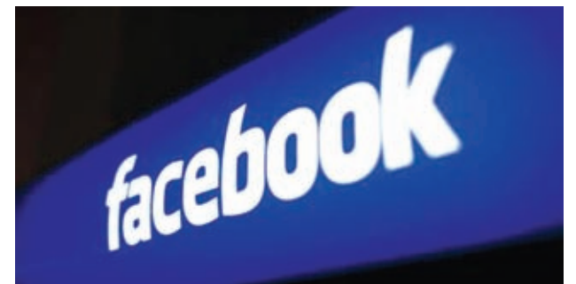
The Facebook logo is pictured at the Facebook headquarters in Menlo Park, California on 29 Jan, 2013.