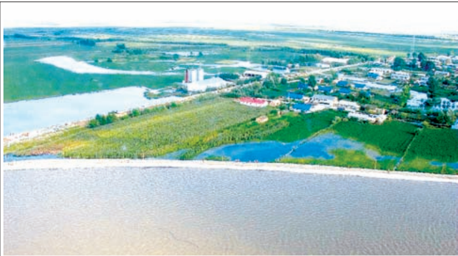
The aerial photo taken on 26 Aug, 2013 shows a protection dike built with sandbags along the Tongjiang-Fuyuan river section of the Heilong River in northeast China's Heilongjiang Province. The Heilong River has swelled since mid-August, with some sections of its middle and lower reaches seeing their worst floods in history.