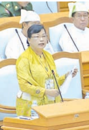
Deputy Minister for Labour, Employment and Social Security Daw Win Maw Tun.—MNA

NAY PYI TAW, 27 Aug—Daw Khin Waing Kyi of Yangon Region Constituency No 1 discussed a report submitted by Pyidaungsu Hluttaw Employee and Employer Rights Observation Joint Commission at today's session of Pyidaungsu Hluttaw, and Deputy Minister for Labour,