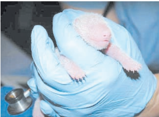
In this photo released by Smithsonian's National Zoo the giant panda cub born 5:32 pm on 23 August at the Zoo receives an exam from animal care staff in Washington DC on 25 Aug, 2013.

Meanwhile, the RIA Novosti news agency said "no injuries were reported among the passengers and crew members."— Xinhua