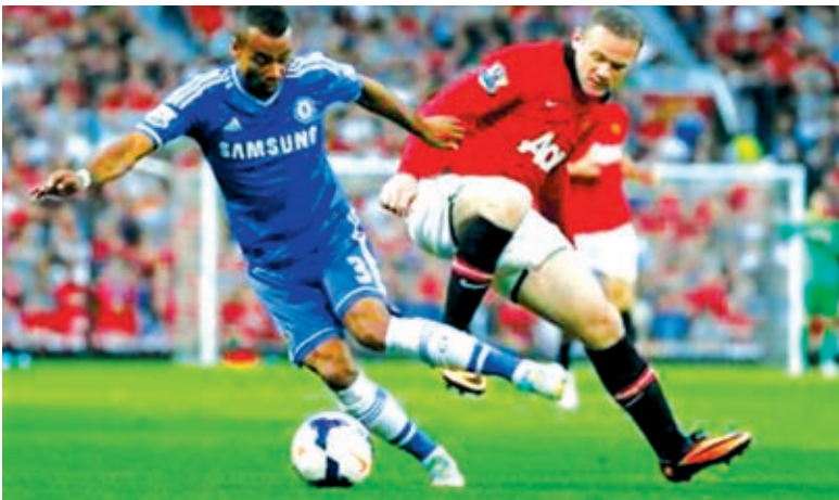
Manchester United's Wayne Rooney (R) challenges Chelsea's Ashley Cole during their English Premier League soccer match at Old Trafford, northern England on 26 Aug, 2013.