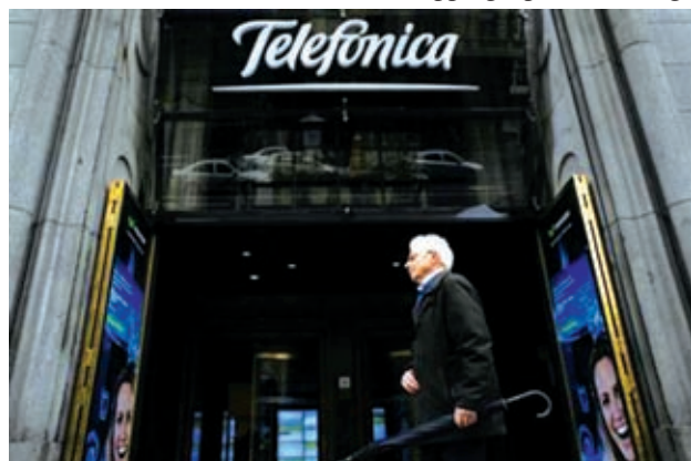
A man walks past Telefonica's building in central Madrid on 26 March, 2013.