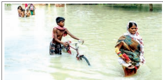
Local residents wade through flooded roads at the village of Simultala Jangipur, some 252 kilometers away from Calcutta, capital of eastern Indian state West Bengal, on 26 Aug, 2013.