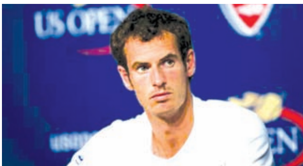
Tennis player Andy Murray of Britain speaks during a news conference after Arthur Ashe Kids' Day at the USTA Billie Jean King National Tennis Centre in New York on 24 Aug, 2013.

over the spotlight for British men when he stunned Japan's Kei Nishikori 6-4, 6-4, 6-2. Evans, ranked 179th in the world, had to come through the qualifiers just to reach the main draw and was given little hope