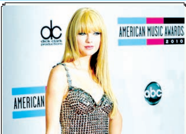
Taylor Swift featured with Julia Roberts in the film Valentine's Day.

"For media and people, it (marriage) seems like a big thing. But in real life it is not like that. There have never been any restrictions. We are surprised when people ask what is the difference after marriage, we fail to understand this as there is no difference. He is in America and we were talking about this thing... it seems surprising," she said. Though Kareena feels things are same post marriage, there is usually an added responsibility after marriage but for her, singlehood and married life is more or less the same. "Since childhood I was a responsible girl. There was responsibility of the family... First of my mother, then my sister Karisma and now Saif's responsibility. PTI