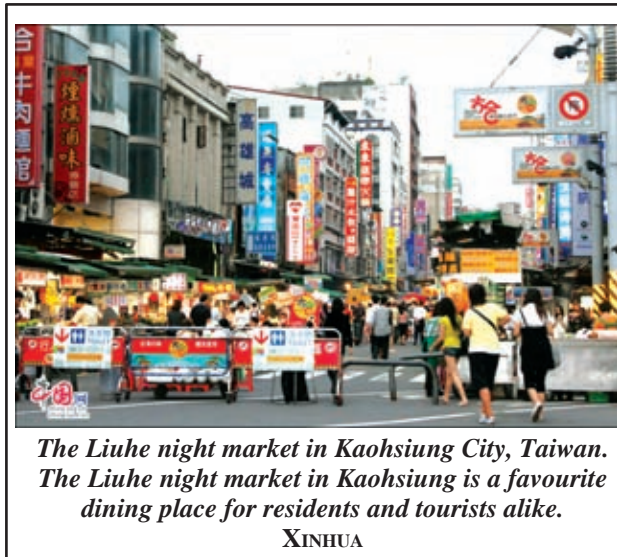
The Liuhe night market in Kaohsiung City, Taiwan. The Liuhe night market in Kaohsiung is a favourite dining place for residents and tourists alike.

"I think Assad wouldn't dare to attack us, he knows that if he did it could be the last thing he ever does," he said. Israel has provided its citizens with gear to cope with possible chemical or biological attacks since the 1991 Gulf War, when US-led troops drove Iraq out of Kuwait.—Reuters