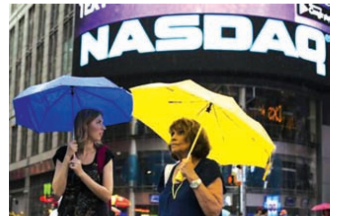
Two women hold umbrellas as they walk past the Nasdaq MarketSite in New York's Times Square, on 22 Aug, 2013.