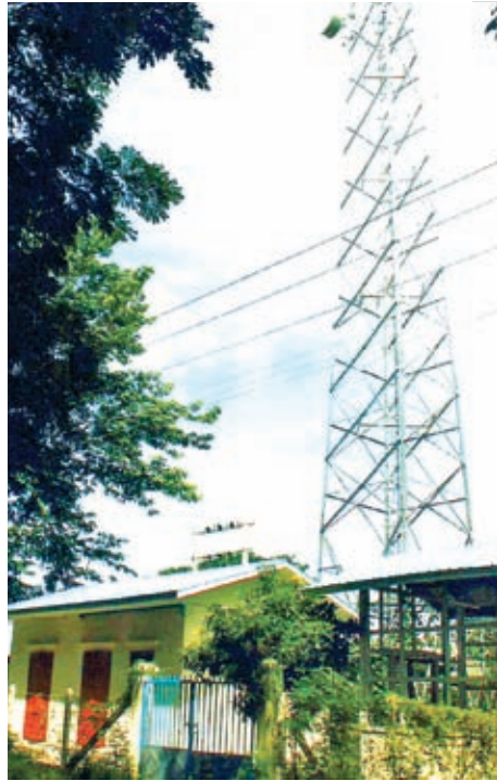
Photo shows a communication tower in Singu but it cannot serve low-priced mobile connection to telephone users efficiently.

SINGU, 27 Aug— Low-priced mobile phone connection is not working well in Singu since the start of sales of MEC CDMA-800 SIM cards.