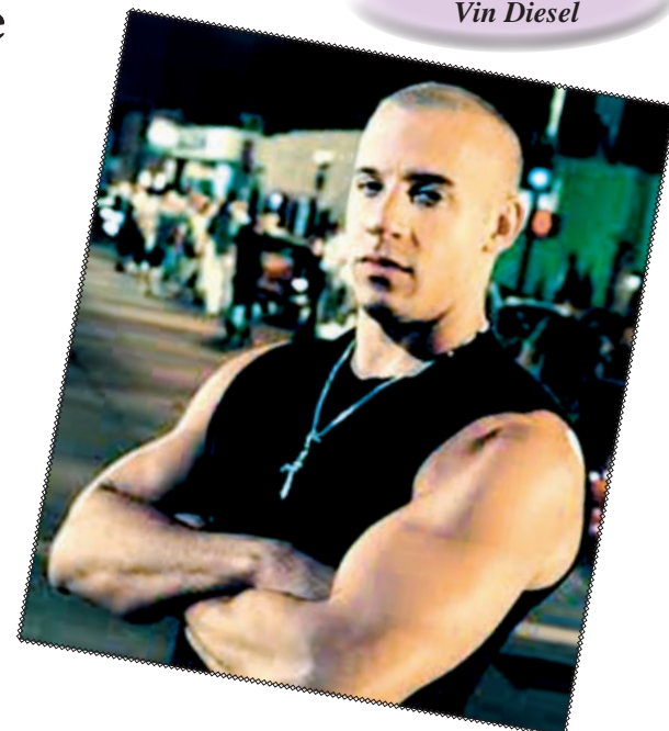
He will also reprise his role in "Fast & Furious 7" which will be released in July 2014.

LOS ANGELES, 27 Aug —US actor and filmmaker Vin Diesel, best known for starring in a couple of Hollywood blockbuster hits including "Saving Private Ryan" and "Fast & Furious" film franchise, received the 2,504th star on the Hollywood Walk of Fame on Monday in honour of more than 20 years of career.