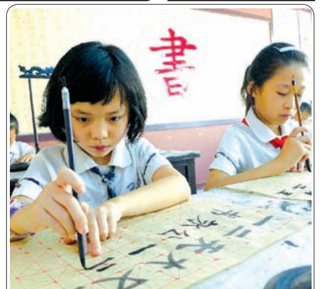
Students have a calligraphy class at the Zhuhelu Elementary School in Handan City, north China's Hebei Province, on 26 Aug, 2013. Chinese education authorities on Sunday called for providing better calligraphy education for the country's primary and middle school students, according to the Ministry of Education. Calligraphy, which was a sort of time-honored handwriting art in China, was suspended for a period of time in school classes.