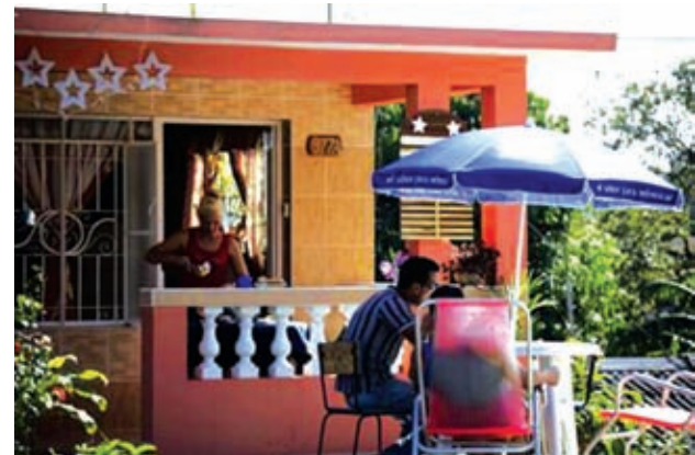
A woman (L) prepares food as customers dine outside her newly opened private-licensed family home restaurant in Havana on 11 Jan, 2011.—REUTERS

Some of the restaurants slated to become coops are off the beaten track and cater to a mainly Cuban clientele using the local peso currency. Others — for example La Casona de 17 and La Divina Pastora, both in Havana — operate in a dollar equivalent, called the convertible peso or CUC, and serve mainly tourists. The Divina Pastora, nestled under Moro Castle at the narrow entrance to the Bay of Havana, sits on some of the city's most valuable real estate, owned by the military-run Gaviota tourism corporation.—Reuters