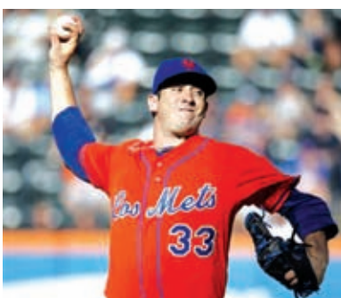
New York Mets starting pitcher Matt Harvey throws a pitch to the Detroit Tigers in the third inning of their MLB inter-league baseball game at Citi Field in New York, on 24 Aug, 2013.