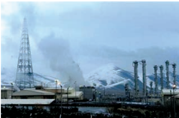
A general view of the Arak heavy-water project, 190 km (120 miles) southwest of Teheran on 15 Jan, 2011.

Moscow fears that if Kiev and the EU sign a free trade deal, the goods made in Europe will sneak into the CU territory through Ukraine thus bypassing customs control.—Xinhua