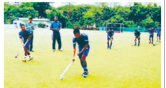
As preparations for taking part in XXVII SEA Games, Myanmar men players in training session of hockey event.

According to the plan, invitation will be extended to foreign hockey teams to the Pre-SEA Games hockey tournament at Theinbyu