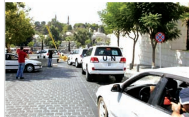
United Nations (UN) vehicles transport a team of UN chemical weapons experts to the scene of a poison gas attack outside the Syrian capital last week, in Damascus on 26 Aug, 2013.