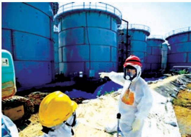
Japan's Economy, Trade and Industry Minister Toshimitsu Motegi (R), wearing a protective suit and a mask, inspects contaminated water tanks at the tsunami-crippled Fukushima Daiichi nuclear power plant in Fukushima prefecture on 26 Aug, 2013, in this photo released by Kyodo. — KYODO NEWS

FUKUSHIMA, 27 Aug—The Japanese government will step up decontamination efforts in areas hit by high levels of radiation around the crippled Fukushima nuclear plant under a revised plan to be released on Friday, Senior Vice Environment Minister Shinji