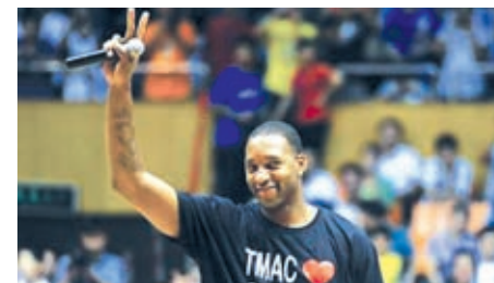
NBA basketball player Tracy McGrady of Detroit Pistons gestures to his fans at a stadium during a promotional event of his China tour in Hefei, Anhui province in this 27 Aug, 2011 file photo.