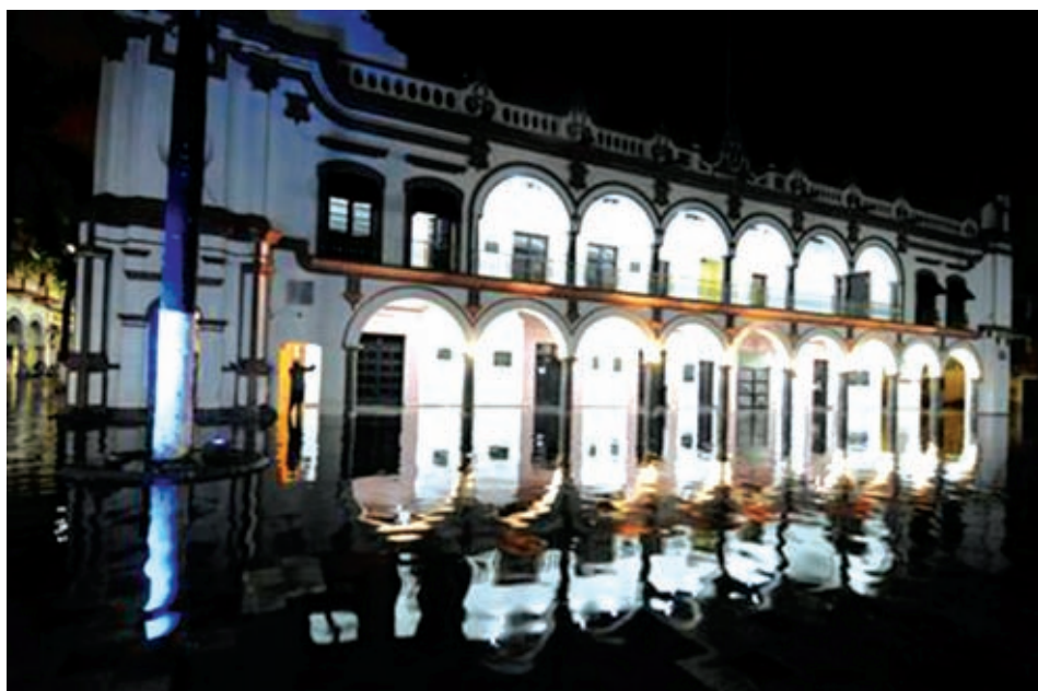
A man stands at a flooded building in Veracruz on 25 Aug 2013.

Located about 75 miles west-southwest of Tuxpan, the remains of Fernand had