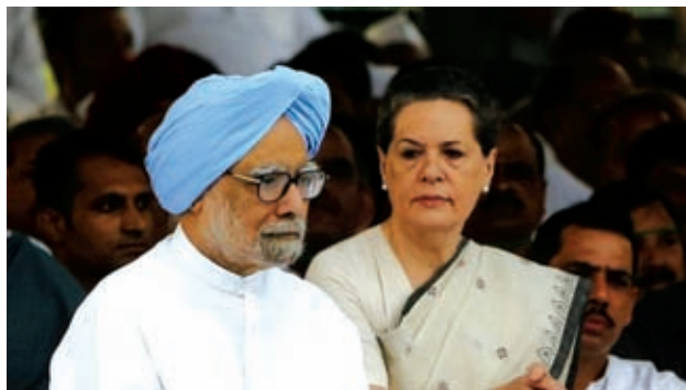
Indian Prime Minister Manmohan Singh (in blue turban) and chief of India's ruling Congress party Sonia Gandhi (R) sit after paying respect at the memorial of the former India's Prime Minister Rajiv Gandhi on the occasion of Rajiv's 68th birth anniversary in New Delhi on 20 Aug, 2013.