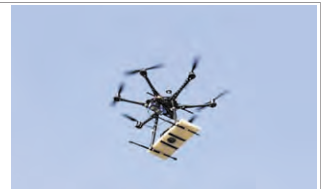
A drone flies over the archaeological site of Cerro Chepen as it takes pictures in Trujillo on 3 Aug, 2013.

Researchers are still picking up the pieces after a pyramid near Lima, believed to have been built some 5,000 years ago by a fire-revering coastal so-