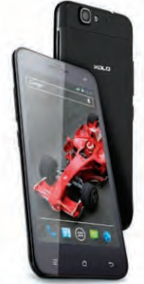
Q1000S in India at a price point of Rs. 18,999.

The Xolo Q1000S sports a 13-megapixel rear