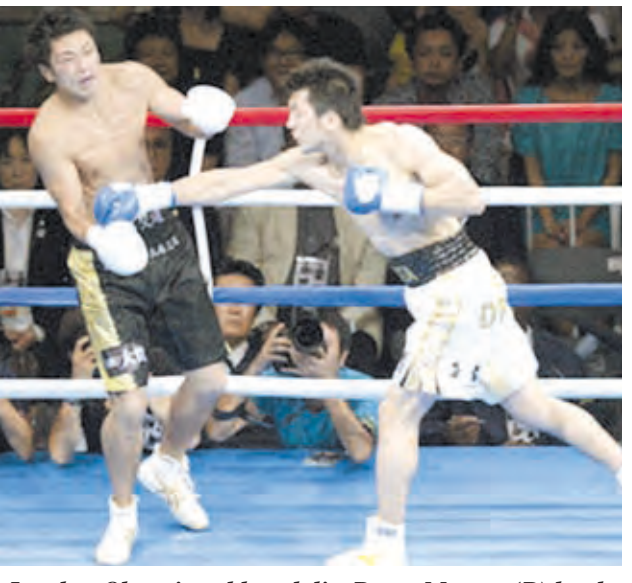
London Olympic gold medalist Ryota Murata (R) lands a blow on Akio Shibata, the Oriental and Pacific Boxing Federation middleweight champion, sending his opponent down in the first round of his pro debut nontitle match at Ariake Colloseum in Tokyo on 25 Aug, 2013.

Токуо, 26 Aug—London Olympic champion Ryota Murata scored a second-round stoppage of Akio Shibata, the Oriental and Pacific Boxing Federation mid-