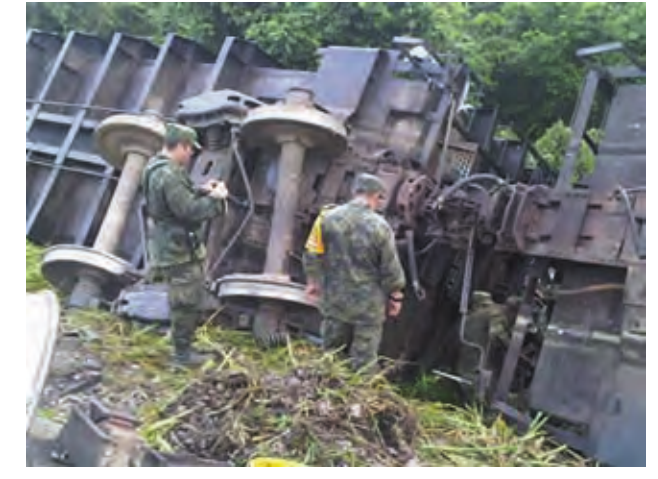
Soldiers stand near the overturned wagons of a derailed train in Huamanguillo, in this 25 August, 2013 handout

Mexico City, 26 Aug— At least six people were killed when a cargo train nicknamed "La Bestia," or "The Beast," on which would-be migrants hitch rides toward the US border, derailed in a remote area of southern Mexico on Sunday, state officials said.