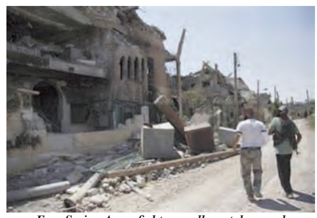
Free Syrian Army fighters walk past damaged buildings and debris in Deir al-Zor on 20 Aug, 2013.

Beirut, 26 Aug — UN weapons experts are due on Monday to inspect a site where poison gas killed many hundreds of people in Damascus suburbs, amid calls from Western capitals for military action to punish the world's worst apparent chemical weapons attack in 25 years.