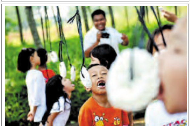
Children compete to eat crackers tied on the ropes during fun games in Tangerang, Indonesia, on 25 Aug, 2013. Children participate in the fun games every year in order to celebrate Indonesia's Independence Day.