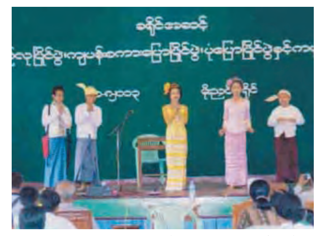
Mohnyin, 26 Aug—A hav debate under the title "Men wor

have more capacity than women in preserving Myan-