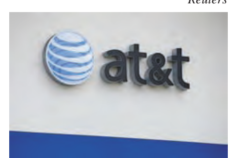
The AT&T logo is pictured by its store in Carlsbad, California, on 22 April, 2013.