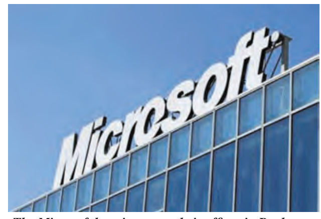
The Microsoft logo is seen at their offices in Bucharest on 20 March, 2013.

Seattle, 24 Aug— Microsoft Corp takes on Google's Motorola Mobility unit this week in the second of two landmark trials between the companies that delve into hot disputes over the patents behind smartphone and Internet techno- wireless and video techno-