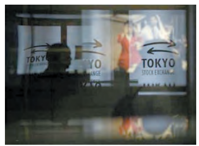
A visitor walks past logos at the Tokyo Stock Exchange in Tokyo on 13 June, 2013.

Sydney, 26 Aug— Asian stocks rose and gold hit a near three-month high on Monday, extending a move started late last week when a steep drop in US new home sales tempered expectations the Federal Reserve will soon reduce stimulus. Trading was subdued, particularly in the currency markets, as investors awaited fresh offshore leads amid a lack of market-moving economic news out of Asia. MSCI's broadest index of Asia-Pacific shares outside Japan .MI-APJ0000PUS climbed 0.7 percent, adding to Friday's 0.8 percent gain. Tokyo's Nikkei. N225 was little changed.