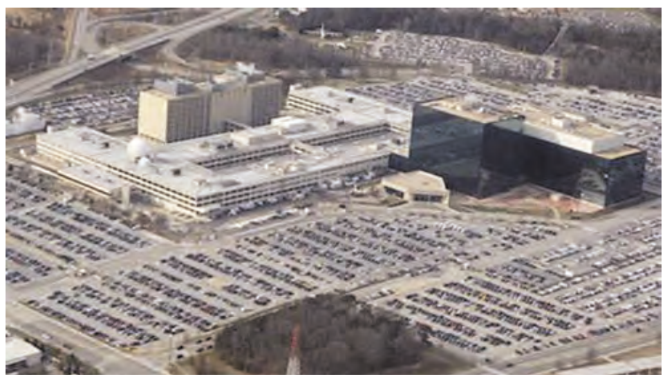
A view from helicopter of the National Security Agency at Ft Meade, Maryland, on 29 January, 2010.

Washington, 26 Aug There was a time when the US National Security Agency was so secretive that government officials dared not speak its name in public. NSA, the joke went, stood for "No Such Agency."