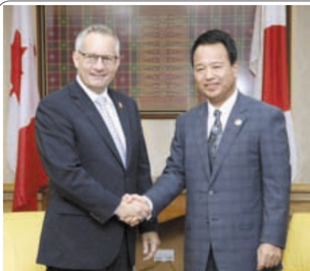
Canadian Minister of International Trade Ed Fast (L) and Akira Amari, the Japanese minister in charge of Trans-Pacific Partnership free trade negotiations, shake hands in Bandar Seri Begawan, Brunei, on 23 Aug, 2013, the second day of the 19th round of negotiations for creating a regional free trade pact by 12 Pacific Rim countries.