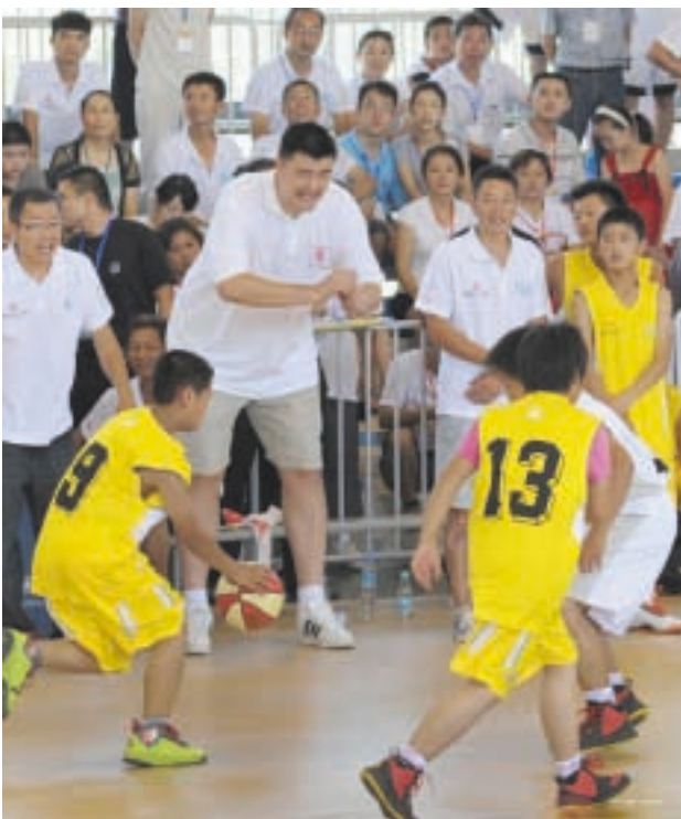
Former NBA player Yao Ming (2nd L, back) cheers for little players during a basketball match of the eastern division of the Yao Foundation Hope Primary School Basketball Season, in Lu'an City, east China's Anhui Province, on 15 Aug, 2013.

Initiated by the Yao Foundation and the China Youth Development Foundation last year, the event reached 79 hope schools (37 more than last year) over a two-month stretch, during which college volunteers instructed children in basketball skills and sports facilities were donated. As the finale of the season's eastern conference, a six-day training camp and exhibition game were held