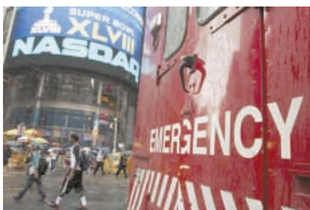
An emergency vehicle drives past the Nasdaq MarketSite in New York's Times Square, on 22 Aug, 2013.