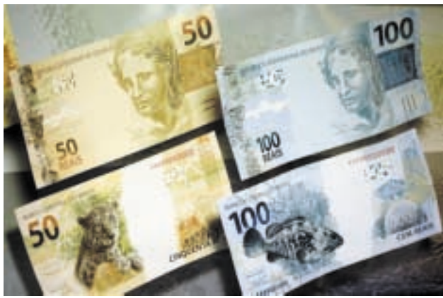
A banner with the new Brazilian real currency notes is seen during a presentation ceremony in Brasilia on 3 Feb, 2010.

The bank said in a statement it will sell, on Mondays through Thursdays, $500 million worth of currency swaps, derivative contracts designed to provide investors with insurance against a weaker real. On Fridays, it will offer $1 billion on the spot market through repurchase agreements. Both are designed to prevent companies and individuals with dollar obligations from scrambling to the market at the same time, afraid that waiting will force them to pay more to buy dollars. When that