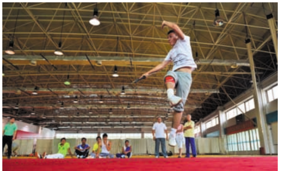
A student from the Blue Dragon Martial Arts School in Munich performs one-handed sword skills in Tianjin, North China, on 21 Aug, 2013.