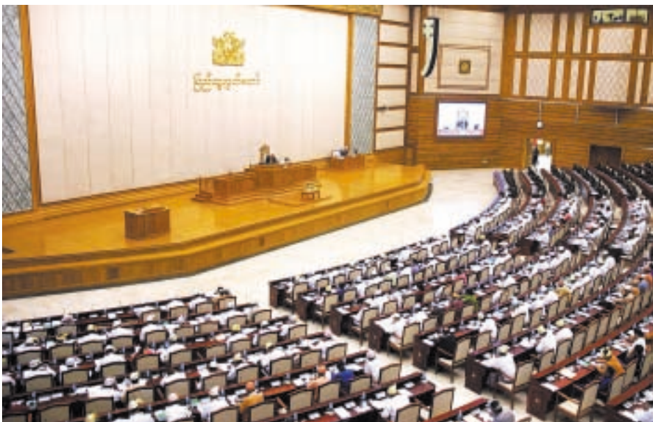
25 th day session of Pyithu Hluttaw in progress.