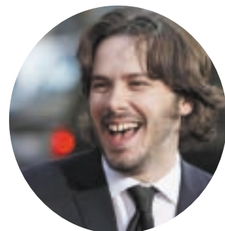
Writer, director and producer Edgar Wright arrives at the premiere of his movie "Scott Pilgrim vs. the World" at the Grauman's Chinese theatre in Hollywood, California, on 27 July, 2010 file photo.

Wright's film follows washed-up alcoholic Gary King, who reunites with his high school friends in his hometown to complete what they were not able to as teenagers: the ultimate