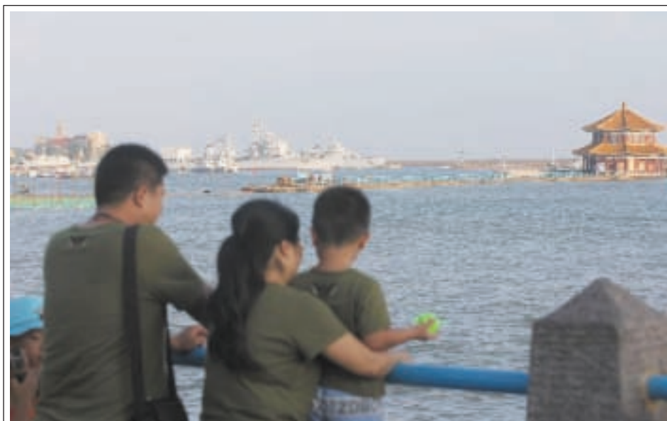
Photo taken on 22 Aug, 2013 shows the Zhanqiao Bridge being under repair in Qingdao City, east China's Shandong Province. A renovation work has been started to repair the Zhanqiao Bridge, a landmark for Qingdao, since part of the bridge was hit and destroyed by thunderstorms and waves on 27 May. The renovation work is expected to be finished by October this year.

In July, Santos told Colombians that they had nothing to worry about, because "we have carefully prepared to face any new lawsuit or action that Nicaragua may prepare in its expansionist spirit."—Xinhua