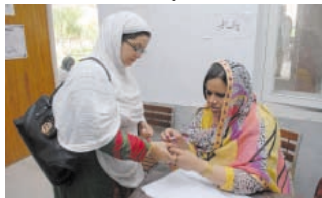
A Pakistani polling officer marks a voter's thumb before casting vote at a polling station in northwest Pakistan's Peshawar, on 22 Aug, 2013.

The by-election results will not affect the government in the centre and four provinces because of sound position.—Xinhua