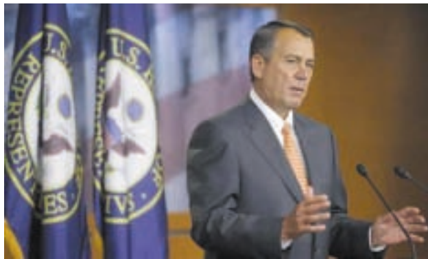
House Speaker John Boehner holds a news conference at the US Capitol in Washington on 21 March, 2013.