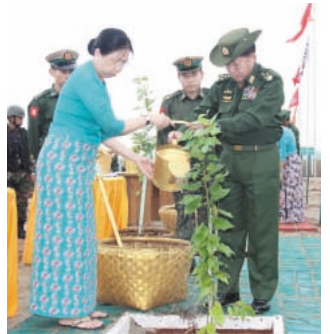
Commander-in-Chief of Defence Services Senior General Min Aung Hlaing and wife plant Cherry saplings.