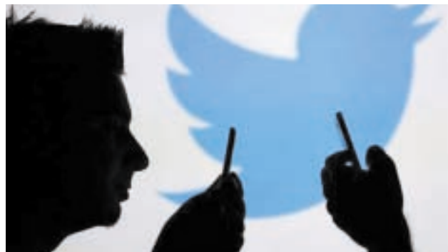
Men are silhouetted against a video screen with a Twitter logo as he poses with a Samsung S4 smartphone in this photo illustration taken in the central Bosnian town of Zenica, on 14 Aug, 2013.