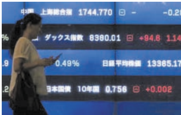
A woman walks past a screen showing market indices in Tokyo on 22 Aug, 2013.