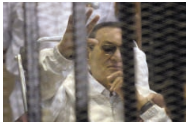
The file photo taken on 13 April, 2013 shows the former Egyptian President Hosni Mubarak at the trial in Cairo, Egypt.

In light of the state of emergency, interim Prime Minister Hazem al-Beblawi, the deputy military ruler, ordered to place Mubarak under home arrest. According to official news agency MENA, Mubarak chose to spend his period of home arrest in Maadi hospital, which is located in Maadi district in Cairo.