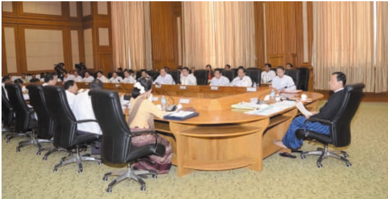
Pyithu Hluttaw Speaker Thura U Shwe Mann attends coordination meeting between committees and commission.

NAY PYI TAW, 23 Aug—Pyithu Hluttaw Speaker Thura U Shwe Mann attended a work coordination meeting between the committees and commission at Zabuthiri hall of the Hluttaw building, here, this morning.