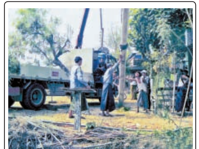
NEW LAMP POST INSTALLED: Township electrical engineers and staff of the Electrical Department replaced the old wooden lamp post with the new concrete lamp post in Zeyawaddy in Pyu Township in Toungoo District in Bago Region on 18 August.