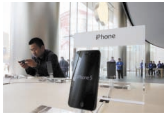
A visitor tries out an iPhone at an Apple store in Beijing on 2 April, 2013.

View of the interior of the Tesla Model S at the North American International Auto Show in Detroit, Michigan on 15 Jan, 2013.