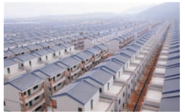
A general view of newly built houses at Dadun village of Lingshui ethnic Li Autonomous County, Hainan province, in this 18 Jan, 2013 file photo.—REUTERS

"This excessive supply will put a serious drag on national construction growth for several years." House prices have fallen for nearly two years in Wenzhou, a prosperous eastern city that had suffered fevered speculation before stringent controls on the property market took hold. In July prices in Wenzhou were down by an annual 2.4 percent in July.—Reuters