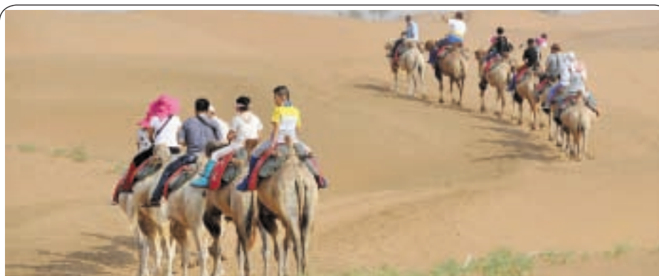
Tourists ride camels on the desert of Shapotou scenery spot in Zhongwei, northwest China's Ningxia Hui Autonomous Region, on 21 Aug, 2013. Despite the heat wave, many tourists were attracted to Zhongwei to view the unique desert scenery.—XINHUA

Pham Minh Huan, Vice Minister of Labor, Invalids and Social Affairs, stressed that in the 2020-2050 period, the rate of aging for Vietnam's population would expect to be among the fastest in Asia. ILO projects are critical for the ministry to have the ground for future development plan of the social insurance and retirement