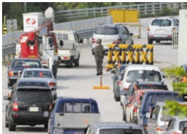
Photo taken at the inter-Korean transit office in northern South Korea on 22 Aug, 2013, shows vehicles carrying representatives of South Korean companies heading for a joint industrial zone in the North's border town of Kaesong.