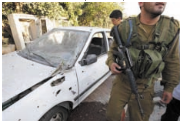
An Israeli soldier walks past a car damaged by a barrage of Lebanese rockets fired at Israel, in Kibbutz Gesher HaZiv, near the northern city of Nahariya on 22 August, 2013.

Four rockets fired on Thursday caused dam-