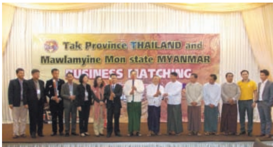
Myanmar and Thai entrepreneurs seen at the discussion.

MAWLAMYINE, 23 Aug—A ceremony to hold market festival and meet Mon State entrepreneurs and Thai entrepreneurs of Tak Province in Thailand for trade promotion between the two countries was held at Strand Hotel on Strand Road in Mawlamyine on 20 August afternoon.