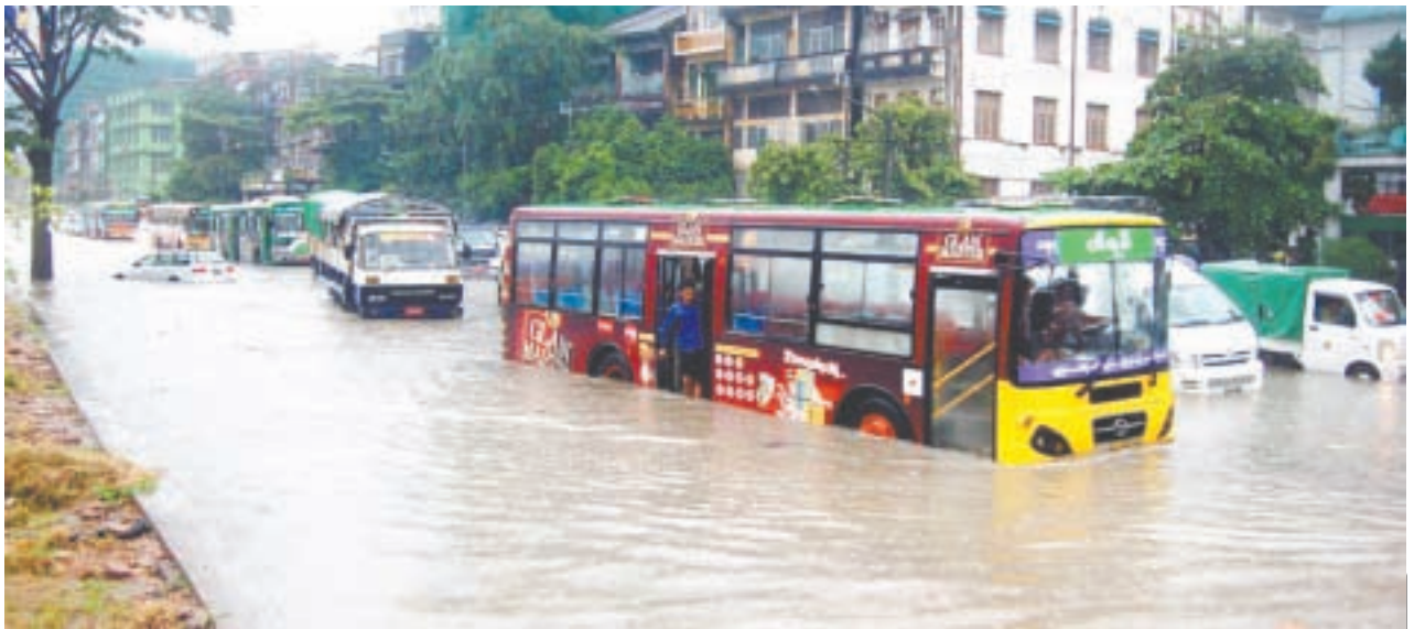
Photo shows inundation along Strand Road in Latha Township on 22 August due to heavy rain.

assistance to Myanmar under the Knowledge Sharing Program (KSP) 2013 with the help of Ministry of Strategy and Finance from ROK and Korean Development Institute (KDI), research programmes, human resource development courses and signing of MoU for KSP cooperation between NPED and KDI. MNA