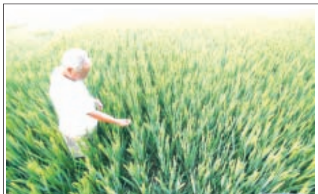
A farmer checks crops at a paddy field in Tancheng County of Linyi City, east China's Shandong Province, on 21 Aug, 2013.

Meanwhile, around 6,000 youths who passed the Korean language test have not been able to go to South Korea for the employment due to different reasons.—Xinhua