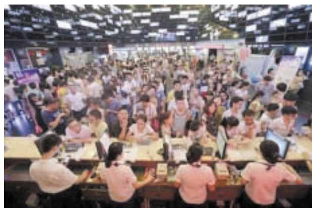
People wait for tickets at a ticket office of a movie theatre in Wuhan, Hubei Province, on 13 Aug, 2013.