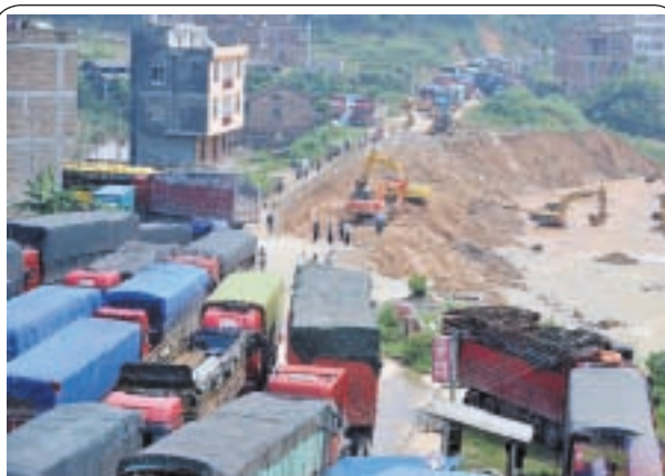
Vehicles are stranded on the damaged Wuping Highway linking Wuxuan and Pingnan counties in south China's Guangxi Zhuang Autonomous Region, on 22 Aug, 2013. Landslides and road accidents has disrupted the traffic since on 17 Aug, leaving 68 vehicles and over 130 people still trapped now on the highway.—XINHUA