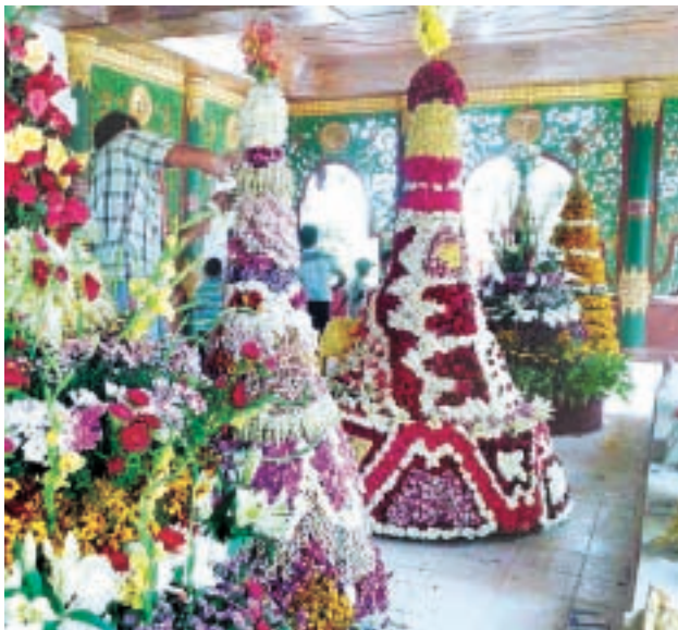
Pagodas created with various kinds of flowers in Pujaniya in Toungoo.