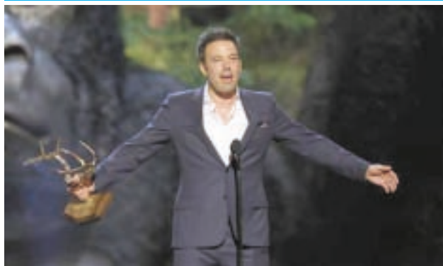
Actor and director Ben Affleck accepts the Guy of the Year award at the seventh annual Spike TV's "Guys Choice" awards in Culver City, California in this on 8 June, 2013, file photo.