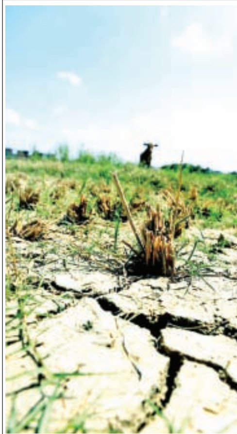
Photo taken on 21 Aug, 2013 shows the dried-up rice fields at Laowu Village of Duchang County, east China's Jiangxi Province. Continuous hot, dry weather has led to a lingering drought in the province.

Boko Haram, based in northeastern Nigeria, seeks to enshrine the Islamic sharia law in the Constitution, declaring war against Western education. Amid increasing casualties including women and children, President Goodluck Jonathan tried but failed to reach a ceasefire with the sect in April.