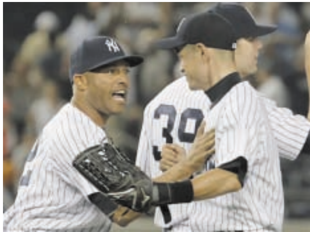
New York Yankees relief pitcher Mariano Rivera (L) congratulates right fielder Ichiro Suzuki after they beat the Toronto Blue Jays in their MLB American League baseball game at Yankee Stadium in New York, 21 August, 2013.

Aug 23 — While the New York Yankees were playing the finale in a four-game homestand against the Toronto Blue Jays on Thursday, the entire team was still savoring the memory of Ichiro Suzuki's 4,000-hit milestone the previous night.