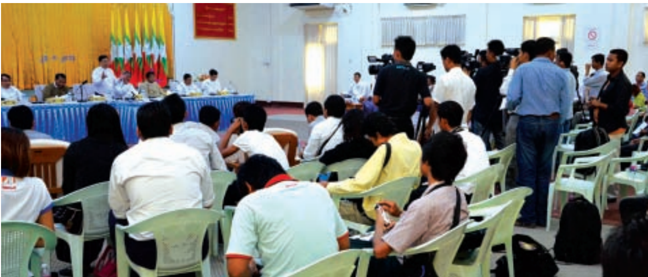
Union Minister at President Office U Soe Thane and Union Ministers meet media persons.—MNA

NAY PYI TAW, 23 Aug—A meeting between Union ministers and deputy ministers and media was held at the meeting hall of Ministry of Industry here this morning.