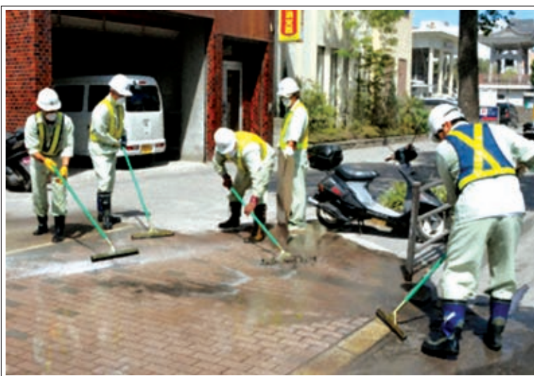
Workers clean up ash from the Sakurajima volcano on streets in Kagoshima City in Kagoshima Prefecture on 19 Aug, 2013, the day after 1,117-metre volcano had a major eruption.

He said he has always wanted good relations with India and people supported his contention during recent elections. He said both countries should realize that instead of wasting their energies and resources on wars, they should wage war against poverty, ignorance and disease. He said the nation is fully prepared to defend the motherland along with its valiant armed forces.—Xinhua