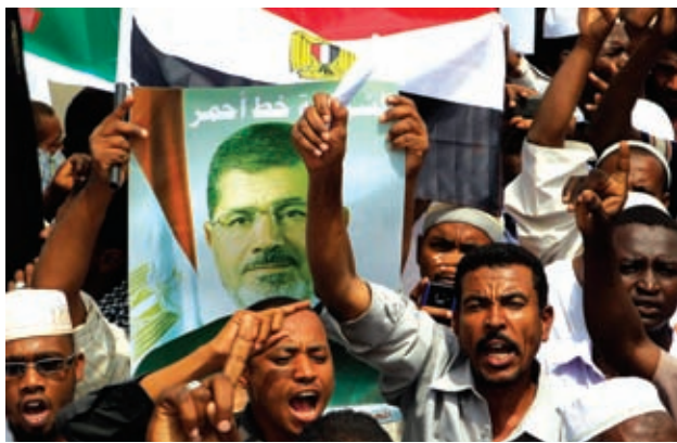
Sudanese and Egyptian Islamist supporters of deposed Egyptian President Mohamed Mursi shout slogans during a rally after taking part in Jumma prayers (Friday prayers) to protest against the recent violence in Egypt, in Khartoum on 16 August, 2013.

"Carrying out the decisions of the public prosecutor to arrest and bring forward the 'general guide' of the Muslim Brotherhood, Mohamed Badie, and through collected information and observation of movements, it was possible for the criminal search apparatus under the direction