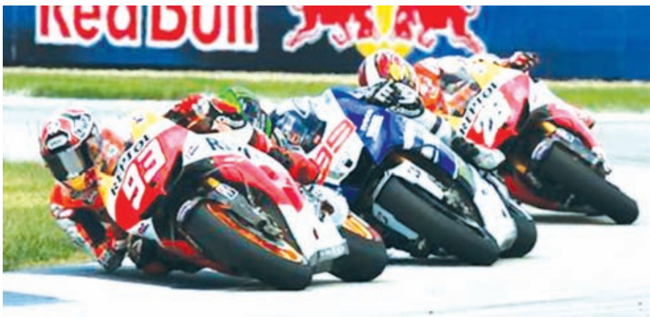
Honda MotoGP rider Marc Marquez (93) leads Yamaha rider Jorge Lorenzo (99) and Honda rider Dani Pedrosa, all of Spain, during the Indianapolis Grand Prix in Indianapolis on 18 Aug, 2013.