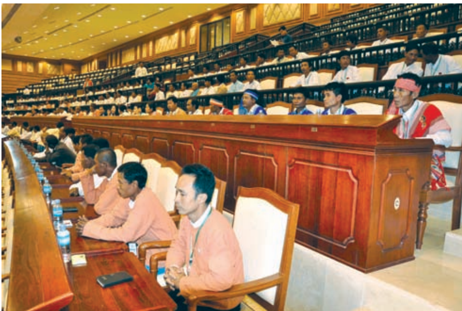
24 th day session of Pyithu Hluttaw in progress.