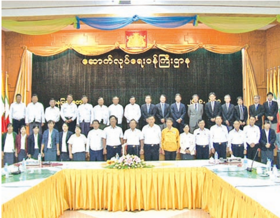
Technical presentation seminar on steel bridges in progress.—MNA