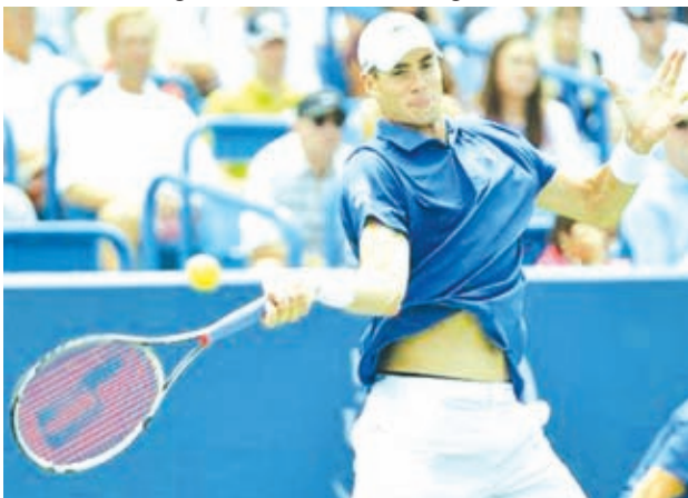
John Isner of the US hits a return ball to Rafael Nadal of Spain during their championship match at the Men's Cincinnati Open tennis tournament in Cincinnati, Ohio on 18 Aug, 2013.

CINCINNATI, 20 Aug—Long before Andy Roddick retired at the US Open last year American tennis had been searching for some-