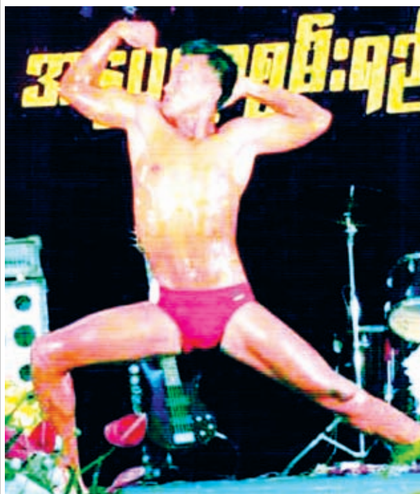
Mr Dawei University and Miss Dawei University contests were held at the convocation hall of the university on 17 August. A body-builder shows off his muscles in best posture in the contest.