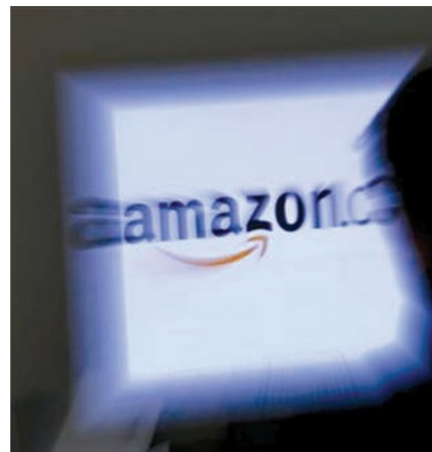
A zoomed illustration image of a man looking at a computer monitor showing the logo of Amazon is seen in Vienna on 26 Nov, 2012.