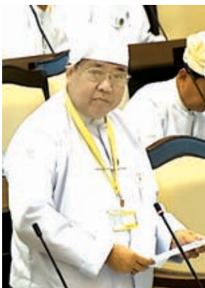
Deputy Minister for Industry U Myo Aung.

With respect to the question of MP Dr Aye Maung of Rakhine State