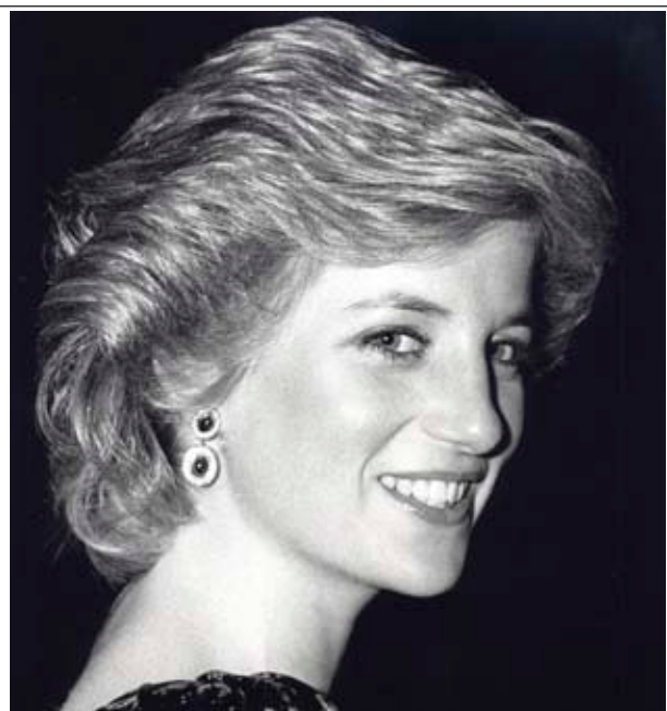
Britain's Princess Diana attends a gala performance in London in this 16 December, 1985 file photo. British police said on 17 August, 2013 they were assessing new information about the deaths of Diana and her friend Dodi al Fayed in a Paris road crash in 1997.