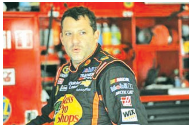
Three-time NASCAR Sprint Cup Series Champion Tony Stewart.