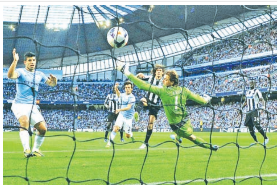
Manchester City's David Silva, centre right, scores past Newcastle's goalkeeper Tim Krul, right, during their English Premier League soccer match at The Etihad Stadium, Manchester, England, on 19 Aug, 2013. Manchester City win 4-0.