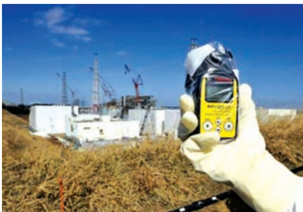
A radiation monitor indicates 131.00 microsieverts per hour near the No 4 and No 3 buildings at the tsunami-crippled Tokyo Electric Power Co.

TOKYO, 20 Aug—The operator of Japan's crippled Fukushima nuclear plant said on Tuesday it believes about 300 tons of highly contaminated water has leaked from a storage tank designed to hold overflows from the site.