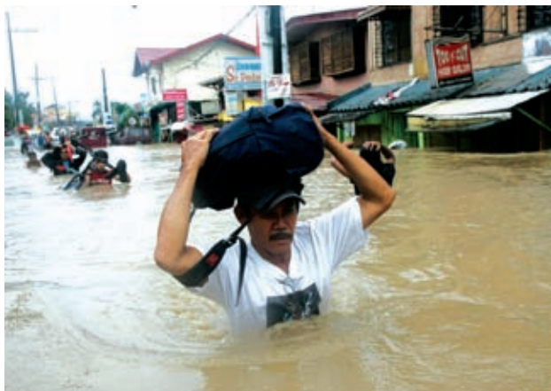
Residents wade through floodwater brought by monsoon rain, intensified by tropical storm Trami, in Kawit town of Cavite city, south of Manila on 19 Aug 2013. Heavy rain in the Philippine capital forced the closure of government offices, schools, banks and most private companies on Monday, and residents in parts of the city and nearby provinces had to flee from their homes because of floods. At least three people were killed and two were missing in accidents caused by the rain and flooding, disaster and government officials said.