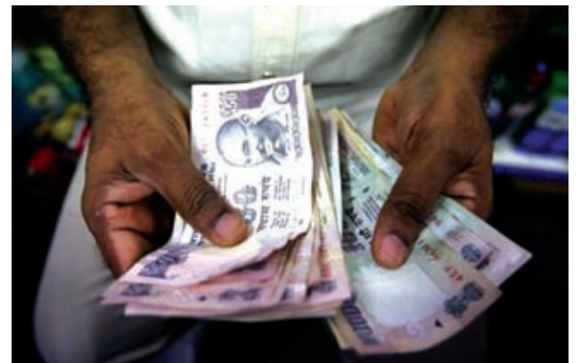
A private money trader counts Indian Rupee currency notes at a shop in Mumbai on 1 Aug, 2013.

The rupee fits that bill, as do the Indonesian rupiah, the South African rand and the Brazilian real. The rupiah plunged to four-year troughs on Monday while the rand lost another 1 percent to bring year-to-date losses to almost 17 percent against the dollar. Brazil's real extended last week's fall of more than 5 percent to trade at its weakest level since March 2009 even as the central bank sold nearly $3 billion worth of currency swaps, which are derivatives that mimic an injection of dollars in the futures market. Like the rupee, it has been hammered by doubts over the efficacy of policy actions to stem the rout. The rupee and the real,