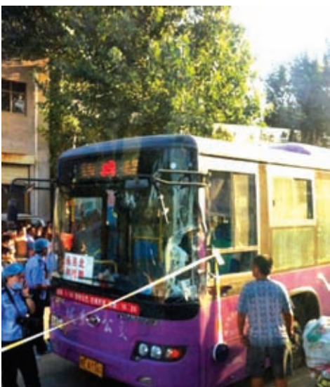
Photo taken with a mobile phone shows a bus which is cordoned off after a robbery incident happened in Anyang City, central China's Henan Province, on 19 Aug, 2013.