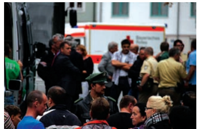
People gather near the scene of a hostage taking in Ingolstadt, Germany, on 19 Aug 2013. The remaining two hostages were freed in the town hall of the southern German city of Ingolstadt as police raided the building after hours of standoff on Monday.

German Chancellor Angela Merkel was scheduled to visit the Bavarian city for an election rally at 17:00 (1500 GMT). The plan was cancelled due to the incident, announced her CDU and its sister party CSU in the southern German state. —Xinhua