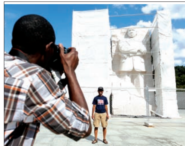
A visitor poses for a photo in front of the Martin Luther King, Jr. Memorial in Washington on 16 August, 2013. The monument is on track to be fixed by on 28 August in time for the 50th anniversary of the March on Washington for Jobs and Freedom. Workers have been removing a disputed inscription from the side of the monument.