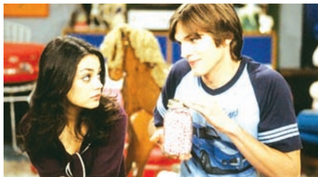
Ashton Kutcher has known Mila Kunis for the past 16 years.

"They plan to get engaged soon. Being with