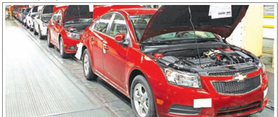
Fully assembled Chevrolet Cruze cars reach the end of the assembly line at the General Motors Cruze assembly plant in Lordstown, Ohio in this file photo from 22 July, 2011. General Motors Co will recall 292,879 Chevrolet Cruze cars in the United States due to a defect that can cause loss of the brake assist function in models with the 1.4-liter turbocharged engine and six-speed automatic transmission, it announced on 16 Aug, 2013. The recall affects 2011 and 2012 models.

The two sides vowed to step up efforts to further promote trade and investment in order to achieve the bilateral trade target of 100 billion U.S. dollars by 2015 set by the leaders of the two countries, prompting an early convening of the 3rd Meeting of the Joint Commission on Trade, Investment and Economic Cooperation. They also pledged to fully implement the MoU on Agricultural Trade Cooperation and expand trade in agricultural products. They shared the view that RMB should play a greater role in the business transactions between China and Thailand.—Xinhua