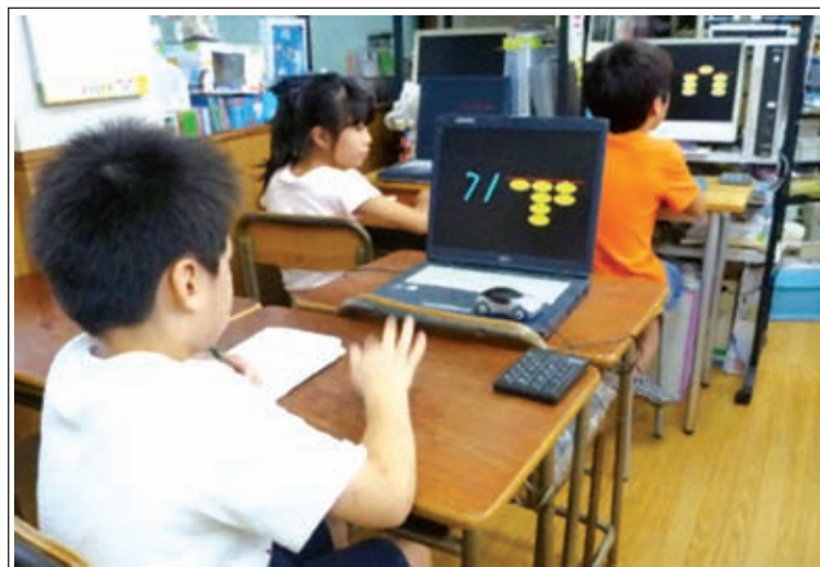
Photo taken on 21 June, 2013 shows children practicing "anzan" or "blind calculation" while watching computer screens which show numbers and a scaled-down abacus at a soroban class in Tokyo's Nerima Ward.