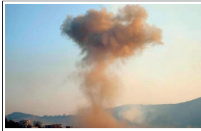
Smoke rises after what activists said was an air raid by forces loyal to Syria's President Bashar al-Assad in Salma town, Latakia governorate on 16 Aug, 2013.