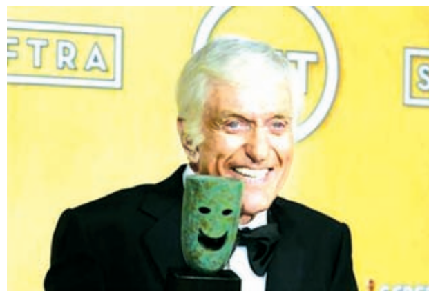
Actor Dick Van Dyke Life holds his award backstage after receiving the life achievement award at the 19th annual Screen Actors Guild Awards in Los Angeles, California on 27 Jan, 2013.

ing wheel of a Jaguar that was reported to be on fire on the shoulder of the Ventura Freeway.