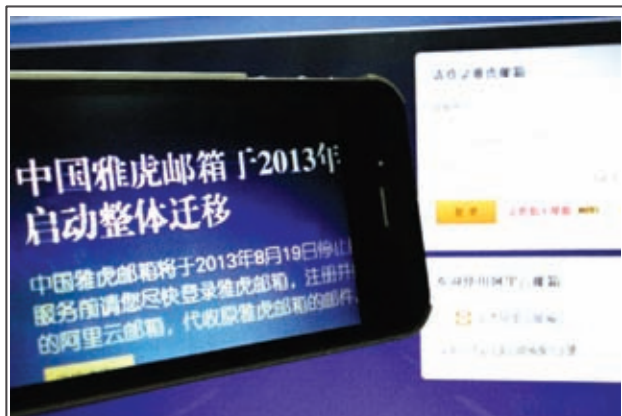
Photo taken on 19 Aug, 2013 shows an announcement on the email web pages of Yahoo China. Yahoo China said in the announcement that it decided to shut down its email service on 19 August.