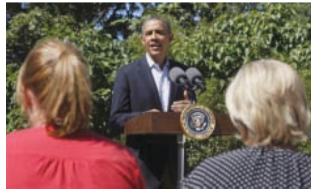
US President Barack Obama makes a statement about the violence in Egypt while at his rental vacation home on the Massachusetts island of Martha's Vineyard in Chilmark on 15 Aug, 2013.

Former US officials said Obama's decision reflected his balancing act since the army ousted Egypt's first freely elected president, an action the United States appeared to tacitly condone by its deci-