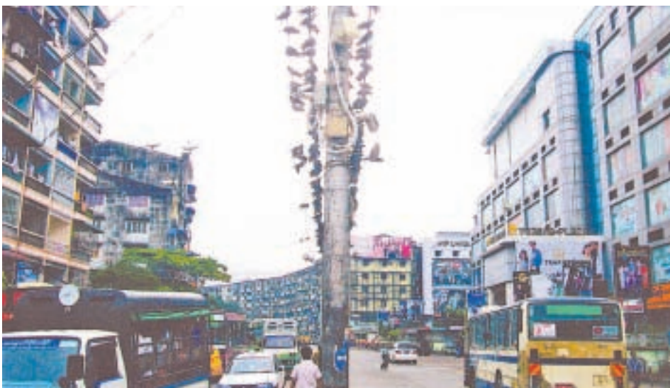
CCTV installed at the post in centre of the road to check the vehicles that break traffic rules.