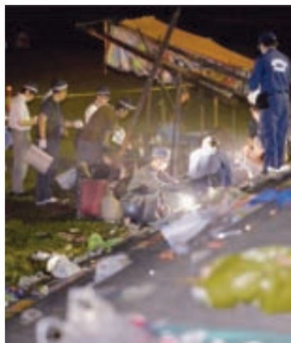
Investigators examine past midnight of 15 Aug, 2013, a site where an explosion occurred that evening at a row of stalls at a summer firework festival in Fukuchiyama, Kyoto Prefecture. Fifty-nine people were taken to hospital.

The firefighters said flames of fire and billows of smoke were seen and three stalls caught fire and were knocked down. They were among the around 350 stalls selling foods and