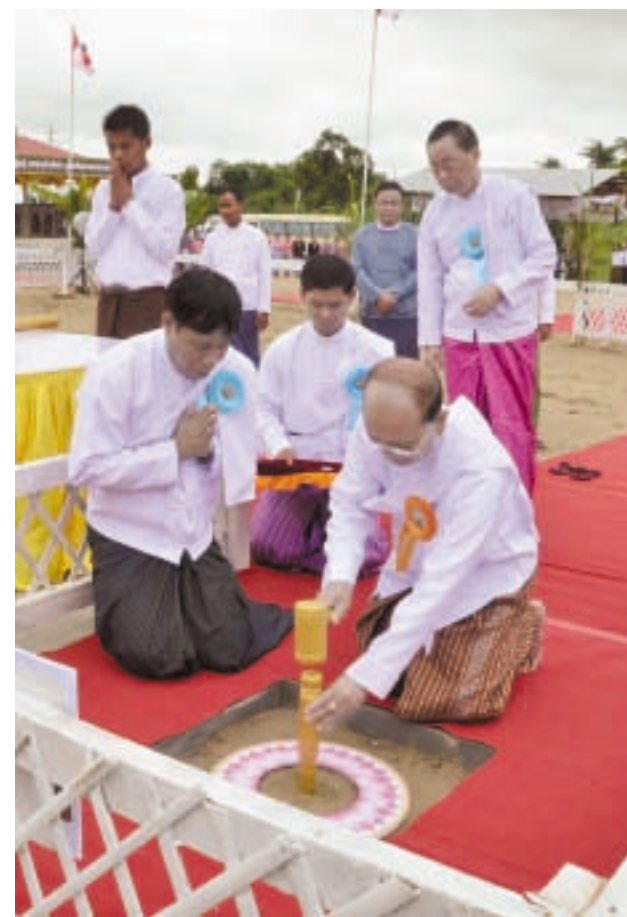
President U Thein Sein drives a stake at Bodh Gaya replica Thatta Thattaha Maha Bo Tree Pagoda.