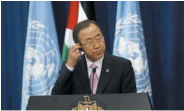
UN Secretary-General Ban Ki-moon holds a joint news conference with Palestinian President Mahmoud Abbas in the West Bank city of Ramallah on 15 Aug, 2013.