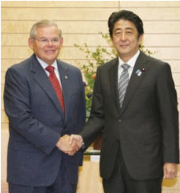
Robert Menendez (L), chairman of the US Senate Foreign Relations Committee, and Japanese Prime Minister Shinzo Abe shake hands at the prime minister's office in Tokyo on 15 Aug, 2013.

Western sanctions imposed over Iran's disputed nuclear programme have halved Teheran's oil exports since 2011, and its ageing oilfields need crucial maintenance.—Reuters