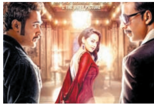
Once Upon Ay Time In Mumbai Dobaara! features Sonakshi Sinha, Akshay Kumar and Imran Khan.