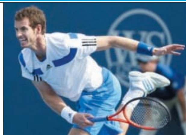
Andy Murray of Britain serves to Julien Benneteau of France at the Men's Cincinnati Open tennis tournament in Cincinnati, Ohio on 15 Aug, 2013.

"I played four times (in the finals, so it's been one of the tournaments where I've performed well actually in the last five, six years," said Djokovic. "Never managed to take final step and hopefully this year I can do so." I have an extra motivation and an opportunity to make history in this tournament, so I'm very inspired to play well day after day." World number two Murray was no less ruthless, the Wimbledon champion looking right