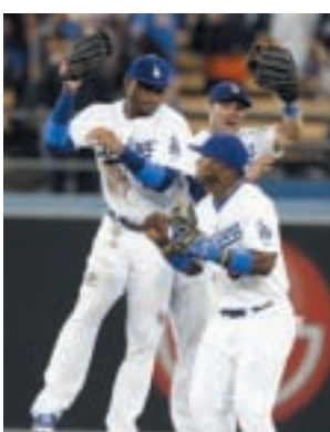
formance since the 1942 St Louis Cardinals went 41-7, according to information

team's second come-from-behind win in six days. On Friday, the Dodgers scored four times in the ninth inning to beat Tampa Bay 7-6. "The magic has happened again," Vin Scully, the Dodgers' fabled 85-year old announcer Vin Scully, excitedly proclaimed to his listeners as the Dodgers stormed back on Wednesday night. The victory over the Mets gave the Dodgers a 40-8 record since 22 June, the best 48-game per-