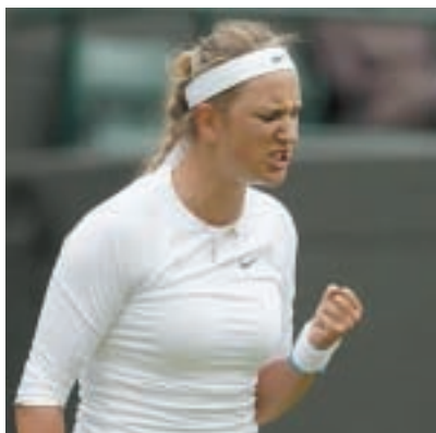
Victoria Azarenka of Belarus reacts during her women's singles tennis match against Maria Joao Koehler of Portugal at the Wimbledon Tennis Championships, in London on 24 June, 2013.

CINCINNATI, 16 Aug — As the tennis world took stock of Marion Bartoli's shock decision to retire, Victoria Azarenka tried to put the focus back on court with a controlled display against Magdalena Rybarikova at the Western and Southern Open on Thursday. The world number two's 6-3, 6-4 third round victory was impressive but it could not turn attention away from Bartoli, the Wimbledon champion having stunned the sport 24 hours earlier by announcing she was quitting following a second-round defeat. Even when world number one Serena Williams closed out the action under the center court floodlights