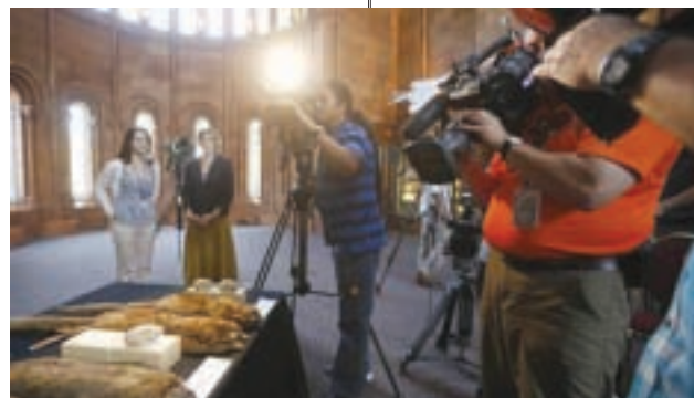
Two stuffed specimens of the newly-discovered mammal, "Olinguito (Bassaricyon neblina)," are pictured by the media at the Smithsonian in Washington, on 15 Aug, 2013.

are about 2.5 feet (.76 metre) long and weigh about 2 pounds (900 grams). Males and females are about the