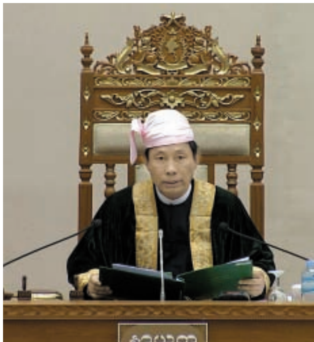
Pyidaungsu Hluttaw Speaker Thura U Shwe Mann makes discussion in today session.

Speaker Thura U Shwe Mann said that most of today's discussions occurred in the olden days. Their reviews and suggestions are objective. He urged the Union government and region/state governments to deal with these problems as