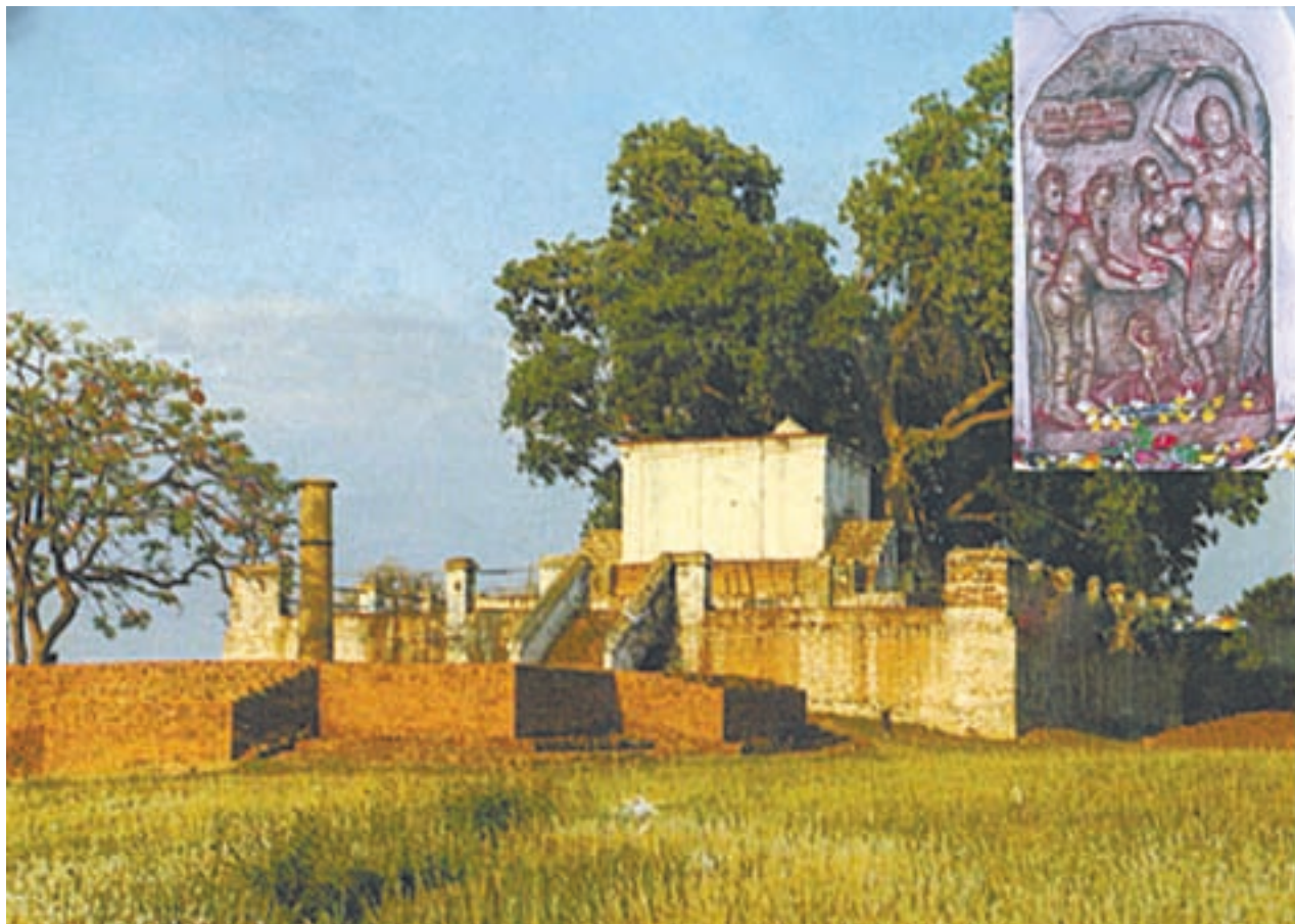
Photo shows birth place of Lord Buddha at Bodh Gaya.

NAY PYI TAW, 16 Aug—A ceremony to drive stakes at the venues dedicating to the birth place