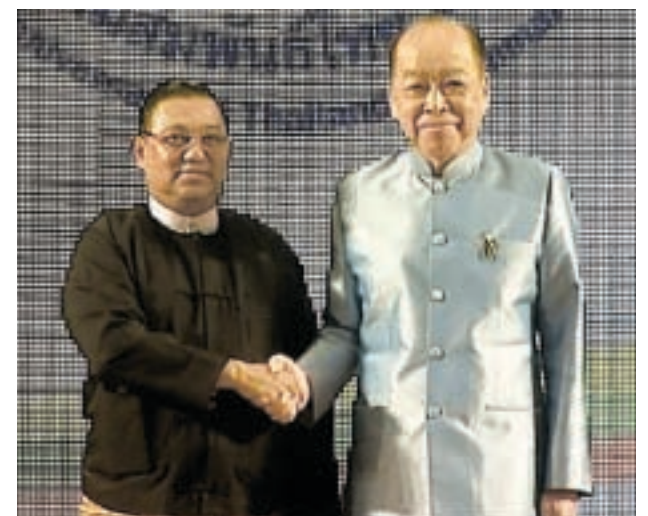
Union Minister U Wunna Maung Lwin poses for documentary photo with Deputy Prime Minister and Foreign Minister Mr. Surapong Tovichakchaikul.

After the meeting, Thai Deputy Prime Minister and Minister of Foreign Affairs Mr. Surapong Tovichakchaikul presented 100,000 USD to Union Minister U Wunna Maung