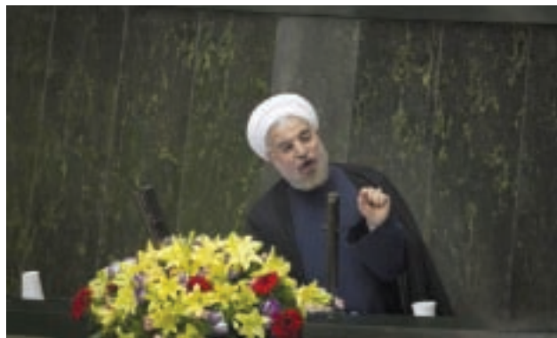
Iranian President Hassan Rouhani delivers a speech at Iran's Majlis (parliament) in Teheran, Iran, on 15 Aug, 2013. Iran's Majlis on Thursday approved candidates that President Hassan Rouhani nominated for key posts in his 18-member cabinet.

DUBAI, 16 Aug — Iran's Parliament on Thursday approved all President Hassan Rouhani's big-name nominees for a cabinet of technocrats, which will have the task of imple-