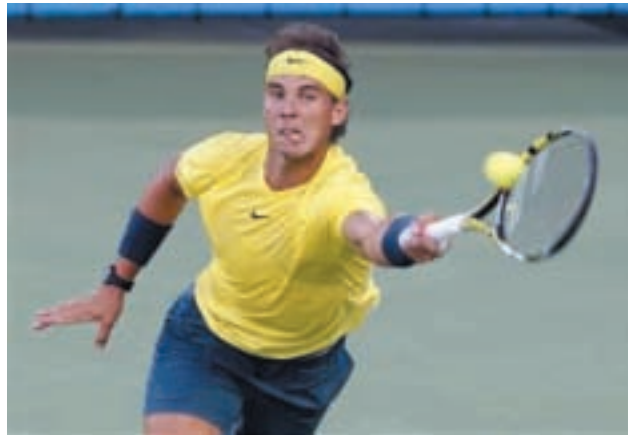
Rafael Nadal of Spain hits a return ball to Grigor Dimitrov of Bulgaria at the Men's Cincinnati Open tennis tournament in Cincinnati, Ohio on 15 Aug, 2013.

take on long-time rival Nadal, the world number three. Nadal, whose grand slam resume lists 12 titles, and Federer will clash for the 31st time, adding yet another chapter to what will go down as one of the sport's all-time great rivalries. Nadal has