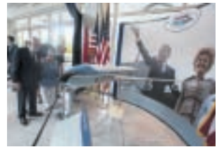
Visitors take a close look at the model of Air Force One during its unveiling ceremony at the Richard Nixon Library & Museum in Yorba Linda, California, on 13 Aug, 2013. A new exhibition featuring a 1/20 scale, 7 feet model of Air Force One SAM 26000 was opened here on Tuesday. Air Force One SAM 26000 was the plane on which former US President Nixon flew around the world.

2. Tender documents are available at our office starting from 19.8.2013 during office hours and for further detail please contact: Deputy General Manager Supply Department, Myanmar Railways, Corner of Theinbyu Street and Merchant Street, Botahtaung, Yangon. Phone:95-1-291985, 291994