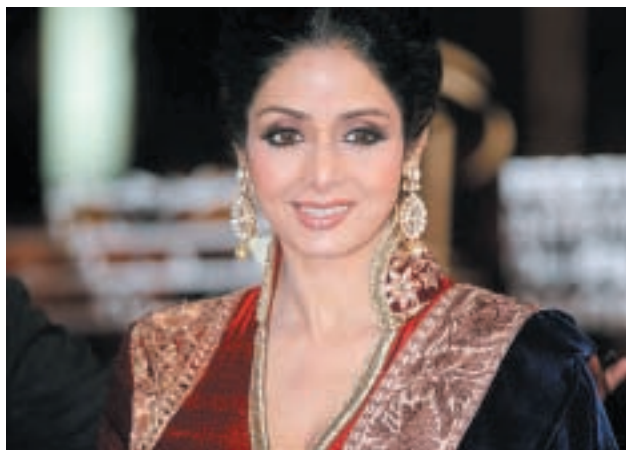
Sridevi was awarded the Padma Shri in 2012.