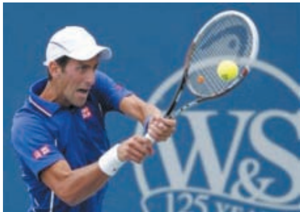
Novak Djokovic of Serbia hits a return to David Goffin of Belgium during their men's singles match at the Cincinnati Open tennis tournament in Cincinnati, Ohio on 15 Aug, 2013.

CINCINNATI, 16 Aug—Novak Djokovic, Andy Murray, Rafa Nadal and Roger Federer all picked up third round wins at the Western and Southern Open on Thursday to set up a star-studded last eight in Cincinnati. The ATP Tour's big four were joined in the quarter-finals by 2009 US Open champion Juan Martin Del Potro of Argentina, the only other man to hoist a grand slam trophy since Marat Safin at the 2005 Australian Open. Djokovic, Murray, Nadal, Federer and Del Potro have accounted for the last 34 grand slams and it is just the second time this year all five have reached the last eight of a tournament.