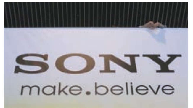
Sony Corp's logo is seen at the company headquarters in Tokyo on 22 May, 2013.

A US spokesman for Sony declined to comment as did representatives from Time Warner, CBS, Disney and Viacom. The report said the Web-based service would be available on Sony's new PlayStation's console, Bravia high-definition TVs and could later expand to other Sony products such as tablets and phones.—Reuters