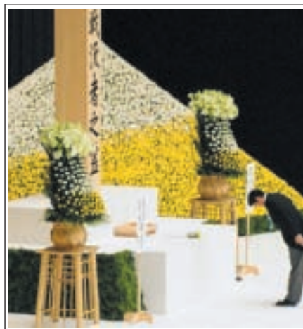
Japanese Prime Minister Shinzo Abe bows during a memorial ceremony marking the 68th anniversary of Japan's surrender in World War II, held at Nippon Budokan hall in Tokyo on 15 Aug, 2013.

"No more negotiation for the joint committee as the temporary results were released," he told Xinhua , adding that the final poll results would be issued on 8 September. CNRP's Vice President Kem Sokha said on Thursday that the party would boycott the first parliamentary session and call for mass protests if an independent poll probe committee was still not established.— Xinhua