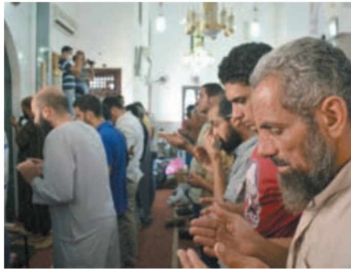
Supporters of ousted Egyptian President Mohammed Morsi pray at a mosque in Nasr City, Cairo, on 15 Aug, 2013, the day after clashes between security forces and protesters in various parts of the country left more than 500 people dead and over 3,700 injured. The bodies of many victims were carried to the mosque.