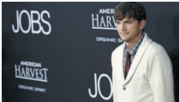
Cast member Ashton Kutcher poses at the premiere of "Jobs" in Los Angeles, California on 13 Aug, 2013.