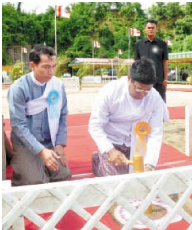
Vice-President U Nyan Tun driving a stake at Bodh Gaya replica Thatta Thattaha Maha Bo Tree Pagoda.

The President and party drove stakes for construction of the birth place of the Buddha-to-be, four corners of the lake and the site for stone inscription and planted Sal trees. They also drove stakes for the sites of Dhammarajika Pagoda,