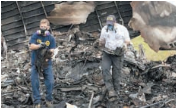
National Transportation Safety Board (NTSB) investigators retrieve the flight voice and data recorders from the wreckage of UPS flight 1354 in this handout photo taken in Birmingham, Alabama on 15 Aug, 2013.

The cargo plane, an Airbus A300, clipped trees and nearly hit a house before plowing across about 200 yards of empty field well short of the Birmingham-Shuttlesworth International Airport, the NTSB