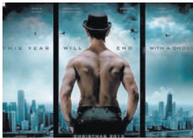
Aamir Khan is playing an antagonist in Dhoom 3.

Although the face is not visible, the man in the poster looks like Aamir Khan giving a glimpse of his well-toned body, something which audiences appreciated in his 2008 hit Ghajini. He is seen wearing a pair of trousers and has teamed it up with a hat.