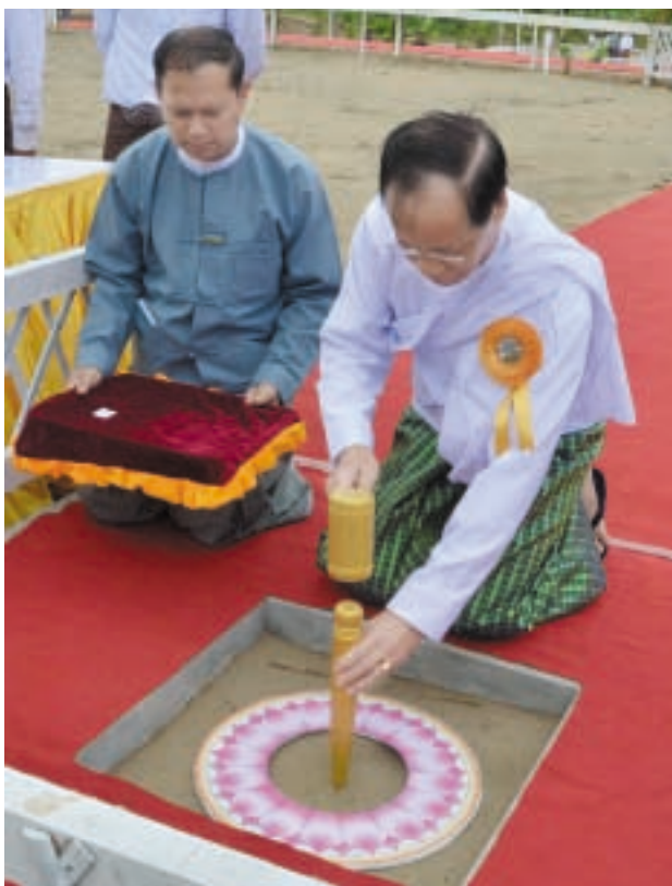
Vice-President Dr Sai Mauk Kham drives a stake at Bodh Gaya replica Thatta Thattaha Maha Bo Tree Pagoda.