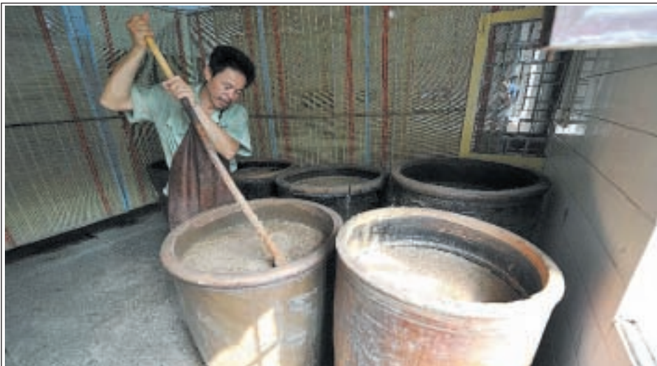
A staff member stirs raw materials used to make Shanxi mature vinegar at Donghu Vinegar Garden in Taiyuan, capital of north China's Shanxi Province, on 15 Aug, 2013. Donghu Vinegar Garden is a theme museum displaying a unique technology of making Shanxi mature vinegar. With over 3,000 years of history, Shanxi mature vinegar, one of the four famous vinegars in China, is made from sorghum, barley and other raw materials. The whole making process of such vinegar is of purely natural fermentation without any chemical catalysts.