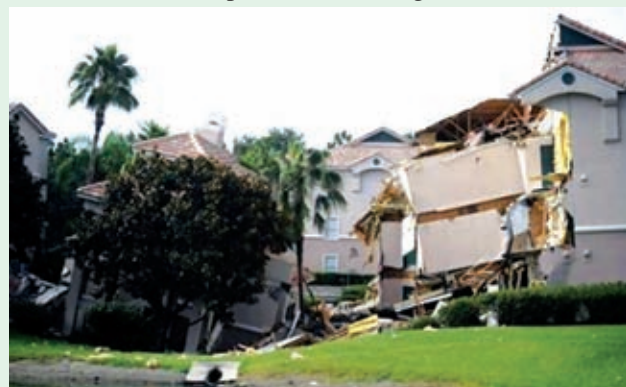
A section of the Summer Bay Resort lies collapsed after a large sinkhole opened on property's grounds in Clermont, Florida on 12 August, 2013.