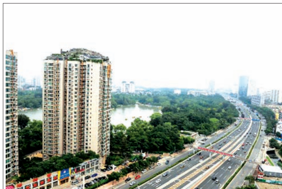
Photo taken on 12 Aug, 2013 shows a residential building with a rocky style villa on its roof, in Haidian District of Beijing, capital of China. A resident in the building has spent years to build a huge villa on top of a 26-storey building in Beijing. His neighbours have complained about this oddity covering over 1,000 square metres, fearing its weight may cause structural collapse. Local bureau of city administration attempted to investigate the allegedly illegal construction, but the owner hasn't shown up so far.