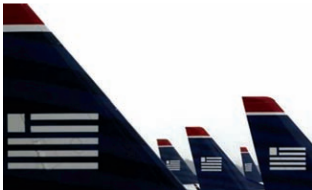
US Airways jets are seen at Reagan National Airport in Washington on 12 July, 2013.

ATLANTA, 13 Aug — The machinists union on Monday won an election to represent nearly 5,000 US Airways Group (LCC.N) mechanics, beating back an attempt by the Teamsters to gain a foothold at the carri-