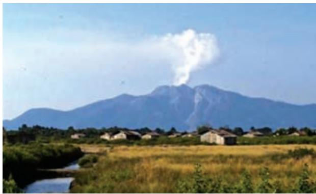
A view of Mount Rokatenda in Palue Island, as it spews hot ash into the air, is pictured from Maumere, East Nusa Tenggara Province on 11 Aug, 2013.

The most deadly in recent memory was Mt Merapi, near the densely populated city of Yogyakarta in central Java, which erupted in late 2010, killing over 350 people. “Observation centres in Indonesia have equipment that can detect an increase in geophysical or geochemical activity. So, if there are increasing tremors, it might be a sign