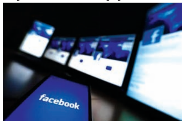
The loading screen of the Facebook application on a mobile phone is seen in this photo illustration taken in Lavigny on 16 May, 2012.

Mobile Technologies, founded in 2001, was the maker of the free Jibbigo Translator mobile app that automatically translates speech from more than 20 languages.—Reuters