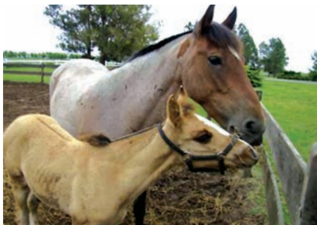
Cloned horse BS Nandubay Bicentenario and its mother Perdida Puester (rear), are shown at a Buenos Aires' farm on 10 Oct, 2010.