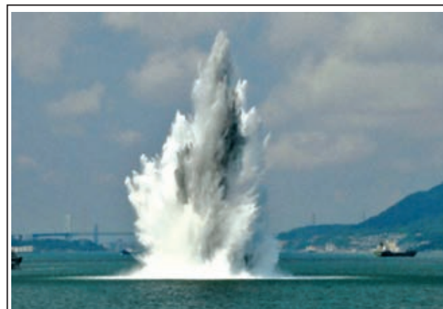
Photo taken on 13 Aug, 2013, shows water spouting from the sea as the Maritime Self-Defence Force disposed of a mine in the Kammon Straits off Shimonoseki, Yamaguchi Prefecture. The mine, found buried in the seabed off Shimonoseki in June, was dropped by a US bomber around the end of World War II.