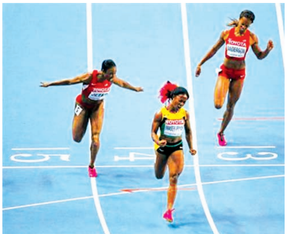
Shelly-Ann Fraser-Pryce of Jamaica (C) celebrates winning the women's 100 metres final next to Carmelita Jeter of the US (L) and Alexandria Anderson of the US during the IAAF World Athletics Championships at the Luzhniki stadium in Moscow on 12 Aug, 2013.