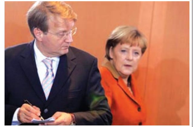
Federal Chancellery Ronald Pofalla makes notes as German Chancellor Angela Merkel walks past, before the weekly cabinet meeting in Berlin on 7 Nov, 2012.

Thomas Oppermann, an opposition Social Democrat who chairs the committee, called the offer a "face-saving confession"