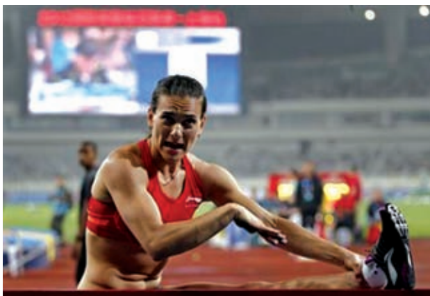
Russia's Yelena Isinbayeva talks to her coach (not pictured) during the women's pole vault at the IAAF Diamond League Athletics meet in Shanghai on 18 May, 2013.

discipline between 2003 and 2008, has not won a global title since Olympic gold five years ago in Beijing.