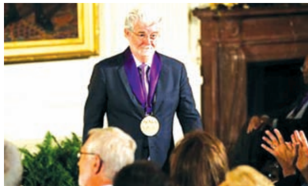
Film producer George Lucas walks to his seat after US President Barack Obama awarded him the 2012 National Medal of Arts during a ceremony in the East Room of the White House in Washington on 10 July, 2013.