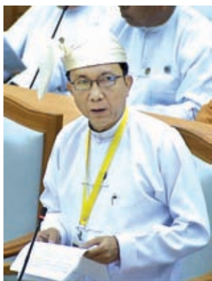
Union Minister for Finance U Win Shein answering questions.

In his clarification at Pyidaungsu Hluttaw here today, the Union minister said the Ministry of Finance has already made the plan in accordance with the Union Budget Law 2013 and Ministry of Information, Ministry of Livestock, Fisheries and Rural Development, Ministry of Electric Power and Ministry of Industry would borrow