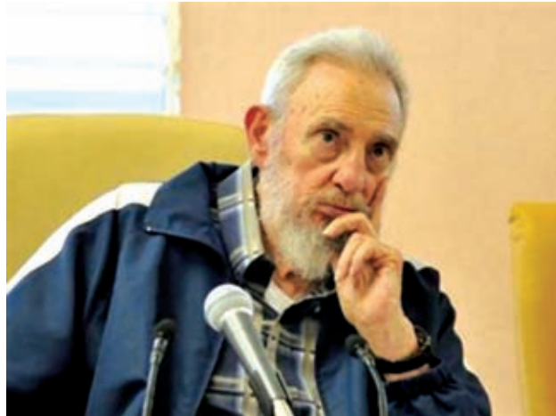
Former Cuban leader Fidel Castro sits at the inauguration of the Vilma Espin Guillois school in Havana in this picture taken on 9 April, 2013, and released by Cuban website Cubadebate on 11 April, 2013. —REUTERS

HAVANA, 13 Aug—Fidel Castro turns 87 on Tuesday, largely out of sight but not out of mind, as Cuba struggles to move on from his half-century rule and as many of his policies are reconsidered under the leadership of his younger brother Raul.