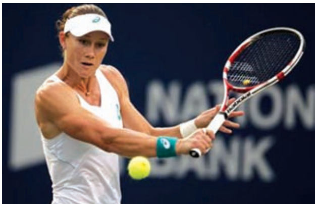
Samantha Stosur of Australia hits a return to Petra Kvitova of the Czech Republic during their women's tennis match at the Rogers Cup tennis tournament in Toronto on 8 Aug, 2013.

CINCINNATI, 13 Aug—Former US Open champion Samantha Stosur continued her buildup to the season's final grand slam with a convincing 6-1, 7-5 win over Russia's Svetlana Kuznetsova in first round action at the Western and Southern Open