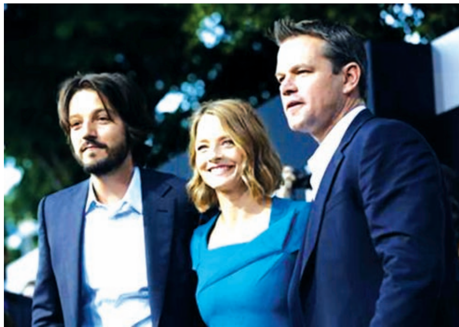
Cast members Diego Luna (L), Jodie Foster and Matt Damon pose at the world premiere of "Elysium" in Los Angeles, California on 7 Aug, 2013. The movie opens in the US on 9 August.

Damon stars as Max, a blue-collar worker with a criminal past who needs medicine from Elysium to survive. Jodie Foster plays the Elysium defence secretary bent on keeping Max and all other illegal immigrants out. The $115 million production was produced and financed by Media Rights Capital. The movie was distributed by Sony, which stumbled earlier this summer with big-budget releases "After Earth" and "White House Down," although its other summer releases have fared better.