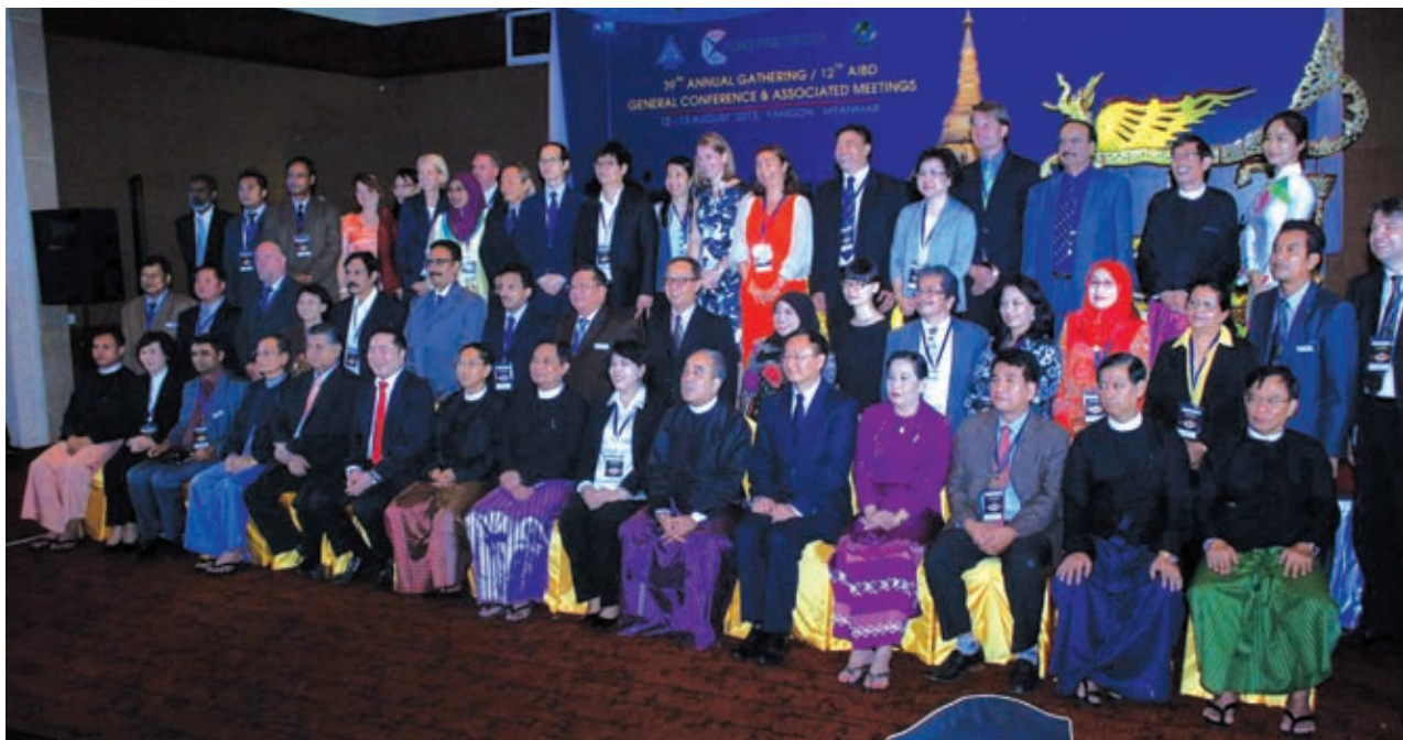
Union Information Minister U Aung Kyi poses for documentary photo together with those present at 39 th Annual Gathering and 12 th AIBD General Conference and Associated Meeting.—MNA

NAY PYI TAW, 13 Aug—"Media plays an important role in shaping and defining societal norms in the modern world," said Union Minister for Information U Aung Kyi at 39 th Annual Gathering and 12 th AIBD General Conference and Associated Meeting, at Parkroyal Hotel in Yangon yesterday evening.