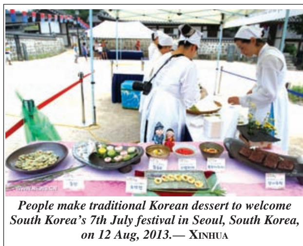
People make traditional Korean dessert to welcome South Korea's 7th July festival in Seoul, South Korea, on 12 Aug, 2013.