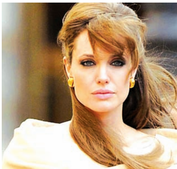
Angelina Jolie will be seen next in Maleficent.

"Star Wars" has become a cultural phenomenon, making characters such as Luke Skywalker, Princess Leia and Darth Vader, and phrases like "May the force be with you" part of popular culture. Lucas sold his production company Lucasfilm Ltd to Walt Disney Co for $4.05 billion in October 2012. Since then, Disney has announced plans for three new "Star Wars" films and an animated TV series set to air in 2014.—Reuters