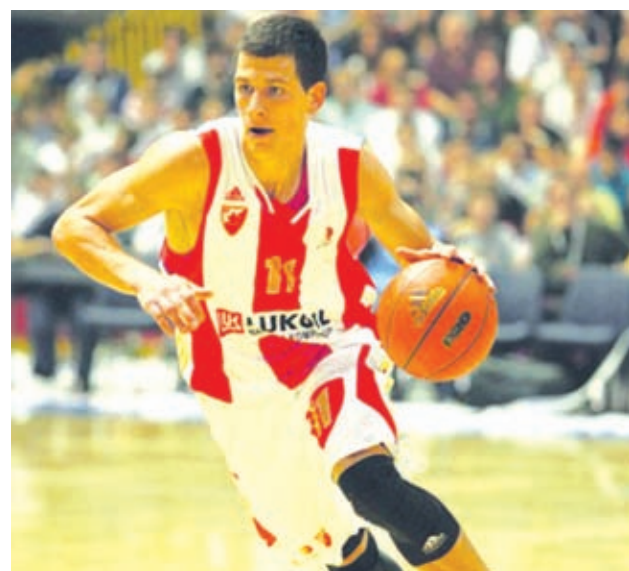
Serbian Nemanja Nedovic

The 22-year-old's talents again came to the fore in that win which was a build-up to the 24-team European Championship where the Serbians will hope to finish in the top eight and qualify for the 2014 World Championship in Spain. "It was very important to win this tournament and it will be an incentive to keep working hard in order to peak in time