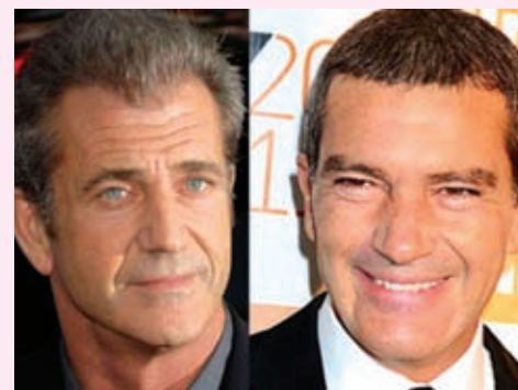
Apart from Mel Gibson and Antonio Banderas, the rest of the cast for The Expendables 3 has yet to be confirmed.