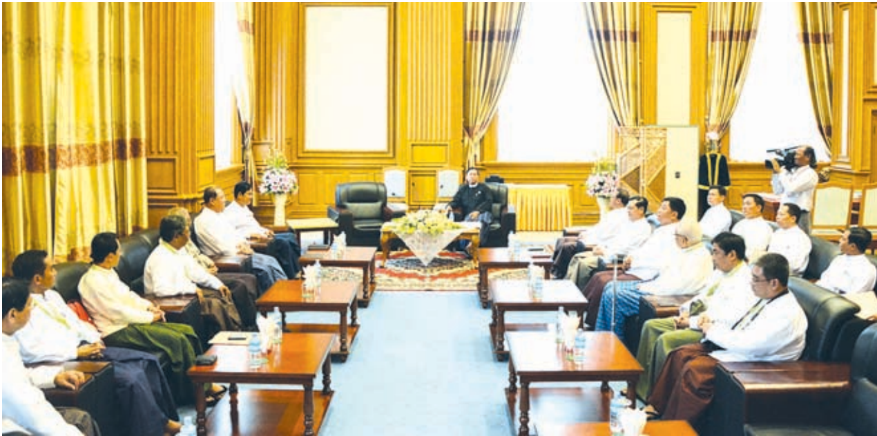
Speaker of Pyithu Hluttaw Thura U Shwe Mann receives Chairman U Khin Maung Aye of Myanmar Press Council (Temporary) and party.

NAY PYI TAW, 13 Aug—Speaker of Pyithu Hluttaw Thura U Shwe Mann received Chairman U Khin Maung Aye of Myanmar Press Council (Temporary) and party at the hall of Pyithu Hluttaw in Hluttaw Complex, here, at 3.45 pm today.