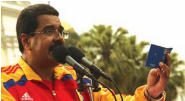
Venezuela's President Nicolas Maduro (C) holds a copy of the Venezuelan constitution as he speaks during a rally in Caracas in this handout photo provided by Miraflores Palace on 3 Aug, 2013.

CARACAS, 13 Aug — Venezuela's President Nicolas Maduro said on Monday he will ask for decree powers last used by his predecessor Hugo Chavez to ramp up a fight against corruption that has begun to cost him politically with supporters. Maduro, who served as Chavez's foreign minister and vice president,