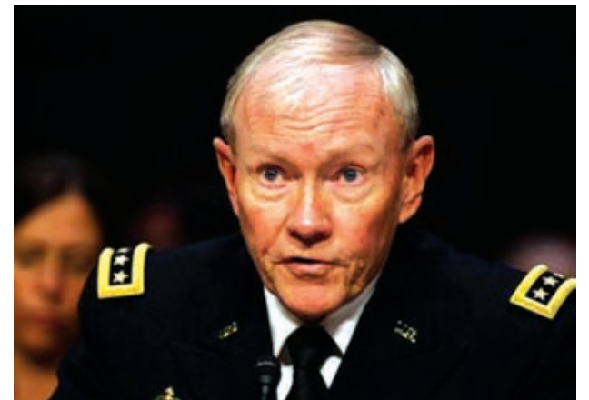
Chairman of the Joint Chiefs General Martin Dempsey testifies about pending legislation regarding sexual assaults in the military at a Senate Armed Services Committee on Capitol Hill in Washington, on 4 June, 2013.