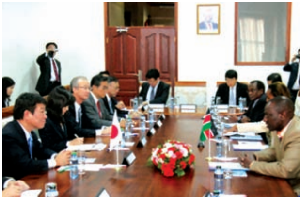
Japanese Economy, Trade and Industry Minister Toshimitsu Motegi (far L) and Kenyan Deputy President William Ruto (far R) hold talks in Nairobi, Kenya, on 11 Aug, 2013. Motegi said 12 Aug that he has confirmed with the Kenyan government that the two countries will jointly undertake oil exploration in the southwestern part of the country.

During his visit to Kenya, Motegi unveiled a Japanese plan to accommodate