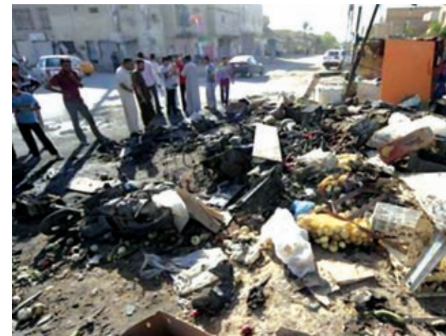
People gather at the site of a car bomb attack in Kerbala, 110 km (70 miles) south of Baghdad, on 11 Aug, 2013.