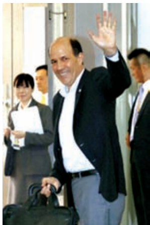
Outgoing US Ambassador to Japan John Roos waves to people seeing him off at Narita airport near Tokyo on 12 Aug, 2013.

Caroline Kennedy, daughter of the late US President John F Kennedy,