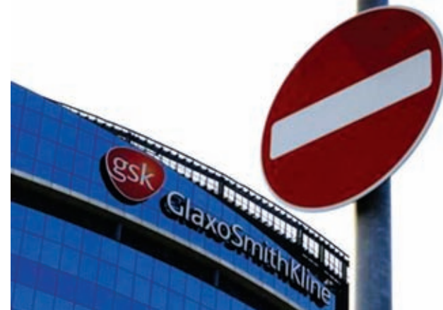
A no entry sign is pictured outside the GlaxoSmithKline building in Hounslow, west London on 18 June, 2013.

Serious side effects included allergic reactions and abnormal liver function in patients who were also infected with hepatitis B or C. Patients received either Tivicay or Merck & Co's Isentress in combination with other HIV drugs;