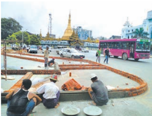
Masons creating traffic island in front of Yangon City Hall.