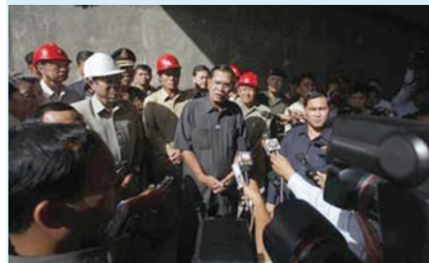
Cambodia's Prime Minister Hun Sen (C) speaks to the media as he inspects a bridge construction site in Phnom Penh on 31 July, 2013.