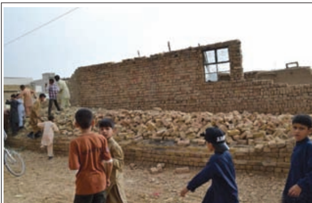
Pakistani children gathered around a fallen house wall in southwest Pakistan's Quetta on 11 Aug, 2013. At least 15 children were injured as the house wall collapsed due to rain in Quetta on Sunday, local media reported.