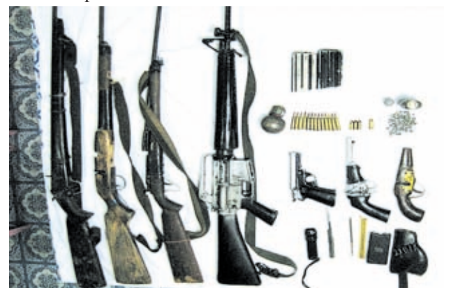
Photos show arms and ammunition and narcotic drugs seized in Hpa-an Township.