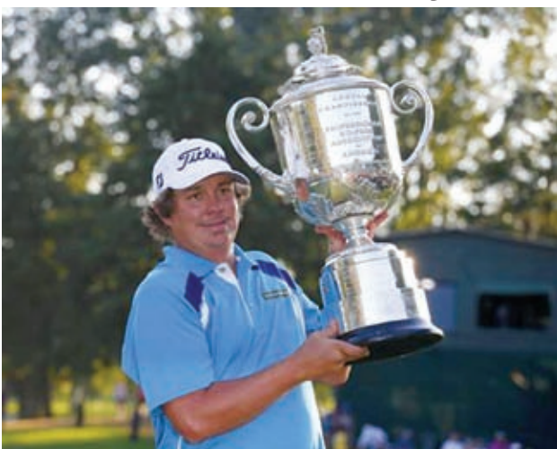
Jason Dufner of the US poses with the Wanamaker trophy after winning the 2013 PGA Championship golf tournament at Oak Hill Country Club in Rochester, New York on 11 Aug, 2013.

ROCHESTER, (New York), 12 Aug—American Jason Dufner erased memories of his heart-breaking late collapse two years ago when he clinched his first major title by two shots in the 95th PGA Championship on Sunday. One stroke behind playing partner Jim