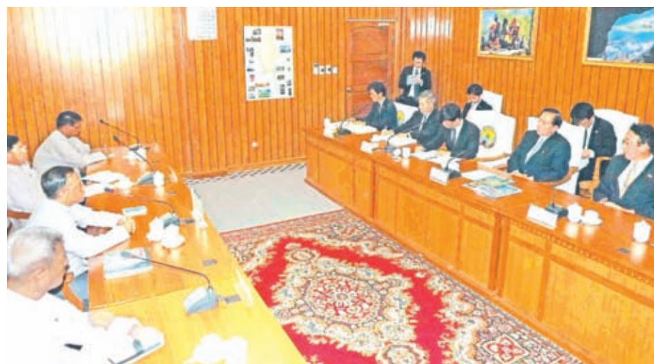
Nippon Airways which plies daily starting from coming September.—MNA

The meeting focused on promotion of tourism industry between the two countries, human resource development, convenience of entry and exit and investment enhancement and substitution of 38-seat Boeing-737 which plies thrice a week with 202-seat Boeing-767 of All