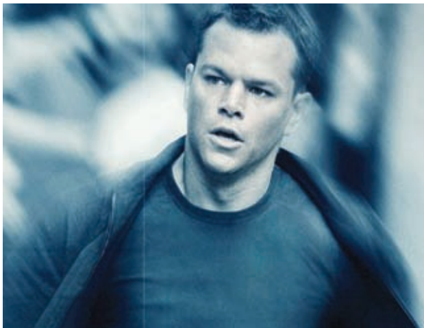
Matt Damon says giving up his favourite food made him angry.

"I'm at the point in my life where somebody was silly enough to marry me