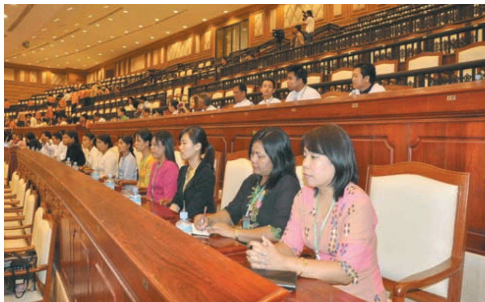
Observers seen at 21 st day session of Pyithu Hluttaw.

As the China's China Guodian Corporation officially informed that it could not process with the implementation of the project, Tun Thwin