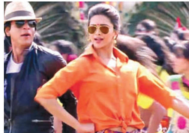
Deepika Padukone's newest comedy film Chennai Express released on 8 Aug, 2013.

"I think these things are relative. It feels nice to hear or to read about it. But, more importantly, I have been working really hard. I know I have pushed myself and sacrificed a lot of personal and family time. But in the end if the result is like this, you don't mind.