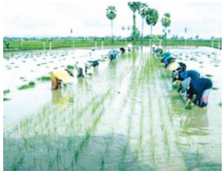
Local farmers transplanting paddy saplings to paddy field in model plot.

DAWEI, 12 Aug—The demonstration on cultivation of Palethwe hybrid paddy was held at the model plot on 4.37 acres of farmer U Maung Shin in Panbyin Village of Thayetchaung Township in Dawei District of Taninthayi Region on 9 August.