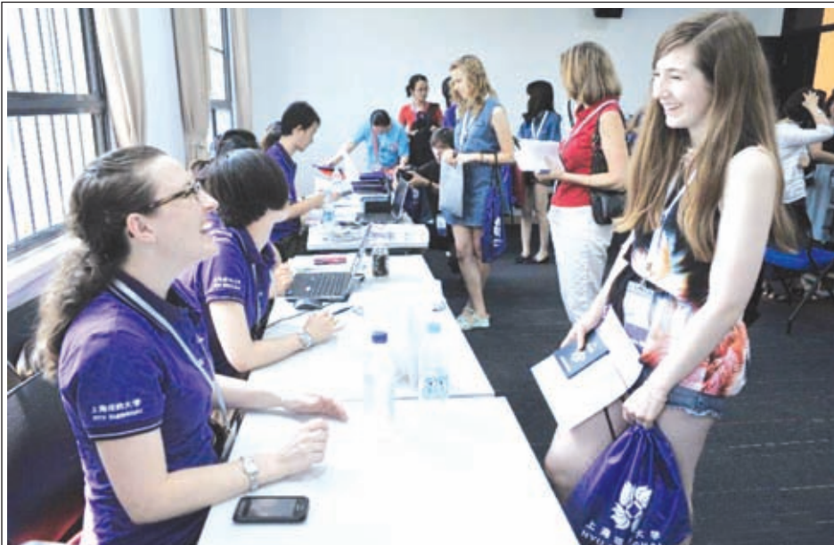
A freshman talks with a staffer of New York University Shanghai (NYU Shanghai), east China's Shanghai, on 11 Aug, 2013. NYU Shanghai, jointly established by New York University and East China Normal University, welcomed its first batch of students on Sunday.