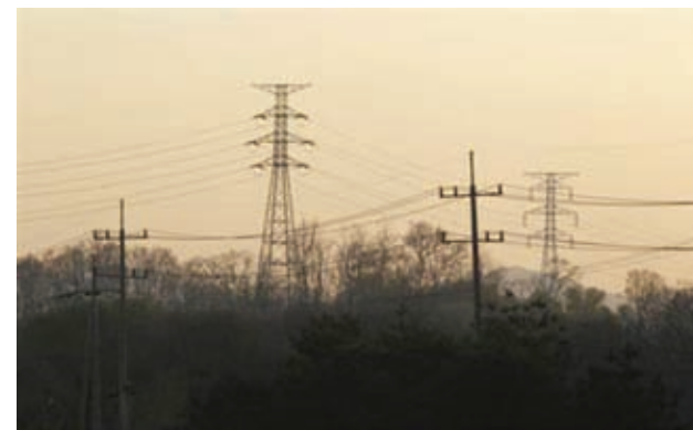
Power transmission towers supplying electric power to the inter-Korean Kaesong Industrial Complex from South Korea, are seen at the customs, immigration and quarantine (CIQ) office, just south of the demilitarized zone separating North Korea from South Korea in Paju, north of Seoul on 29 April, 2013.

South Korea's power demand is projected to peak at up to 80,500 megawatts