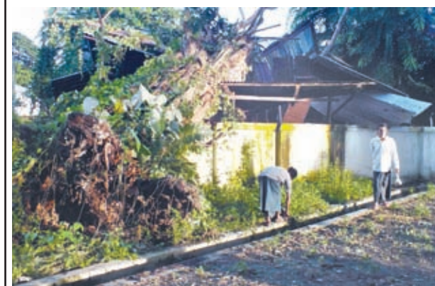
Banyan tree falls over staff quarters of nurses.

MOHNYIN, 12 Aug—A Banyan tree fell over the staff quarters which accommodates five nurses in 100-bed General Hospital in Mohnyin of Kachin State on 8 August evening.