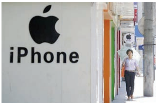
A woman walks past a logo of Apple Inc in Wuhan, Hubei Province on 24 July, 2013.

NEW YORK, 12 Aug — Apple Inc, the world's largest technology company, is expected to present its redesigned iPhone in September,