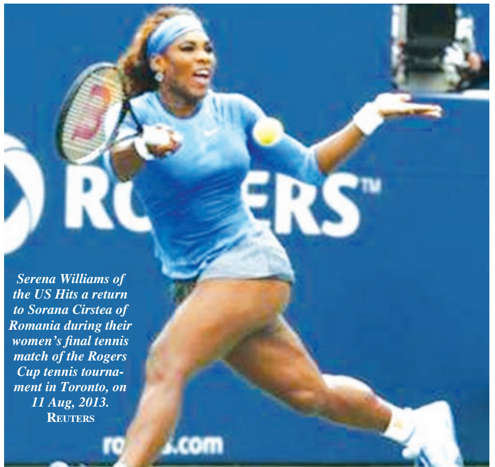
Serena Williams of the US Hits a return to Sorana Cirstea of Romania during their women’s final tennis match of the Rogers Cup tennis tournament in Toronto, on 11 Aug, 2013.