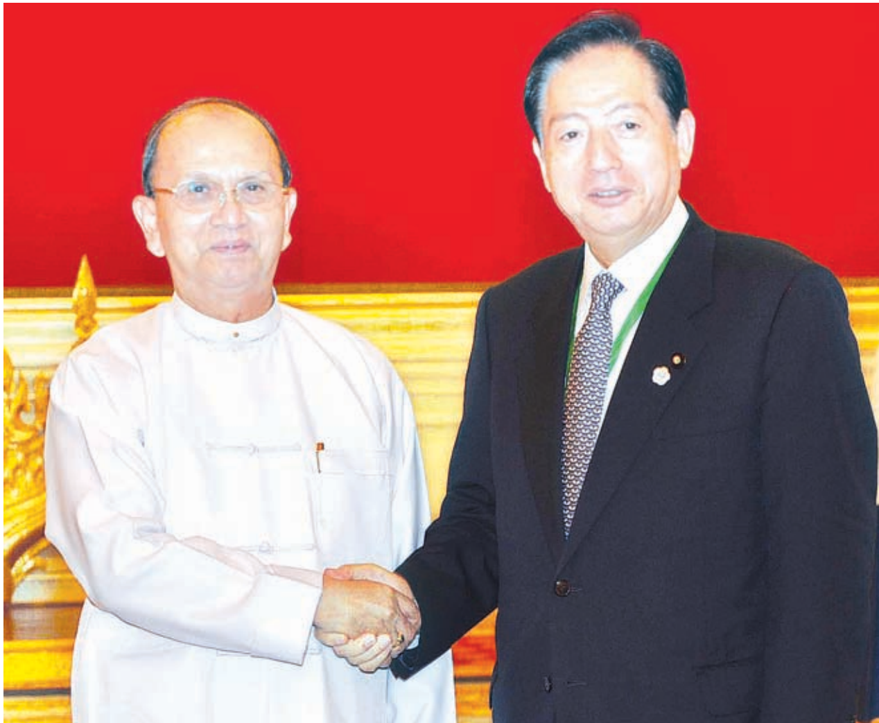
President U Thein Sein receives Minister of Land, Infrastructure, Transport and Tourism Mr Akihiro OHTA of Japan.—MNA