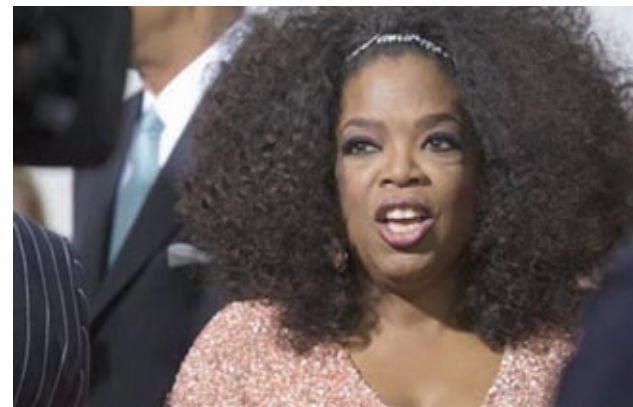
Cast member Oprah Winfrey