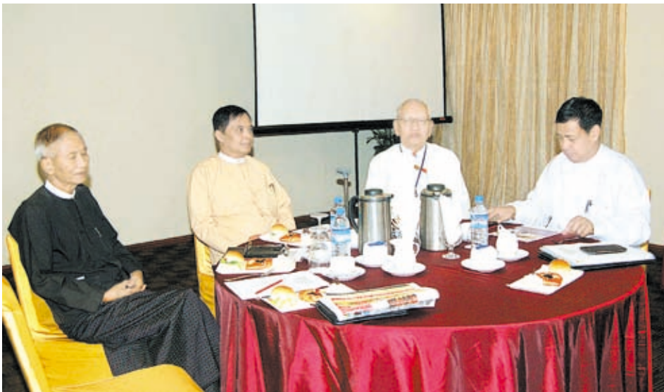
Union Minister for Information U Aung Kyi meets Chairman of MPC (Temporary) U Khin Maung Aye.

NAY PYI TAW, 12 Aug— A meeting between Union Minister for Information U Aung Kyi and Myanmar Press Council (Temporary) was held at Ruby Hall (5) of Parkroyal Hotel in Yangon, this morning.