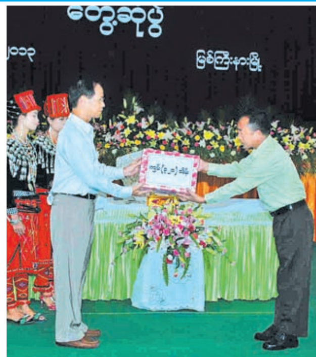
Vice-President Dr Sai Mauk Kham presents cash donation to an official.

The vice-president also visited AD 2000 camp and contributed K 9.8 million to the fund for the IDPs; the Kachin State Chief Minister 50 bags of rice; Ministry of Home affairs, Minister of Border Affairs,