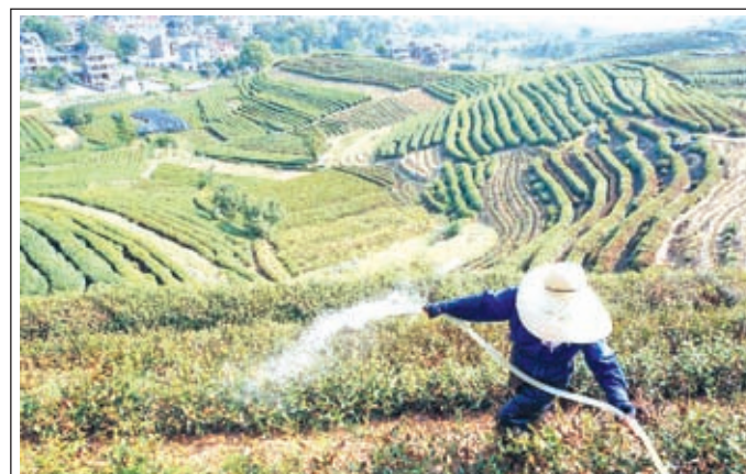
A tea farmer irrigates tea plants at a tea plantation in Hangzhou City, capital of east China's Zhejiang Province, on 11 Aug, 2013. Many tea plants have withered due to the continuous scorching weather and drought in the city.

Indonesia sits on a vulnerable quake-prone zone, or the so-called "the Pacific Ring of Fire."—Xinhua