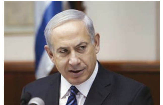
Israel's Prime Minister Benjamin Netanyahu speaks during the weekly cabinet meeting in Jerusalem, in this on 19 May, 2013 file picture.

Yaalon was also slated to head a cabinet-level meeting on Sunday to select Palestinian security prisoners for release as part of US-sponsored peace negotiations, the second round