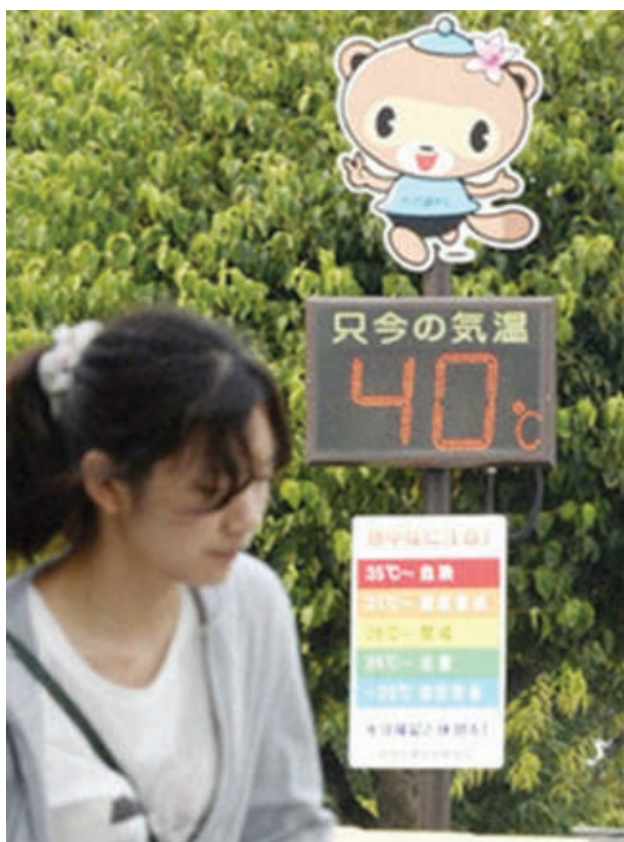
A woman passes a signboard displaying 40 C in Tatebayashi, Gunma Prefecture northwest of Tokyo, on 11 Aug, 2013.

TOKYO, 12 Aug—Japan remained in the grip of a severe heat wave on Sunday, with temperatures topping 40 C for the second day in a row, the Japan Meteorological Agency said.