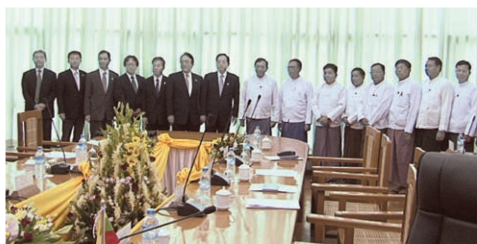
Union Minister U Kyaw Lwin and Japanese Minister Mr Akihiro OHTA and party pose for documentary photo.

The Japanese minister said that he has observed the site for Japan-Myanmar friendship Thakayta Bridge (Pazundaung-Dawbon). He pledged to give necessary expertise for road safety of Yangon-Mandalay Expressway and design and construction for housing development. He added that the Japanese ministry will cooperate with Myanmar Construction Entrepreneurs Association to hold Business