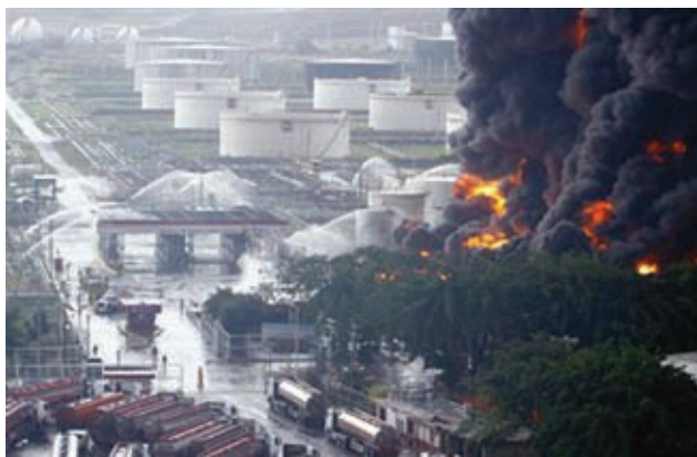
Firefighters try to extinguish a fire at a oil refinery in Puerto La Cruz on 11 Aug, 2013.

He congratulated the fire crews for their "sus-