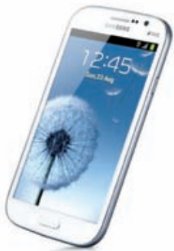
KOLKATA, 12 Aug — It's raining updates for

some smartphone users. Samsung Galaxy Grand Duos and HTC One X+ owners are reportedly receiving the Android 4.2.2 Jelly Bean update.