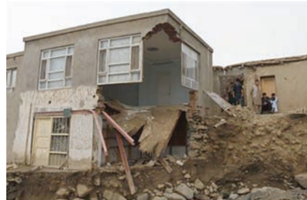
Afghans stand near a destroyed house after floods in the Shakar Dara District of Kabul on 11 Aug, 2013.