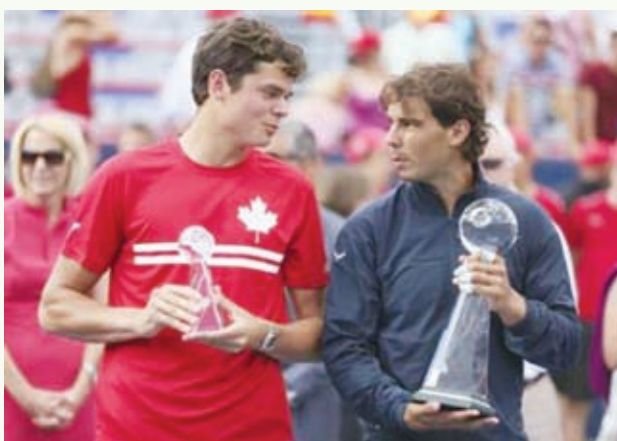
Rafael Nadal of Spain (R) and Milos Raonic of Canada hold their trophies following the men's singles finals match at the Rogers Cup tennis tournament in Montreal on 11 Aug, 2013.

the top 10 for the first time after becoming the first Canadian man in more than half a century to reach the Rogers Cup final. "The breakthroughs I've had this week, with everything, from