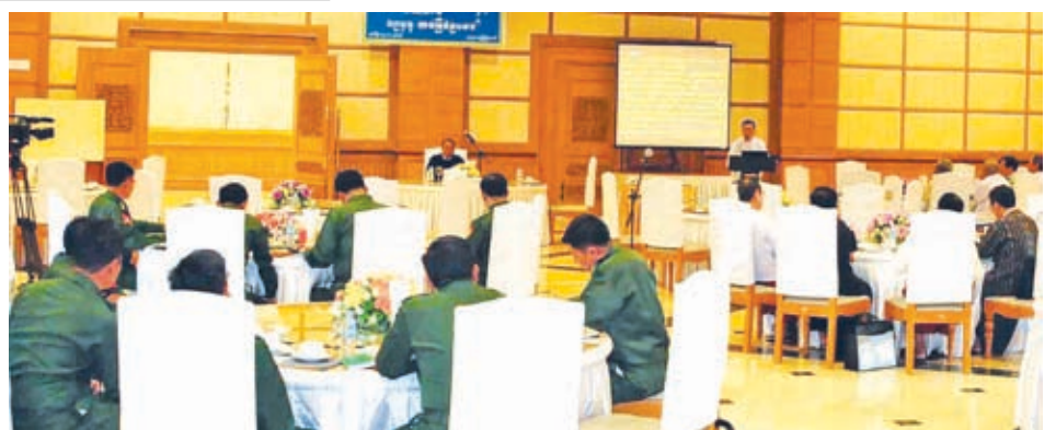
Amyotha Hluttaw Speaker U Khin Aung Myint delivers speech at debate on Constituent Assembly and 1947 Constitution.—MNA