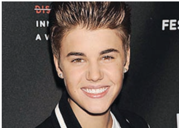
Justin Bieber reportedly got into a fight with a male club-goer after a female friend attempted to hit on him in his VIP section.

NEW DELHI, 12 Aug—Teen pop star Justin Bieber reportedly took home two cocktail waitresses home following his nightclub brawl last week.