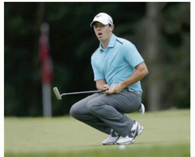
Northern Ireland's Rory McIlroy reacts after missing a birdie putt on the second hole during the final round of the 2013 PGA Championship golf tournament at Oak Hill Country Club in Rochester, New York on 11 Aug, 2013.

back into the water." "I really didn't hit a bad shot, but obviously it was disappointing. Came back okay at the end." The 24-year-old, who has been desperately searching for form is convinced he was close to getting back to his best. "I played the best golf of the week today. I hit some really good drives and really good iron shots," enthused McIlroy. "Didn't quite putt as well as I did the first three days, but really, really happy with my game going into the next few weeks. "I didn't hit many bad shots out there today."—Reuters