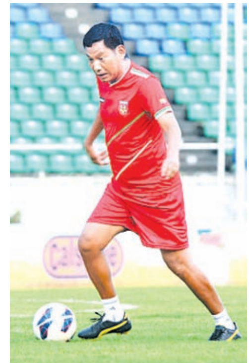
A former star player of selected team seen in the pitch.