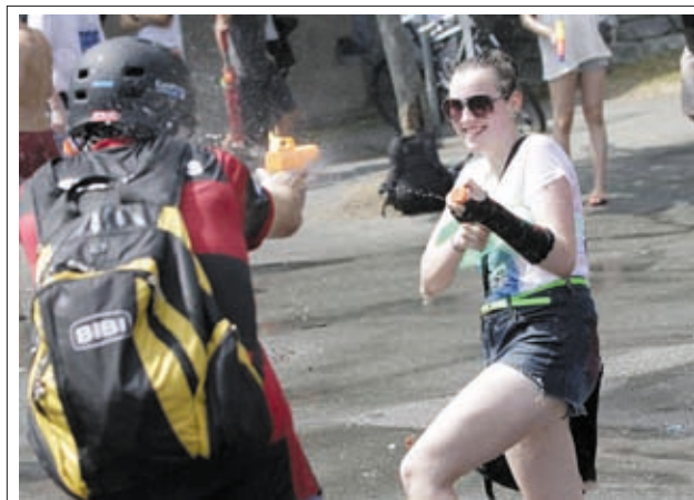
Participants shoot to each other with water pistols during the water fight at Stanley Park in Vancouver, Canada, on 10 Aug, 2013. Over 300 people joined the 7th annual Vancouver's water fight event. Participants brought their water pistols and bombs to cool down each other in the hot summer.

The first WCP was held in 1900 in Paris. The congress aims at inquiring into the world's philosophical traditions, reflecting on the tasks and functions of philosophy in the contemporary world, among others.—Xinhua