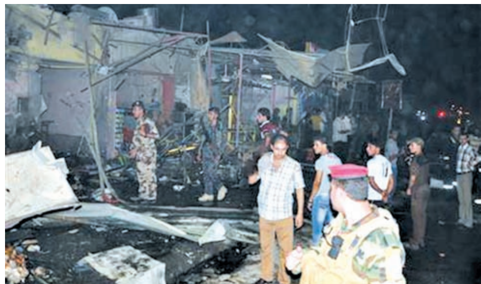
Iraqi security forces inspect the site of a car bomb attack in Nasiriyah city, 375 km (233 miles) south of Baghdad, on 10 Aug, 2013.

"We are now investigating his involvement in the human trafficking murdering and rape and we will work together with our counterparts in Thailand to charge him," Police Col Win Naing Tun.— MNA