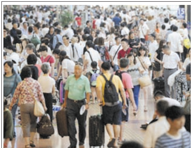
The departure lobby at Tokyo's Haneda airport is crowded with holidaymakers on 10 Aug, 2013, as the annual rush of travellers headed to their hometowns and resort areas for the Japanese "Bon" summer holidays peaked.