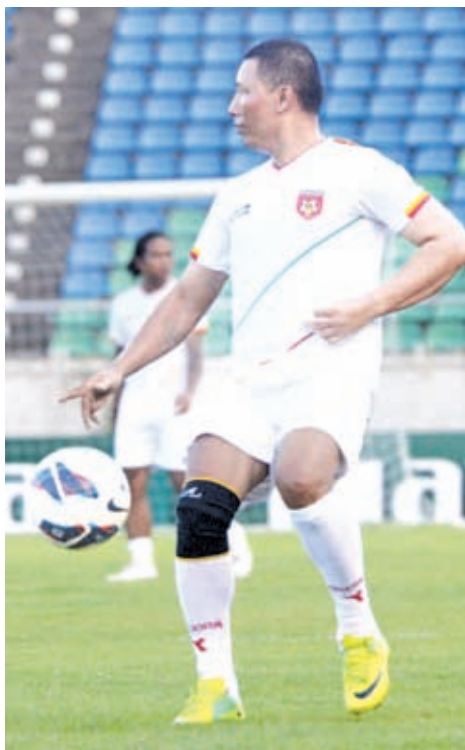
A former star player of Myanmar selected team seen in controlling the football.

YANGON, 11 Aug—The tune-up match between the former selected Myanmar football team and the Thai selected players team will