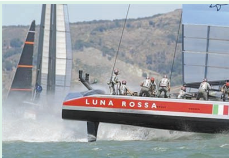
Italy's Luna Rossa Challenge (R) passes Sweden's Artemis Racing during Race 4 of their Louis Vuitton Cup semi-finals in San Francisco, California on 10 Aug, 2013.