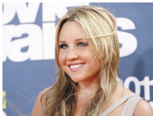
Actress Amanda Bynes

Ventura County Sheriff deputies put the former teenage star of Nickelodeon series "All That" in involuntary psychiatric care at a local hospital after the 22 July incident,