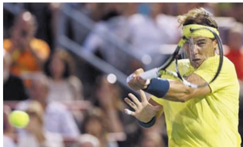
Rafael Nadal of Spain hits a return to Marinko Matosevic of Australia during quarter-final action at the men’s Rogers Cup tennis tournament in Montreal, on 9 Aug, 2013.

Raonic had earlier advanced to his first Masters series final when he recovered from a mid-match slump to win a