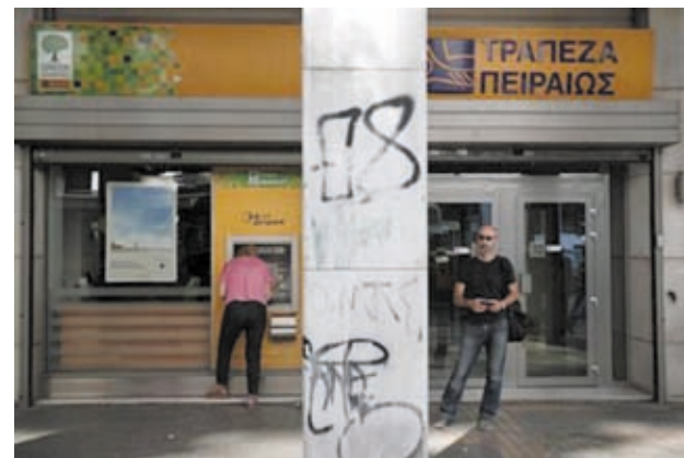
A woman makes a transaction at an ATM of a Piraeus Bank branch as a man waits for his turn in Athens on 25 July, 2013.

LONDON, 11 Aug — Banks cut 5,500 branches across the European Union last year, 2.5 percent of the total, leaving the region with 20,000 fewer outlets than it had when the financial industry was plunged into crisis in 2008.