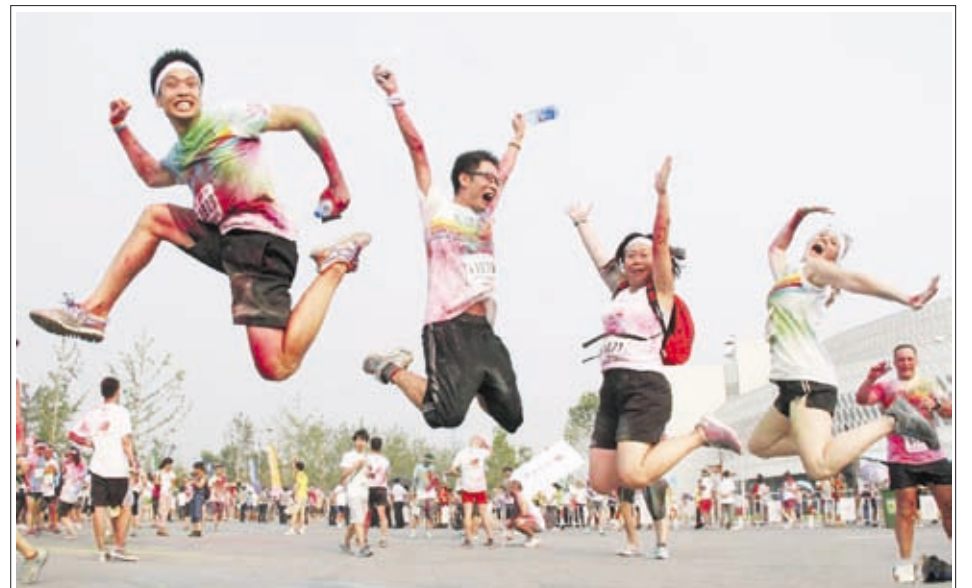
People jubilate at a colour run event in Beijing, capital of China, on 10 Aug, 2013. Colour run is an untimed event with no winners or prizes, and runners are showered with coloured powder at stations along the race.—XINHUA

"Unidentified armed men sneaked into the apartment of the Chinese nationals in Qalai Fatullah area of the 4th police district on Thursday afternoon, killing four people including three Chinese and their Afghan guard," the official told Xinhua but declined to be named.—Xinhua