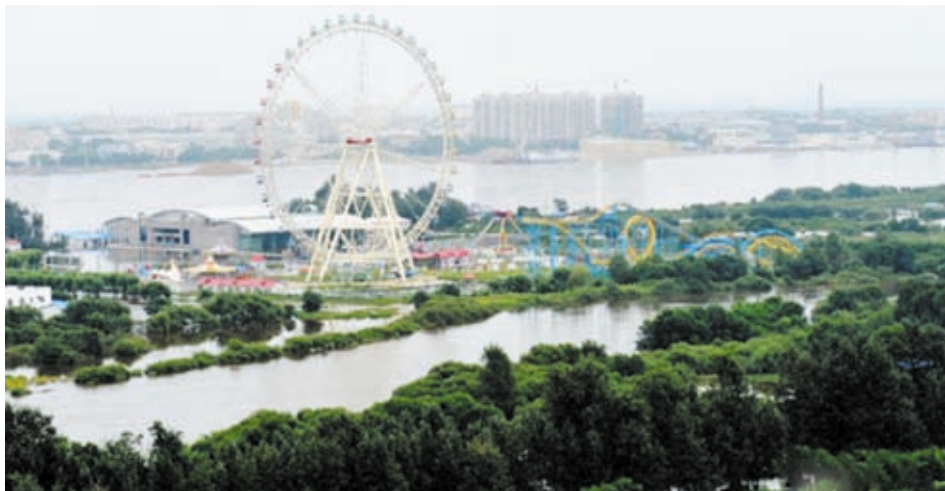
The swollen Heilongjiang River submerges part of the Daheihe Island in Heihe City, northeast China's Heilongjiang Province, on 8 Aug, 2013. Continuous downpours since July left floodwater from tributaries to flow into the Heilongjiang River, putting much pressure on flood control in the lower reaches.