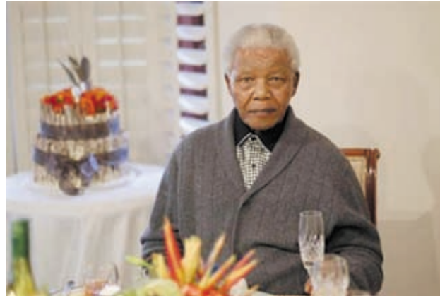
Former South African president Nelson Mandela looks on as he celebrates his birthday at his house in Qunu, Eastern Cape on 18 July, 2012.