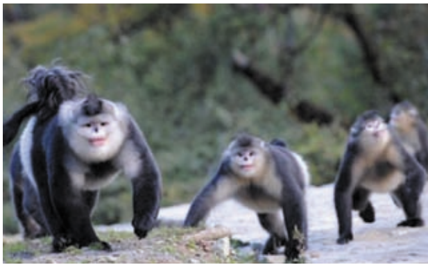
Endangered black snub-nosed monkey

The number of endangered black snub-nosed monkeys in southwest China's Tibet Autonomous Region has increased from 50 in the 1990s to 700, the