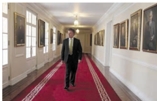
Colombia's President Juan Manuel Santos leaves the conference room after a Reuters interview at the presidential palace in Bogota on 8 Aug, 2013.

HAVANA, 11 Aug—The Colombian government and leftist FARC rebels wound up a 12th round of peace talks on Saturday but apparently made little progress despite pressure from the country's president who has staked his legacy on a successful outcome before a looming national election.