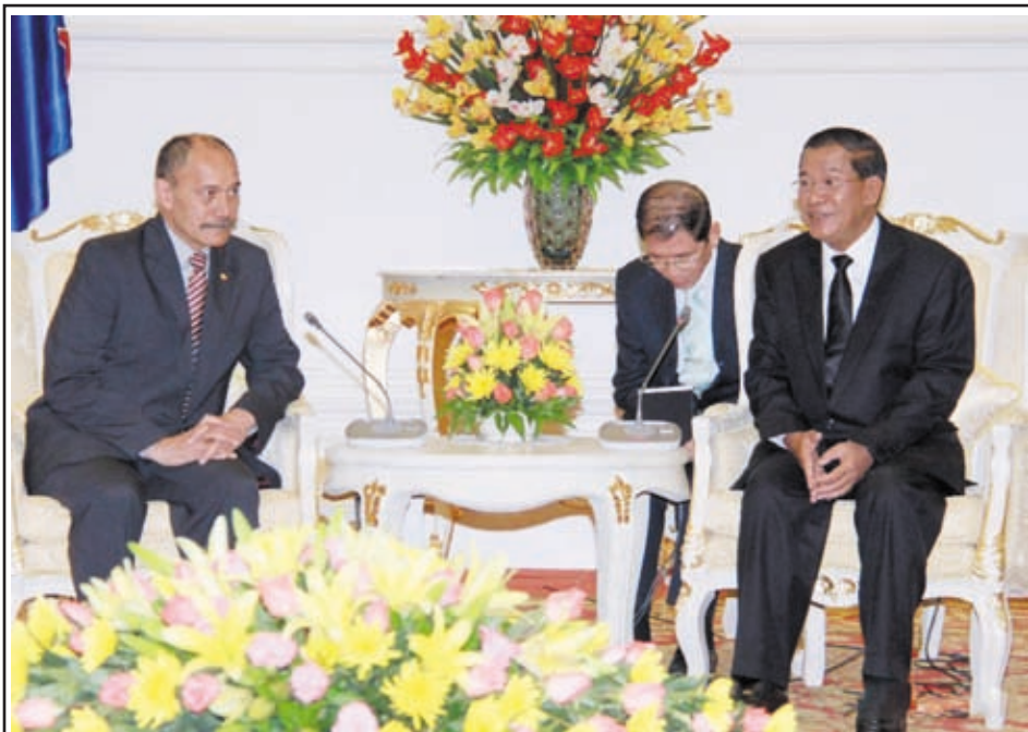
Cambodian Prime Minister Hun Sen (R) talks with visiting New Zealand Governor-General Jerry Mateparae (L) in Phnom Penh, capital of Cambodia, on 10 Aug, 2013. Visiting New Zealand Governor-General Jerry Mateparae said here on Saturday that Cambodia held a peaceful general election on 28 July. —XINHUA