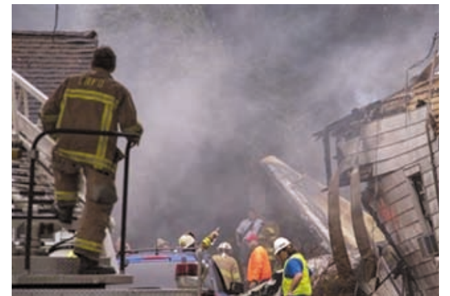
Fire and rescue personnel surround the aftermath of a plane crash between two homes in East Haven, Connecticut, on 9 Aug, 2013.