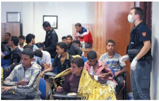
Would-be migrants who were rescued from a shipwreck, rest at a building at La Playa beach in Catania on Sicily island on 10 Aug, 2013.