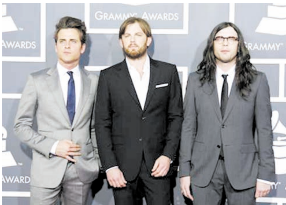
Rock band Kings of Leon pose on arrival at the 53rd annual Grammy Awards in Los Angeles, California on 13 Feb, 2011.