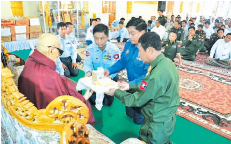
Provision donation ceremony for members of the Sangha in progress.

NAY PYI TAW, 11 Aug—A ceremony to donate cash and kind by families of Defence Services (Army, Navy and Air) and wellwishers to Pariyatti monasteries and nunneries was held at Ngwetaung Tawya Pariyatti monastery in Tatkon Township yesterday. The ceremony was