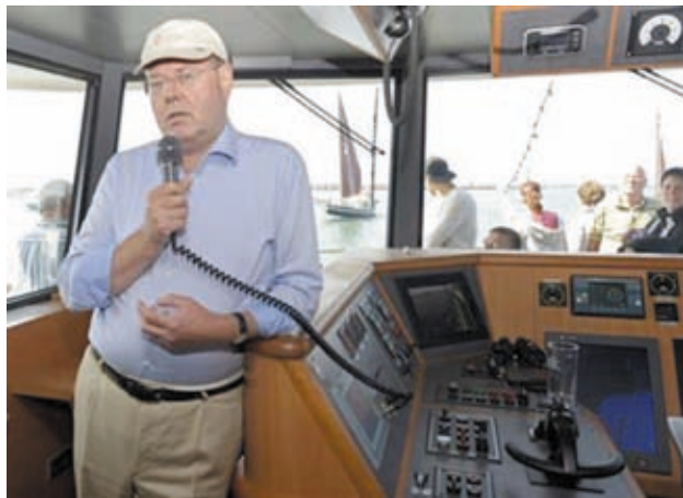
Peer Steinbrueck, the Social Democratic party (SPD) candidate in the upcoming general elections, talks to tourists with a microphone from the bridge of a boat, during a harbour trip in Warnemuende, on 9 Aug, 2013.

BERLIN, 11 Aug—Chancellor candidate Peer Steinbrueck travelled to eastern Germany on Saturday to try to calm a storm over his recent comments suggesting opponent Angela Merkel lacked passion for Europe because she grew up in the former communist East.