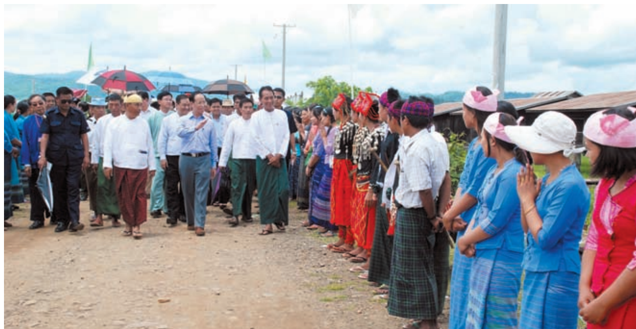
Vice-President Dr Sai Mauk Kham cordially greets local people.