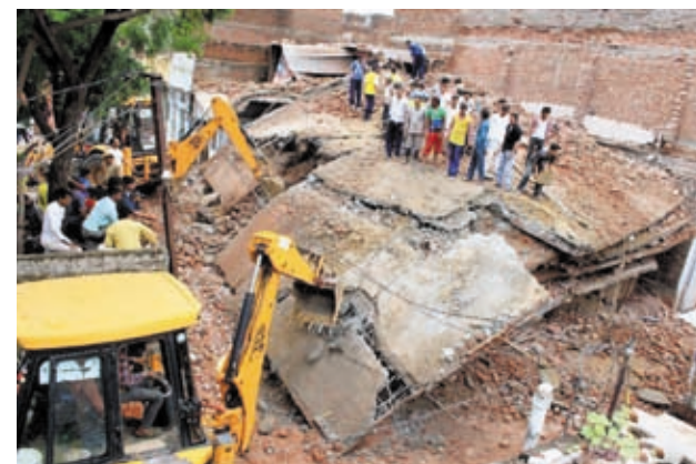
Rescuers work at the collapsed site in Bhatta Basti area of Jaipur, India, on 10 August, 2013. At least two people were killed and four others injured when a four-storey building collapsed in the western Indian city of Jaipur early Saturday, according to the police.