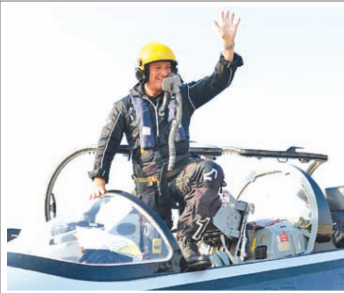
A member of Breitling Jet Team, a famous European aerobatic team, waves after arriving at Tianjin International Airport in Tianjin, north China, on 10 Aug, 2013. The team is on a tour from 10 to 14 August in China.