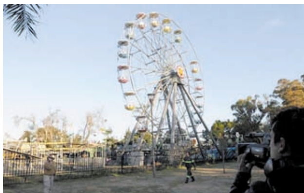
Rescuers and journalists work in front of the big wheel known as "Around the World" or "Wheel of fortune" after an accident at the International Park funfair in Rosario, Argentina, on 10 Aug, 2013. Two people died and many other got injured, including three children who were taken to hospital.