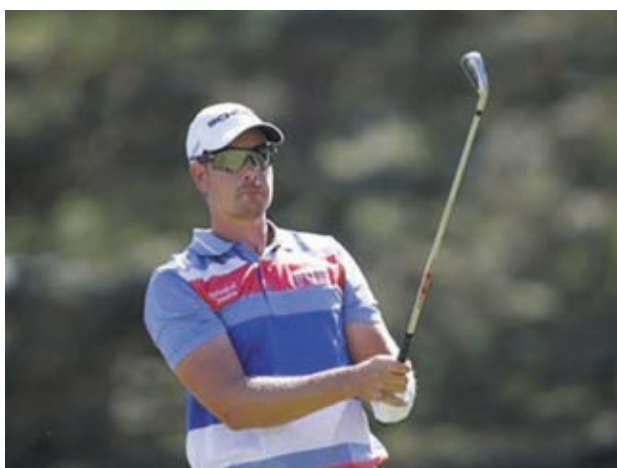
Sweden's Henrik Stenson watches his shot on the seventh tee during the third round of the 2013 PGA Championship golf tournament at Oak Hill Country Club in Rochester, New York on 10 Aug, 2013.