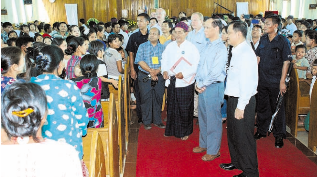
Vice-President Dr Sai Mauk Kham meets internally displaced persons at the Baptist Church in Phakant.

Next, the donation ceremony followed. The Vice-President donated K 7,010,000, the Chief Minister of the state 50 bags of rice, the deputy