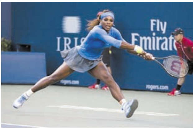
Serena Williams of the US returns a shot to Agnieszka Radwanska of Poland during their women's semi-final tennis match at the Rogers Cup tennis tournament in Toronto, on 10 Aug, 2013.

TORONTO, 11 Aug—Top seed Serena Williams shook off a spirited attempt by Agnieszka Radwanska and moved into the final of the Rogers Cup with a 7-6(3), 6-4 victory on Saturday and will meet Romania's Sorana Cirstea, whose surprising run continued when she beat China's Li Na 6-1, 7-6(5). The American held a 5-0 record against Radwanska coming into the match, but the Pole surprised the 16-times grand slam champion by being aggressive and not mixing up her shots.