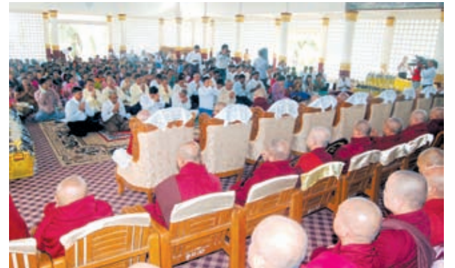
Robe offering ceremony of Thanantana Dhammapalaka (Hindu) Association in progress.

YANGON, 11 Aug — Thanantana Dhammapalaka (Hindu) Association offered Waso robes and a day mean to members of the State Sangha Maha Nayaka Committee and members of the Sangha of the State Pariyatti Sasana University (Yangon) at Mogok Refectory on Kaba Aye Hill in Mayangon Township today.