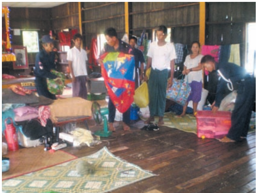
Members of Township Fire Services Department help local people on their moves to home.

been declining here since last five days. The victims from the relief camps moved back home under their