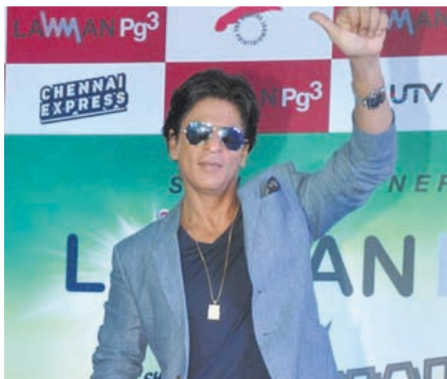
Shah Rukh says "till the time I don't stop smiling, the excitement won't settle down."

Shah Rukh said he is happy with the initial response, but he wants to wait for some more days to see how the film sustains. "It is nice that the film is doing well. I want to wait for three to four days. I am happy that people have liked the film and it has opened well," he said. However, he didn't know about the film's success in terms of numbers.