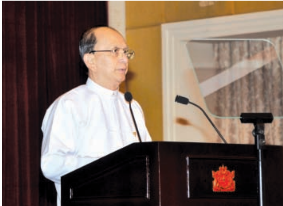
President of the Republic of the Union of Myanmar U Thein Sein delivering speech at the meeting with Union ministers, region/state chief ministers, and deputy ministers at the hall of the Presidential Palace.

NAY PYI TAW, 9 Aug— President U Thein Sein met Union ministers, region/state chief ministers, and deputy ministers at the hall of the Presidential Palace here this morning.