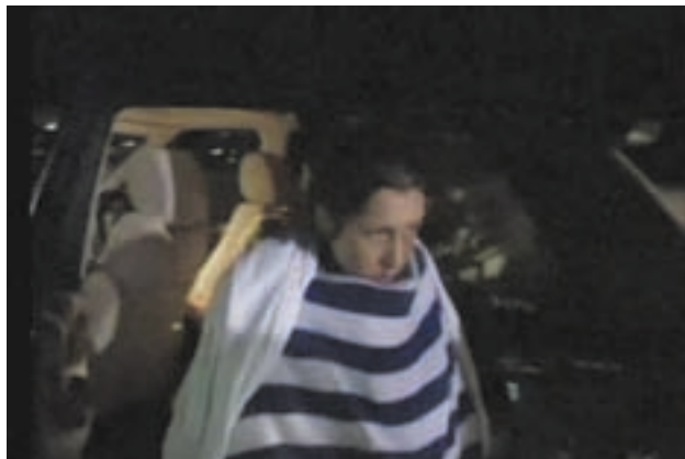
One of the two British teenage victims of an acid attack disembarks from a vehicle at the airport in Zanzibar, on 8 Aug, 2013 in this still image taken from video.