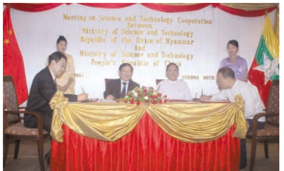
Union Minister Dr Ko Ko Oo and Chinese Minister Mr. Wan Gang sign agreement on remote sensing satellite data sharing and cooperation in work programmes between Myanmar and China.—MNA