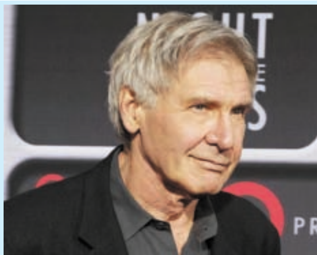
Actor Harrison Ford

LOS ANGELES, 9 Aug—After five decades of playing iconic characters — swinging a whip as Indiana Jones, saving Luke Skywalker as Han Solo, escaping from prison as a fugitive — Harrison Ford shows no signs of slowing down.