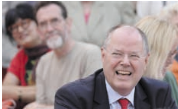
Social Democratic party (SPD) top candidate Peer Steinbrueck laughs before his speech during an election campaign in Hamburg on 8 Aug, 2013.

HAMBURG, 9 Aug — Launching the final phase of his long-shot campaign to oust German Chancellor Angela Merkel, leftist challenger Peer Steinbrueck called on Thursday for higher taxes on the wealthy and tighter rules for "gambling" bankers.