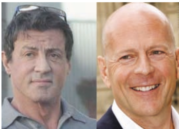
Sylvester wrote "WILLIS OUT... HARRISON FORD IN!!!! GREAT NEWS" on Twitter

Willis appeared in the first two Expendables films alongside Arnold Schwarzenegger, Jason