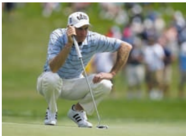
Jim Furyk of the US looks at his putt on the sixth green during the first round of the 2013 PGA Championship golf tournament at Oak Hill Country Club in Rochester, New York on 8 Aug, 2013.

ROCHESTER, (New York), 9 Aug—Jim Furyk and Adam Scott took advantage of rain-softened conditions to surge into a tie for the PGA Championship lead on Thursday as Tiger Woods double-bogeyed his final hole to finish six strokes adrift.