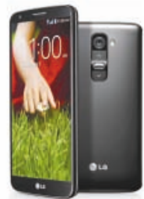
LG has announced the launch of its brand-new flagship device, the LG G2.

The LG G2 comes with a 13.0-megapixel rear camera with Optical Image Stabilization and a 2.1-megapixel front shooter. LG's latest flagship runs Android Jelly Bean 4.2.2 and is powered by a 3,000mAh battery. LG G2 sports dimensions 138.5 x 70.9 x 8.9mm and will be available in Black and White colour options. The LG G2 will be rolled out in over 130 wireless carriers in the