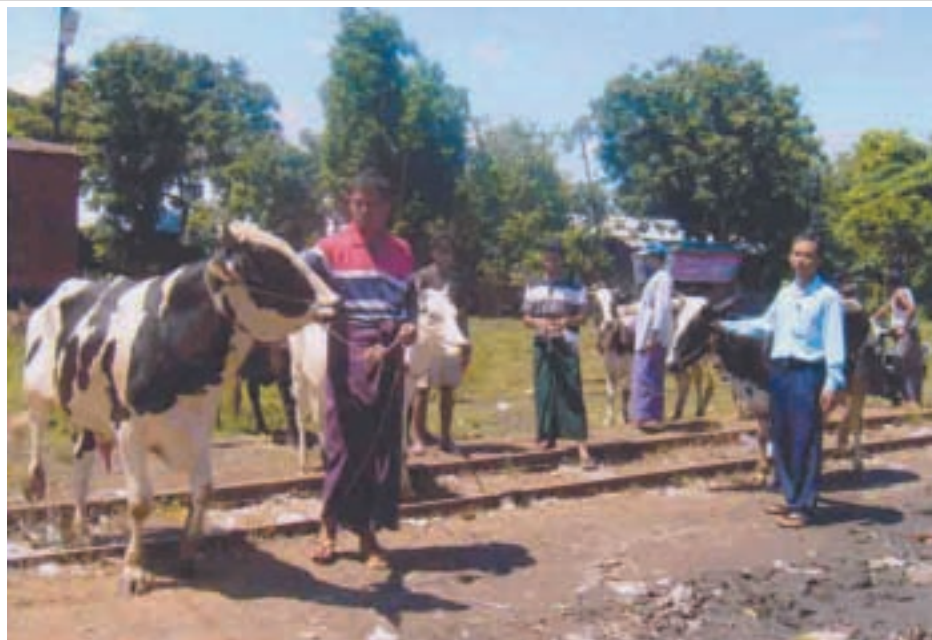
With the aim of developing breeding of milch cows in Kachin State to carry out rural development and poverty alleviation, enabling the local people to consume better milk and milk products and increasing income of livestock breeding entrepreneurs, officials of Livestock Breeding and Veterinary Department bought 59 milch cows from Mandalay Region and distributed eight of them to livestock breeding entrepreneurs in Mohnyin Township on 30 July.