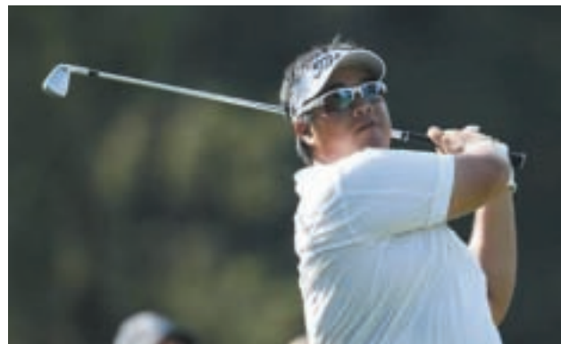
Thailand's Kiradech Aphibarnrat tees off on the 11th hole during the first round of the 2013 PGA Championship golf tournament at Oak Hill Country Club in Rochester, New York on 8 Aug, 2013.

Aphibarnrat, who started golfing when he was eight and is one of the most exciting young players to emerge from Thailand, welcomes the comparisons to Daly, who won the 1991 PGA Championship at Crooked Stick in Carmel, Indiana.