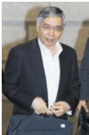
Bank of Japan Governor Haruhiko Kuroda enters the BOJ head office in Tokyo for a policy board meeting on 8 Aug, 2013.