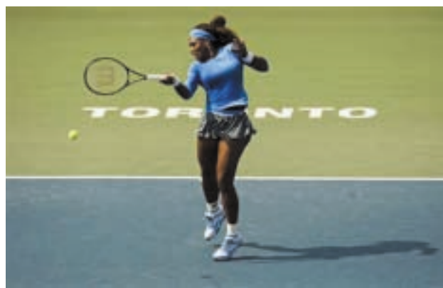
Serena Williams of the US hits a return to Kirsten Flipkens of Belgium during their women's tennis match at day four of the Rogers Cup tennis tournament in Toronto, on 8 Aug, 2013.

Flipkens put down Venus Williams in three sets in the first round as Serena watched from the stands, but the 13th seed struggled for rhythm in the face of the 31-year-old's monster serve and fierce returning.