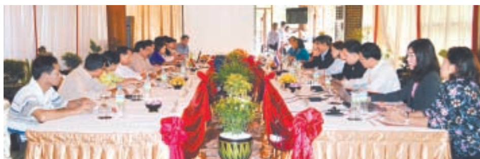
Ninth anti-human trafficking consultation between Myanmar Police Force and Thai Justice Department in progress.

Nay Pyi Taw, 9 Aug—Myanmar Police Force Anti-Human Trafficking Special Squad, Thai Justice Department and Special Branch organized ninth anti-human trafficking consultation in Bagan on 6 and 7 August as per MoU signed between Myanmar and Thailand at Greater Mekong Sub-region Anti-Human Trafficking Ministerial Meeting in 2009.