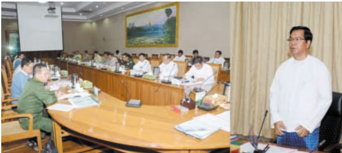
Union Minister U Hla Tun addresses the coordination meeting of the committee.

NAY PYI TAW, 9 Aug—The committee will open a liaison office in Latpadaungtaung project area to tackle the problems of locals, said Chairman of the Committee for Implementation of Investigation Report on Latpadaungtaung Copper Mining Project Union Minister at the President Office U Hla Tun at the coordination meeting of the committee at the meeting hall of the President Office, here, this afternoon.