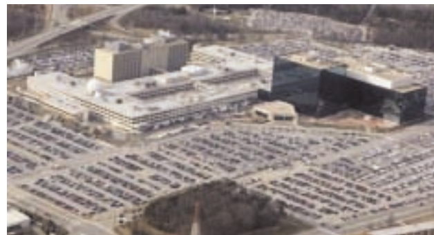
A view from helicopter of the National Security Agency at Ft Meade, Maryland, on 29 Jan, 2010.