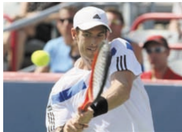
Andy Murray of Britain serves to Ernests Gulbis of Latvia at the Rogers Cup tennis tournament in Montreal on 8 Aug, 2013.

Raonic ended Del Potro's impressive recent run with a 7-5, 6-4 victory while Pospisil chalked up