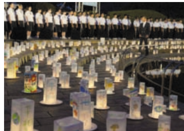
Candles are lit at a concert in Peace Park in Nagasaki on 8 Aug, 2013, the eve of the 68th anniversary of the US atomic bombing of the city.