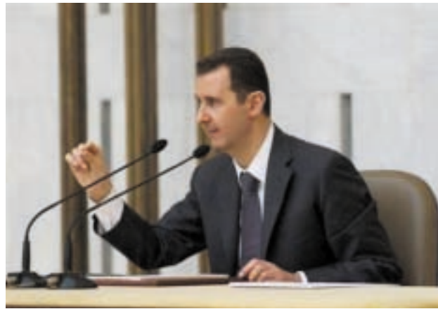
Syria's President Bashar al-Assad heads the plenary meeting of the central committee of the ruling al-Baath party, in Damascus in this handout photograph distributed by Syria's national news agency SANA on 8 July, 2013.

Following the statement, Syrian state television showed footage of Assad praying alongside ministers and other top officials. It