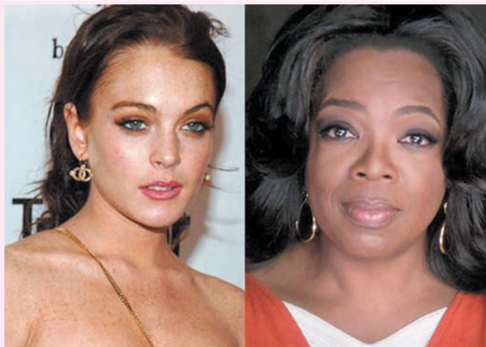
The actress recently completed a 90 day stint at a rehabilitation centre.