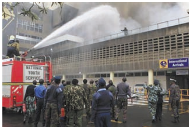
Fire fighters struggle to put out a fire at the Jomo Kenyatta International Airport in Kenya's capital Nairobi on 7 Aug, 2013.

The raging blaze engulfed the terminal buildings and lit up the early morning sky, sending billowing clouds of black smoke rising in a plume that was visible from miles away. The intense heat repeatedly drove back firefighters who battled for five hours to put out the fire, the worst on record at Jomo Kenyatta International Airport, east Africa's busiest.