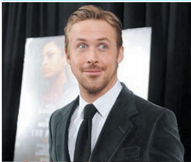
Ryan Gosling is reportedly a contender for Batman, who will be in his late 30s in Jack Snyder's project Batman vs Superman