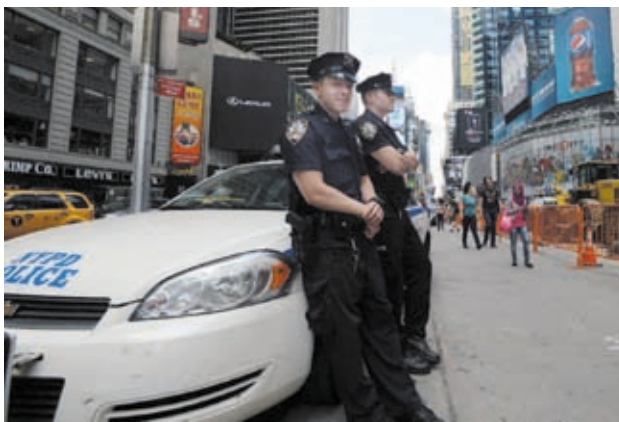
Two policemen stand guard at the Times Square in the New York City, on 7 Aug, 2013. US federal authorities are boosting security in the United States after a credible threat to overseas Western interests were detected and the government has extended the duration of shutdown for US diplomatic posts across the Middle East and North Africa until this weekend.

Local media reported that "an unknown male" made the phone call, but the information was not con-