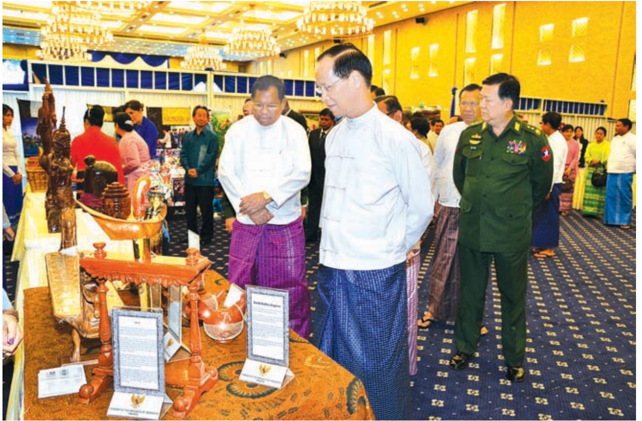
Vice-President Dr Sai Mauk Kham observes displays at the ceremony to mark the Forty-six Anniversary ASEAN Day at the Myanmar International Convention Centre (MICC).