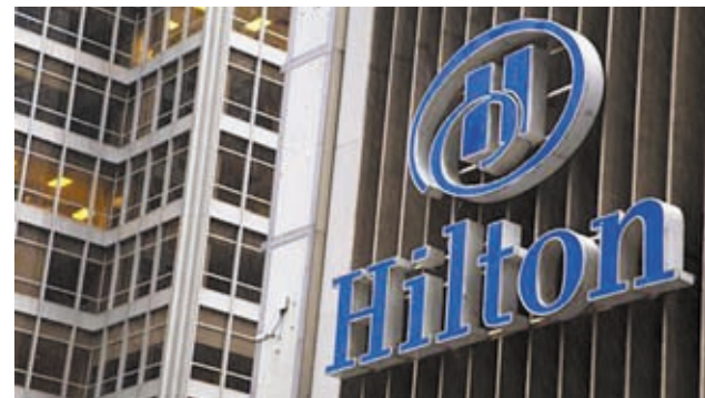
An exterior shot of the Hilton Midtown in New York on 7 June, 2013.