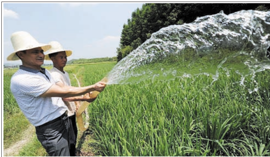
Farmers irrigate rice in the fields at Taihu Village of Xinyu City, east China's Jiangxi Province, on 7 Aug, 2013. A lingering drought since July has left about 150,000 people short of drinking water in the province.—XINHUA

The investigation is still underway.—Xinhua