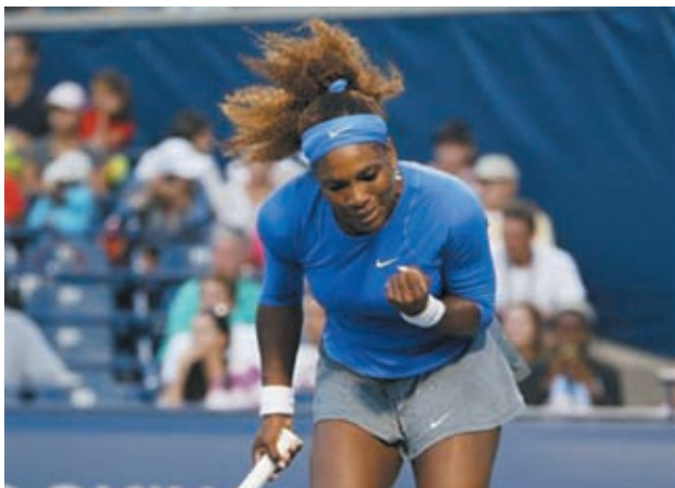
Serena Williams of the US reacts against Francesca Schiavone of Italy during their women's singles match of the Rogers Cup tennis tournament in Toronto, on 7 Aug, 2013.

TORONTO, 8 Aug—Top ranked Serena Williams made a successful return to hard courts with a 6-3, 6-2 thrashing of former French Open champion Francesca Schiavone in the second round of the Rogers Cup on Wednesday.