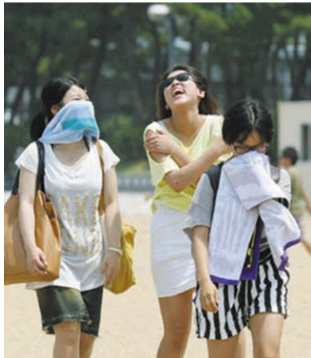
Women walk in scorching sunshine in the city of Fukuoka, southwestern Japan, on 7 Aug, 2013, as temperatures soared across the country.—KYODO NEWS

TOKYO, 8 Aug — Temperatures soared across Japan on Wednesday, climbing as high as 38.6 °C in the southwestern prefecture of Kochi, according to the Japan Meteorological Agency. The town of Shimanto in Kochi recorded the highest temperature of the day, while parts of Yamanashi, Ehime, Gifu, Miyazaki and Okinawa prefectures also saw temperatures above 36 °C.