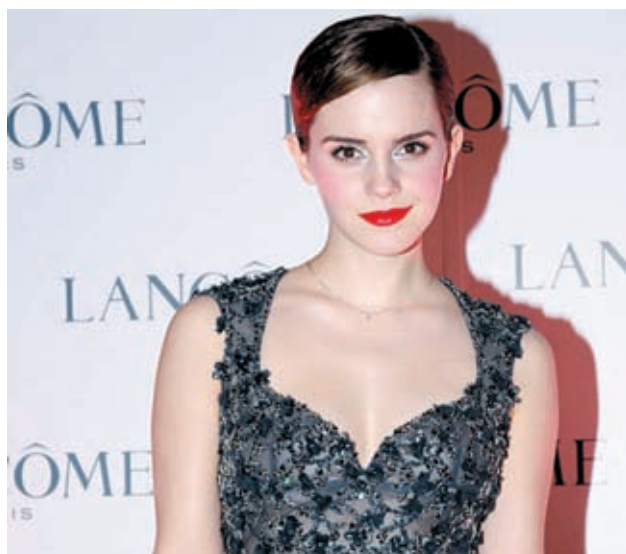
The actress was unsure about her movie career after the Harry Potter franchise.

"It gave me a sense of paralysis and stage fright for a while. And then a professor told me that they didn't think I should act, either. So I was really grappling with it and wasn't feeling good about it. And then, I don't know... it got so bad and people had put me in a box so much that it started pissing me off. I suddenly wanted to prove