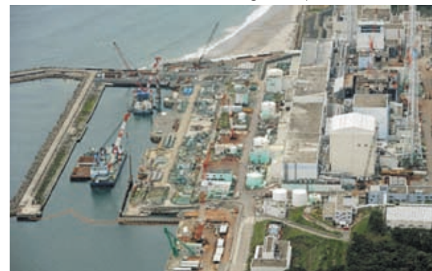
Photo taken from a Kyodo News helicopter over the town of Okuma, Fukushima Prefecture, shows the Fukushima Daiichi Nuclear Power Station on 9 July, 2013.