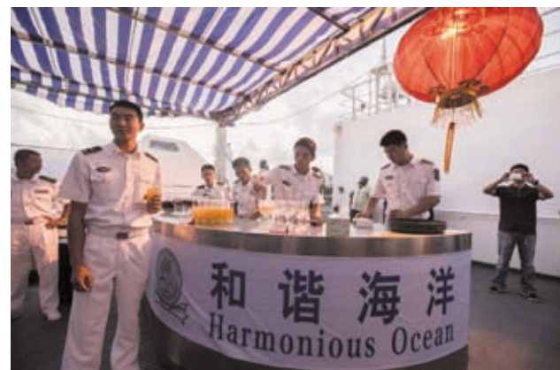
Crew members prepare for the onboard reception of the "Peace Ark" hospital ship at Mumbai Port in India, on 7 Aug, 2013. An onboard reception was held at China People's Liberation Army (PLA) hospital ship "Peace Ark" on Wednesday evening in Mumbai.