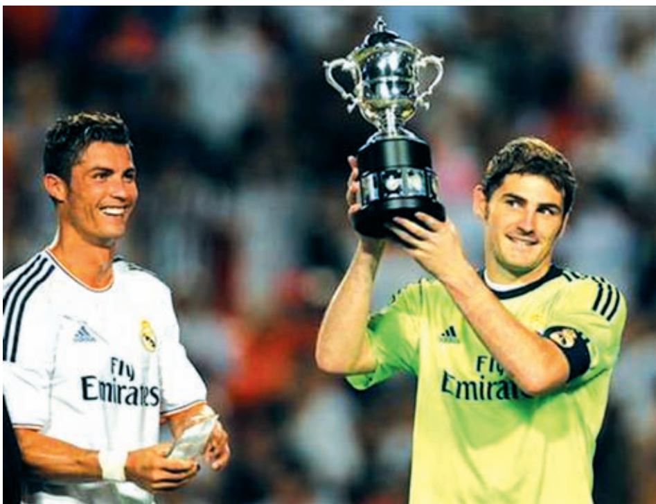
Real Madrid's Iker Casillas (R) hoists the winning trophy next to teammate Cristiano Ronaldo, holding the "Man of the Match" trophy, after their victory over Chelsea in their Guinness International Champions final soccer match in Miami Gardens, Florida on 7 Aug, 2013.