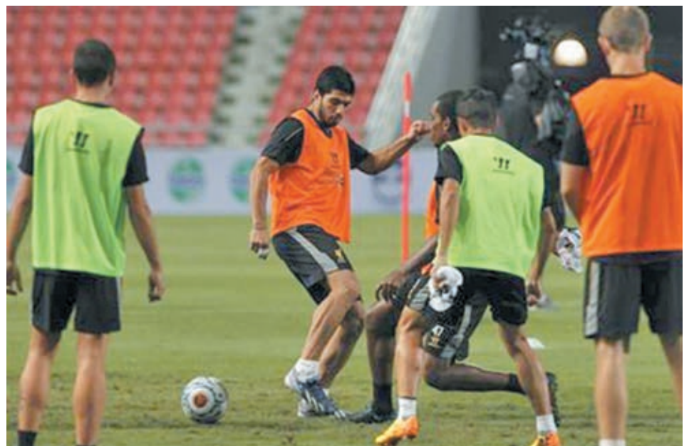
Liverpool's player Luis Suarez (2nd L) controls a ball during a practice session ahead of Sunday's soccer friendly against Thailand's national team, as part of Liverpool's Asia tour, in Bangkok on 27 July, 2013.

jury, said he might even approach the Premier League.