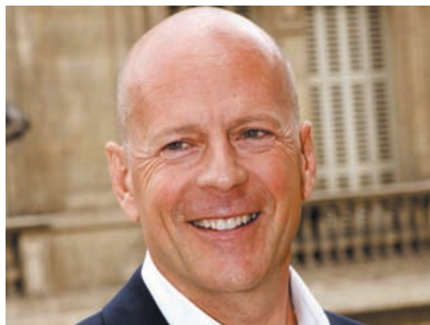
The actor is known for action movies such as the Die Hard series.

"I do let the stuntmen take over. I don't do that many stunts. I would do the stunts if I could but I'm not allowed to ever, ever - they hurt. I wouldn't mind being hurt. I mean, I get hurt all the time, but I'll get scolded (by my wife if I do them)," said Willis.—PTI