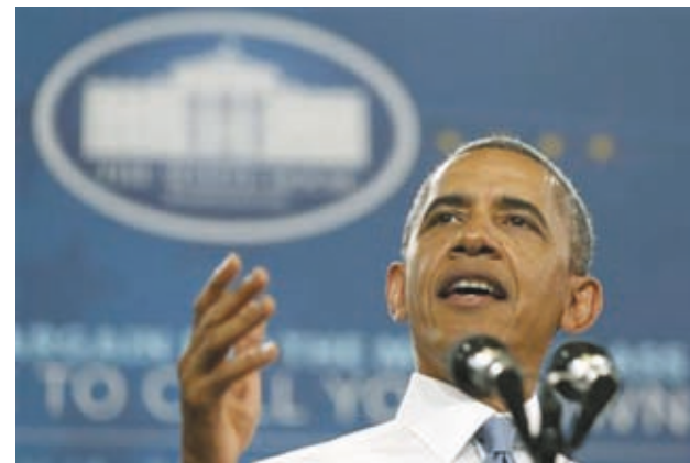
President Barack Obama speaks about home ownership at Desert Vista High School in Phoenix, Arizona on 6 Aug, 2013.

porary asylum to Edward Snowden last week, rejecting US pleas to expel him and letting the former spy agency contractor slip out of a Moscow airport after more than five weeks in limbo there.