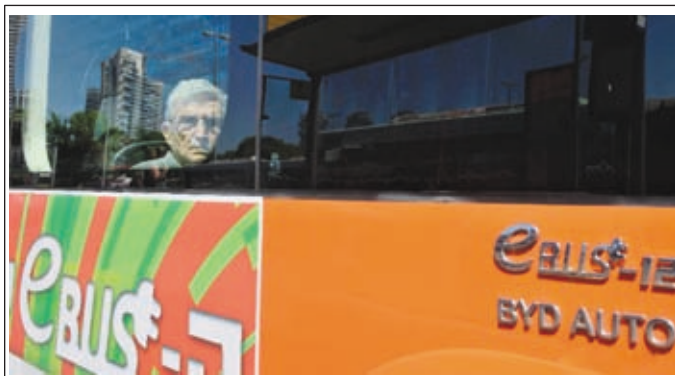
Passengers board Israeli Dan bus company's first electric bus at a bus station in Tel Aviv on 6 Aug, 2013. Israeli Dan bus company on Monday inaugurated the country's first electric bus service in cooperation with China's BYD automaker.