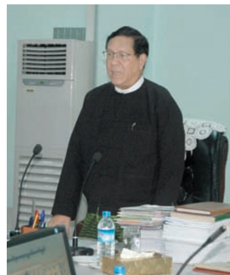
Chief Justice of the Union U Tun Tun Oo addresses coordination meeting between Supreme Court of the Union and high courts. MNA