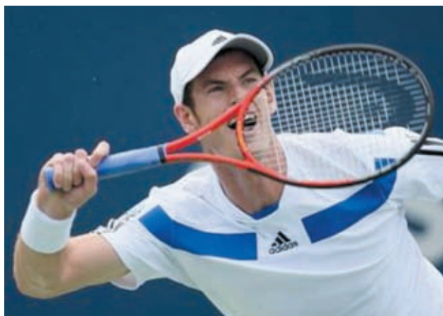
Andy Murray of Britain hits a return to Marcel Granollers of Spain at the Rogers Cup tennis tournament in Montreal, on 7 Aug, 2013.

ter their match was one of a number interrupted by heavy evening rain that sent the players and fans scamp-ering for cover as daylight fell.