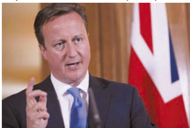
Britain's Prime Minister David Cameron answers a question during a joint news conference with Italy's Prime Minister Enrico Letta in 10 Downing Street in central London on 17 July, 2013.