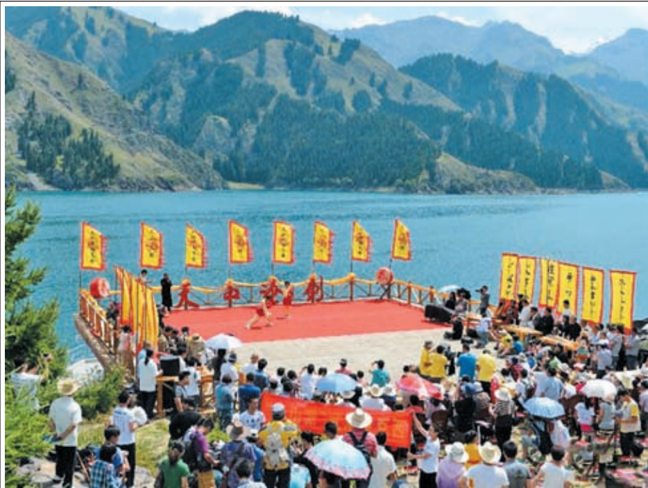
Tourists watch the performance during a martial arts festival at the Tianshan Mountain scenic area in Fukang City, northwest China's Xinjiang Uygur Autonomous Region, on 7 Aug, 2013.—XINHUA