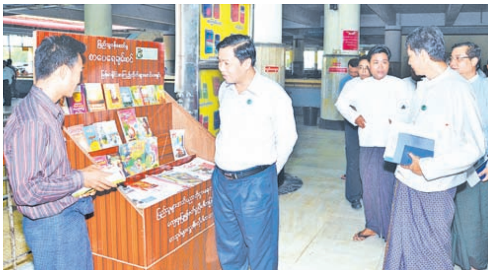
Deputy Minister for Information U Paik Htwe visits a mini book corner.

MANDALAY, 8 Aug—Information and Public Relations Department is opening book corners and mini book corners in various public places to keep the books within readers' reach.