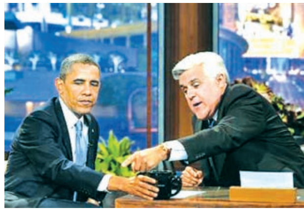
US President Barack Obama sits next to Jay Leno during the taping of "The Tonight Show with Jay Leno" comedy show at the NBC Studios in Burbank, California, on 6 Aug, 2013.

The US State Department issued a worldwide travel alert on Friday warning Americans that al-Qaeda may be planning attacks in August, particularly in the Middle East