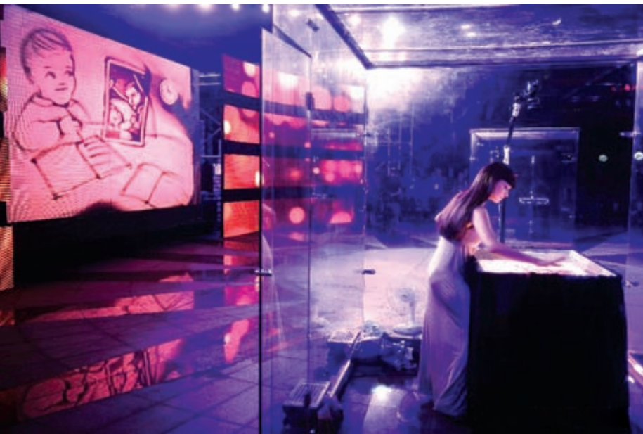
Kseniya Simonova, a famous painting artist from Ukraine, makes a sand painting during the 2013 Zhoushan Sand Painting Competition in Zhoushan, east China's Zhejiang Province, on 5 Aug, 2013. Five Chinese artists entered the final competition, which kicked off on Monday, to challenge Kseniya Simonova, a famous sand painting artist from Ukraine.