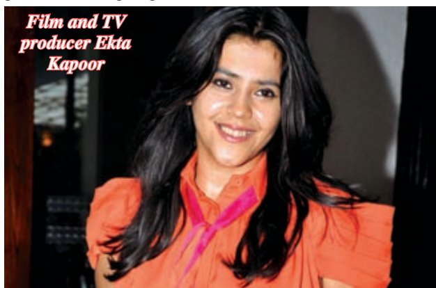
Film and TV producer Ekta Kapoor