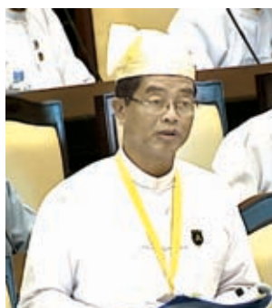
Deputy Minister for Immigration and Population U Kyaw Kyaw Win responds to the questions.—MNA

Deputy Minister for Immigration and Population U Kyaw Kyaw Win responded to the question raised by U Paul Htan Htai of Chin State Constituency No (3) that directives on issuance of citizenship scrutiny cards for the children of Youth Development Centres, household certificates, transfer form (10) of service personnel and household form (6/66) were being issued for the convenience