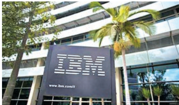
The IBM logo is seen outside the company's offices in Petah Tikva, near Tel Aviv on 24 Oct, 2011.

the chips for cloud data centres. The hardware and software, previously proprietary to IBM, will be available to open development and it