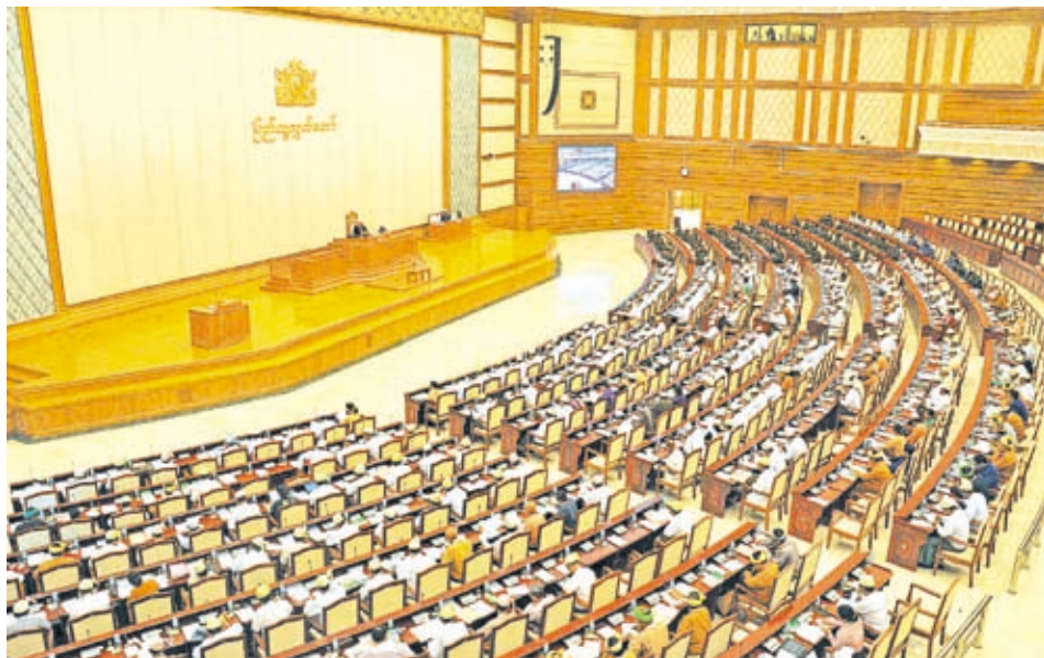
Today's session of Pyithu Hluttaw in progress.—MNA

Promotion Bill is aimed at helping the farmers to get agricultural loans at reasonable interest rate, get technical assistance and inputs to be able to transform the conventional farming to mechanized farming system, getting market and reasonable price for their products and promoting the rights of small farmers.