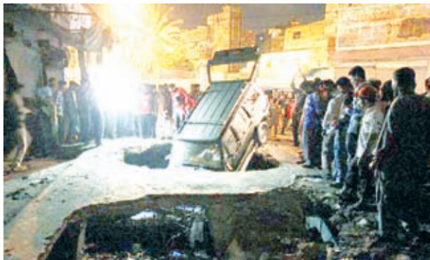
Rescuers work beside a damaged vehicle at the blast site in southern Pakistani port city of Karachi, on 7 Aug, 2013. At least 11 children were killed and 24 others injured when a blast hit a football ground in Karachi Wednesday morning, reported local Urdu TV channel Geo.

ISLAMABAD, 7 Aug — At least 11 children were killed and 24 others injured when a blast hit a football ground in Pakistan's southern port city of Karachi early Wednesday morning, reported local Urdu TV channel Geo.