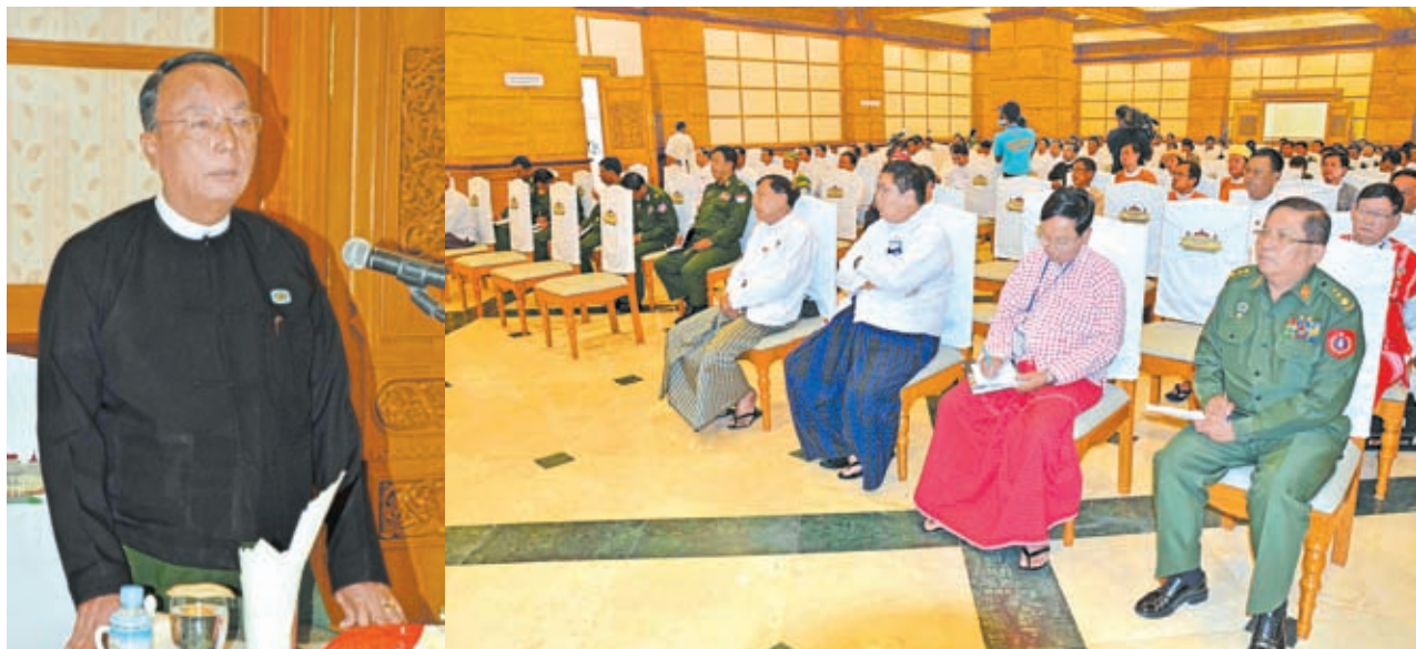
Speaker of Amyotha Hluttaw U Khin Aung Myint delivering address at Debate on AFPFL and Panglong Conference.

NAY PYI TAW, 7 Aug— Speaker of Amyotha Hluttaw U Khin Aung Myint delivered an address at the Debate on AFPFL and Panglong Conference at the assembly hall of the Amyotha Hluttaw Complex, here, this morning.