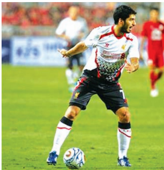
Liverpool's Luis Suarez controls the ball against Thailand's national soccer team during a friendly soccer match at Ratchamangkala Stadium in Bangkok on 28 July, 2013.

LONDON, 7 Aug—Liverpool striker Luis Suarez has called on the club to honour "an agreement" that said he could leave the club if they failed to qualify for the Champions League.