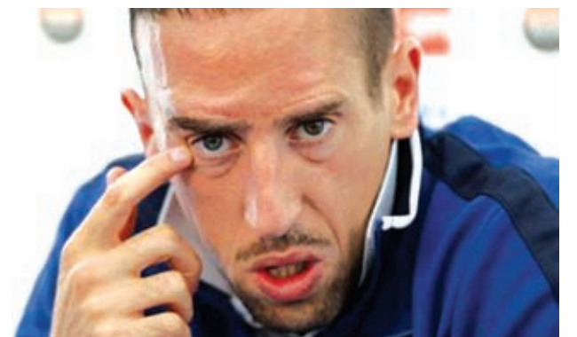
French soccer player Franck Ribery answers reporters' questions during a news conference in Clairefontaine, southern Paris on 29 Aug, 2011.

ciations in a live poll on 29 August at the Champions League group stage draw in Monaco.—Reuters