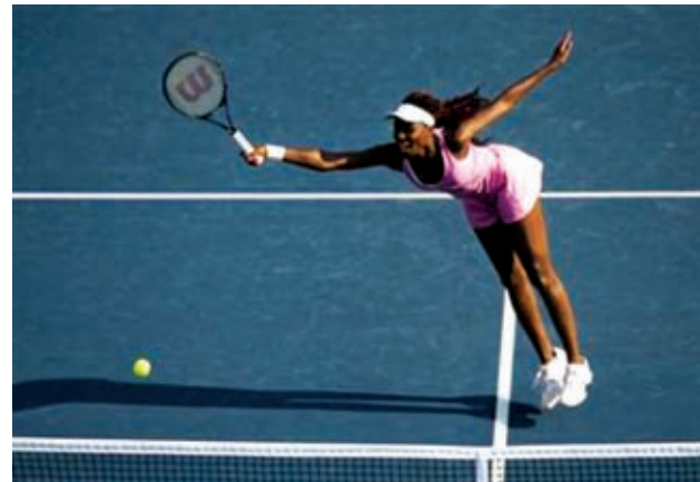
Venus Williams of the US reaches for a shot against Kirsten Flipkens of Belgium during their women's tennis match at the Rogers Cup tennis tournament in Toronto on 6 Aug, 2013.

Cibulkova, who won the Stanford title late last month, needed nearly three hours to overcome German Kerber, fighting back from 1-4 down in the third set to seal victory.