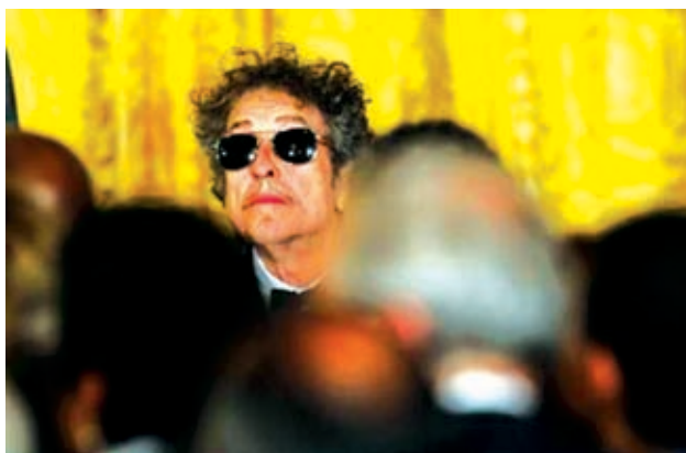
Musician Bob Dylan (C) waits prior to receiving a Presidential Medal of Freedom in the East Room of the White House in Washington, on 29 May, 2012.

"It's true and I also keep roza (fast) some times. The iftaar party is on 6 August. It's a big night, it's