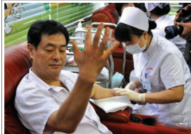
Famous Chinese actor Pu Cunxin, also a voluntary blood donation promotion Ambassador for the Ministry of Health, celebrates his 60th birthday in advance together with 59 voluntary blood donors at a blood donation point in Xidan, Beijing, on 27 July, 2013. It's Pu's 11th and last blood donation since starting out in 2001, as it's now advocated that blood donors should be below 60. Pu, who donated 400ml this time, turns 60 on 31 July.