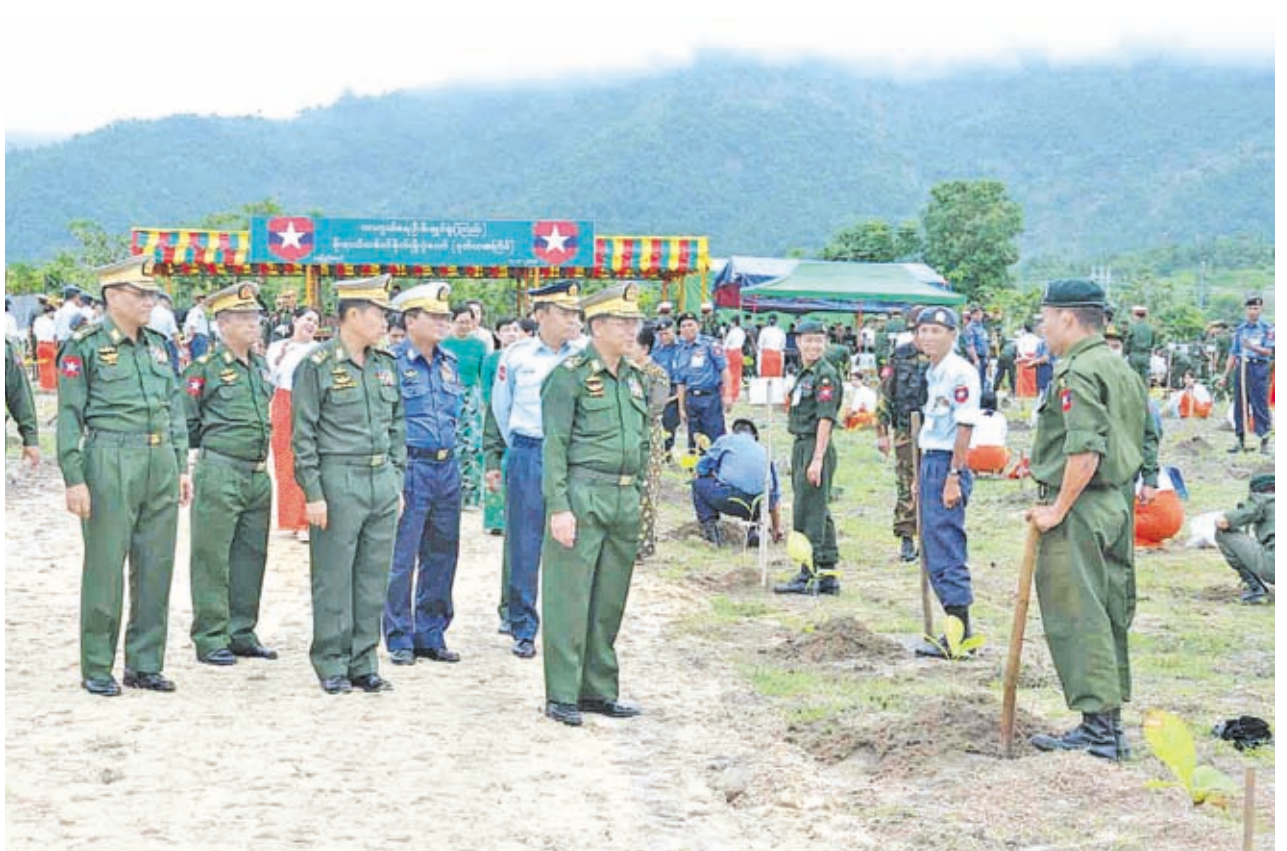
Senior General Min Aung Hlaing and wife Daw Kyu Kyu Hla view servicemen who participated in monsoon tree growing ceremony.