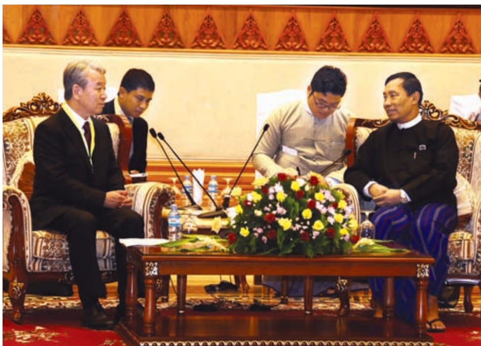
Pyithu Hluttaw Speaker Thura U Shwe Mann receives Chairman of Japan International Cooperation Agency (JICA) Mr Akihiko TANAKA.

NAY PYI TAW, 7 Aug— Speaker of Pyithu Hluttaw Thura U Shwe Mann received Chairman of Japan International Cooperation Agency (JICA) Mr Akihiko TANAKA and party at the Zabuthiri hall of Hluttaw Building, here, at 5pm today.