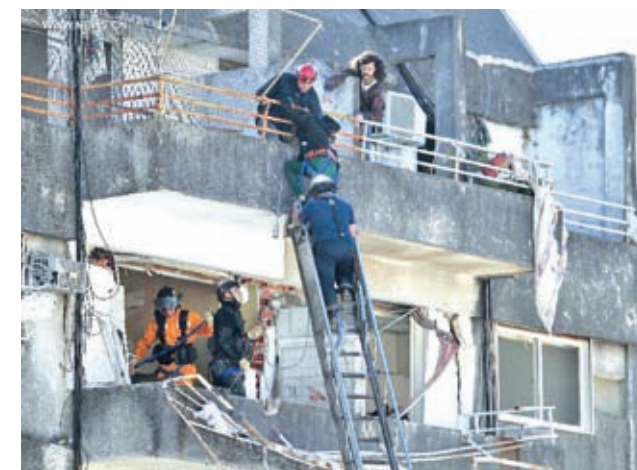
Firemen work at the site of a blast at a building in the city of Rosario, Province of Santa Fe, about 300 km near Buenos Aires, capital of Argentina, on 6 Aug, 2013.

Antonio Bonfatti, governor of Santa Fe Province where Rosario is located, visited the area and described the scene around the