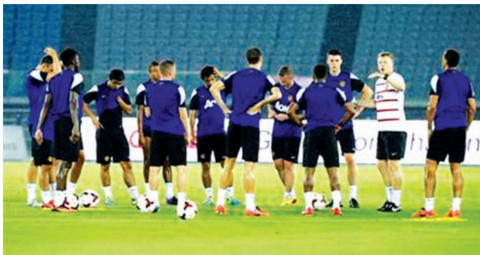
Manchester United manager David Moyes speaks to his players during a training session ahead of their friendly soccer match against Yokohama F Marinos in Yokohama, south of Tokyo on 22 July, 2013.