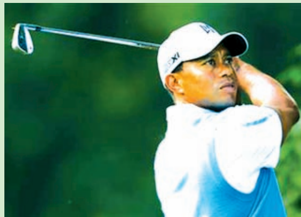
Tiger Woods of the US watches his shot from the 15th tee during a practice round for the 2013 PGA Championship golf tournament at Oak Hill Country Club in Rochester, New York on 6 Aug, 2013.