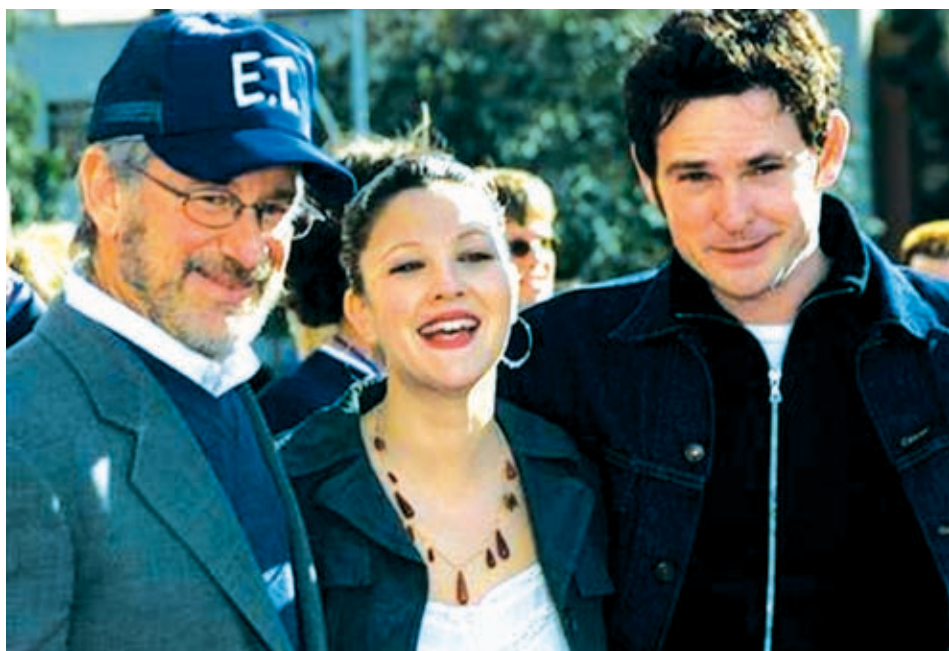
Director Steven Spielberg and cast members Drew Barrymore and Henry Thomas (R) pose together as they arrive for the premiere of the 20th anniversary version of their film "ET The Extra Terrestrial" on 16 March, 2002 in Los Angeles.