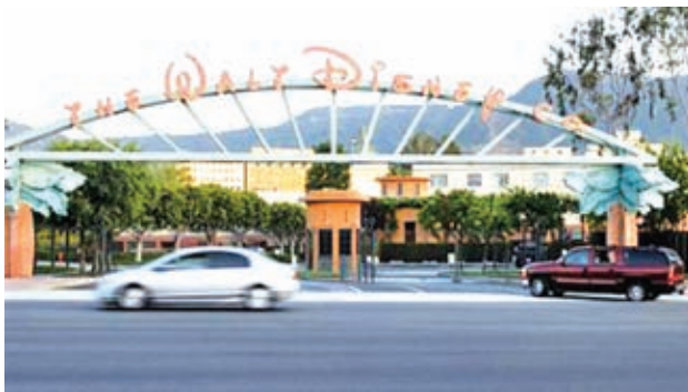
The signage at the main gate of The Walt Disney Co is pictured in Burbank, California.