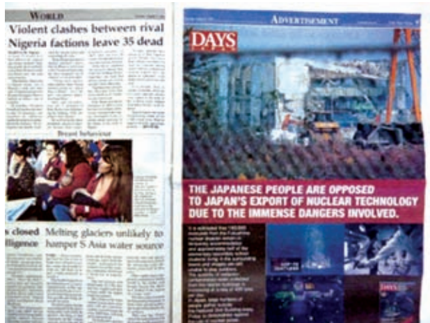
Photo shows an opinion ad (R) objecting to planned nuclear reactor exports by Japan, published on 6 Aug, 2013, by Vietnam's state-run English-language daily Viet Nam News.

HANOI, 7 Aug — Vietnam's state-run English-language daily Viet Nam News published an opinion ad on Tuesday objecting to planned nuclear reactor exports by