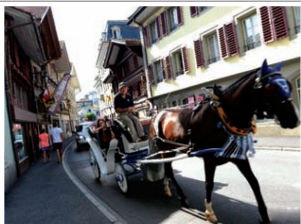
Guests take a carriage ride in Interlaken, Switzerland, 5 Aug, 2013. Interlaken lies between Lake Thun and Lake Brienz, and at the foot of the snow-clad Eiger, and is the starting point for excursions into the Jungfrau Region and the whole of Switzerland. It has been a holiday destination for guests from all over the world for over 100 years.