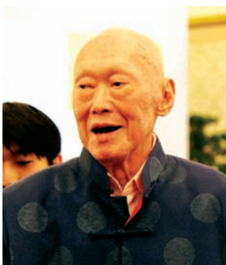
Singapore's former Prime Minister Lee Kuan Yew attends a ceremony in Singapore on 6 Aug, 2013, marking the publishing of his book "One Man's View of the World."

But he praised the Japanese for being able to maintain a sense of "calm, order