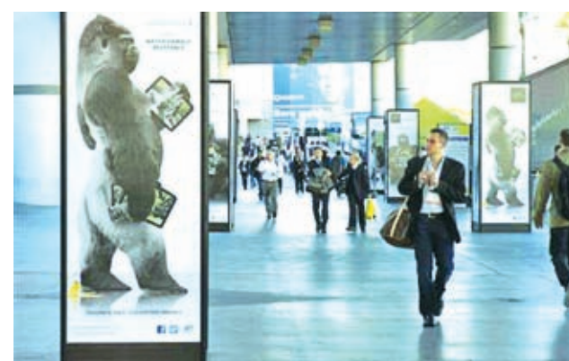
A man walks by an advertisement for Corning Gorilla Glass 3 outside the Las Vegas Convention Centre on the first day of the Consumer Electronics Show/Files CES in Las Vegas in this file photo from 8 Jan, 2013.