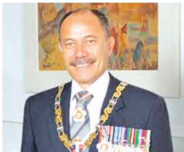
New Zealand Governor-General Jerry Mateparae

"Southeast Asia is one of the world's most dynamic economic growth areas and ASEAN of which Vietnam, Cambodia and Laos