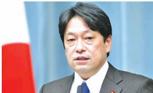
Japanese Defence Minister Itsunori Onodera

While saying such forum may not be established overnight, the minister said "it is important for Japan to take the lead" in making such proposal. —Kyodo News