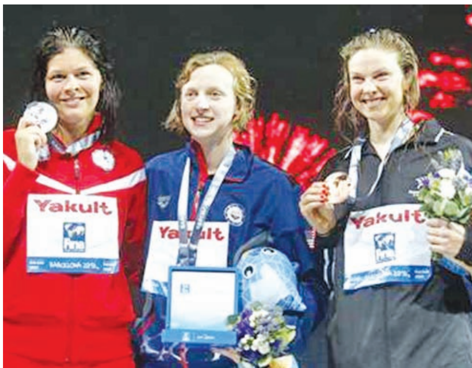
Gold medalist Katie Ledecky of the US (C) poses with other medalists at the women's 1500m freestyle victory ceremony during the World Swimming Championships at the Sant Jordi arena in Barcelona on 30 July, 2013.