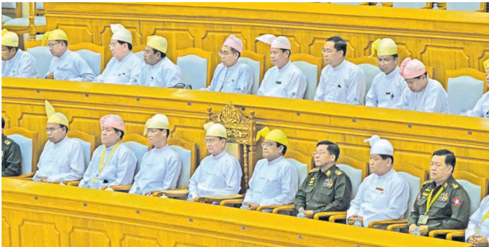
President U Thein Sein seen together with the Vice-Presidents and head of states at today's Pyidaungsu Hluttaw Session.