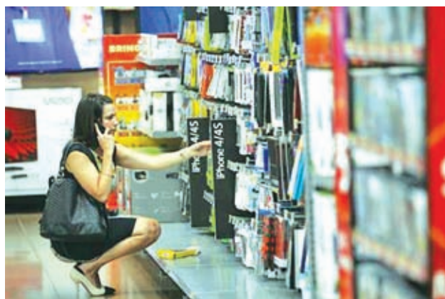
A woman shops at a Walmart Supercentre in Rogers, Arkansas on 6 June, 2013.

The report was shy of economists' expectations for the index to hold steady at June's original reading of 81.4. The expectations index dropped to 84.7 from 91.1.