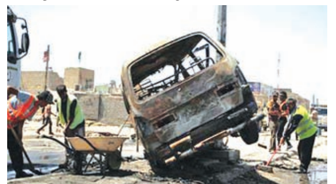
Street cleaners remove debris on the road at the site of a car bomb attack in Basra, 420 km (260 miles) southeast of Baghdad, on 29 July, 2013.