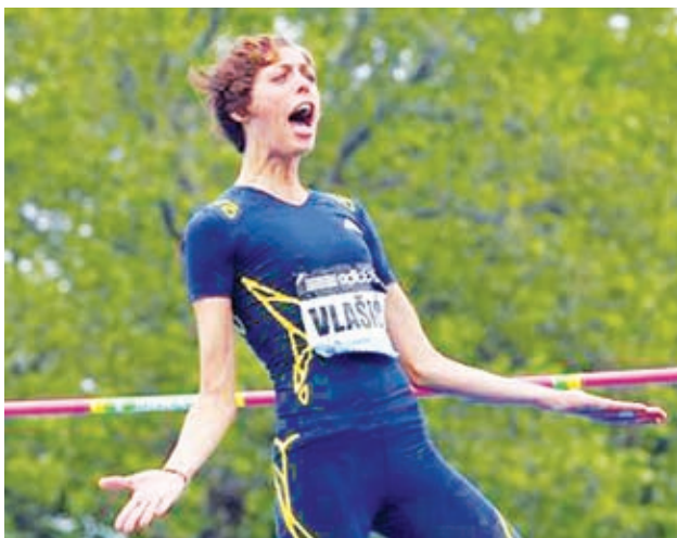
Blanka Vlasic of Croatia celebrates clearing the bar at 1.91 meters on her way to winning the women's high jump at the Diamond League Adidas Grand Prix in New York, on 25 May, 2013.

The world championships run from 10-18 August.—Reuters