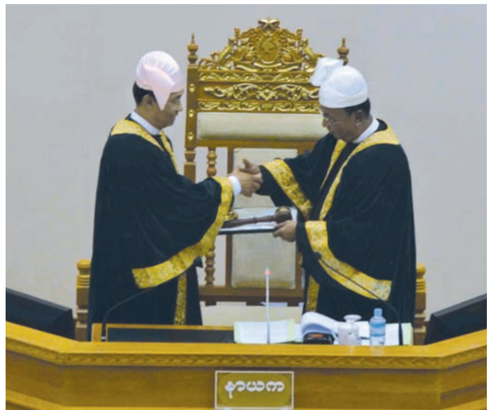
Speaker of Pyithu Hluttaw Thura U Shwe Mann and Speaker of Amyotha Hluttaw U Khin Aung Myint hand over duties of Speaker of Pyidaungsu Hluttaw.

That's why, the legislative body has formulated the laws capable of safeguarding the interest of the State and the people. The aim of the laws is to bring about