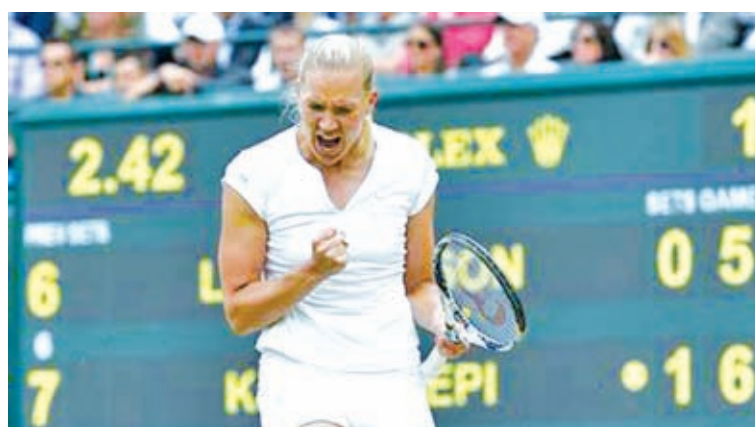
Kaia Kanepi of Estonia celebrates after defeating Laura Robson of Britain in their women's singles tennis match at the Wimbledon Tennis Championships, in London on 1 July, 2013.