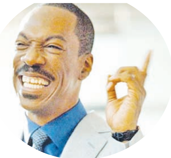
Eddie Murphy’s performance as Axel Foley in the first installment of the Beverly Hills Cop series earned him a Golden Globe nomination.