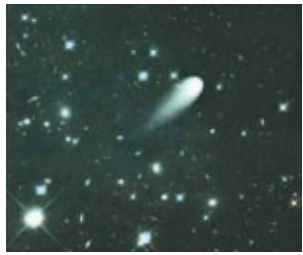
The sun-approaching Comet ISON floats against a seemingly infinite backdrop of numerous galaxies and a handful of foreground stars in this April 2013 composite image from the Hubble Telescope.

CAPE CANAVERAL, 31 July—Astronomers slated to meet this week to discuss observing plans for Comet ISON may not have much to talk about. The so-called "Comet of the Century" may already have fizzled out.