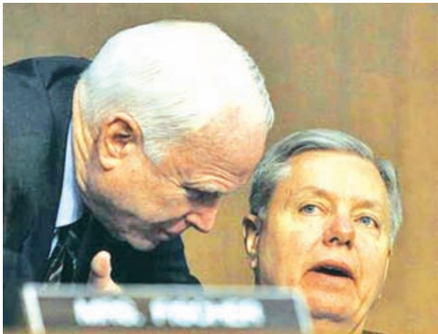
Senators John McCain (R-AZ) (L) and Lindsey Graham (R-SC) (R) confer at the Senate Armed Services Committee in Washington on 5 March, 2013.

WASHINGTON, 31 July —President Barack Obama has asked two senior Republican senators to travel to Egypt to meet with its military leaders and the opposition, as Cairo's allies struggle with how to address the turmoil convulsing the country.