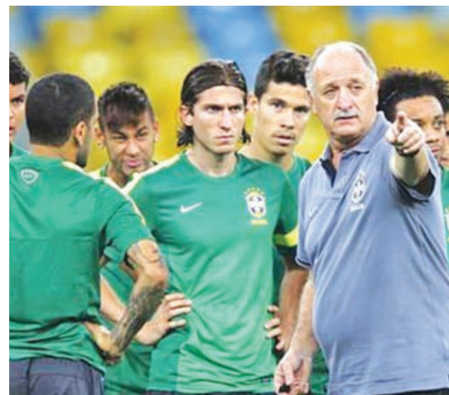
Brazil's head coach Luis Felipe Scolari (front R) gestures in front of his players during a training session in Rio de Janeiro on 29 June, 2013.

Midfielders: Fernando (Shakhtar Donetsk), Hernanes (Lazio), Luiz Gustavo (Bayern Munich), Paulinho (Tottenham Hot-