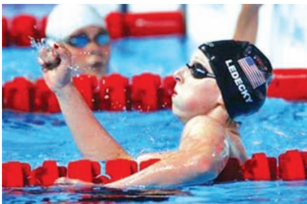
Katie Ledecky of the US celebrates after setting a new world record to win the women's 1500m freestyle final during the World Swimming Championships at the Sant Jordi arena in Barcelona on 30 July, 2013.—REUTERS

"I had to be careful not to push it too early or push it too late and just touch the wall first."—Reuters