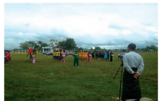
The opening ceremony of village football tournament in progress.