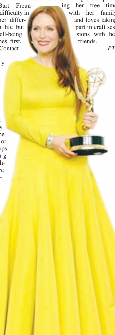
The actress finds it difficult to balance her personal and professional life.

“My life is a constant juggling act and it’s challenging. I don’t think any parent completely avoids the guilt trap or ever stops worrying about whether they’re doing everything perfectly,” said