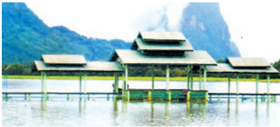
TOURIST SPOT UNDER WATER: Famous Kanthaya Lake bridge the major tourist attraction in Hpa-an of Kayin State was inundated on 29 July as Thanlwin River reached danger water level. After days of heavy rains, various parts of Kayin State are subject to flash flood.