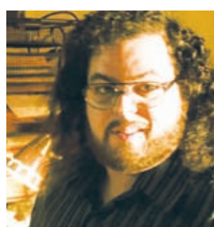
Josh Gad portrays the role of Steve Wozniak in the film.

JOBS is a forthcoming biopic on late Steve Jobs, co-founder of Apple. He died of pancreatic cancer in October 2011 at the age of