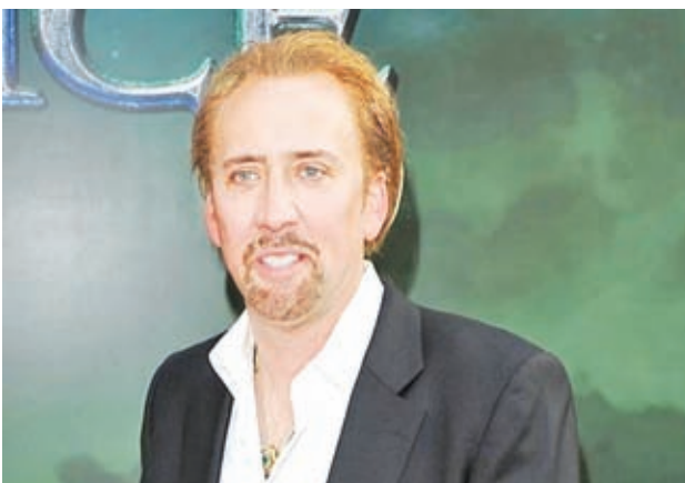
The actor is thankful to his acting career for saving him from his anger.

“I have learned to calm down. I have developed into a person who is