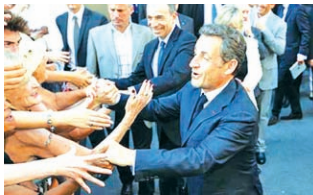
Former French President Nicolas Sarkozy and French UMP political party head Jean-Francois Cope (bottom) leave the UMP political party headquarters in Paris on 8 July, 2013.

unite his fractured opposition party and present voters with a compelling alternative to Hollande, whose 14 months in office have been marred by a sluggish economy and rising unemployment. French election auditors ruled this