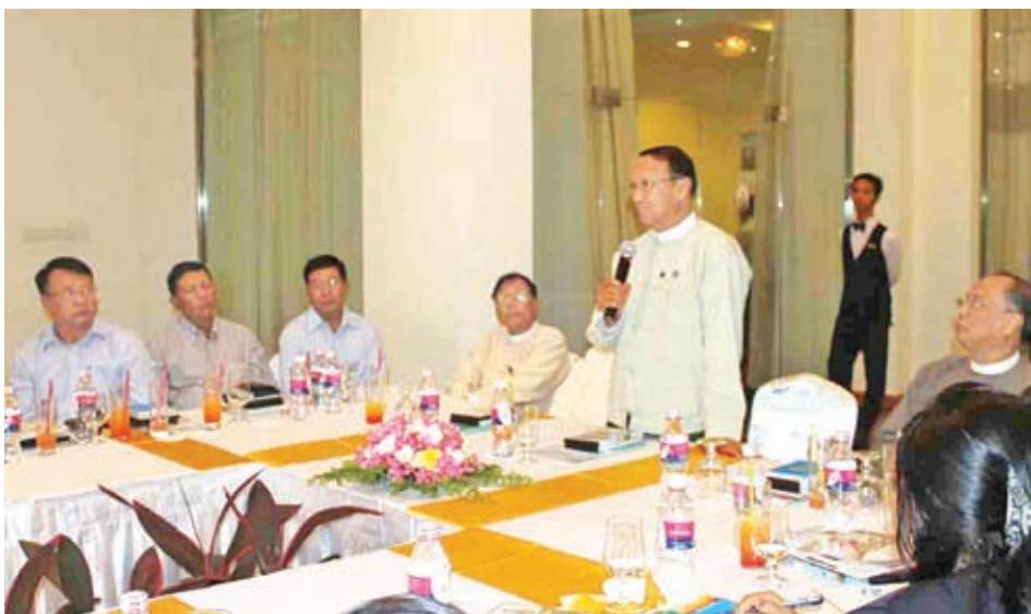
The meeting between MPs and partnership for disabled in progress.

NAY PYI TAW, 31 July—MPs and partnership for the disabled met at Sky Palace Hotel here yesterday evening.