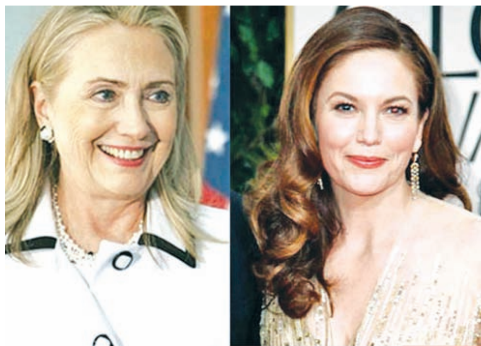
Diane Lane will play the lead role in Hillary which will focus on all aspects of Hillary Clinton’s life.