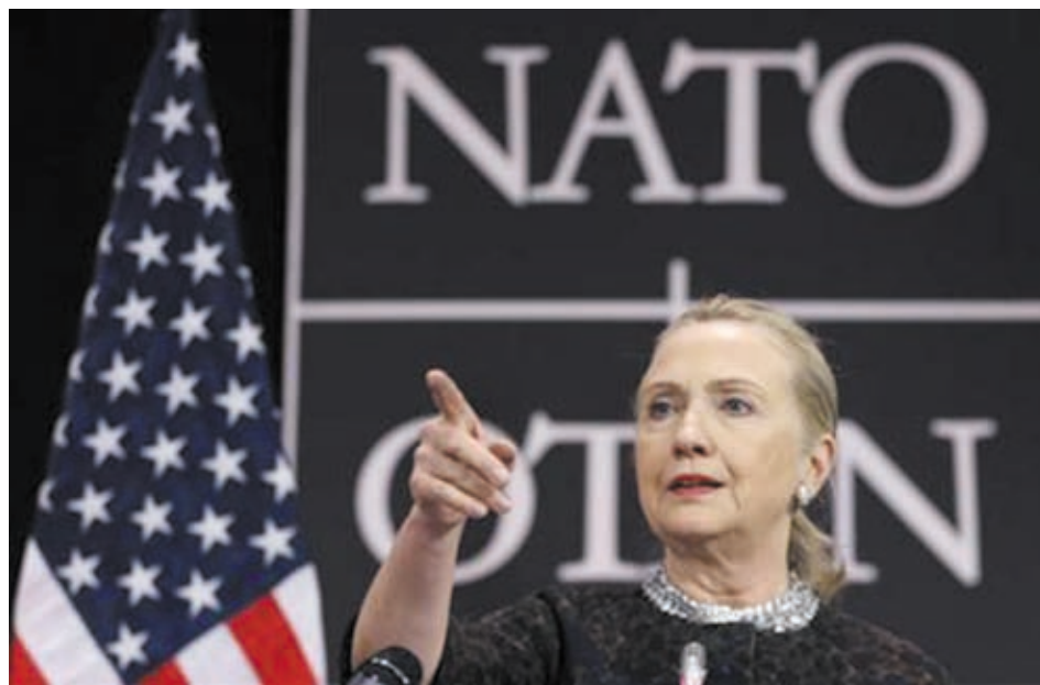
US Secretary of State Hillary Clinton gestures as she addresses a news conference during a NATO foreign ministers meeting at the Alliance headquarters in Brussels on 5 Dec, 2012.