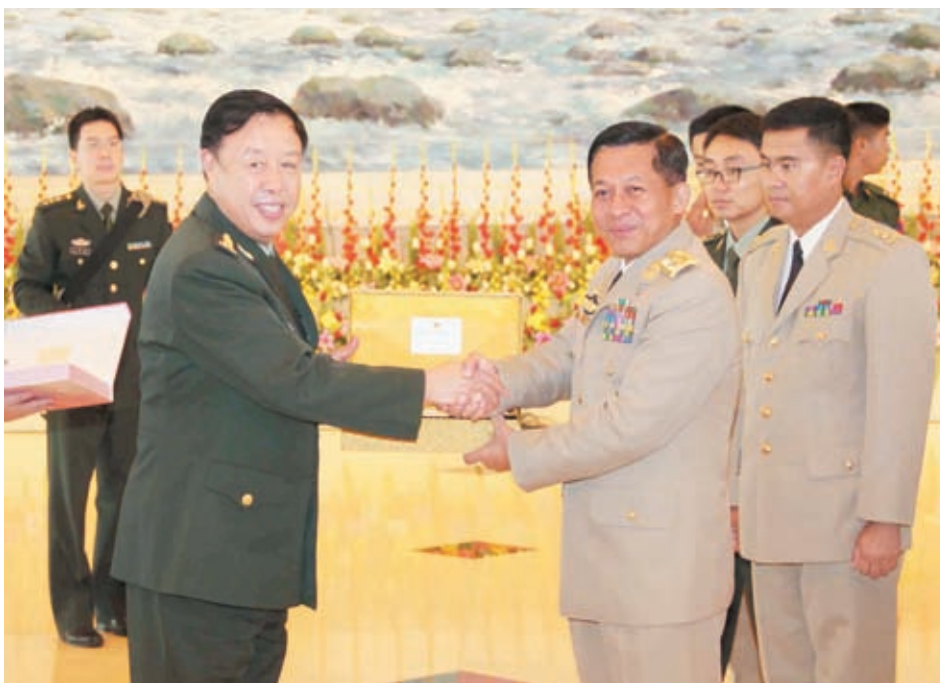
Commander-in-Chief of Defence Services Senior General Min Aung Hlaing cordially greets General Fan Changlong, Vice Chairman of the Central Military Commission-CMC of the People's Liberation Army (PLA) of PRC.

between the two Armed Forces in addition to the two governments, extending cordial relations with every global country without making any discrimination against East or West, and the implementations on the talks on further promotion of the comprehensive strategic partnership after the meeting between the two presidents.