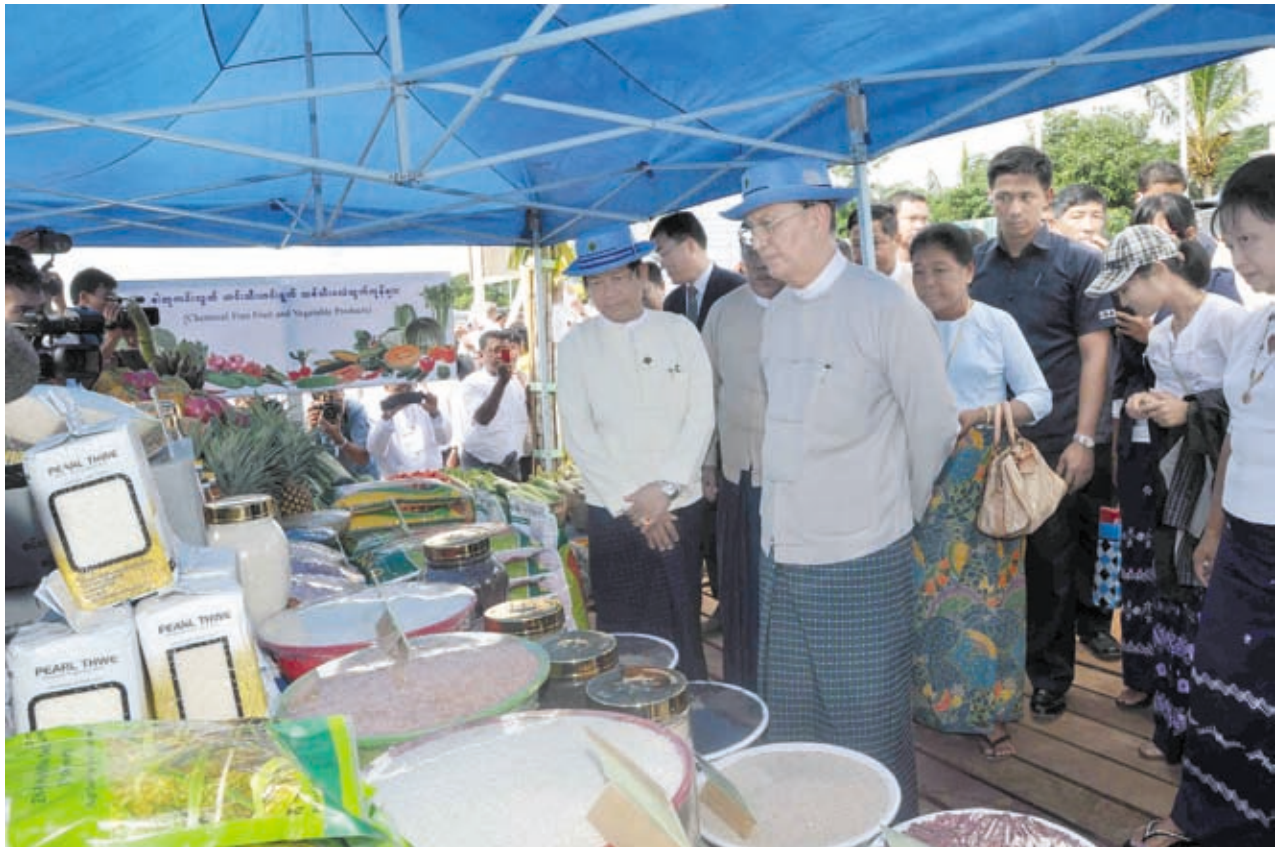
President U Thein Sein views organic fruits and vegetable and products displayed in Ahlyinlo Village in Pynmana Township.

He pointed out Myanmar agriculture produce are not marketable