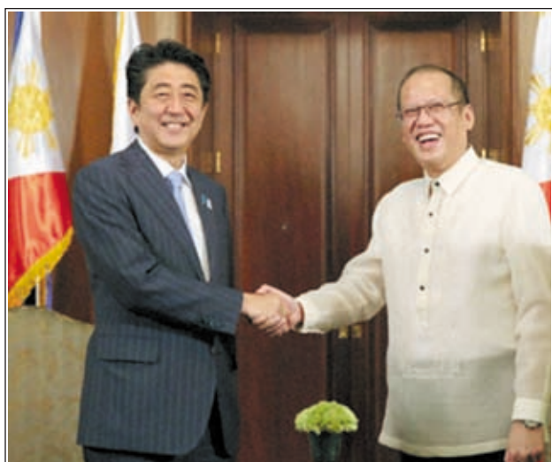
Japanese Prime Minister Shinzo Abe (L) and Philippine President Benigno Aquino shake hands at the start of their talks in Manila on 27 July, 2013.