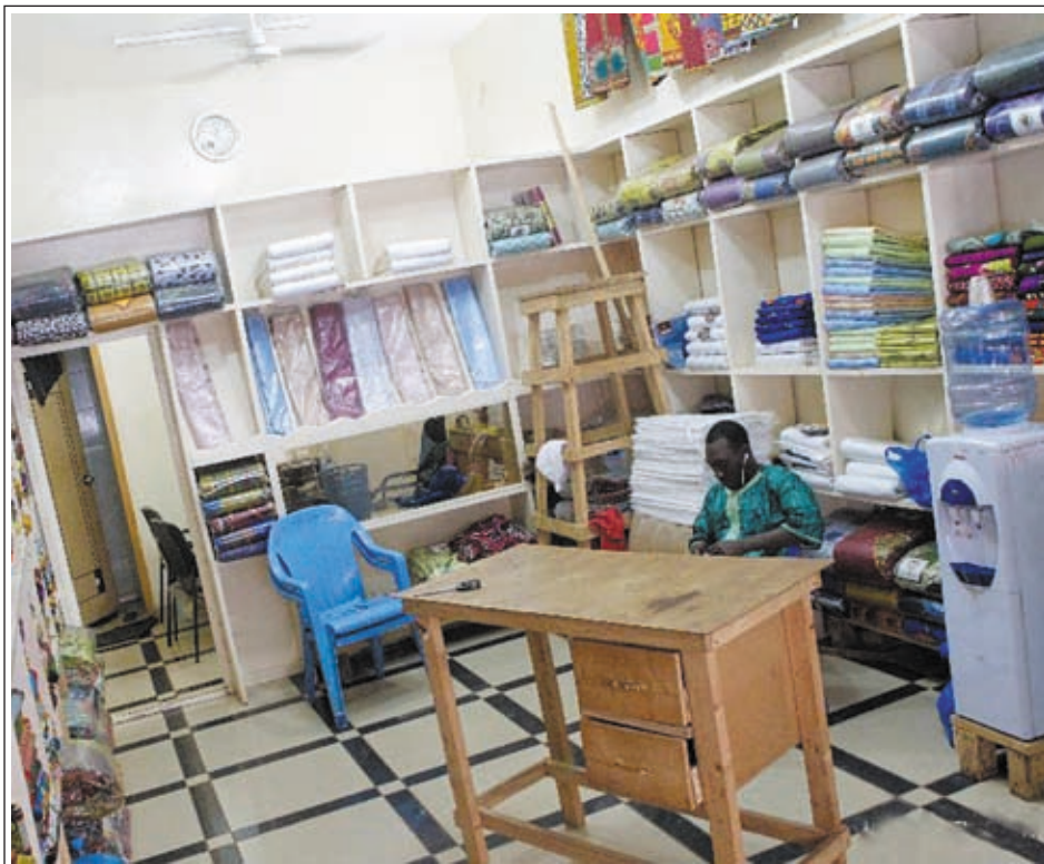
An employee waits for customers in a Chinese shop at Dibida market, Bamako, capital of Mali, on 27 July, 2013. According to incomplete statistic carried out after the 2012 coup d'etat of Mali, more than 500 Chinese run small shops, mostly selling made-in-China shoes and commodities, around Bamako and neighbouring regions.