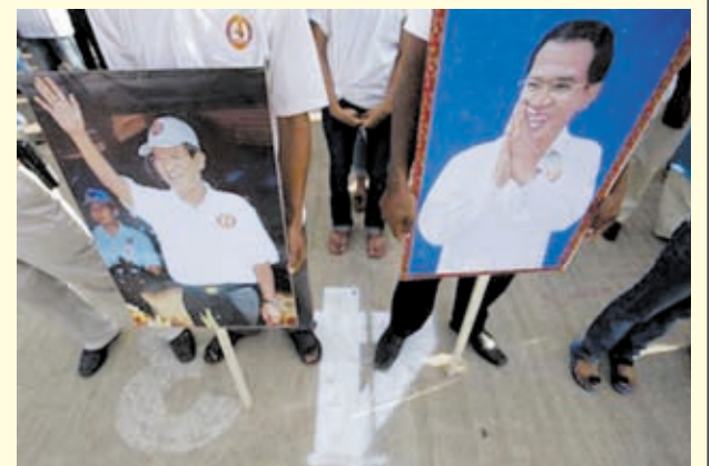
Supporters of the Cambodian People Party hold posters of Prime Minister Hun Sen during an election rally on the last day of campaigning in central Phnom Penh on 26 July, 2013.

Backed by a compliant media and with superior resources, the CPP was confident of victory, but analysts had said the recent merger of the two