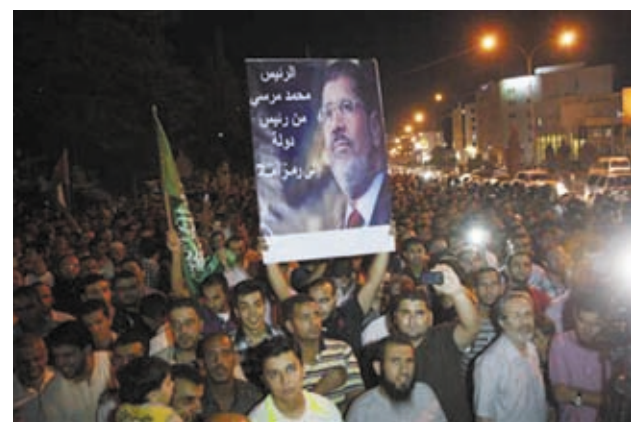
Islamists and members of the Egyptian community in Jordan shout slogans against Egyptian security forces and the ousting of Egyptian President Mohamed Mursi during a demonstration in Amman on 27 July, 2013.

US Defence Secretary Chuck Hagel spoke by tele-