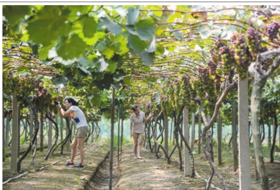
Tourists play in a vineyard in Changxing County of east China's Zhejiang Province, on 27 July, 2013. Changxing County, known as "Turpan of the South", covering a grape plantation area of 2,480 hectares, has entered harvest season recently.