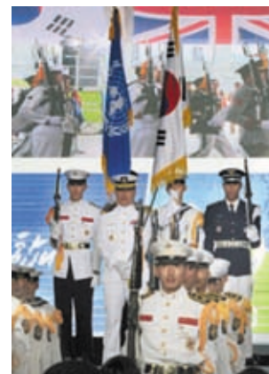
Photo taken on 27 July, 2013, shows South Korean soldiers at a ceremony in Seoul marking the 60th anniversary of the signing of the armistice agreement that halted the three-year Korean War.