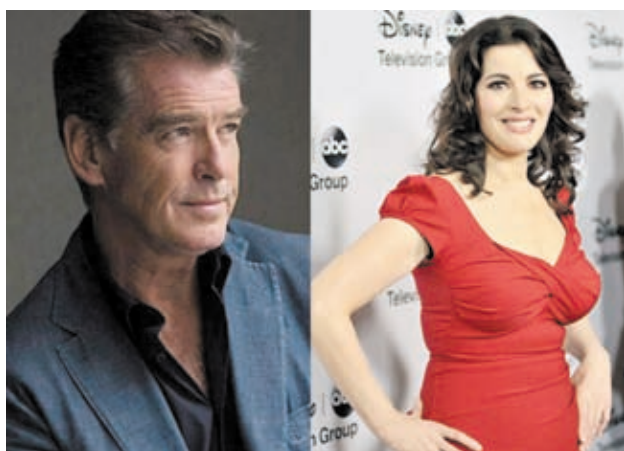
Pierce Brosnan and Nigella Lawson were sighted having a good time together.