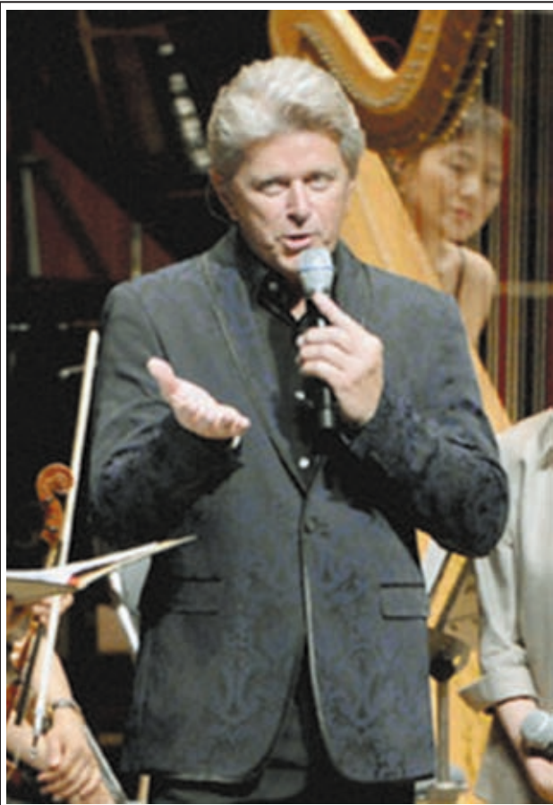
Veteran American singer Peter Cetera speaks about peace during the World Peace Concert in Hiroshima, western Japan, on 27 July, 2013.

Libya's Prime Minister Ali Zeidan (C) speaks during a joint news conference at the headquarters of the Prime Minister's Office in Tripoli on 31 March, 2013.