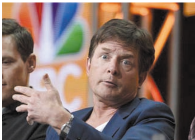
Executive producer and cast member Michael J Fox participates in a panel for "The Michael J Fox Show" during the NBC sessions at the Television Critics Association summer Press tour in Beverly Hills, California on 27 July, 2013.

The Canadian-born Fox won over audiences in the 1980s for his role as conservative Alex P. Keaton on NBC sitcom "Family Ties," and as teen adventurer Marty McFly in the "Back to the Future" movies. He later starred in the ABC political comedy "Spin City," but semi-retired from acting in 2000 as his Parkinson's symptoms worsened and he focused his efforts on research for a cure.