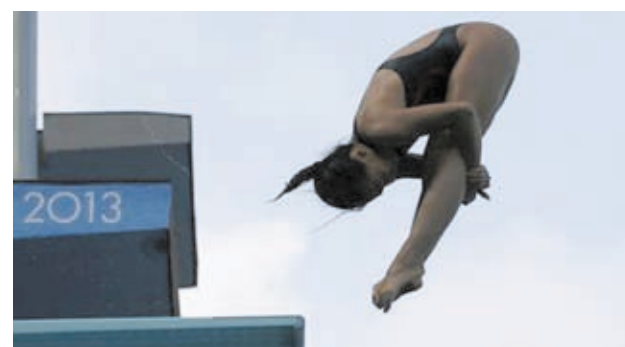
China's He Zi performs a dive at the women's 3m springboard final during the World Swimming Championships at the Montjuic municipal pool in Barcelona on 27 July, 2013.

and 2009, with Wu, champion in Saturday's three-meter springboard synchro with Shi Tingmao, triumphing in Shanghai two years ago. He said it is too early to talk about taking over as the dominant force in her events.