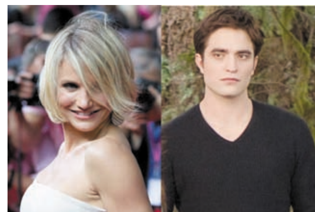
Cameron Diaz reportedly finds Robert Pattinson "hot".

Diaz recently received an invite from actress Reese Witherspoon for wine-tasting at her residence, and ever since she got to know that Pattinson would be present there too, she is said to have quickly made up her mind to attend it.