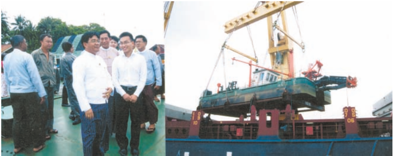
Union Minister for Transport U Nyan Tun Aung views the newly-arrived dredgers at Sule Jetty No (6).

YANGON, 28 July— Union Minister for Transport U Nyan Tun Aung this morning inspected the dredgers and supportive