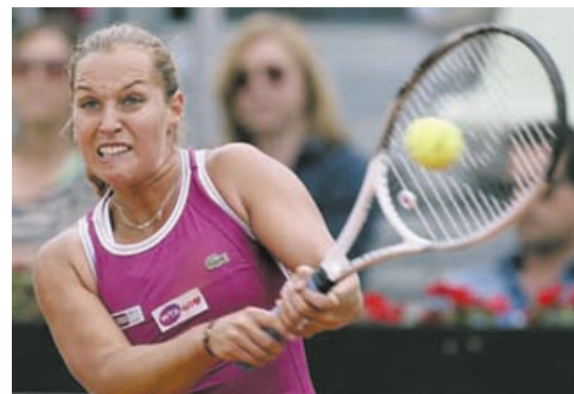
Third seed Dominika Cibulkova of Slovakia

STANFORD, (California), 28 July—Third seed Dominika Cibulkova of Slovakia powered past Romanian Sorana Cirstea 6-4, 6-0 to make her first final at the Bank of the West Classic. In her sixth appearance on the campus of Stanford University, the world number 25 got through a rough patch at the start of the first set and then battered the fifth-seeded Cirstea with powerful groundstrokes and returns.