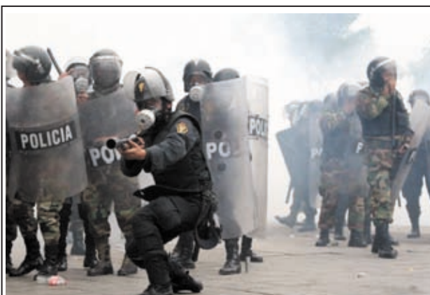
National policemen scatter the demonstrators with tear gas, during a protest against the government, in Lima, Peru, on 27 July, 2013. The rally was organized by work syndicates, political groups and civil society, claiming the repeal of the Civil Service Law.