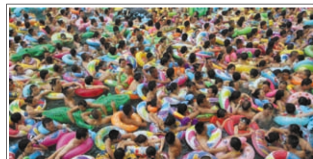
People cram in a water pool to cool off themselves inside a scenery spot in Daying County, Suining, southwest China's Sichuan Province, on 27 July, 2013.