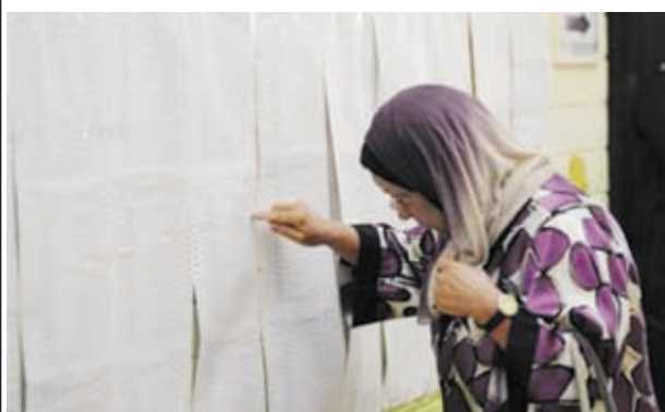
A voter looks for her name to find her voting station during elections in District 3 Khalfan, Kuwait City on 27 July, 2013.

Political parties are banned so candidates campaign independently or with links to political movements. Before the election