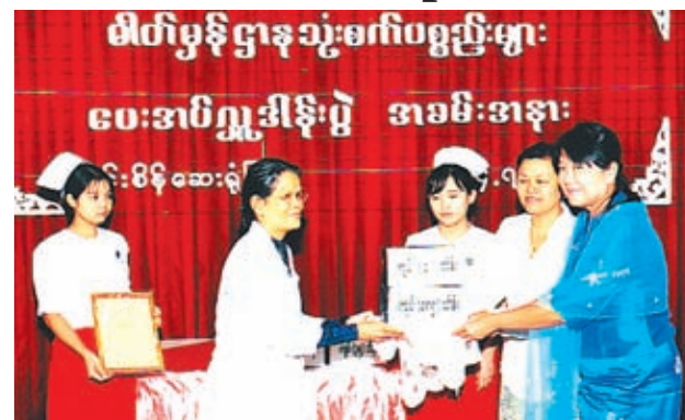
Wellwishers donate X-ray equipment to Insein Hospital in Yangon Region.

YANGON, 28 July— Wellwishers donated equipment to radiology department in Insein Hospital in Yangon Region on 24 July.