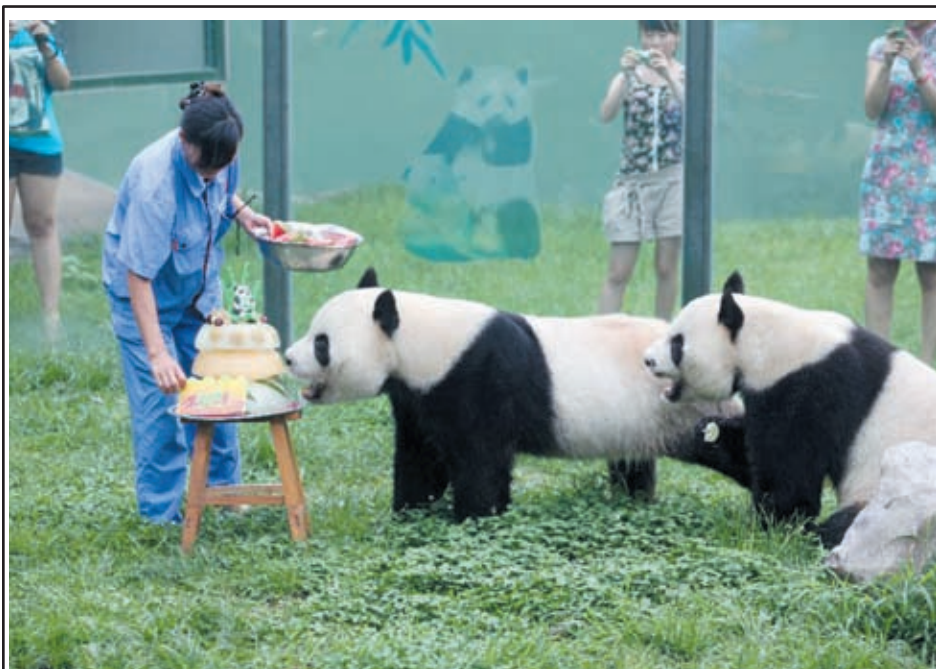
Giant pandas Qin Chuan (R) and Le Le enjoy the cake prepared for their 5th birthday at the Jinbao park in Weifang City, east China's Shandong Province, on 26 July, 2013.