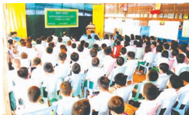
Educative talks on drug abuses to basic education students in Mandalay Region in progress.