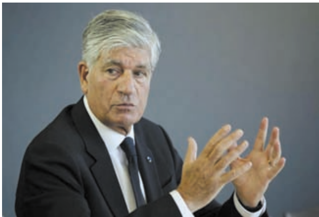
French advertising group Publicis Chief executive Maurice Levy.

PARIS, 28 July—French advertising group Publicis said it plans to make a “major corporate announcement” on Sunday, after a media report on Friday said it was in merger talks with larger rival Omnicom.