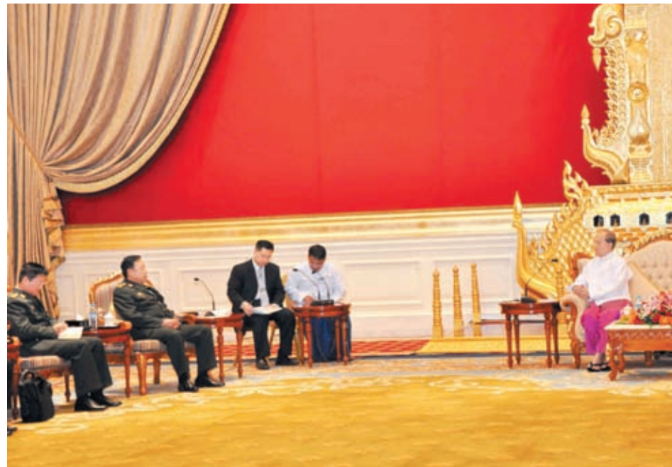
President U Thein Sein holds discussion with General Fan Changlong, Vice Chairman of the Central Military Commission-CMC of the People's Liberation Army (PLA) of PRC.

At the meeting with the President, the focus was on the efforts for promoting stability and progress of border areas, undertakings to achieve eternal peace with ethnic armed groups, cementing cooperation