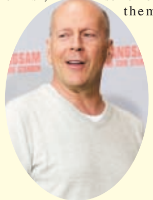
Bruce Willis kisses both his female co-stars in his latest flick Red 2 .

“I think I’m very fortunate. I get asked to do a lot of different kinds of things. Some of them include weapons,