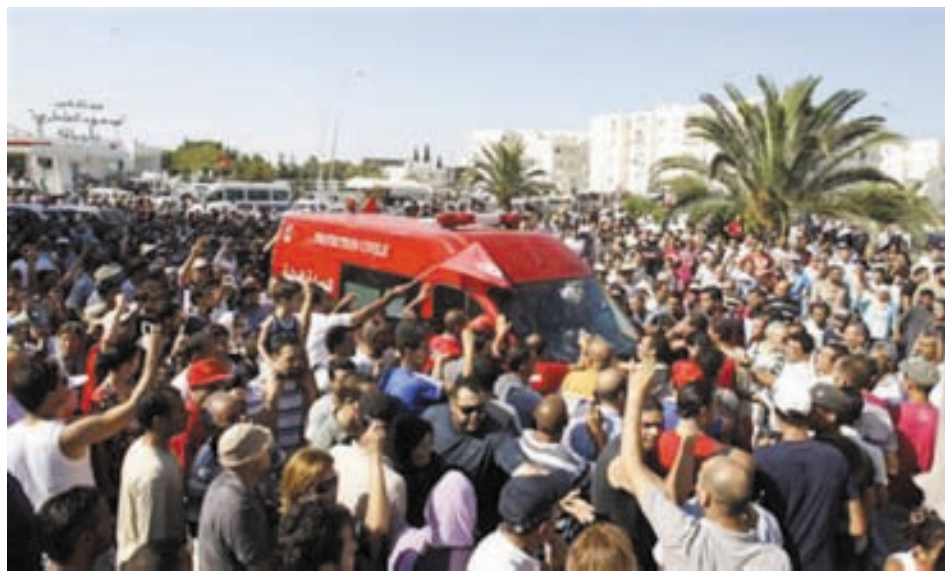
People walk beside the ambulance carrying the body of assassinated Tunisian opposition politician Mohamed Brahmi in Tunis on 25 July, 2013.

The Islamic State of Iraq and the Levant, which was formed through a merger between al-Qaeda’s Syrian and Iraqi branches, claimed responsibility for the raids and said it had freed its jailed comrades after months of preparation. One security official told Reuters on Tuesday that some of the escaped inmates were heading to Syria to join the ranks of the mainly Sunni rebels fighting to overthrow President Bashar al-Assad, whose Alawite sect derives from Shi’ite Islam.—Reuters