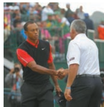
Tiger Woods of the US (L) shakes hands with his former caddie Steve Williams, after finishing his final round of the British Open golf championship at Muirfield in Scotland on 21 July, 2013.

"The whole week, I really hit so many good shots and really had control of