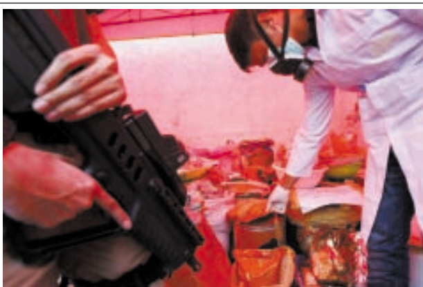
A chemist from the Philippine Drug Enforcement Agency (PDEA) looks at sacks full of expired medicines during the destruction of illegal drugs in Malabon City, the Philippines, on 25 July, 2013. A total of 772.4 kilograms of assorted drug evidence composed of shabu, cocaine, marijuana, valium, and other illegal drugs worth 964.94 million pesos (about 22.29 million US dollars) were destroyed by Philippine Drug Enforcement Agency (PDEA).