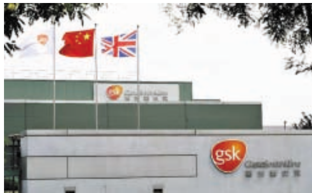
Photo taken on 25 July, 2013 shows GlaxoSmithKline (GSK) China company at the Tianjin Economic and Technological Development Area in Tianjin, north China. As investigations into GSK China deepen, expectations are rising that the company's drug prices can be further lowered. —XINHUA

BEIJING, 26 July — As investigation into GlaxoSmithKline (GSK) China deepens, expectations are rising that drug prices can be further lowered.