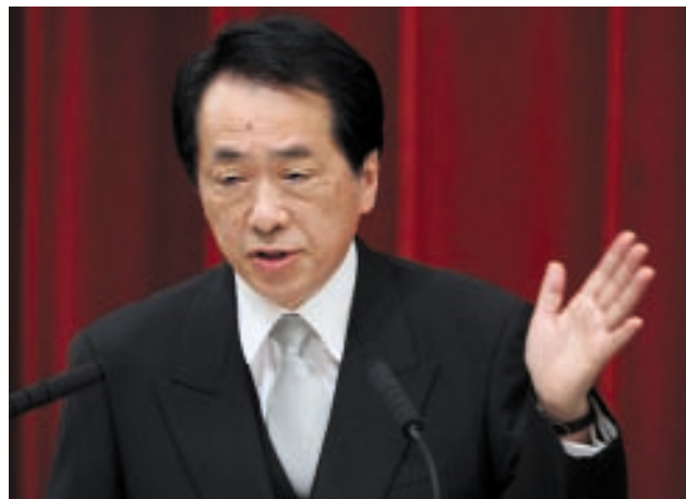
Former Prime Minister Naoto Kan

TOKYO, 26 July — The Democratic Party of Japan decided on Friday to suspend the party membership of former Prime Minister Naoto Kan for three months as he supported an independent candidate in Sunday's upper house election in defiance of a decision by the main opposition party.