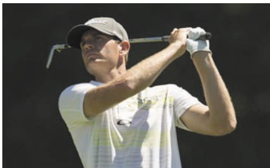
Brendan Steele of the US hits his approach shot on the ninth fairway during the first round at the Canadian Open golf tournament at the Glen Abbey Golf Club in Oakville, on 25 July, 2013.

afternoon wave is going to be tougher for sure," said Mahan. "In the morning the greens are pure and the wind is not blowing quite as hard."