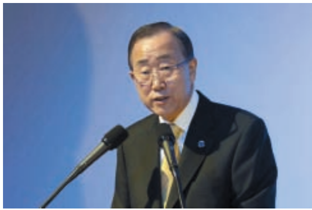
UN Secretary-General Ban Ki-moon