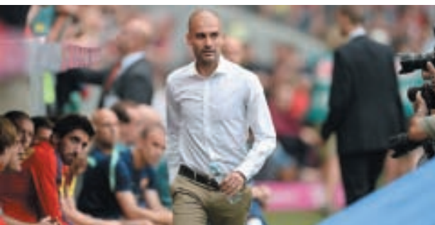
Pep in his step: former players look on as ex-Barcelona coach Pep Guardiola takes his seat at the Allianz Arena.