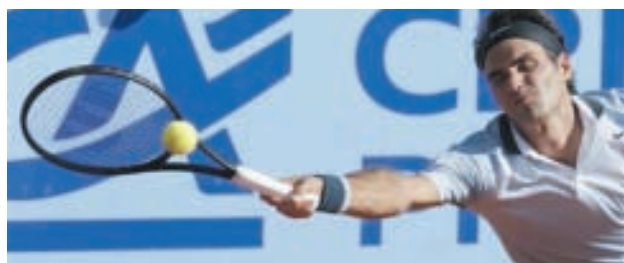
Switzerland's Roger Federer returns the ball to Germany's Daniel Brands during their Swiss Open second round tennis match in Gstaad on 25 July, 2013.