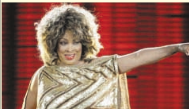
American singer Tina Turner