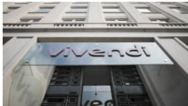
A logo of entertainment-to-telecoms conglomerate Vivendi is seen on the main entrance of the company's headquarters in Paris on 23 July, 2013.