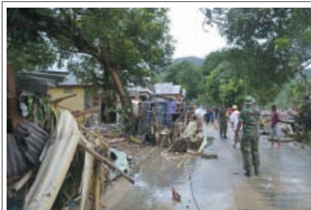
People stand on a road where houses were destroyed by the Way Ela dam burst from the Negeri Lima village, in Leihitu sub-district, Central Maluku, Indonesia, on 25 July, 2013. One person died and thousands have been evacuated according to the Indonesian National Board for Disaster Management (BNPB) agency's report.

detailed Morsi so as to learn about his health conditions. Qandil also asked the two rival camps — supporters and opponents of Morsi — to stop attacking each other in the media. As both camps vowed to stage massive rallies on Friday, Qandil asked protesters to stay at fixed locations instead of march in the street in order to avoid possible clashes.