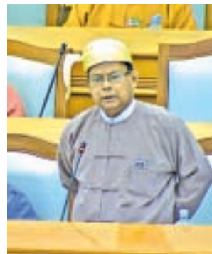
Hluttaw Representative U Kyi Myint.