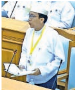
Union Minister U Win Shein.

"My proposal is concerned with usage of Myanmar language. I submitted this proposal in order that some words of the bill can be amended,"