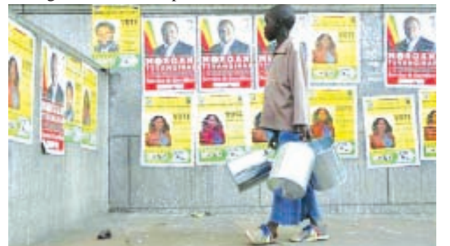
A boy walks past election campaign posters in Harare on 17 July, 2013.