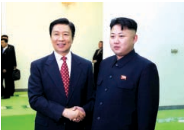
Kim Jong Un (R), top leader of DPRK, meets with visiting Chinese Vice President Li Yuanchao in Pyongyang on 25 July to pay a visit to attend activities marking the 60th Anniversary of the Korea War Armistice.

PYONGYANG, 26 July — Kim Jong Un, top leader of the Democratic People's Republic of Korea (DPRK), met here on Thursday with visiting Chinese Vice-President Li Yuanchao to discuss relations between their two countries. Li arrived here earlier in the day to pay a visit to the DPRK and to