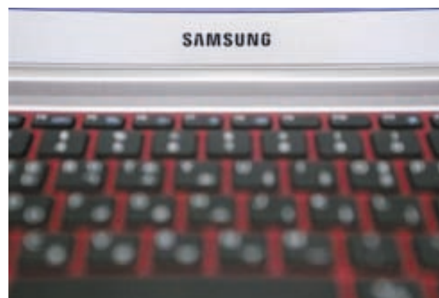
A Samsung Electronics laptop computer is displayed at a shop in Samsung's main office building in central Seoul on 23 July, 2013.