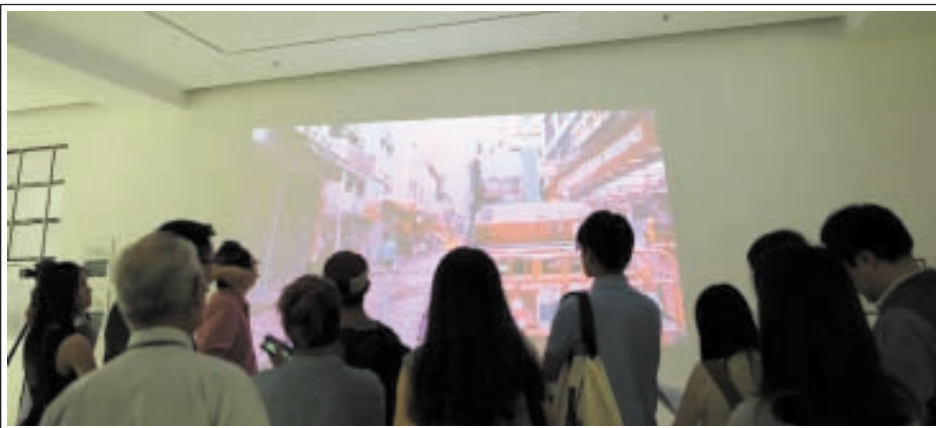
Visitors view an art work from artist Sara Wong in PearLam Galleries in south China's Hong Kong, on 25 July, 2013. An exhibition of multi-media art pieces from the 1990s kicked off on Thursday, showcasing various kinds of representative works from four contemporary Hong Kong artists.