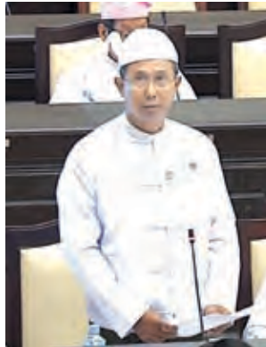
Amyotha Hluttaw Representative U Toe Win of Taninthayi Region Constituency No (12) asking questions.