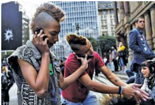
Brazilian punks use their mobile phones during a May Day demonstration on Labour Day in downtown Sao Paulo on 1 May, 2012.

- Do be a good dining companion. No one wants to be a captive audience to