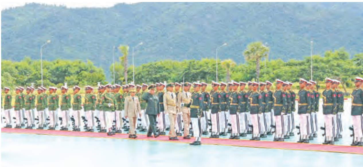
Commander-in-Chief of Defence Services Senior General Min Aung Hlaing and Vice-Chairman of the Central Military Commission of the People's Liberation Army of China General Fan Changlong inspect the Guard of Honour.

NAY PYI TAW, 23 July — Commander-in-Chief of Defence Services Senior General Min Aung Hlaing welcomed Vice-Chairman of the Central Military Commission of the People's Liberation Army of China General Fan Changlong of at Zeyathiri Beikman, here, at 10 am today.