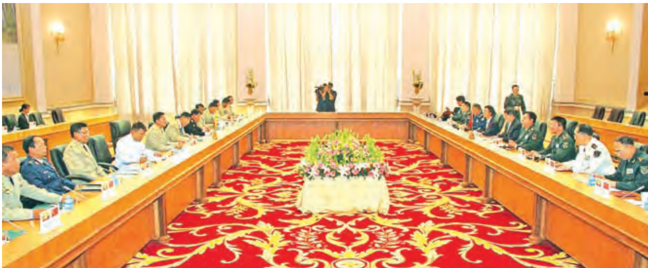
Meeting between Commander-in-Chief of Defence Services Senior General Min Aung Hlaing and Vice-Chairman of the Central Military Commission of the People's Liberation Army of China General Fan Changlong in progress.