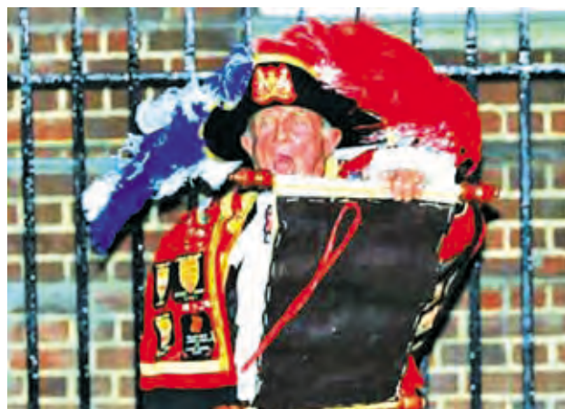
A town crier announces the birth of a son to Catherine, Duchess of Cambridge and Prince William, outside the Lindo wing of Queen Mary's Hospital in central London, on 22 July, 2013.

The baby's name will be announced later but George and James, both traditional royal names, were favoured choices with British bookmakers for the child, who could one day be king. The popular couple sidestepped tradition by announcing the birth via