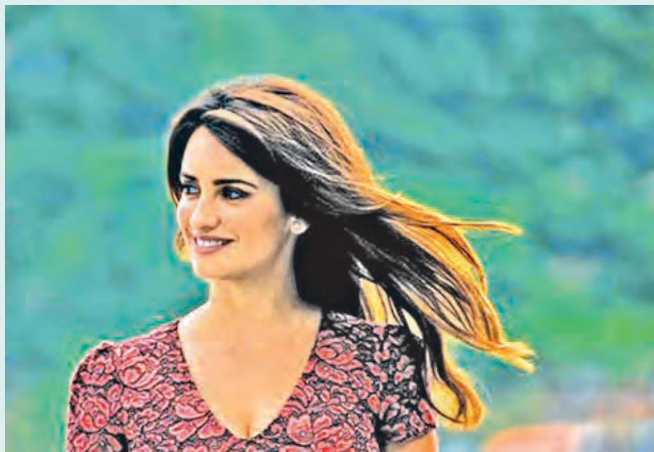
Penelope Cruz is expecting her second child any day now.