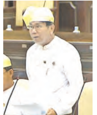
Amyotha Hluttaw Representative U Aung Nyein from Magway Region Constituency No. (2) questioning.