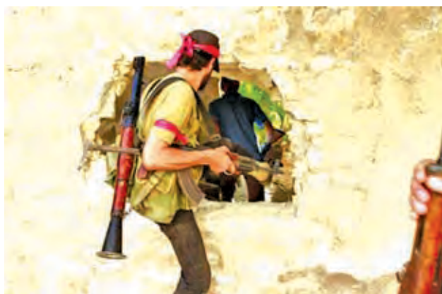
Free Syrian Army fighters move through a hole in a wall in the northern town of Khan al-Assal, after seizing it on 22 July, 2013.

able to proceed,” a source familiar with the administration's thinking told Reuters on condition of anonymity.—Reuters