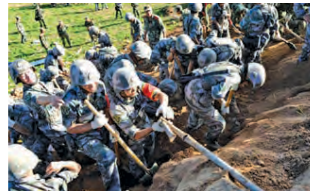
Rescuers work at Yongguang Village of Meichuan Town in Minxian County, northwest China's Gansu Province, on 22 July, 2013. The death toll has climbed to 89 in the 6.6-magnitude earthquake which jolted a juncture region of Minxian County and Zhangxian County in Dingxi City on Monday morning.