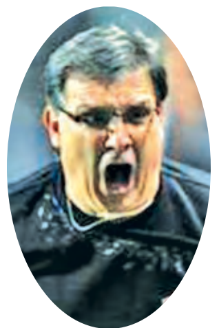
Coach Gerardo Martino