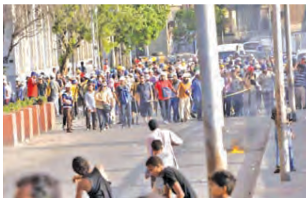
Supporters of Egypt's ousted president Mohamed Morsi walk towards the opponents during clashes in Cairo, Egypt, on 22 July, 2013. The death toll of clashes between supporters and opponents of ousted Egyptian president Mohamed Morsi on Monday has climbed to four, the state TV reported.

CAIRO, 23 July—Continued clashes between supporters and opponents of ousted Egyptian President Mohamed Morsi killed at