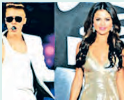
Justin Bieber and Selena Gomez have been in relationship for the past two years.

LOS ANGELES, 23 July —Singer-actress Selena Gomez is not ready to give up on her on-off relation with Justin Bieber as she considers him to be “the one”.