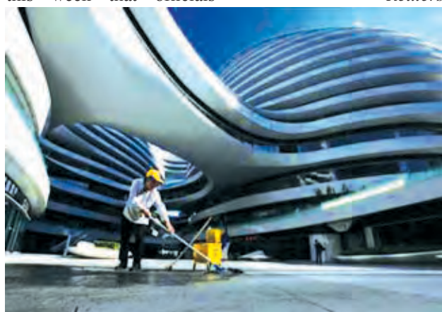
A cleaner works at a newly built business building in Beijing on 16 July, 2013.

The official Xinhua news agency quoted Xi as saying during a trip to the central Province of Hubei this week that officials