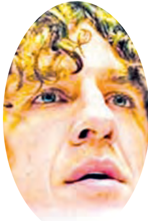
Barcelona's captain Carles Puyol

“It's about getting properly fit and when I return I want to be at 100 percent.” Barca have said they want to sign another centre back before the transfer