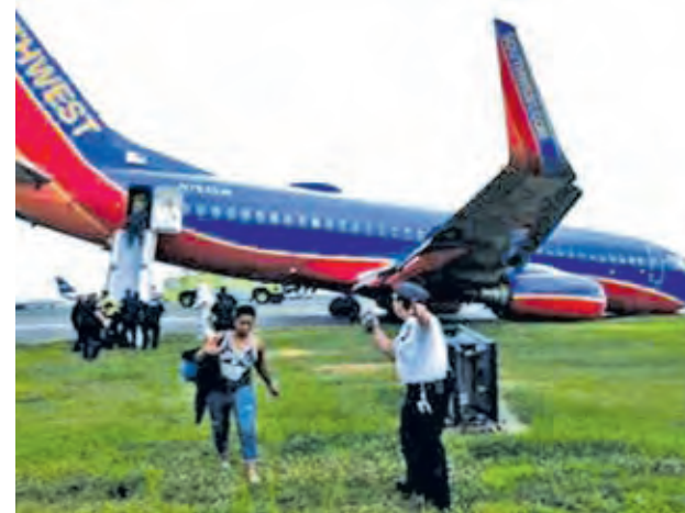
A Southwest Airlines plane sits on the tarmac as passengers disembark at LaGuardia airport in New York, on 22 July, 2013.