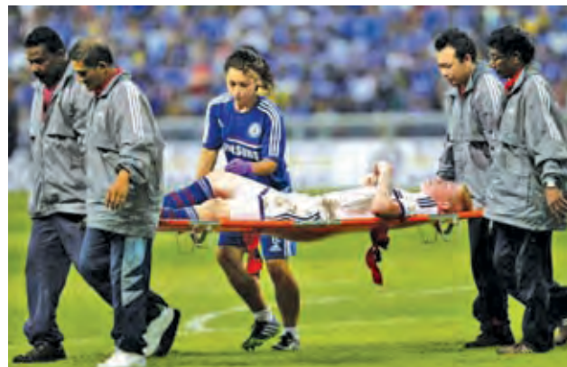
Kevin de Bruyne is stretchered off during Chelsea's match against the Malaysia XI in Kuala Lumpur.

But de Bruyne underwent further tests in Malay-