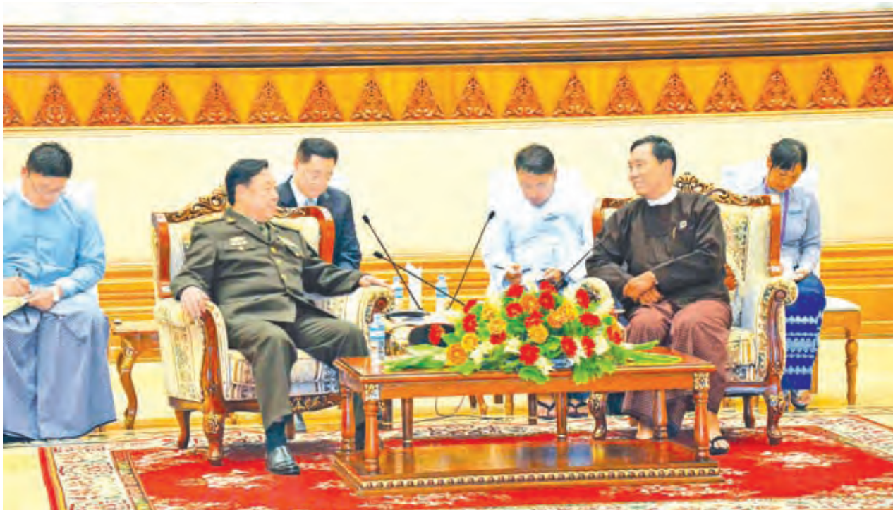
Pyithu Hluttaw Speaker Thura U Shwe Mann receives a delegation led by General Fan Changlong, the Vice-Chairman of the Central Military Commission of the People's Liberation Army of China.