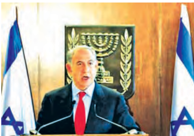
Israeli Prime Minister Benjamin Netanyahu delivers a statement to the media at the Knesset, Israeli parliament, in Jerusalem on 22 July, 2013.

said “it looks like negotiations will begin only next week, not this week.” In Washington, White House spokesman Jay Carney said: “We are working on a date for the parties to come to Washington in the coming weeks to move that