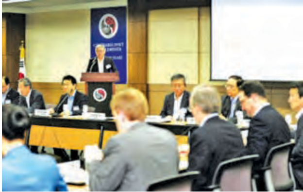
Government officials and academics from the United States, China and South Korea meet in Seoul on 22 July, 2013, to coordinate policies to achieve North Korea's denuclearization.

SEOUL, 23 July—Government officials and academics from the United States, China and South Korea held a meeting on Monday in Seoul aimed at coordinating policies to achieve North Korea's denuclearization.