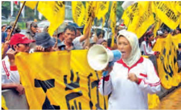
About 120 villagers from Central Java Province stage a protest in front of the Japanese Embassy in Jakarta on 22 July, 2013, over the planned construction of a $4 billion coal-fired power plant by an Indonesia-Japan consortium.

JAKARTA, 23 July—About 120 villagers from Central Java Province staged a protest in front of the Japanese Embassy in Jakarta on Monday over the planned construction of a $4 billion coal-fired power plant by an Indonesia-Japan consortium. Braving heavy rain, the villagers from Batang Regency formed a line in front of the embassy, carrying banners that say “Reject the Batang Power Plant! Choose a Clean Environment!”