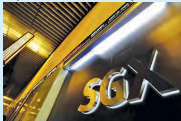
The logo of the Singapore Exchange (SGX) is pictured at its office in Singapore on 25 July, 2012.

A-share listings jumped 3.2 percent. Sentiment in China was boosted by separate media reports that the government would use