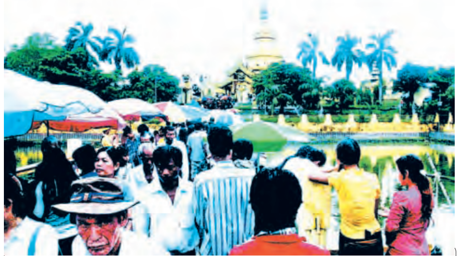
Photo shows Maha Wizaya Pagoda packed with pilgrims on Fullmoon Day of Waso, 1375 ME (Dhammacakka Day). KYEMON-KHIN MAUNG WIN