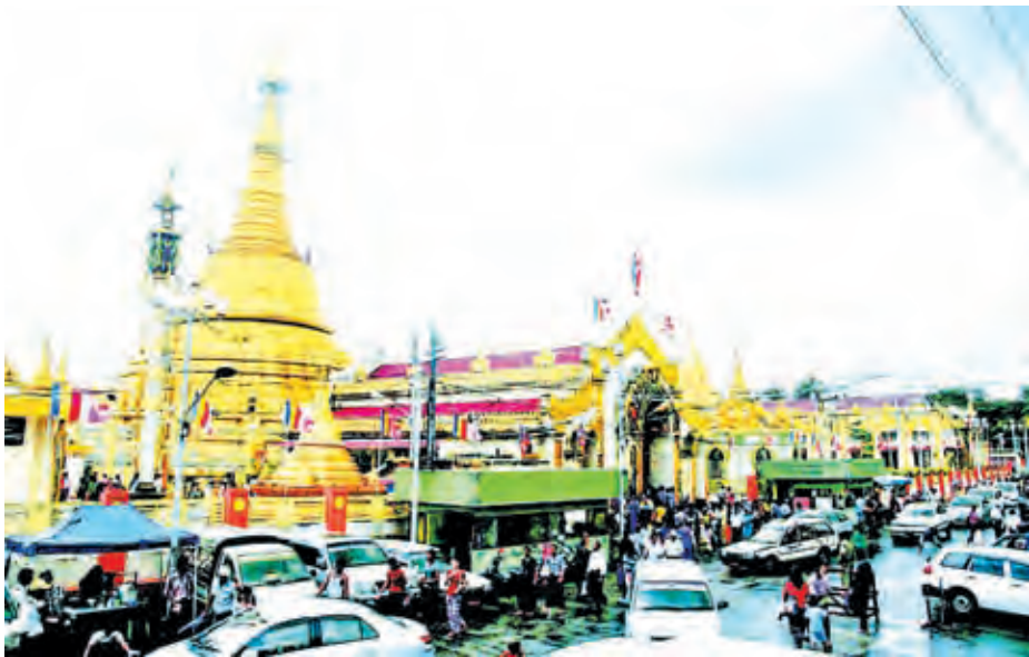
Photo shows Botathaung Kyaikdaeat SandawU Pagoda teeming with devotees on Fullmoon Day of Waso, 1375 ME (Dhammacakka Day) in Botathaung Township.