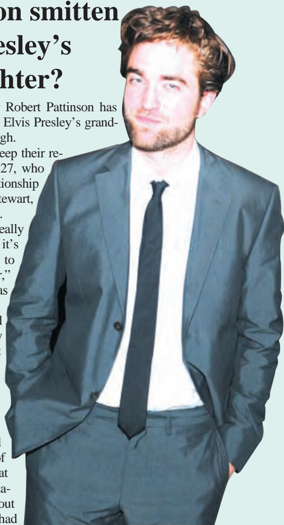
Robert Pattinson recently ended an on-and-off relationship with Kristen Stewart.

LOS ANGELES, 23 July—Actor Robert Pattinson has reportedly hit it off with late singer Elvis Presley’s granddaughter, actress-model Riley Keough.