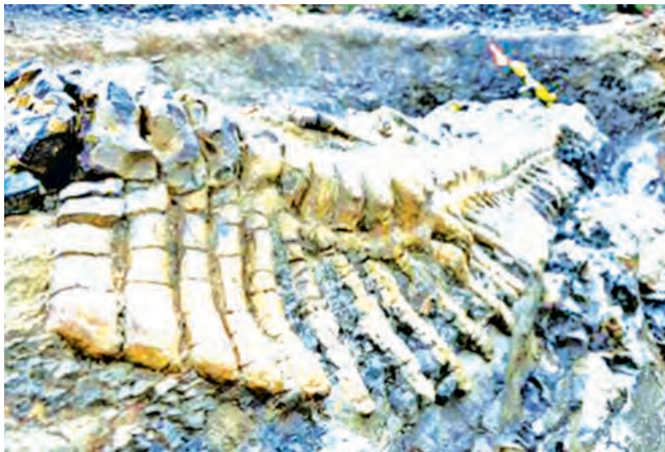
A fossilized tail of a duck-billed dinosaur, or hadrosaur, is seen in the Municipality of General Cepeda, Coahuila in this handout picture by National Institute of Anthropology and History (INAH) made available to Reuters on 22 July, 2013.