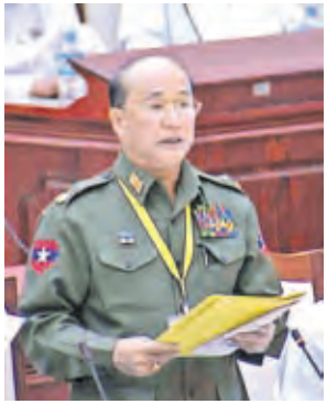
Deputy Minister Maj-Gen Zaw Win answering queries.