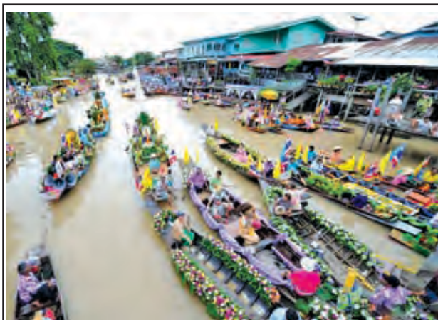
Boats decorated with flowers sail on a canal in Ayutthaya Province, Thailand, on 22 July, 2013. People celebrated the arrival of Vassa with candles and flowers on Monday in Thailand. This day is also called "Candle Festival" in English by foreigners. Vassa is the three-month annual retreat observed by monks and Buddhist ascetics. The Vassa 2013 starts on 23 July this year.