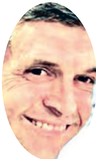
Barcelona's coach Tito Vilanova

BARCELONA, 23 July — Gerardo Martino and Luis Enrique are both suitable candidates to succeed Tito Vilanova as Barcelona coach as their philosophies chime well with the team's playing style, captain Carles Puyol said on Monday.