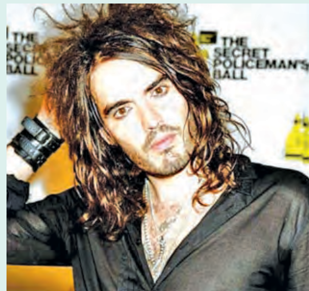
Russell Brand was earlier married to singer Katy Perry.