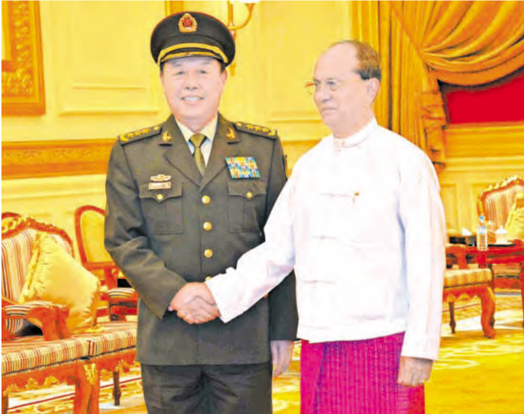
President U Thein Sein shaking hands with General Fan Changlong, the Vice-Chairman of the Central Military Commission of the People's Liberation Army of China.