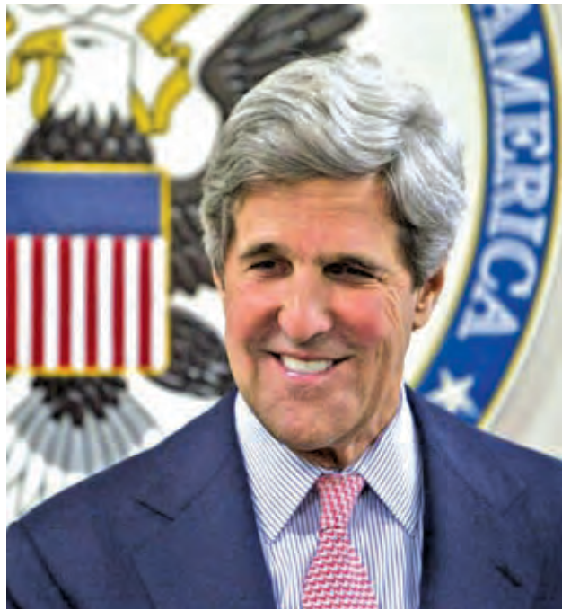
US Secretary of State John Kerry

recent involvement in the conflict in neighbouring Syria, in support of President Bashar al-Assad, made