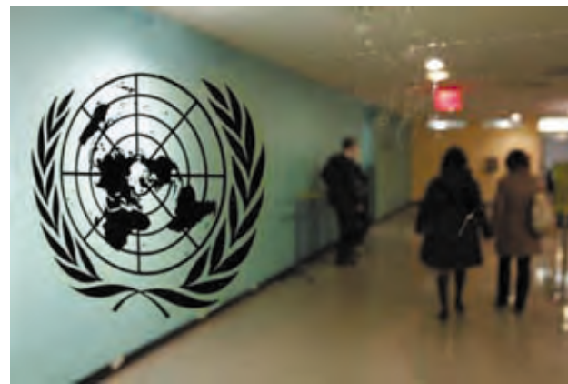
The United Nations logo is displayed on a door at UN headquarters in New York on 26 Feb, 2011.