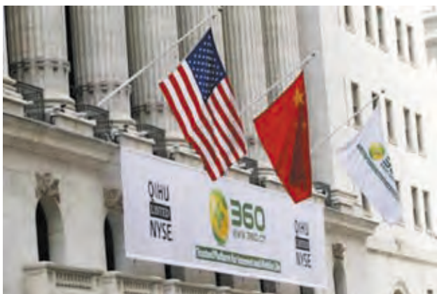
A sign advertising the Qihoo 360 Technology Co Ltd is hung with the US and Chinese flags outside the New York Stock Exchange before the company's Initial Public Offering (IPO) in New York on 30 March, 2011.