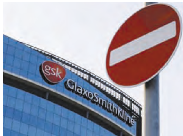
A no entry sign is pictured outside the GlaxoSmithKline building in Hounslow, west London on 18 June, 2013.

million pounds) to 700 travel agencies and consultancies over six years to facilitate the bribes. GSK said it was deeply concerned by the allegations, which it called "shameful".