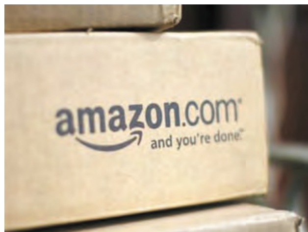
A box from Amazon.com is pictured on the porch of a house in Golden, Colorado on 23 July, 2008.