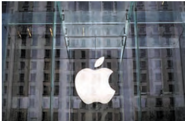
The Apple logo hangs inside the glass entrance to the Apple Store on 5th Avenue in New York City, on 4 April, 2013.

SAN FRANCISCO, 22 July —Apple Inc's main website for developers remains shut after intruders tried to steal sensitive information last week, forcing the iPhone maker to overhaul its database and