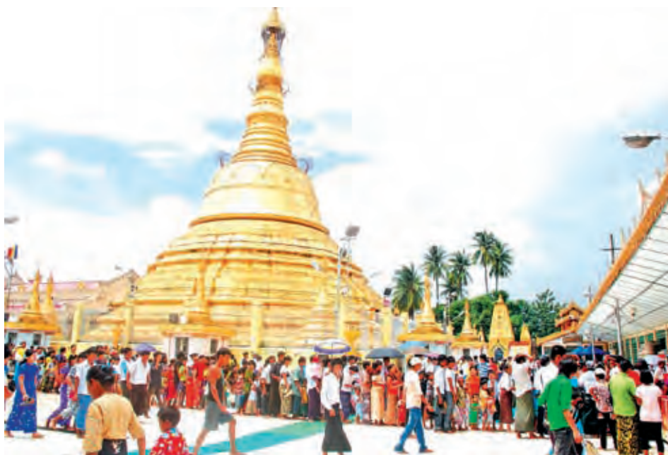
Botahtaung Kyaikdaeup Pagoda packed with pilgrims.