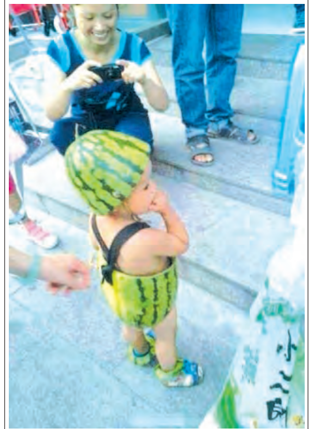
A kid beats summer heat by covering the body with "watermelon clothes" in Wenzhou, East China's Zhejiang Province.