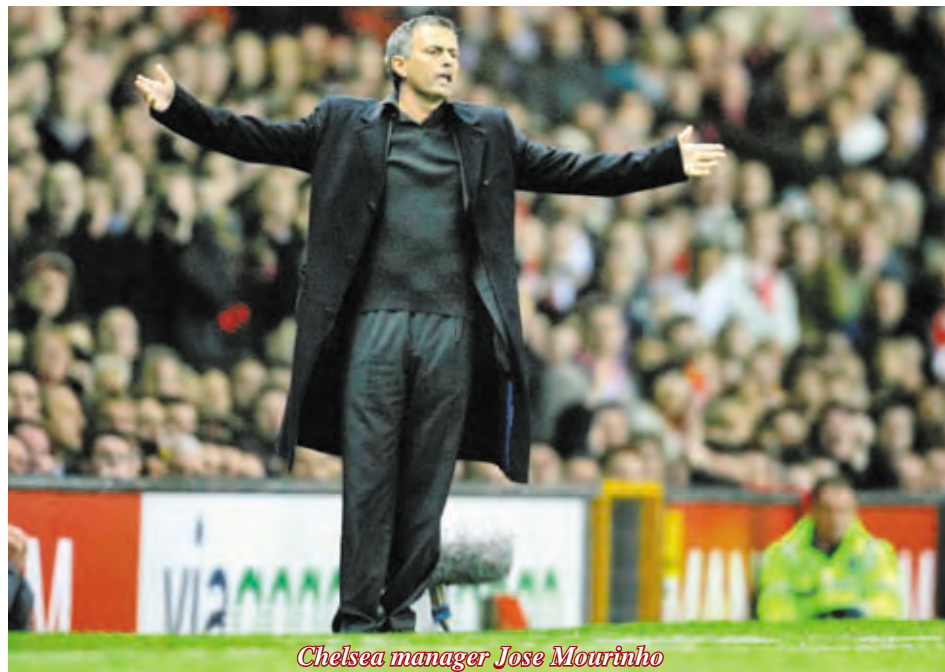
Chelsea manager Jose Mourinho

"What did Jose say? He said we'll meet again at Inter in three years," he said.—PTI