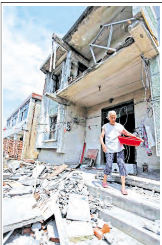
A woman walks by a damaged house in Songjiang District of east China's Shanghai municipality, on 21 July, 2013. A sudden gale battered Tiancun NO 2 Village in Shanghai on Saturday, causing some 30 houses damaged with no casualties report.—XINHUA

Military relations between Israel and the US have been consistently close, reflecting common security interests in the Middle East. Joint exercises are regularly held to maintain those ties, develop teamwork and share information on new weapon systems and tactics. Israel also periodically holds aerial and naval drills with NATO members - either at home or abroad.—Xinhua