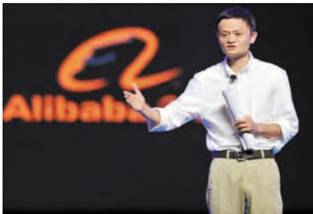
Jack Ma, founder of Chinese e-commerce giant Alibaba Group.

SHANGHAI, 22 July—A Hong Kong journalist has quit in a controversy over disputed remarks that Jack Ma, founder of Chinese e-commerce giant Alibaba Group, is reported to have made in support of Beijing’s violent crackdown on Tiananmen Square protesters in 1989. The controversy comes ahead of the anticipated listing of Alibaba, expected to value the firm at $60-$100 billion, which in turn has put a critical spotlight on Ma, the wider Chinese Internet industry and its approach to freedom of speech.