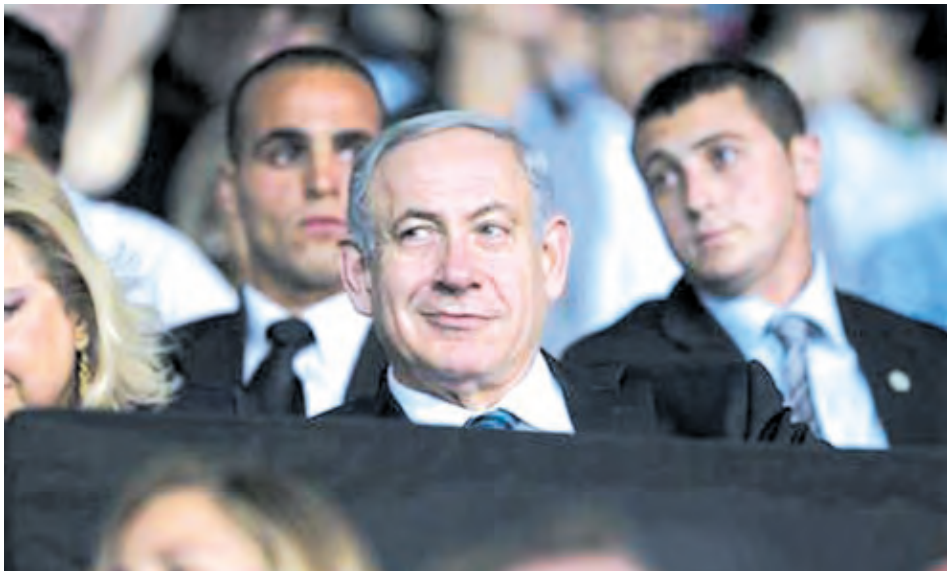
Israel's Prime Minister Benjamin Netanyahu smiles during the opening ceremony of the 19th Maccabiah Games at Teddy Stadium in Jerusalem on 18 July, 2013.