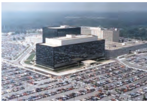
An undated aerial handout photo shows the National Security Agency (NSA) headquarters building in Fort Meade, Maryland.

WASHINGTON, 22 July — The US government said on Friday a secret court that oversees intelligence activities granted its request to continue a telephone surveillance program — one of the two data collection efforts leaked by former security contractor Edward Snowden. The Office of the Director of National Intelligence, or ODNI, said its authority to maintain the program expired on Friday and that the government sought and received a renewal from the Foreign Intelligence Surveillance Act court.