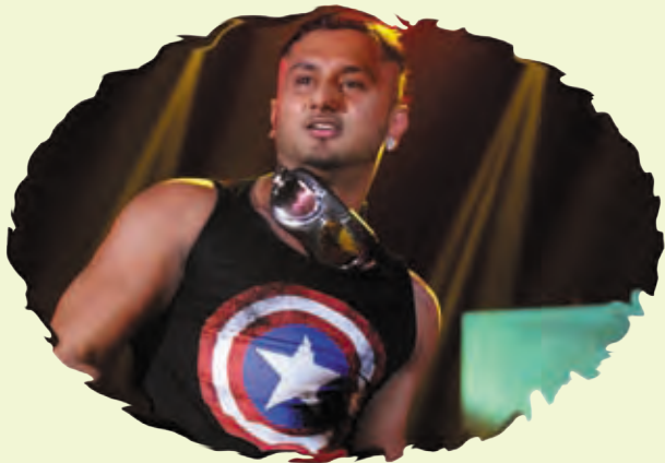
Yo Yo Honey Singh has hit songs such as songs like Angrezi beat, Dope shop, Brown rang and Achko machko to his credit.

NEW DELHI, 22 July—Rapper-musician Hirdesh Singh, popularly known as Yo Yo Honey Singh, who made quirky Punjabi-Hindi rap songs, now wants to go regional and rap in local languages.