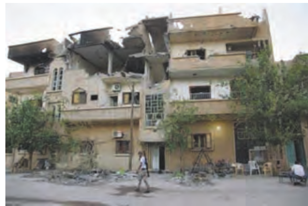
A Free Syrian Army fighter carries his weapon as he walks past damaged buildings in Deir al-Zor on 20 July, 2013.