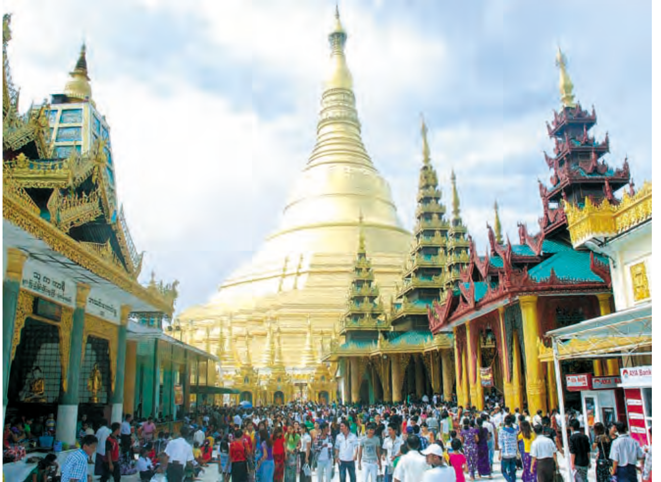
Shwedagon Pagoda packed with devotees on Fullmoon Day of Waso (Dhammacakka Day).

YANGON, 22 July — Today, Fullmoon Day of Waso (Dhammacakka Day), pagodas, stupas, monasteries, lakes, townships, wards, streets and Dhammayons in Yangon were packed