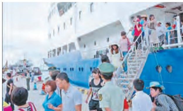
Tourists arrive at Yongxing Island in Sansha, Hainan province, on Sunday.