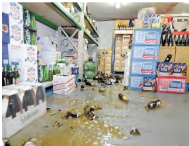
Broken bottles litter the floor of Regional Wines and Spirits shop after a 6.5 magnitude earthquake shook New Zealand capital Wellington on 21 July, 2013.

Each of them immediately kicked off its own aftershock sequence, said a statement from GeoNet. "Repeated earthquake sequences such as this have happened before in this part of New Zealand, con-