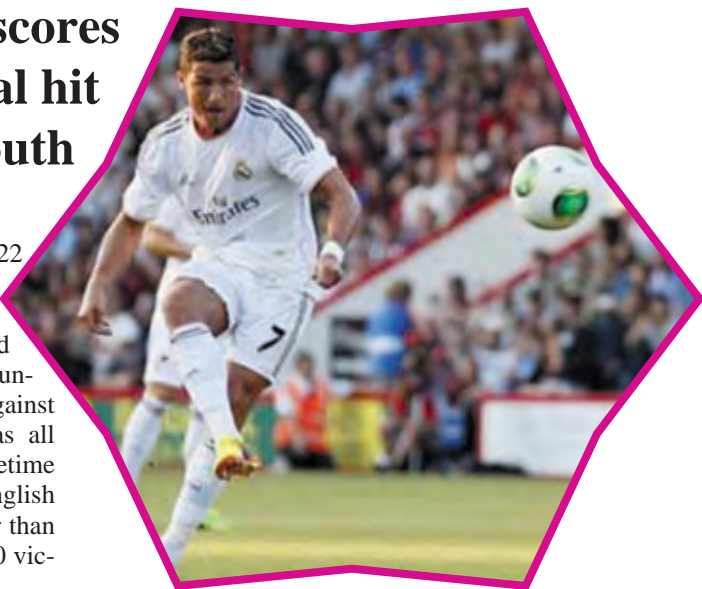
Real Madrid's Cristiano Ronaldo scores with a free kick against Bournemouth during their friendly soccer match at Dean Court in Bournemouth, on 21 July, 2013.

Higuain got his name on the scoresheet in the 47th, while winger Angel Di Maria netted the fifth on 68 minutes and Brazilian midfielder Casemiro scored from close range eight minutes from time to finish the rout.