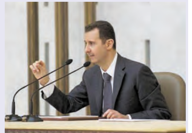
Syria's President Bashar al-Assad heads the plenary meeting of the central committee of the ruling al-Baath party, in Damascus in this handout photograph distributed by Syria's national news agency SANA on 8 July, 2013.— REUTERS

When rebel fighters have held confined areas, such as the border town of Qusair, which was overrun by Hezbollah and Assad loyalists two months ago,