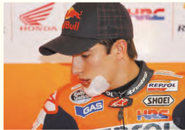
Repsol Honda MotoGP rider Marc Marquez of Spain at the Sachsenring circuit, near the eastern German town of Hohenstein-Ernstthal, on 14 July, 2013.