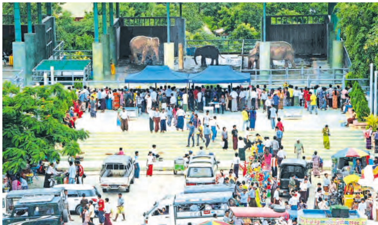
White elephants at Uppatasanti Pagoda drawing public attention. — MNA

Datpaungsu Pagoda and precinct, Hsutaungpyae Koesu and Koekhangyi are also packed with devotees.—MNA