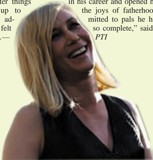
Cast member Vera Farmiga poses at the premiere of ‘The Conjuring’ at the Cinerama Dome in Los Angeles, California on 15 July, 2013.