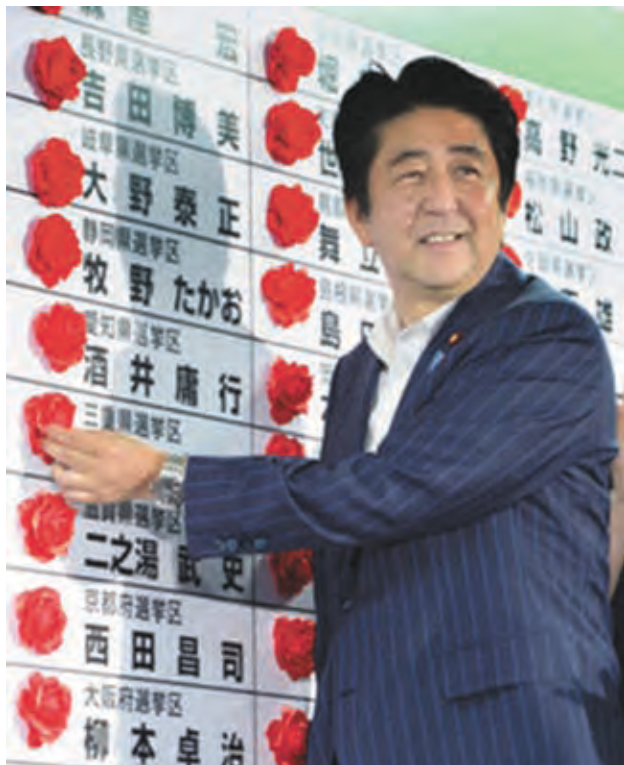
Japanese Prime Minister and Liberal Democratic Party President Shinzo Abe puts flowers on the name of winning party candidates in the House of Councillors election at the LDP's headquarters in Tokyo on 21 July, 2013.

TOKYO, 22 July — Prime Minister Shinzo Abe strengthened his grip on power on Sunday with his ruling coalition winning a comfortable majority in the upper house election, enabling him to pursue his goal of economic recovery amid greater political stability.