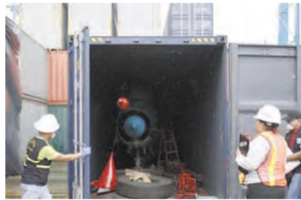
Panamaian forensic workers close a container holding a MiG-21 fighter jet seized from the North Korean-flagged ship Chong Chon Gang, during investigations at the Manzanillo Container Terminal in Colon city on 21 July, 2013.

Panama has asked the UN Security Council to investigate the ship and its contents amid suspicion that the vessel is in breach of a