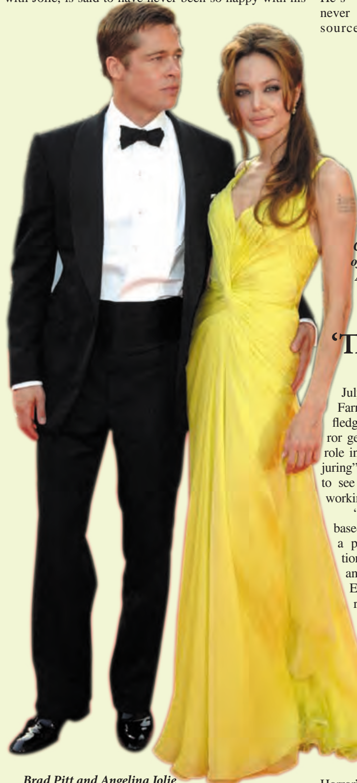
Brad Pitt and Angelina Jolie