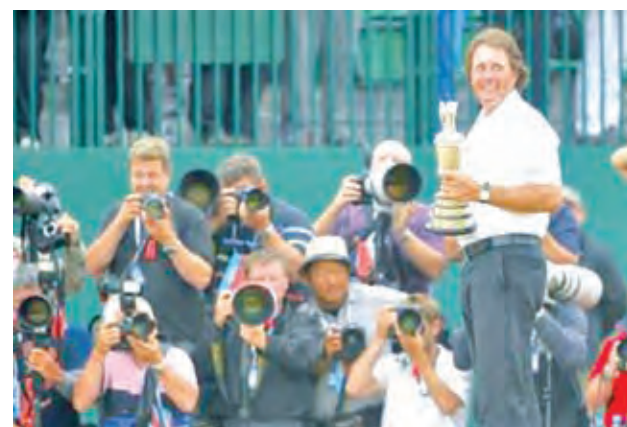
Phil Mickelson of the US holds the Claret Jug after winning the British Open golf championship at Muirfield in Scotland on 21 July, 2013.

"The wow factor just kind of happened," Mickelson, who warmed up by winning the Scottish Open last week, told a news conference. "It wasn't like I was setting out thinking, I