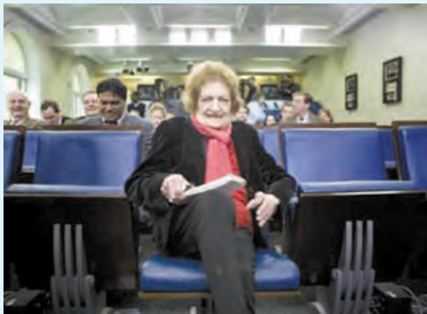
Helen Thomas, dean of the White House Press corps, takes her seat after recovering from a long illness in the Briefing Room at the White House in Washington in this 11 Nov, 2008 file photo.

WASHINGTON, 22 July — Former White House correspondent Helen Thomas, a trailblazing journalist who reported on every US president from John Kennedy to Barack Obama, died on Saturday at the age of 92, the Gridiron Club and Foundation said.