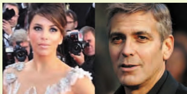
There were rumours that George Clooney had attempted to pursue Eva Longoria while he was dating Stacy Keibler.