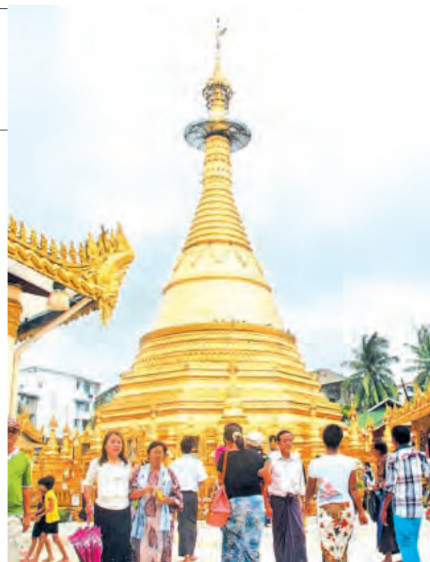
Shwedagon Pagoda in Yangon teemed with devotees from different regions on fullmoon day of Waso (Dhammacakka Day).