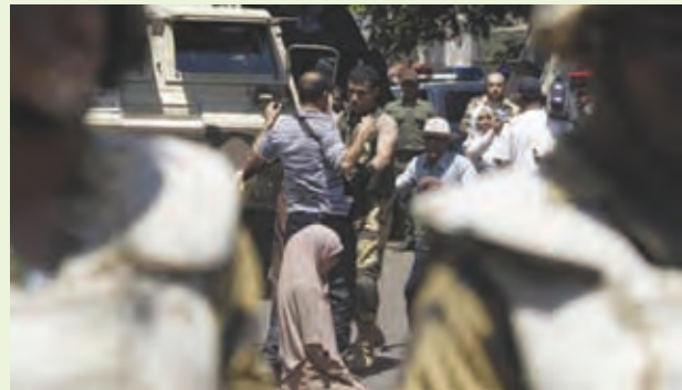
An army soldier checks a member of the Muslim Brotherhood and supporter of ousted Egyptian President Mohamed Mursi near Egypt's defence ministry headquarters in Cairo on 21 July, 2013.