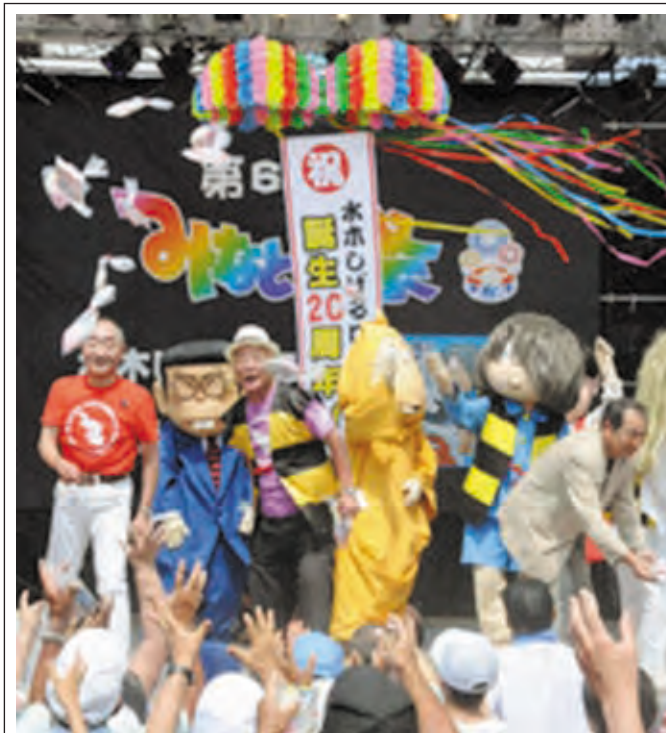
People dressed as Japanese "yokai" specters attend a ceremony to celebrate the 20th anniversary of the founding of Mizuki Shigeru Road, a street named after a famous local cartoonist, in Sakaiminato, Tottori Prefecture, on 21 July, 2013. More than 150 statues of yokai characters are displayed on the street.