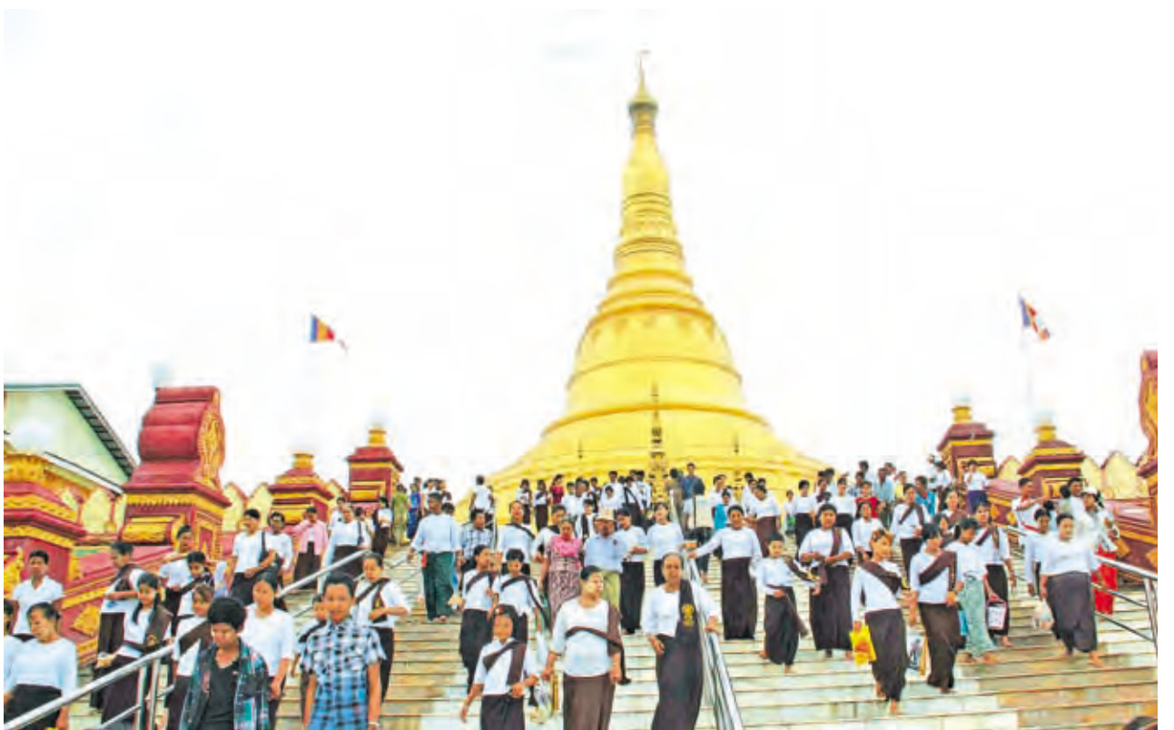
Uppatasanti Pagoda teemed with devotees on Fullmoon Day of Waso. —MNA

Datpaungsu Pagoda and precinct, Hsutaungpyae Koesu and Koekhangyi are also packed with devotees.—MNA