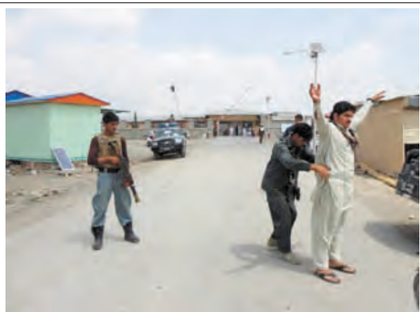
An Afghan policeman searches the body of a passenger in Spera district of Khost Province in eastern Afghanistan on 21 July, 2013. The brother of Spera district chief was killed along with five other people in the eastern Afghan Province of Khost on Sunday morning, said an official.

In a related event, the Algerian army has destroyed a four-wheel drive vehicle transporting weapons from Libya and heading for the Tunisian border, Mosaique FM said, adding that at least two assailants were killed and some others injured in an exchanging fire.— Xinhua