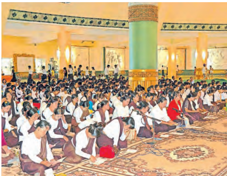
Paritta recitation taking place at Uppatasanti Pagoda in Nay Pyi Taw.