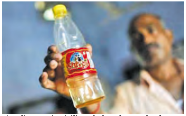
A policeman in civilian clothes shows a bottle containing oil which they recovered from the school where contaminated meals were served to children on Tuesday, at a police station in Masrakh at Chapra.

PATNA, (India), 21 July—An initial forensic report has confirmed that the free school lunch that killed 23 children this week in India's eastern state of Bihar was contaminated with a pesticide, a senior police official said on Saturday.