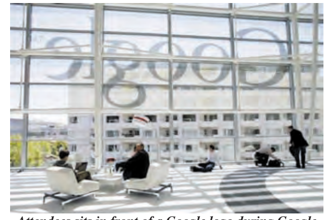
Attendees sits in front of a Google logo during Google I/O Conference at Moscone Centre in San Francisco, California on 28 June, 2012.