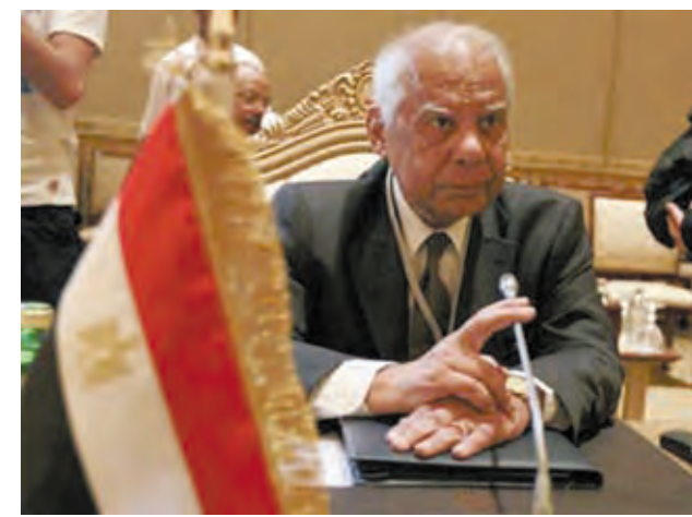
Egypt's Finance Minister Hazem el-Beblawi looks on during a group meeting of Gulf and Arab Finance Ministers in Abu Dhabi, in this on 7 Sept, 2011 file photo.

Mursi's Muslim Brotherhood has branded the ousting of the president as a military coup and has said it will not enter into any talks with its opponents until he is restored to power, staging a round-the-clock vigil in Cairo to push their demand.