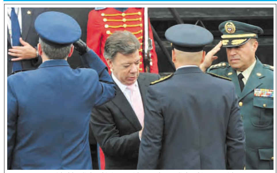
Image provided by Colombia's Presidency shows Colombian President Juan Manuel Santos (2nd L) honoring outstanding military officers of the Public Force during the military parade in the framework of the Colombia's Independence Day commemoration, in Bogota, Colombia, on 20 July, 2013. The commemoration of the 203rd anniversary of Colombia's Independence includes a homage to the Colombian Army veterans.