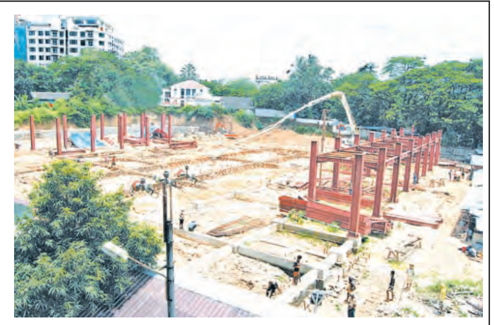
Construction of new market complex under way.