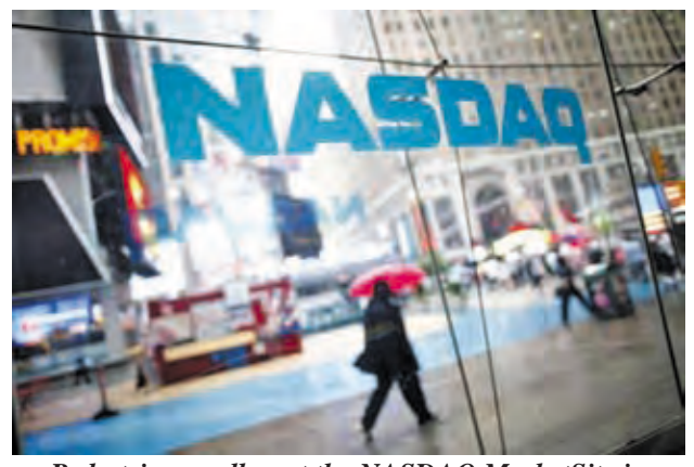
Pedestrians walk past the NASDAQ MarketSite in New York's Times Square in this 4 June, 2012 file photo.

New York, 21 July Cyber-criminals tar-Nasdaq OMX Group's community forum website and gained access to the email usernames and passwords of the members of the site, which took two days to come back online on Thursday evening. The New York-based exchange