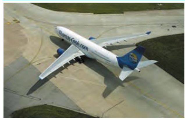
A Thomas Cook Airbus A330 aircraft taxis across the tarmac at Manchester Airport, northern England on 25 June, 2013.