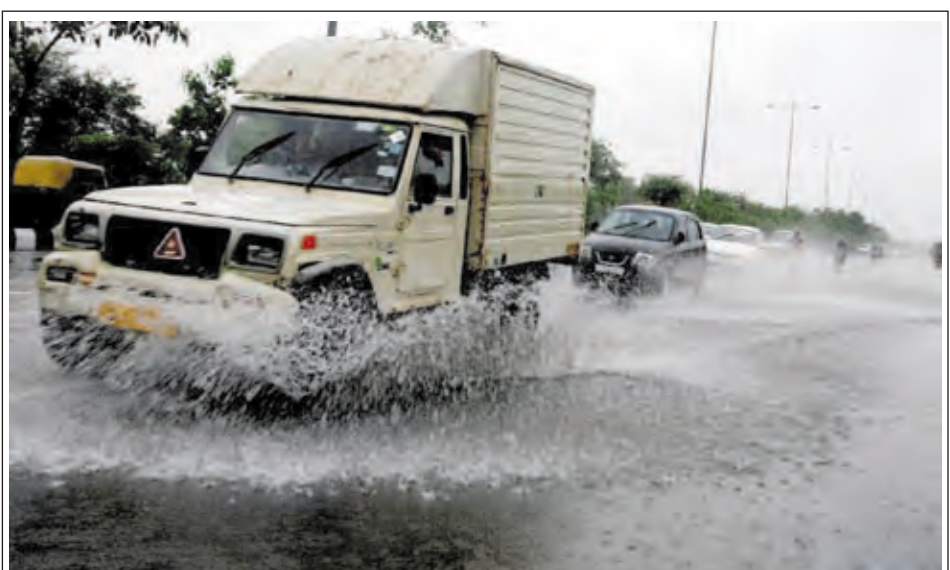
Vehicles move through the water-logged road in New Delhi, India, on 20 July, 2013. Heavy rainfall lashed the national capital on Saturday, causing water-logging and affecting traffic.