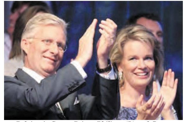
Belgium's Crown Prince Philippe (L) and Crown Princess Mathilde applaud during the national ball in the Marolles District to celebrate King Albert II's 20th anniversary of reign, in Brussels on 20 July, 2013.

Brussels, 21 July— Belgium will swear in a tions" was a headline in new king on Sunday with French language business festivities but also questions over the political in- newspaper De Standaard tist N-VA, the largest party fluence of the monarch and the acceptance of Philippe as the king of all Belgians.