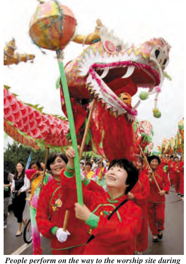
the 18th Fisherman Culture Festival at Peijia Village in Rizhao City, east China's Shandong Province, on 20 July, 2013. According to legend, the 13th day of the 6th lunar month is the birthday of "Dragon King", the emperor of ocean, when fishermen offer sacrifices to him. Nowadays, it has become a festival celebrated by local fishermen to pray for a good harvest in fishery.

Police authorities are further investigating the case.—Xinhua