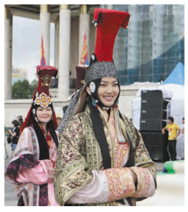
Models present traditional Mongolian clothes during the annual Mongolian Clothing Festival in Ulan Bator, Mongolia, on 20 July 2013.

ULAN BATOR, 21 July —The 20th National Costume Festival of Mongolia opened in Sukhbaatar Square here on Sunday.