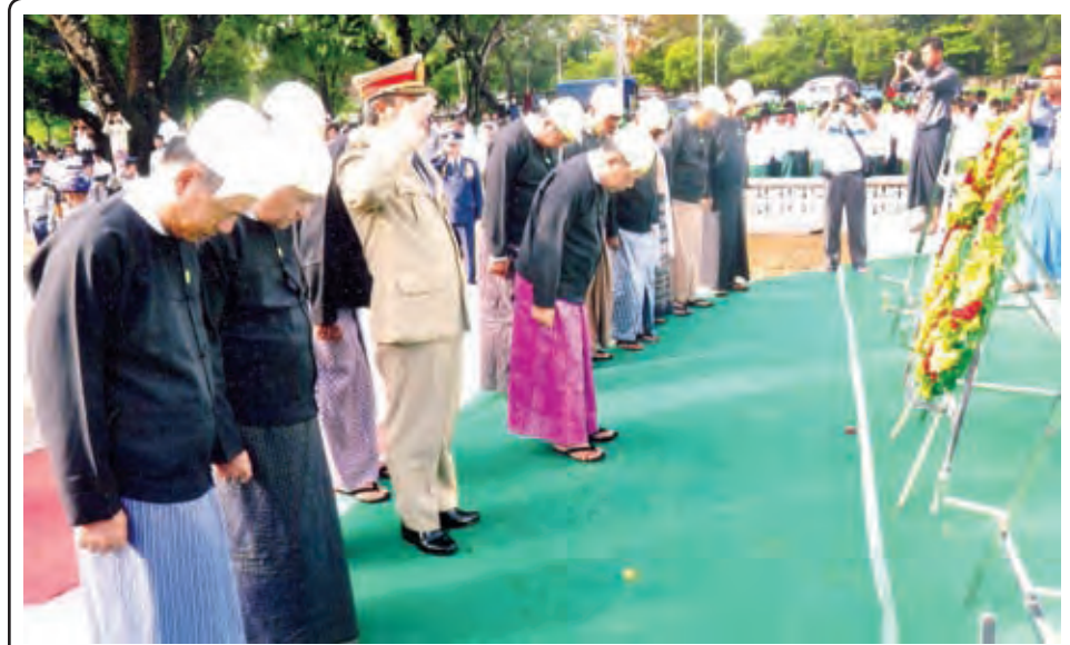
Photo shows Ayeyawady Region Chief Minister U Thein Aung and party paying tribute to the fallen heroes at the ceremony to observe the 66th Anniversary Martyr's Day at Kanthaya (Pyidaungsu ground) in Pathein on 19 July.

Photo shows a ceremony to observe the 66th Anniversary Martyrs' Day in Bogyoke Aung San Garden in Sagaing on 19 July.