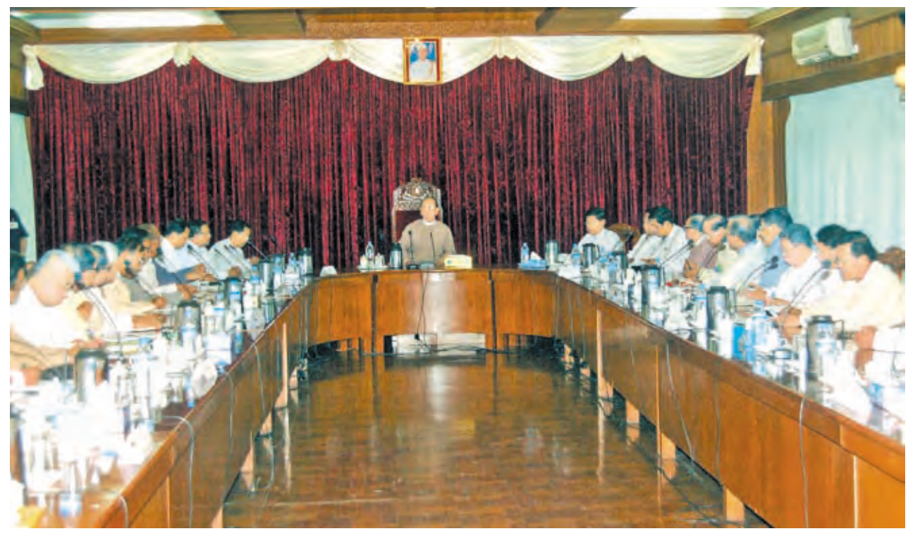
President U Thein Sein delivers a speech in meeting with Interfaith Friendship Group and Myanmar National Human Rights Commission.

YANGON, 21 July — President U Thein Sein urged the Interfaith Friendship Group and Myanmar National Human Rights Commission to cooperate with the government and to take responsibility for image the country not to be tarnished as it is found that the conflict between the two communities in the country is being exaggerated as racial and religious conflict between the two communities and regional and international issues in an attempt to bring it to the UN.